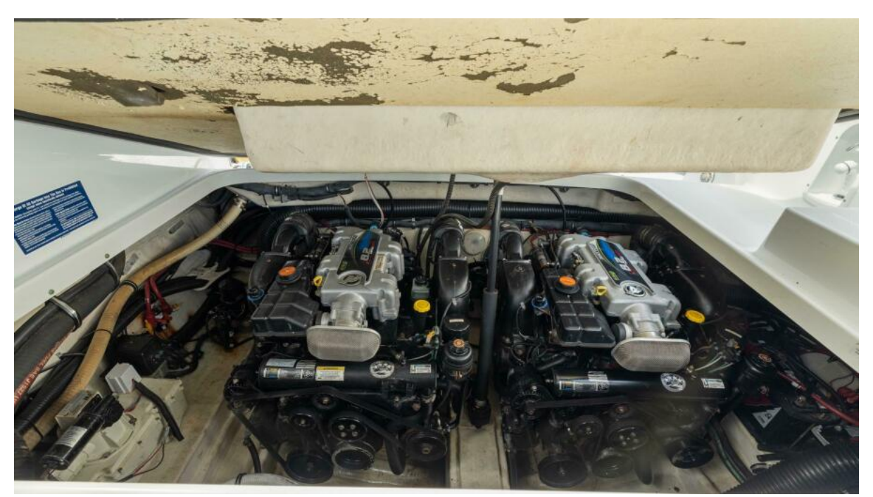
2012 Formula 350 Sun Sport For Sale