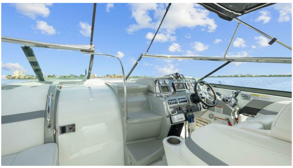
2012 Formula 350 Sun Sport