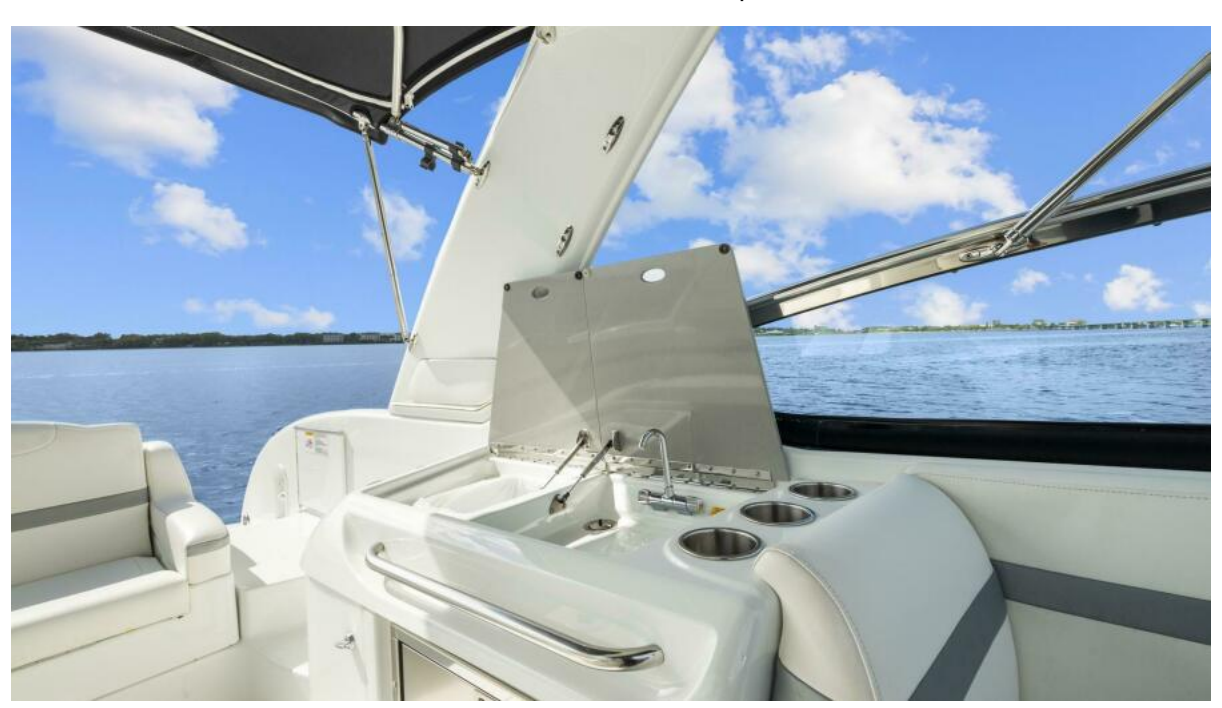
2012 Formula 350 Sun Sport