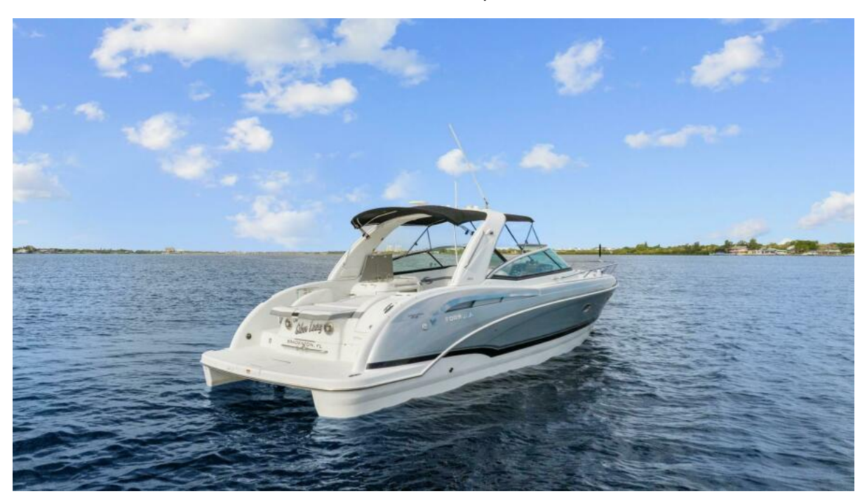
2012 Formula 350 Sun Sport