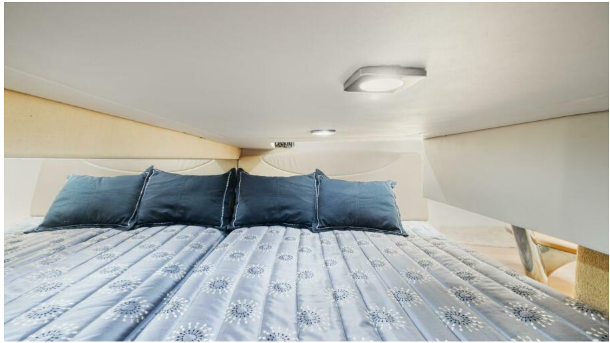
2012 Formula 350 Sun Sport