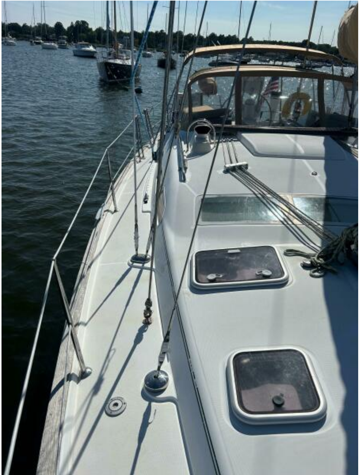
Starboard Run Deck