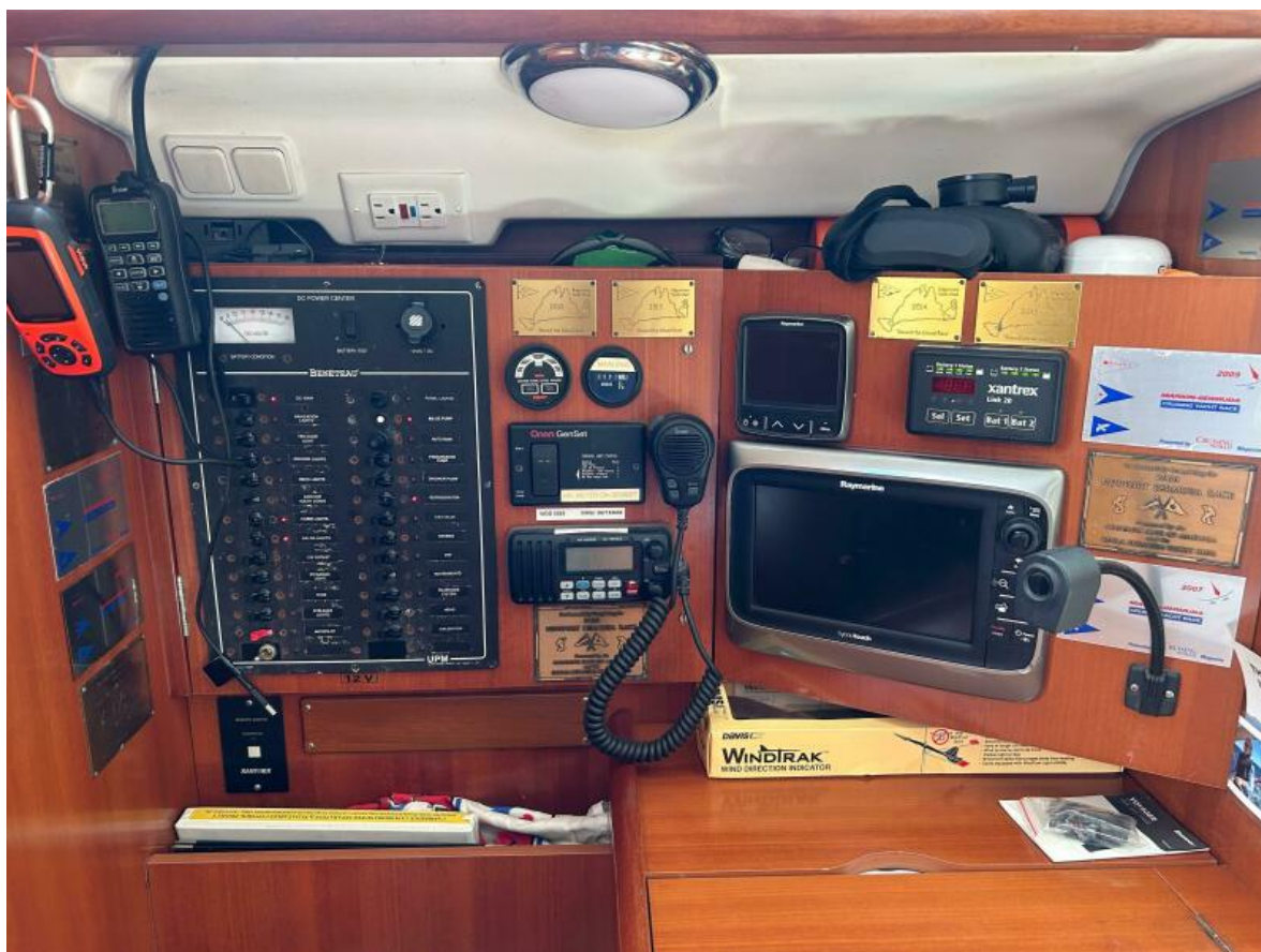
Instruments at Nav Station