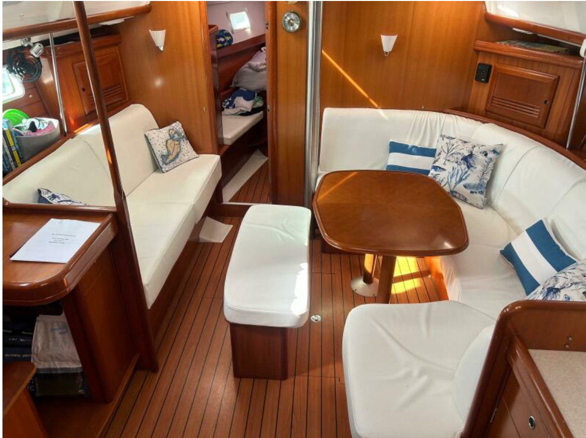
Main Salon Looking Forward