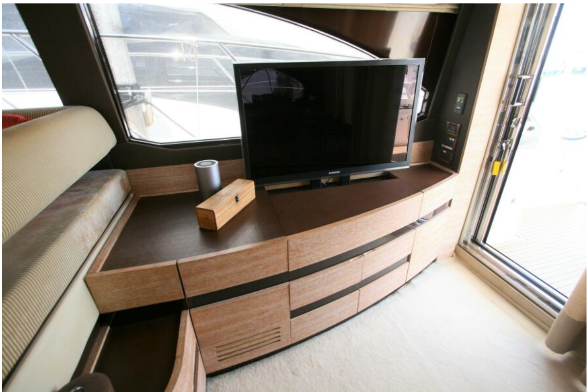
Salon Starboard Aft View