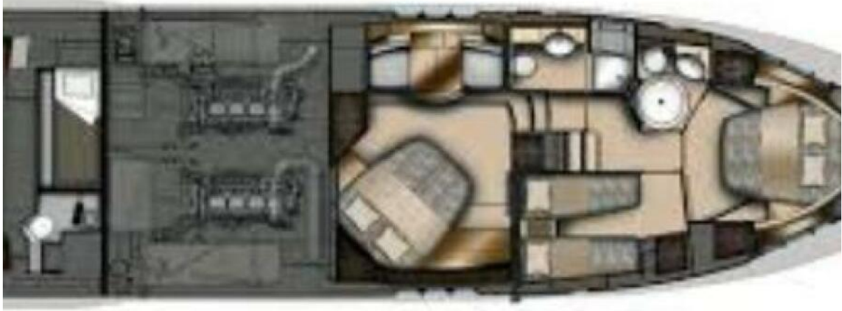
53' Azimut Cabin Layout