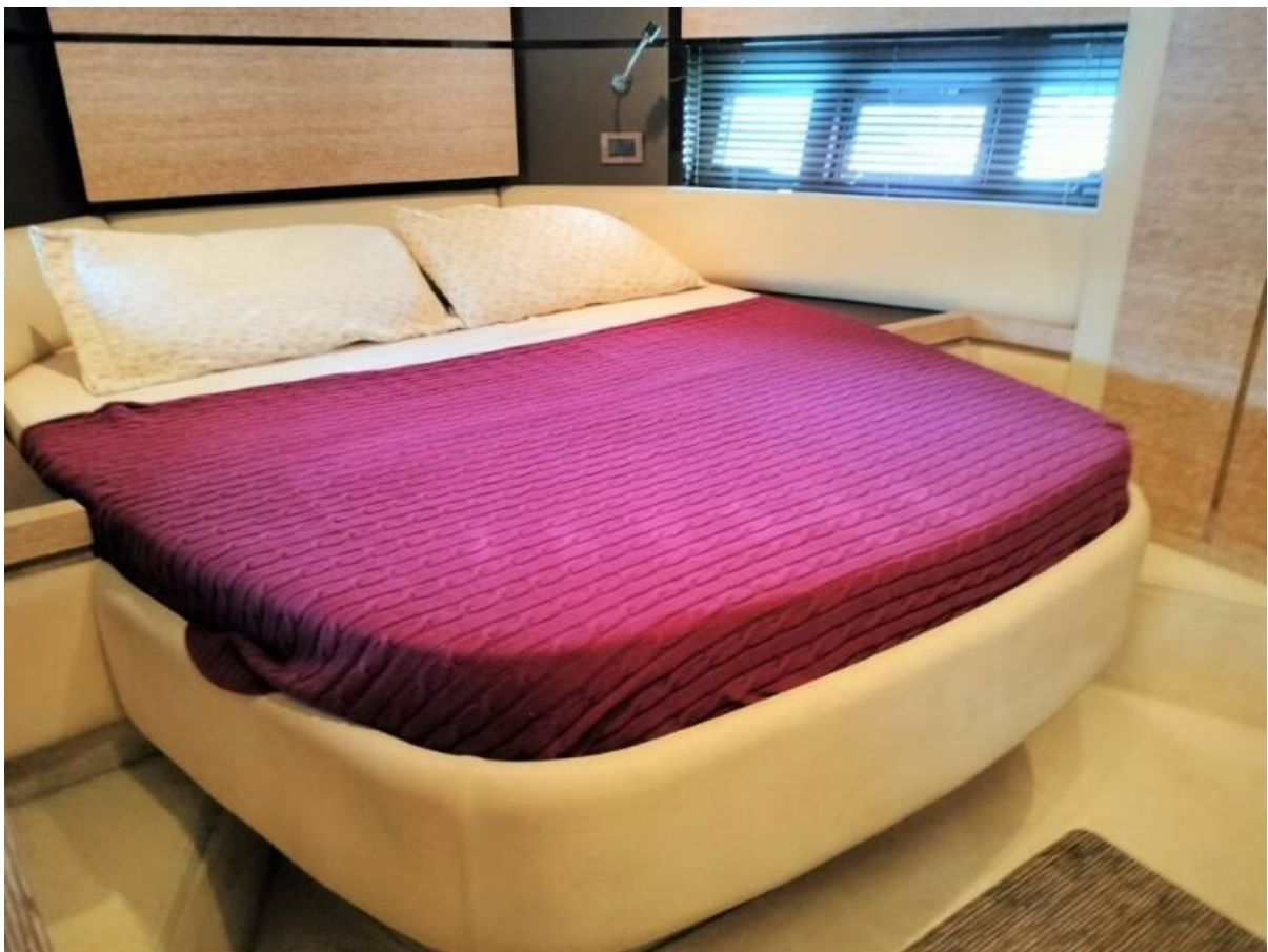
Forward VIP Stateroom