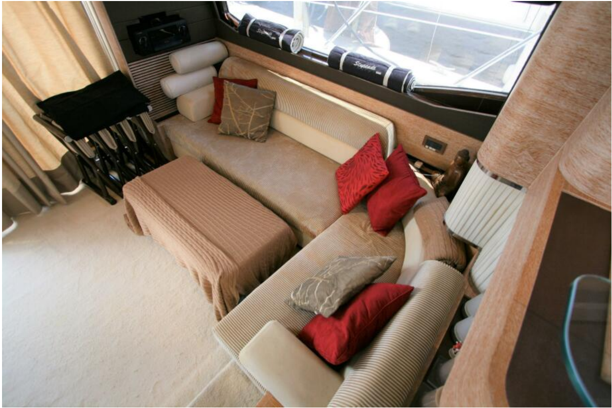
Salon Port View