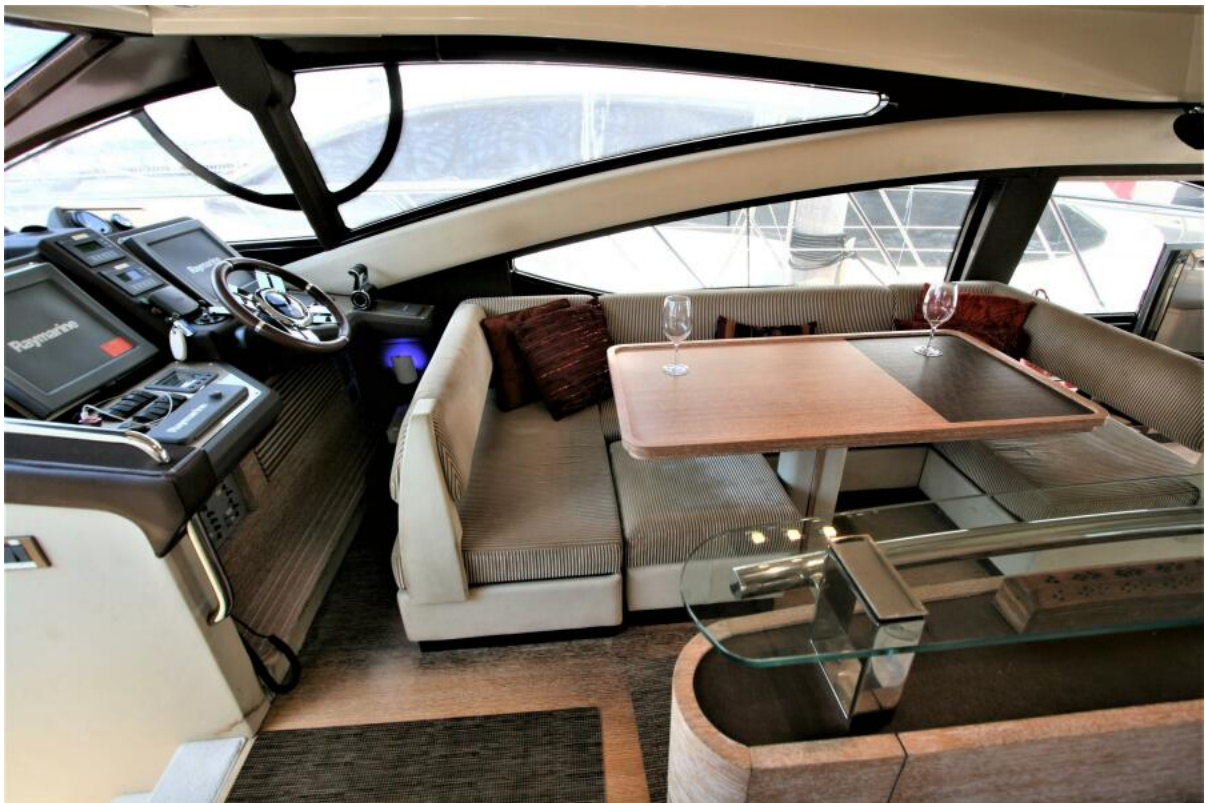
Settee and Helm