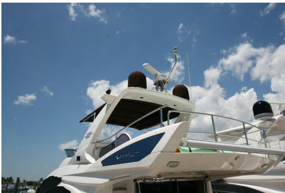
Flybridge Aft View