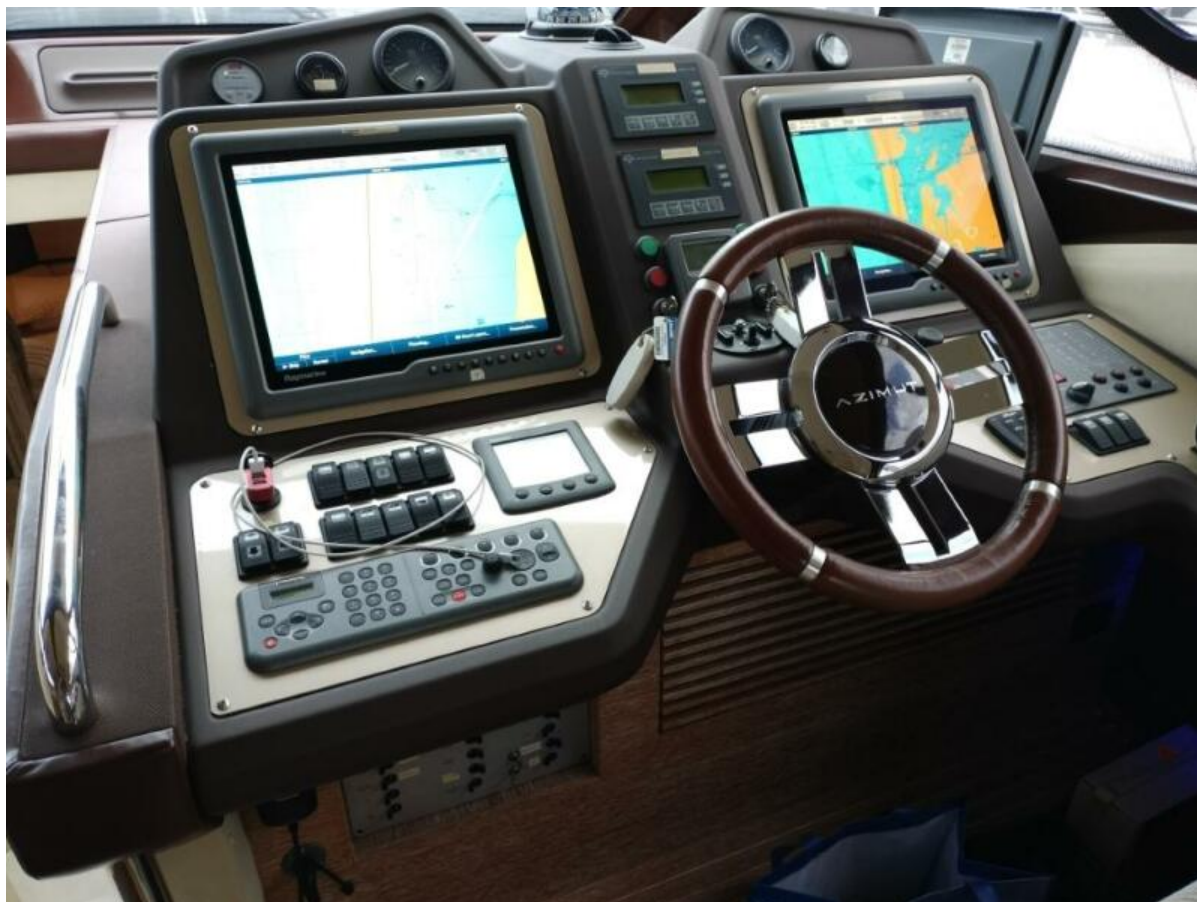
Ravello Lower Helm 2