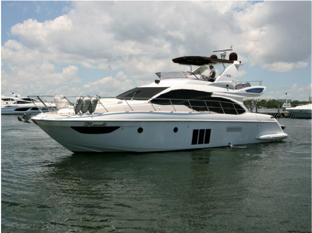
Ravello 2011 53' Azimut