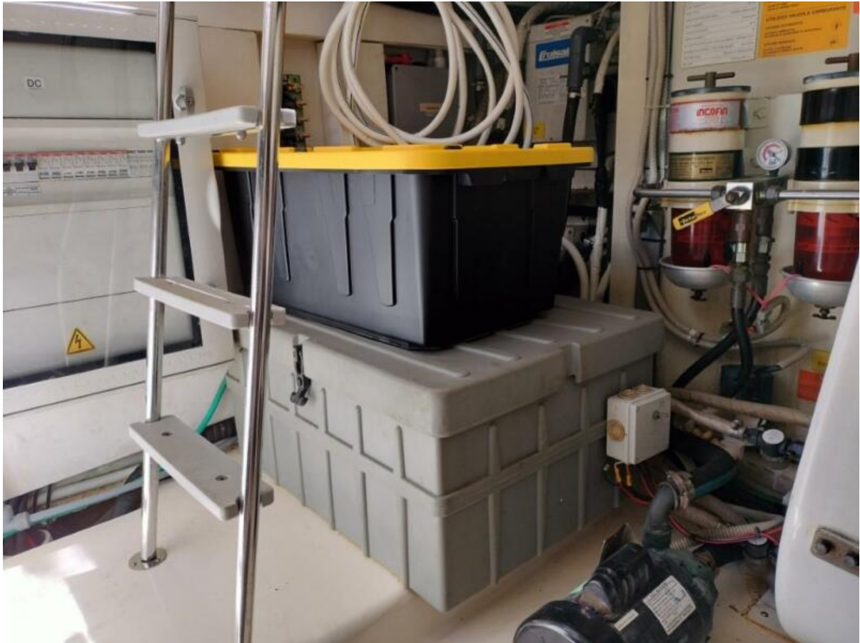
Engine Room Storage