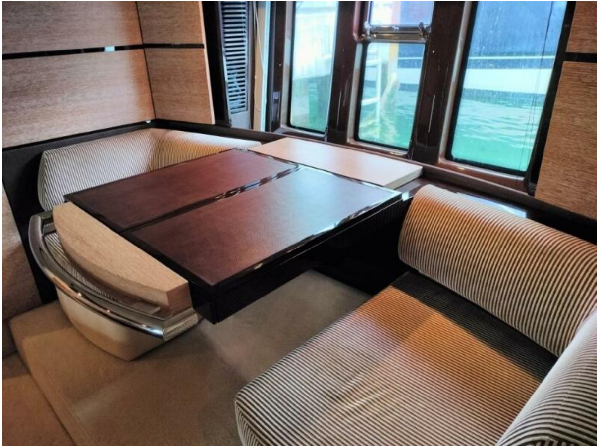
Master Stateroom Settee