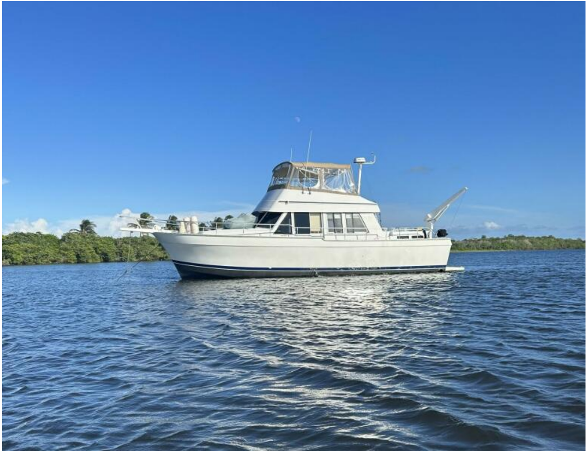
1999 Mainship 430 Trawler