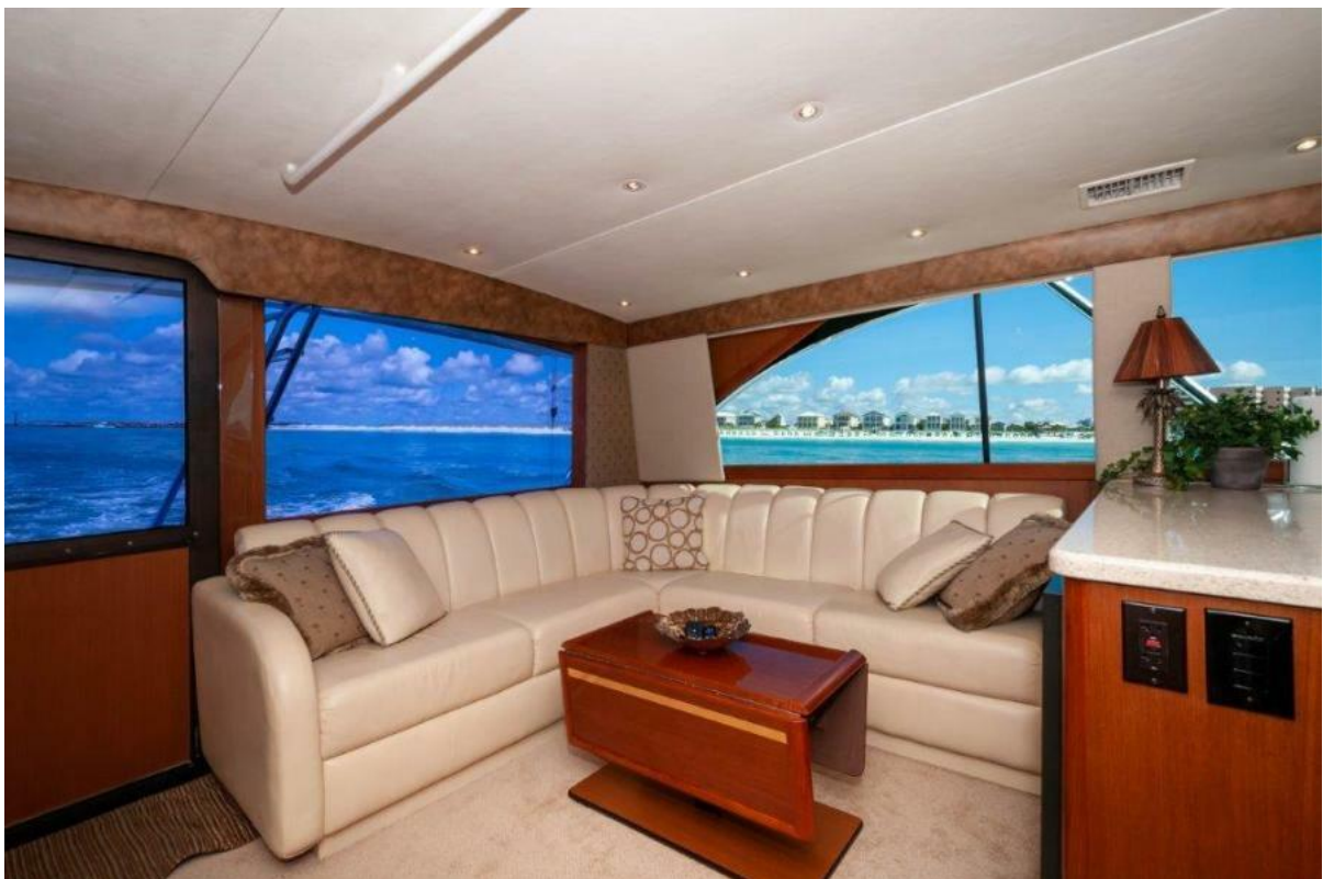
1998 Ocean Yachts 48 Super Sport Salon