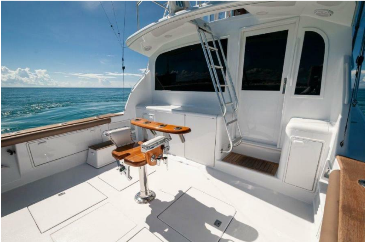
1998 Ocean Yachts 48 Super Sport Cockpit 6