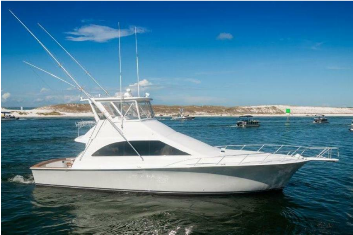
1998 Ocean Yachts 48 Super Sport Main Profile