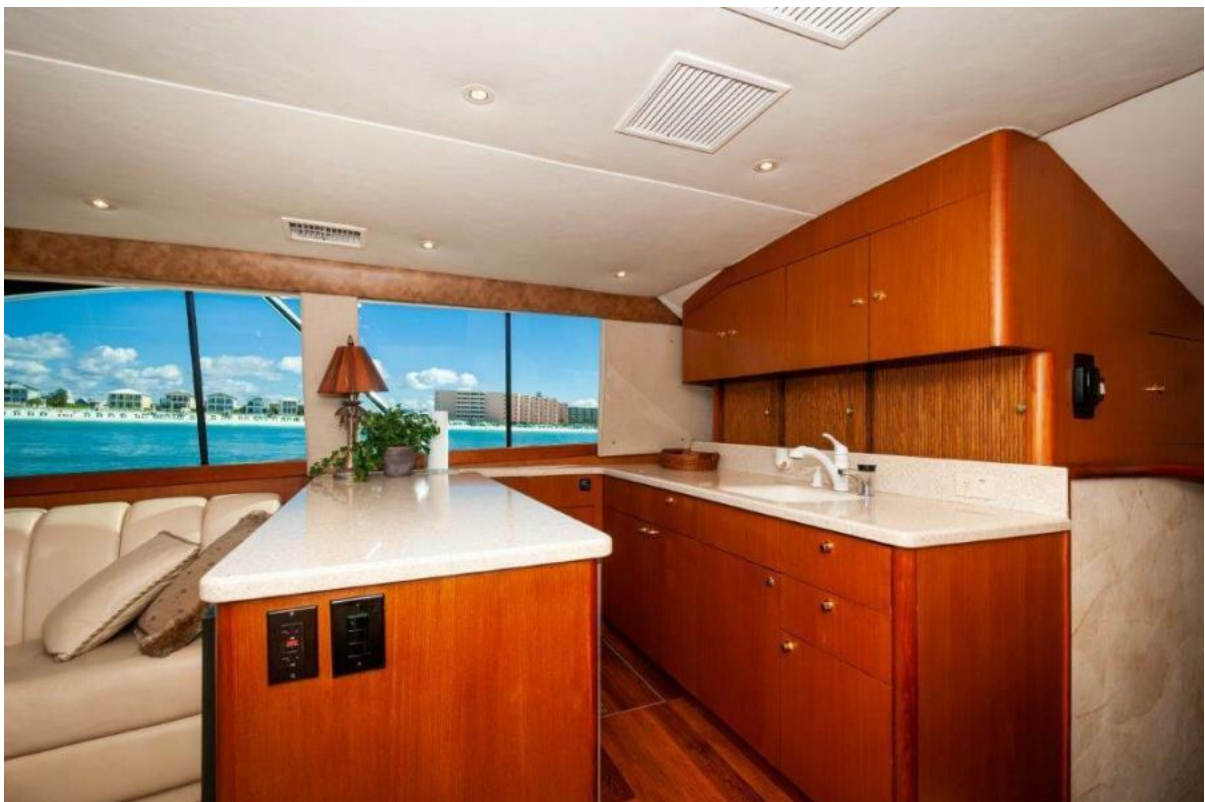
1998 Ocean Yachts 48 Super Sport Galley 2