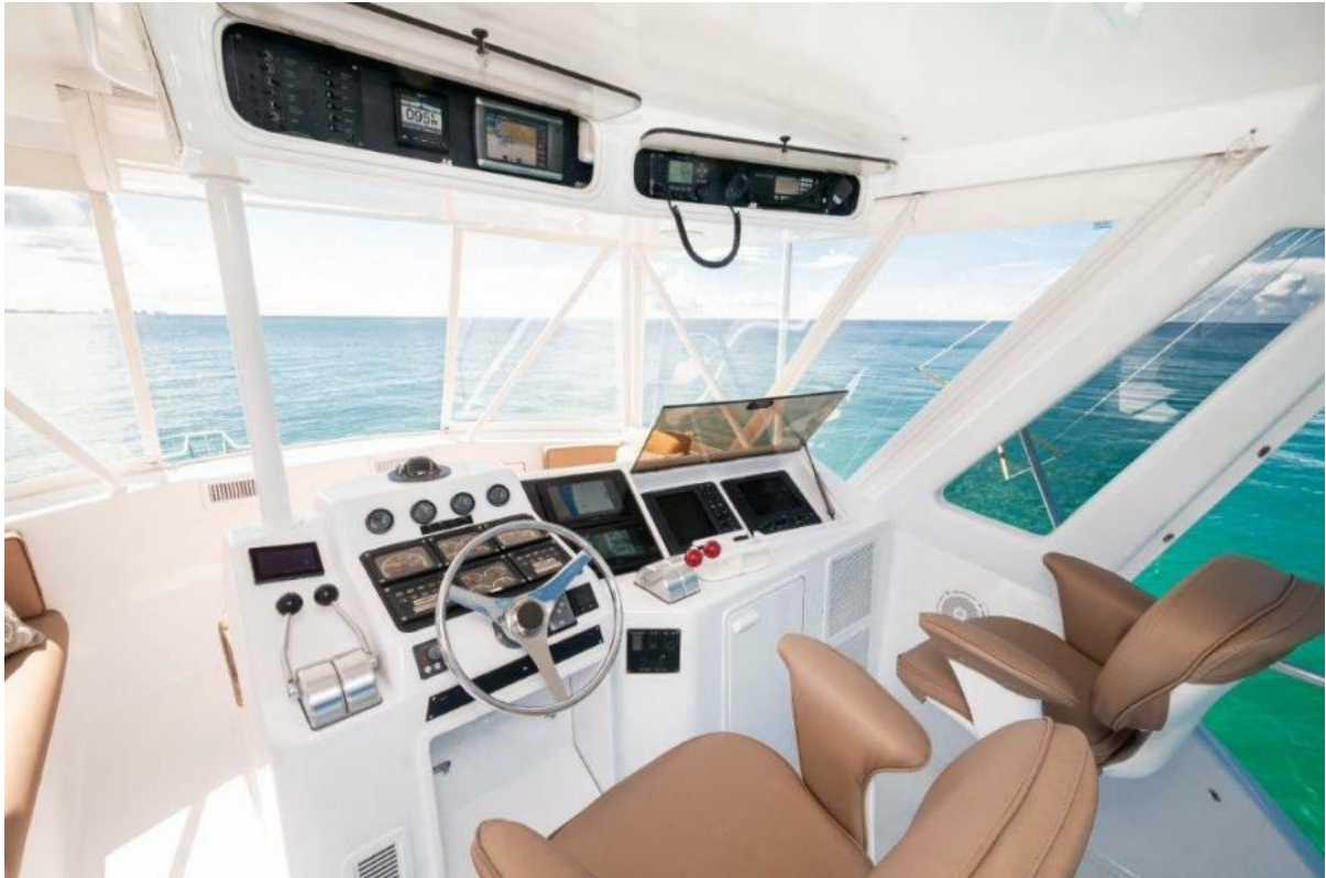
1998 Ocean Yachts 48 Super Sport Helm