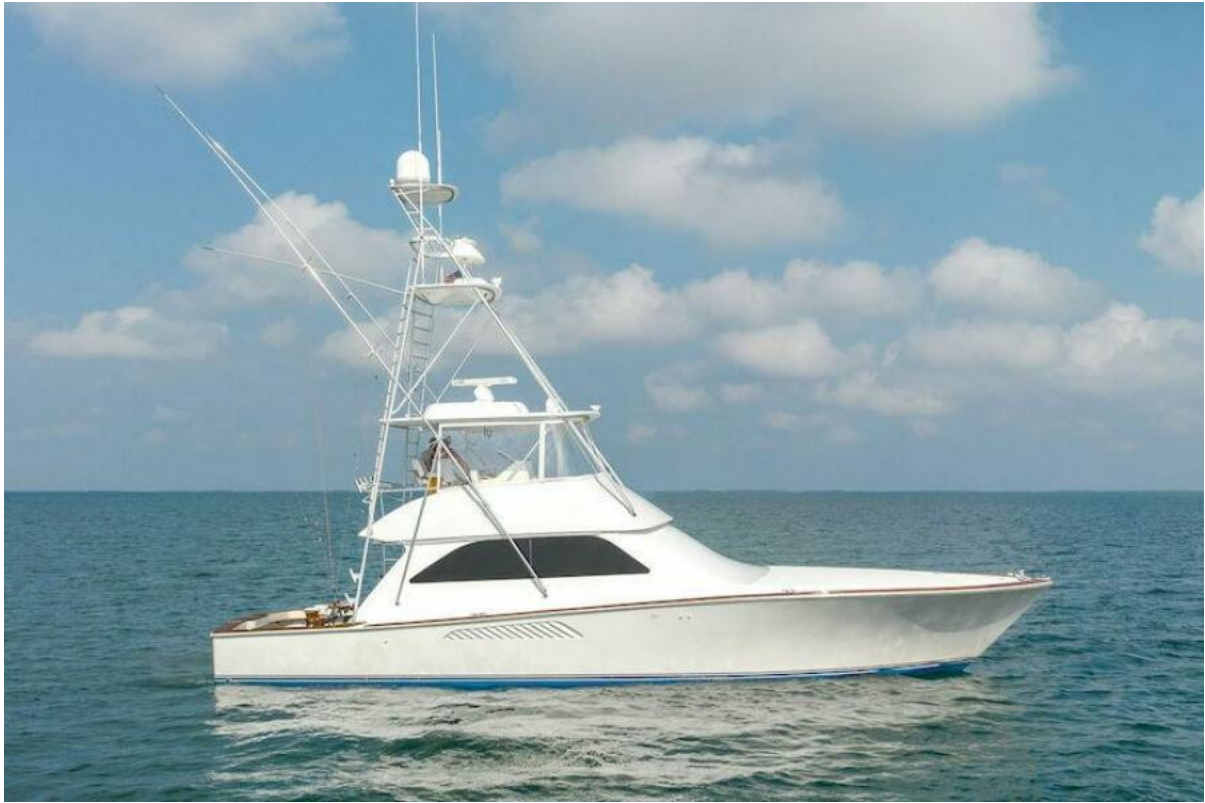
2004 Viking 52 CNV 'War Chant'