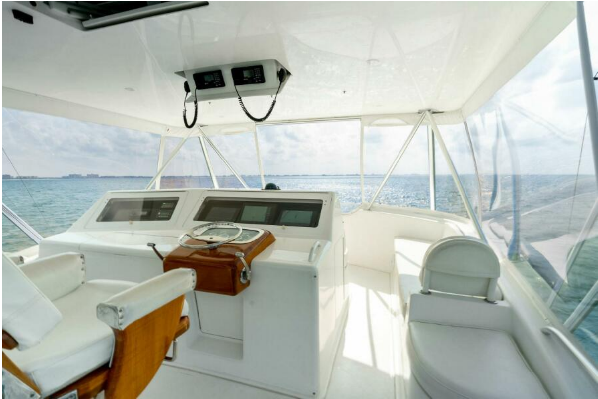
2004 Viking 52 CNV 'War Chant' Flybridge