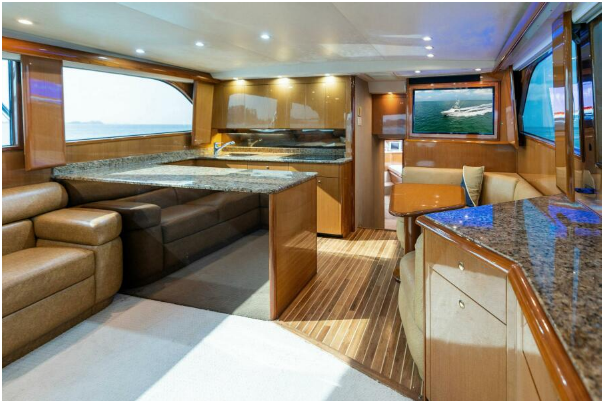
2004 Viking.52 CNV 'War Chant' Salon