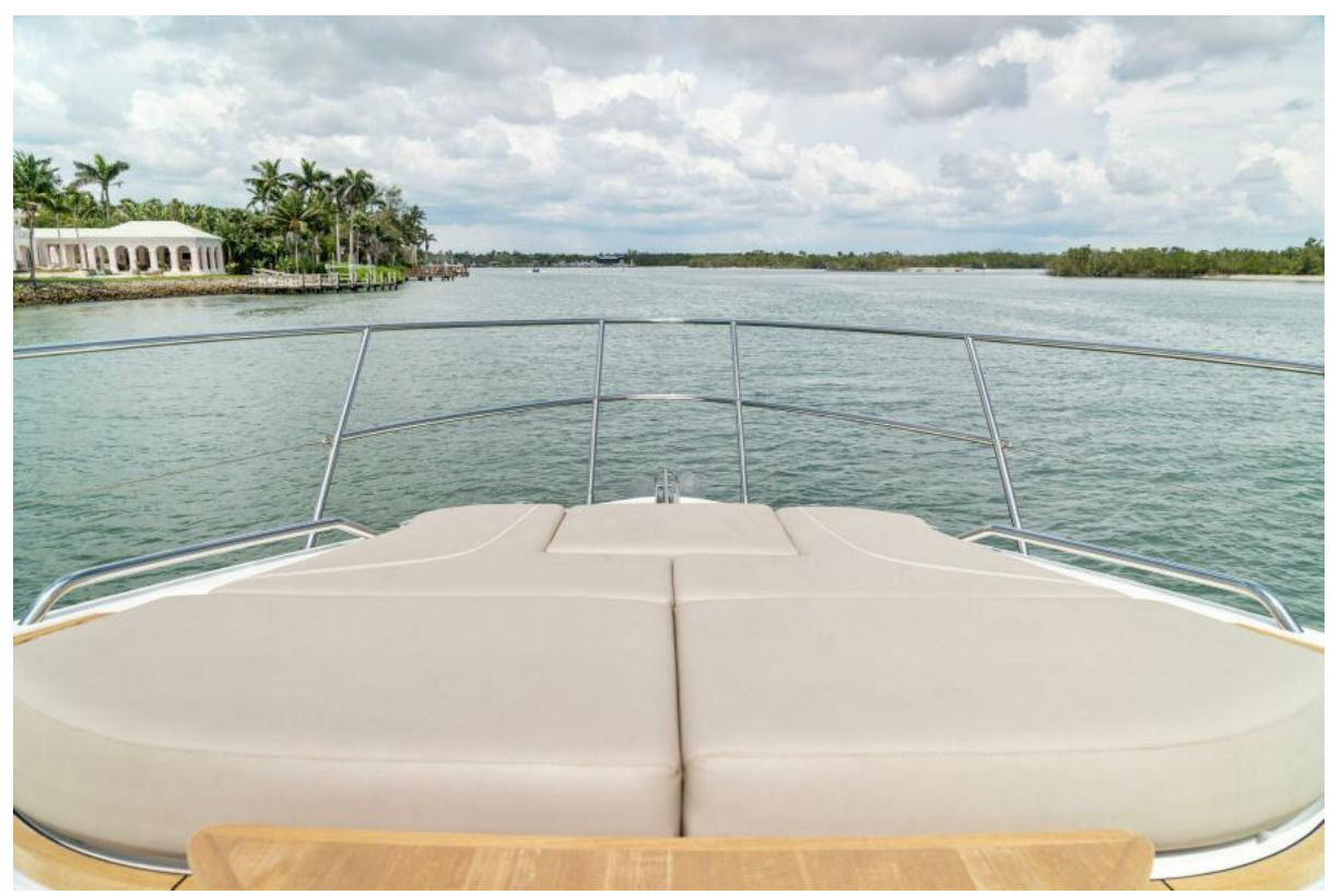
2020 Princess V55 - Baskin in the Sun - Bow Seating