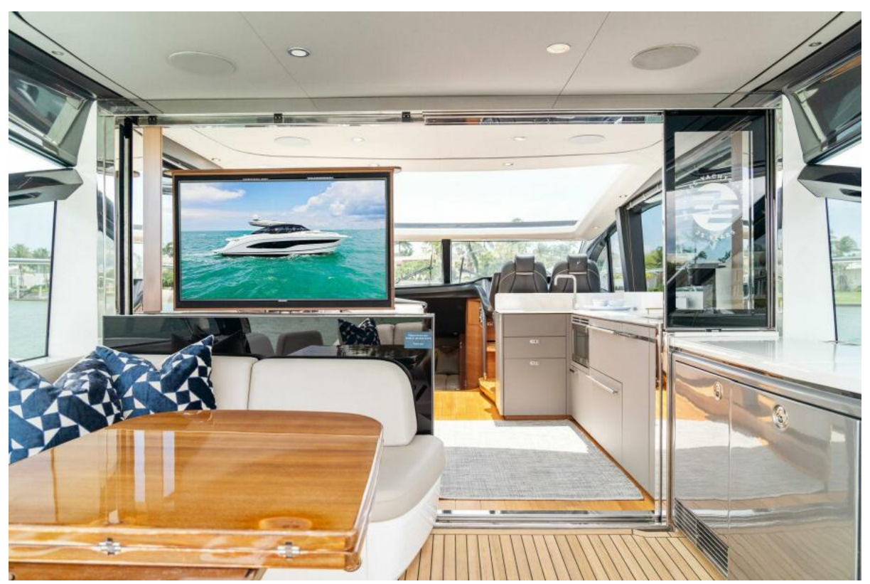
2020 Princess V55 - Baskin in the Sun - Cockpit/ Salon