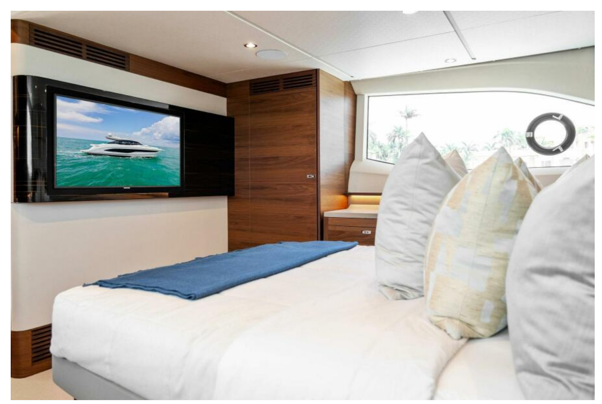
2020 Princess V55 - Baskin in the Sun - Master Stateroom