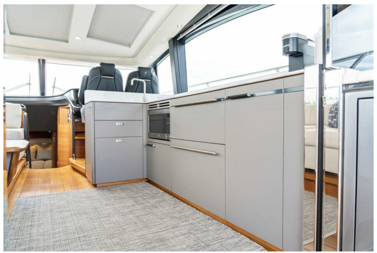
2020 Princess V55 - Baskin in the Sun - Galley