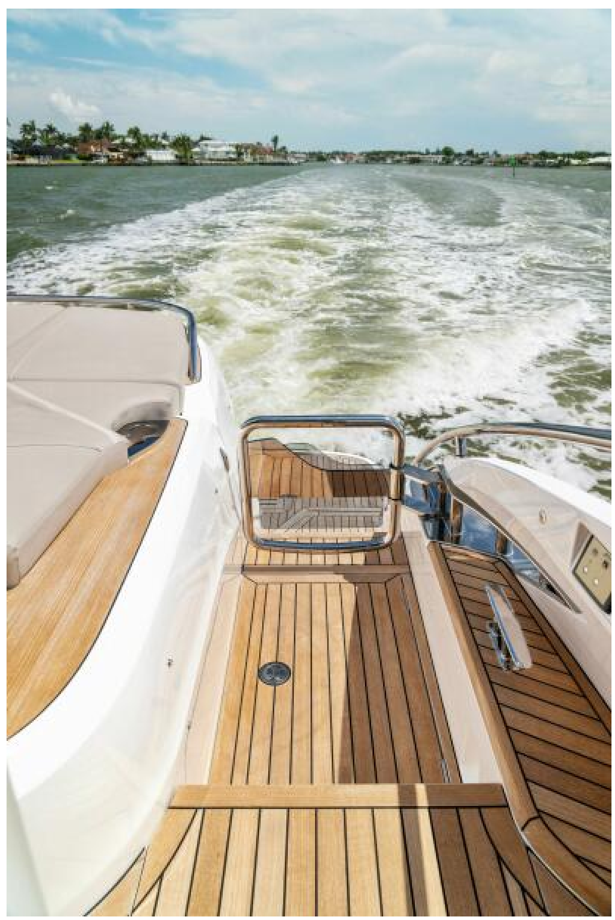
2020 Princess V55 - Baskin in the Sun - Companionway to Swim Platform