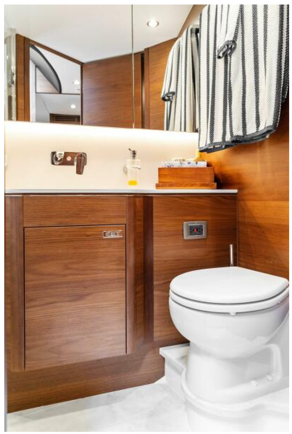
2020 Princess V55 - Baskin in the Sun - Master Head