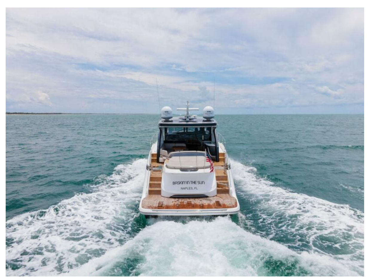
2020 Princess V55 - Baskin in the Sun - Running Profile