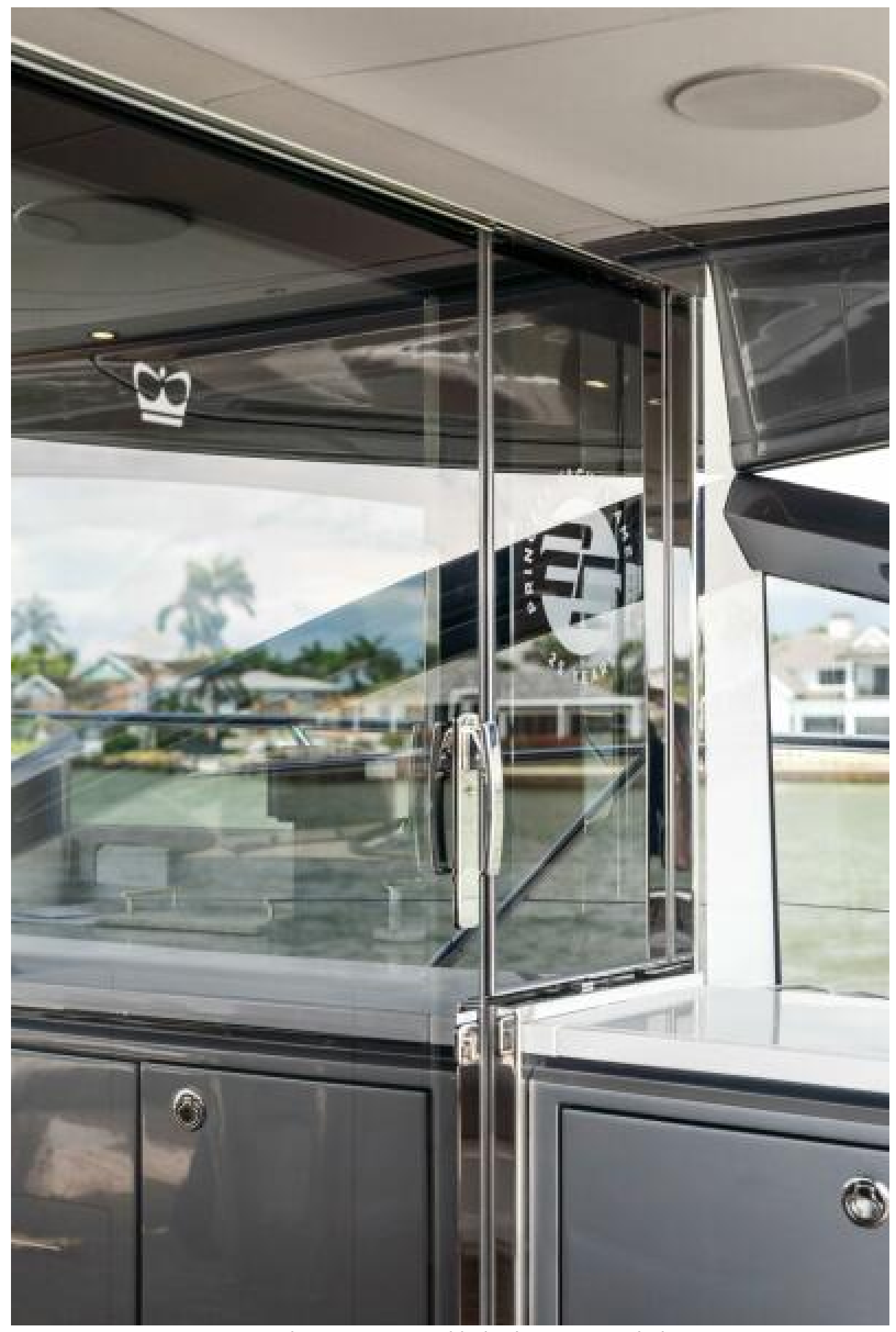
2020 Princess V55 - Baskin in the Sun - Cockpit