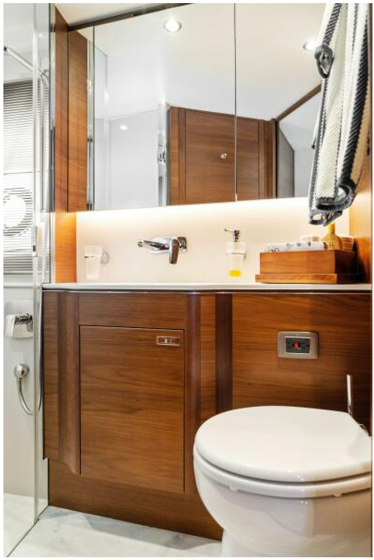
2020 Princess V55 - Baskin in the Sun - Master Head