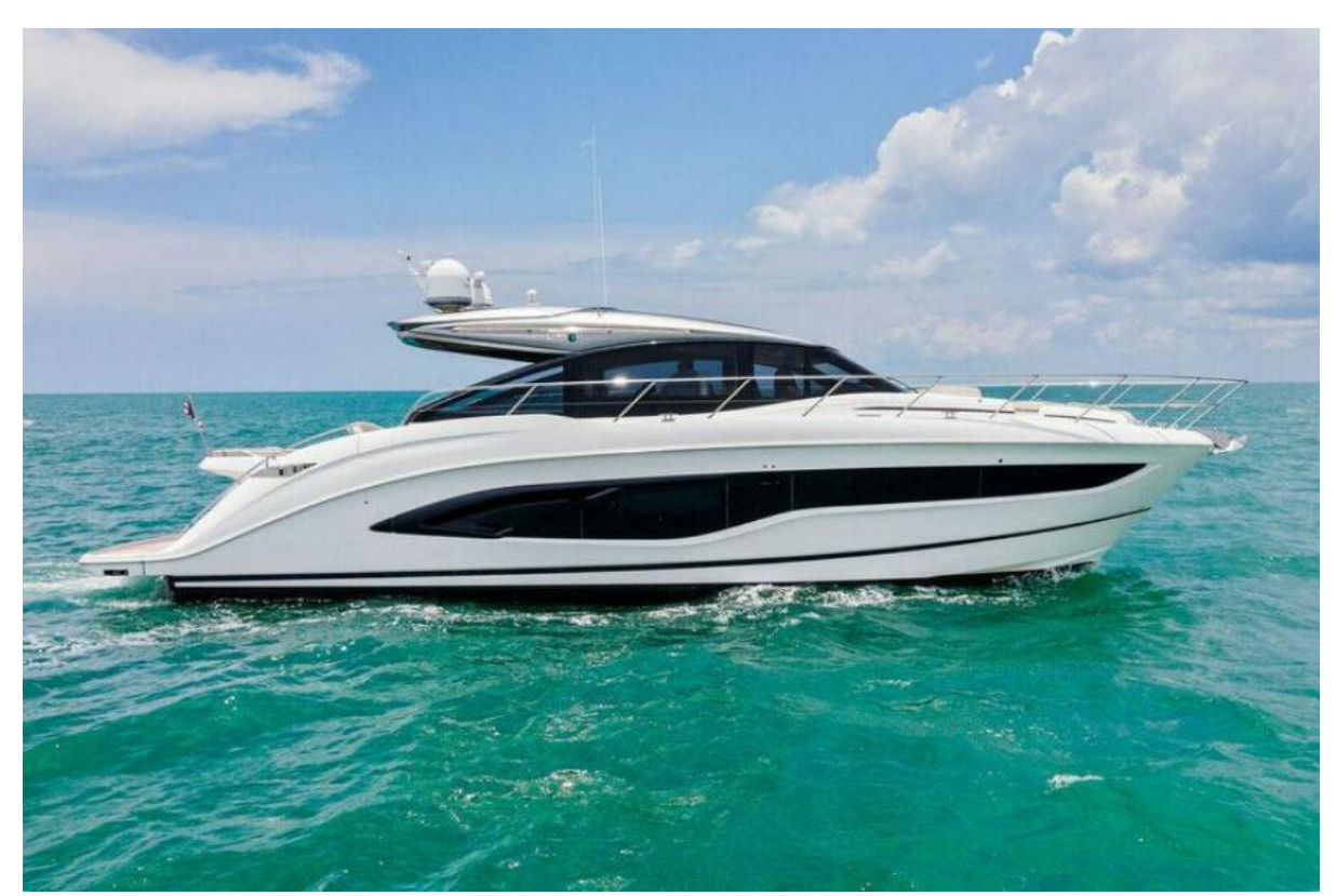
2020 Princess V55 - Baskin in the Sun - Main Profile