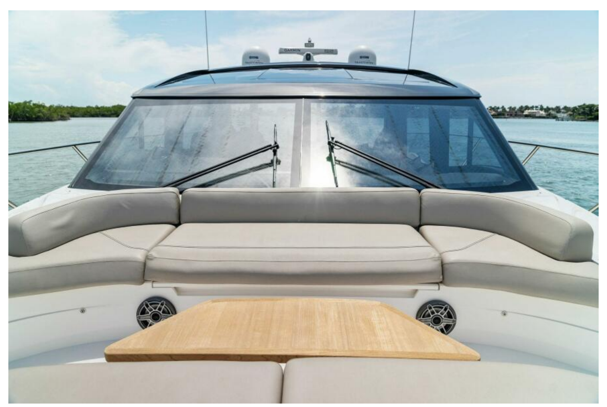
2020 Princess V55 - Baskin in the Sun - Bow Seating