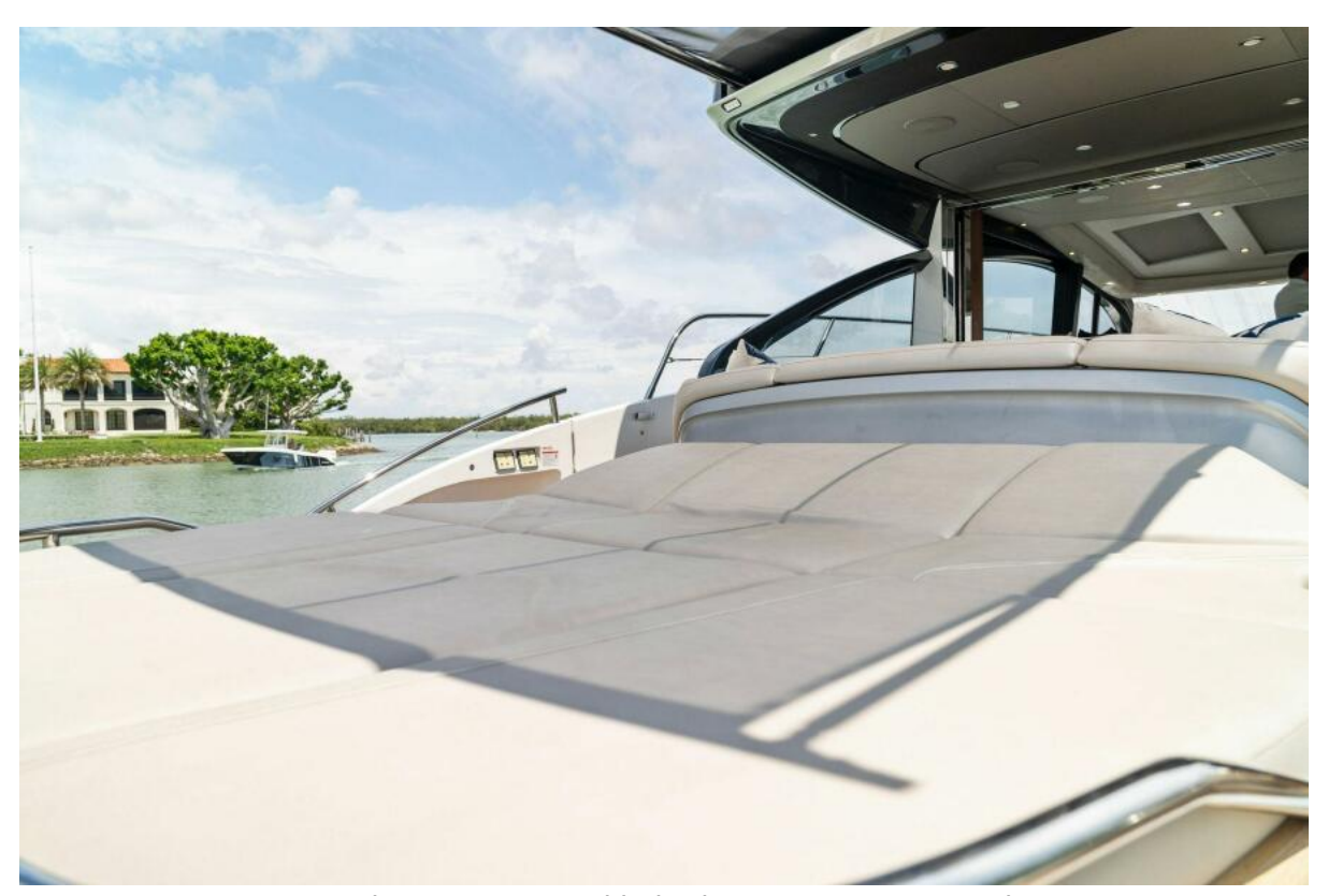
2020 Princess V55 - Baskin in the Sun - Lounge Seating