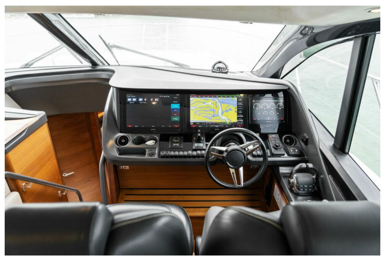
2020 Princess V55 - Baskin in the Sun - Helm