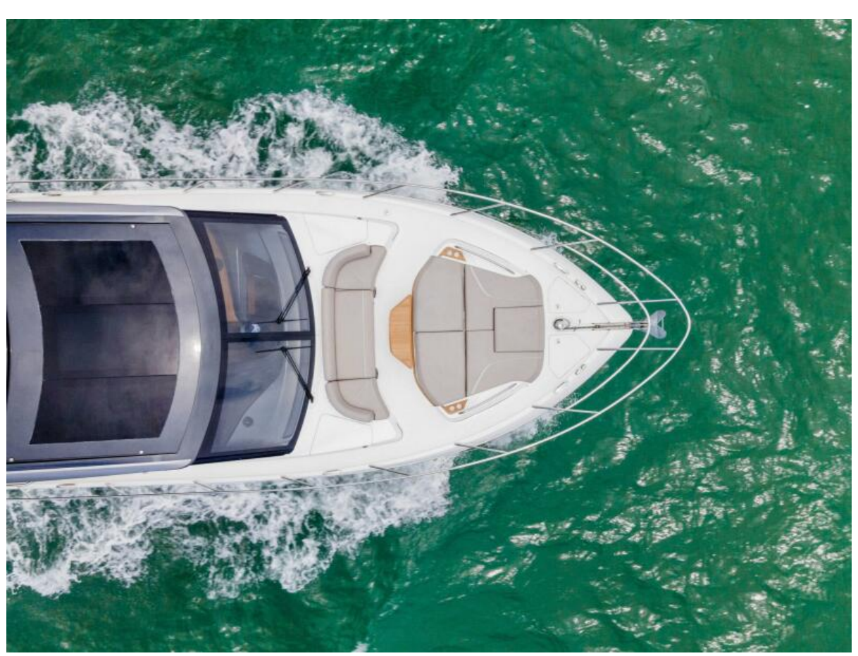
2020 Princess V55 - Baskin in the Sun - Running Profile