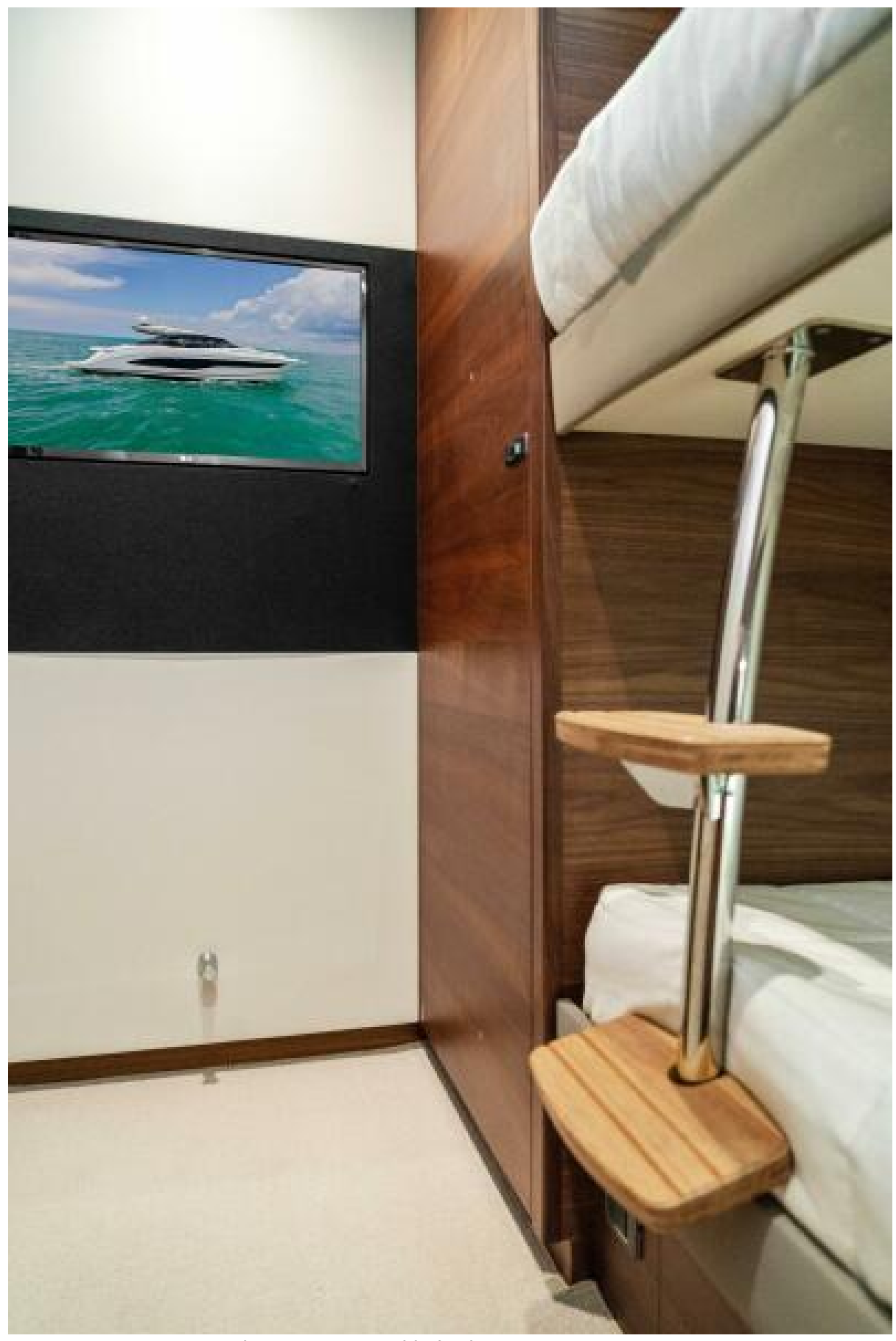
2020 Princess V55 - Baskin in the Sun - Guest Stateroom