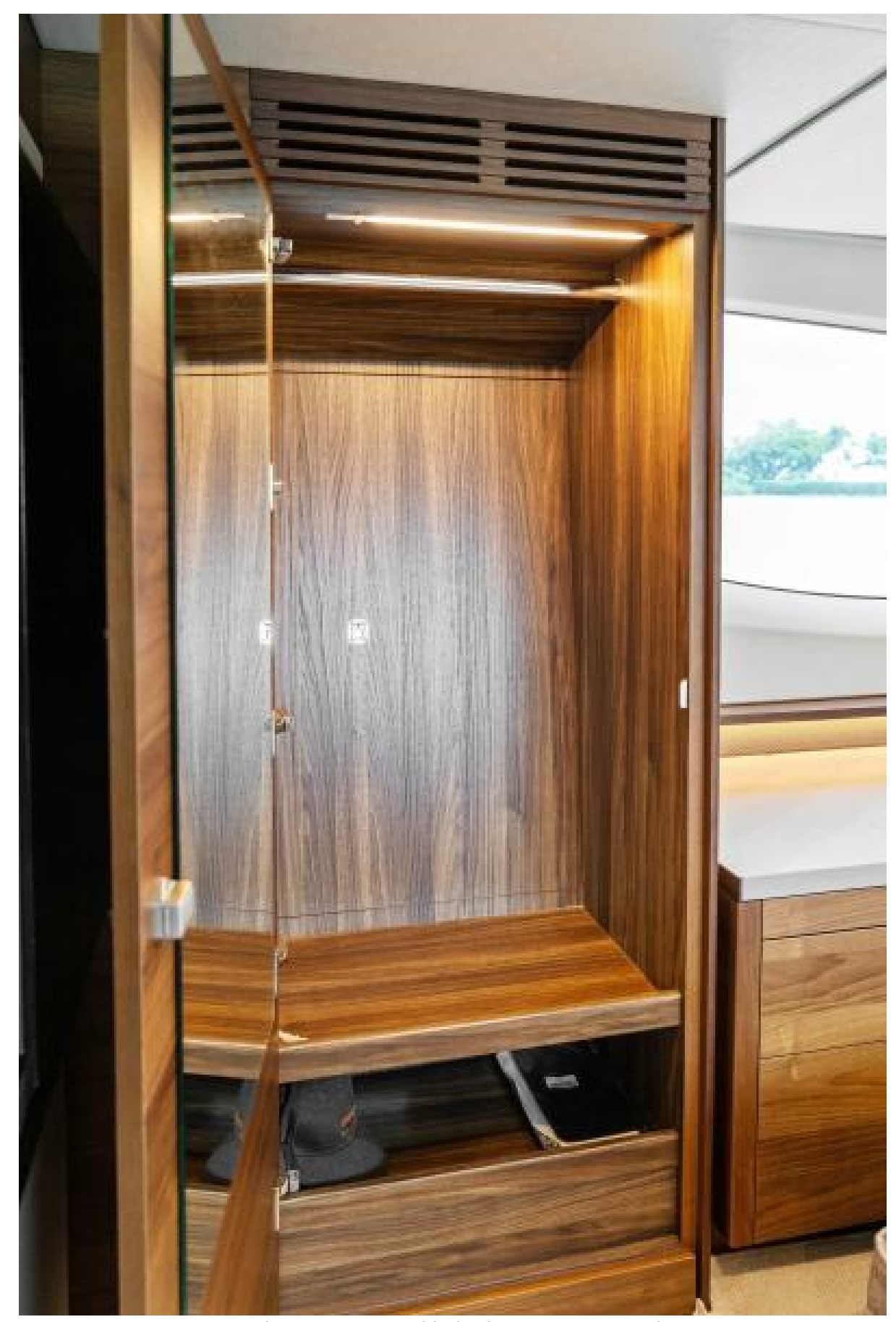
2020 Princess V55 - Baskin in the Sun - Master Closet