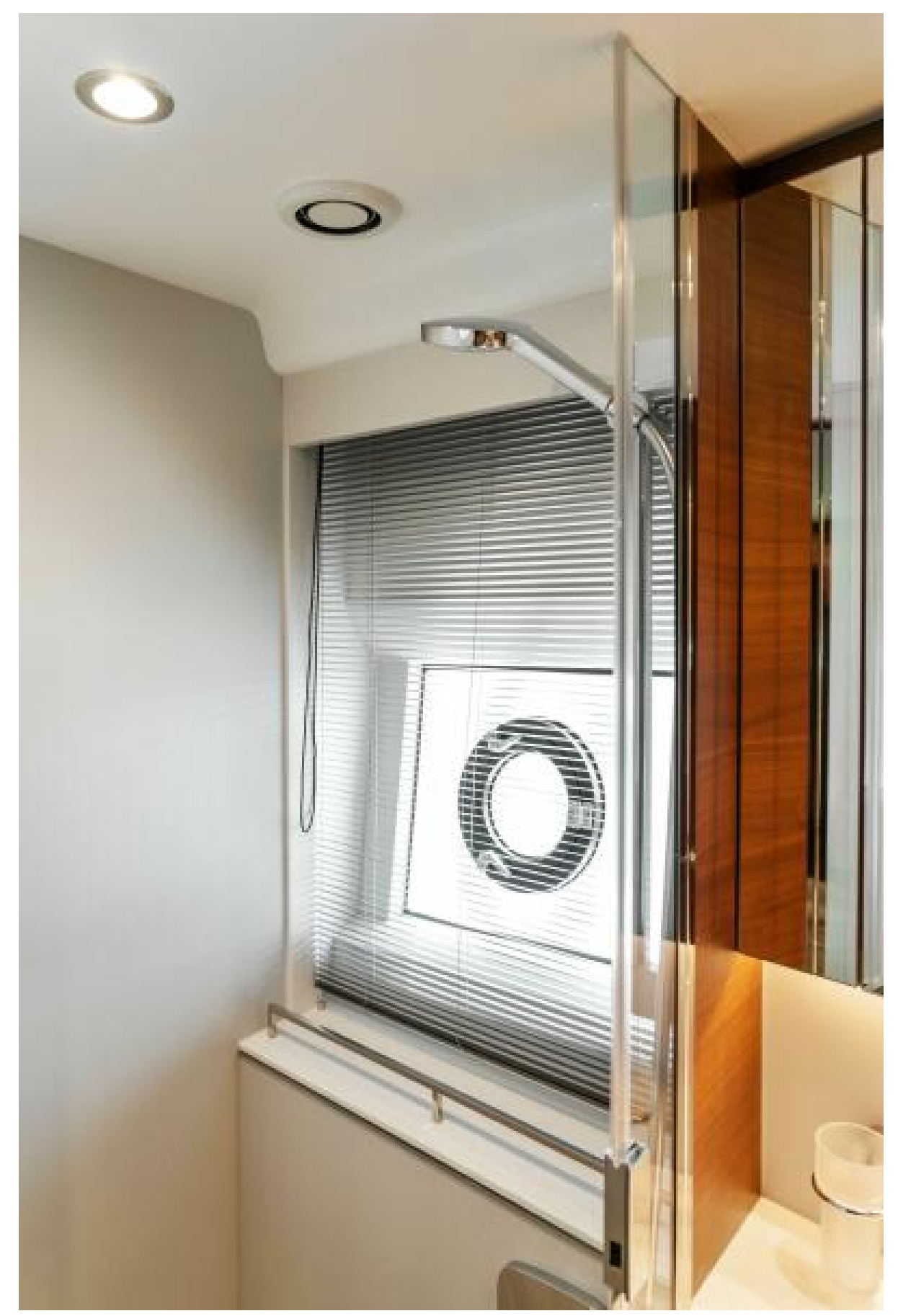
2020 Princess V55 - Baskin in the Sun - Master Shower