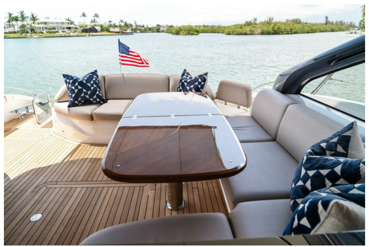
2020 Princess V55 - Baskin in the Sun - Cockpit