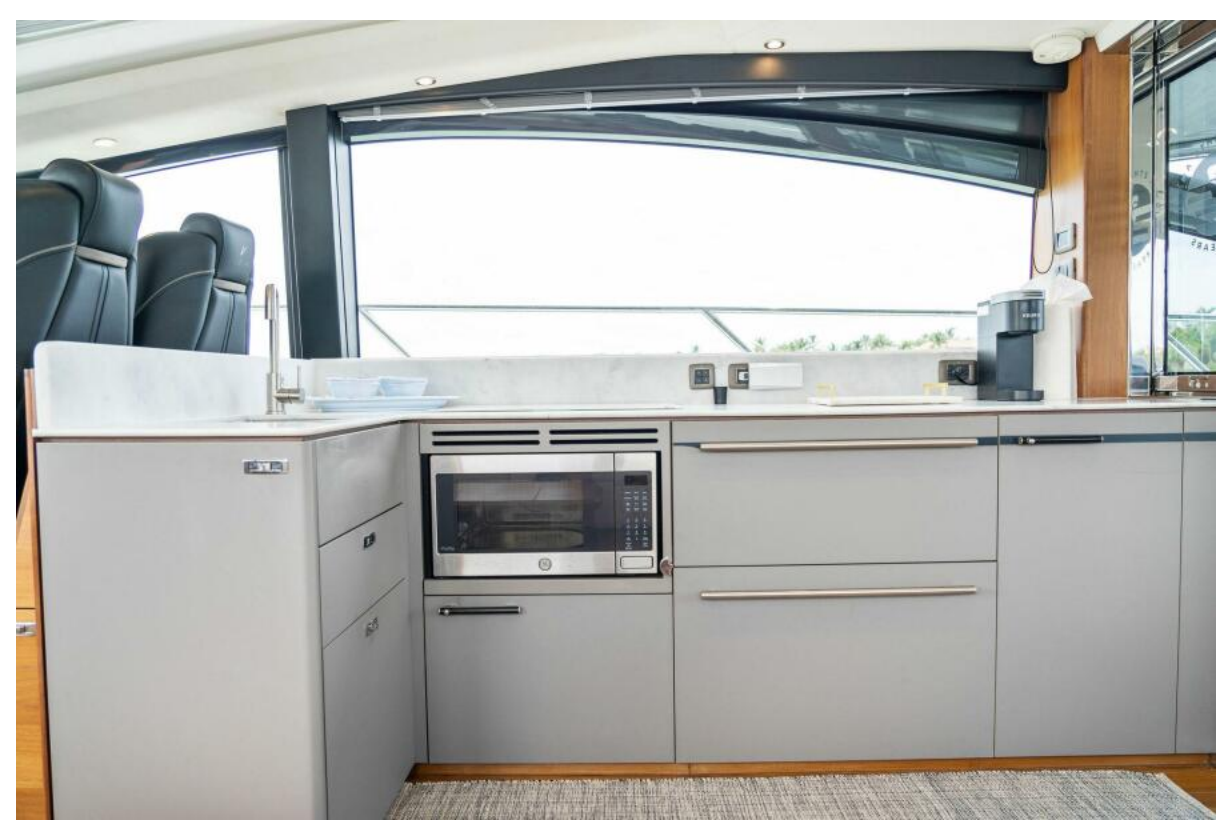
2020 Princess V55 - Baskin in the Sun - Galley