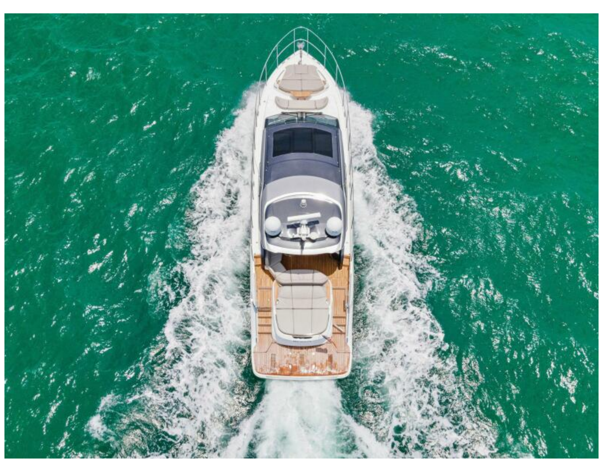
2020 Princess V55 - Baskin in the Sun - Running Profile