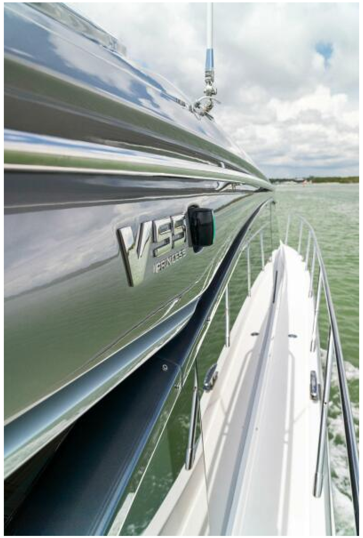
2020 Princess V55 - Baskin in the Sun - Starboard Walkway