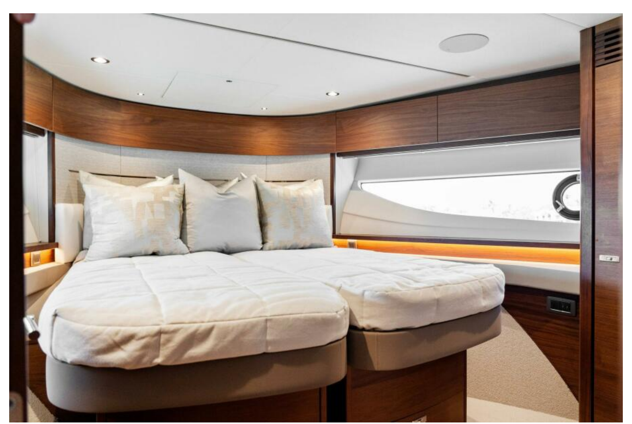
2020 Princess V55 - Baskin in the Sun - VIP Stateroom