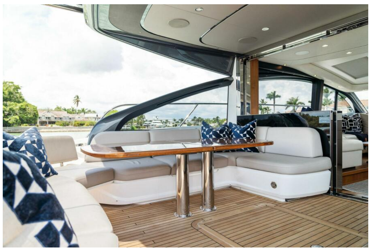
2020 Princess V55 - Baskin in the Sun - Dinette