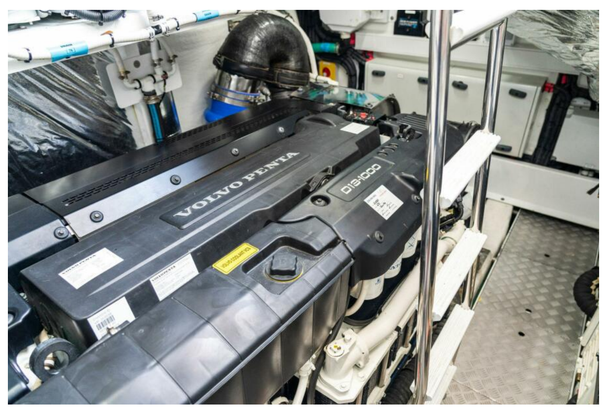
2020 Princess V55 - Baskin in the Sun - Engine Room