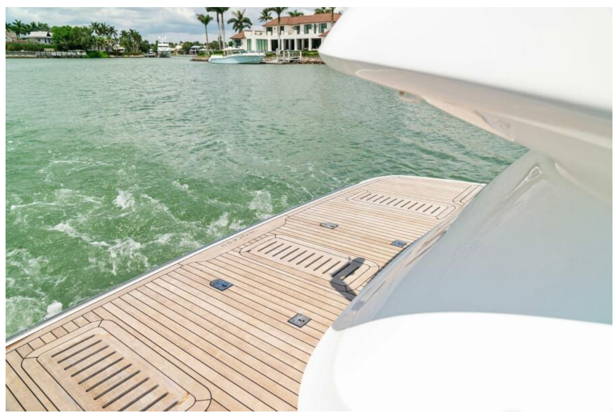
2020 Princess V55 - Baskin in the Sun - Swim Platform