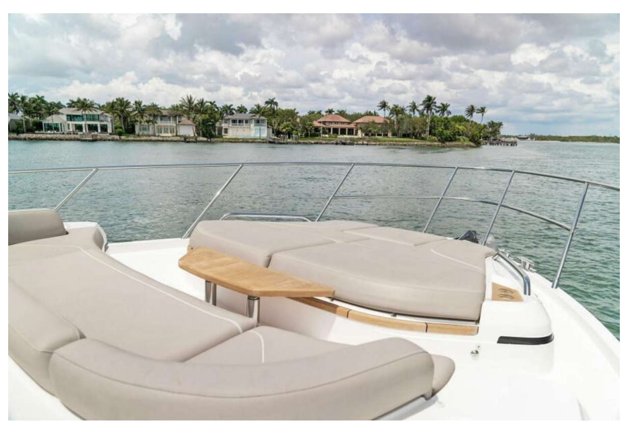
2020 Princess V55 - Baskin in the Sun - Bow Seating