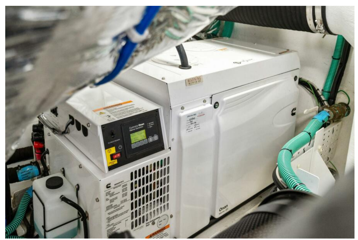
2020 Princess V55 - Baskin in the Sun - Engine Room