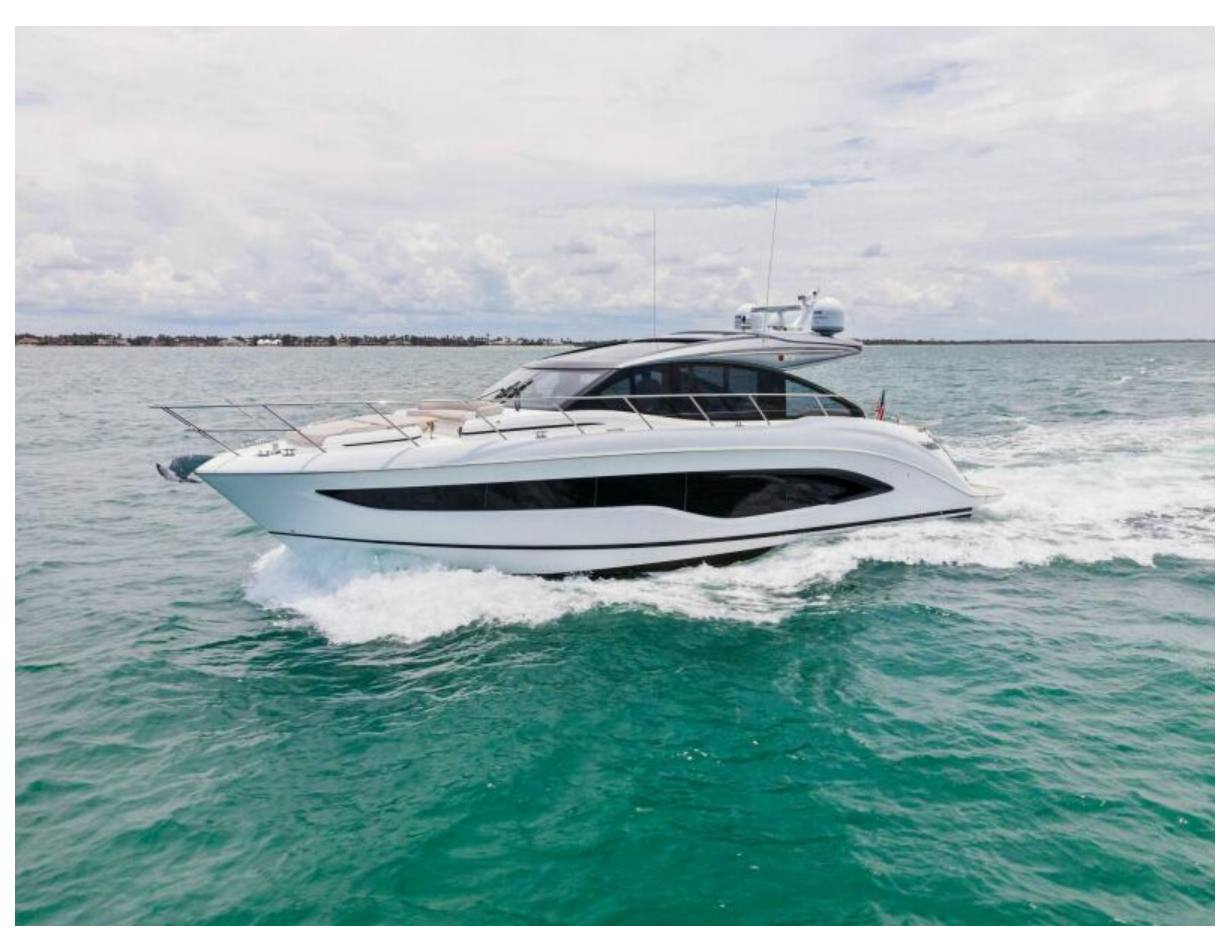
2020 Princess V55 - Baskin in the Sun - Port Profile