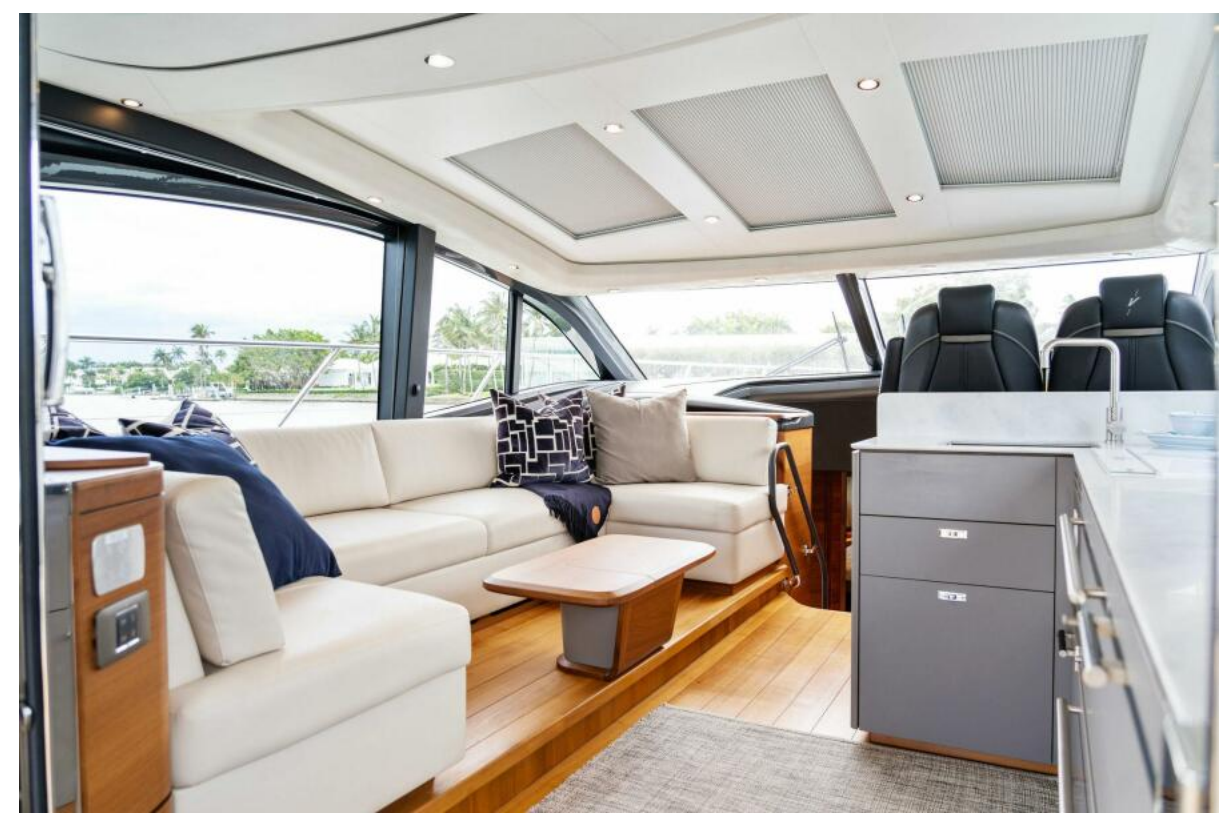
2020 Princess V55 - Baskin in the Sun - Salon Overview