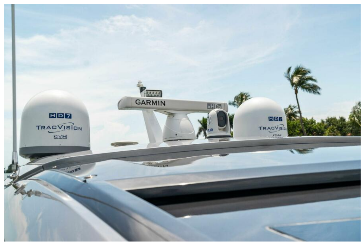
2020 Princess V55 - Baskin in the Sun - Electronics