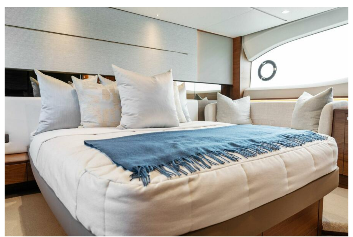
2020 Princess V55 - Baskin in the Sun - Master Stateroom