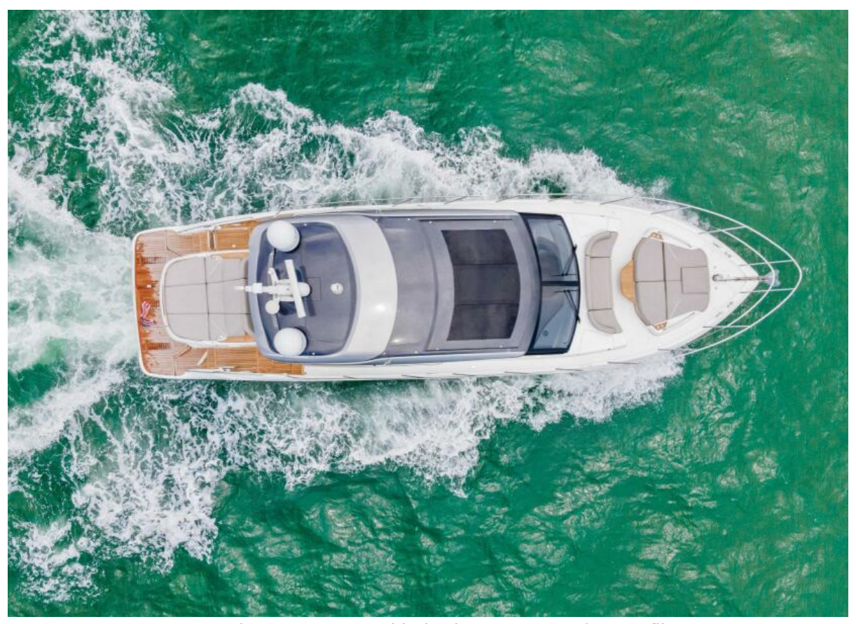
2020 Princess V55 - Baskin in the Sun - Running Profile