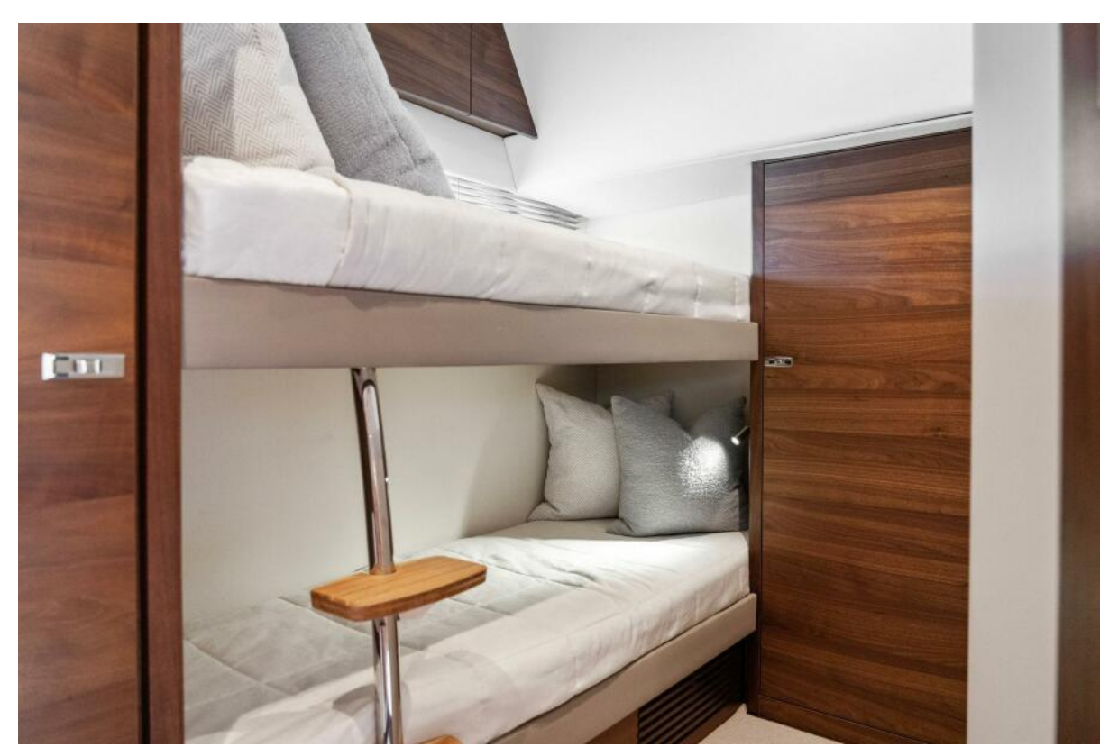
2020 Princess V55 - Baskin in the Sun - Guest Stateroom