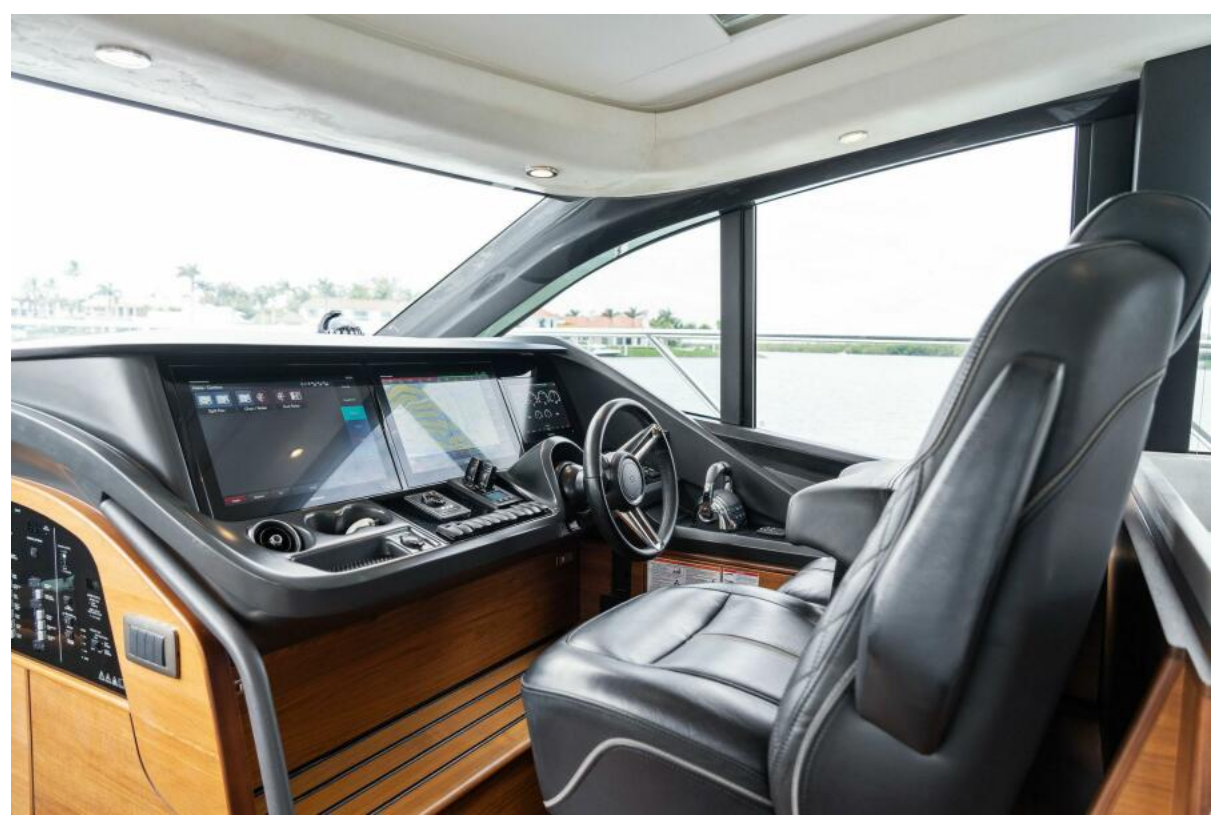
2020 Princess V55 - Baskin in the Sun - Helm