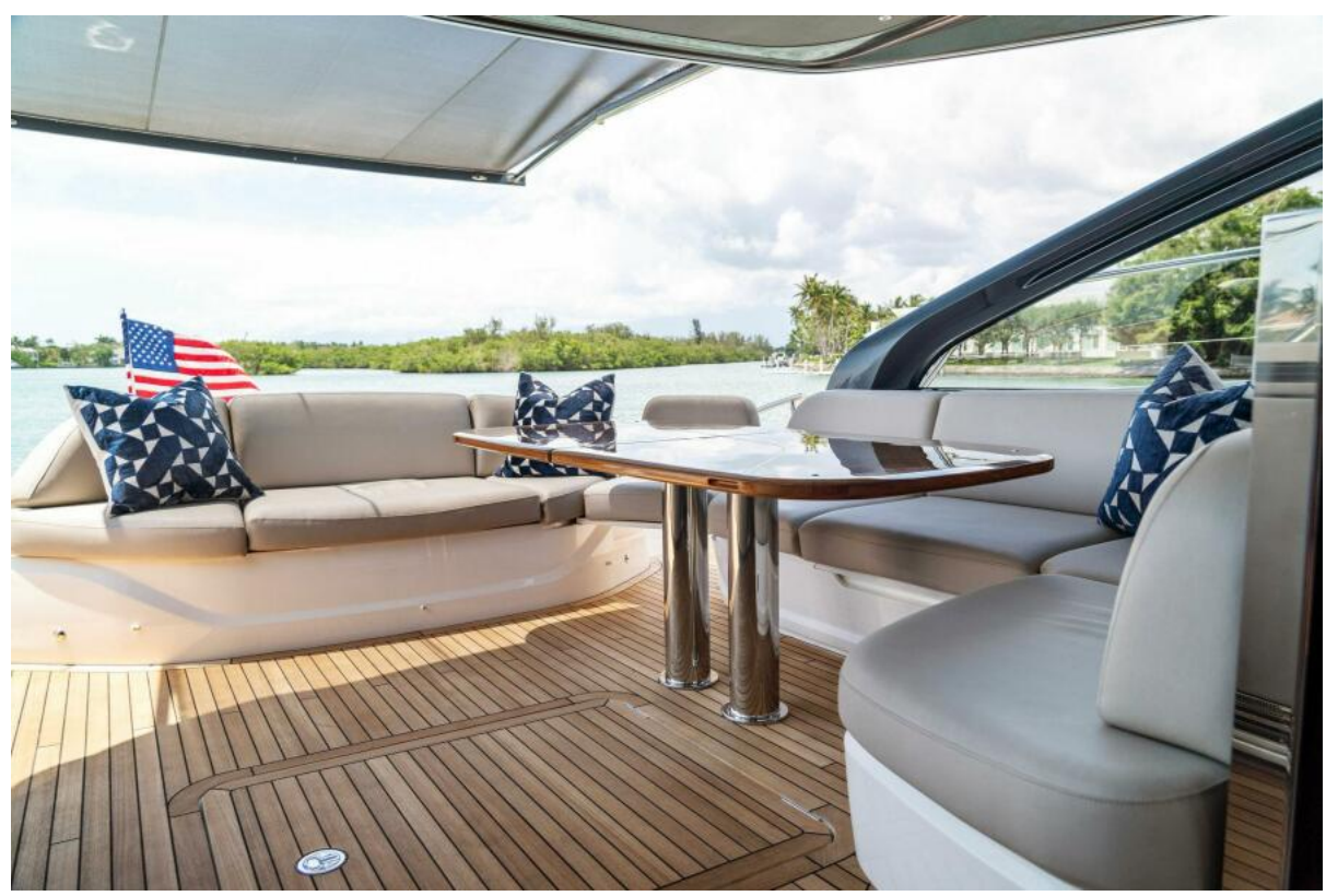
2020 Princess V55 - Baskin in the Sun - Cockpit