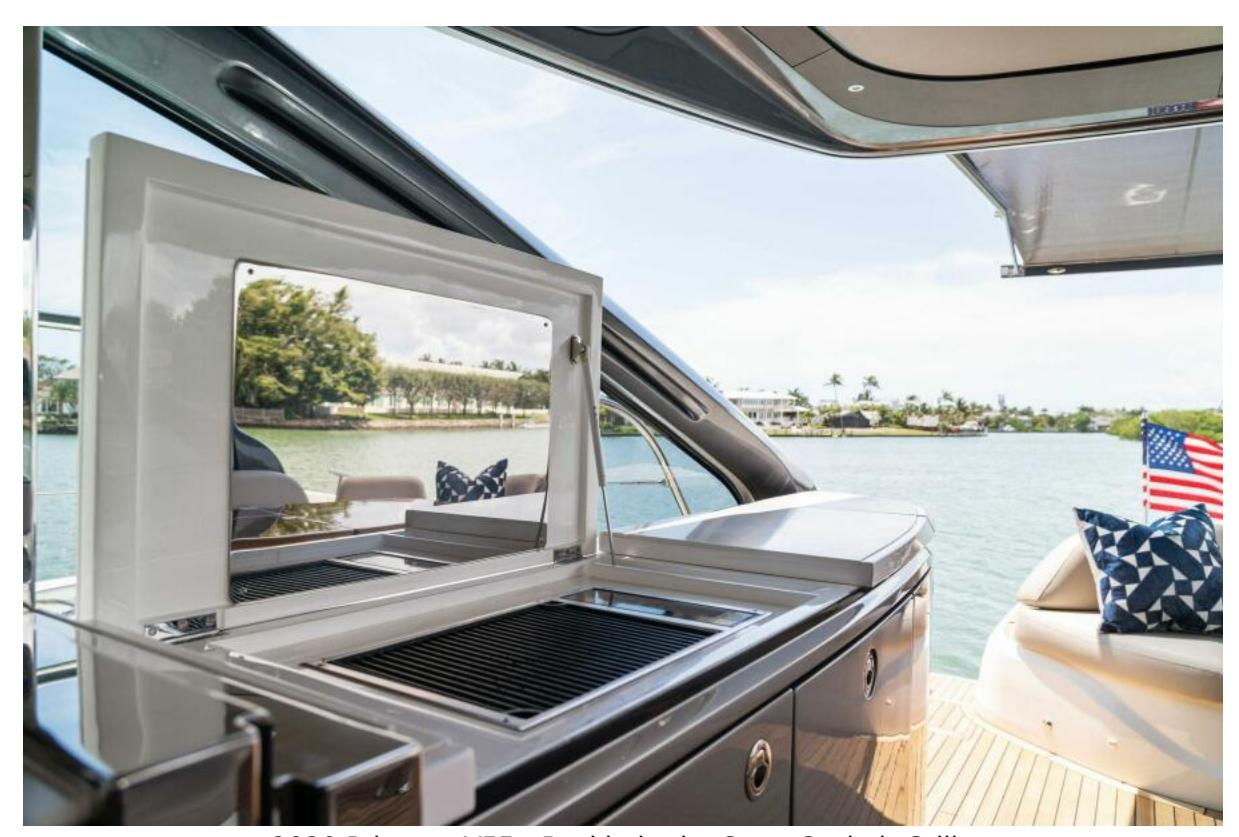
2020 Princess V55 - Baskin in the Sun - Cockpit Grill