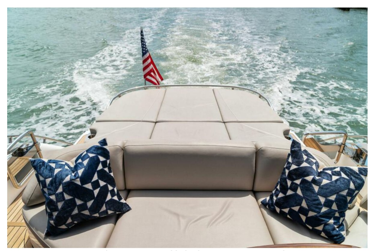
2020 Princess V55 - Baskin in the Sun - Lounge Seating