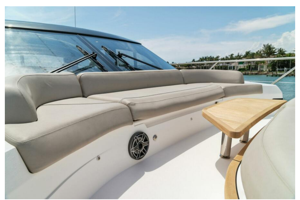
2020 Princess V55 - Baskin in the Sun - Bow Seating