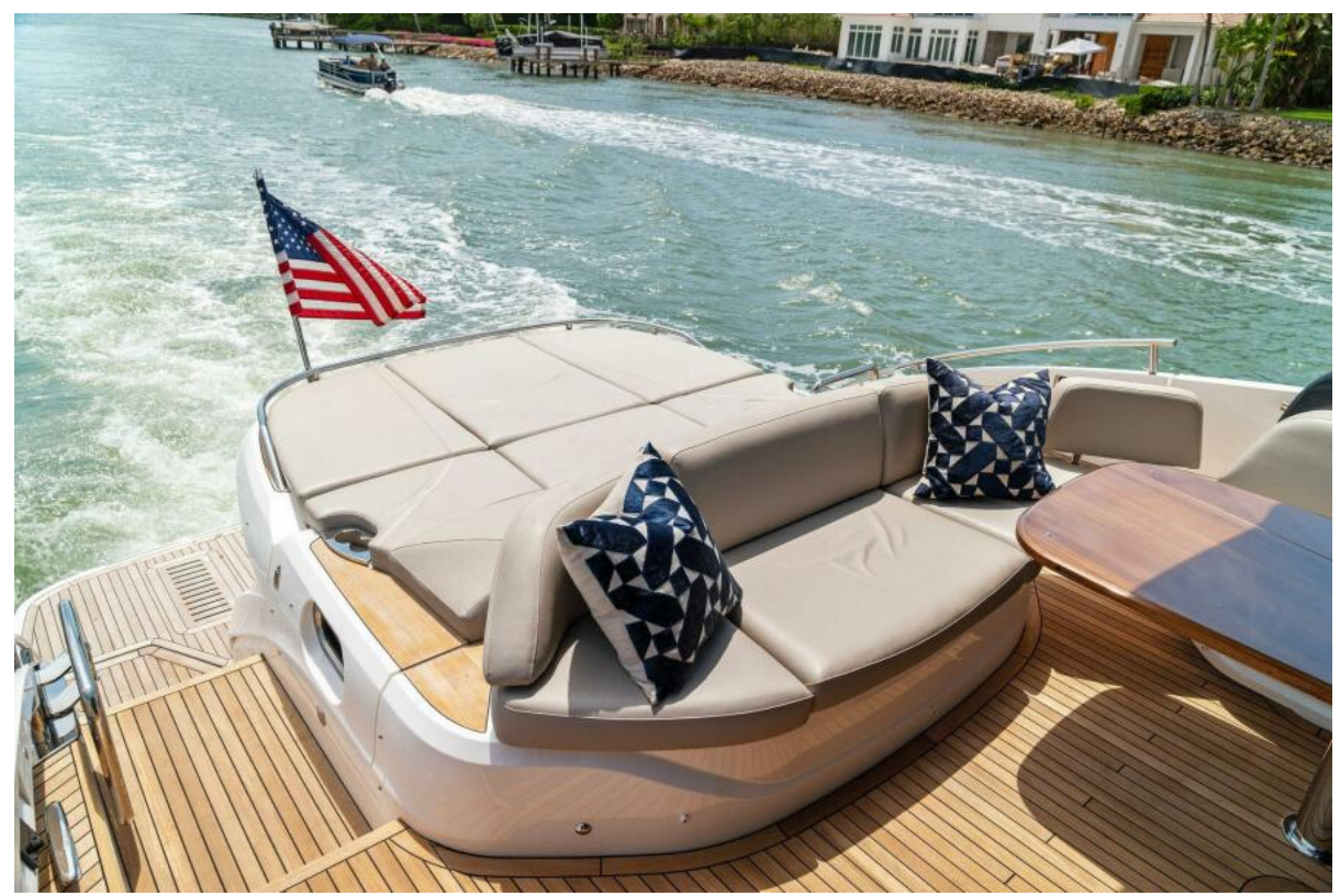
2020 Princess V55 - Baskin in the Sun - Lounge Seating