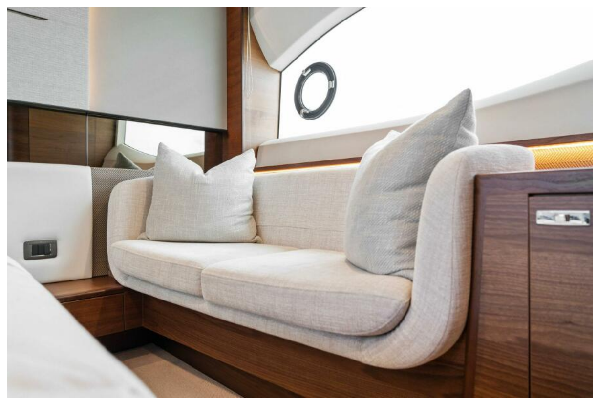
2020 Princess V55 - Baskin in the Sun - Master Stateroom