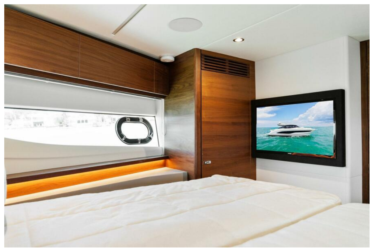
2020 Princess V55 - Baskin in the Sun - VIP Stateroom