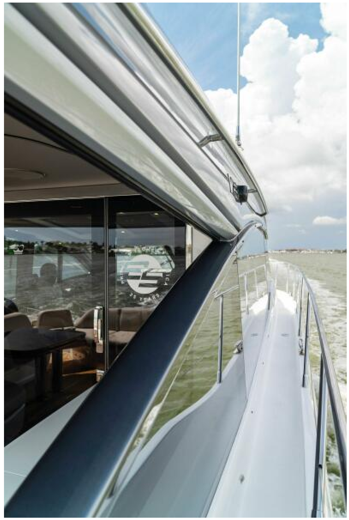
2020 Princess V55 - Baskin in the Sun - Starboard Walkway