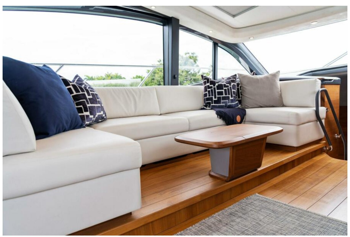
2020 Princess V55 - Baskin in the Sun - Salon Seating