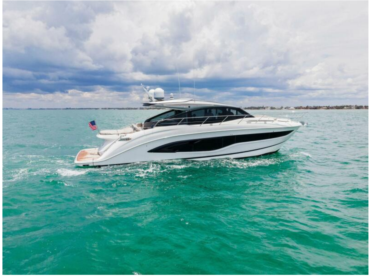
2020 Princess V55 - Baskin in the Sun - Starboard Profile