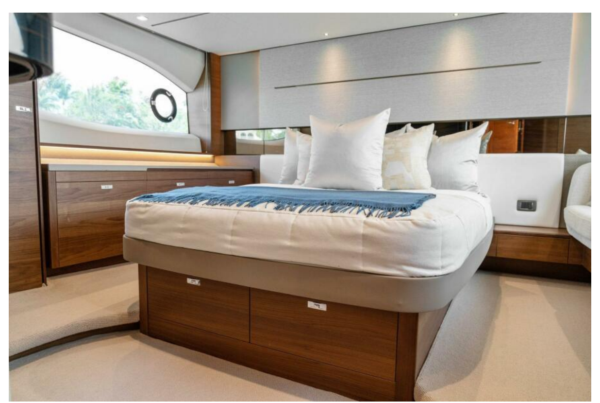
2020 Princess V55 - Baskin in the Sun - Master Stateroom