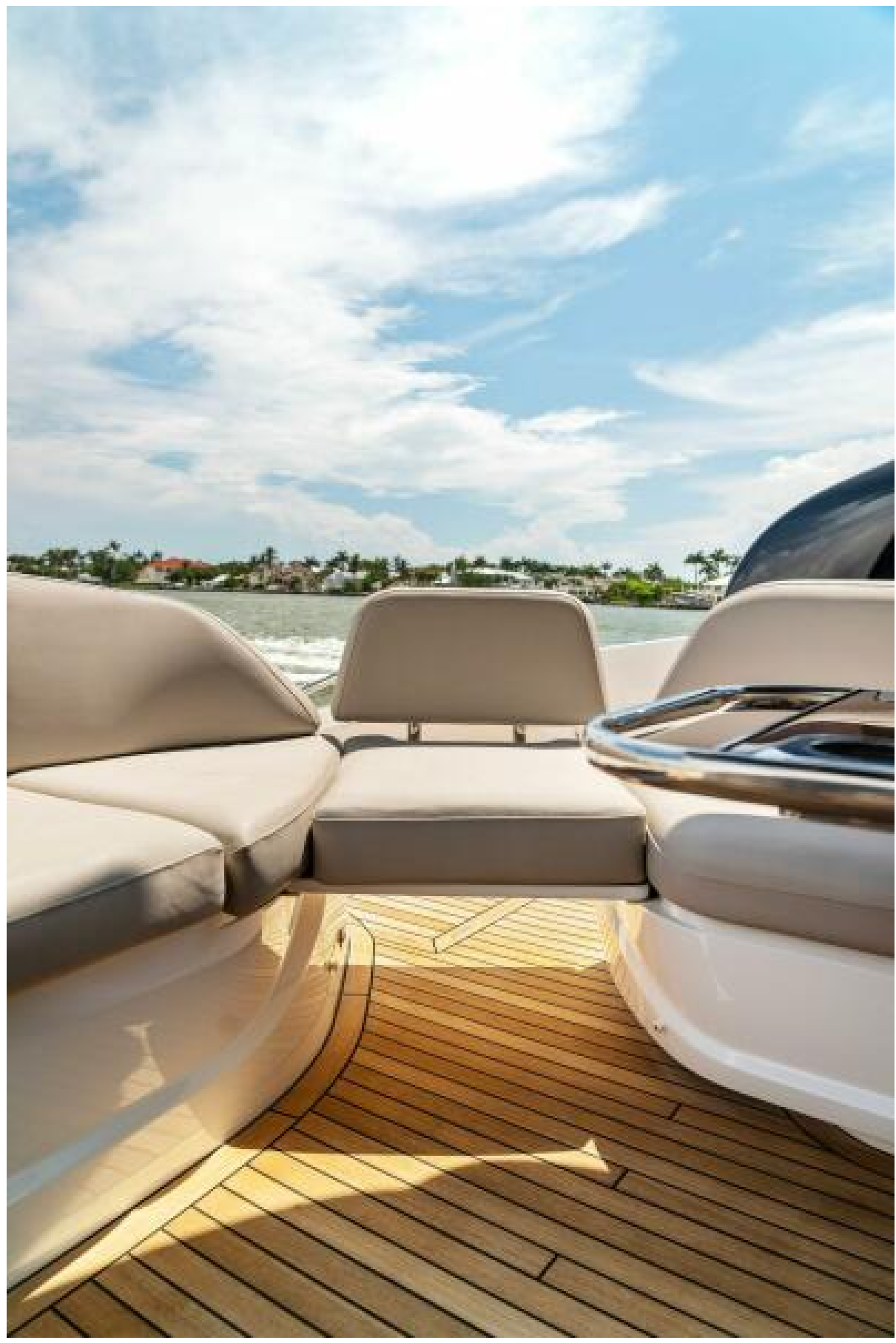
2020 Princess V55 - Baskin in the Sun - Lounge Seating