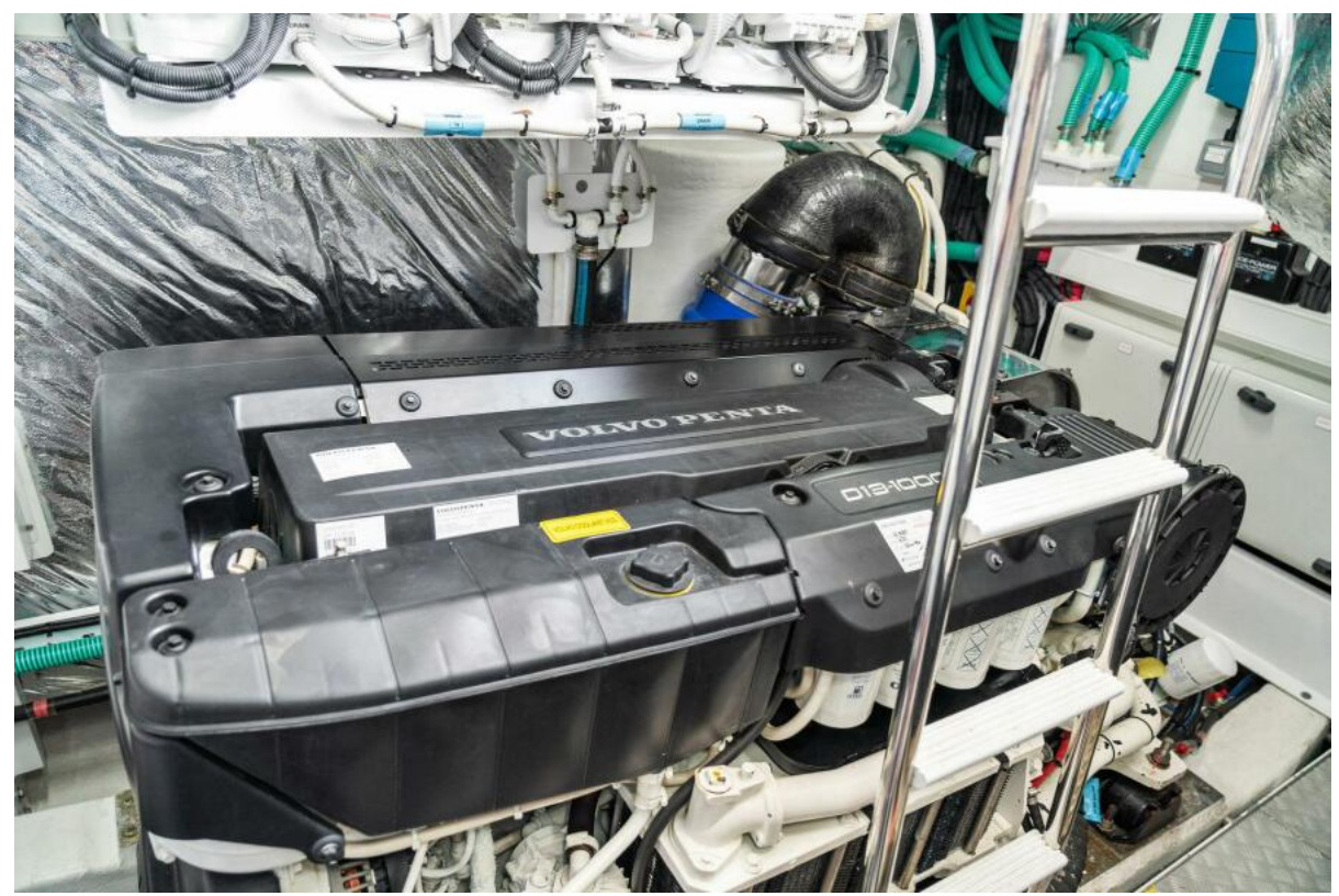
2020 Princess V55 - Baskin in the Sun - Engine Room