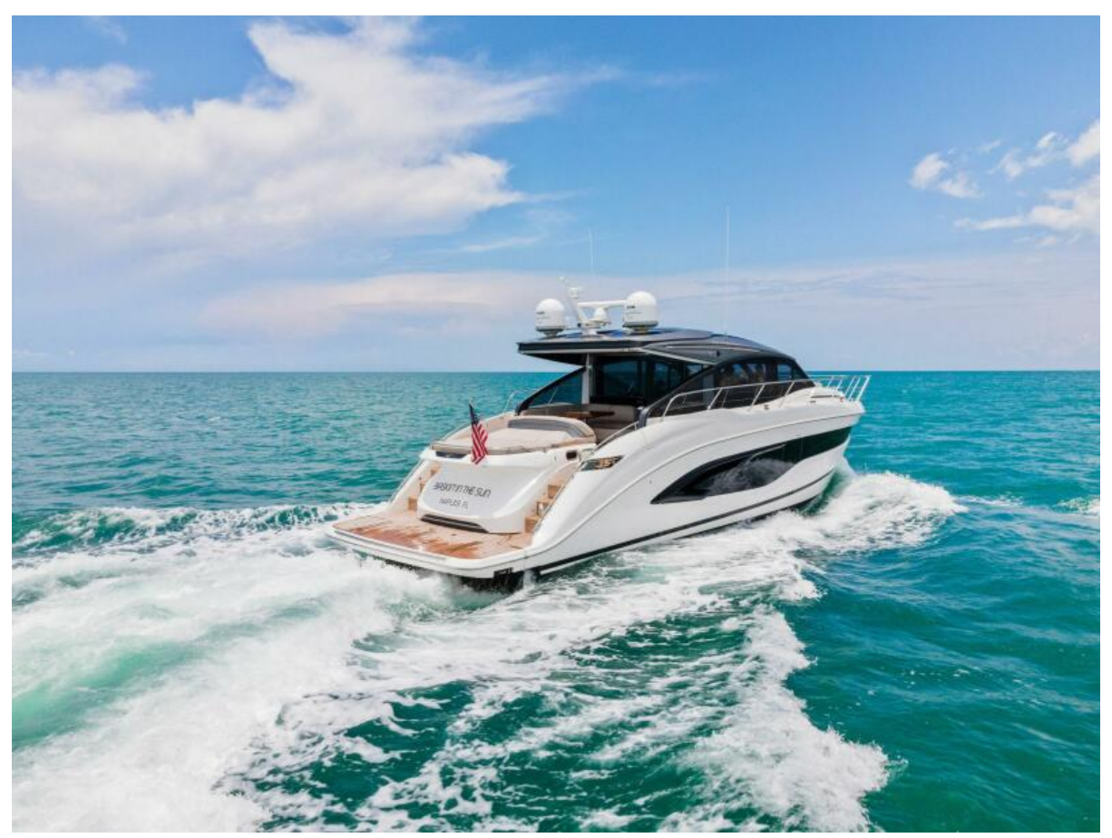
2020 Princess V55 - Baskin in the Sun - Running Profile