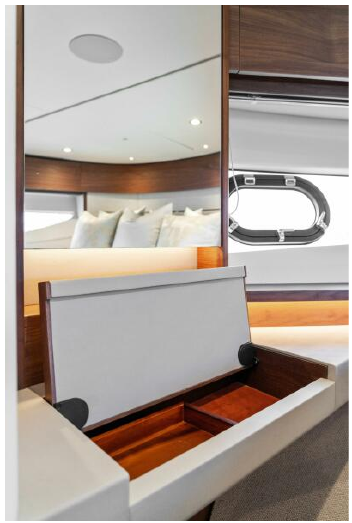
2020 Princess V55 - Baskin in the Sun - Master Stateroom Vanity