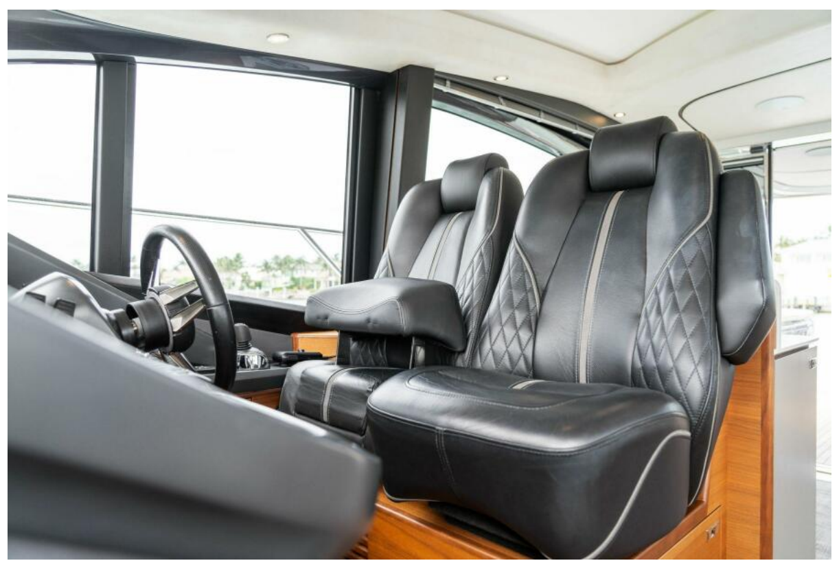
2020 Princess V55 - Baskin in the Sun - Helm