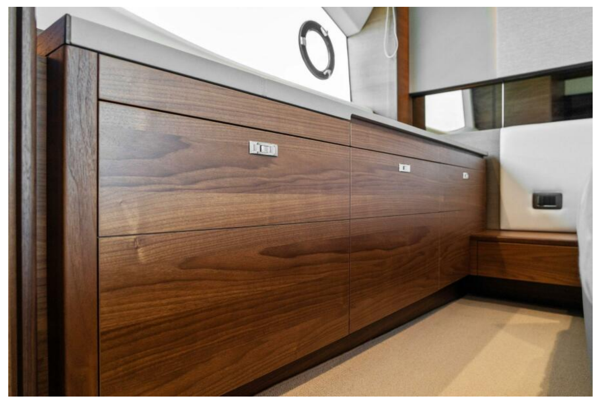
2020 Princess V55 - Baskin in the Sun - Master Stateroom