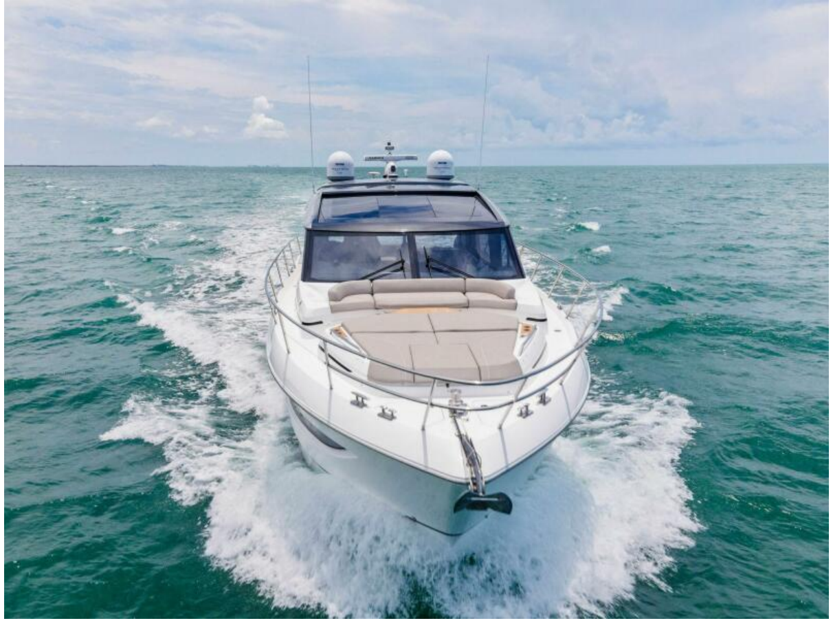
2020 Princess V55 - Baskin in the Sun - Running Profile