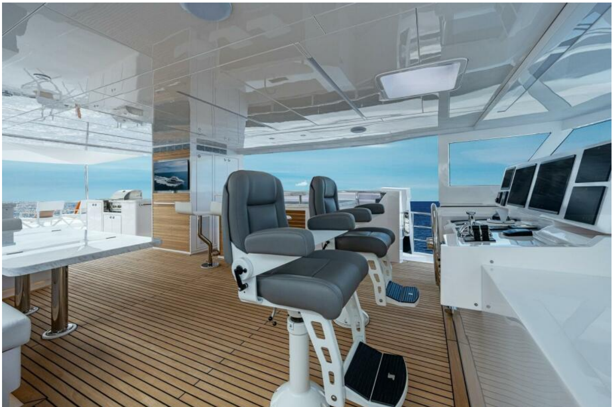
Horizon FD75 Flybridge helm with 2 grey chairs.