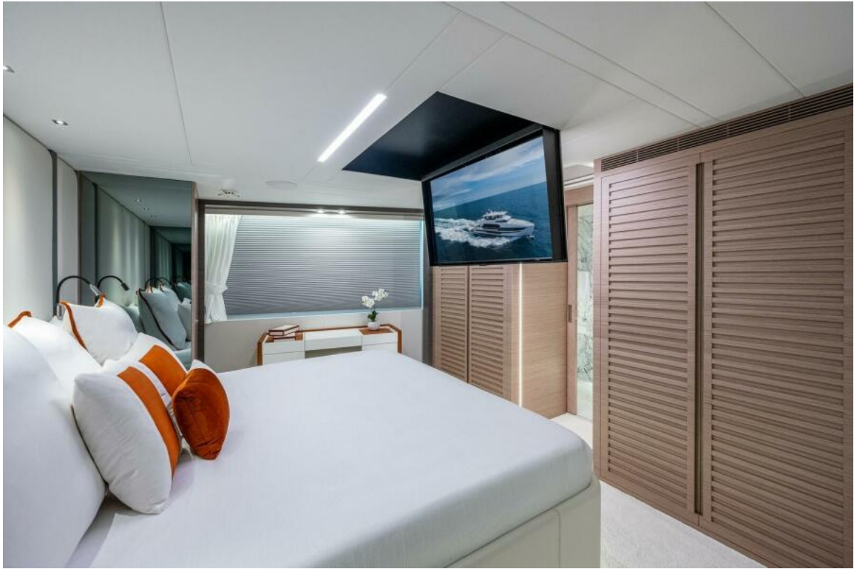
Horizon FD75 Master stateroom with drop down TV.