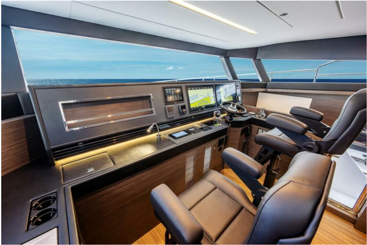
Horizon FD75 Pilothouse helm with 2 STIDD chairs.