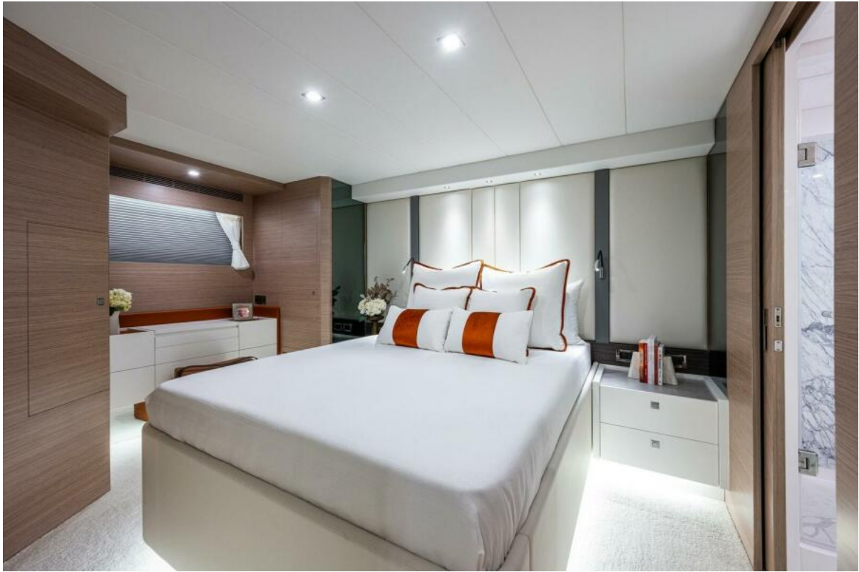
Horizon FD75 Full beam VIP stateroom with vanity.