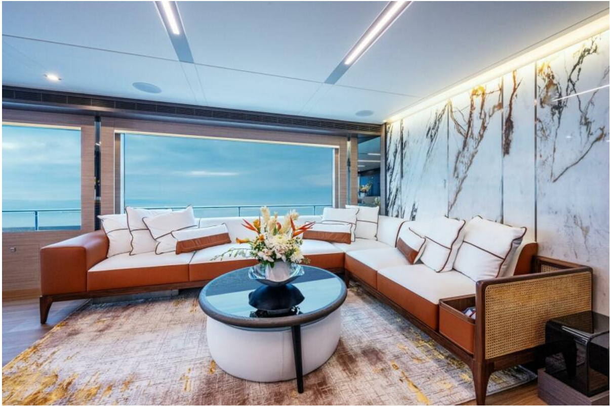
Horizon FD75 L-shaped sofa with coffee table.