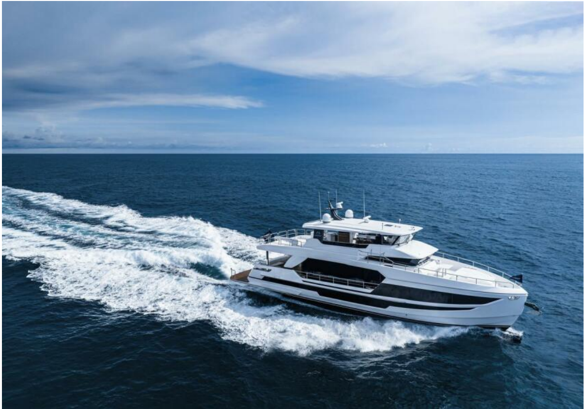
Horizon FD75 Horizon FD75 aerial shot.