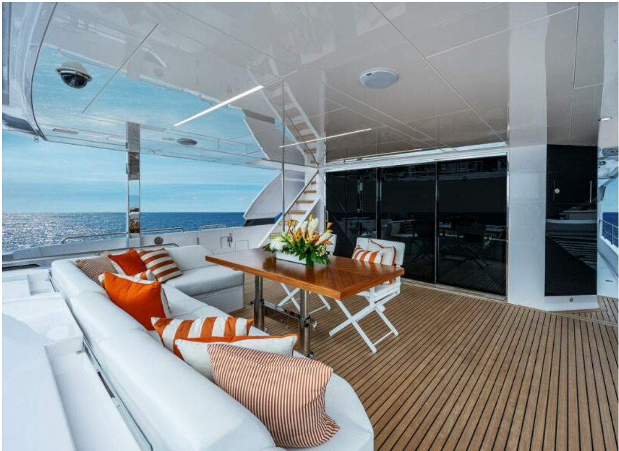
Horizon FD75 Aft deck seating area with 2 loose white chairs.