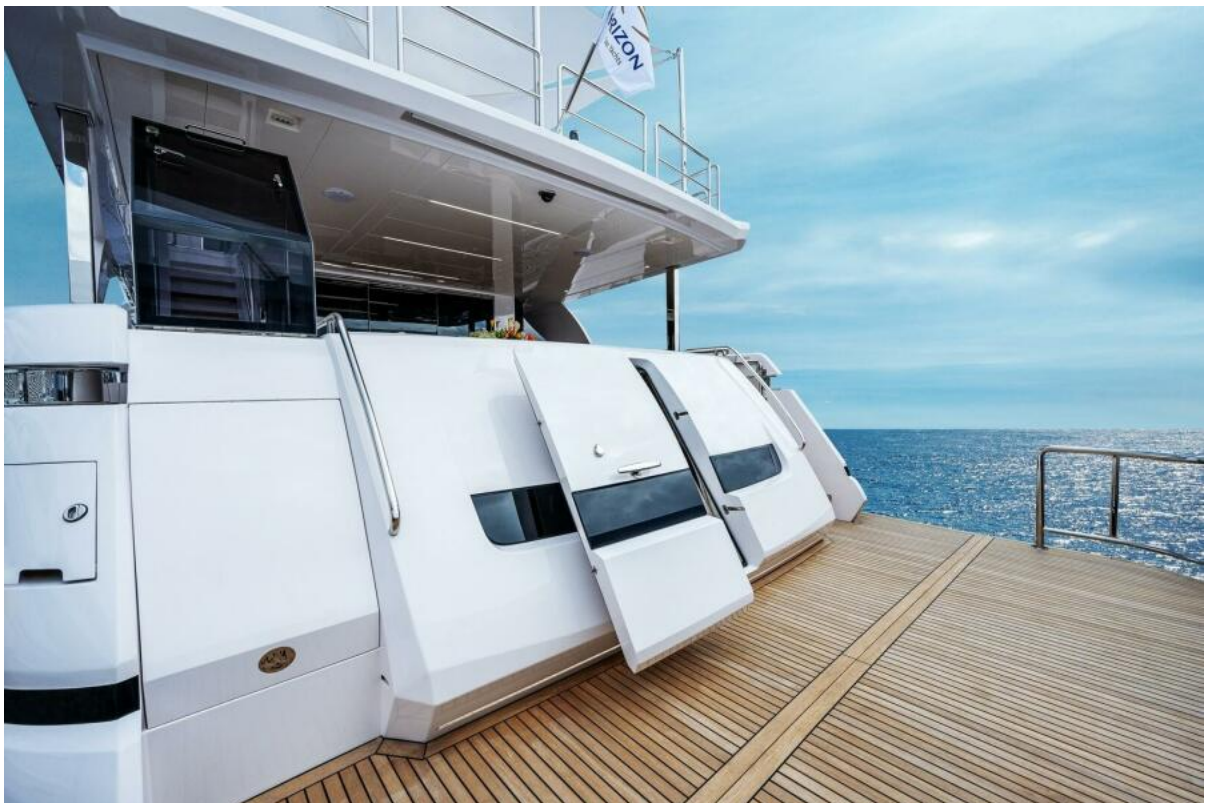
Horizon FD75 Crew door from swim platform.