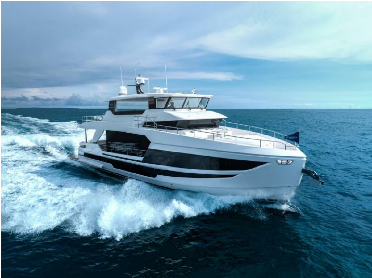
Horizon FD75 Horizon FD75 cruising over the ocean.