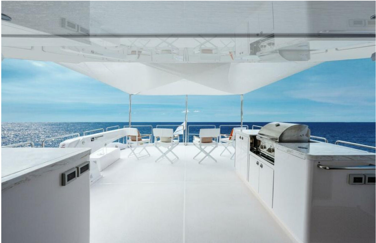
Horizon FD75 Large boat deck with BBQ.