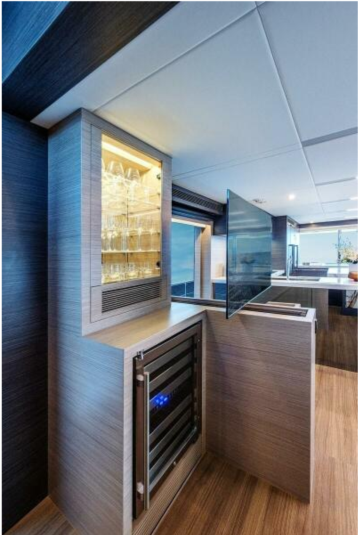
Horizon FD75 Glassware storage with lighting and shelving.