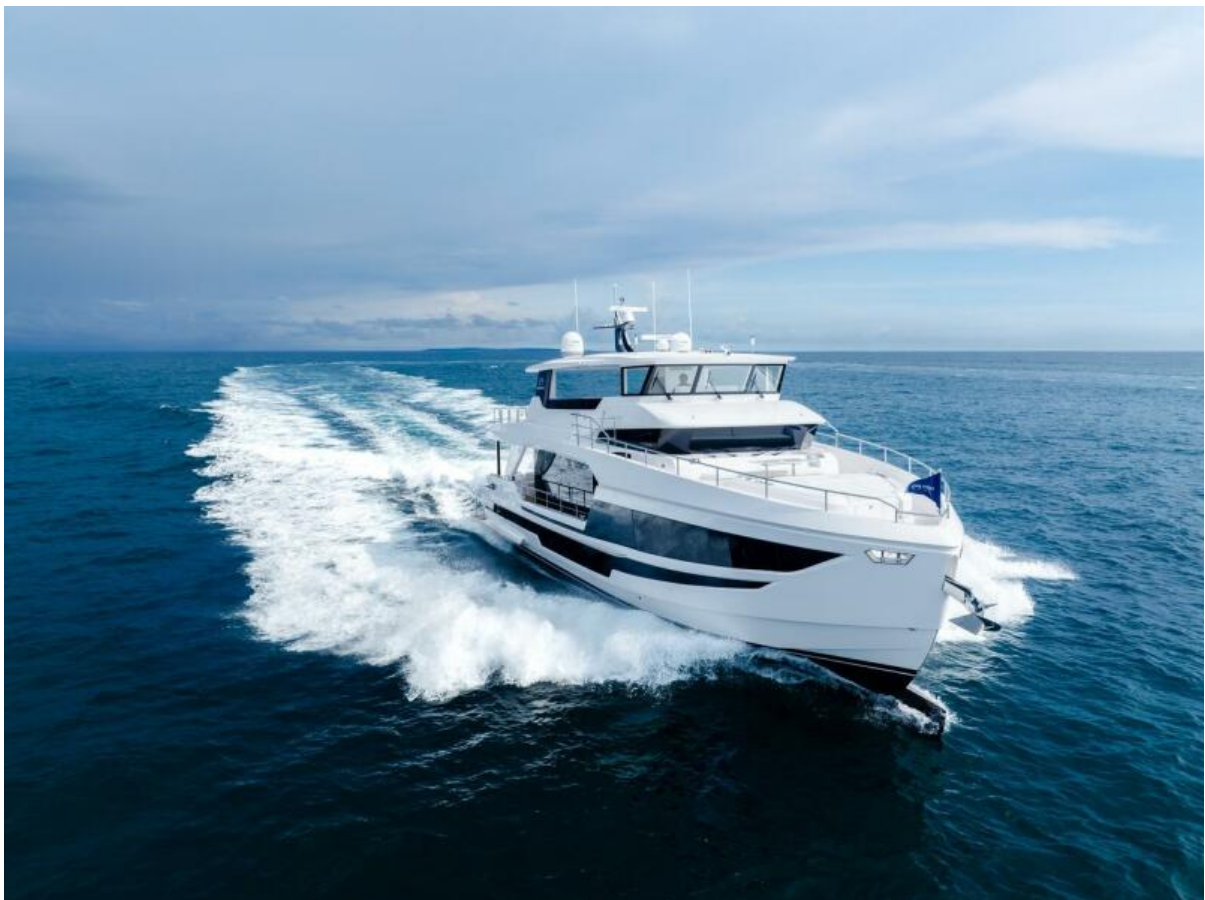
Horizon FD75 Horizon FD75 running over the open ocean with blue bow flag.