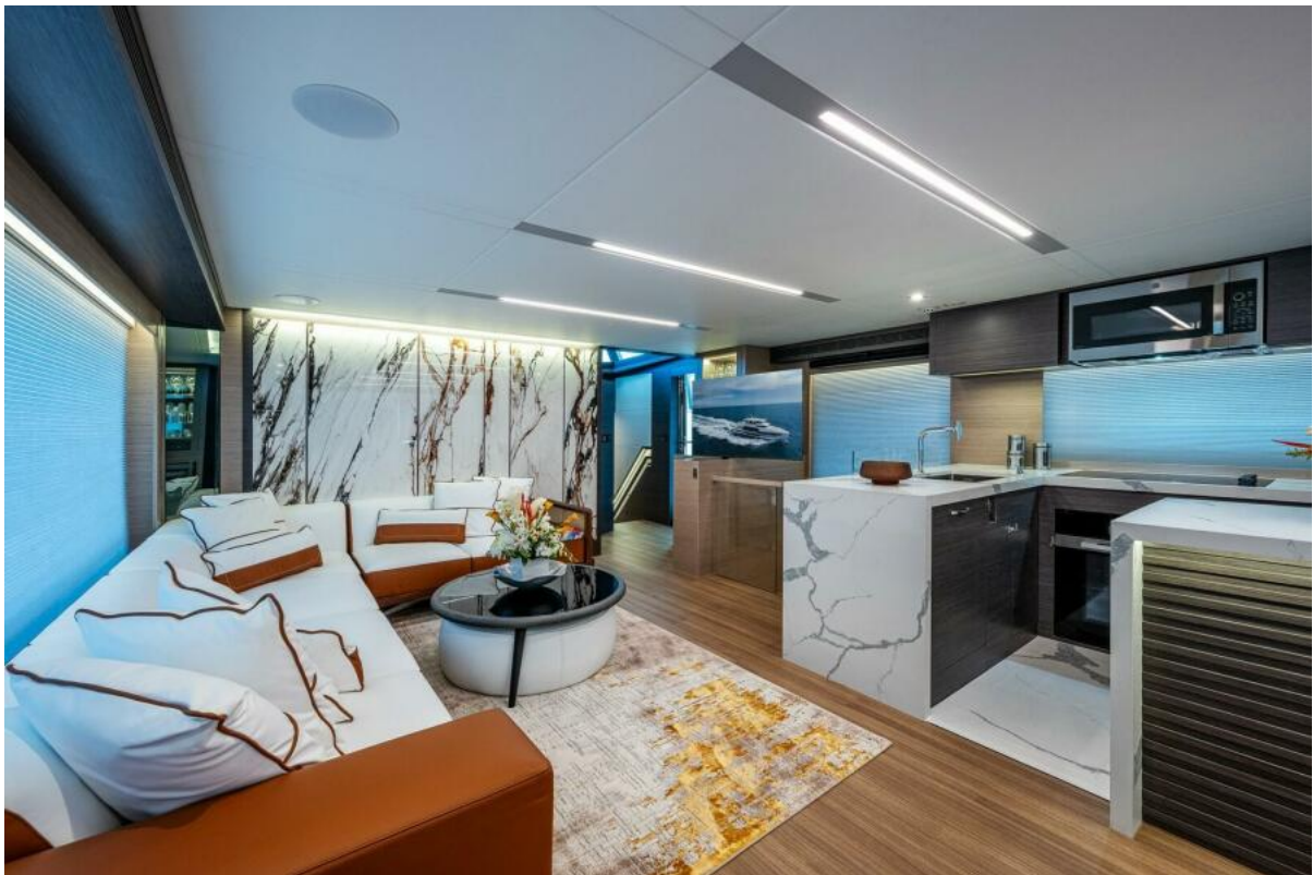
Horizon FD75 Open salon with custom feature stone wall.