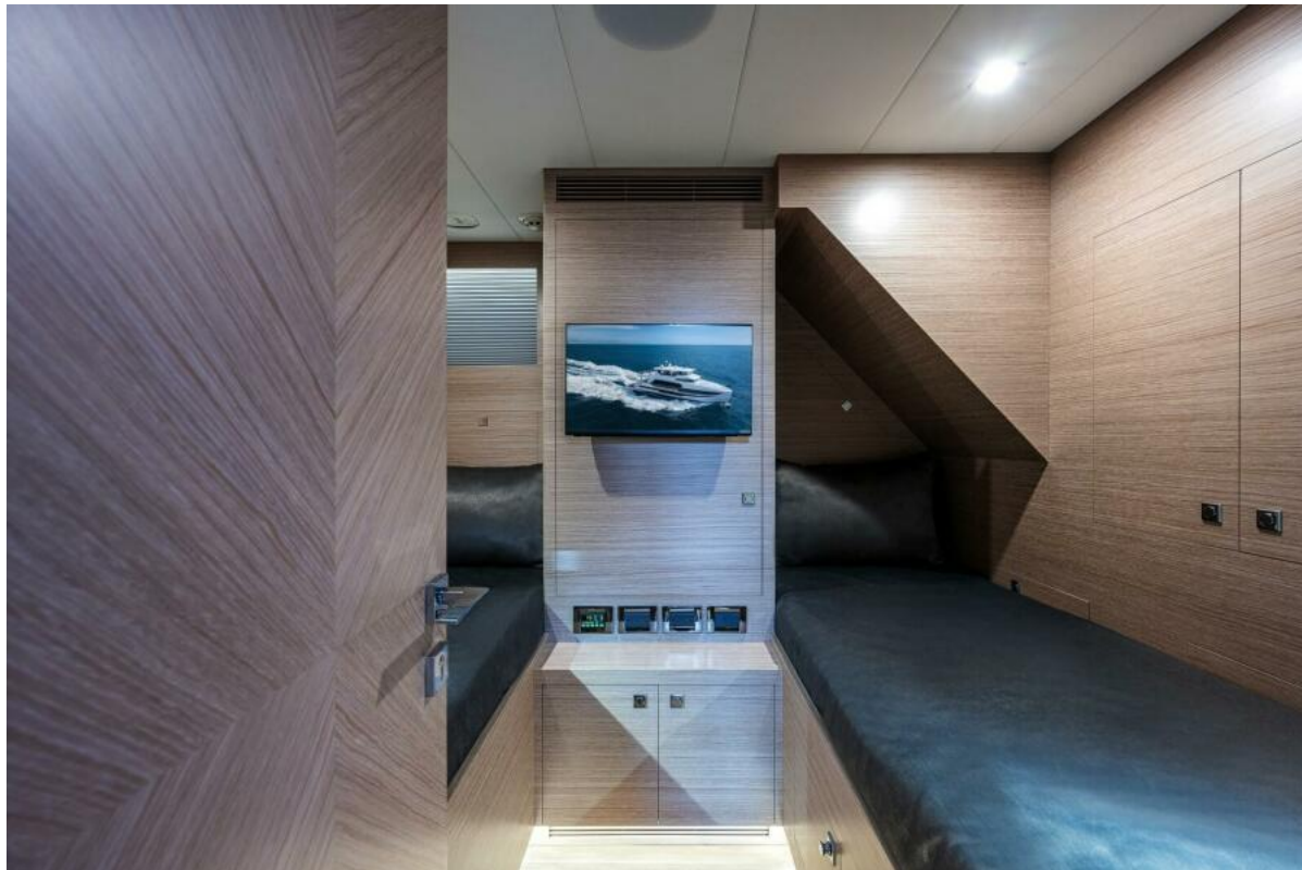
Horizon FD75 Crew berth with TV.