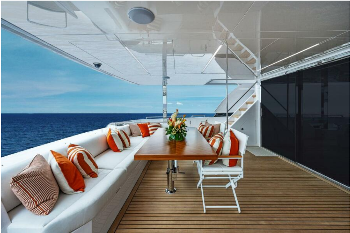
Horizon FD75 Aft deck L shape seating area with orange accents.