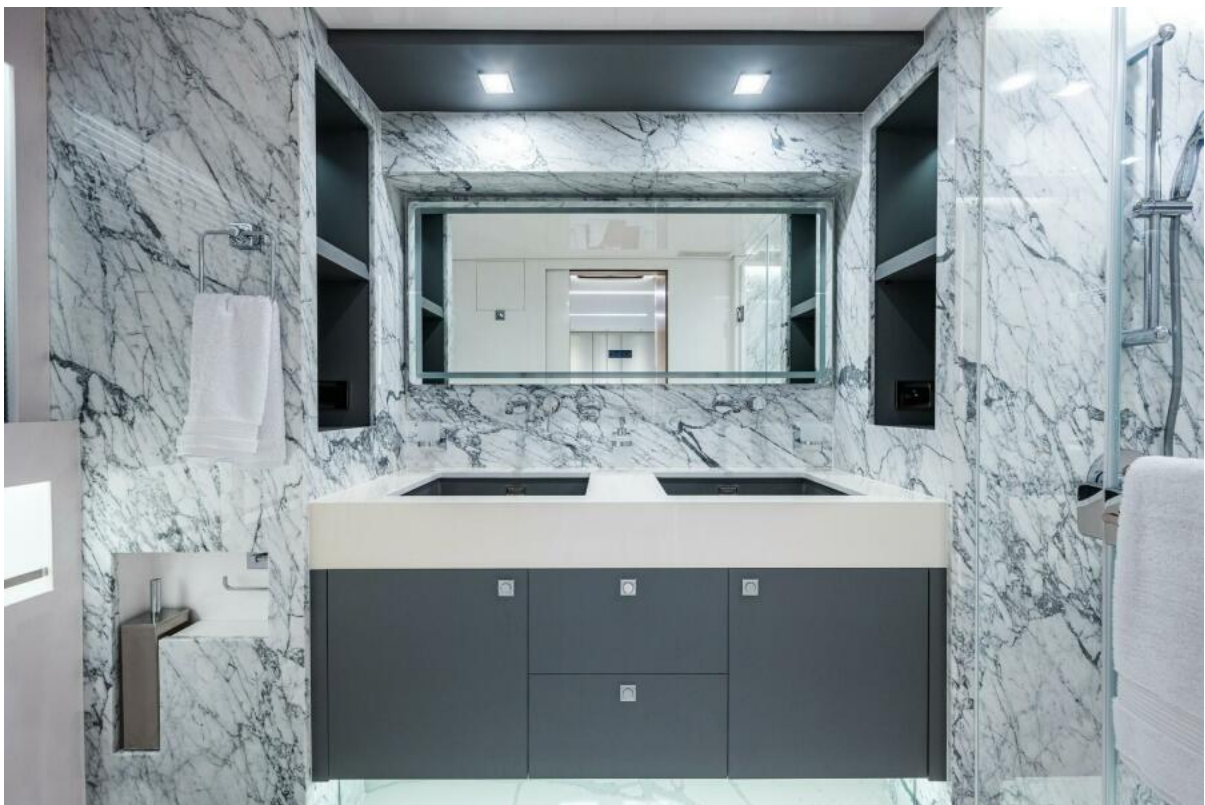
Horizon FD75 Master bath with duel sinks and smart mirror.