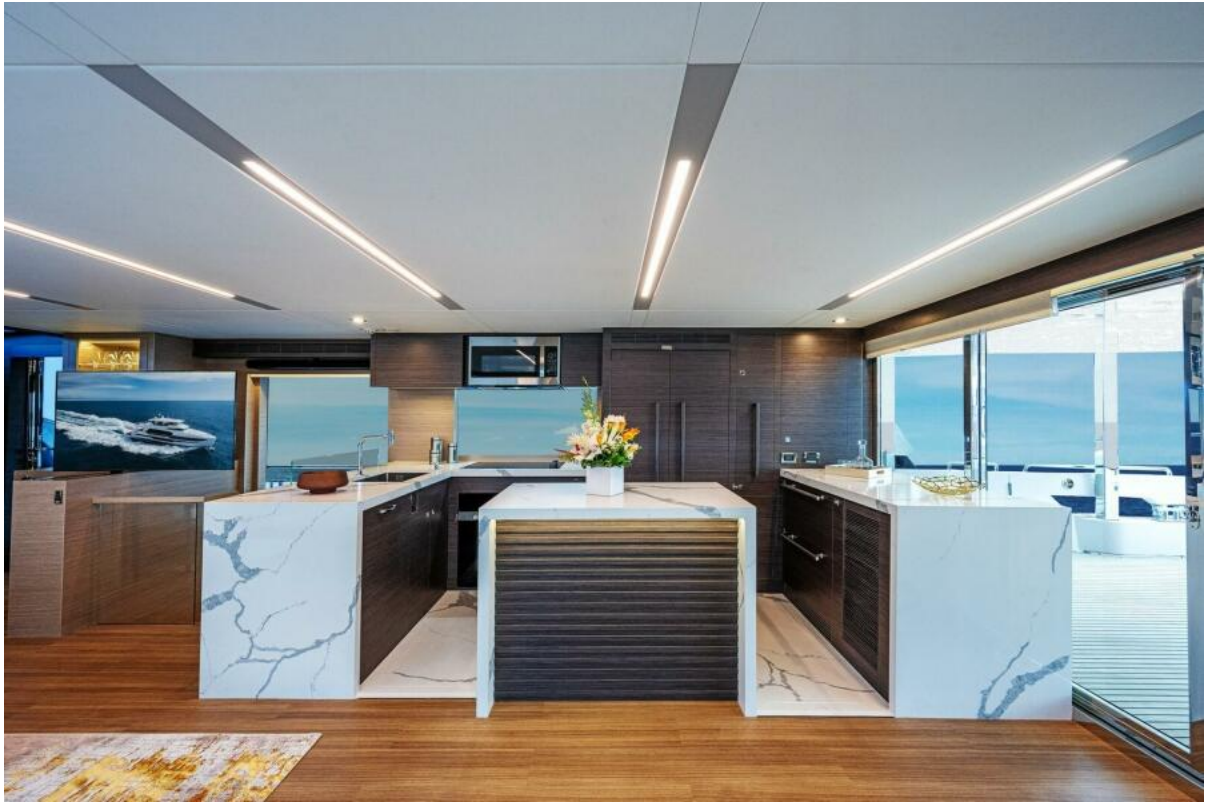
Horizon FD75 Aft open galley with waterfall island.