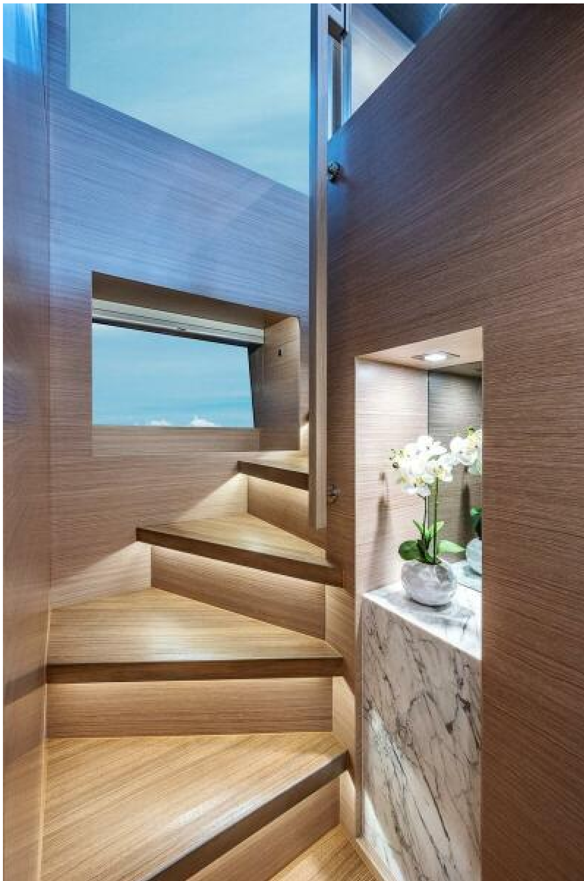
Horizon FD75 Foyer at bottom of wood staircase.