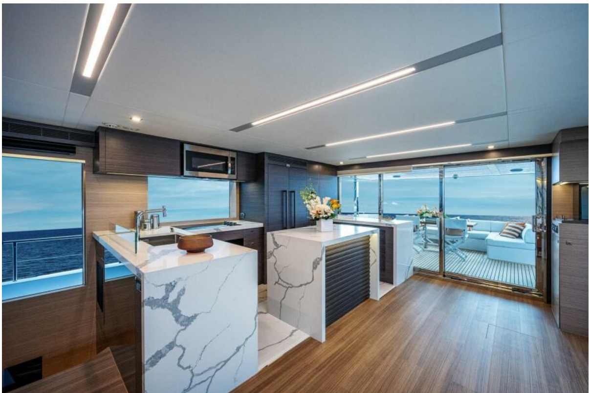
Horizon FD75 Aft galley with panel-ready appliances.