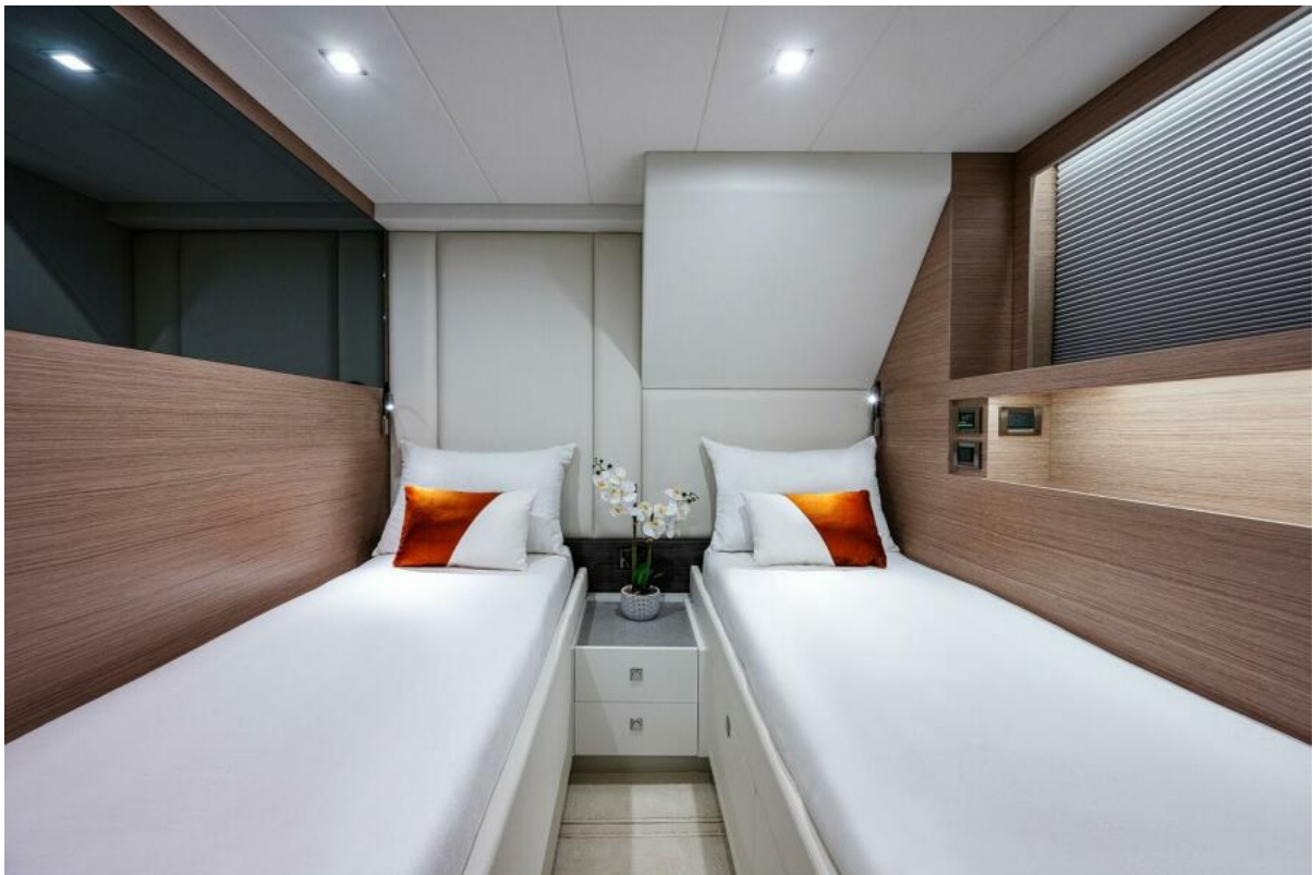
Horizon FD75 Twin stateroom with sliding bed feature.