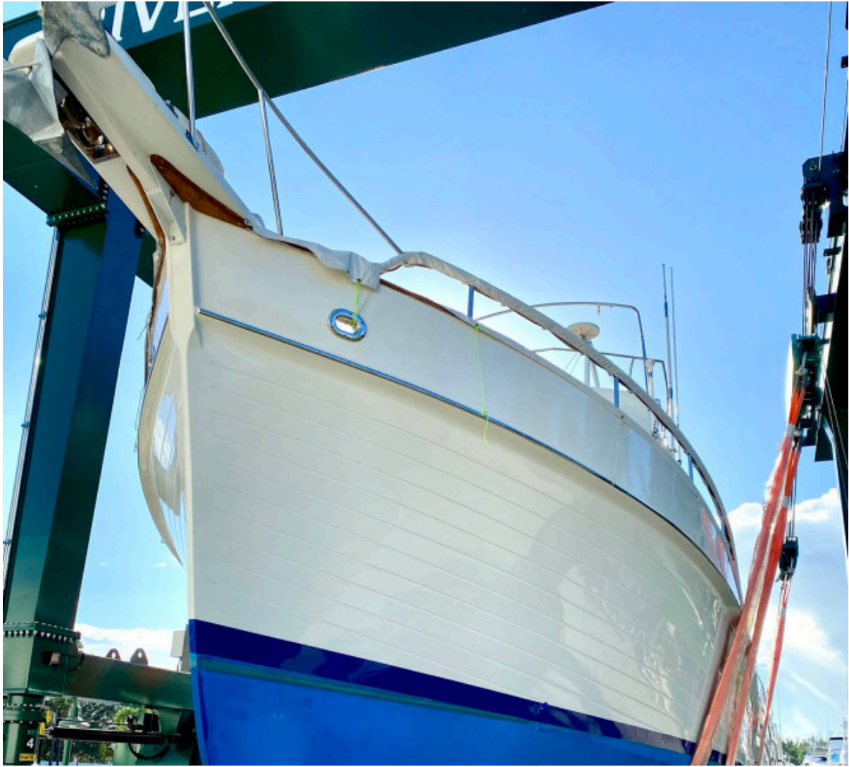
Port Bow View In Slings