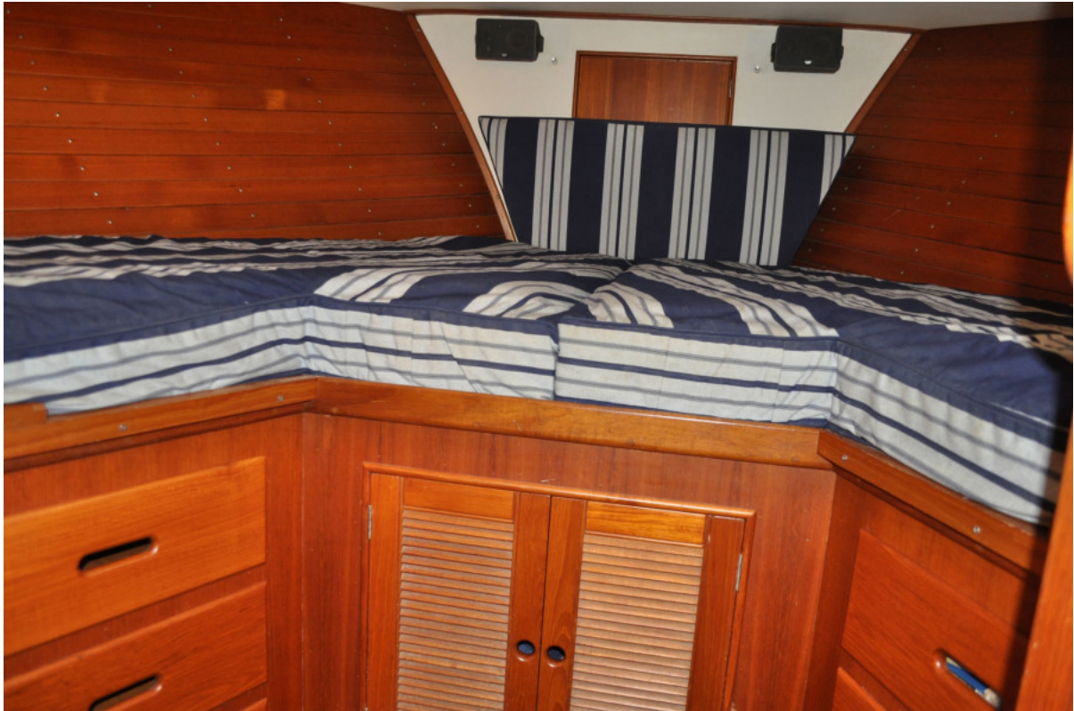
Forward Guest Stateroom