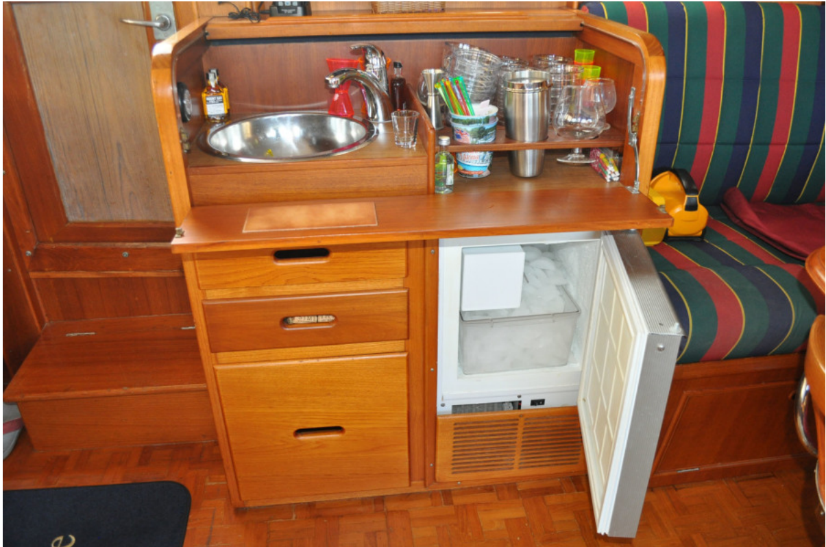
Salon Bar Cabinet With Drawer Storage And Ice Maker