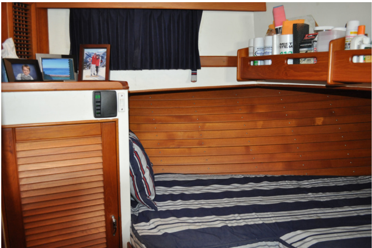
Forward V-Berth To Port