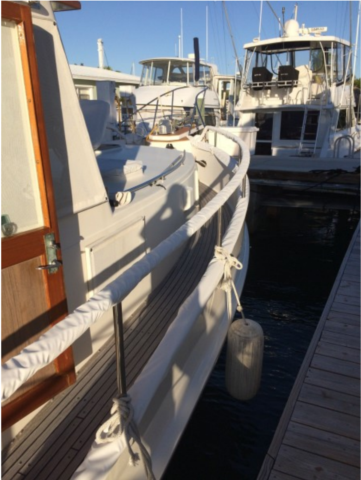
Custom Made Teak Covers