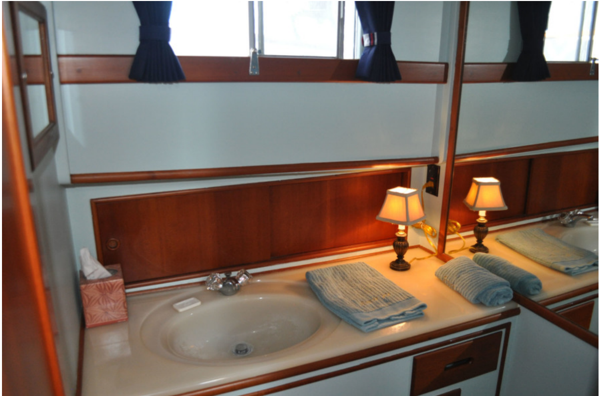
Forward En-Suite Head And Shower