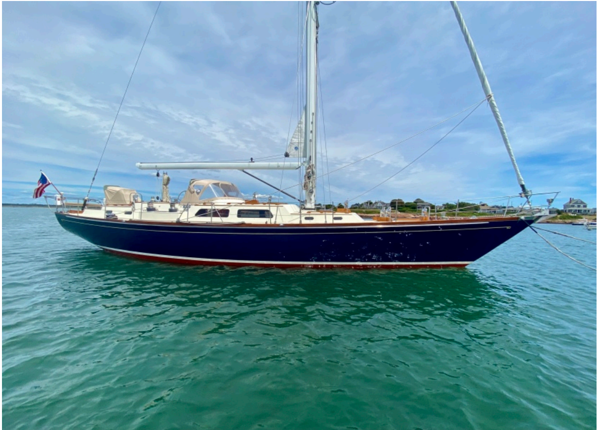
strbrd side 1985 59' Hinckley Sou'wester "Eclipse"