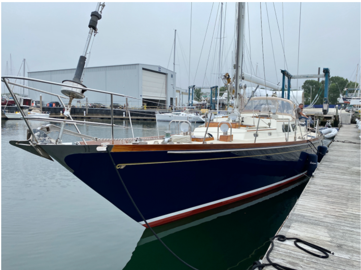
on dock 1985 59' Hinckley Sou'wester "Eclipse"