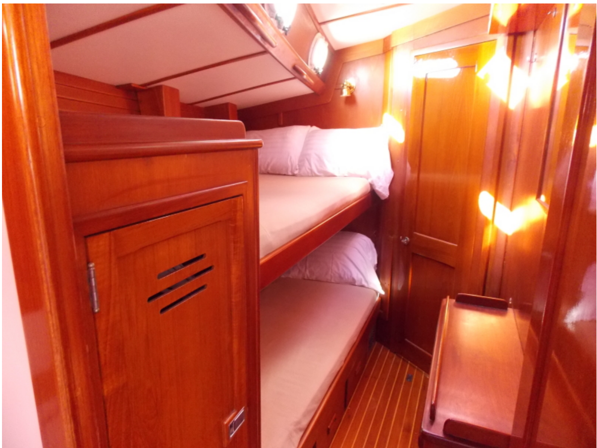
strbrd side cabin 1985 59' Hinckley Sou'wester "Eclipse"