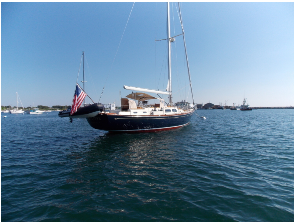
strbrd side -transom 1985 59' Hinckley Sou'wester "Eclipse"