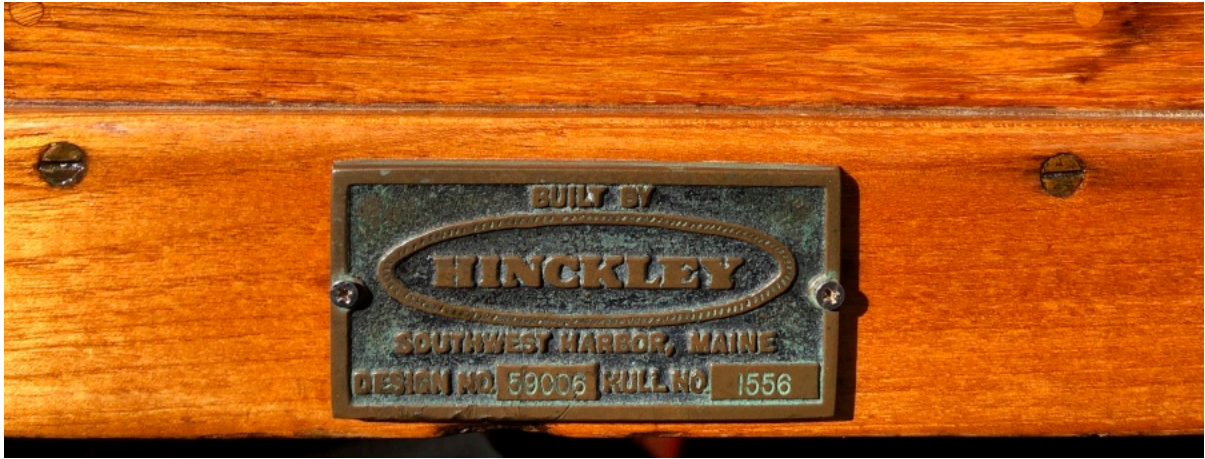
builders badge 1985 59' Hinckley Sou'wester "Eclipse"