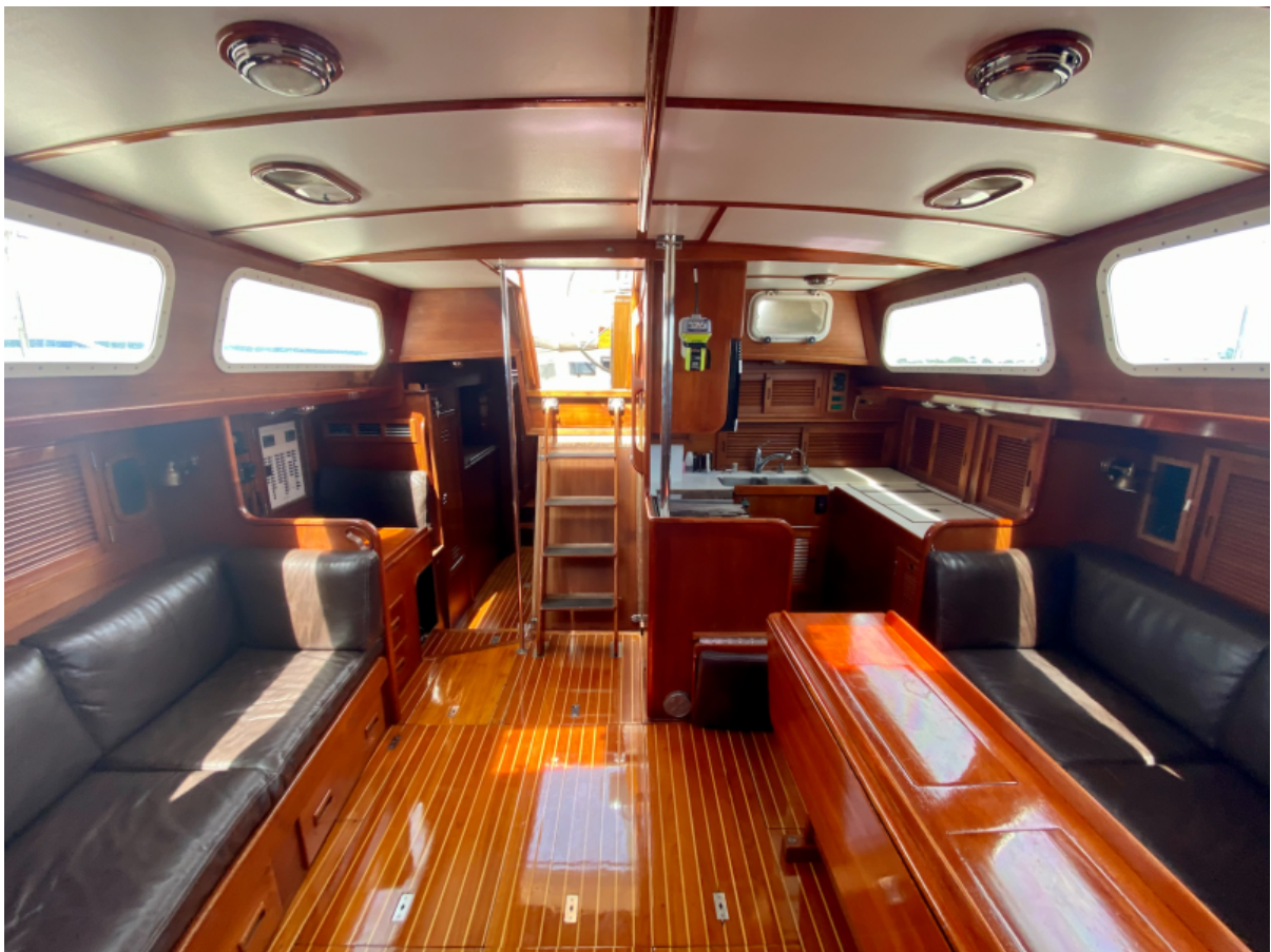
salon alternate 1985 59' Hinckley Sou'wester "Eclipse"