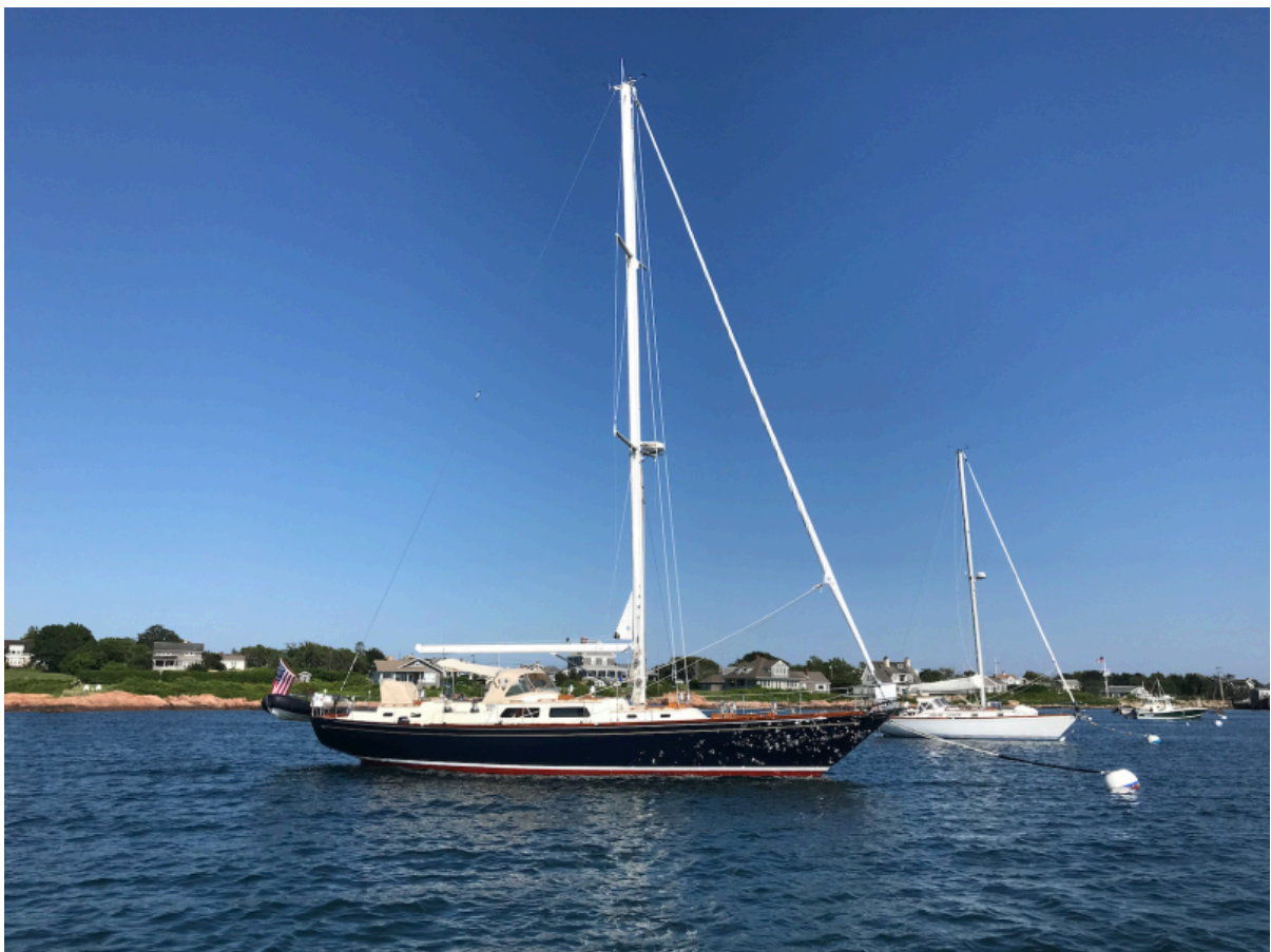
profile 1985 59' Hinckley Sou'wester "Eclipse"