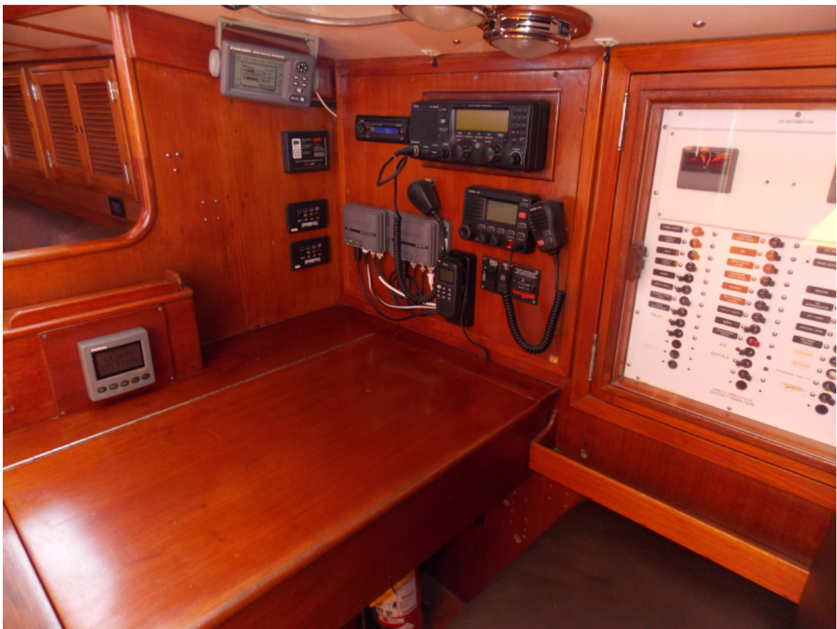
nav desk 1985 59' Hinckley Sou'wester "Eclipse"