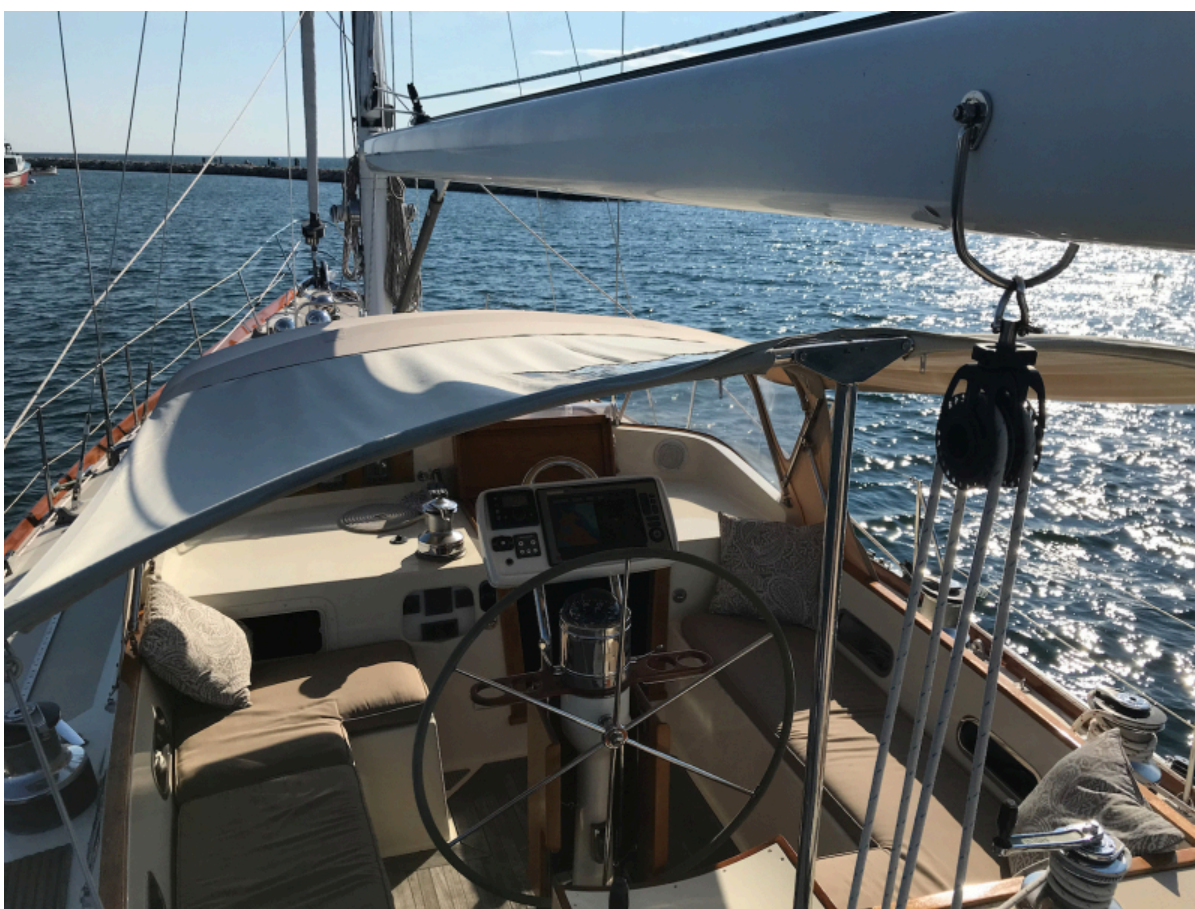
cockpit overview 1985 59' Hinckley Sou'wester "Eclipse"