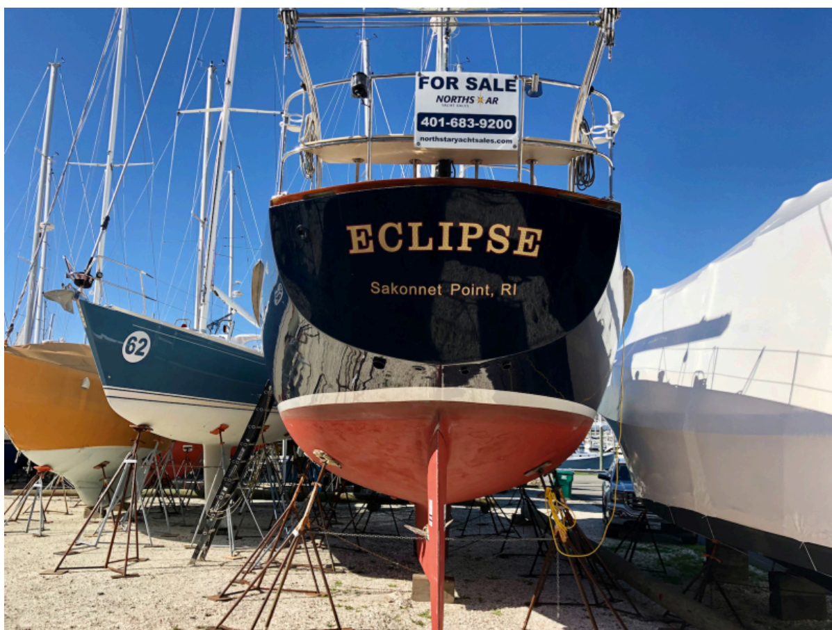
transom on hard 1985 59' Hinckley Sou'wester "Eclipse"