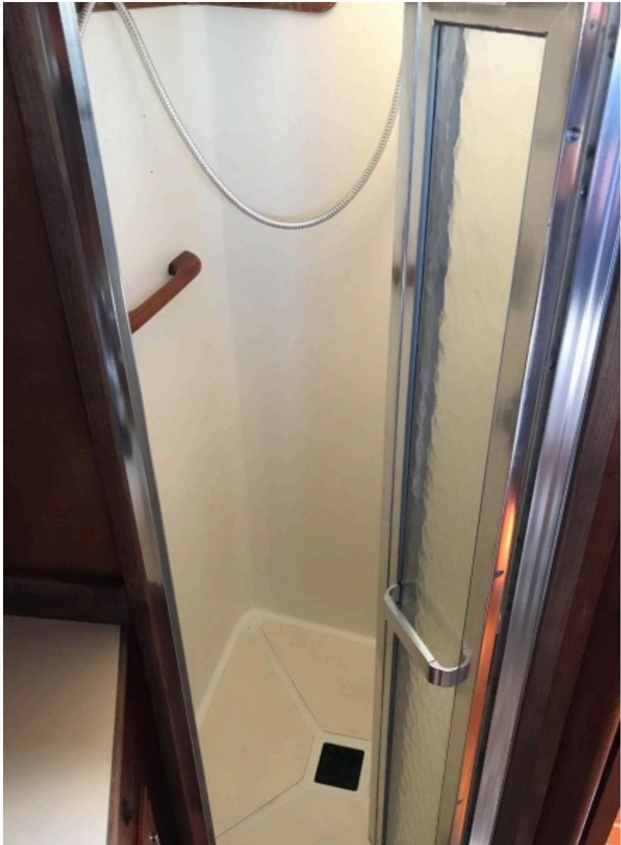
aft shower 1985 59' Hinckley Sou'wester "Eclipse"