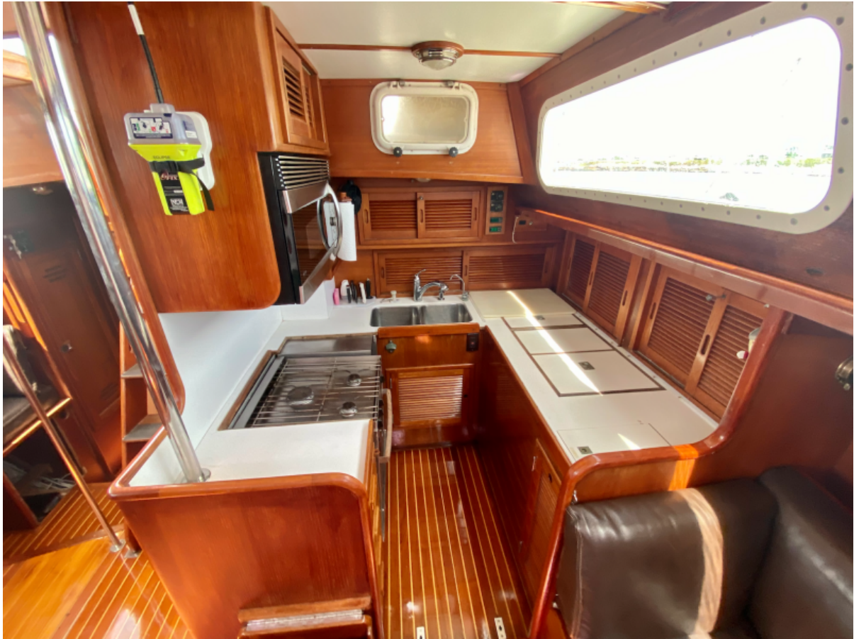
galley 1985 59' Hinckley Sou'wester "Eclipse"