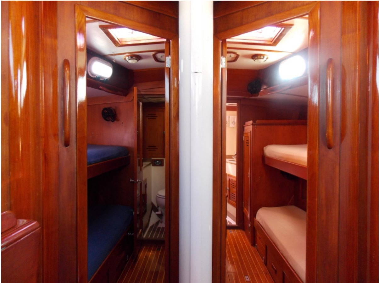
forward cabins 1985 59' Hinckley Sou'wester "Eclipse"