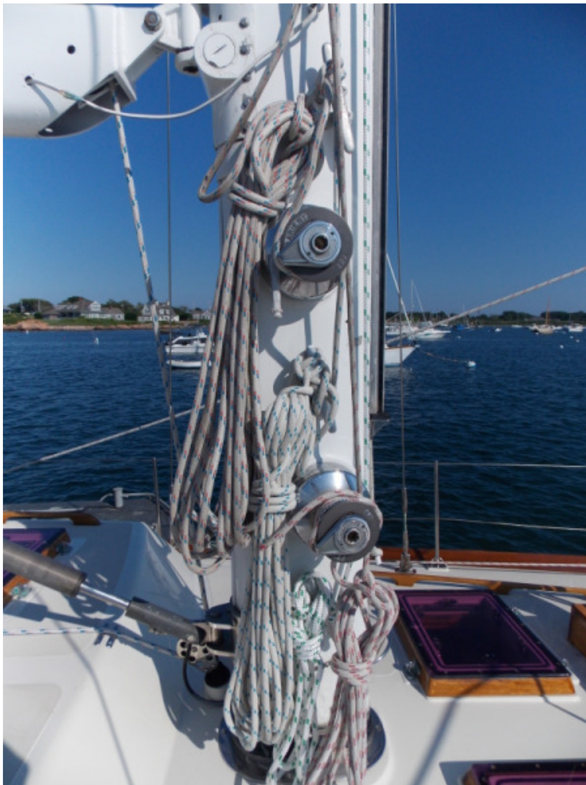
mast hardware 1985 59' Hinckley Sou'wester "Eclipse"