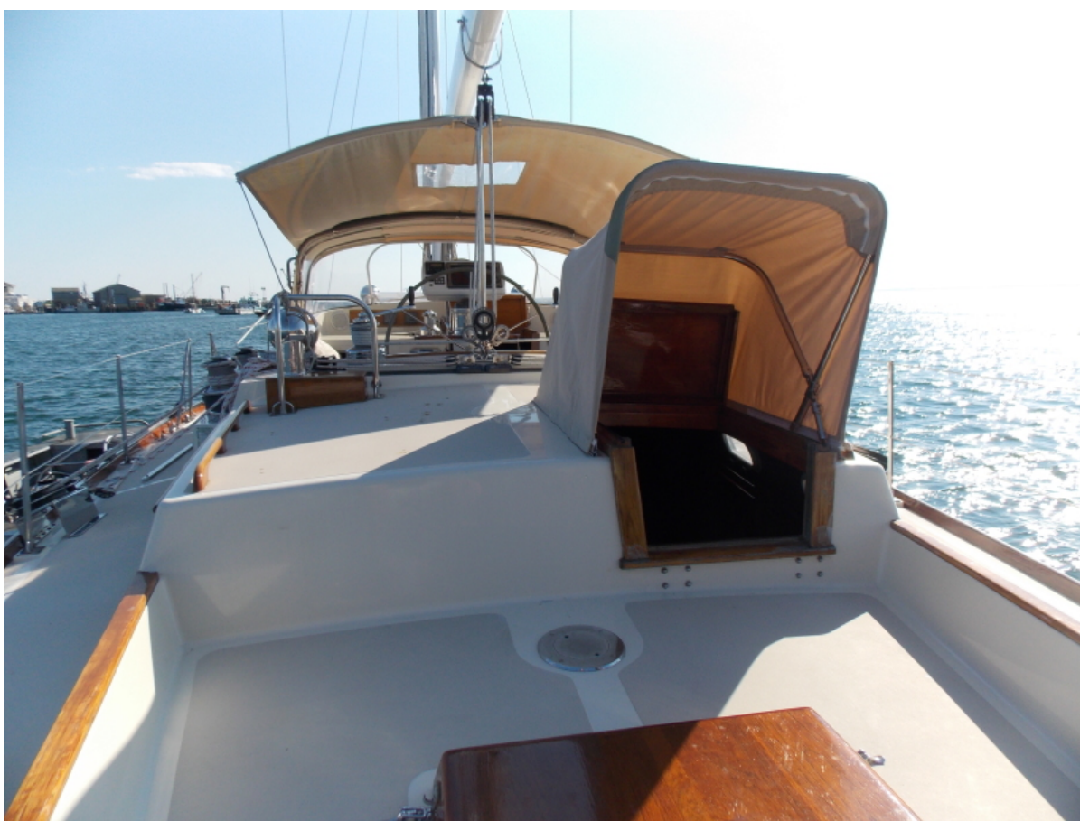
aft companionway 1985 59' Hinckley Sou'wester "Eclipse"