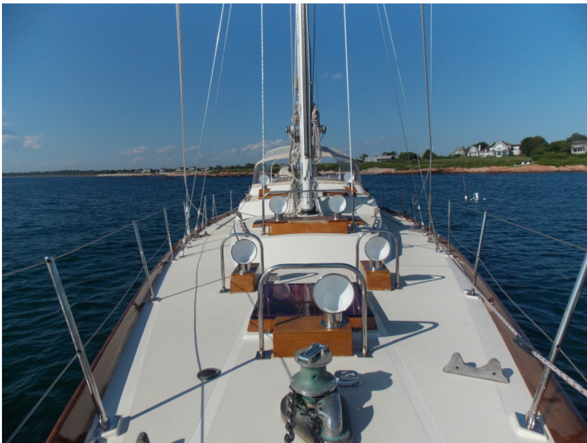
looking aft alternate 1985 59' Hinckley Sou'wester "Eclipse"