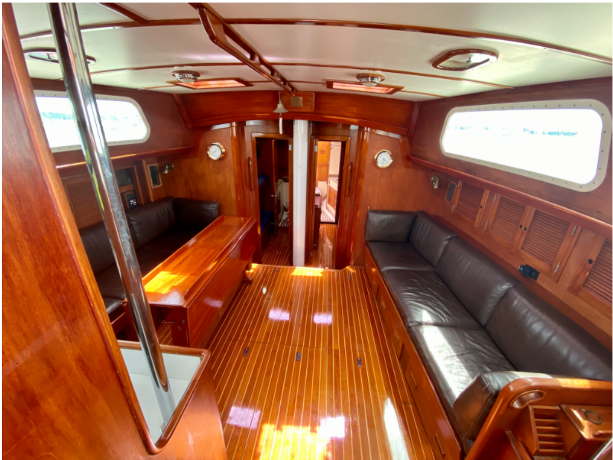
looking down companionway 1985 59' Hinckley Sou'wester "Eclipse"