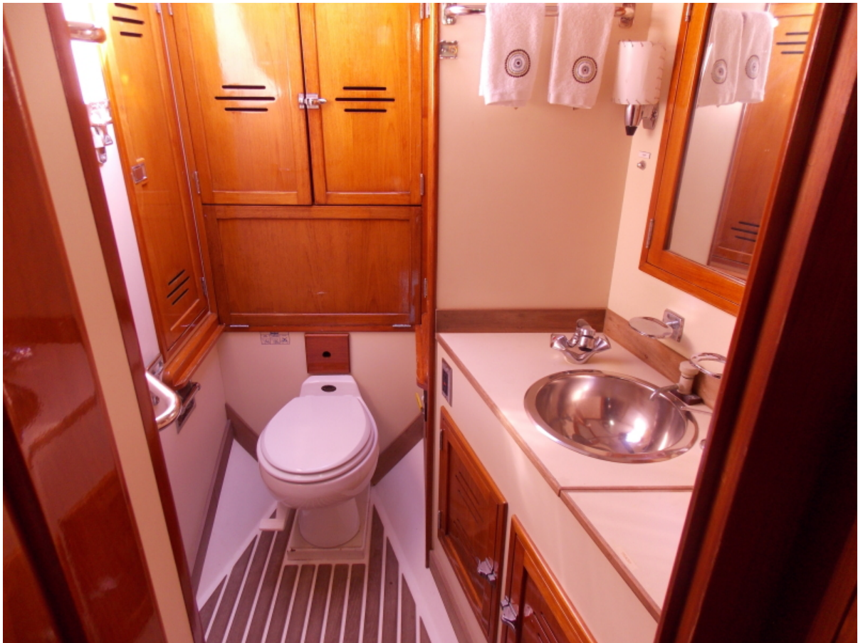
strbrd side head 1985 59' Hinckley Sou'wester "Eclipse"