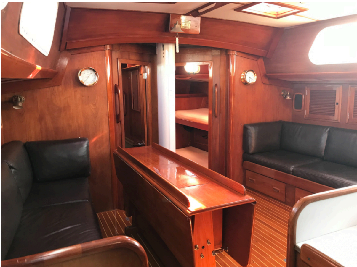
salon from galley 1985 59' Hinckley Sou'wester "Eclipse"