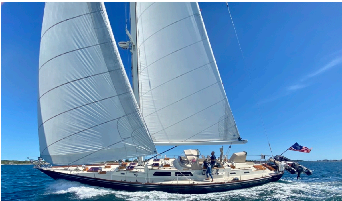
undersail 1985 59' Hinckley Sou'wester "Eclipse"