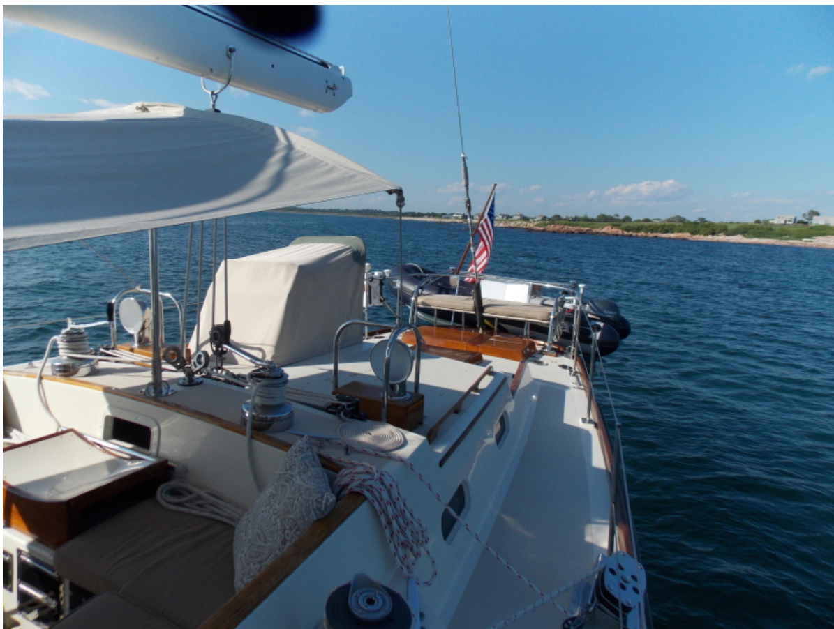
looking aft from port midship 1985 59' Hinckley Sou'wester "Eclipse"