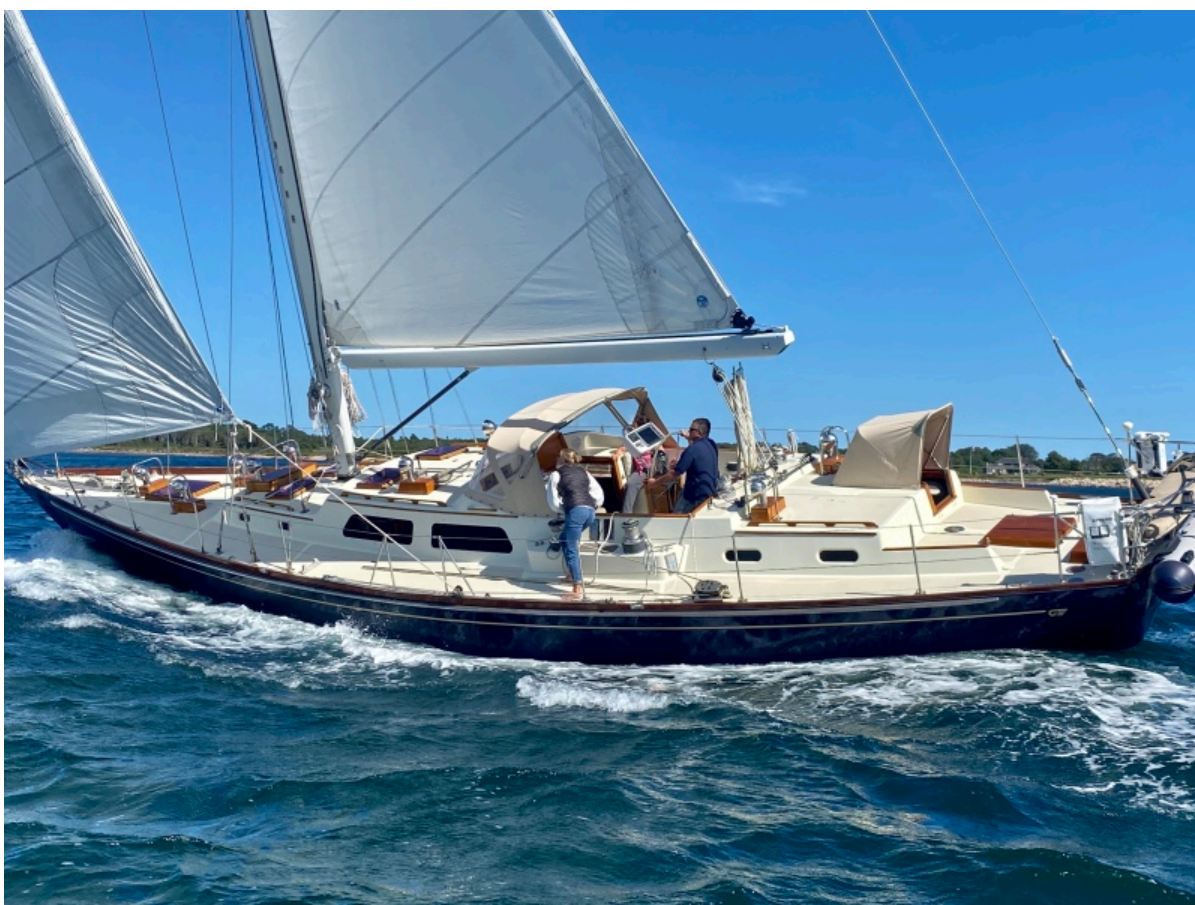
undersail close up 1985 59' Hinckley Sou'wester "Eclipse"