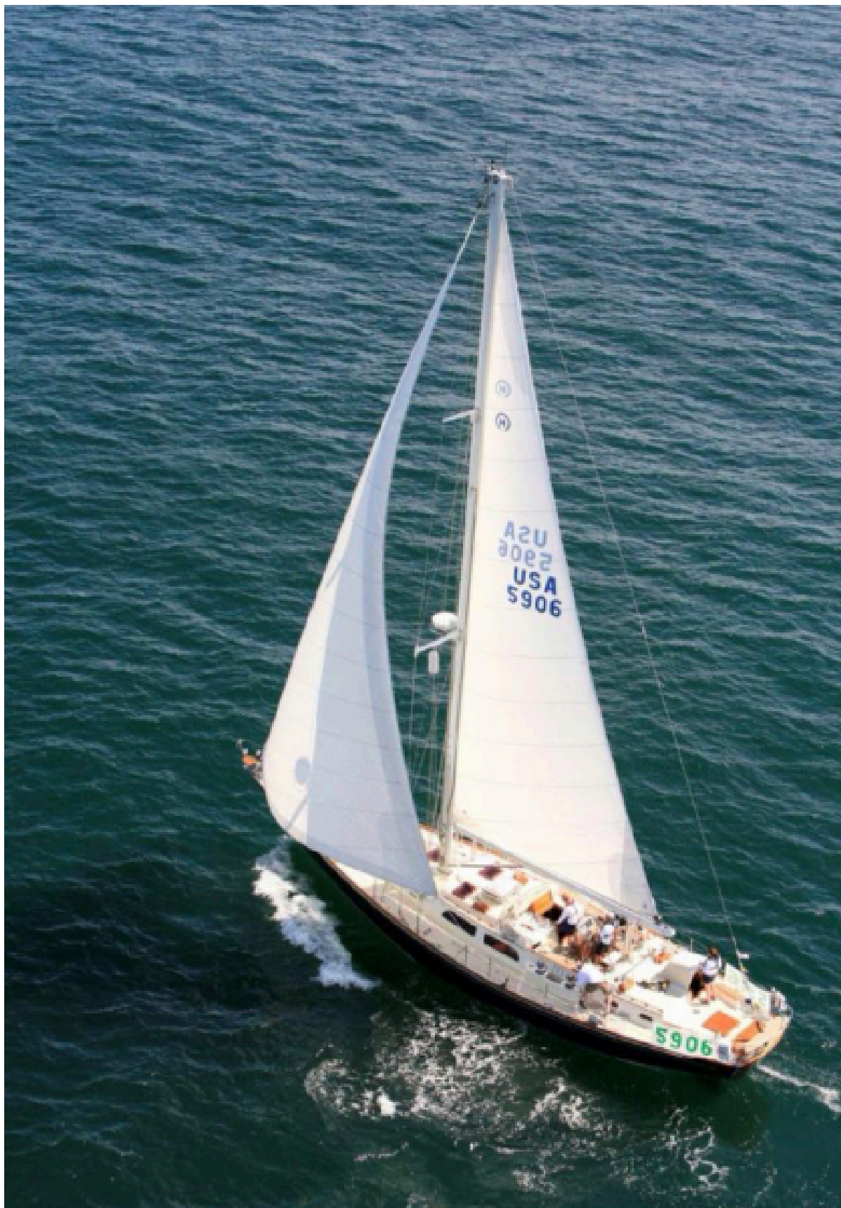
npt to bm start 1985 59' Hinckley Sou'wester "Eclipse"