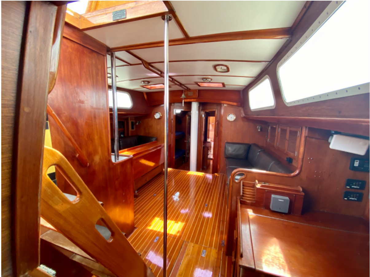
salon 1985 59' Hinckley Sou'wester "Eclipse"