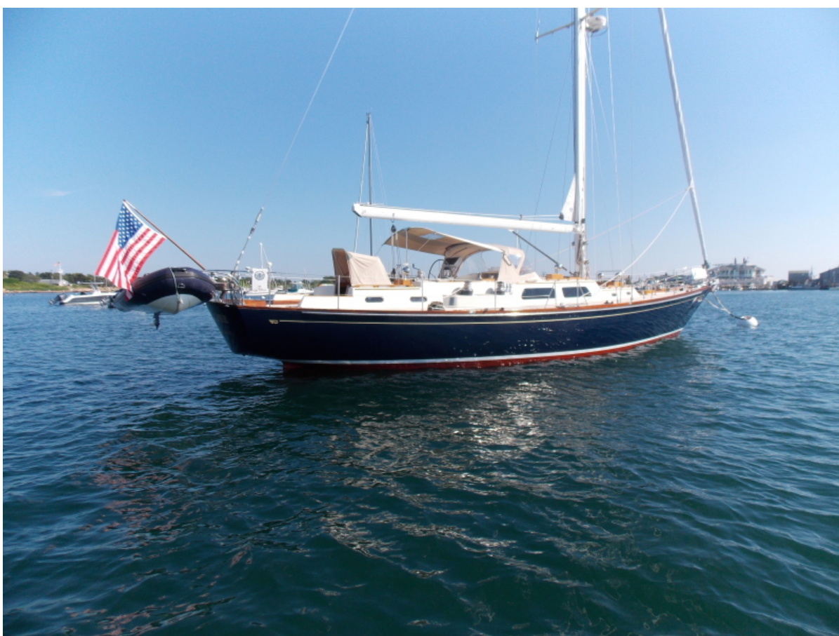
strbrd side- alternatre 1985 59' Hinckley Sou'wester "Eclipse"