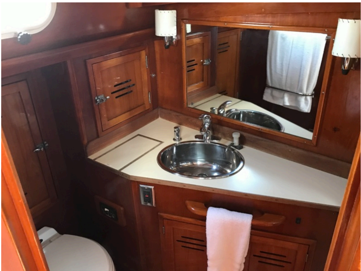
aft head 1985 59' Hinckley Sou'wester "Eclipse"