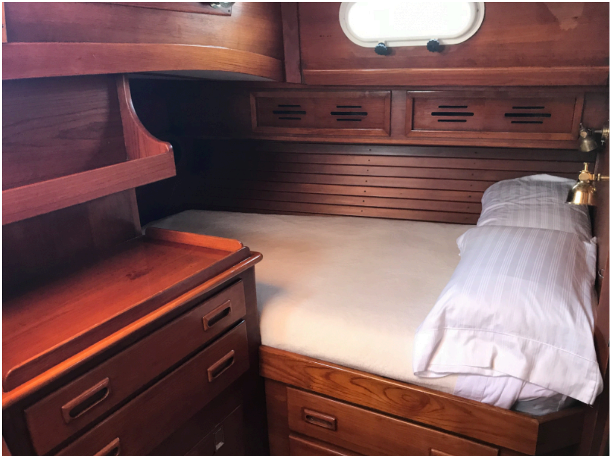
aft double berth 1985 59' Hinckley Sou'wester "Eclipse"