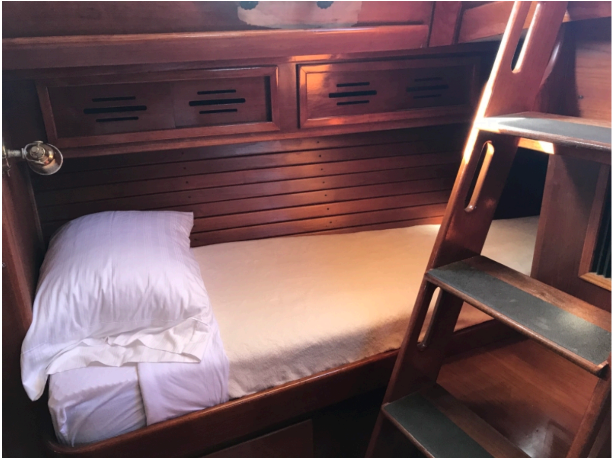
aft strbrd single berth 1985 59' Hinckley Sou'wester "Eclipse"