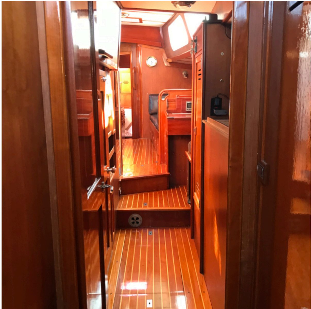
forward from aft cabin 1985 59' Hinckley Sou'wester "Eclipse"