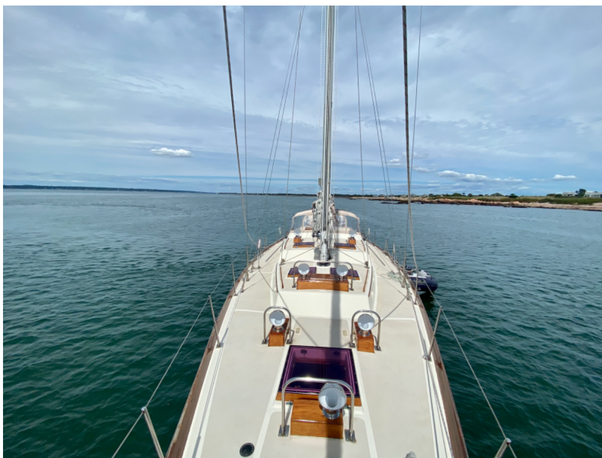
looking aft from bow 1985 59' Hinckley Sou'wester "Eclipse"