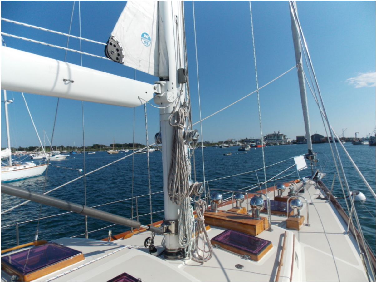
foredeck from housetop 1985 59' Hinckley Sou'wester "Eclipse"