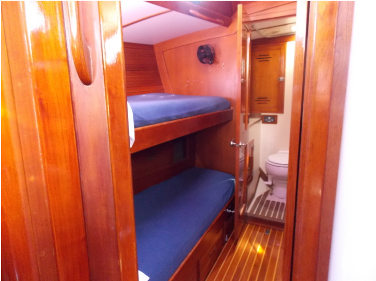
portside cabin 1985 59' Hinckley Sou'wester "Eclipse"