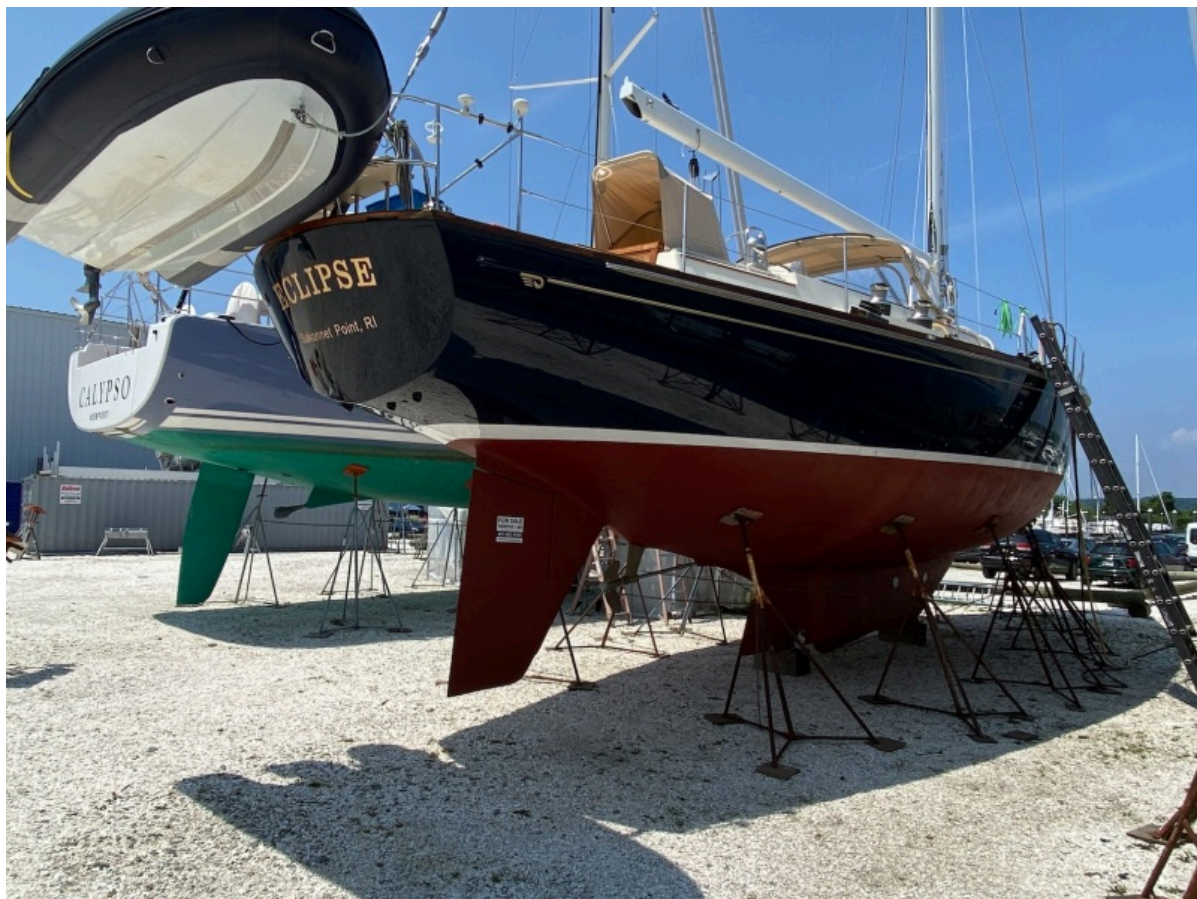
strbrdside on hard 1985 59' Hinckley Sou'wester "Eclipse"