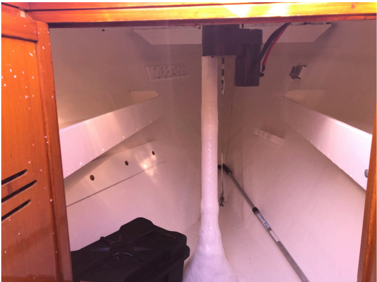
anchor locker 1985 59' Hinckley Sou'wester "Eclipse"