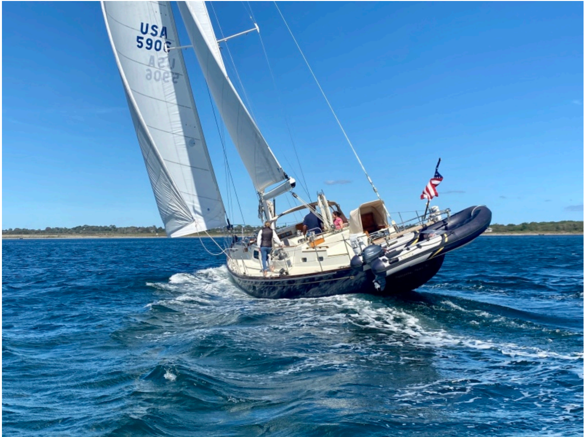
transom view- undersail 1985 59' Hinckley Sou'wester "Eclipse"