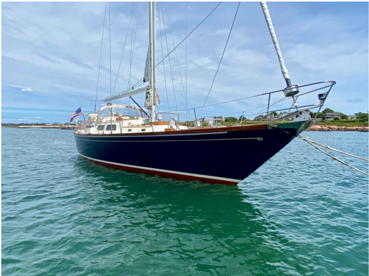
strbrd side -bow 1985 59' Hinckley Sou'wester "Eclipse"