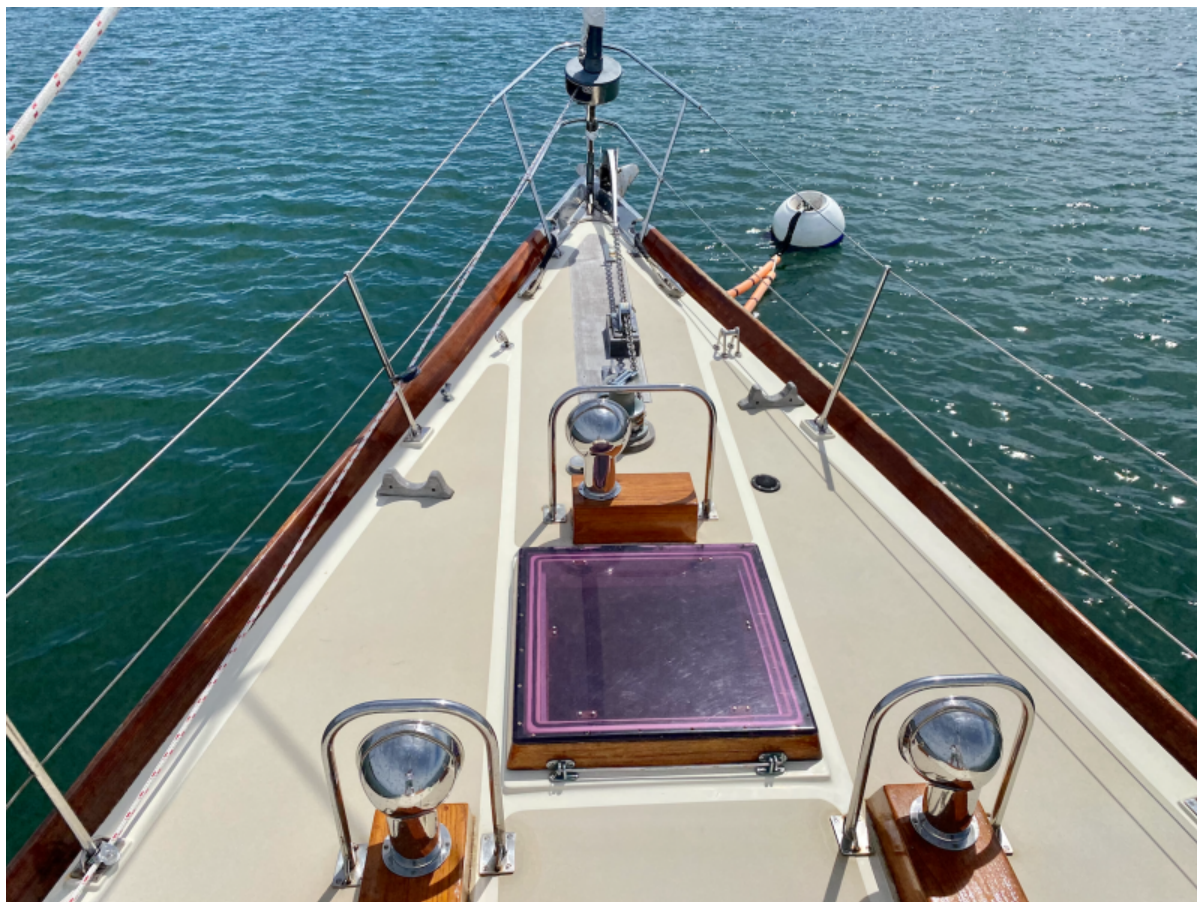
bow 1985 59' Hinckley Sou'wester "Eclipse"