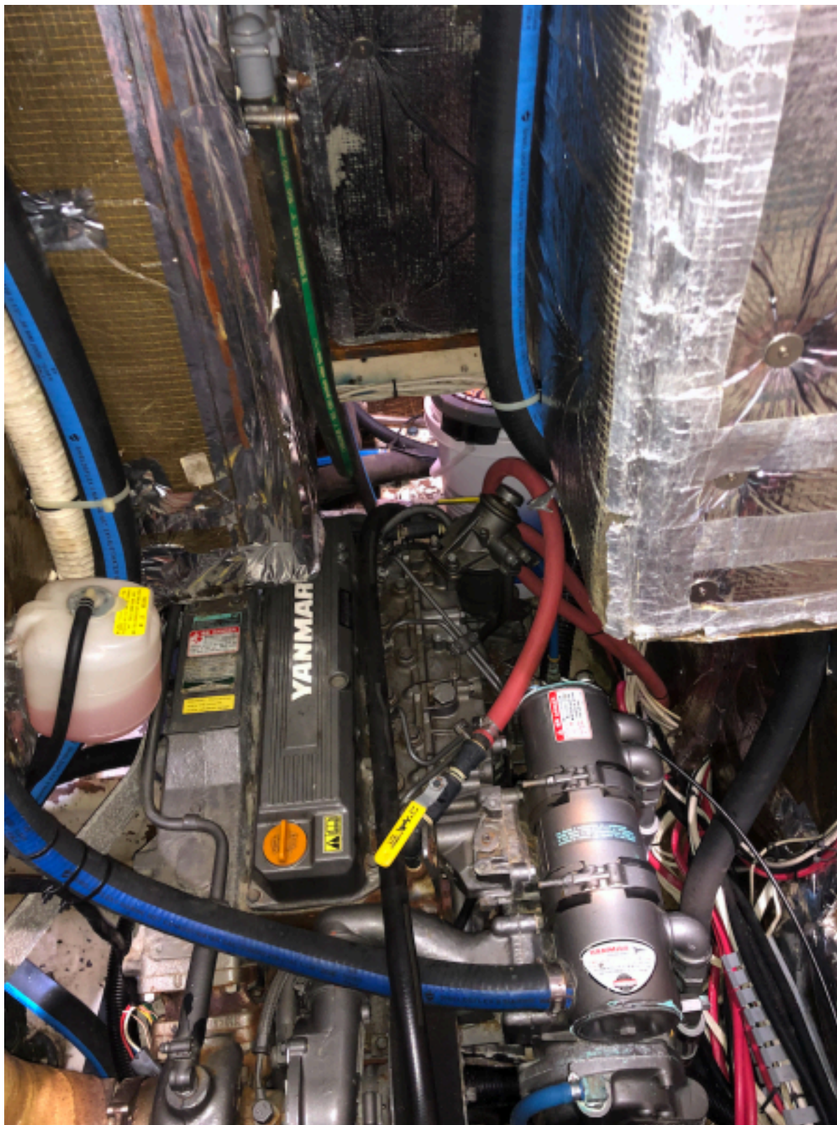
yanmar 135hp 1985 59' Hinckley Sou'wester "Eclipse"