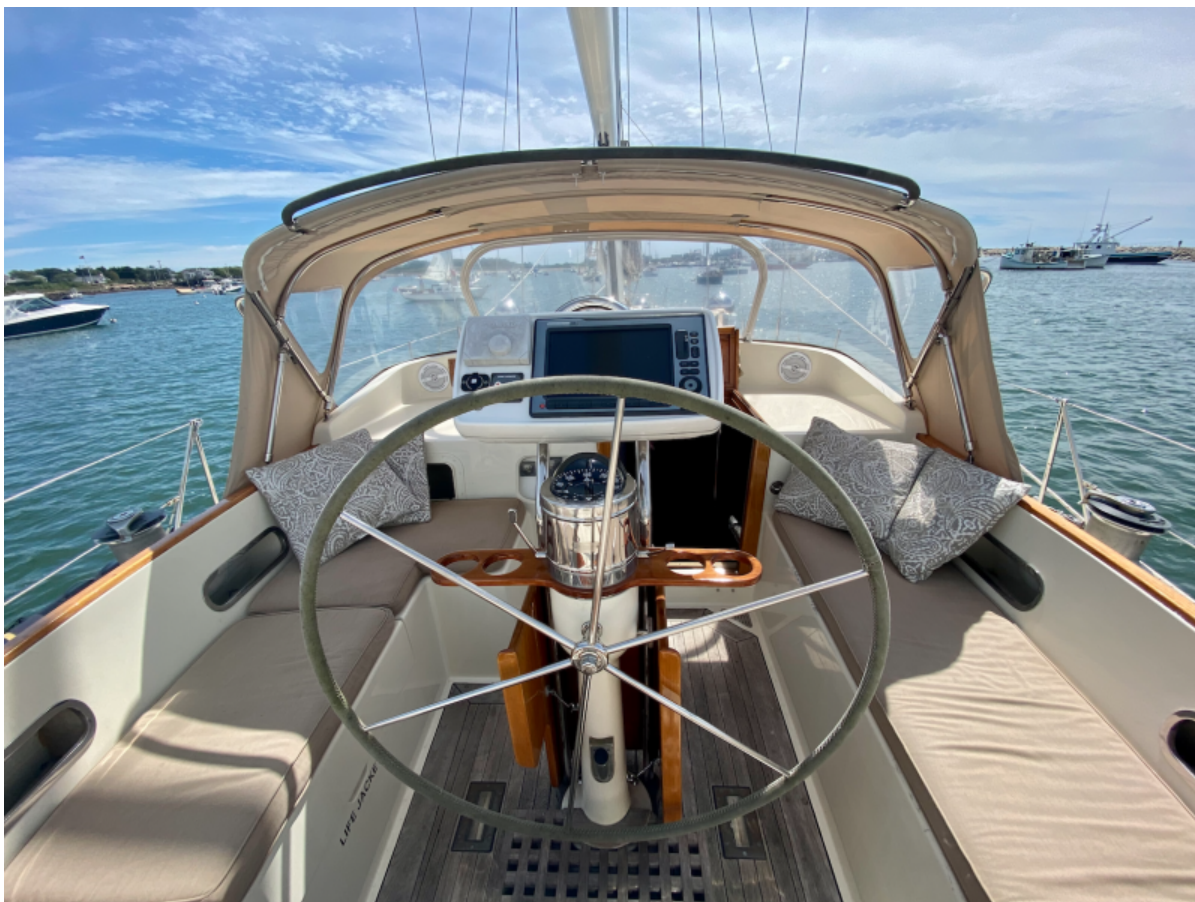
cockpit 1985 59' Hinckley Sou'wester "Eclipse"