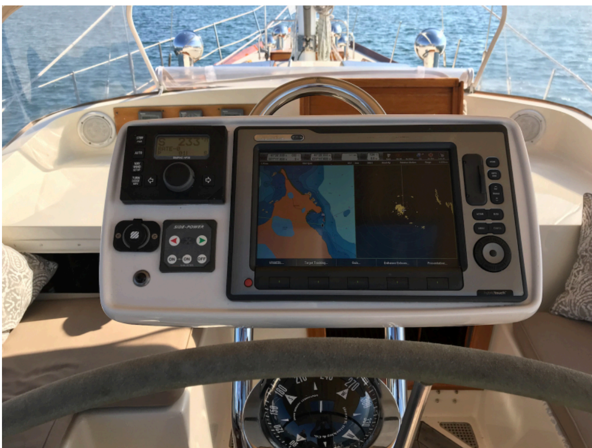
helm 1985 59' Hinckley Sou'wester "Eclipse"