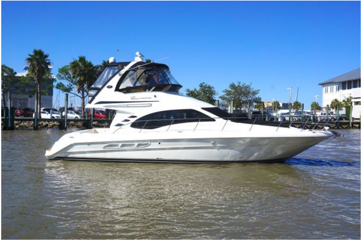
2004 42 Sea Ray Sedan Shug Profile