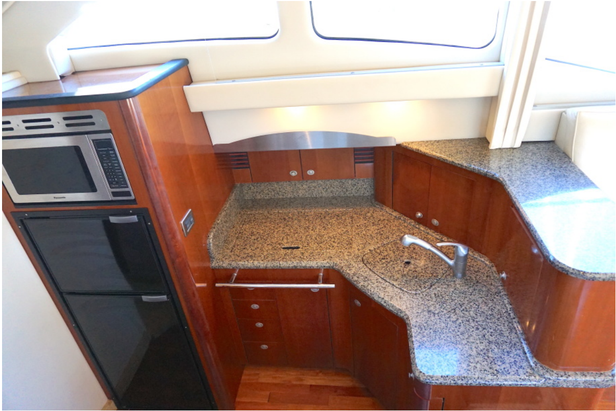
2004 42 Sea Ray Sedan Shug Galley (1)