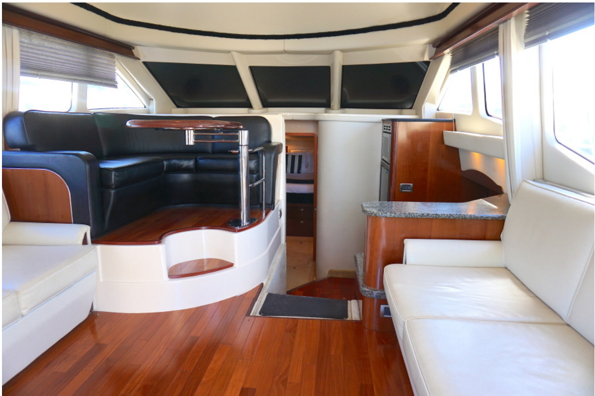
2004 42 Sea Ray Sedan Shug Salon (4)