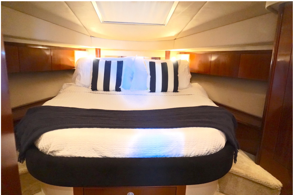
2004 42 Sea Ray Sedan Shug Master Stateroom (2)