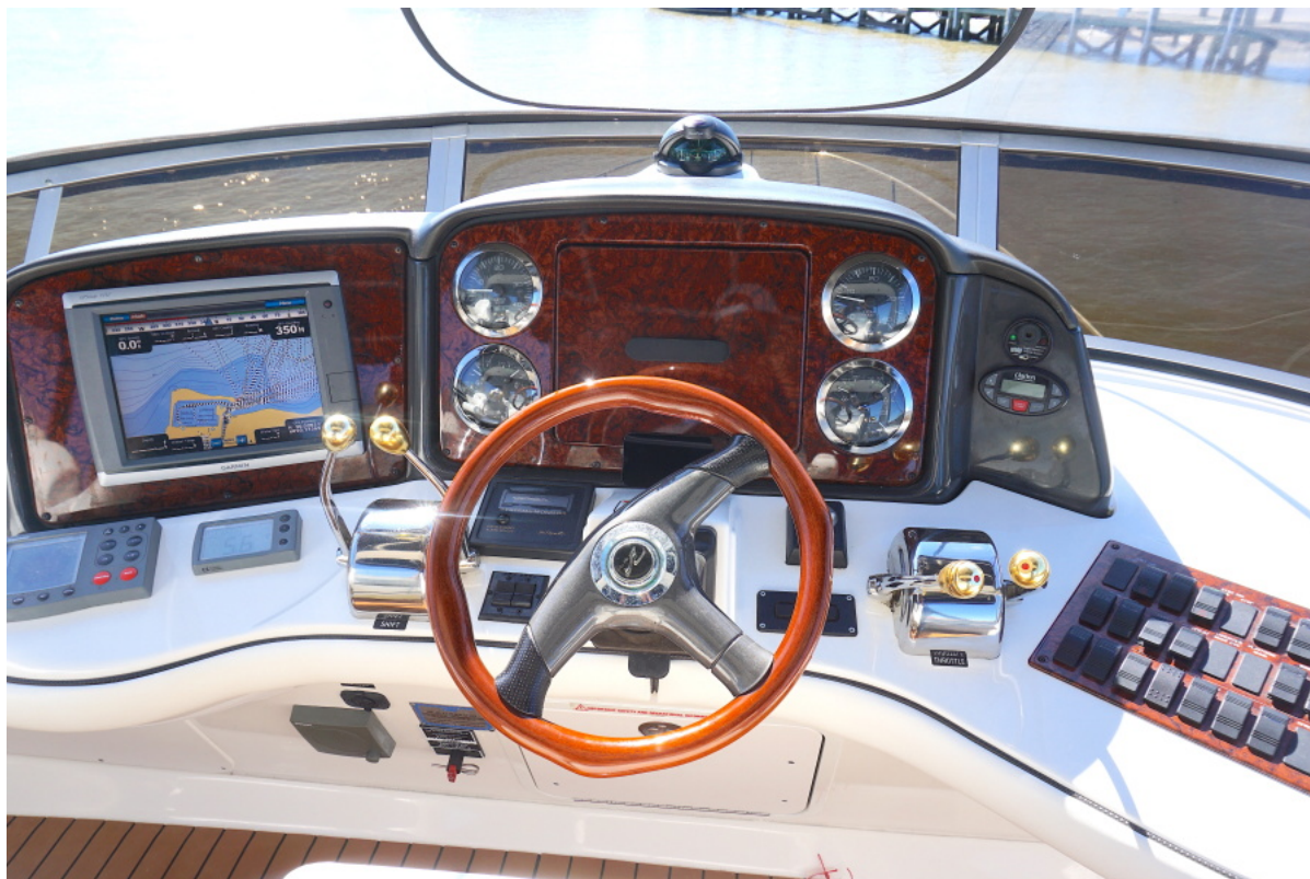
2004 42 Sea Ray Sedan Shug Helm (1)