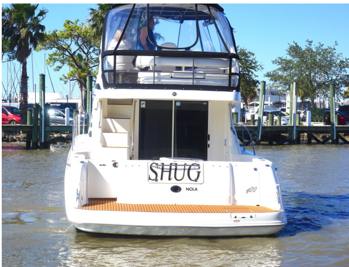
2004 42 Sea Ray Sedan Shug Stern (3)