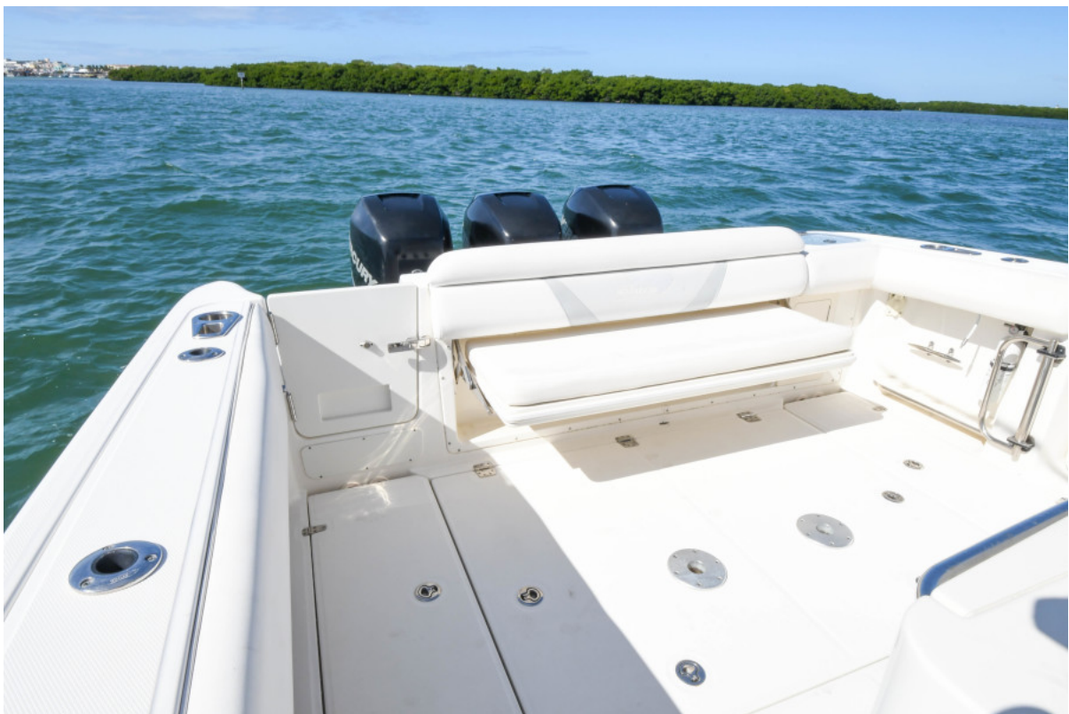
2013 37 Boston Whaler Outrage - Cockpit