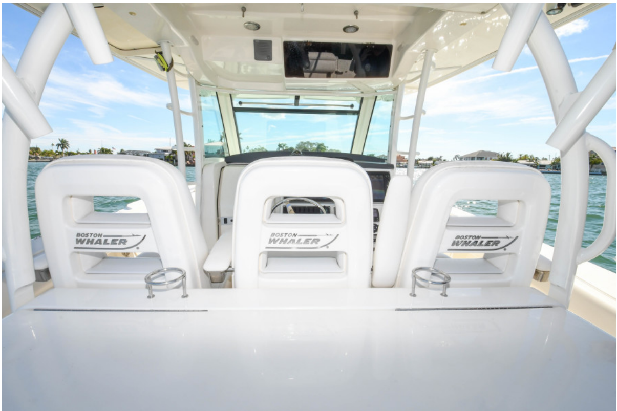
2013 37 Boston Whaler Outrage - Helm Seating