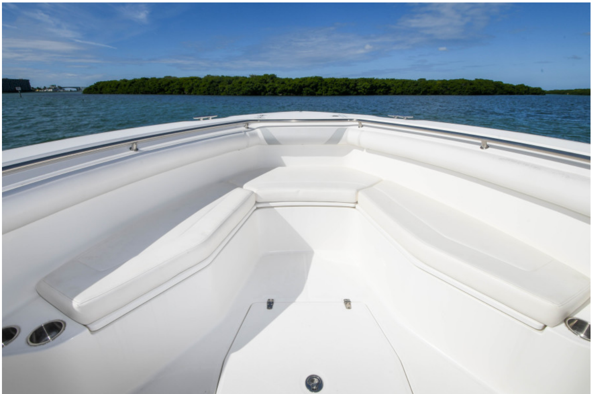
2013 37 Boston Whaler Outrage - Bow