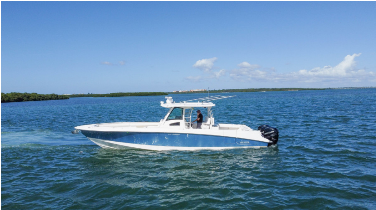
2013 37 Boston Whaler Outrage - Port Profile