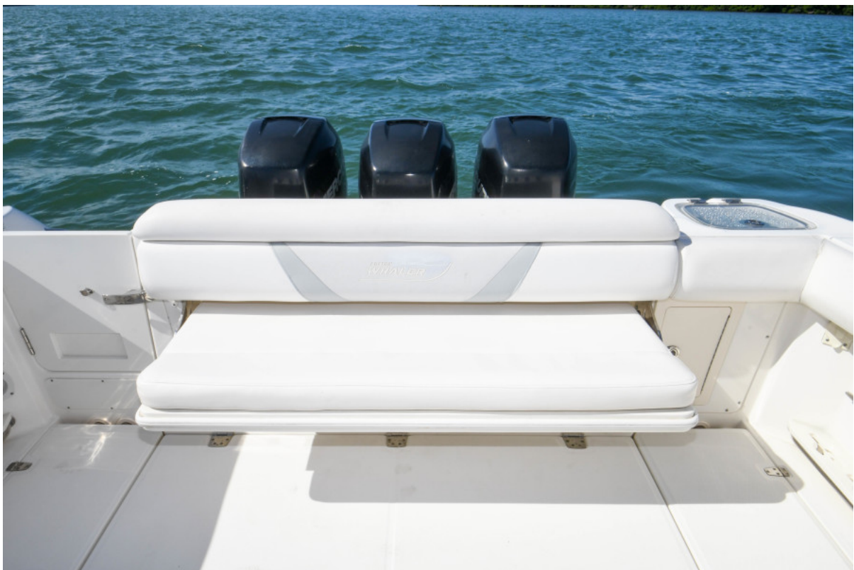
2013 37 Boston Whaler Outrage - Cockpit