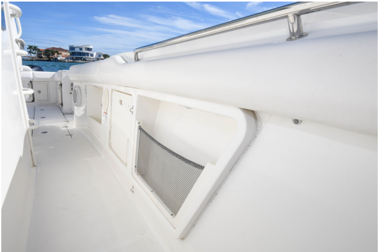
2013 37 Boston Whaler Outrage - Gunnel