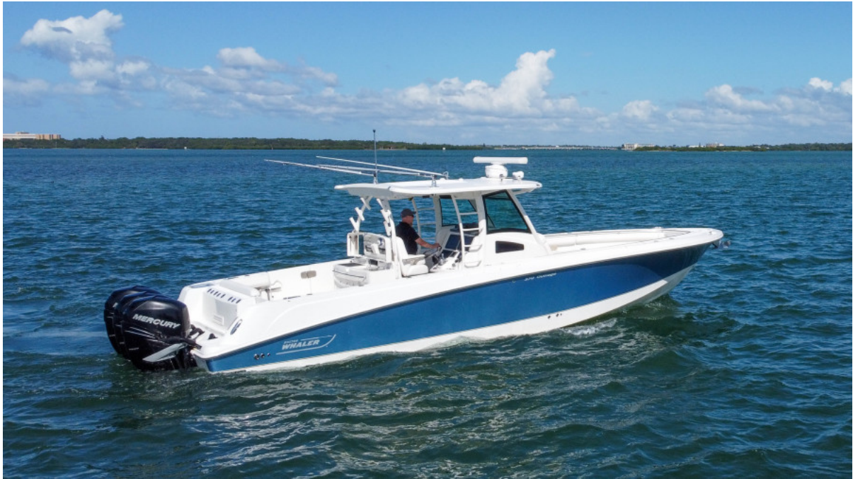
2013 37 Boston Whaler Outrage - Starboard Profile