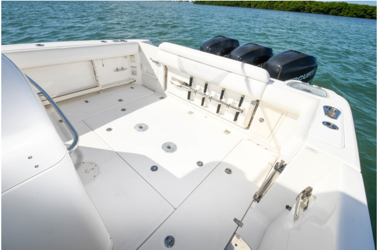
2013 37 Boston Whaler Outrage - Cockpit