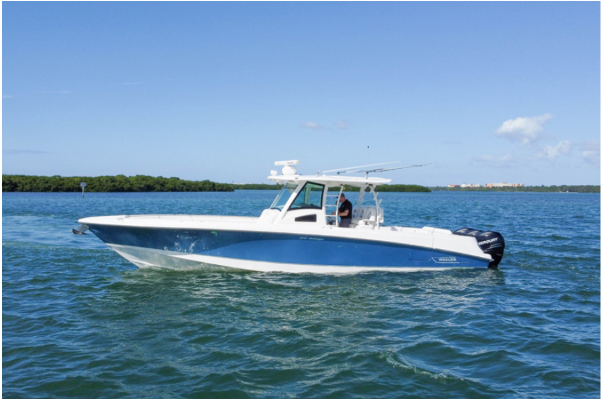
2013 37 Boston Whaler Outrage - Profile