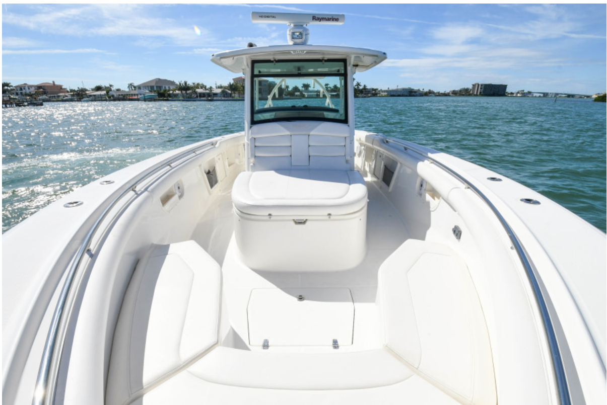
2013 37 Boston Whaler Outrage - Bow Seating