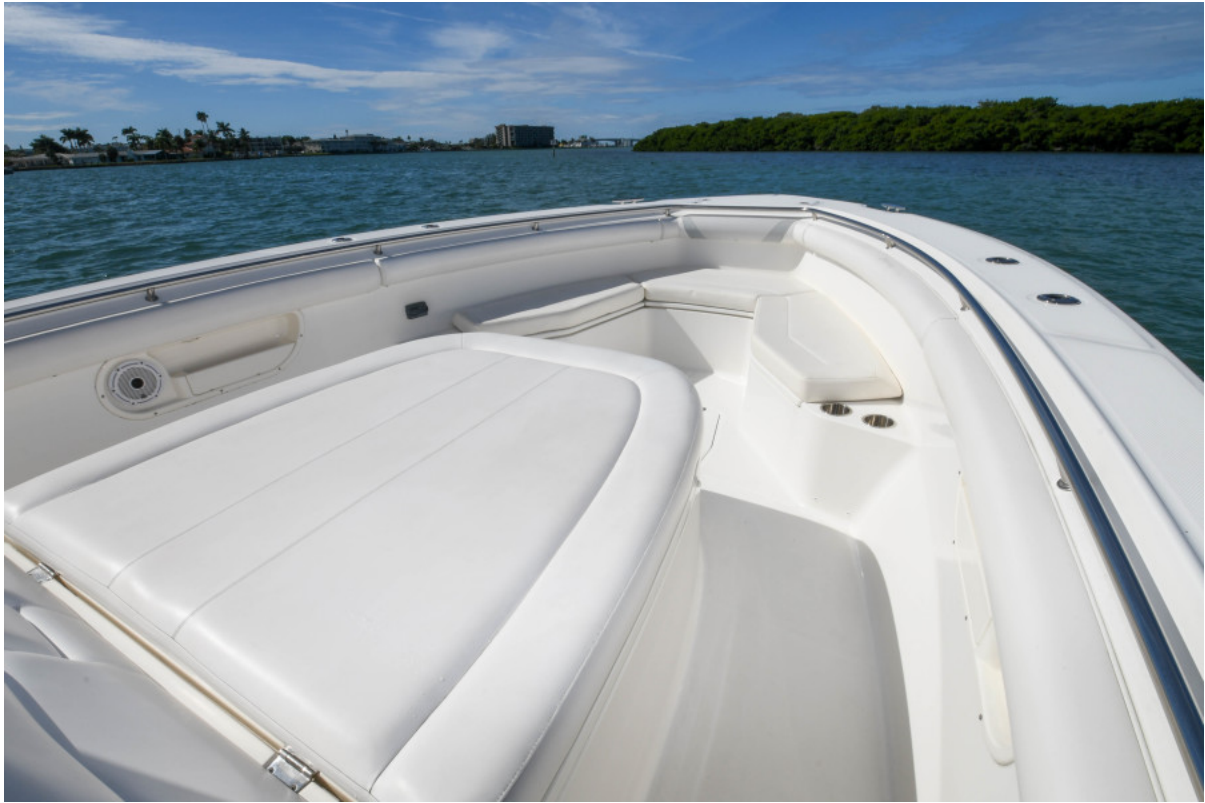
2013 37 Boston Whaler Outrage - Bow