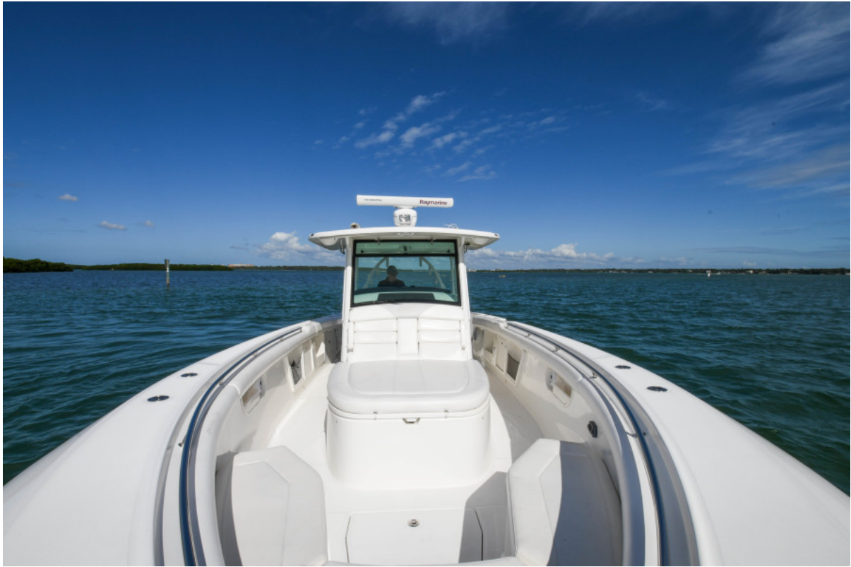
2013 37 Boston Whaler Outrage - Bow Seating