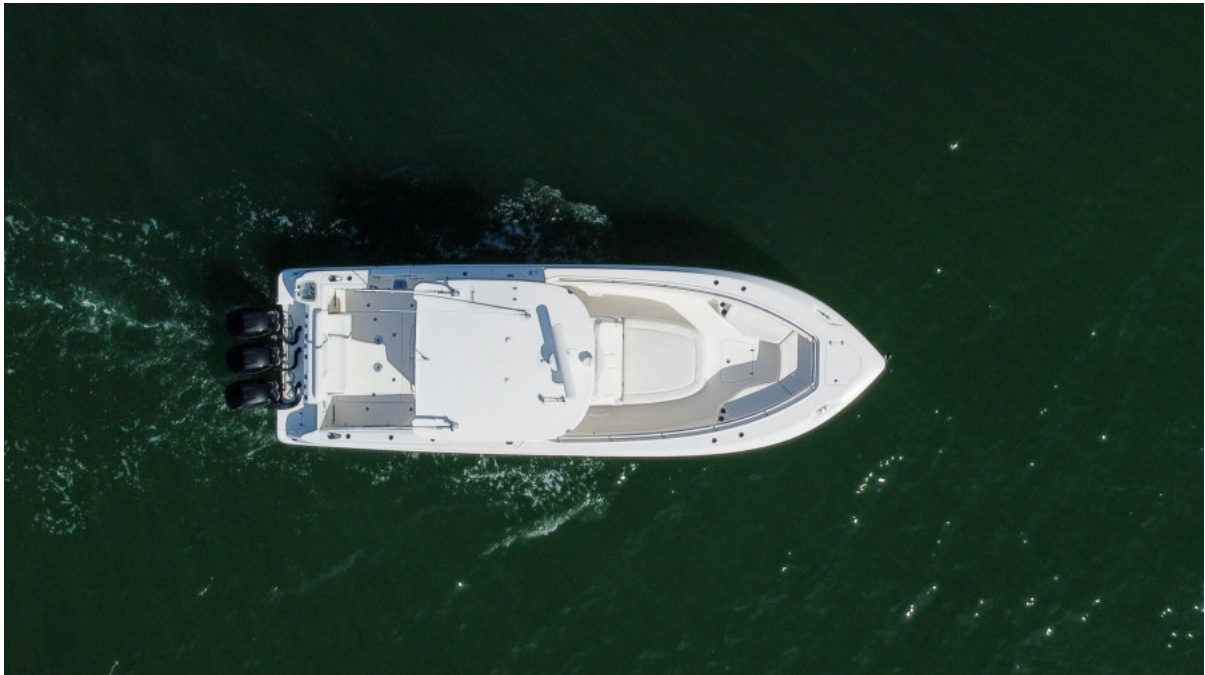
2013 37 Boston Whaler Outrage - Profile