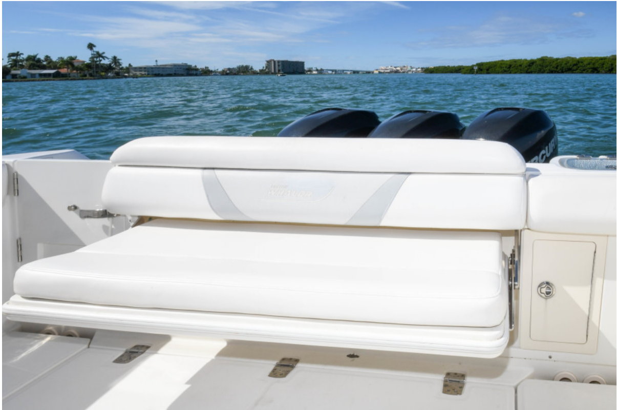
2013 37 Boston Whaler Outrage - Cockpit