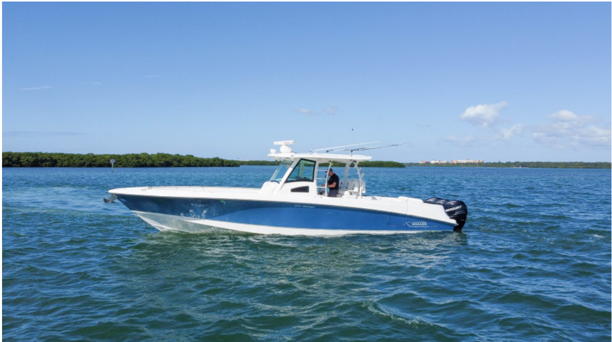
2013 37 Boston Whaler Outrage - Port Profile