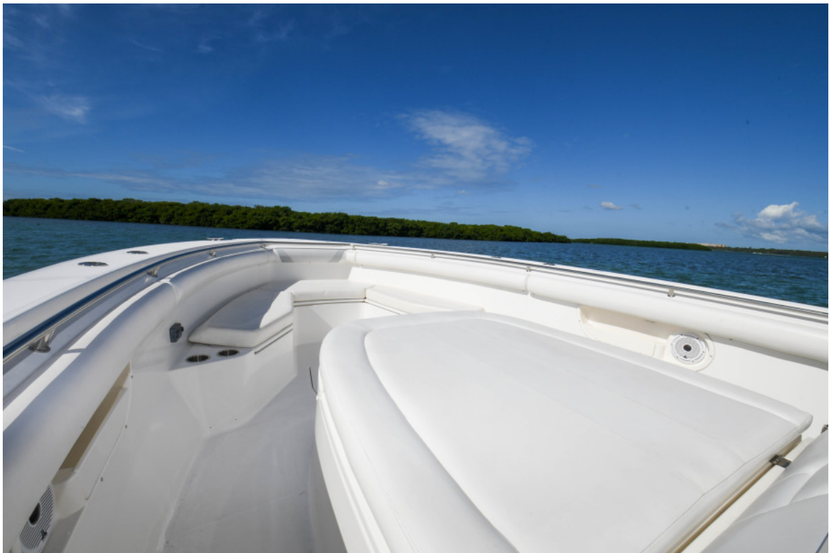
2013 37 Boston Whaler Outrage - Bow