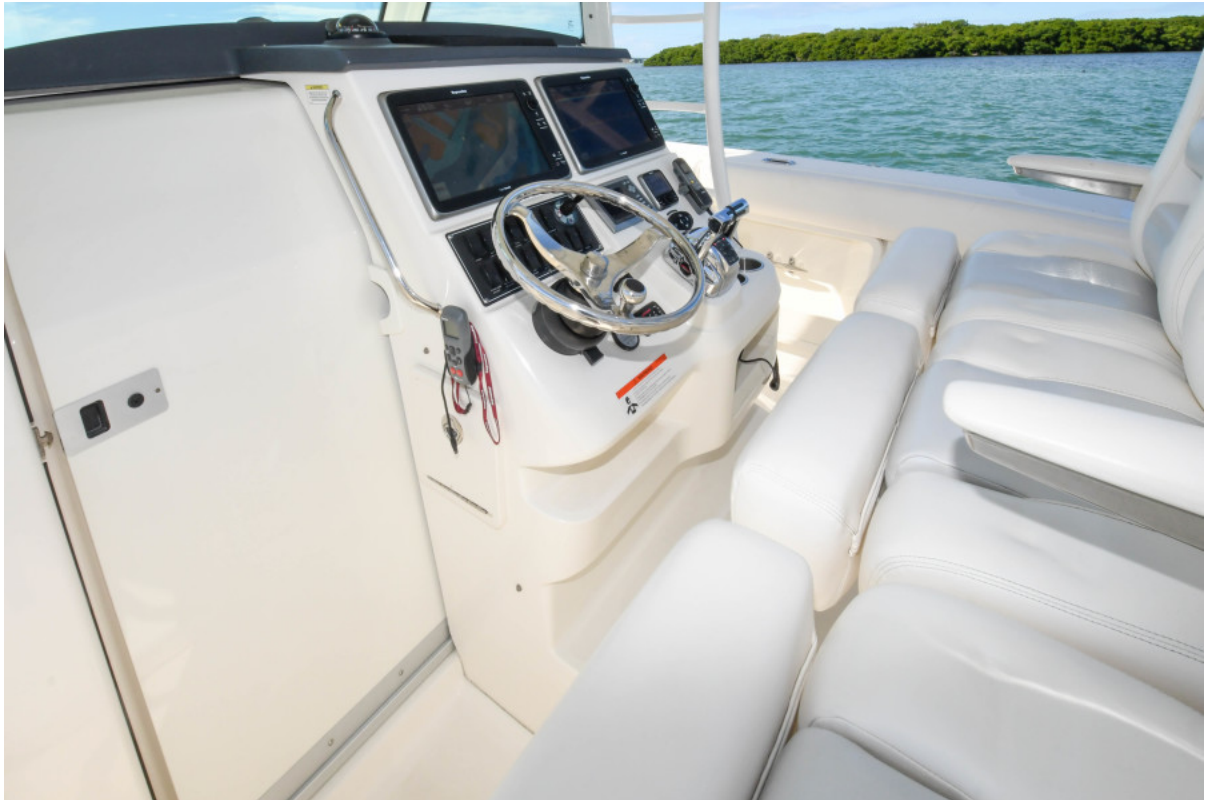
2013 37 Boston Whaler Outrage - Helm