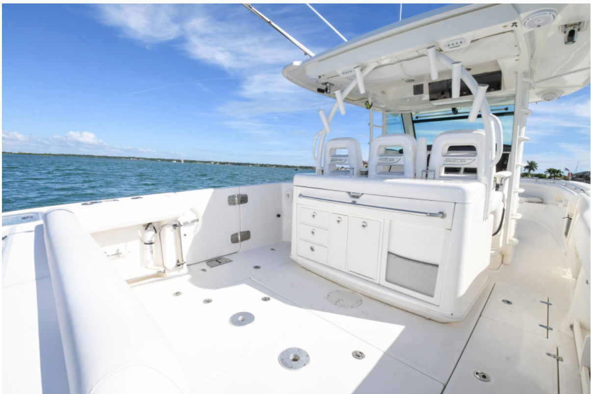
2013 37 Boston Whaler Outrage - Cockpit