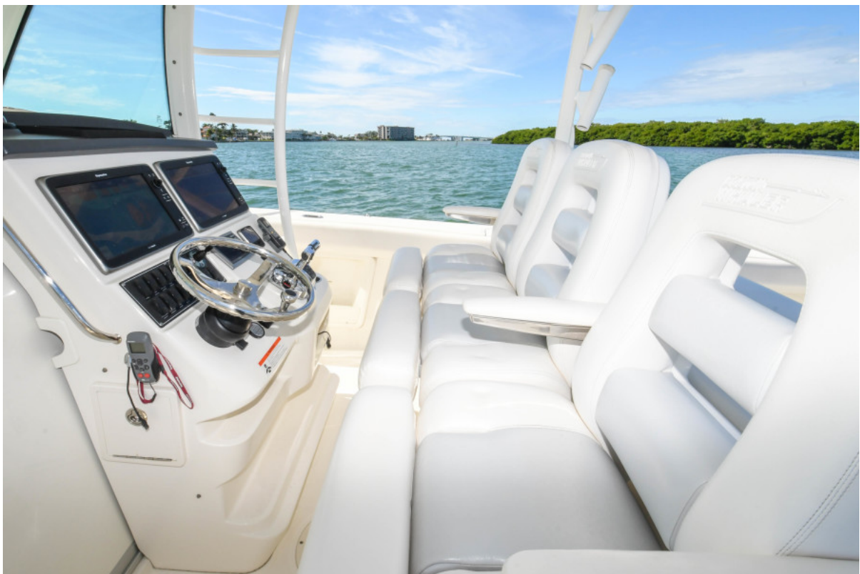
2013 37 Boston Whaler Outrage - Helm