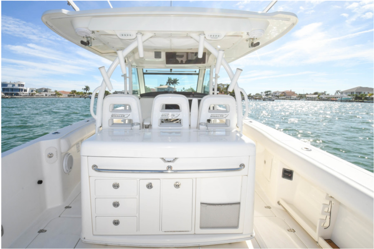
2013 37 Boston Whaler Outrage - Cockpit