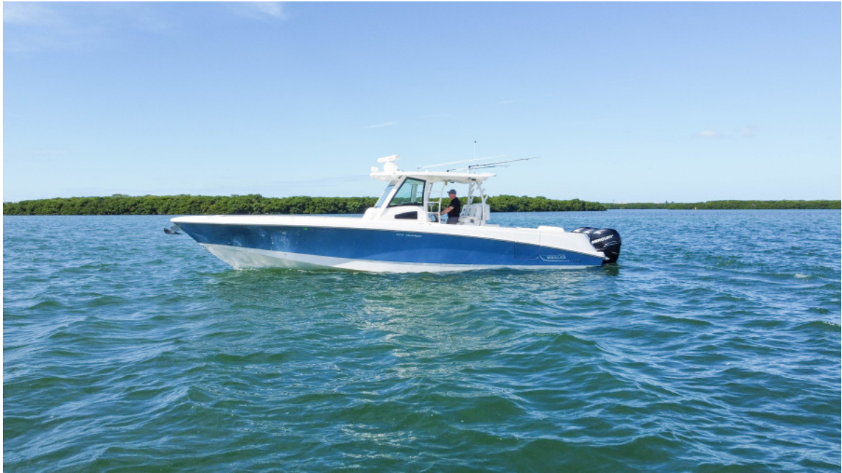
2013 37 Boston Whaler Outrage - Port Profile