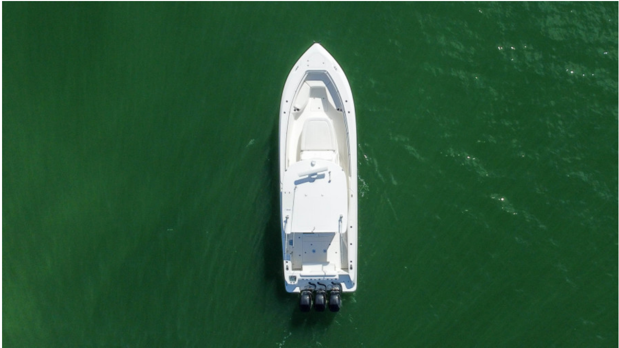
2013 37 Boston Whaler Outrage - Profile