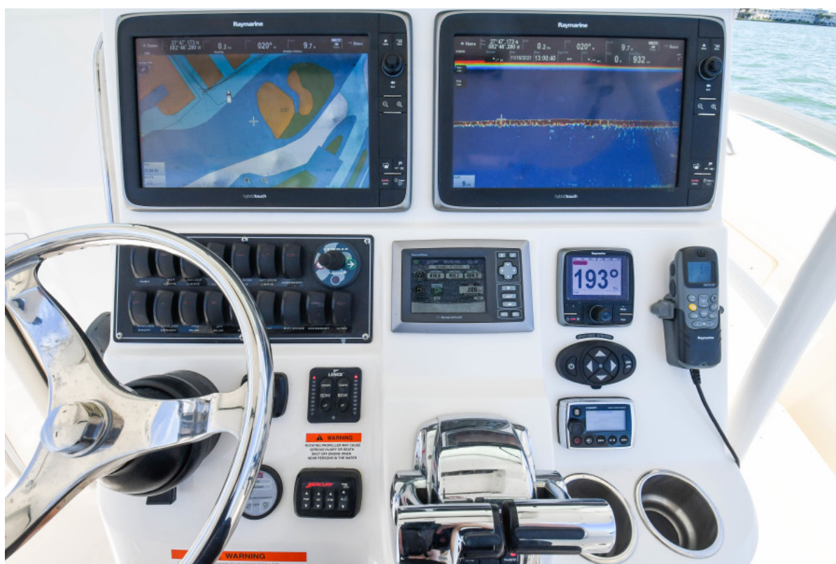
2013 37 Boston Whaler Outrage - Helm