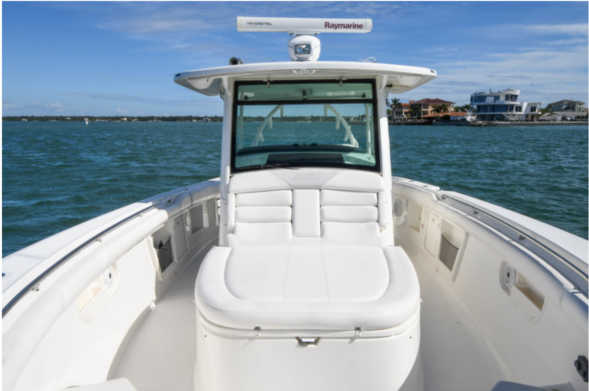
2013 37 Boston Whaler Outrage - Bow Seating