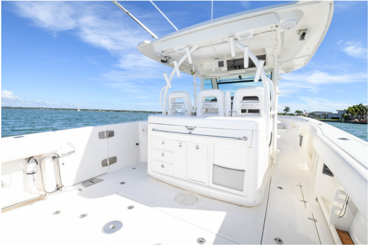
2013 37 Boston Whaler Outrage - Cockpit