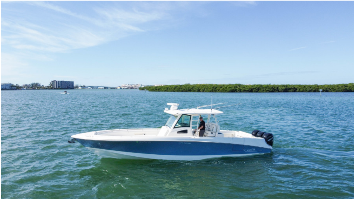
2013 37 Boston Whaler Outrage - Port Profile