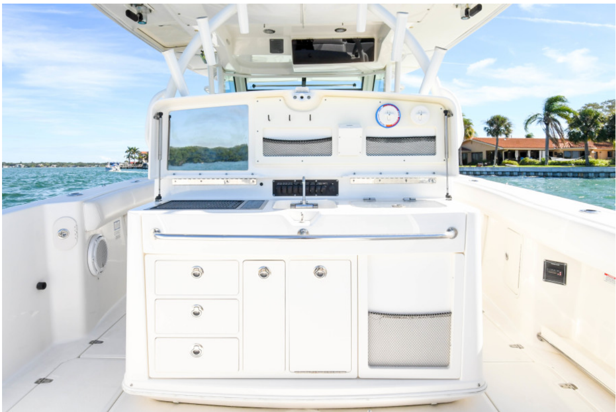
2013 37 Boston Whaler Outrage - Cockpit