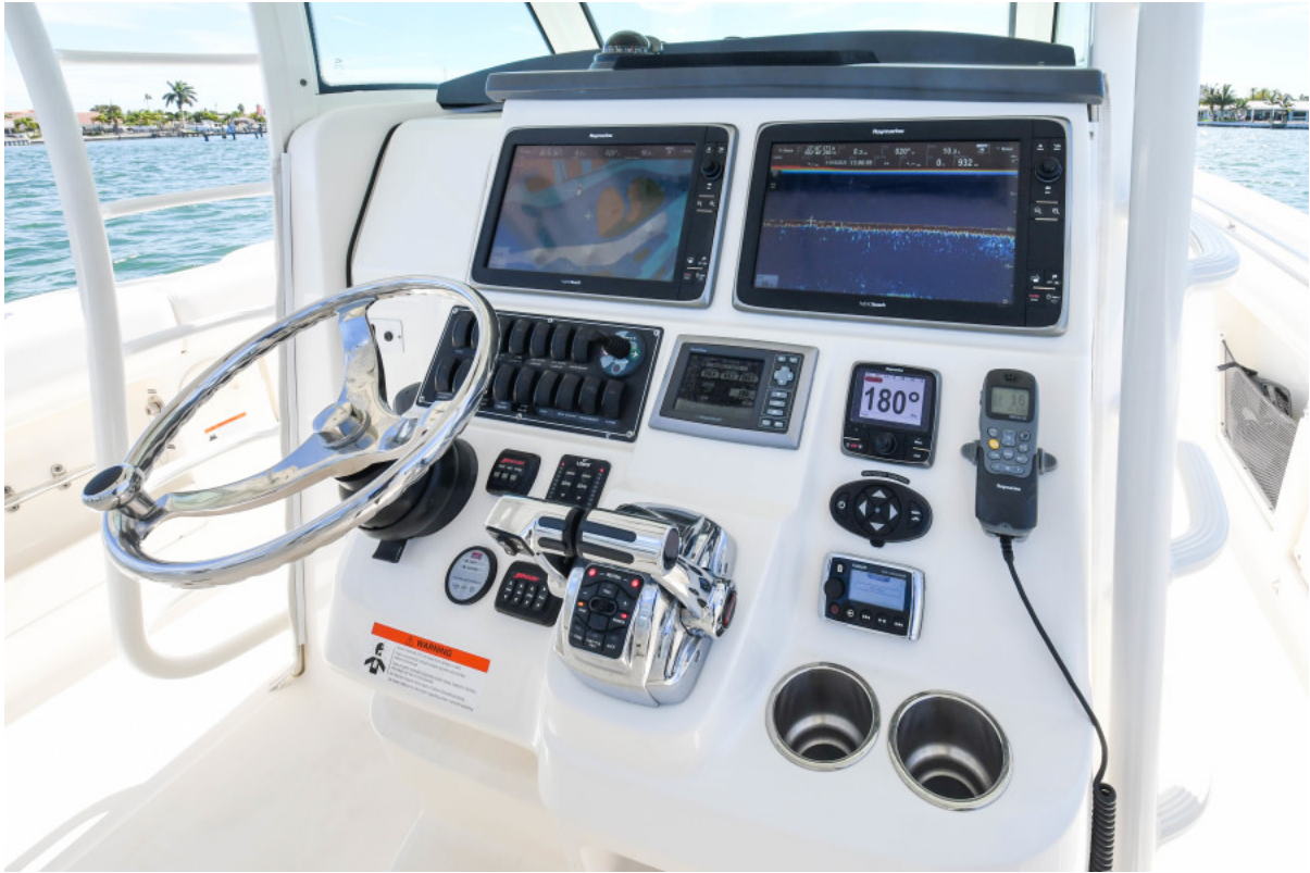
2013 37 Boston Whaler Outrage - Helm