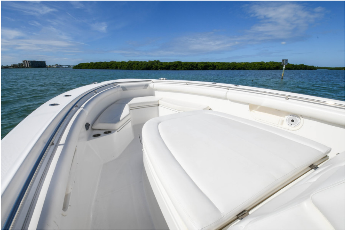
2013 37 Boston Whaler Outrage - Bow