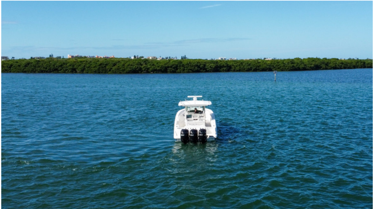
2013 37 Boston Whaler Outrage - Stern Profile