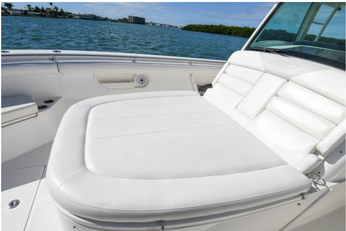
2013 37 Boston Whaler Outrage - Bow Seating