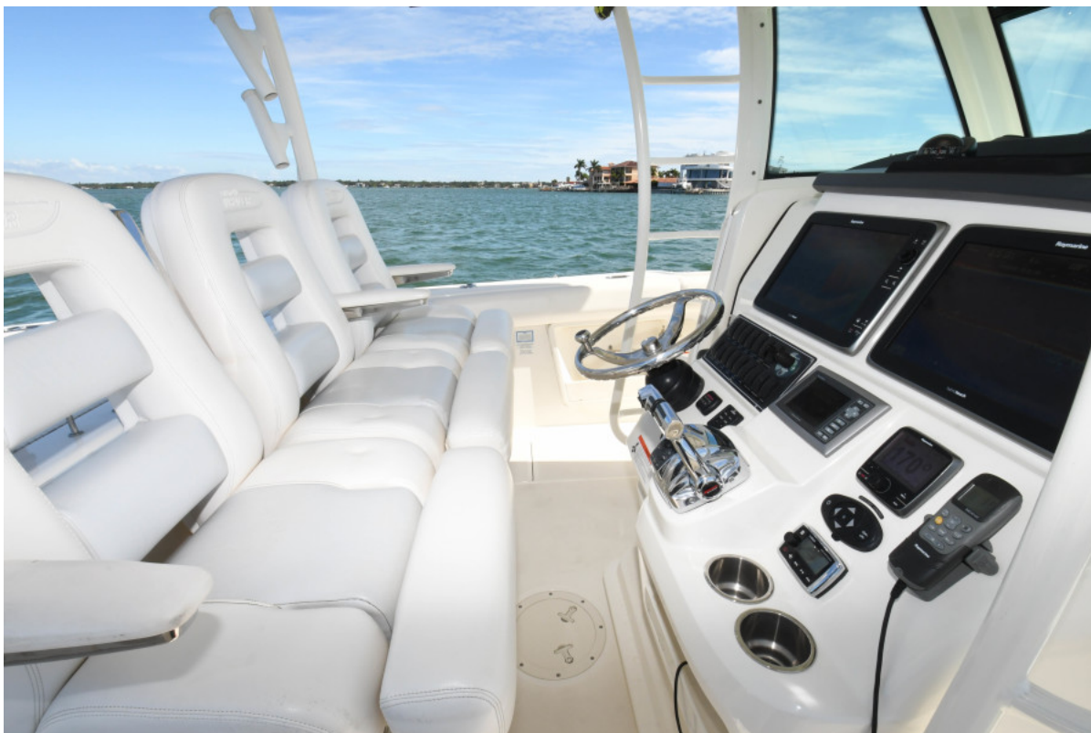
2013 37 Boston Whaler Outrage - Helm