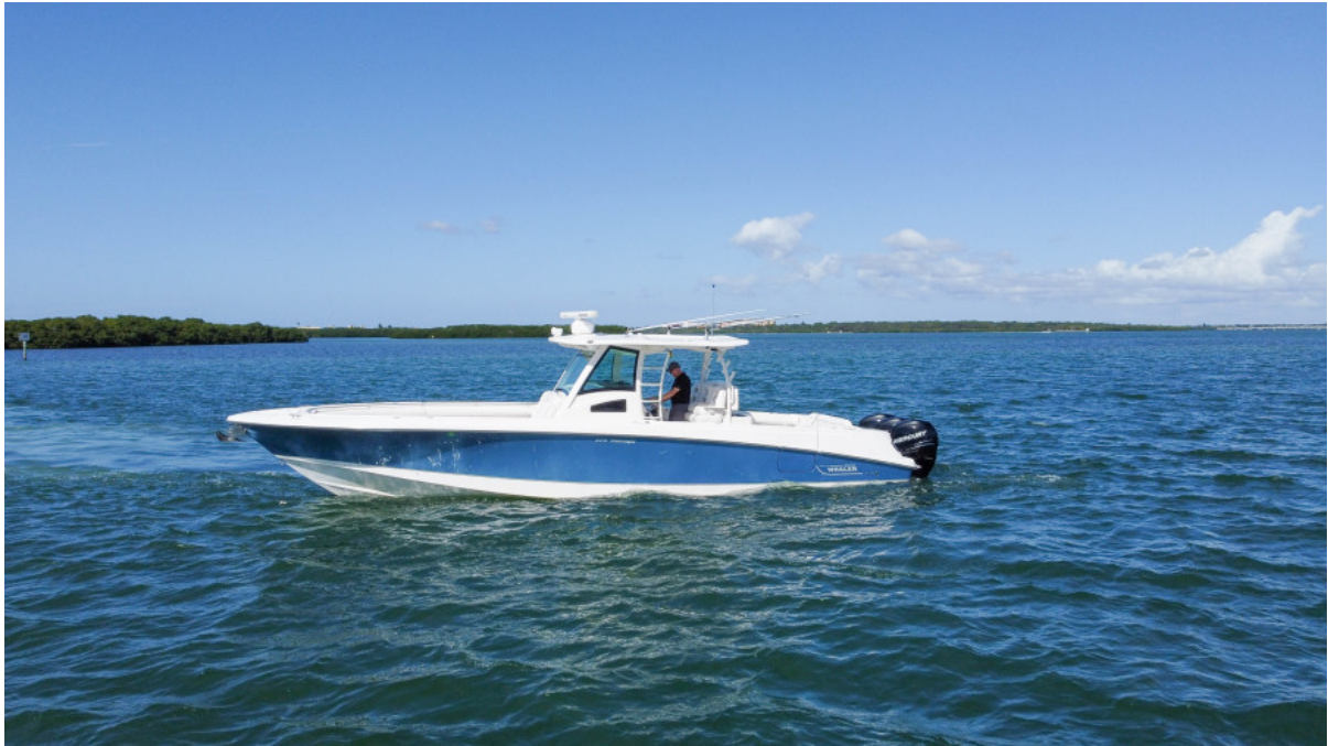
2013 37 Boston Whaler Outrage - Port Profile