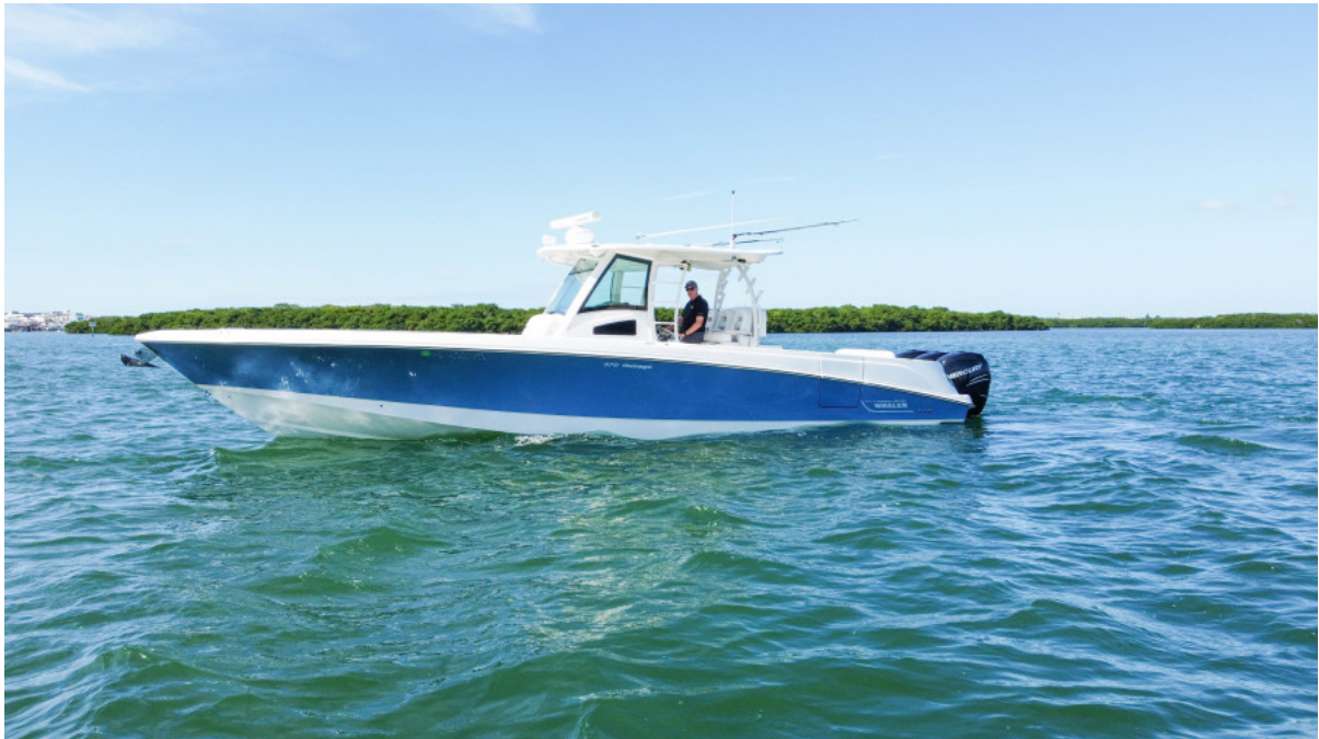
2013 37 Boston Whaler Outrage - Port Profile