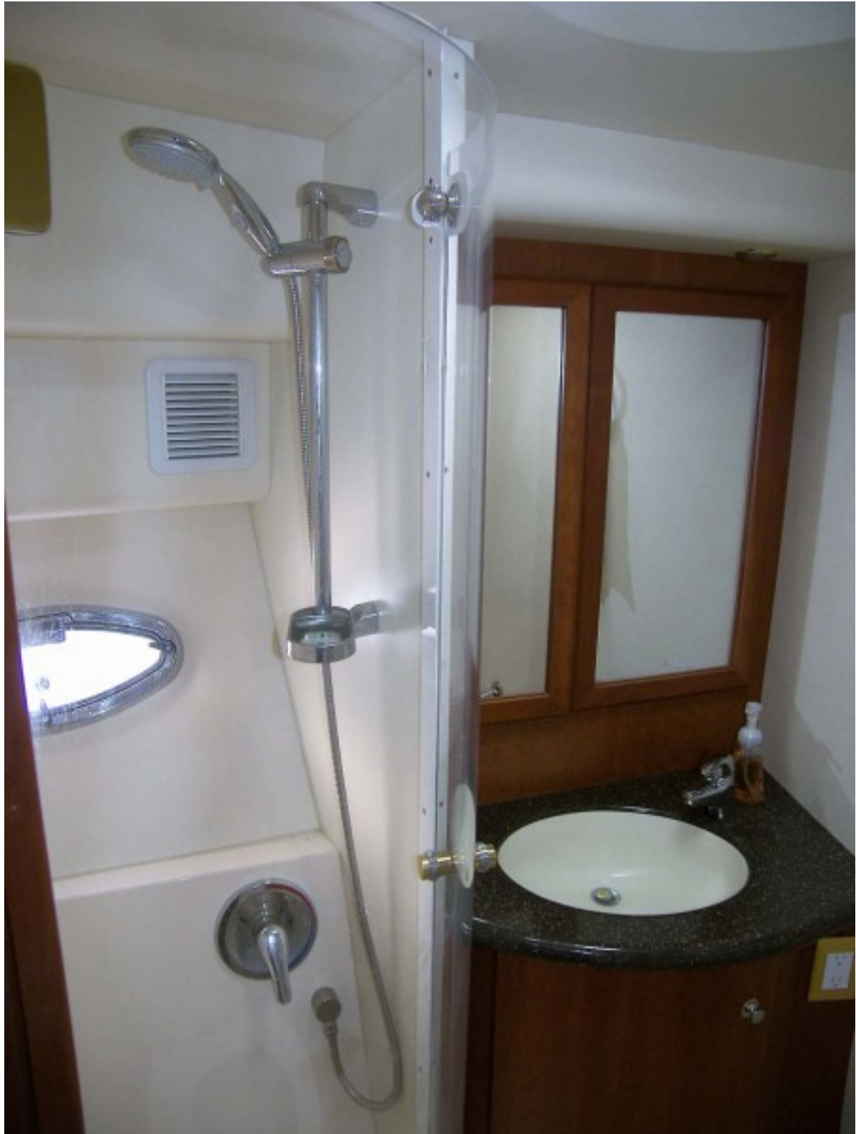
Master Head and Shower