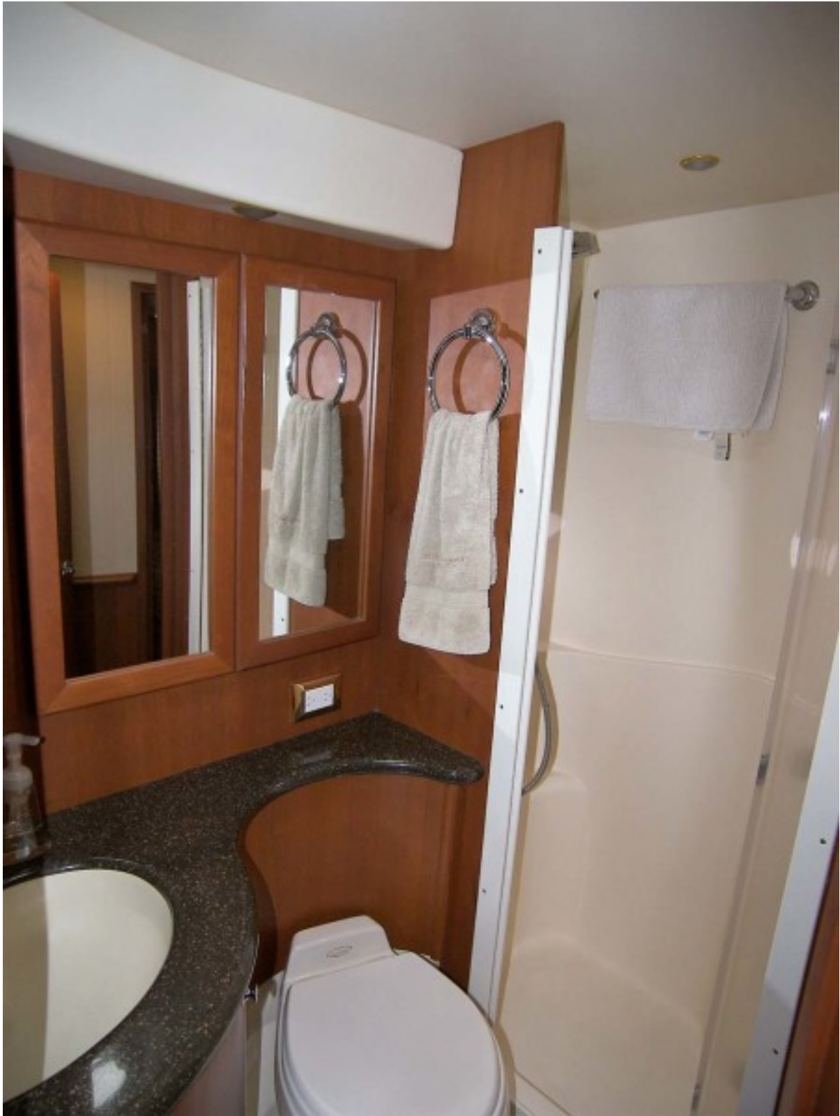
Guest Head and Shower