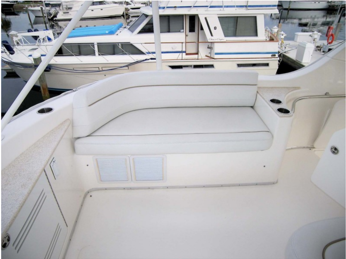
Bridge Seating Starboard