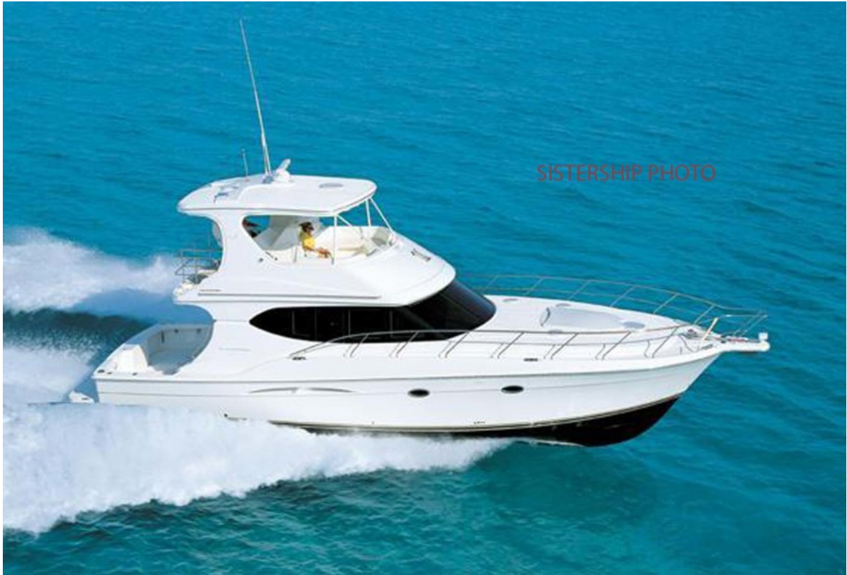
Sistership Profile Sistership Photo