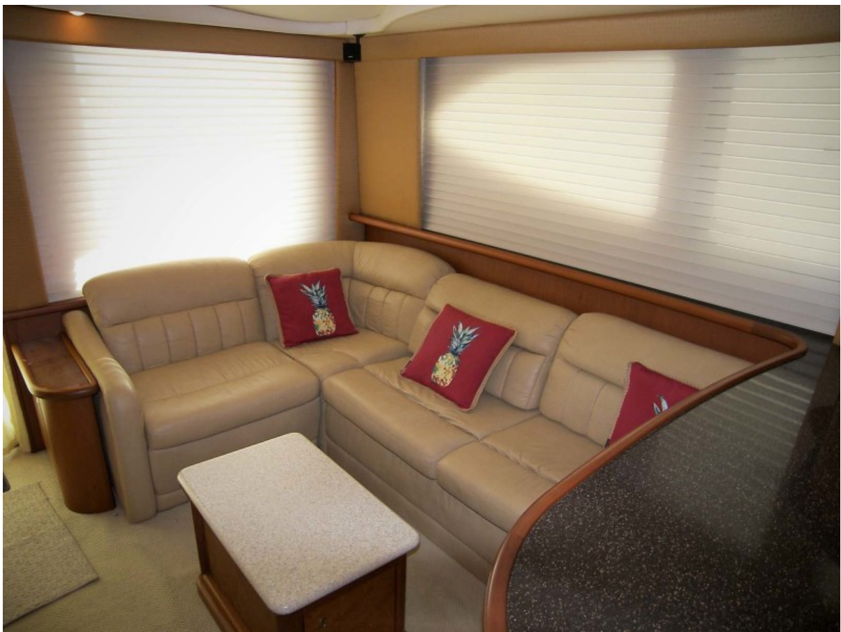
Salon Pull Out Couch