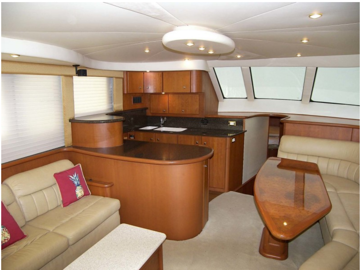
Salon From Entry