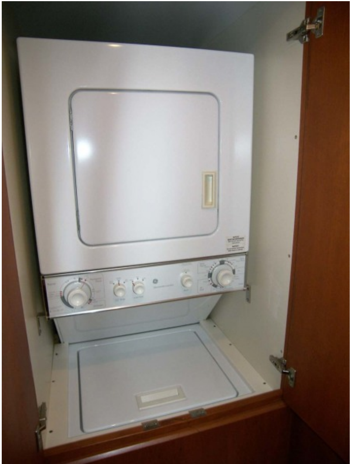
Stack Washer and Dryer