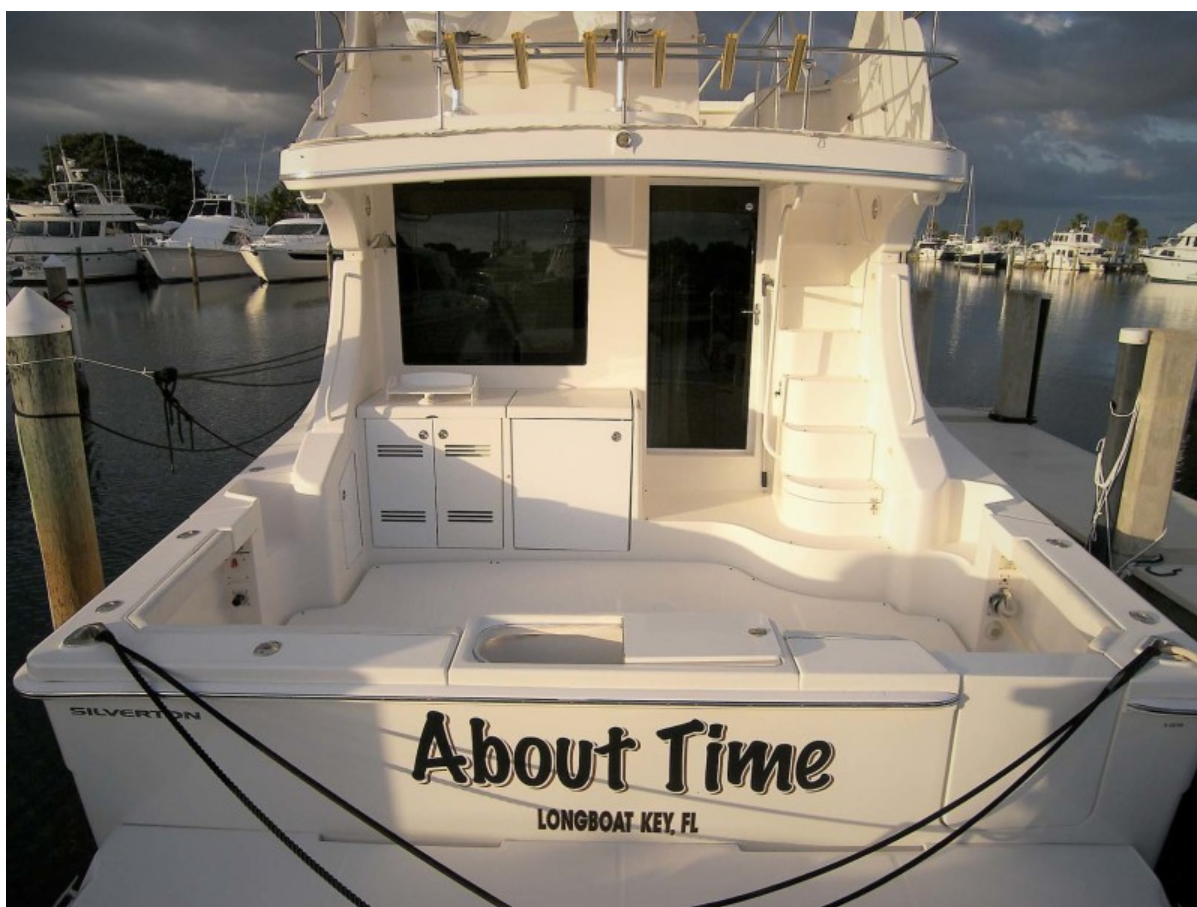
From The Dock