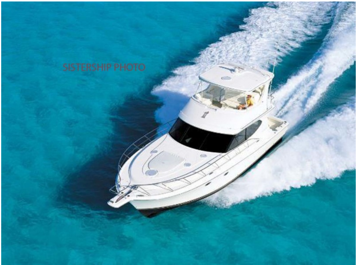
Sistership Running Sistership Photo