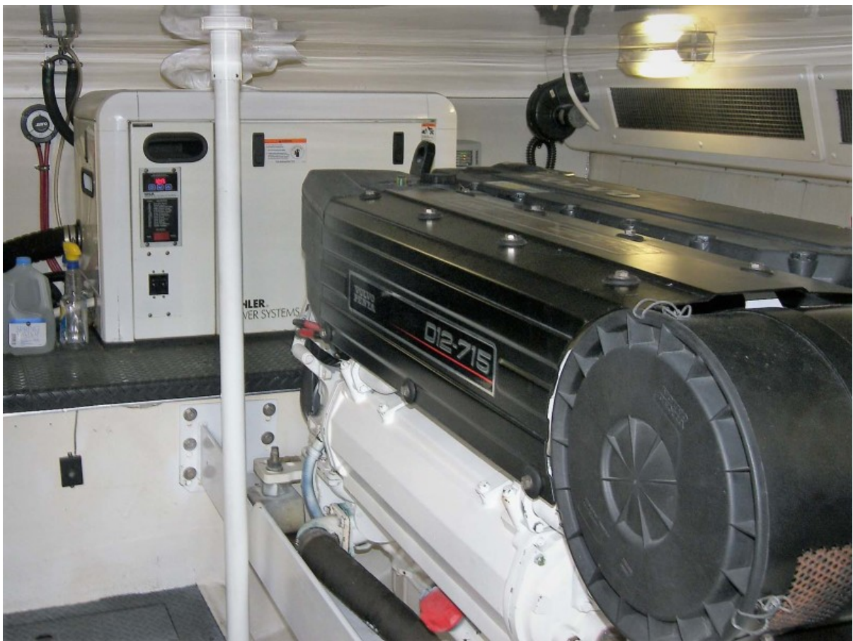
Starboard and Generator