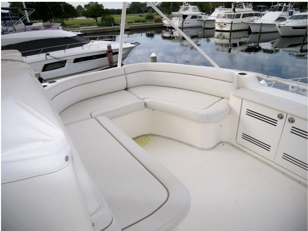
Bridge Seating Port