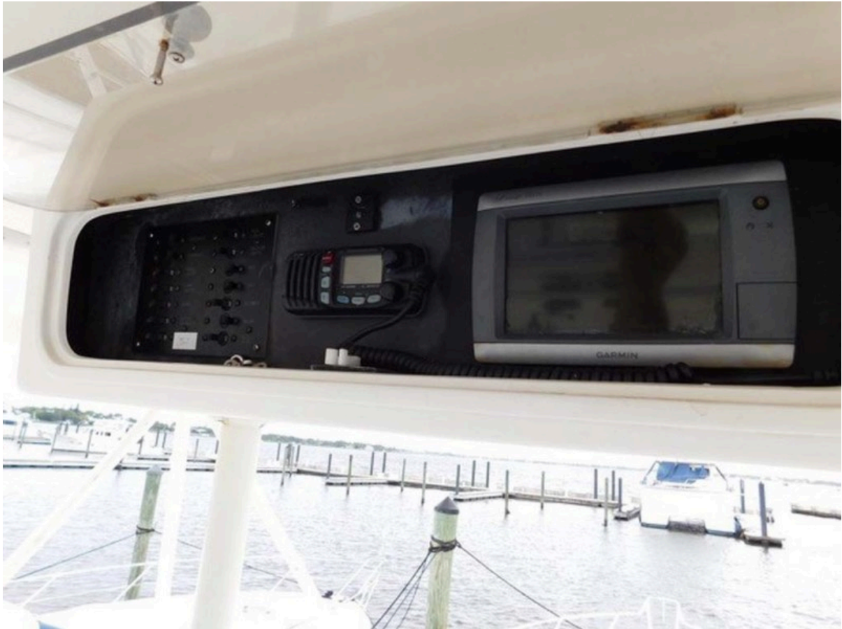
VHF and Garmin GPS