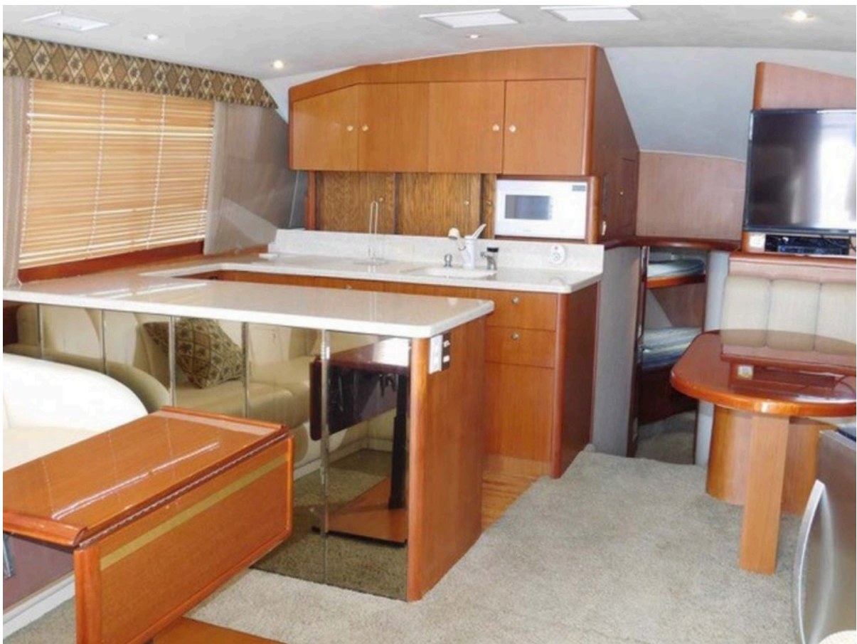
Salon Looking at Galley