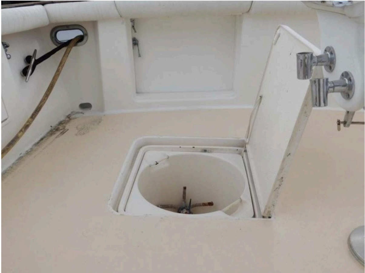
Transom Door Well