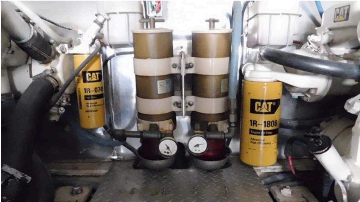
Racor Fuel Filters