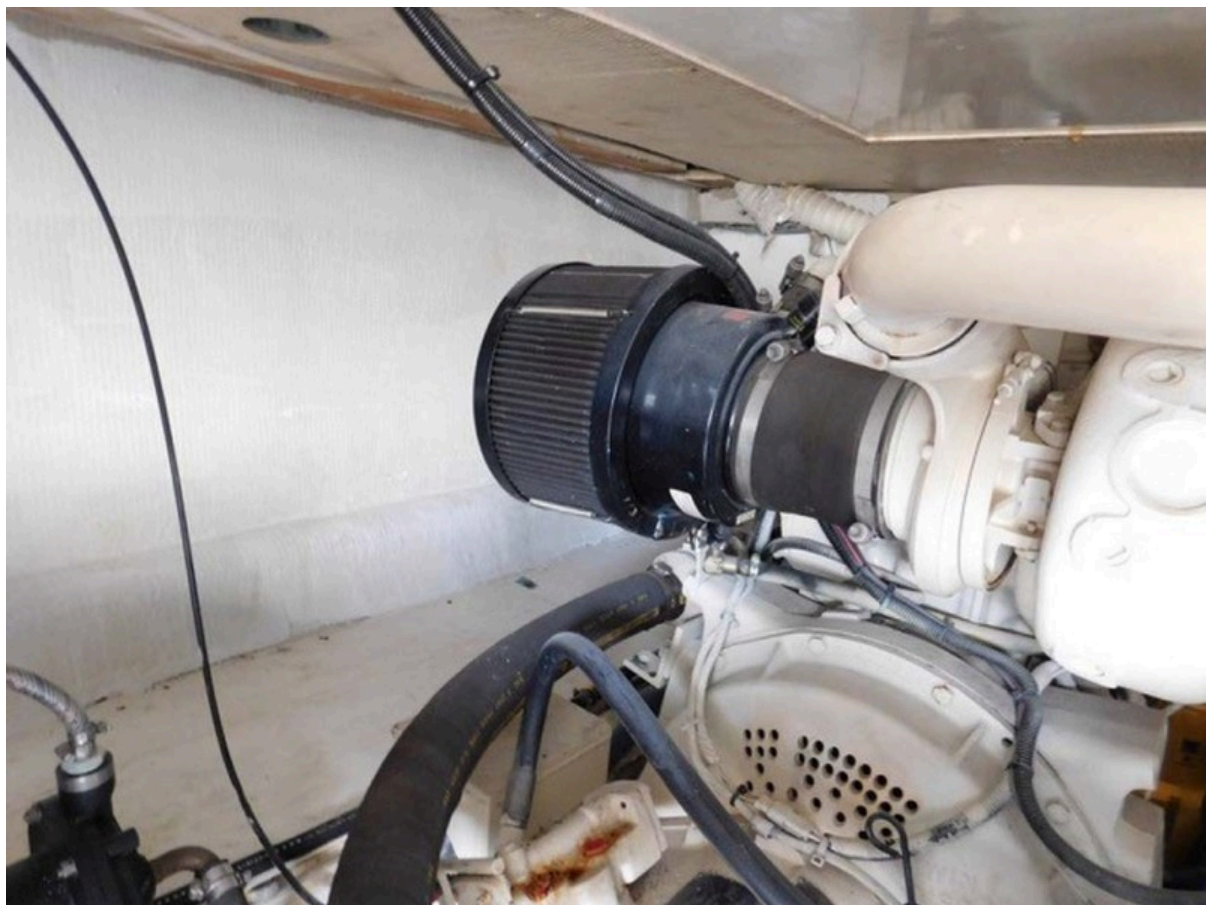
Outboard Port Engine