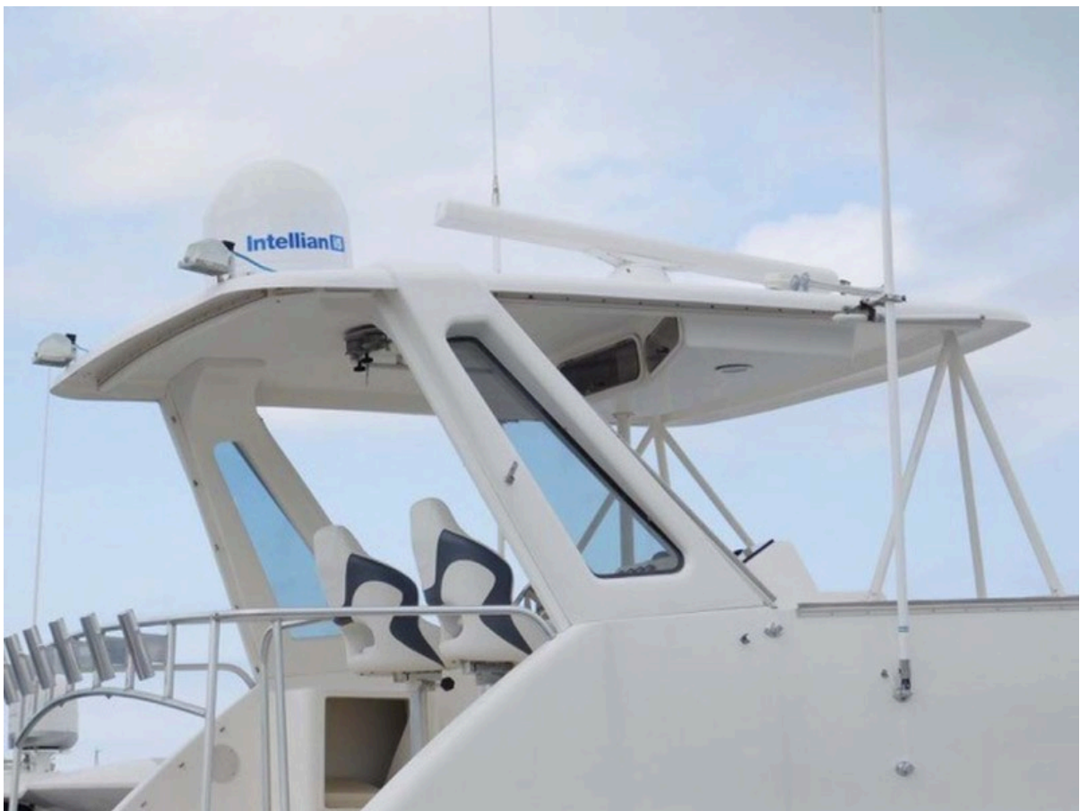
Hardtop with Open Array And Satellite