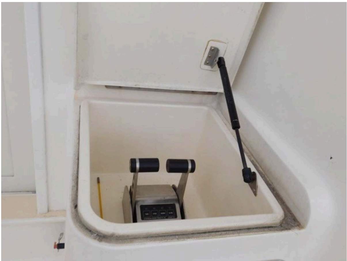
Back Down Station