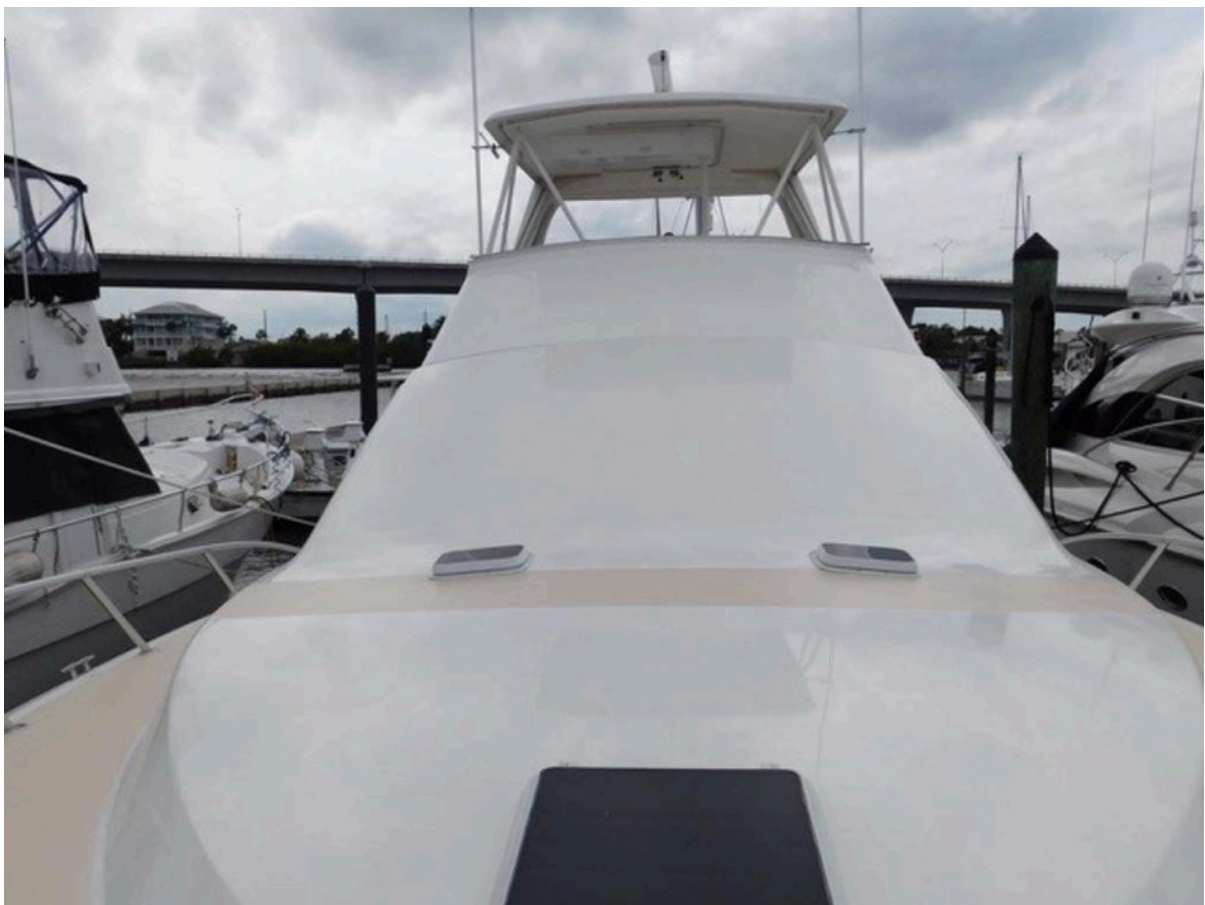
Foredeck and view of Flybridge