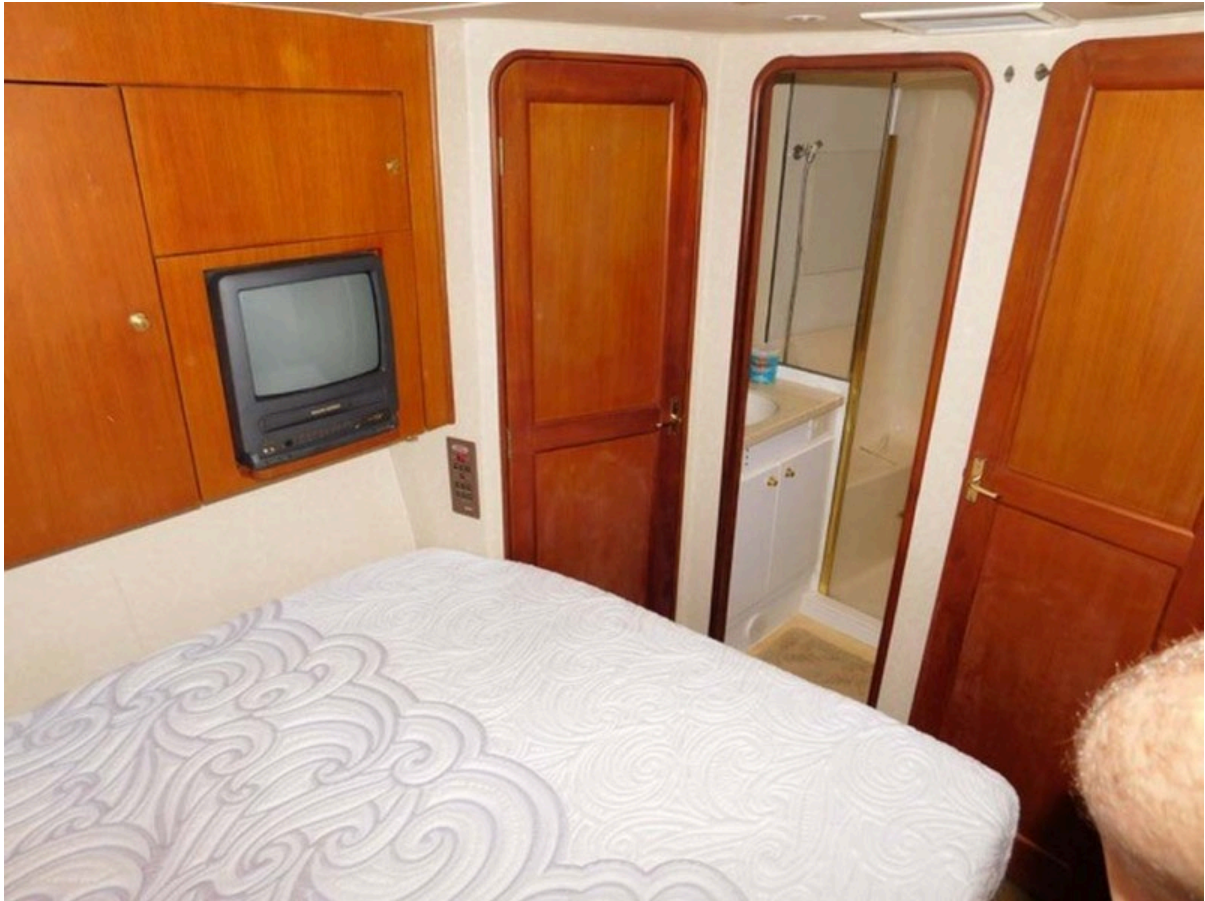
Master Stateroom Aft