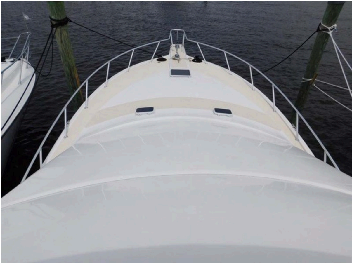
Forward Deck from Bridge