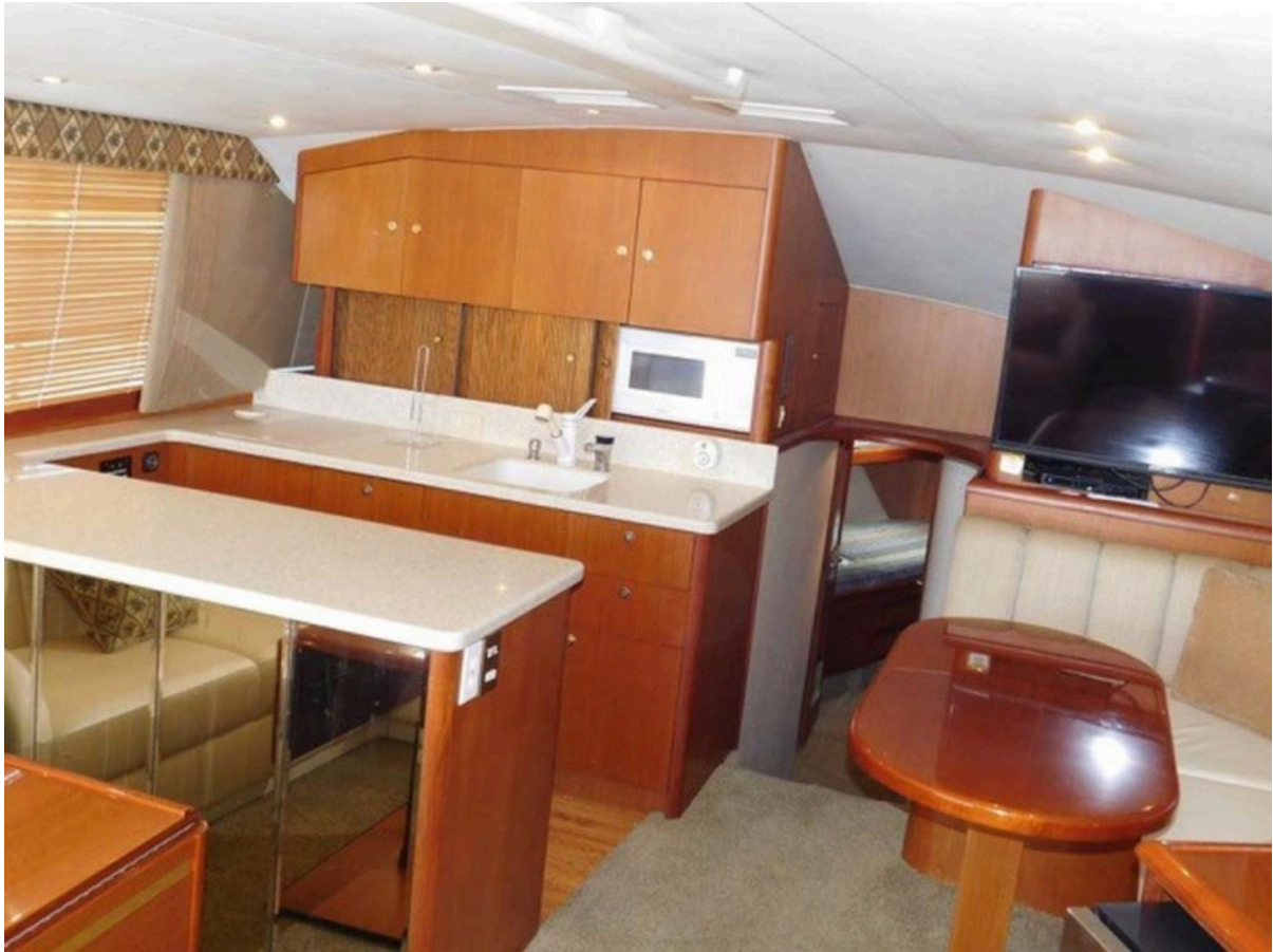
Galley and Dinette