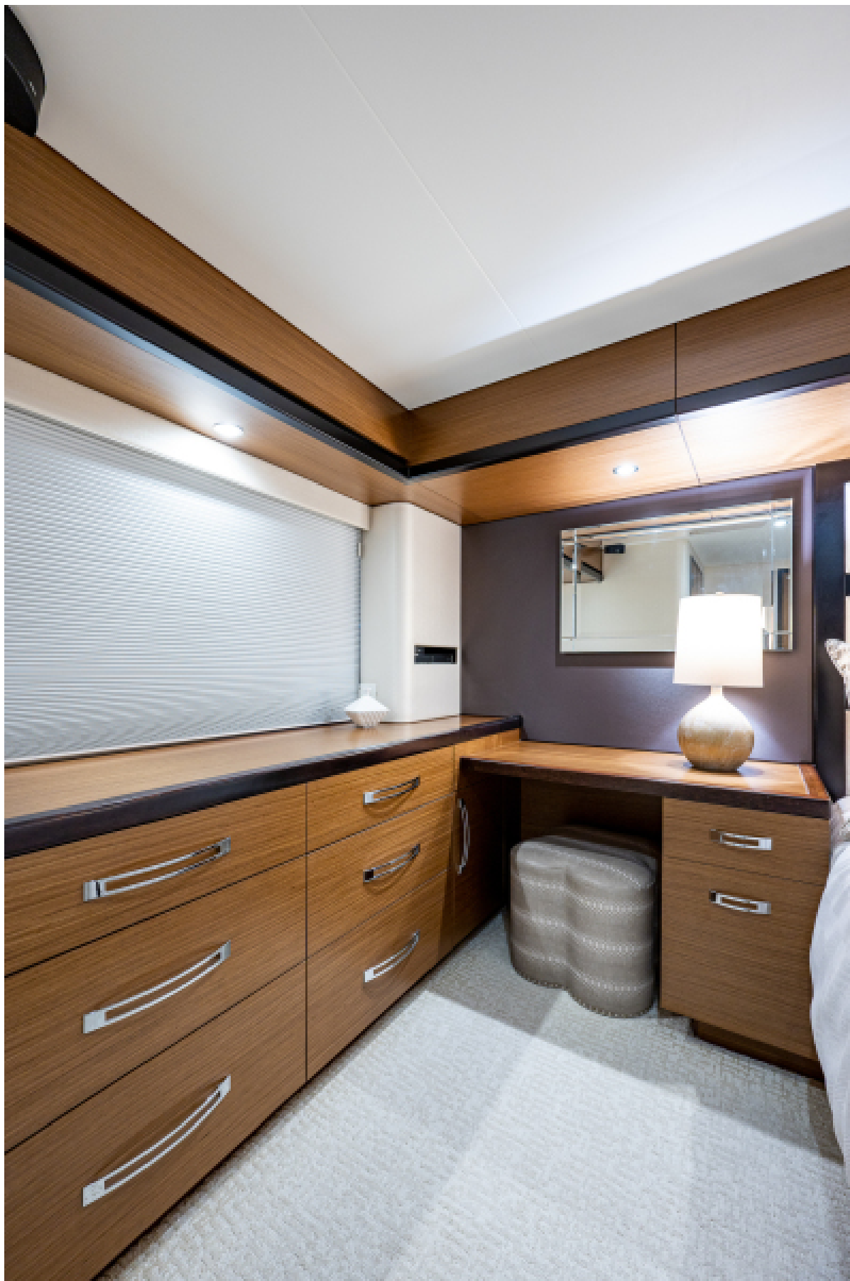
Master Stateroom Starboard 2014 Hatteras M60 GETAWAY listed by Jimmy Rogers, CPYB