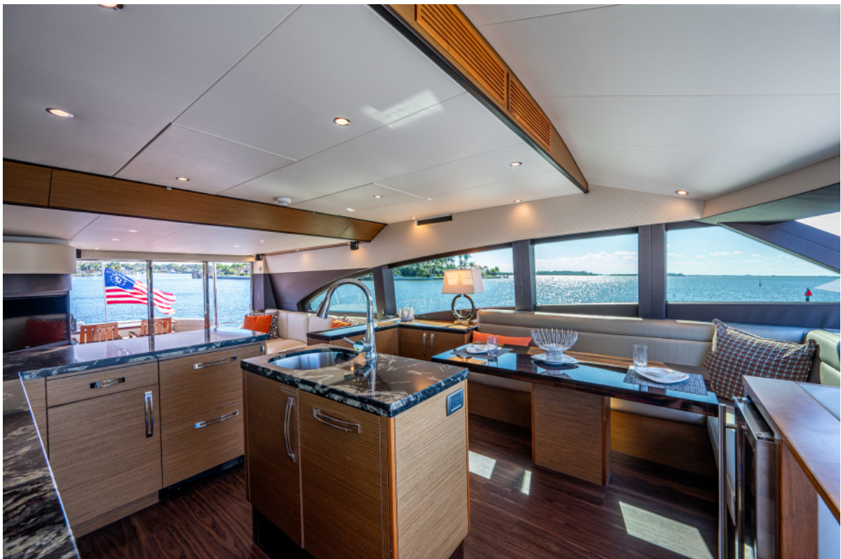
Galley and Dining Area on Main Deck 2014 Hatteras M60 GETAWAY listed by Jimmy Rogers, CPYB