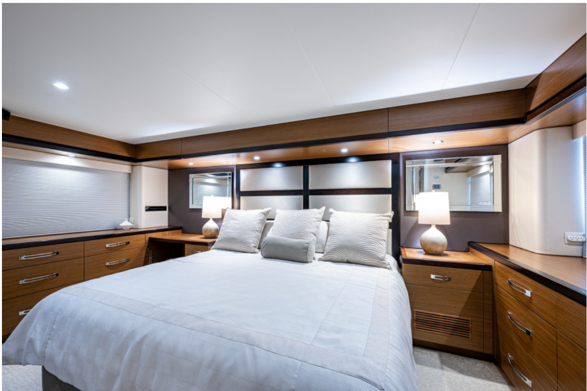
Master Stateroom with KING bed 2014 Hatteras M60 GETAWAY listed by Jimmy Rogers, CPYB