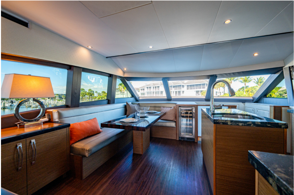
Galley and Dining Table 2014 Hatteras M60 GETAWAY listed by Jimmy Rogers, CPYB