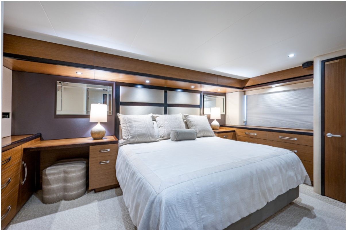
Master Stateroom with KING bed 2014 Hatteras M60 GETAWAY listed by Jimmy Rogers, CPYB