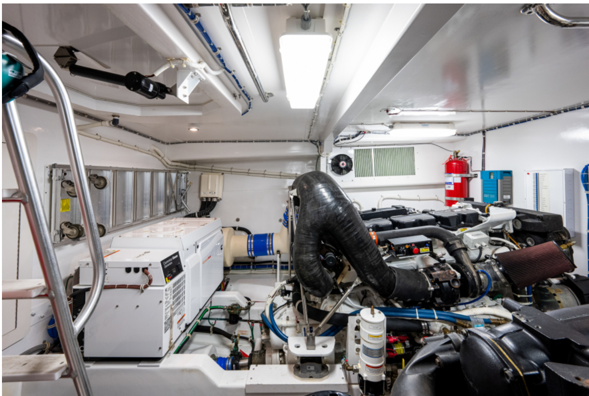
Engine Room 2014 Hatteras M60 GETAWAY listed by Jimmy Rogers, CPYB