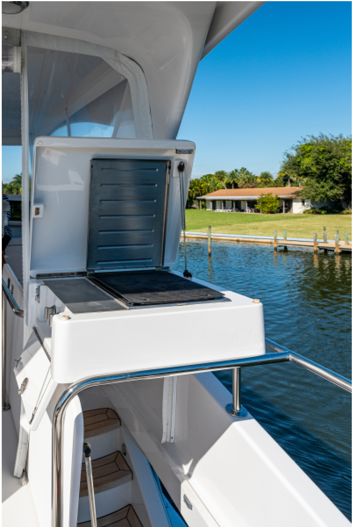
Aft Flybridge Grill 2014 Hatteras M60 GETAWAY listed by Jimmy Rogers, CPYB