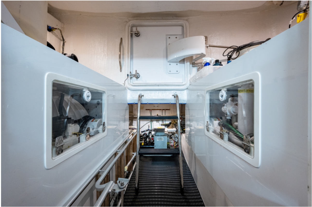
Aft Engine Room Storage and Gyros 2014 Hatteras M60 GETAWAY listed by Jimmy Rogers, CPYB