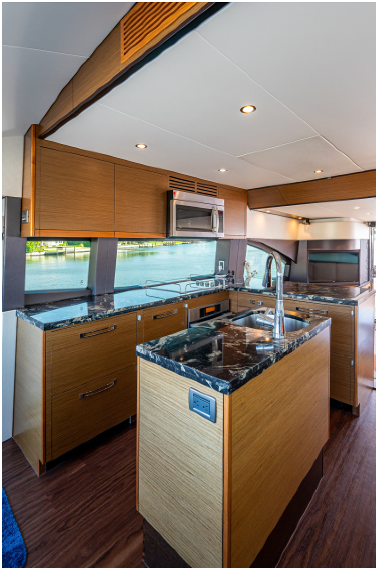
Galley with Island 2014 Hatteras M60 GETAWAY listed by Jimmy Rogers, CPYB