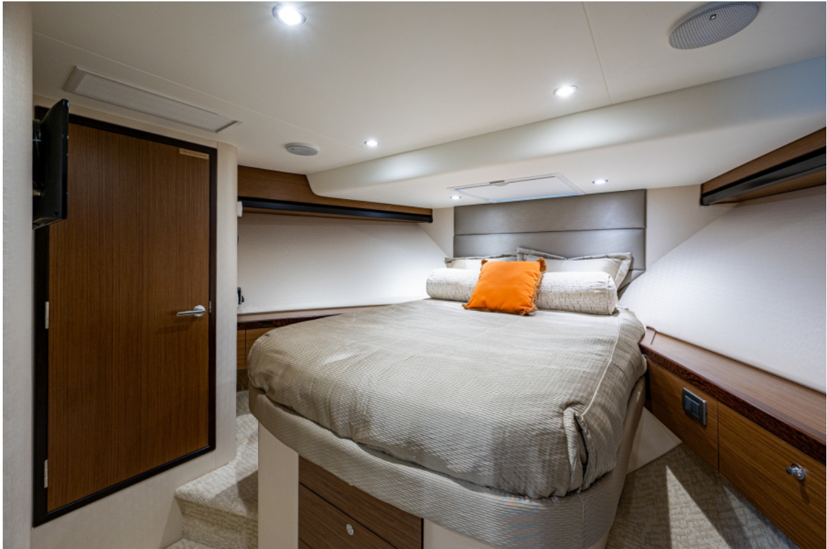
Bow VIP Stateroom 2014 Hatteras M60 GETAWAY listed by Jimmy Rogers, CPYB