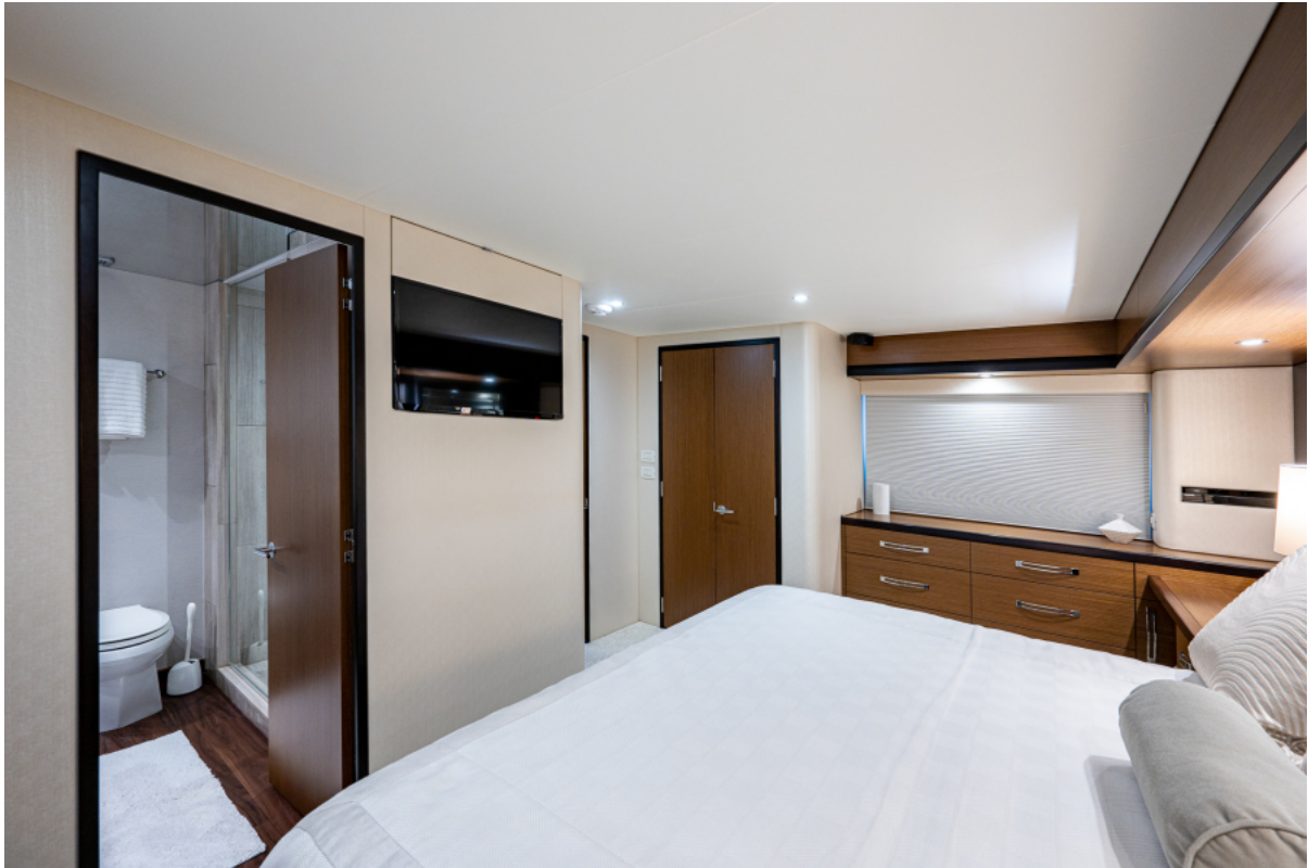
Master Stateroom with KING bed 2014 Hatteras M60 GETAWAY listed by Jimmy Rogers, CPYB