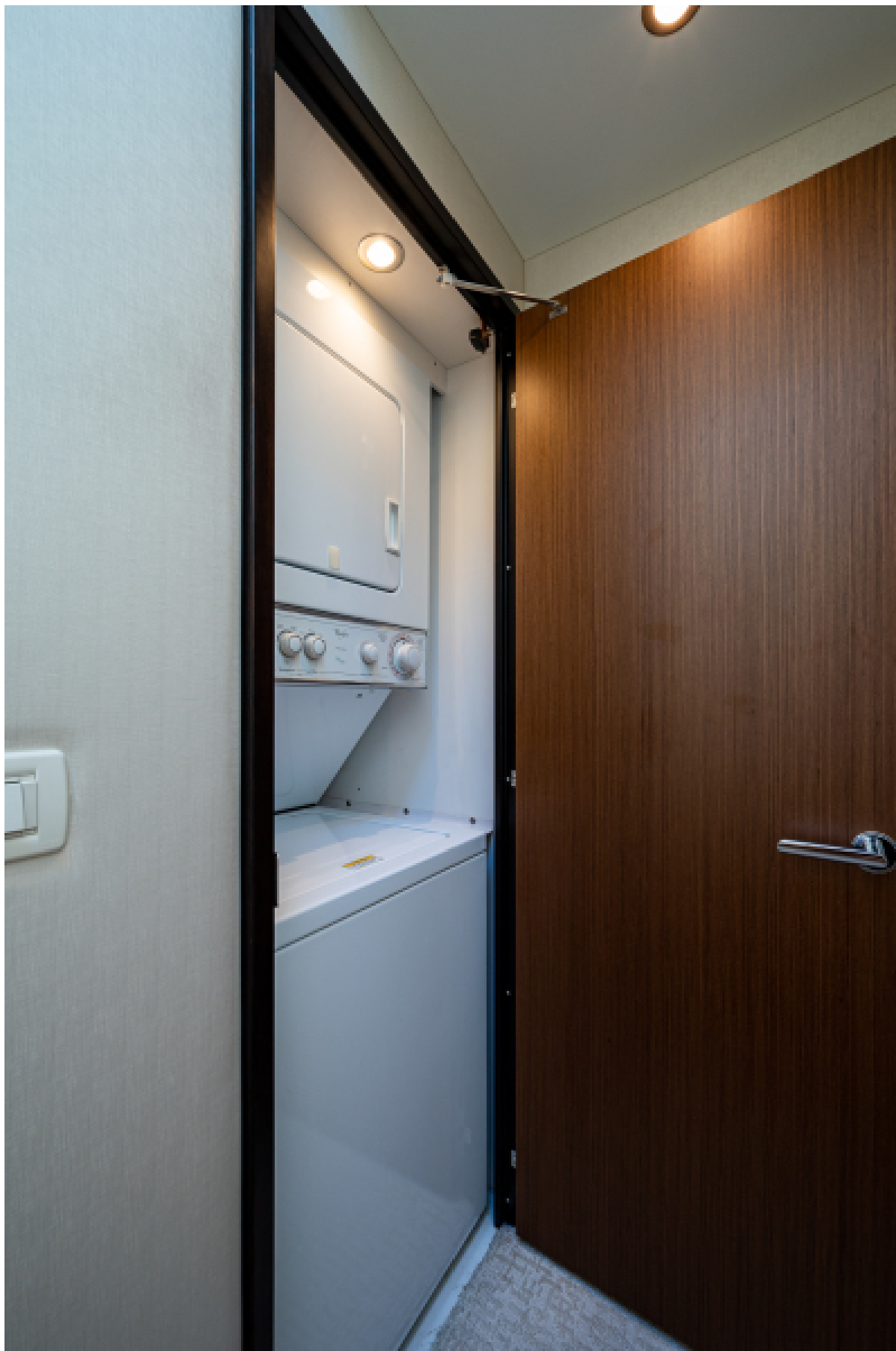
Washer and Dryer in Lower Companionway by Master Stateroom 2014 Hatteras M60 GETAWAY listed by Jimmy Rogers, CPYB