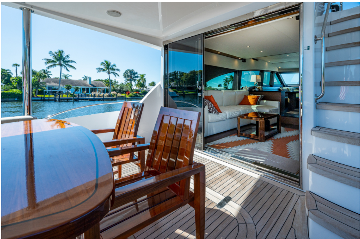
Aft Deck 2014 Hatteras M60 GETAWAY listed by Jimmy Rogers, CPYB