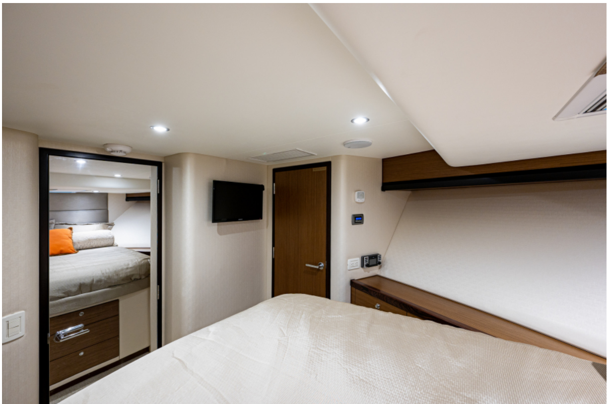
Bow VIP Stateroom 2014 Hatteras M60 GETAWAY listed by Jimmy Rogers, CPYB