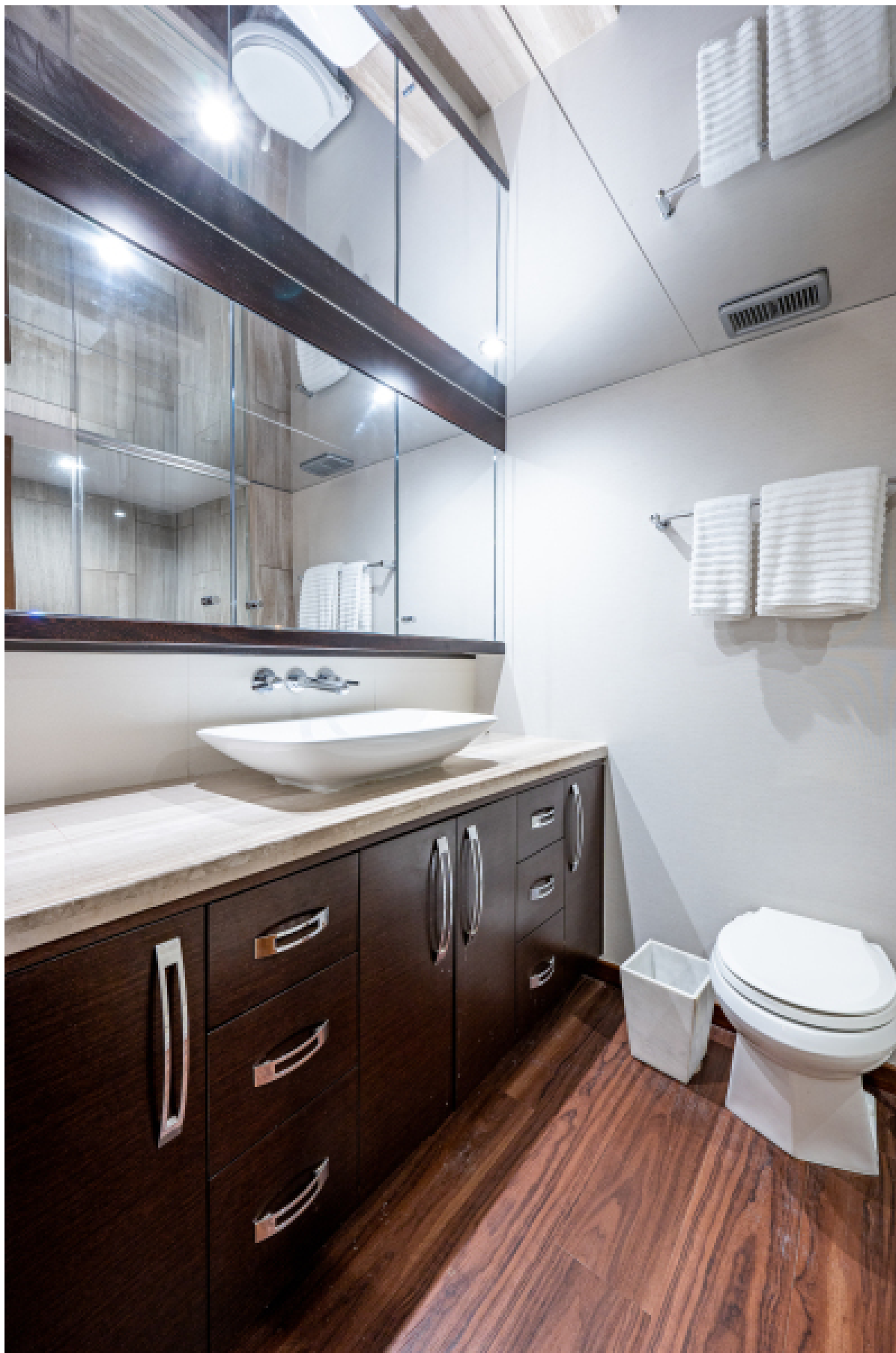
Master Head/Bath 2014 Hatteras M60 GETAWAY listed by Jimmy Rogers, CPYB