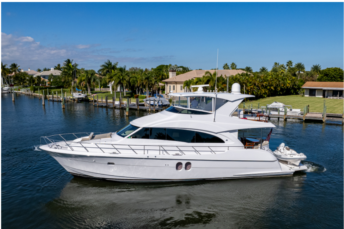
Port Profile 2014 Hatteras M60 GETAWAY listed by Jimmy Rogers, CPYB