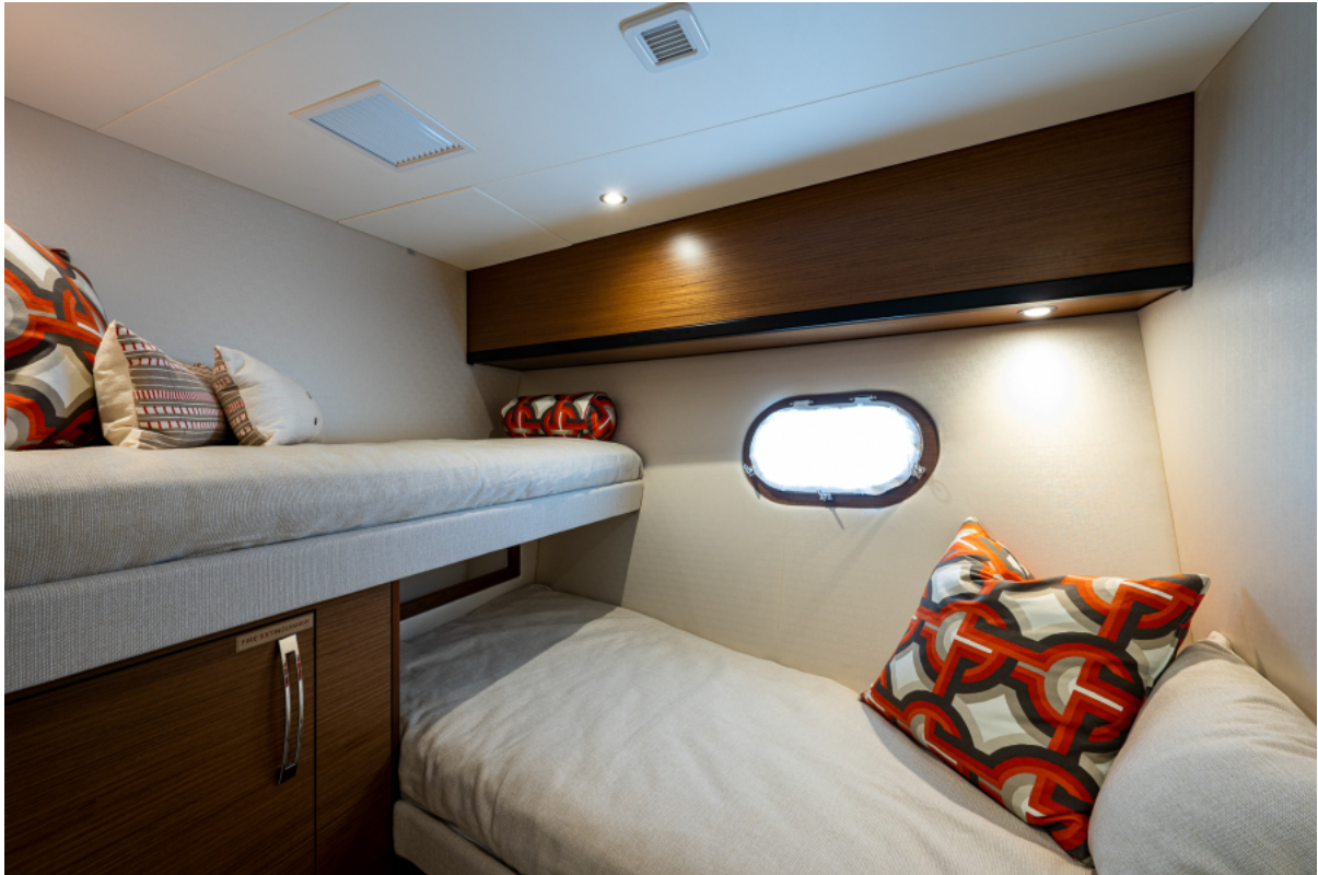
3rd Stateroom Over Under Crossed Bunks 2014 Hatteras M60 GETAWAY listed by Jimmy Rogers, CPYB