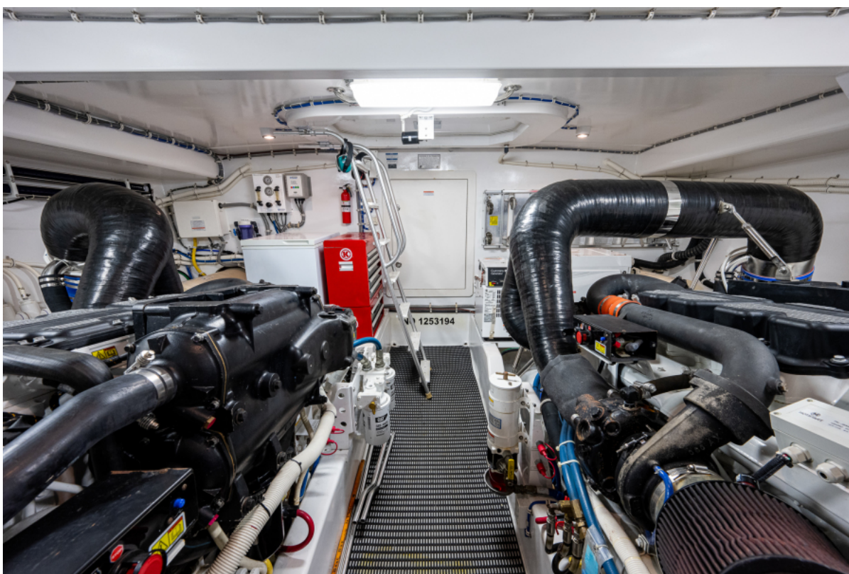
Engine Room 2014 Hatteras M60 GETAWAY listed by Jimmy Rogers, CPYB