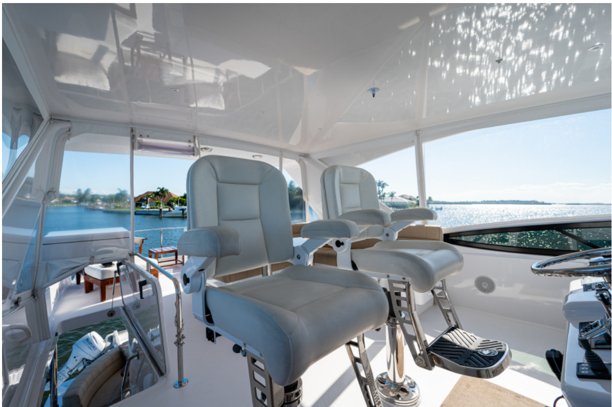
Flybridge Upper Deck (Air Conditioned) 2014 Hatteras M60 GETAWAY listed by Jimmy Rogers, CPYB