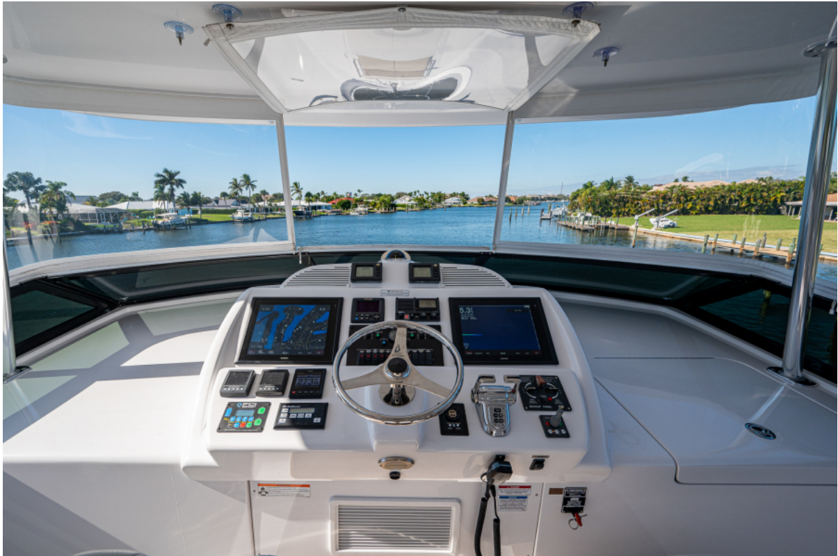
Flybridge Helm 2014 Hatteras M60 GETAWAY listed by Jimmy Rogers, CPYB