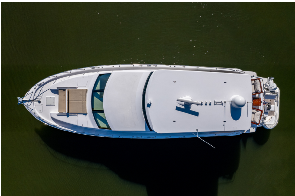
Overhead 2014 Hatteras M60 GETAWAY listed by Jimmy Rogers, CPYB