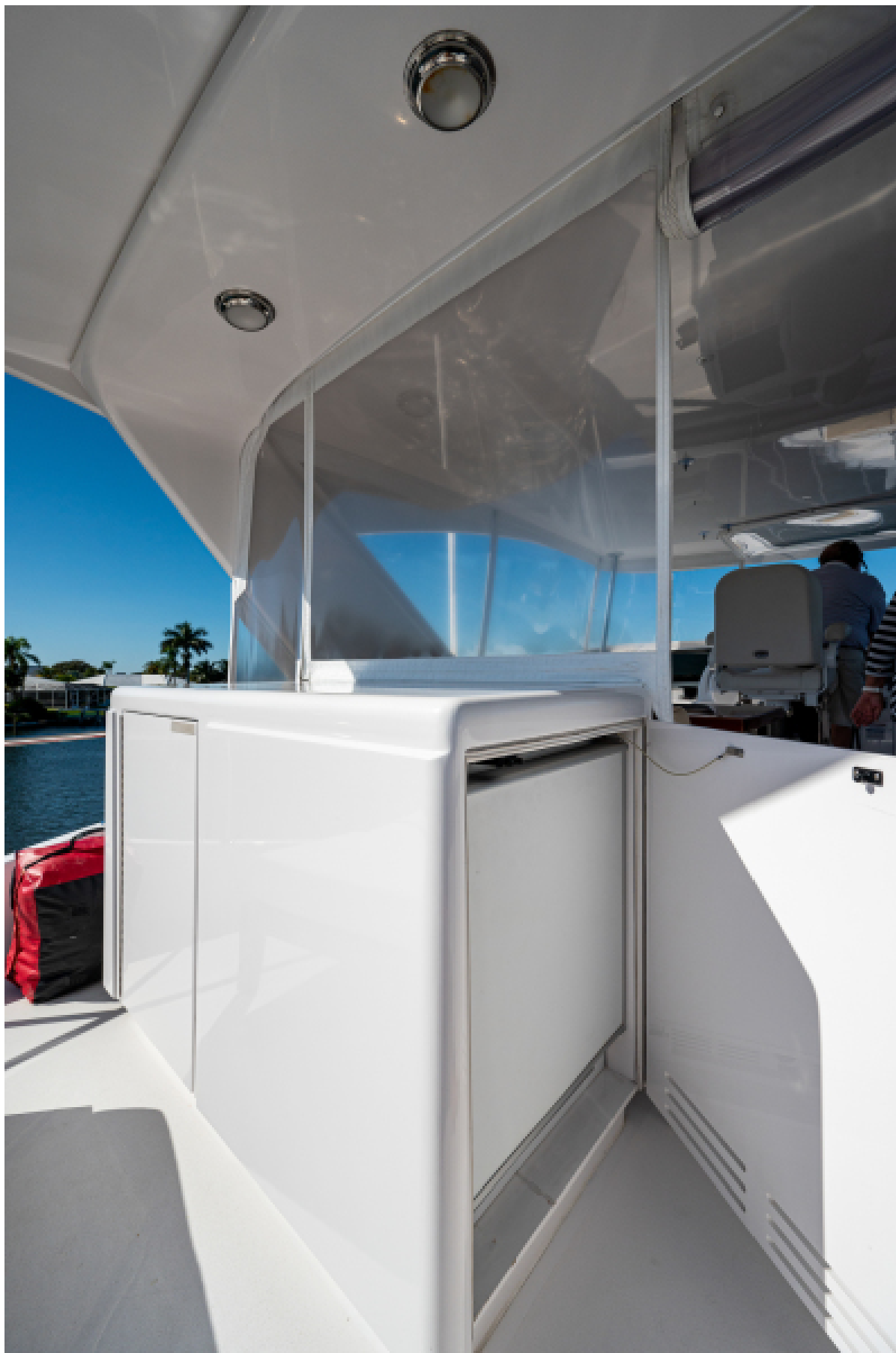
Aft Flybridge Fridge with Icemaker and Storage 2014 Hatteras M60 GETAWAY listed by Jimmy Rogers, CPYB