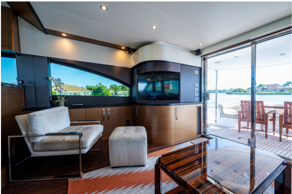
Salon Starboard 2014 Hatteras M60 GETAWAY listed by Jimmy Rogers, CPYB