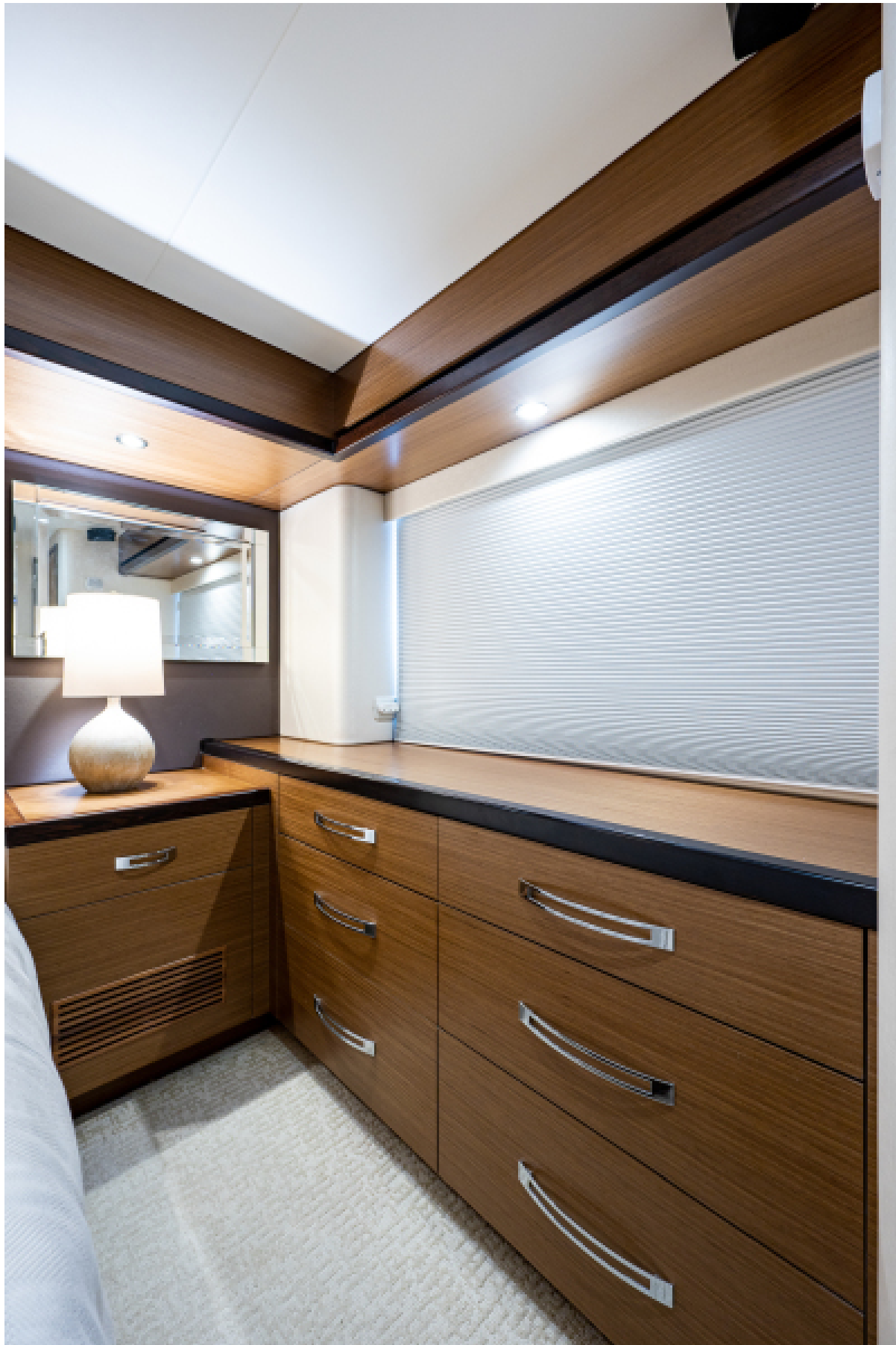
Master Stateroom Port 2014 Hatteras M60 GETAWAY listed by Jimmy Rogers, CPYB