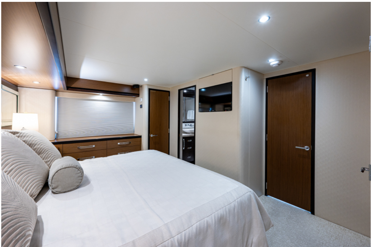
Master Stateroom with KING Bed 2014 Hatteras M60 GETAWAY listed by Jimmy Rogers, CPYB