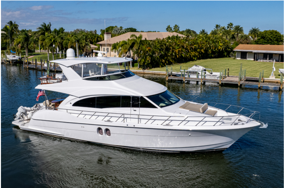
Starboard Profile 2014 Hatteras M60 GETAWAY listed by Jimmy Rogers, CPYB