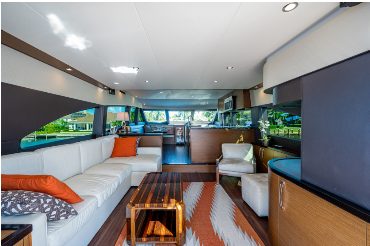
Salon 2014 Hatteras M60 GETAWAY listed by Jimmy Rogers, CPYB