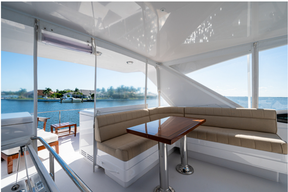
Flybridge Seating/Dining Area 2014 Hatteras M60 GETAWAY listed by Jimmy Rogers, CPYB