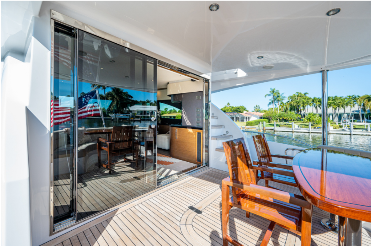
Aft Deck 2014 Hatteras M60 GETAWAY listed by Jimmy Rogers, CPYB