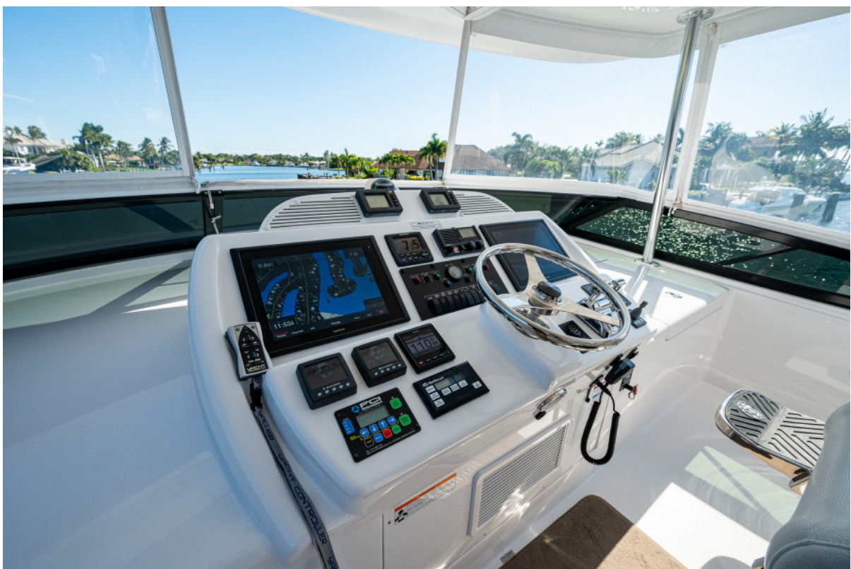
Flybridge Helm 2014 Hatteras M60 GETAWAY listed by Jimmy Rogers, CPYB