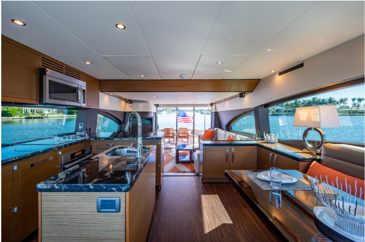
Galley and Dining Area on Main Deck 2014 Hatteras M60 GETAWAY listed by Jimmy Rogers, CPYB