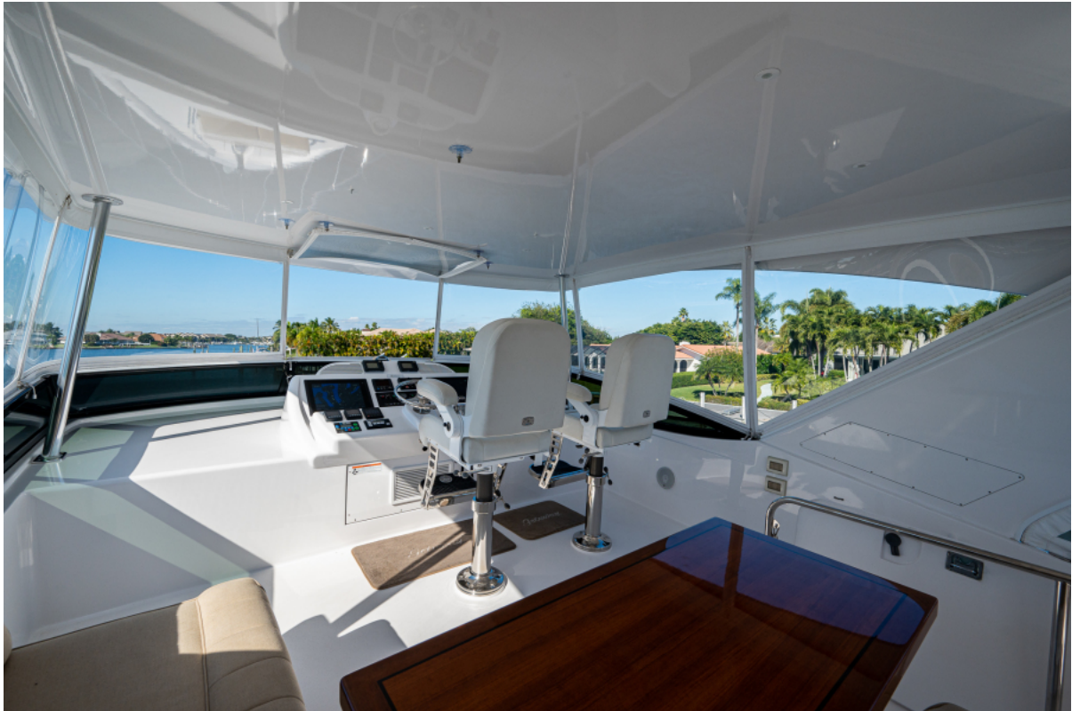
Air Conditioned Flybridge Area 2014 Hatteras M60 GETAWAY listed by Jimmy Rogers, CPYB