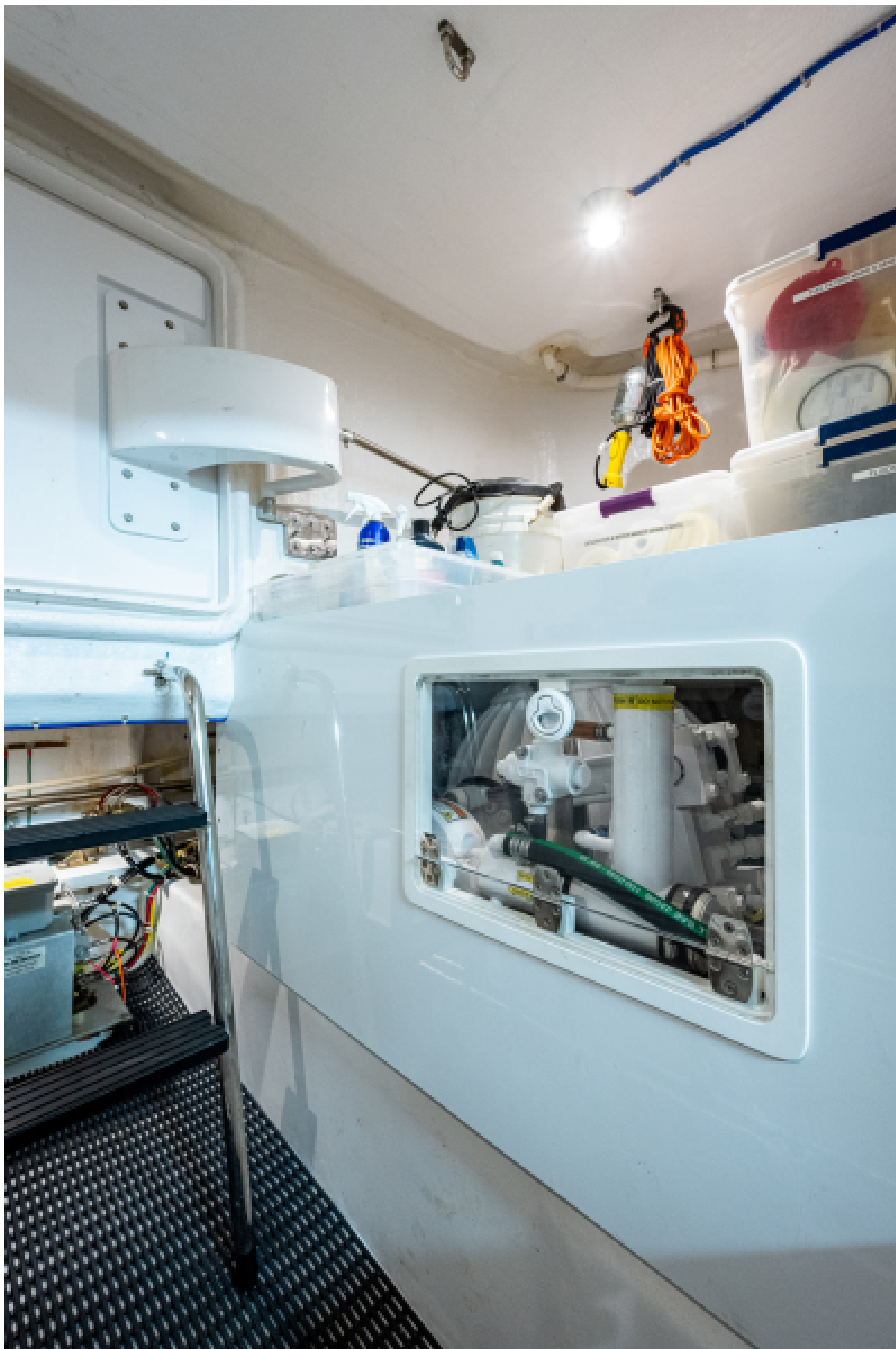
Aft Engine Room Storage and Gyros 2014 Hatteras M60 GETAWAY listed by Jimmy Rogers, CPYB