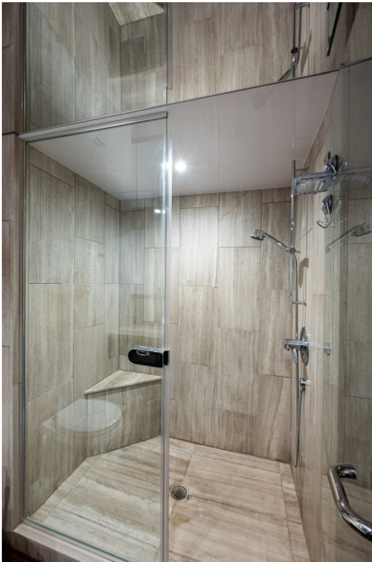
Master Head/Bath Shower 2014 Hatteras M60 GETAWAY listed by Jimmy Rogers, CPYB