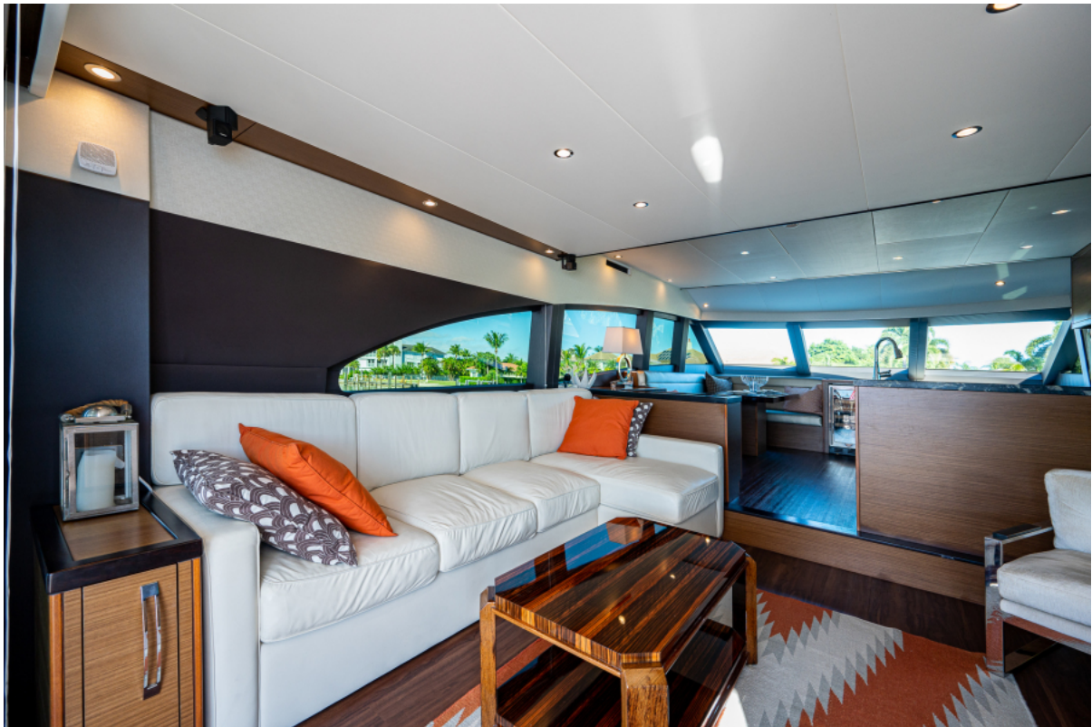
Salon Port Sofa 2014 Hatteras M60 GETAWAY listed by Jimmy Rogers, CPYB