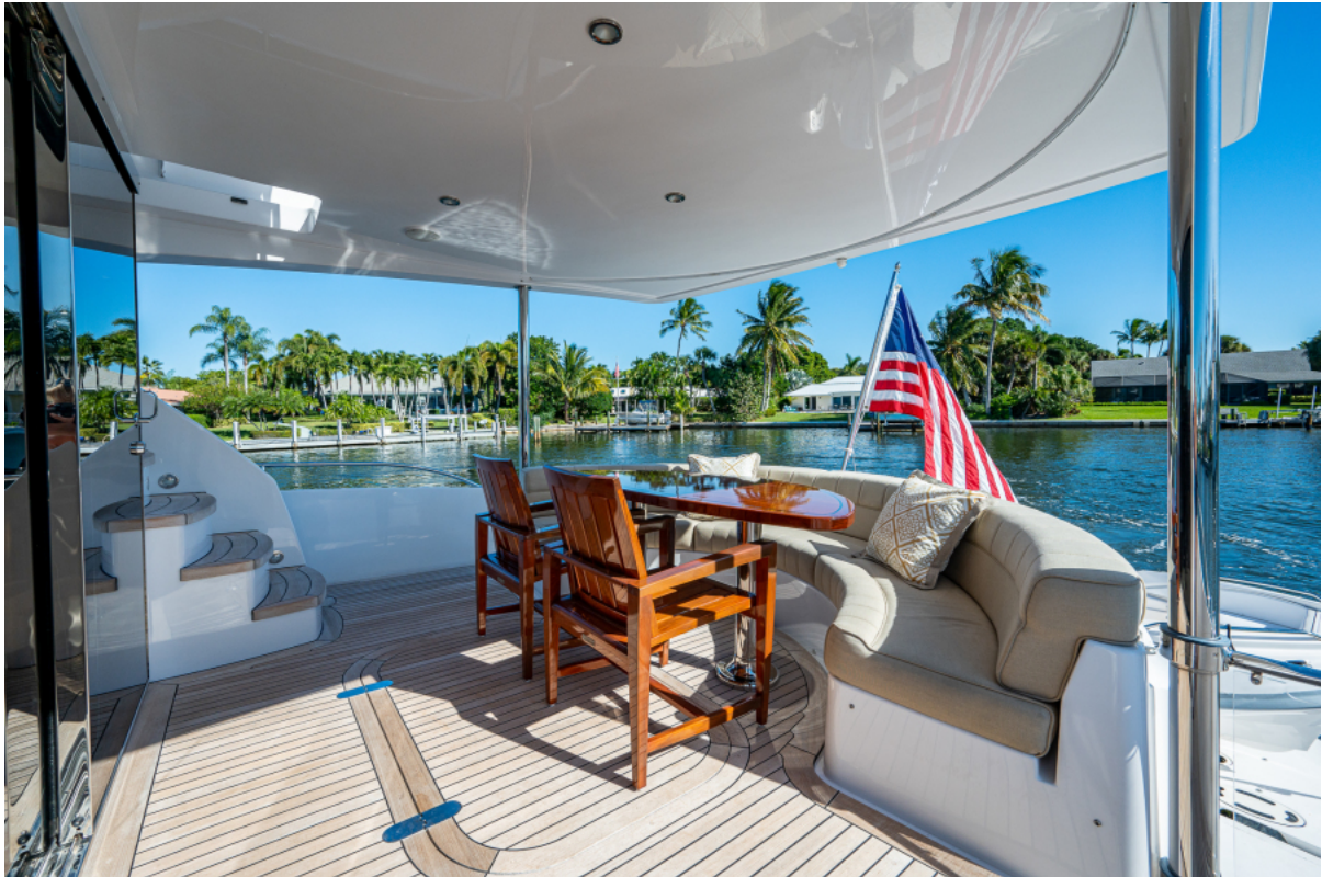
Aft Deck 2014 Hatteras M60 GETAWAY listed by Jimmy Rogers, CPYB