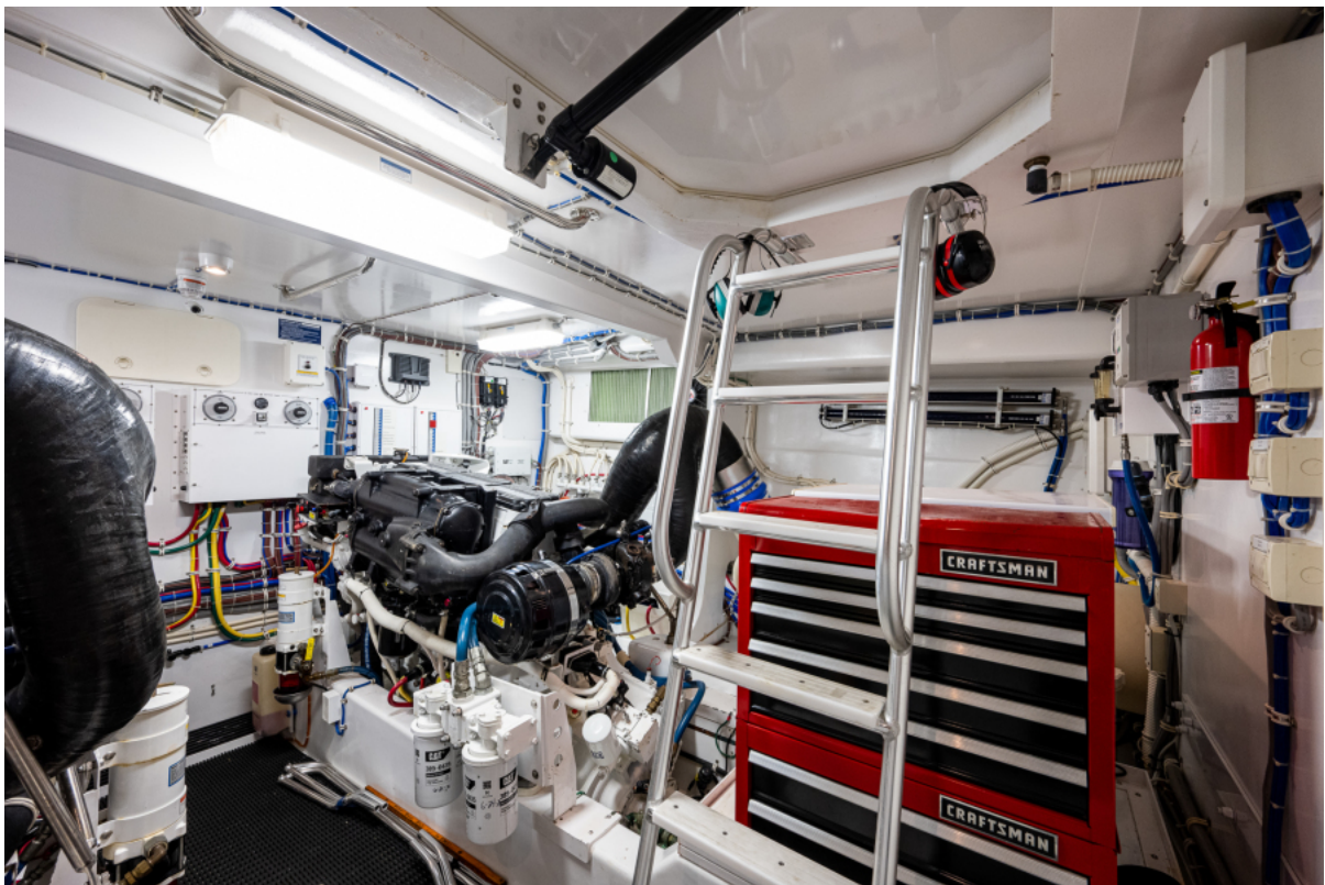
Engine Room 2014 Hatteras M60 GETAWAY listed by Jimmy Rogers, CPYB