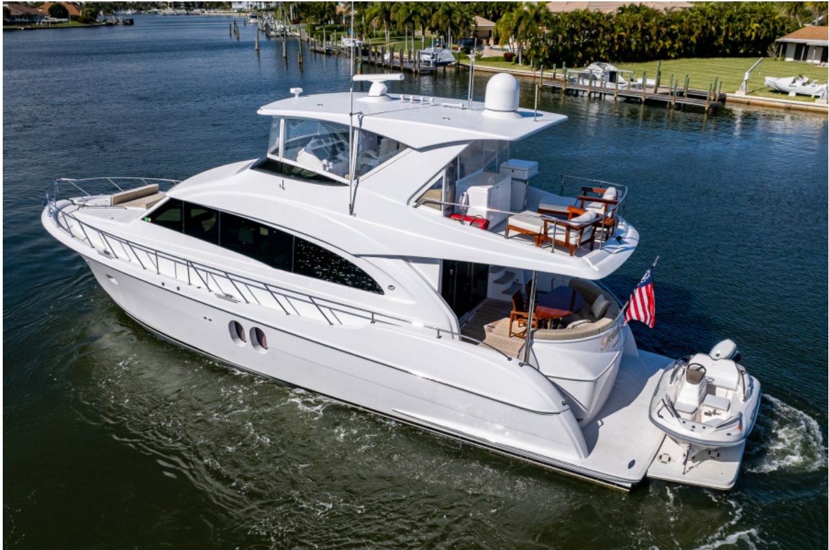
Port Aft Profile 2014 Hatteras M60 GETAWAY listed by Jimmy Rogers, CPYB