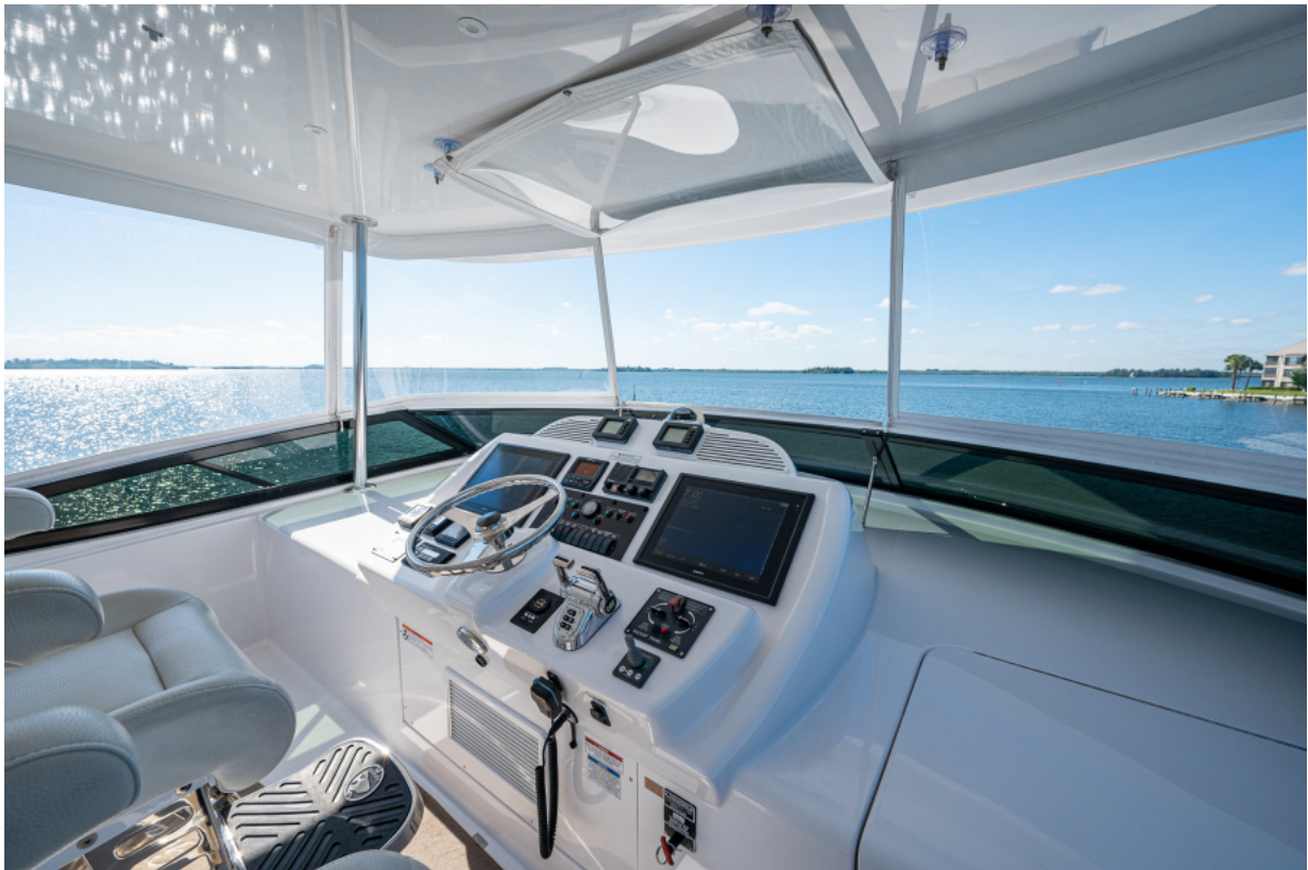
Flybridge Helm Station 2014 Hatteras M60 GETAWAY listed by Jimmy Rogers, CPYB