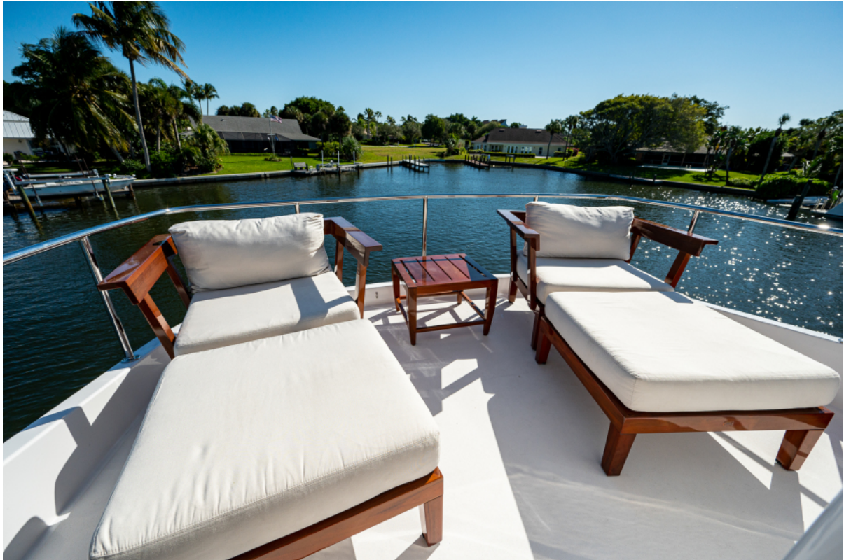
Aft Flybridge Lounge Space 2014 Hatteras M60 GETAWAY listed by Jimmy Rogers, CPYB