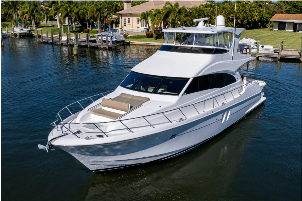
Bow Port 2014 Hatteras M60 GETAWAY listed by Jimmy Rogers, CPYB