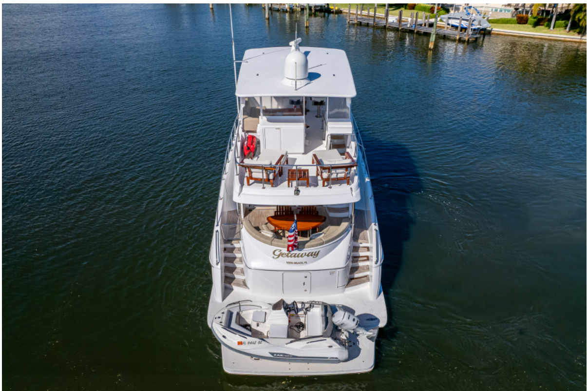
Stern 2014 Hatteras M60 GETAWAY listed by Jimmy Rogers, CPYB