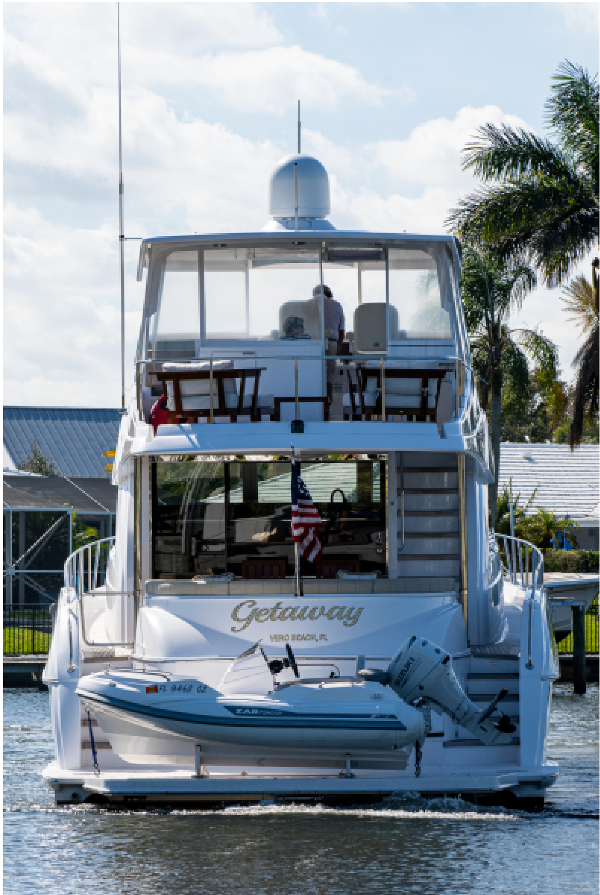
Stern 2014 Hatteras M60 GETAWAY listed by Jimmy Rogers, CPYB