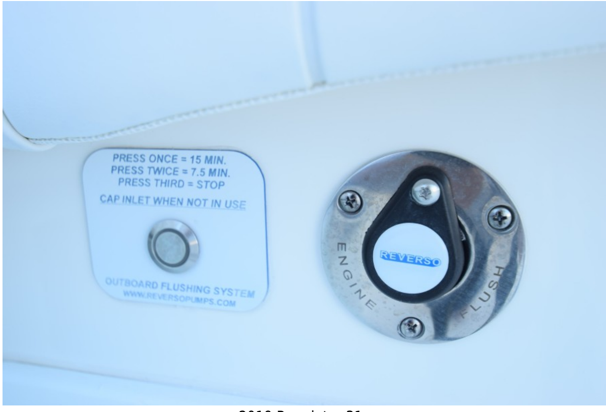
2019 Regulator 31