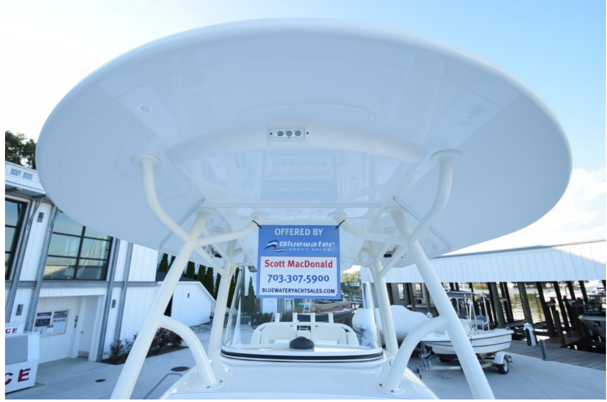
2019 Regulator 31 2019 Regulator 31