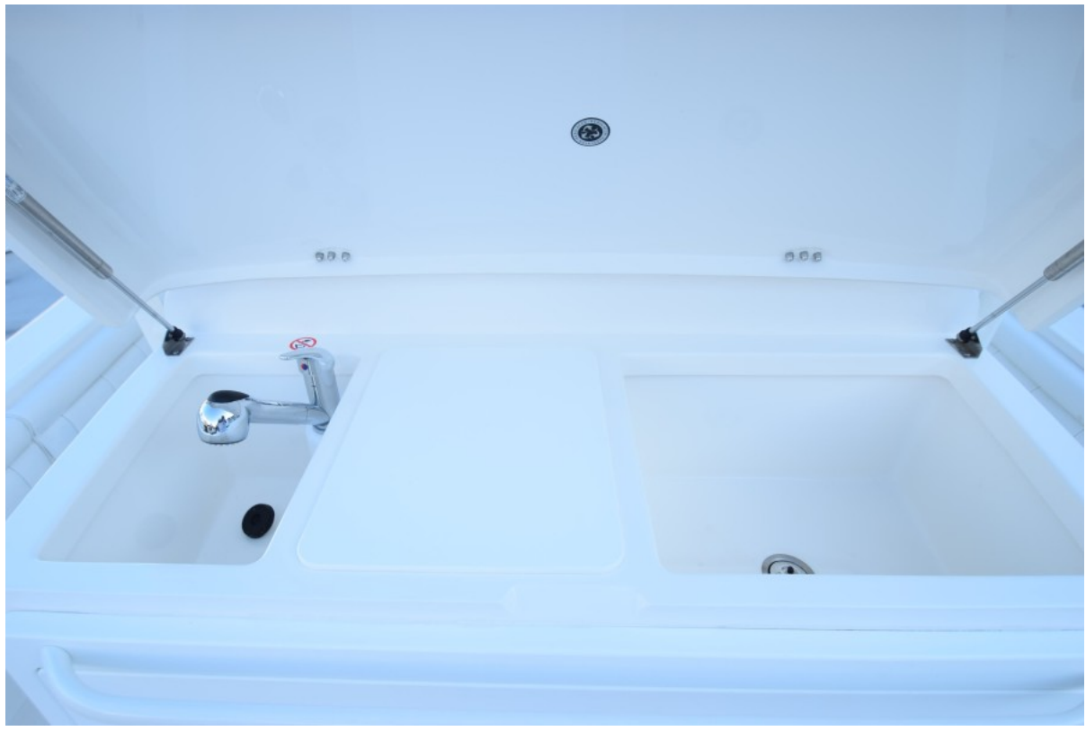
2019 Regulator 31