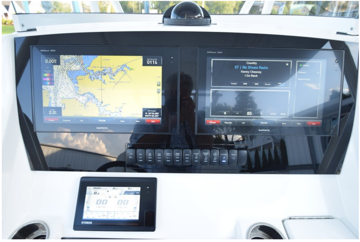
2019 Regulator 31