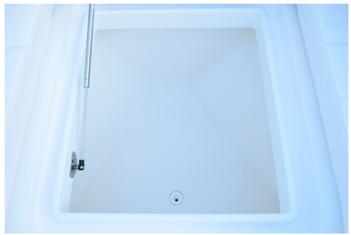
2019 Regulator 31