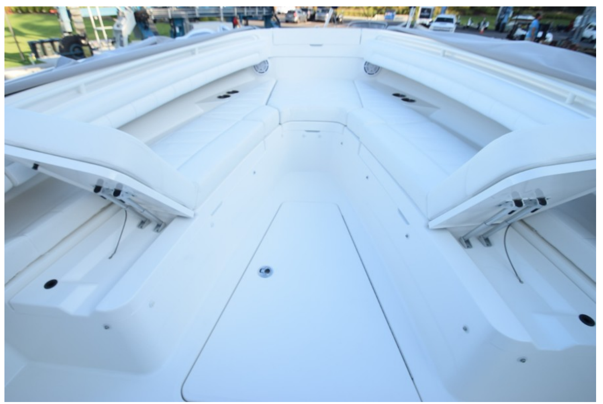
2019 Regulator 31