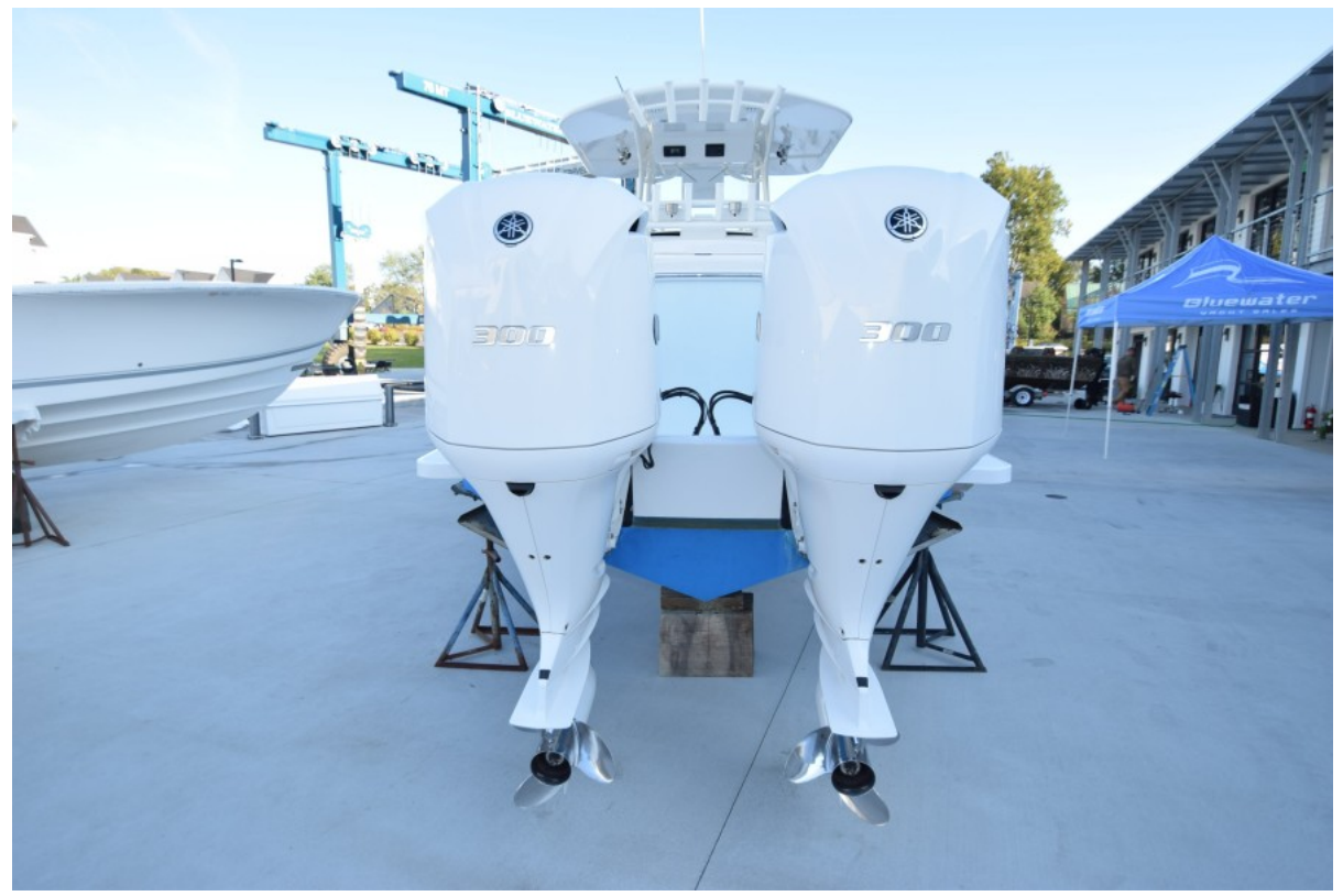
2019 Regulator 31