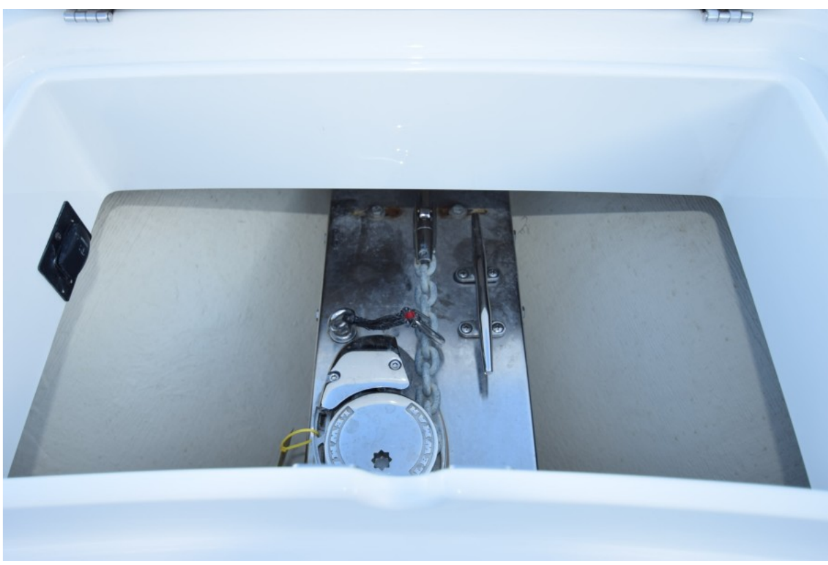
2019 Regulator 31