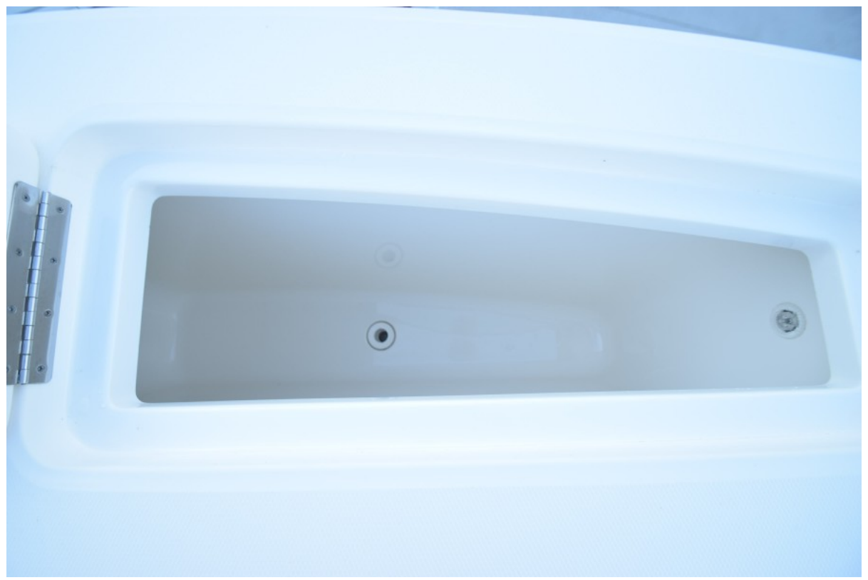
2019 Regulator 31