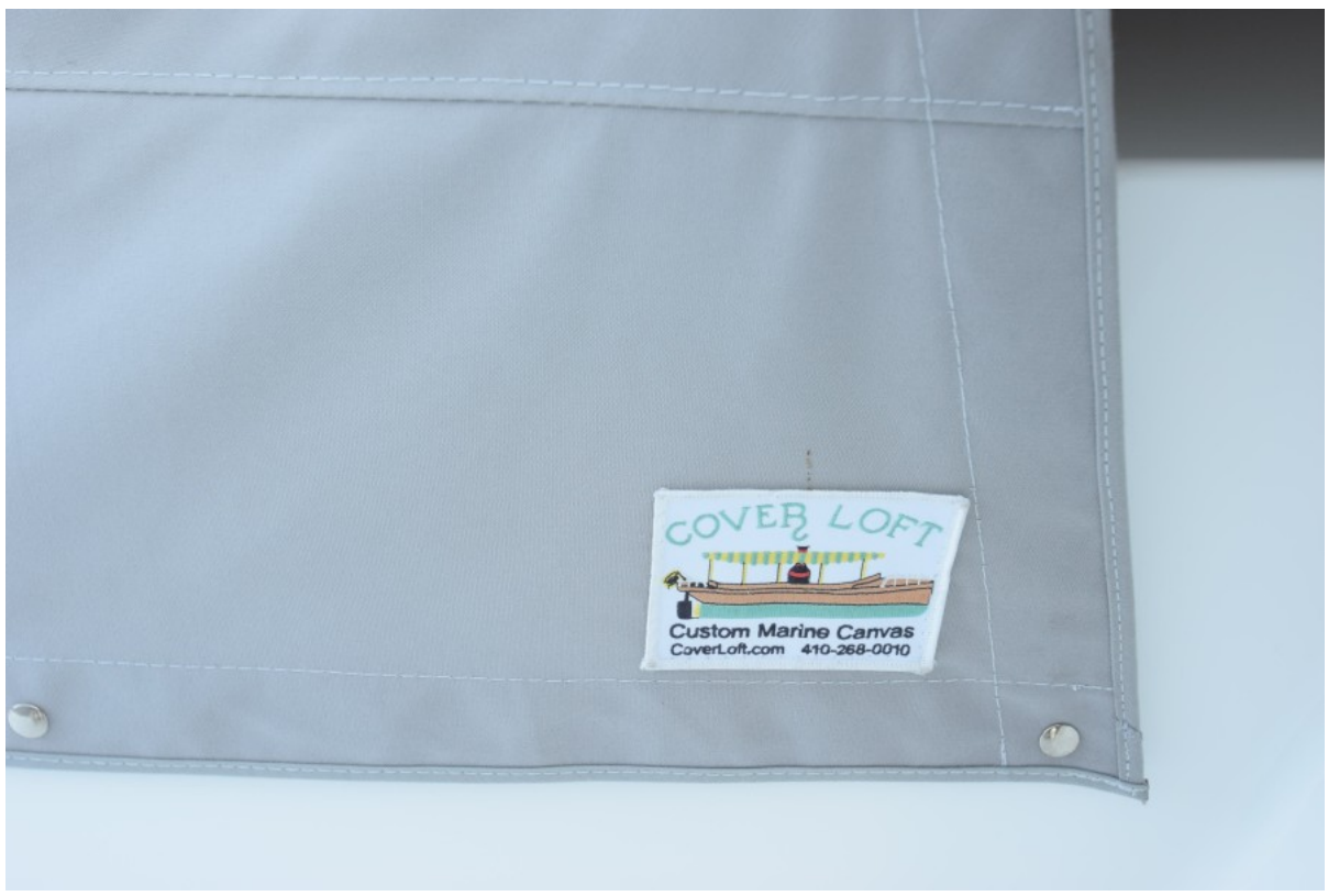
2019 Regulator 31