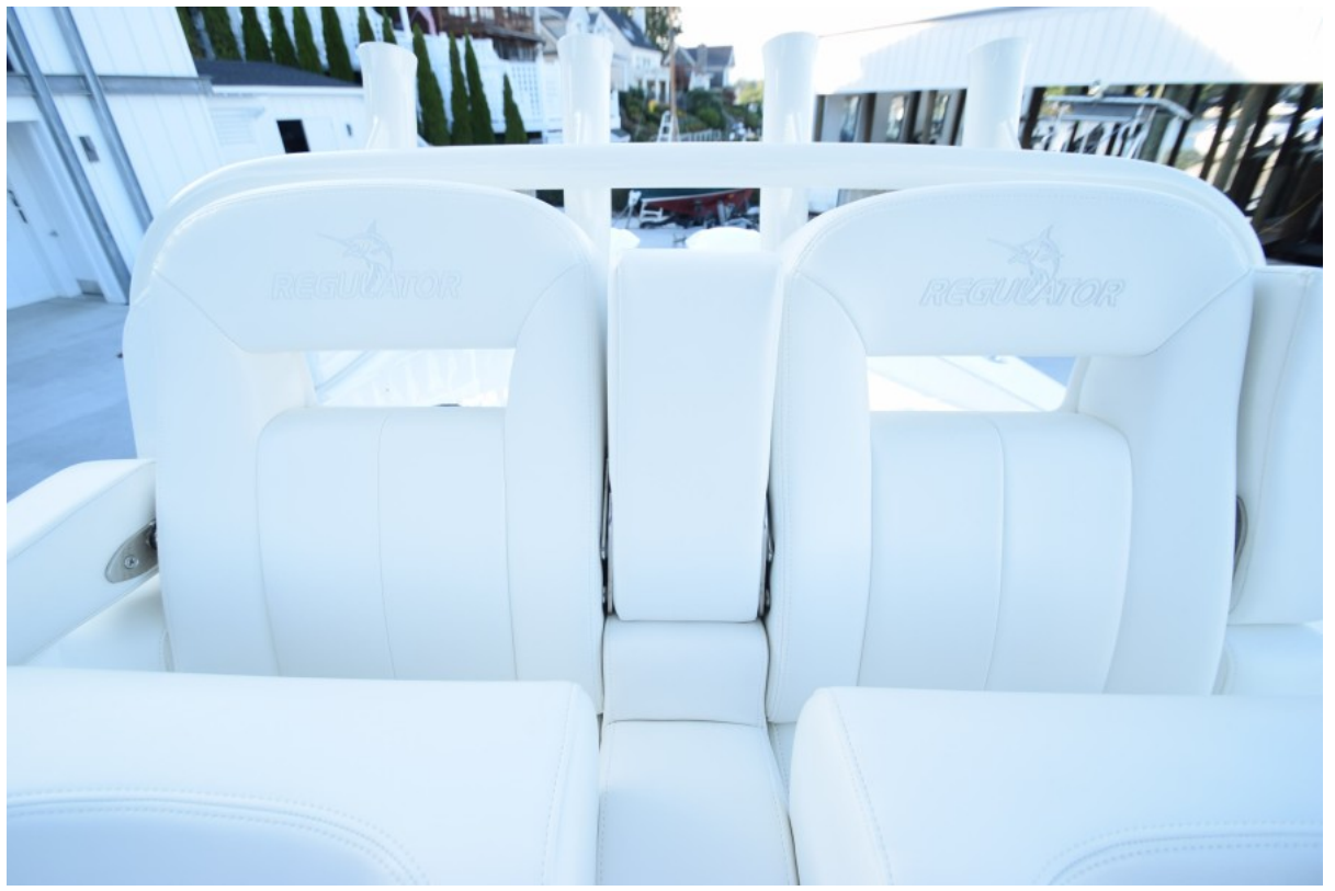
2019 Regulator 31