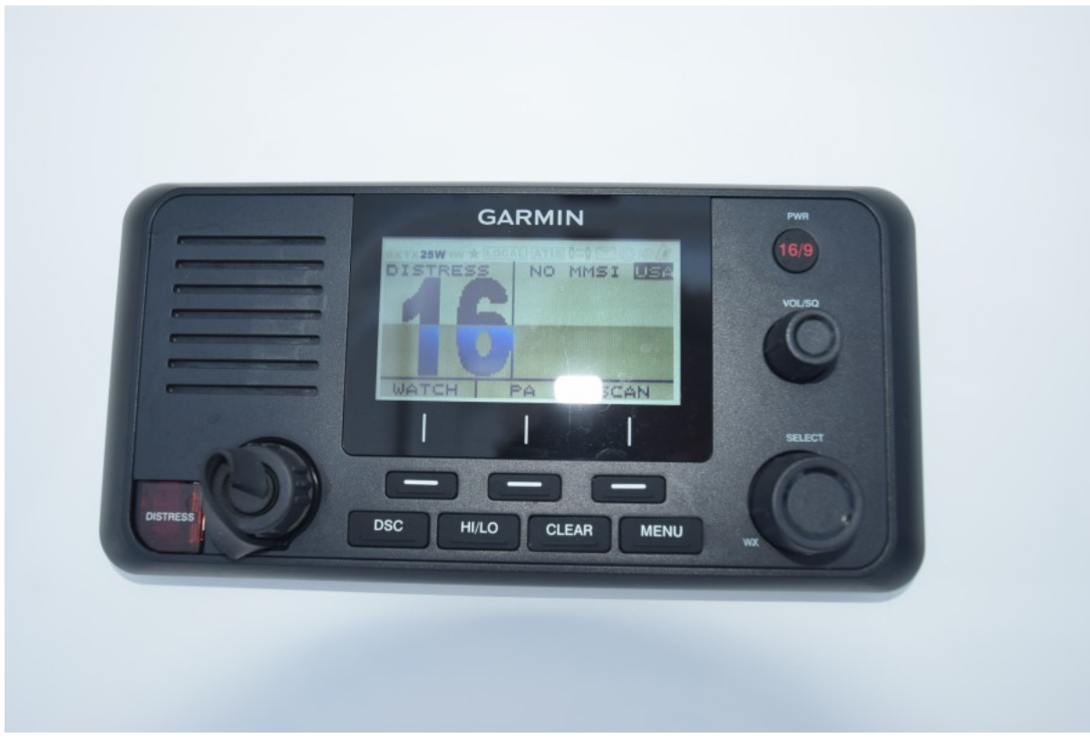
2019 Regulator 31