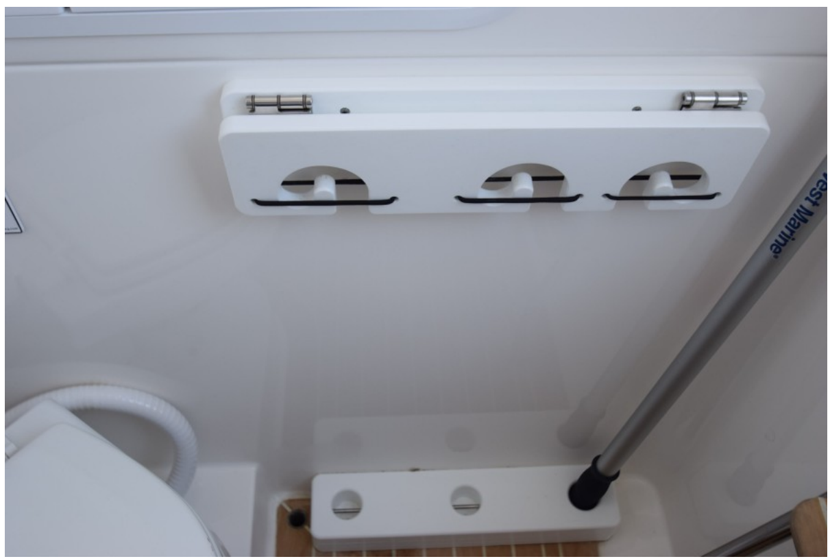
2019 Regulator 31