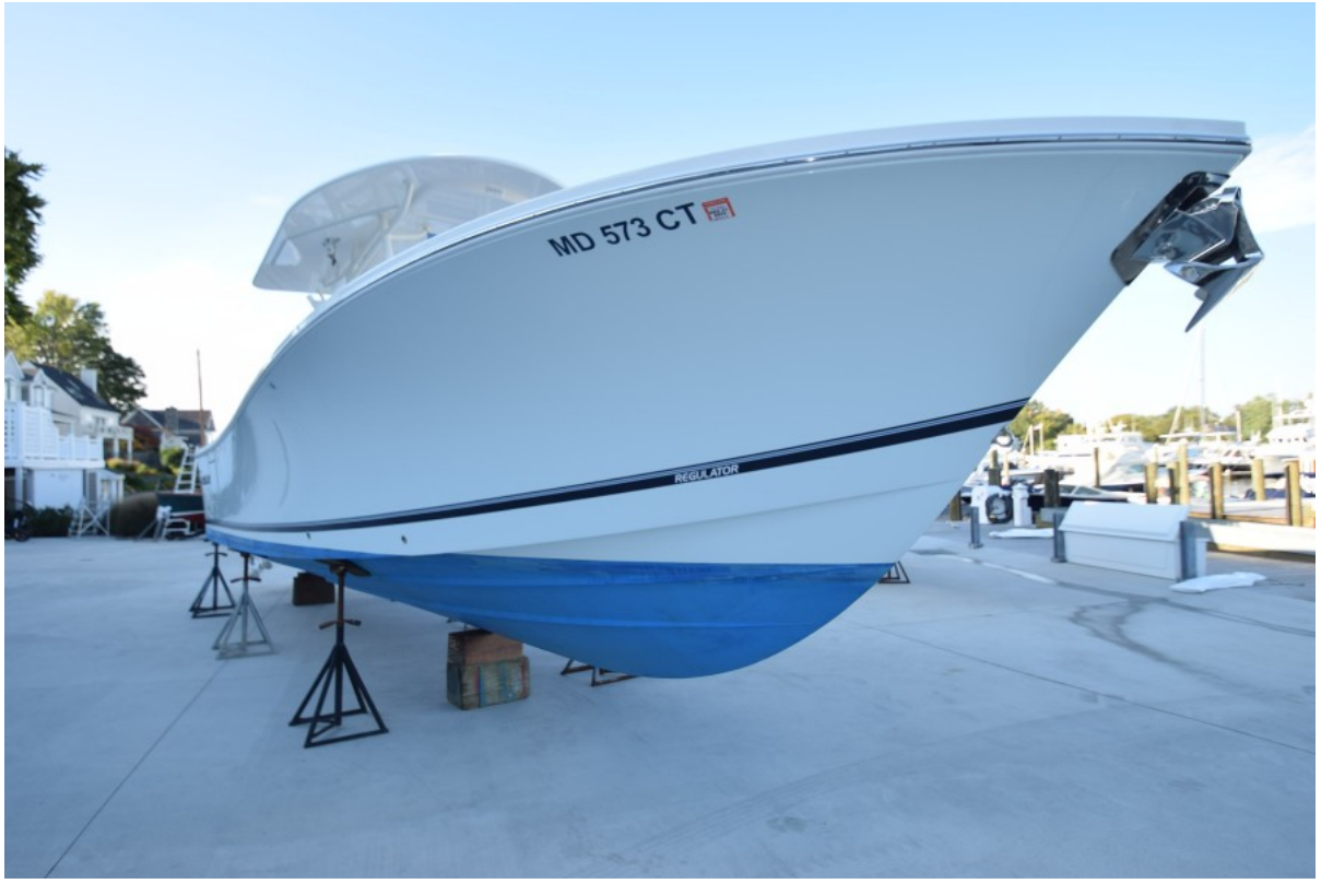
2019 Regulator 31