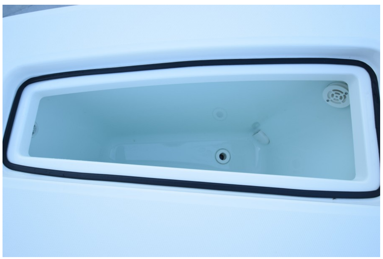
2019 Regulator 31