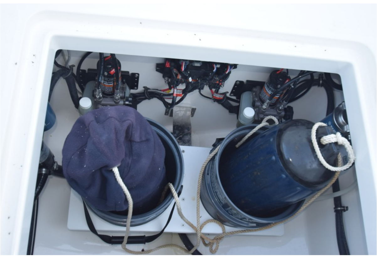
2019 Regulator 31