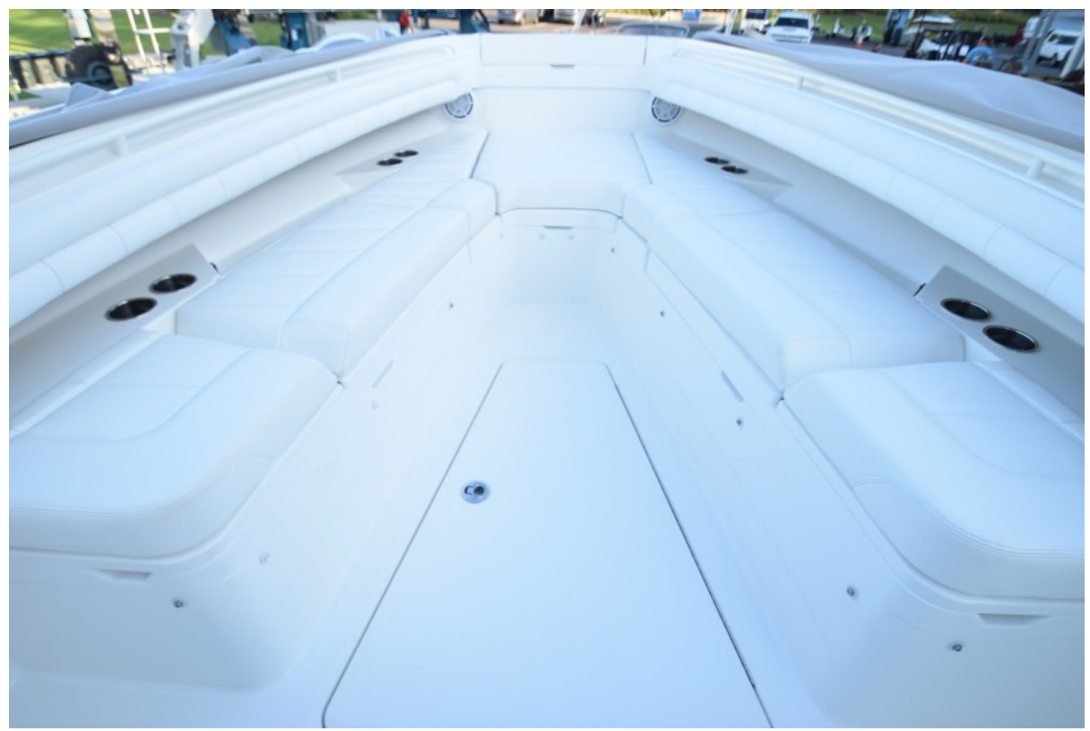
2019 Regulator 31