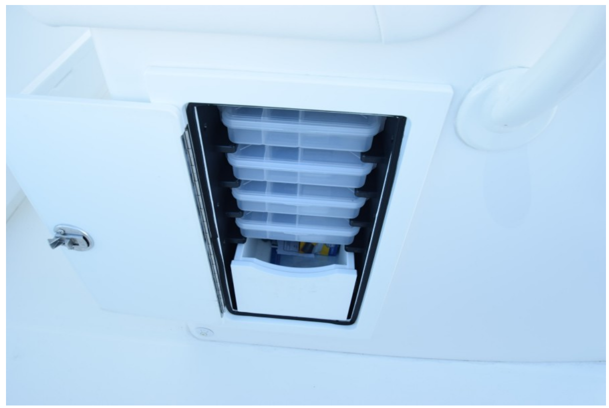
2019 Regulator 31