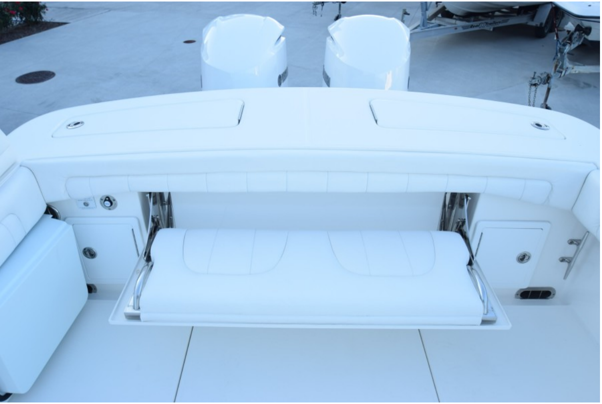
2019 Regulator 31