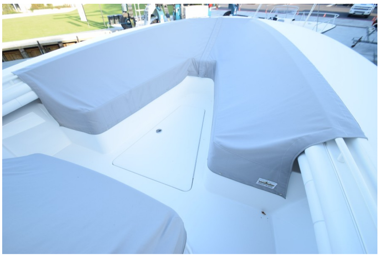
2019 Regulator 31