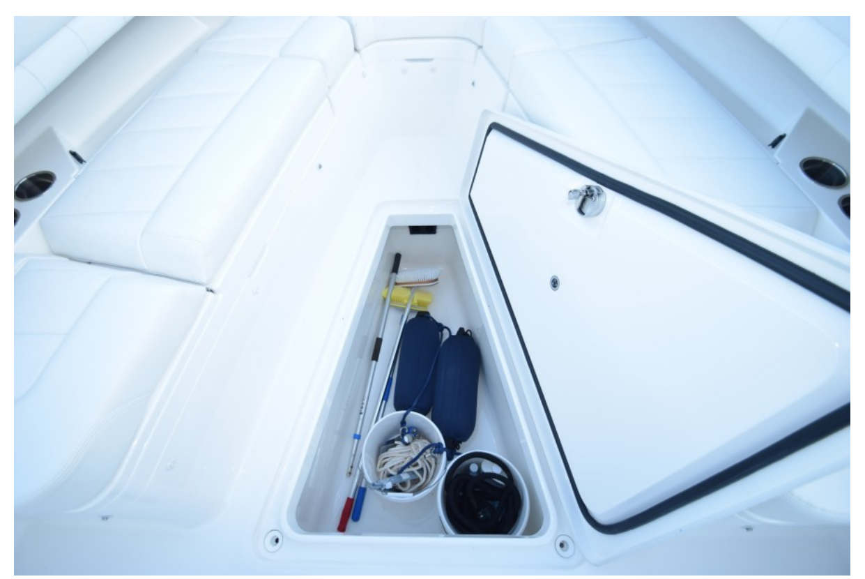
2019 Regulator 31