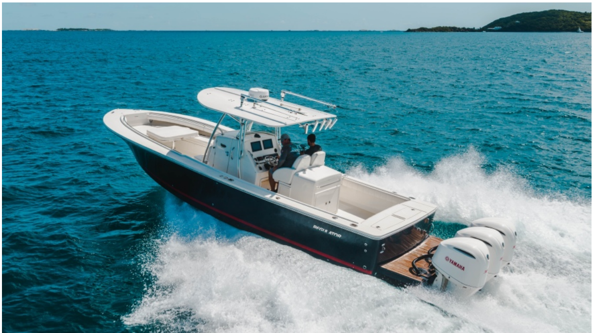
2015 Regulator 34 SS