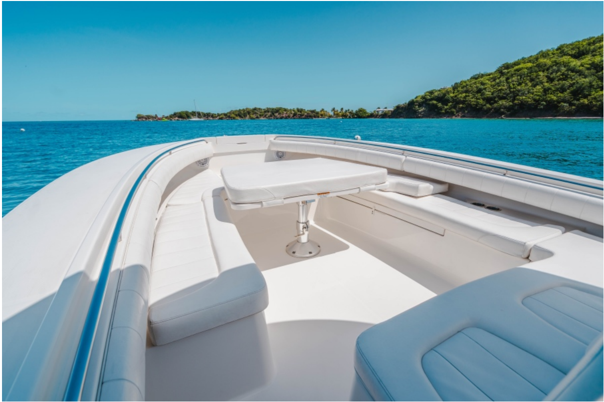
2015 Regulator 34 SS Bow with Seating and Table