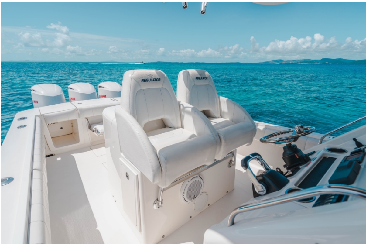
2015 Regulator 34 SS