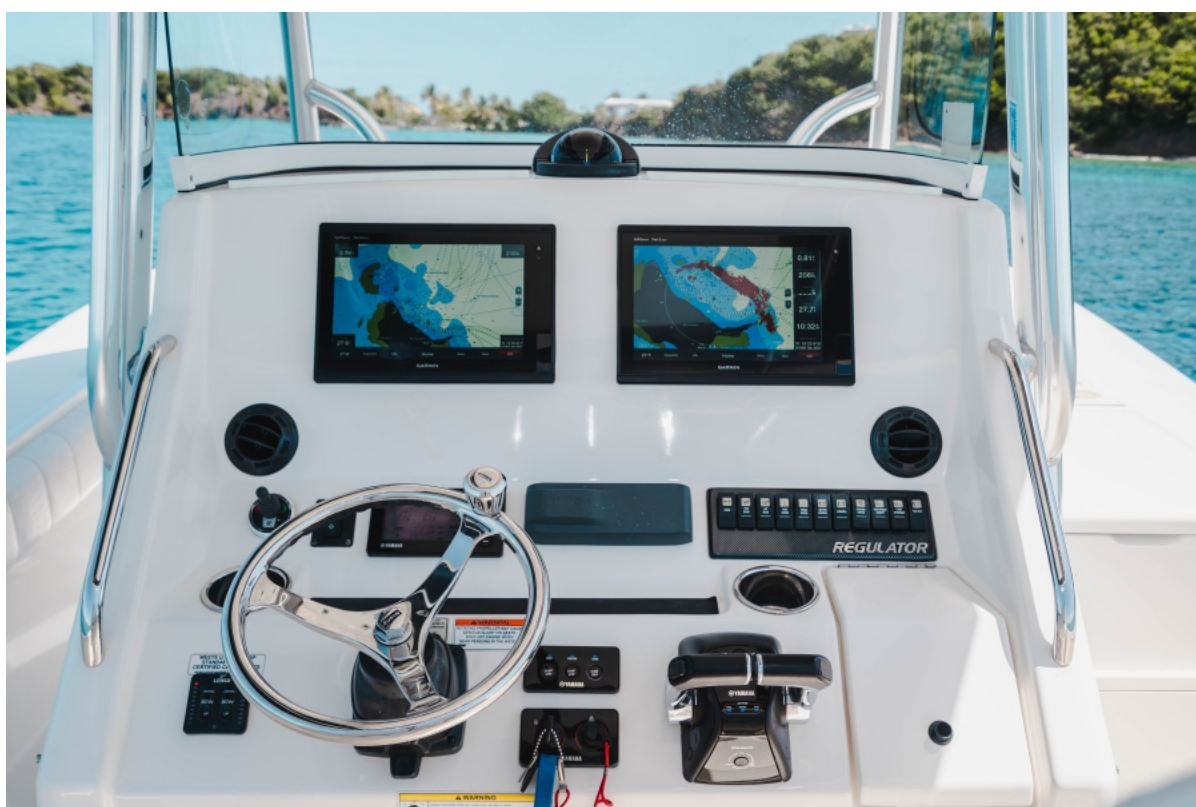
2015 Regulator 34 SS Helm