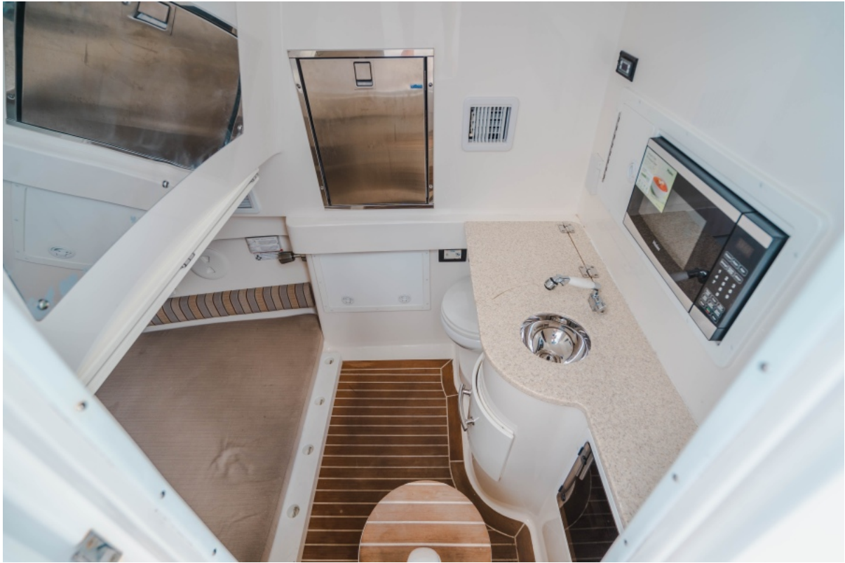
2015 Regulator 34 SS Head