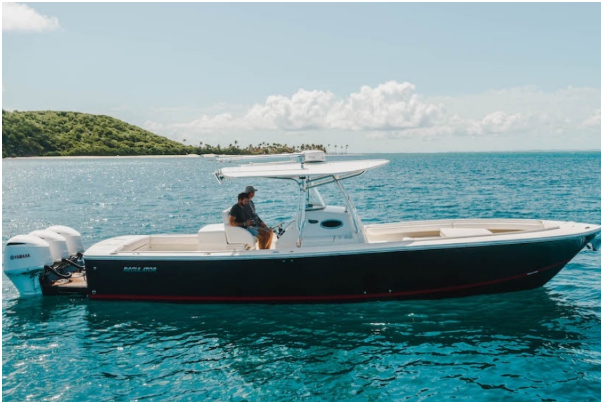
2015 Regulator 34 SS