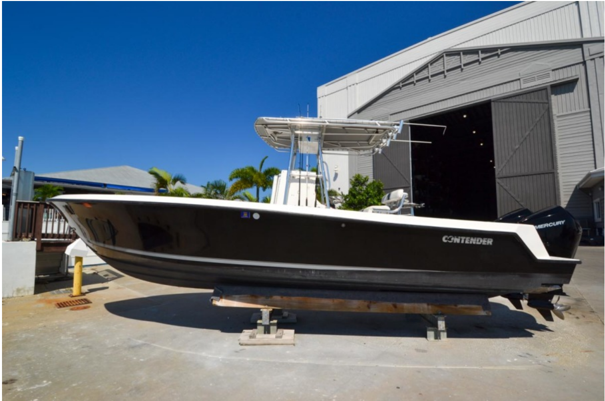
2006 Contender 25 Open 2019 Verado 4.6L V8 225hp - 44 hours