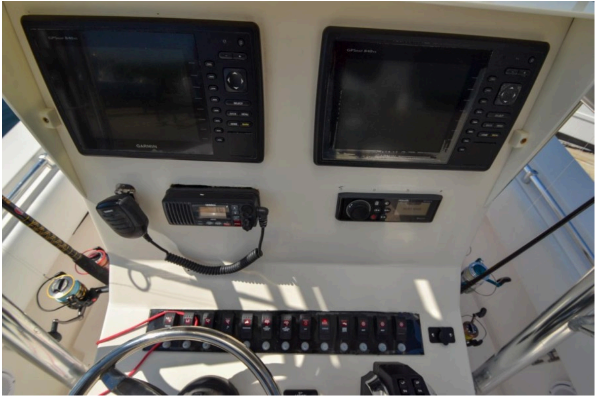
Garmin GPS Map 840 XS Engine data in GPS