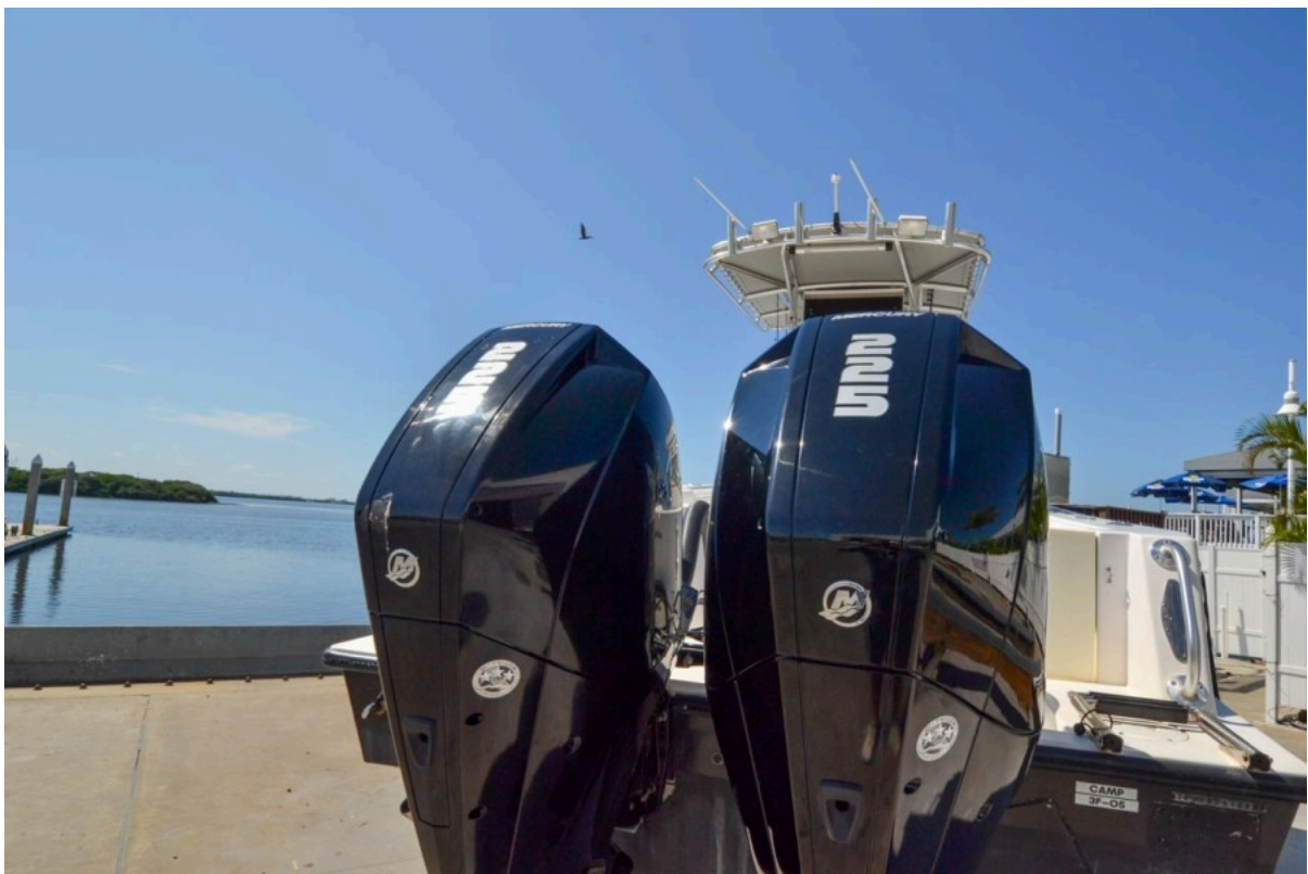
2019 Verado 225hp V8 2 mph at 35 mph