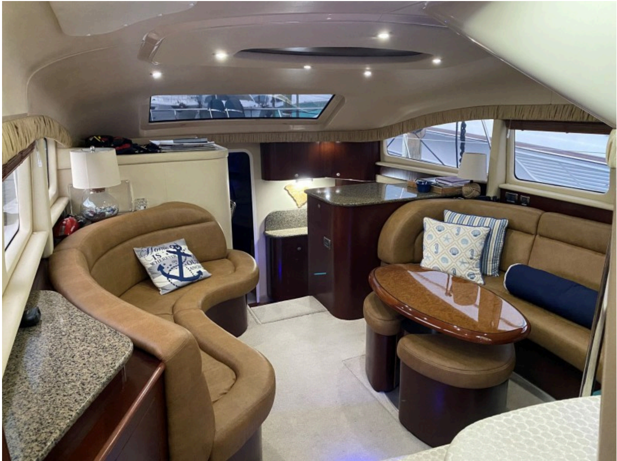
Main Salon - Pull-Out Sofa Bed