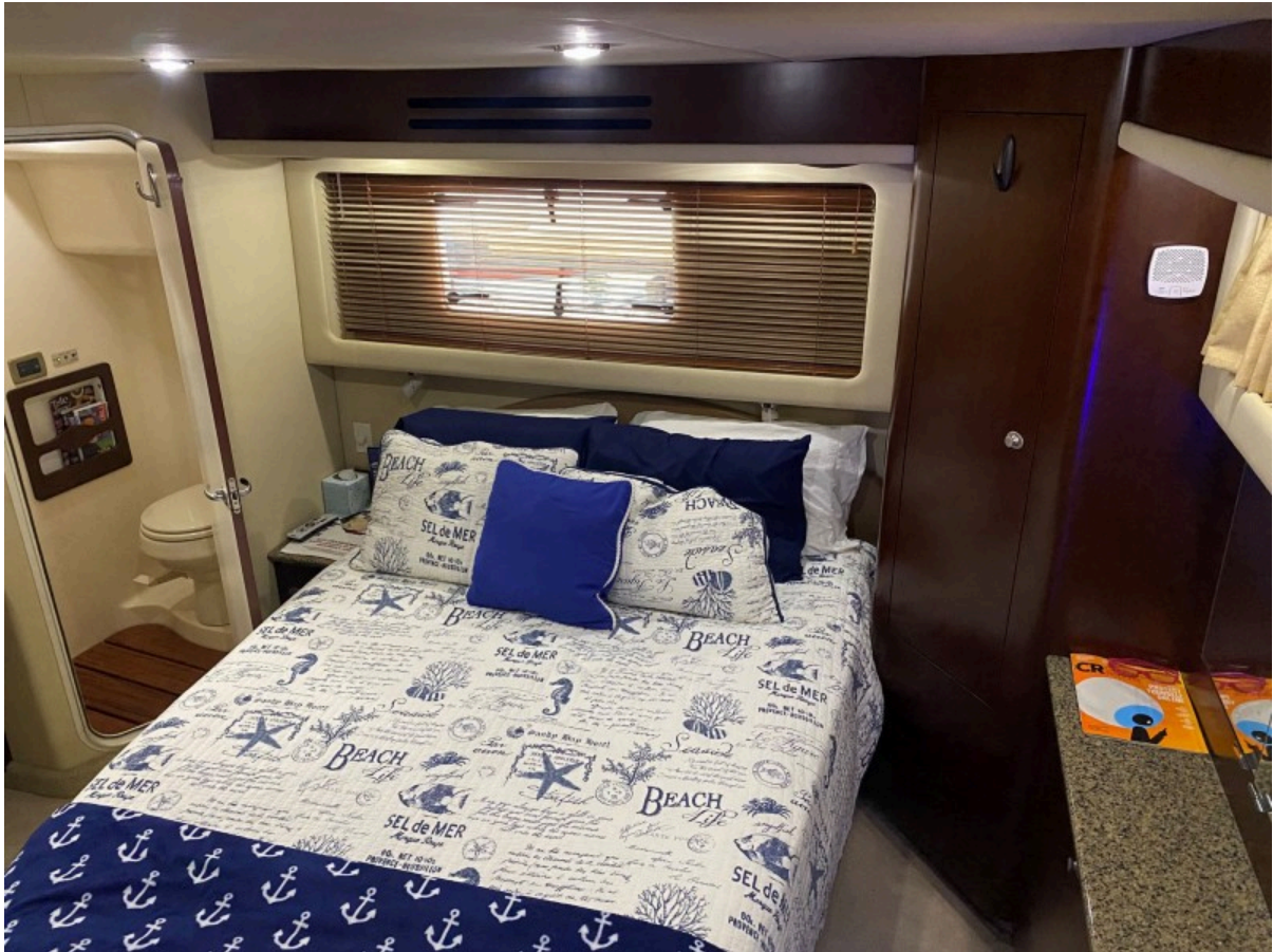
Aft Master Stateroom