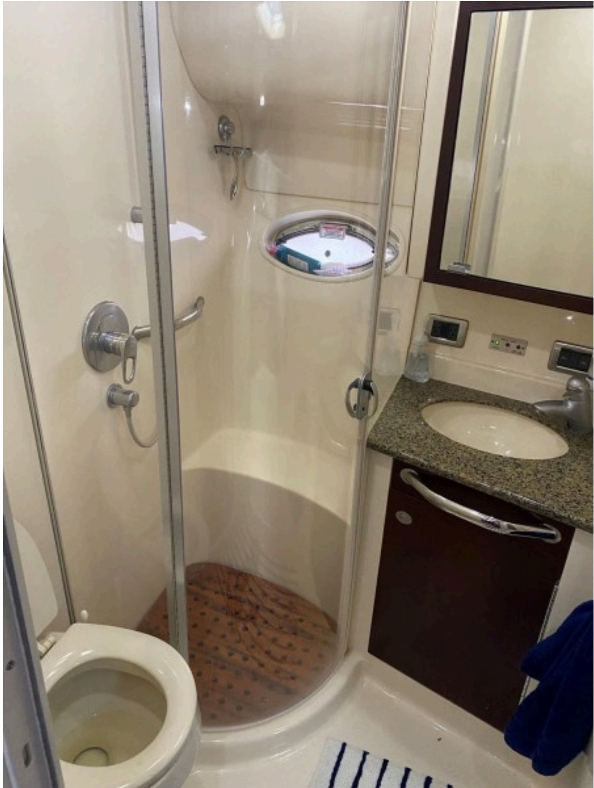
Master Stateroom Shower