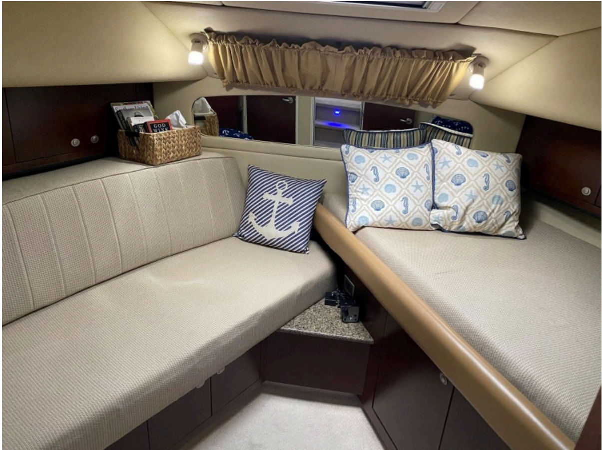
Forward Guest Stateroom