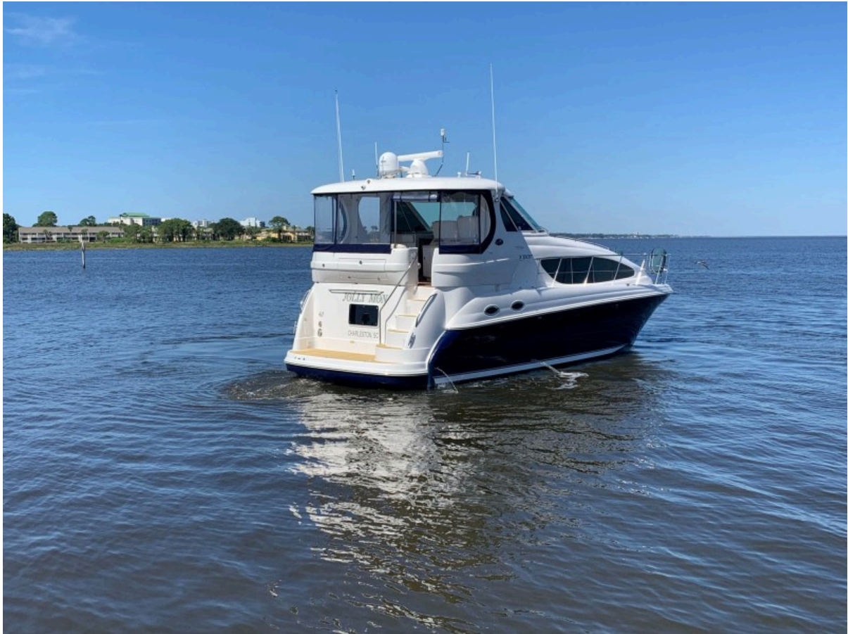
Starboard Aft Quarter