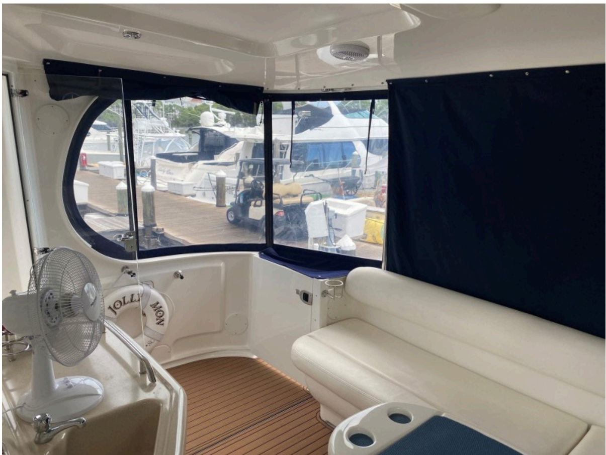
Enclosed Aft Deck