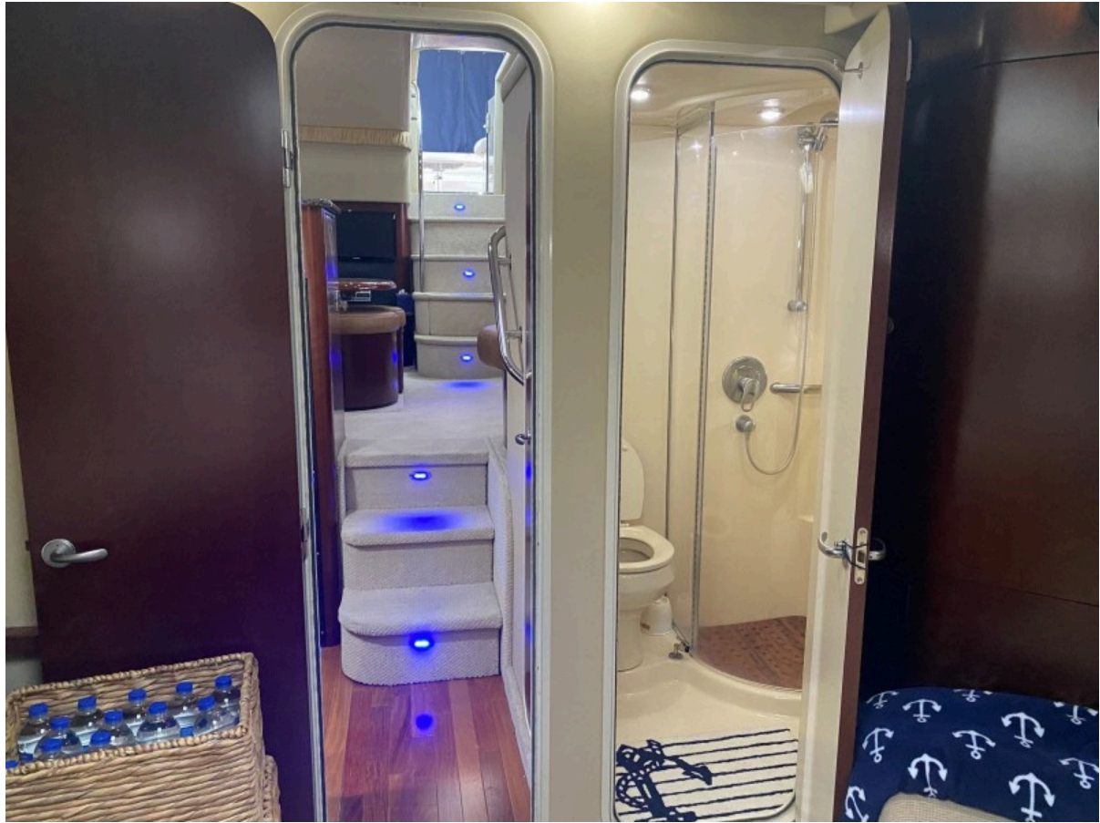
Companionway and Head