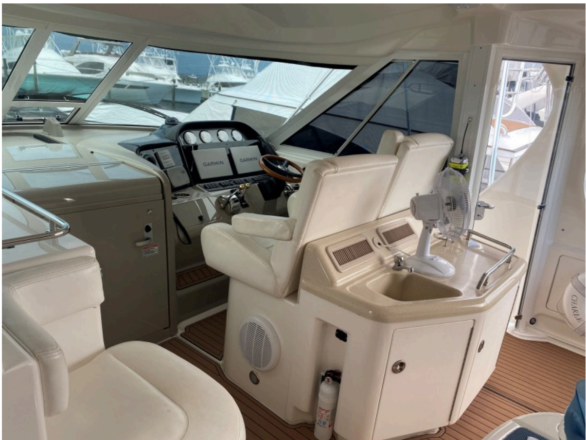
Helm Deck Wet Bar