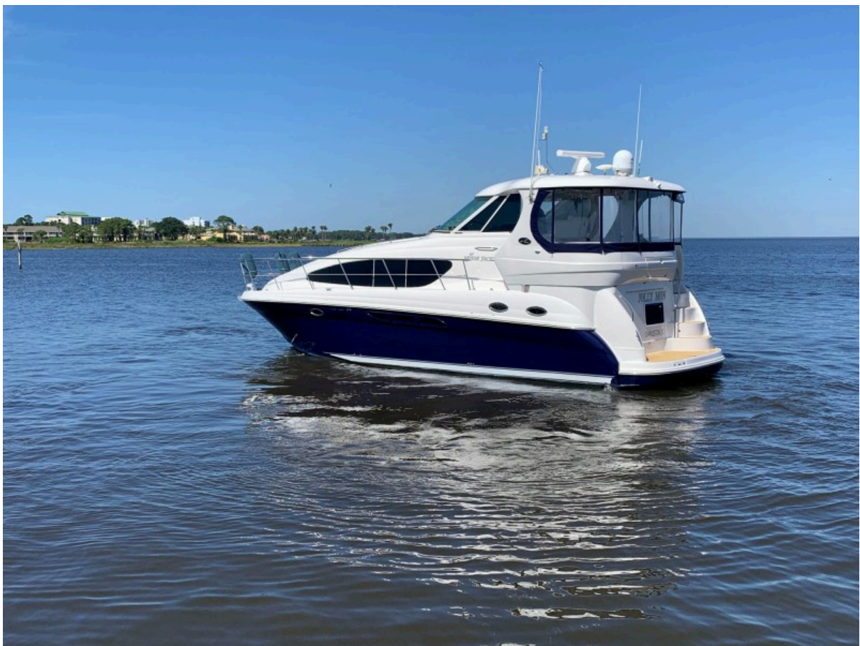
Port Aft Quarter