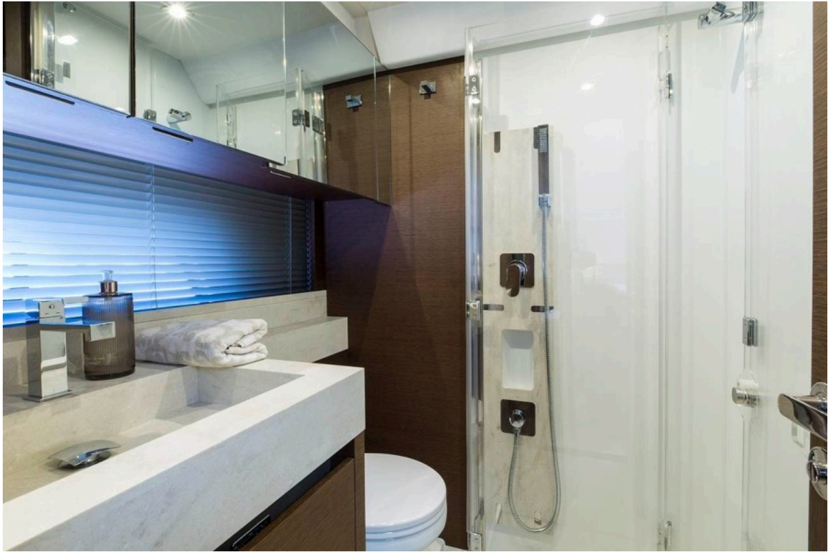
2019 52 Prestige Coupe - Head