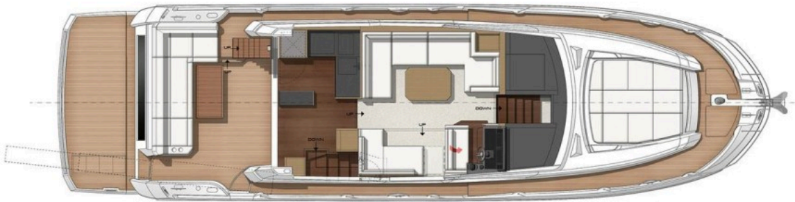
2019 52 Prestige Coupe - Layout