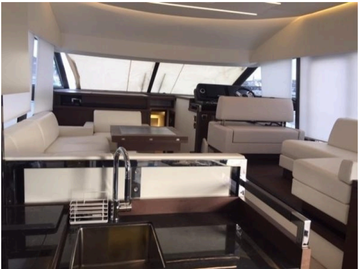
2019 52 Prestige Coupe - Salon/Galley