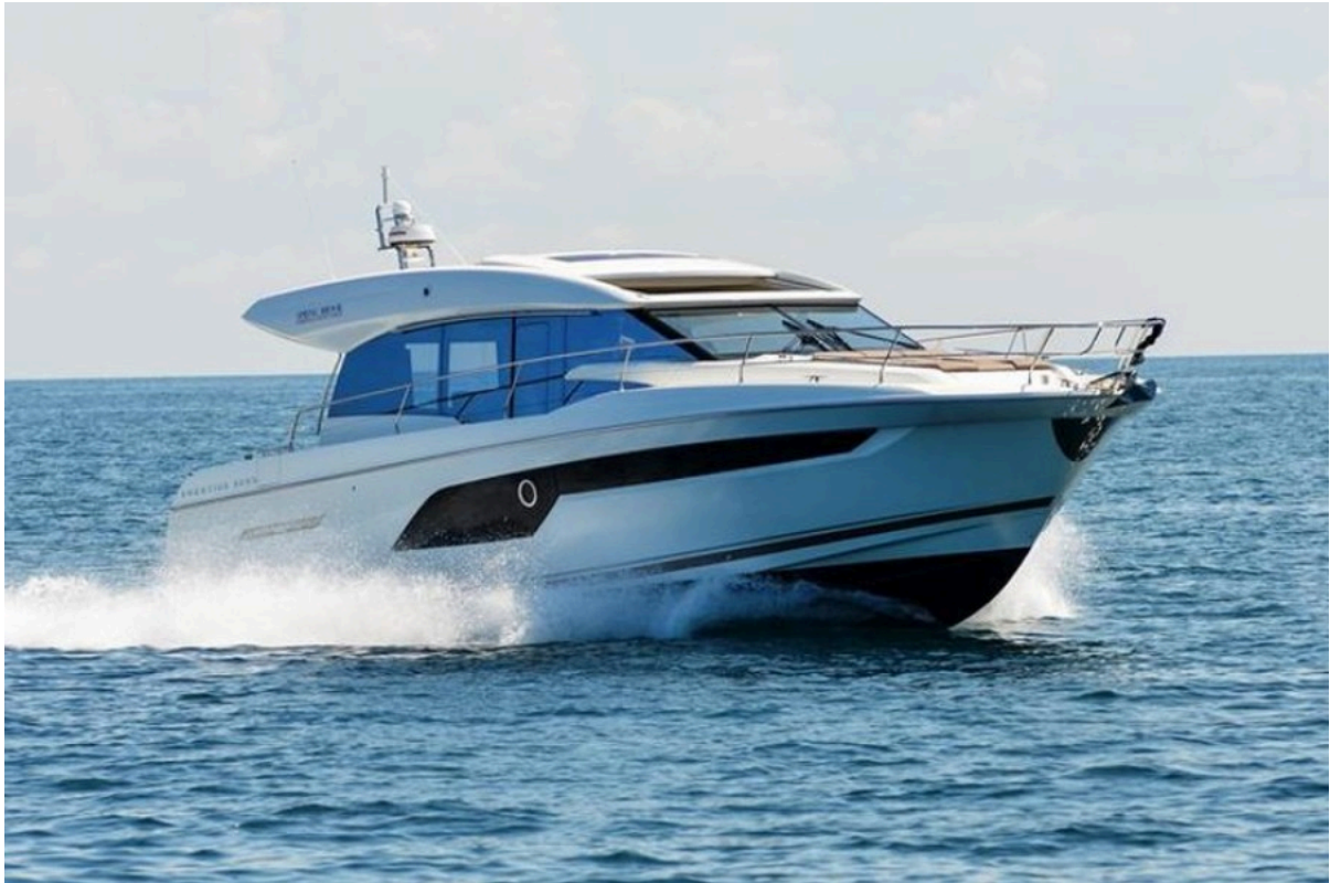
2019 52 Prestige Coupe - Sistership Profile