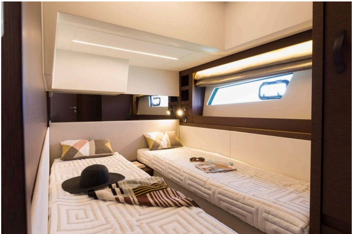
2019 52 Prestige Coupe - Stateroom