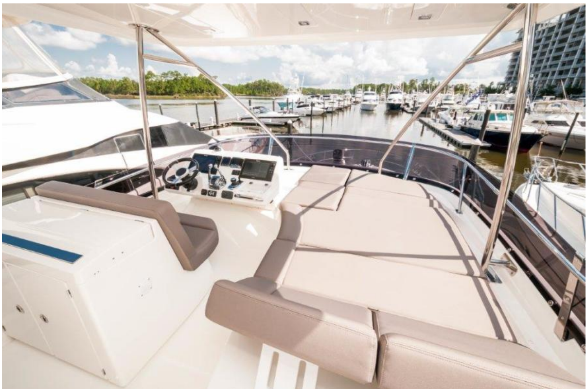
2017 Prestige 56 Flybridge