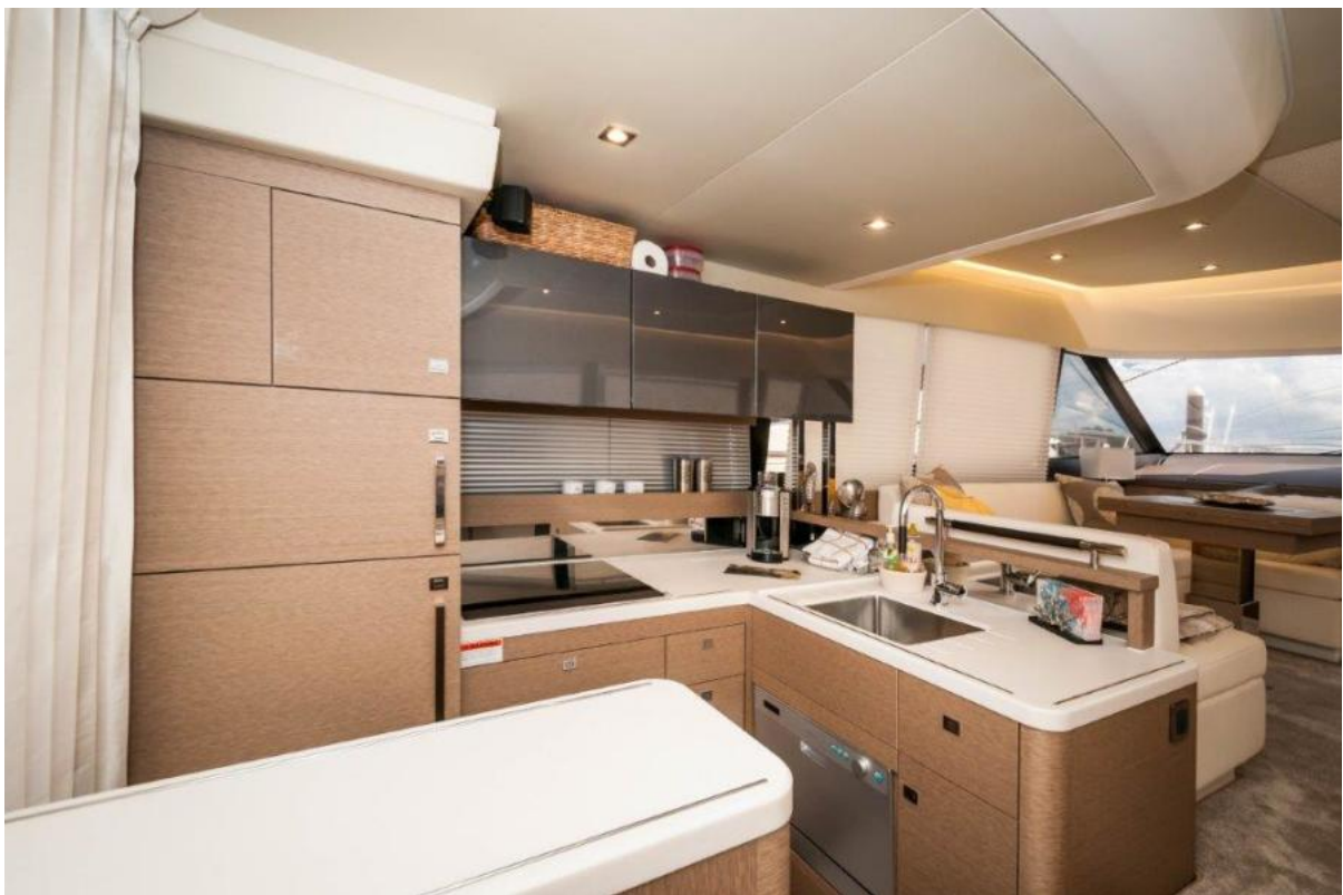
2017 Prestige 56 Flybridge Galley