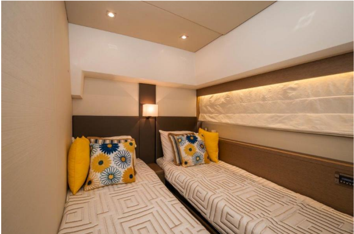
2017 Prestige 56 Flybridge Guest Stateroom