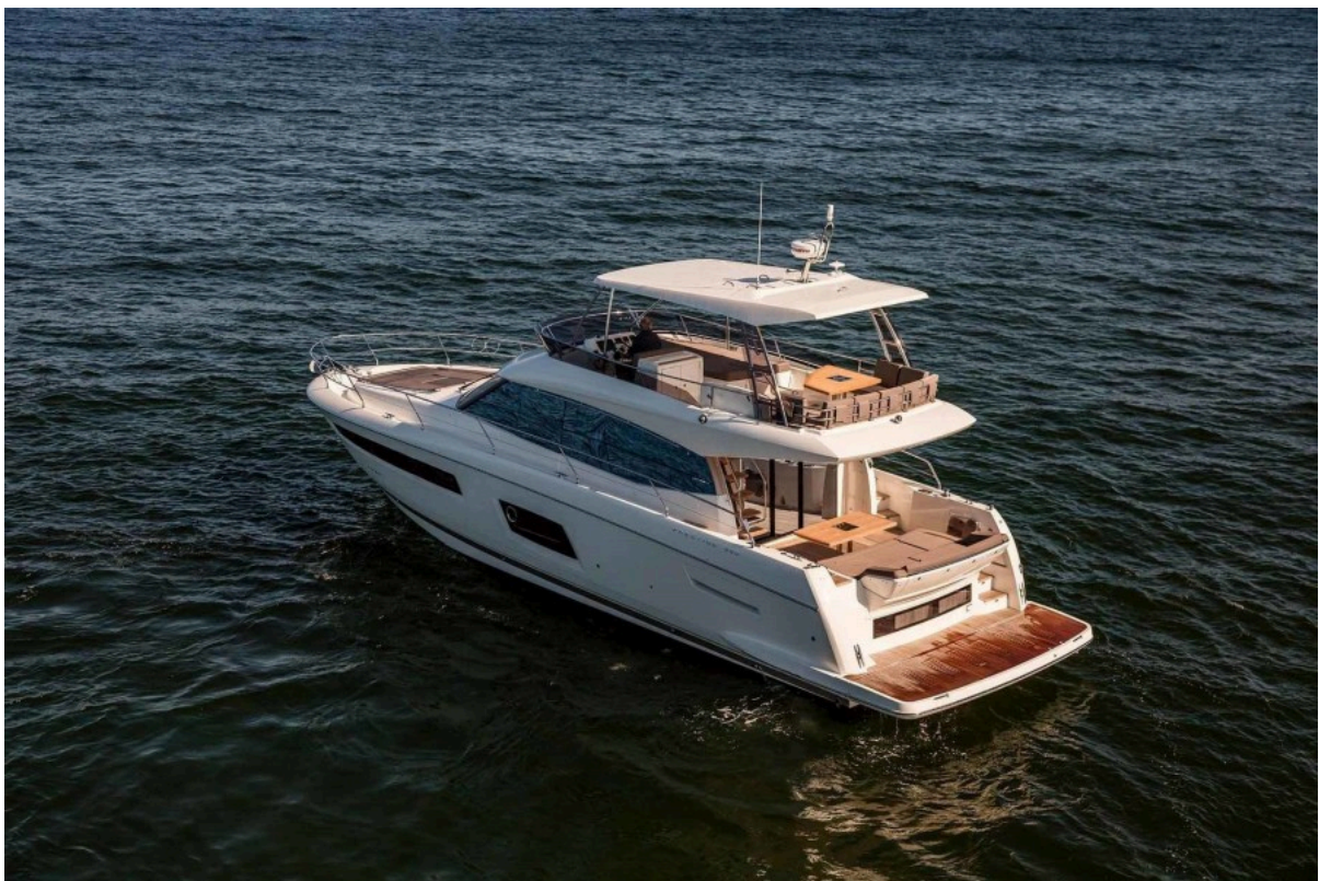
2017 Prestige 56 Flybridge