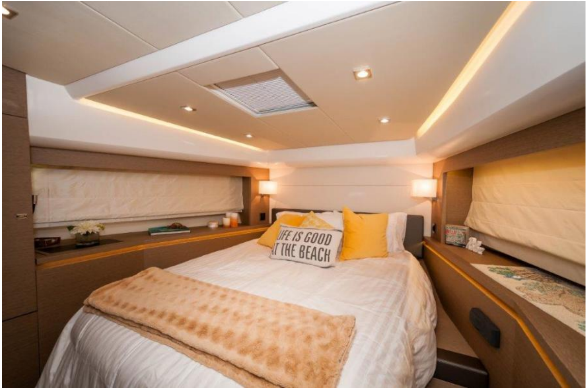
2017 Prestige 56 Flybridge VIP Stateroom