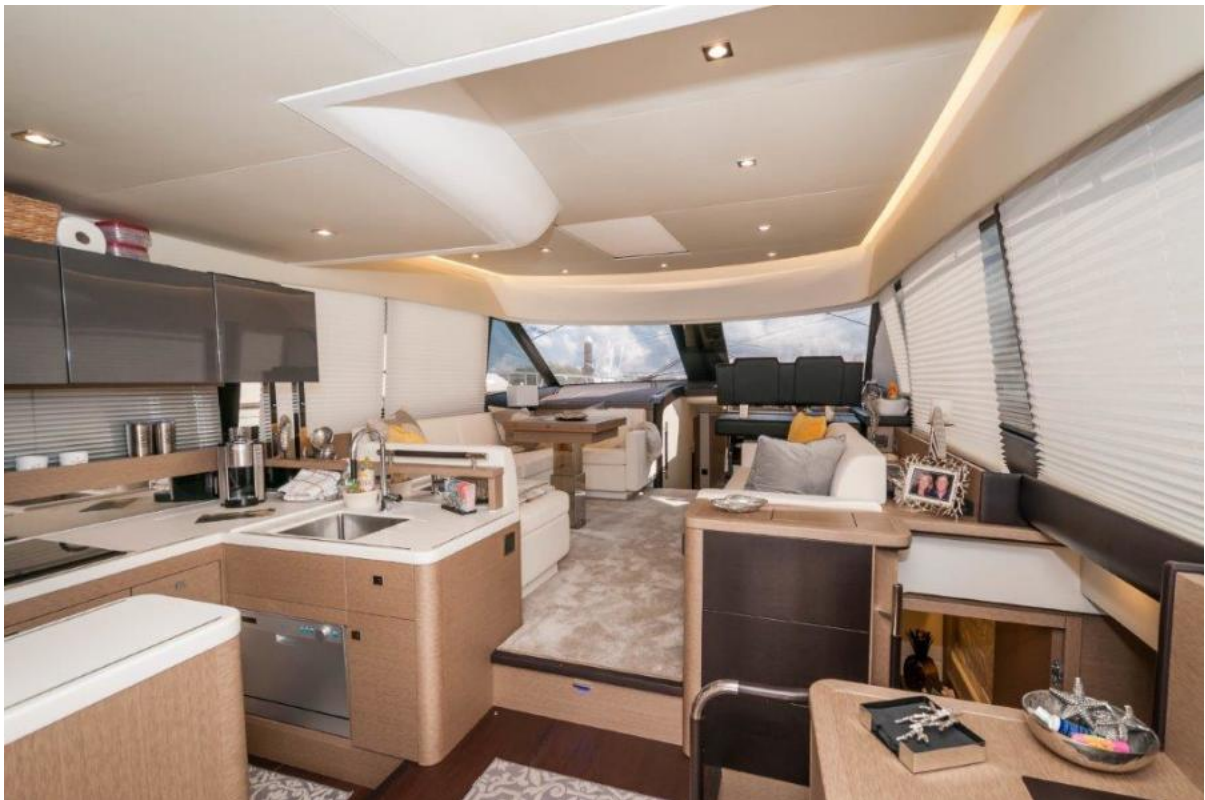
2017 Prestige 56 Flybridge Salon