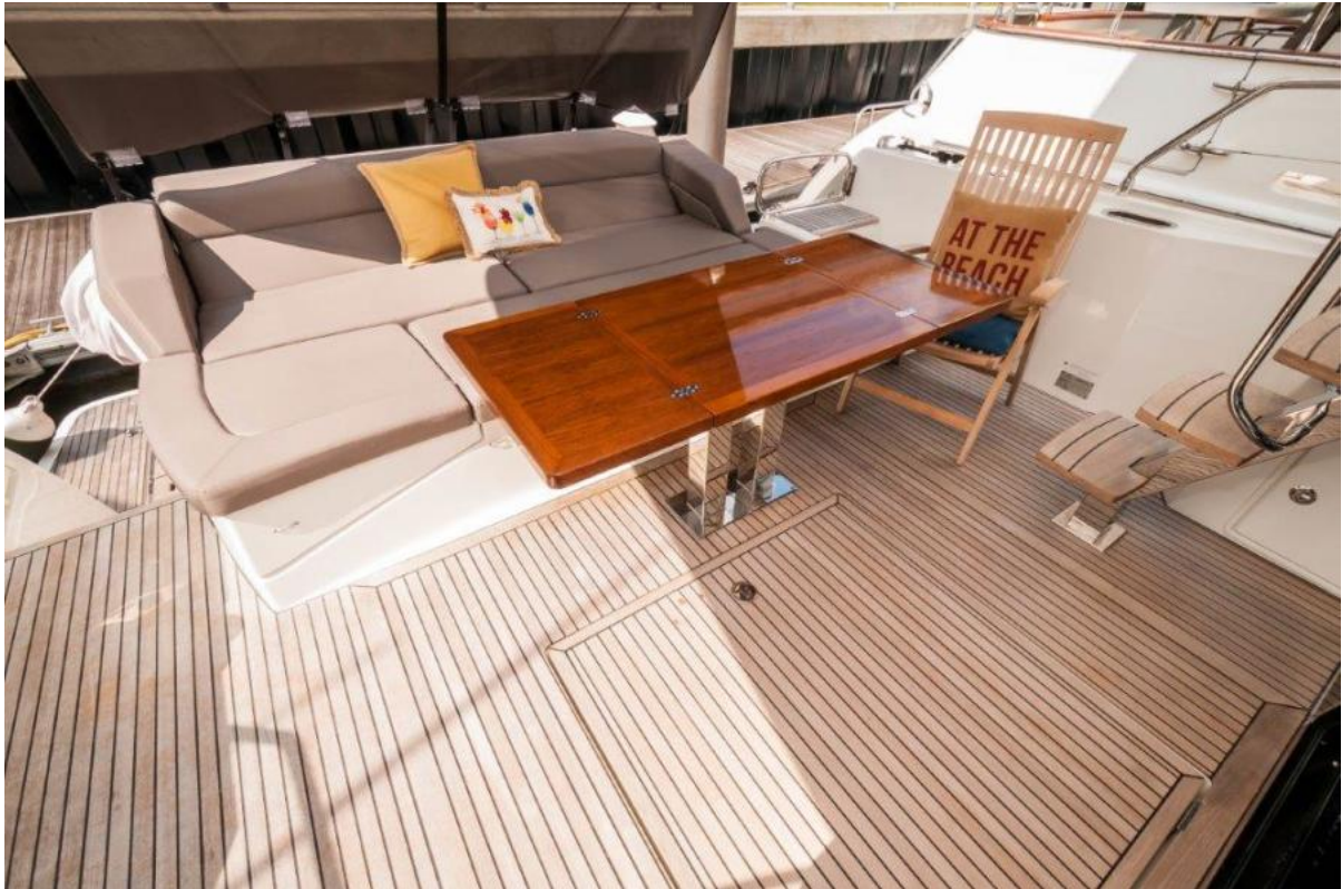
2017 Prestige 56 Flybridge Cockpit