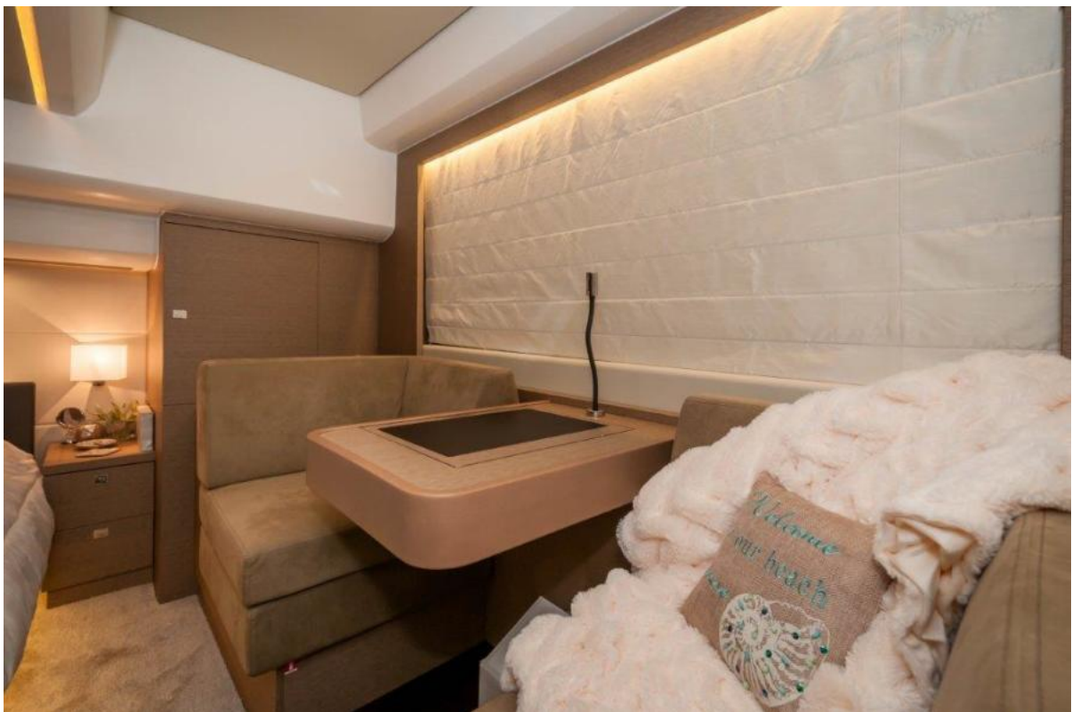
2017 Prestige 56 Flybridge Master Seating Area