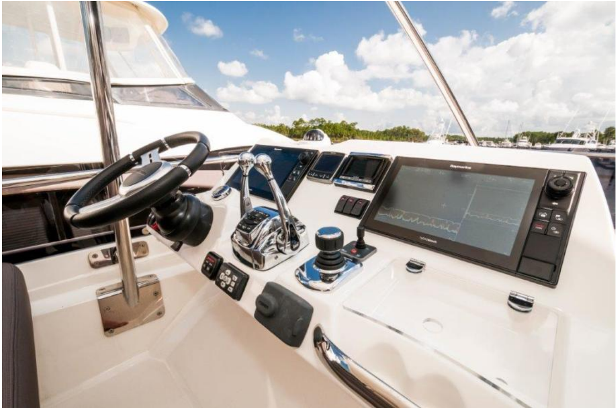
2017 Prestige 56 Flybridge