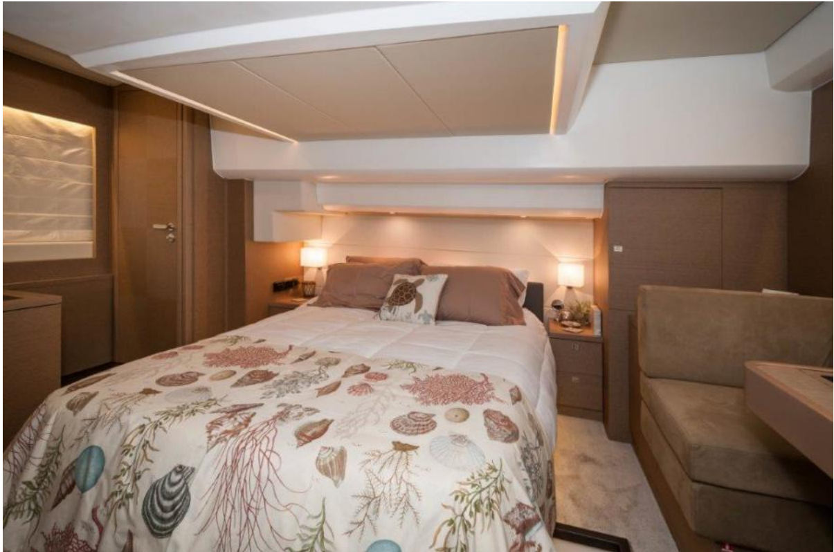
2017 Prestige 56 Flybridge Master Stateroom