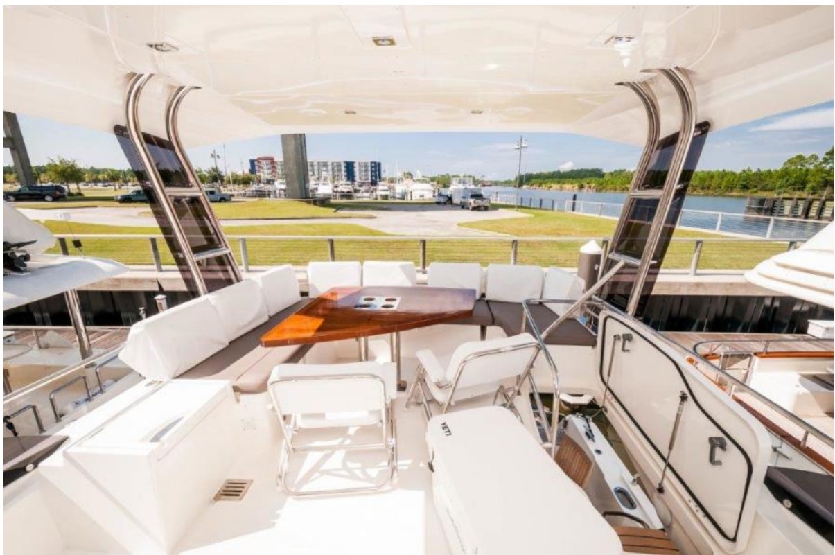
2017 Prestige 56 Flybridge