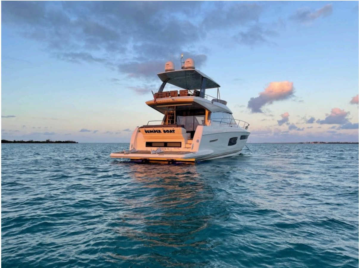
2017 Prestige 56 Flybridge