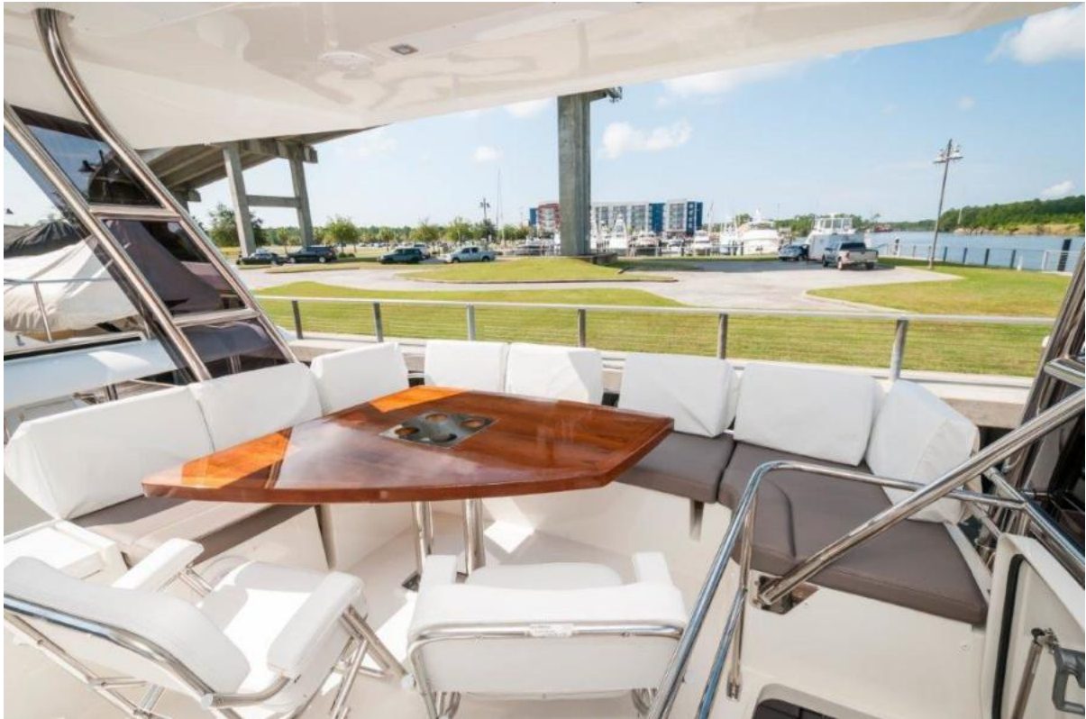
2017 Prestige 56 Flybridge