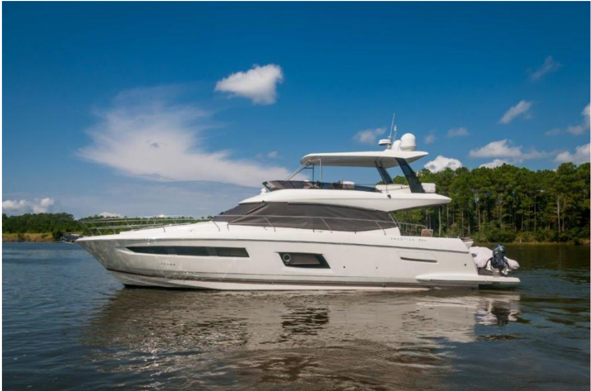
2017 Prestige 56 Flybridge Port Profile