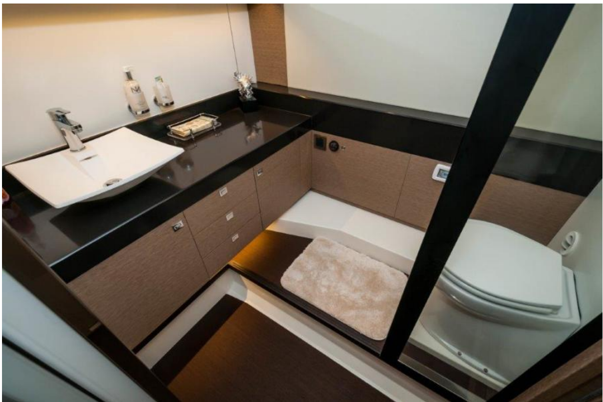
2017 Prestige 56 Flybridge Master Head