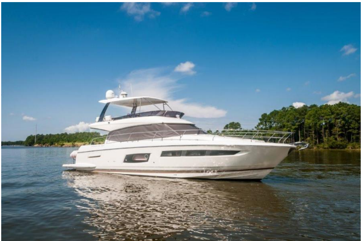
2017 Prestige 56 Flybridge Starboard Bow