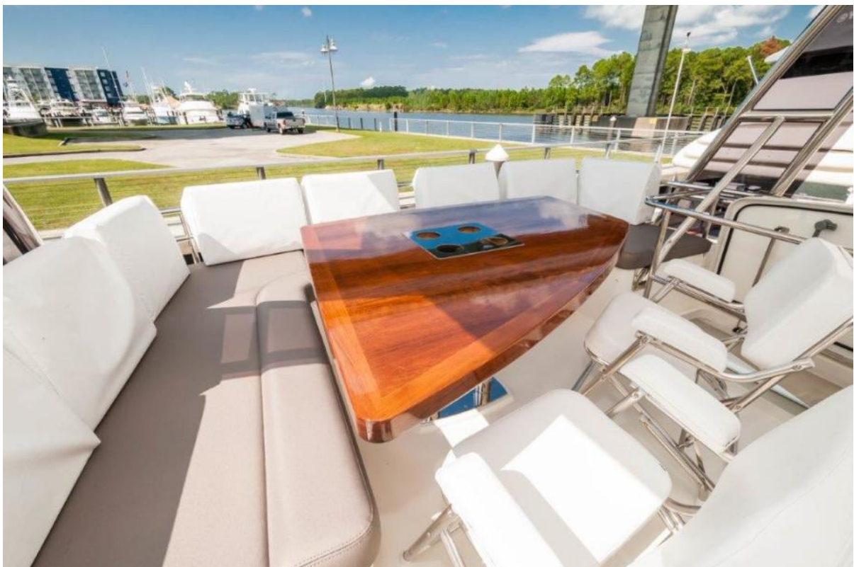
2017 Prestige 56 Flybridge