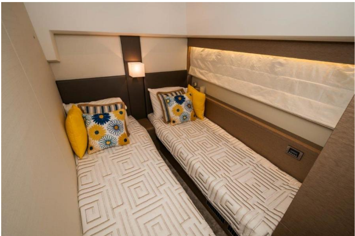
2017 Prestige 56 Flybridge Guest Stateroom