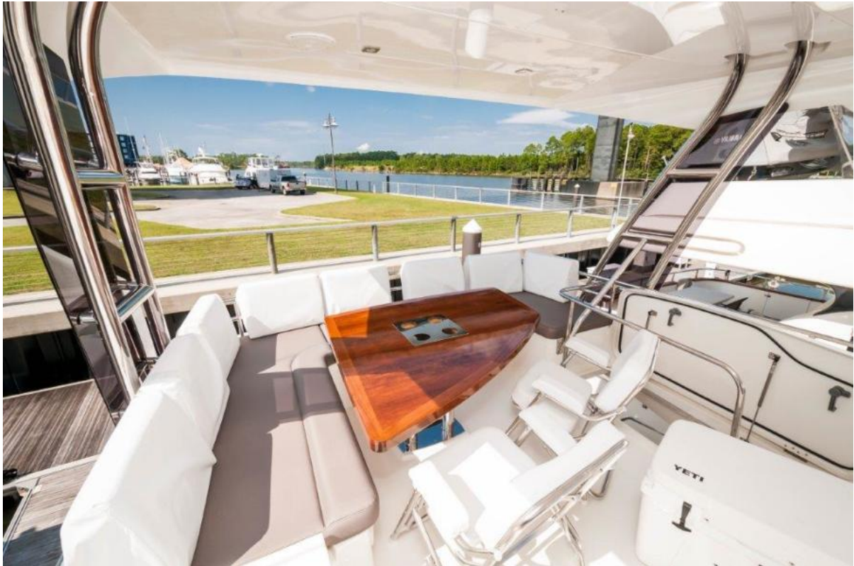
2017 Prestige 56 Flybridge