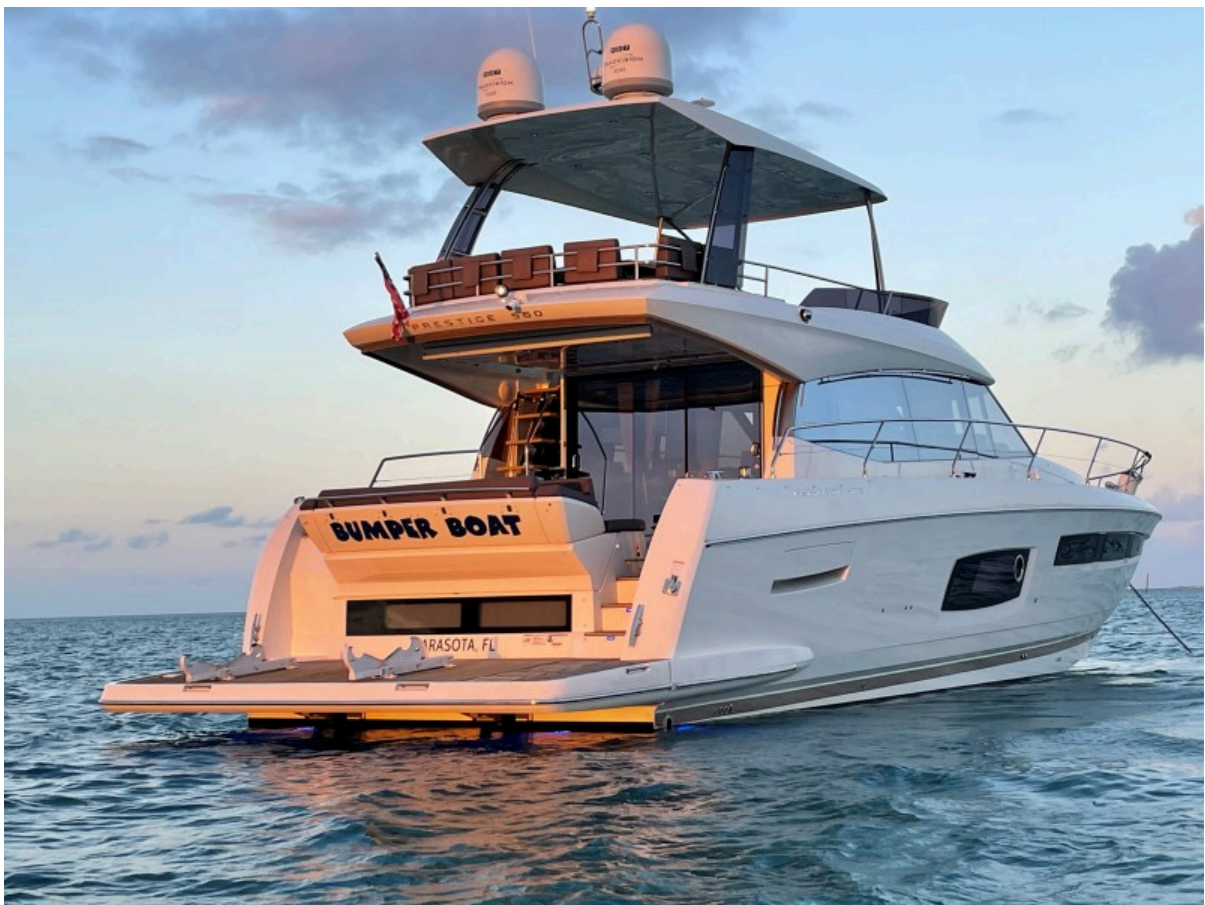
2017 Prestige 56 Flybridge