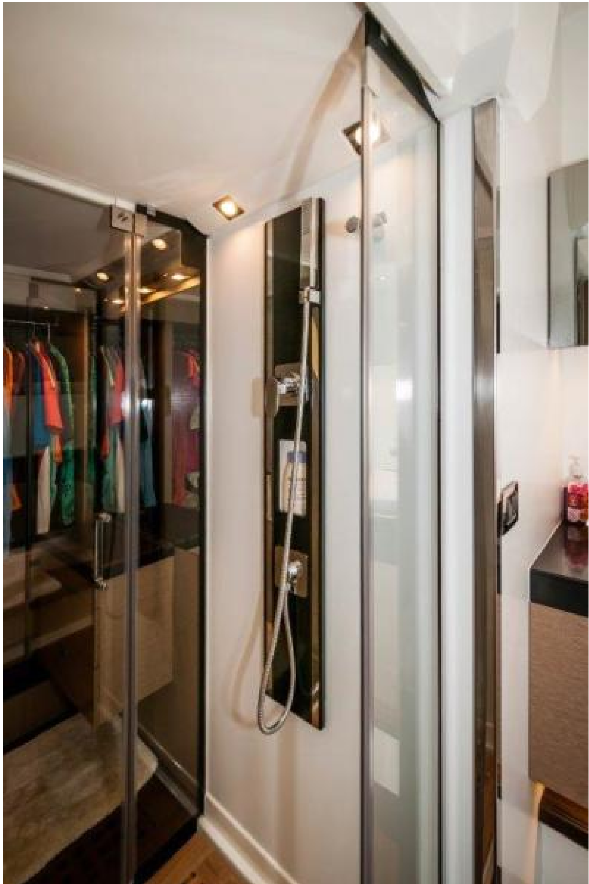
2017 Prestige 56 Flybridge Master Head Shower