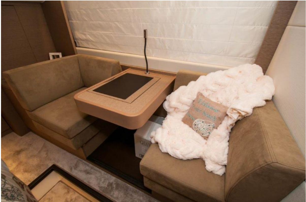
2017 Prestige 56 Flybridge Master Seating Area