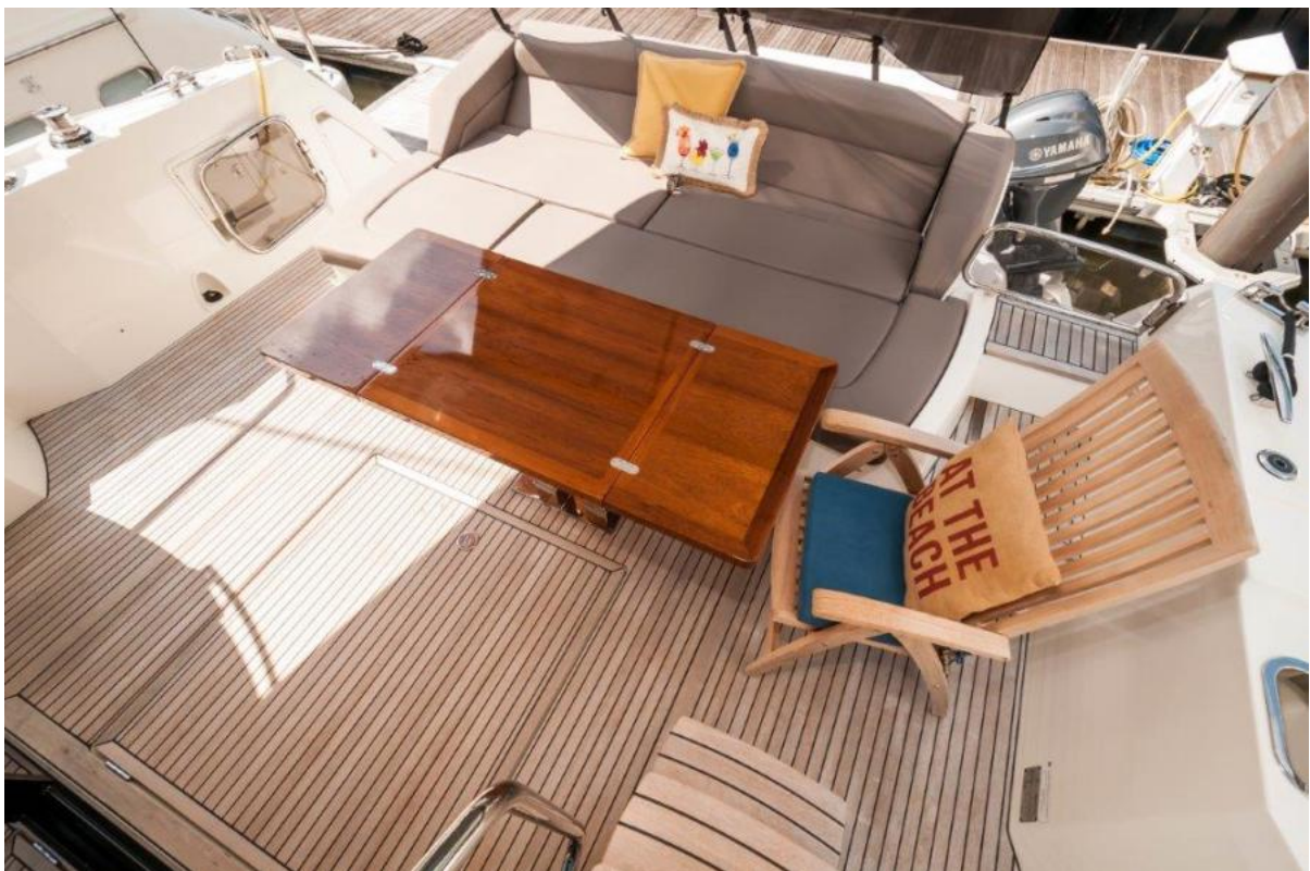
2017 Prestige 56 Flybridge Cockpit