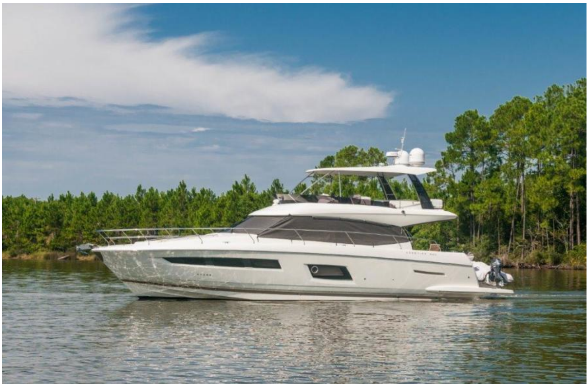
2017 Prestige 56 Flybridge Port Profile