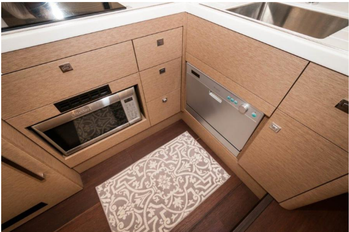
2017 Prestige 56 Flybridge Galley