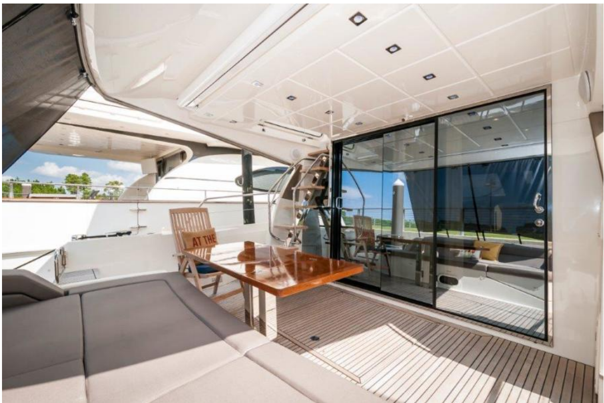
2017 Prestige 56 Flybridge Cockpit