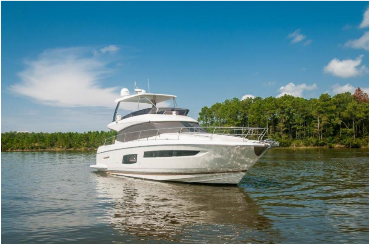
2017 Prestige 56 Flybridge Starboard Bow