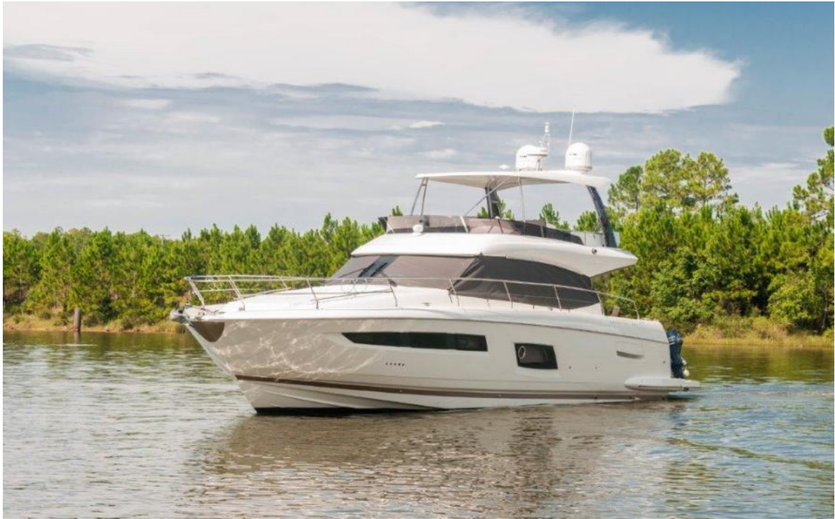
2017 Prestige 56 Flybridge Port Bow