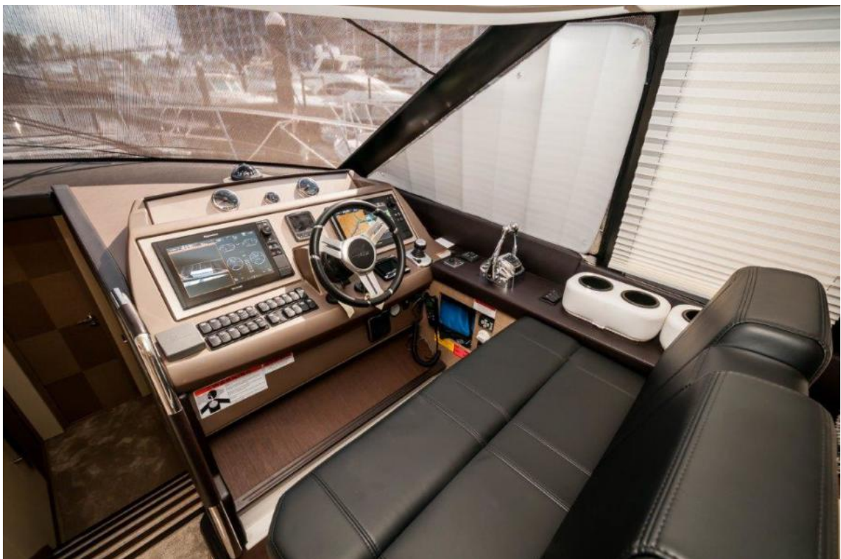
2017 Prestige 56 Flybridge Helm