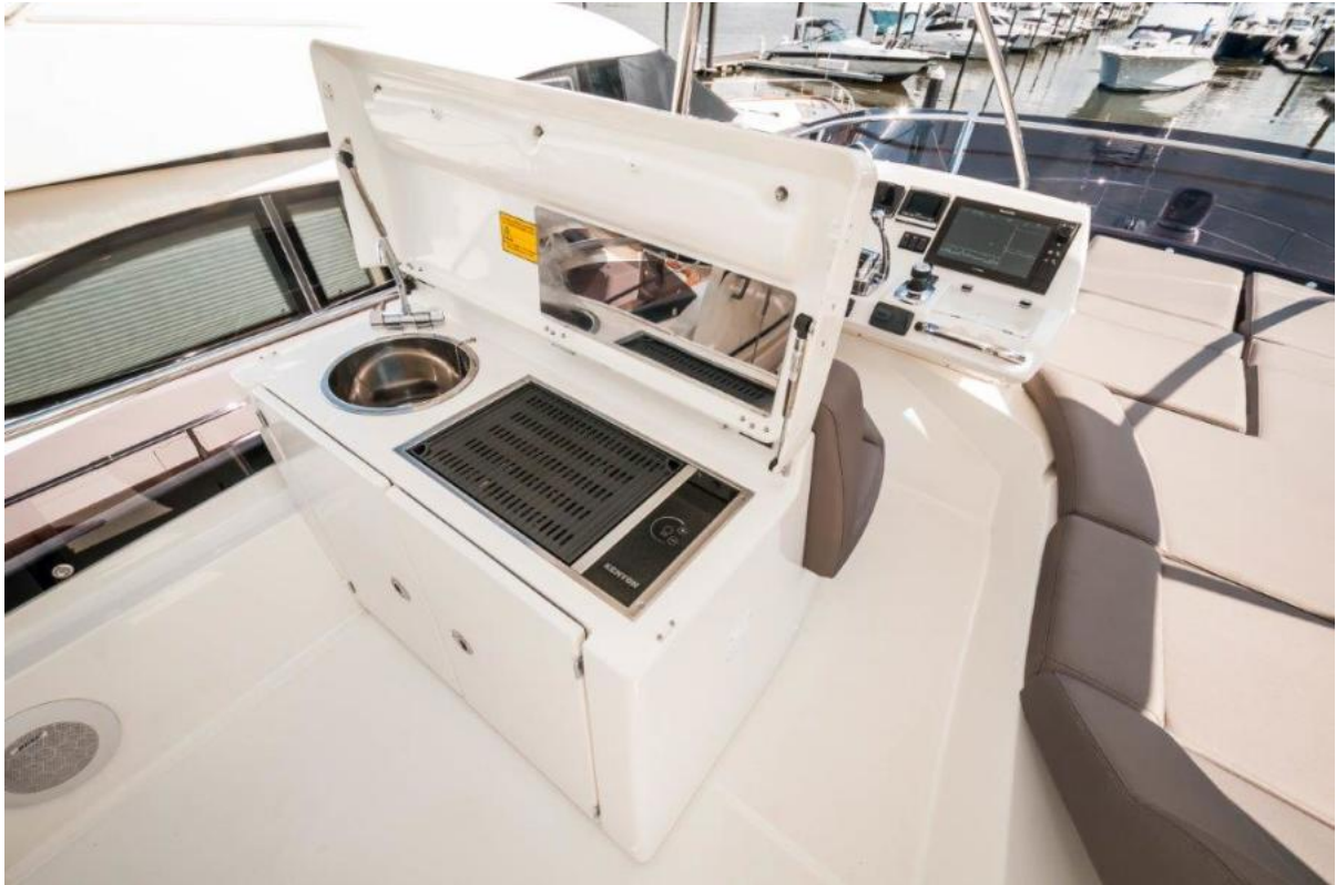
2017 Prestige 56 Flybridge