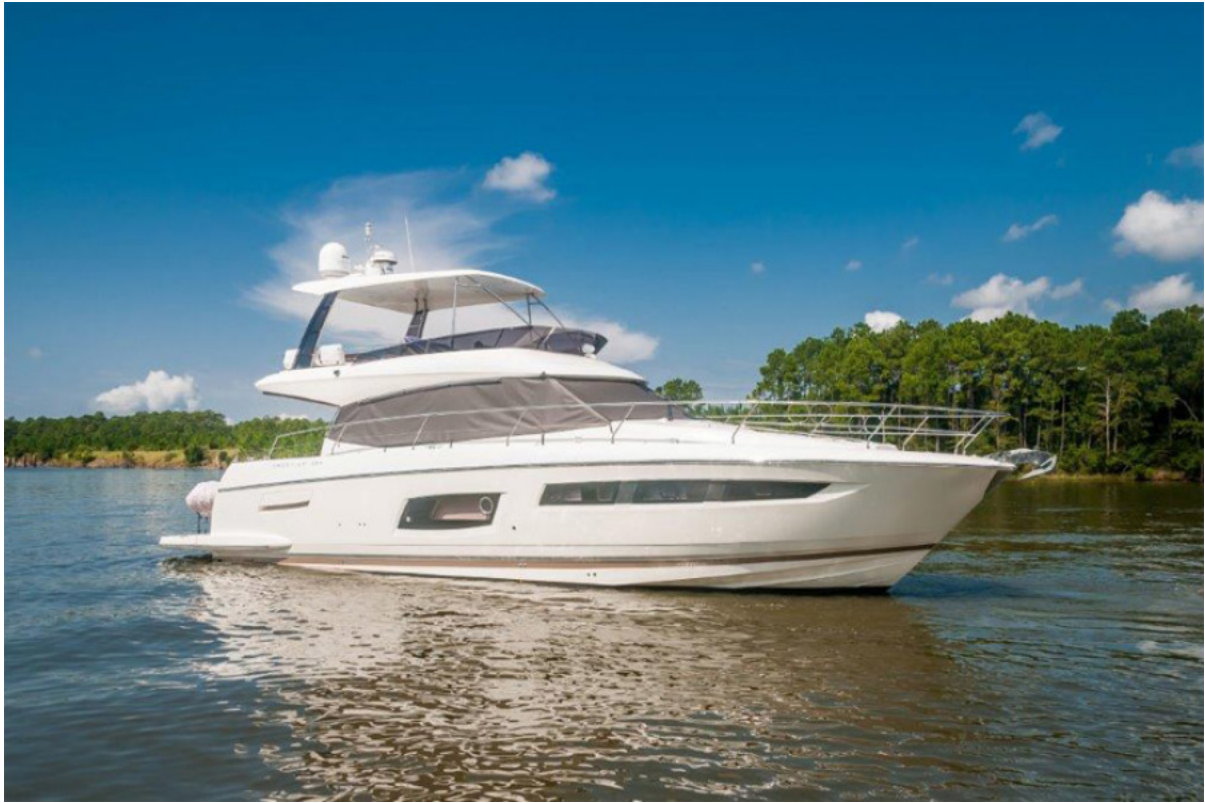
2017 Prestige 56 Flybridge Profile