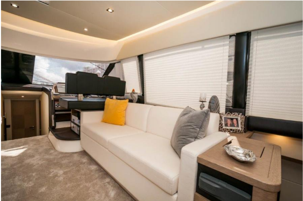
2017 Prestige 56 Flybridge Salon