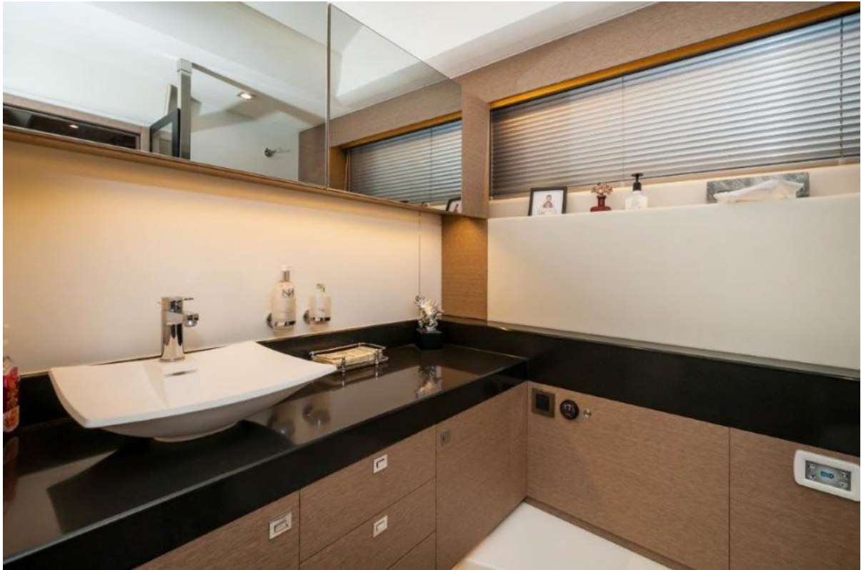
2017 Prestige 56 Flybridge Master Head