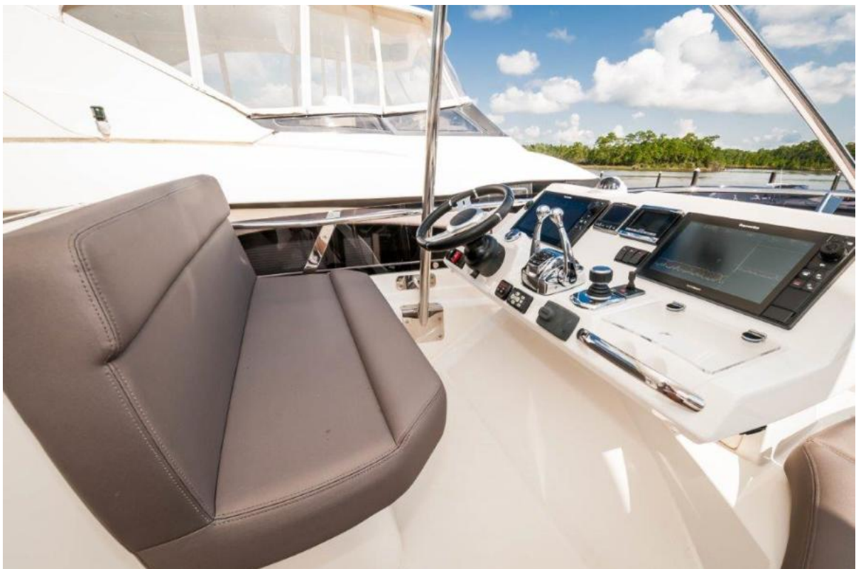
2017 Prestige 56 Flybridge