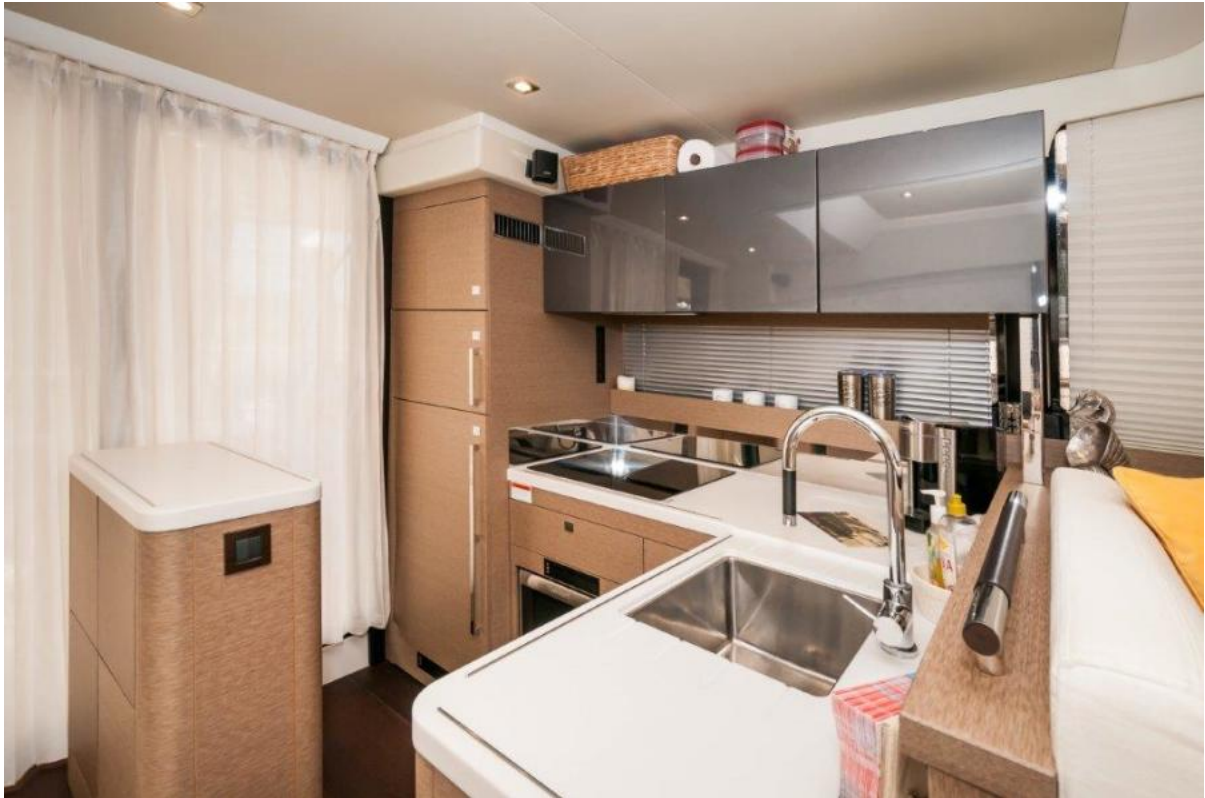
2017 Prestige 56 Flybridge Galley