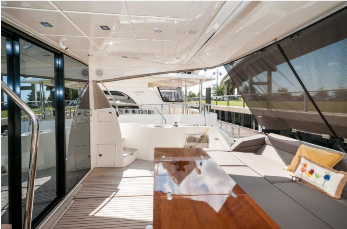
2017 Prestige 56 Flybridge Cockpit