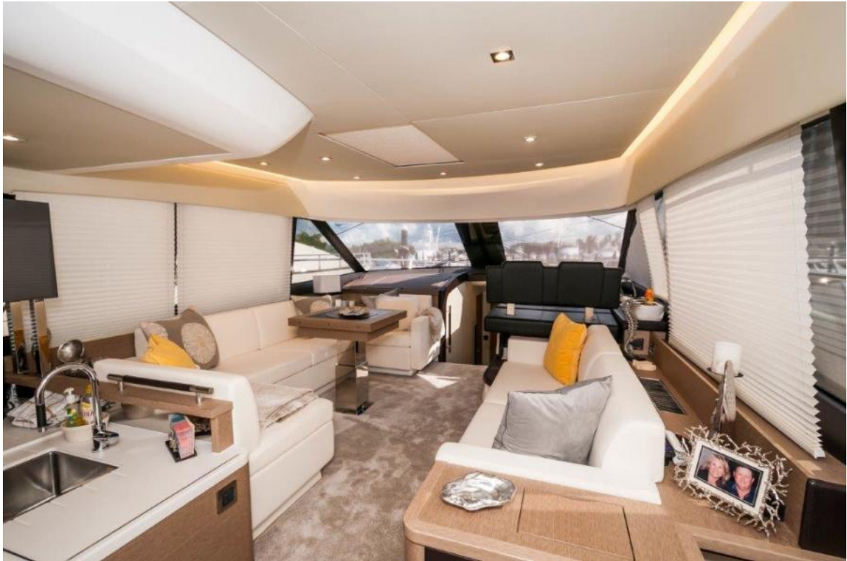
2017 Prestige 56 Flybridge Salon