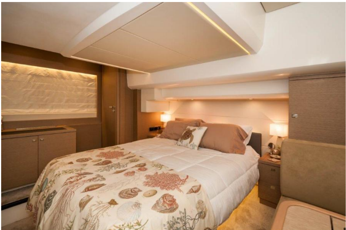
2017 Prestige 56 Flybridge Master Stateroom