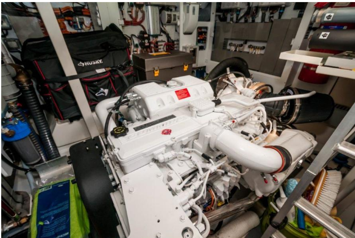
2017 Prestige 56 Flybridge Engine Room