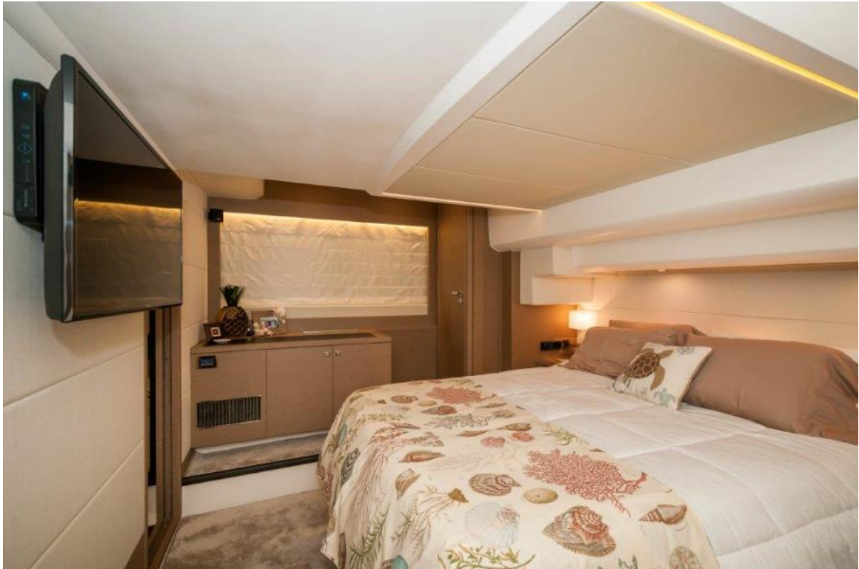
2017 Prestige 56 Flybridge Master Stateroom