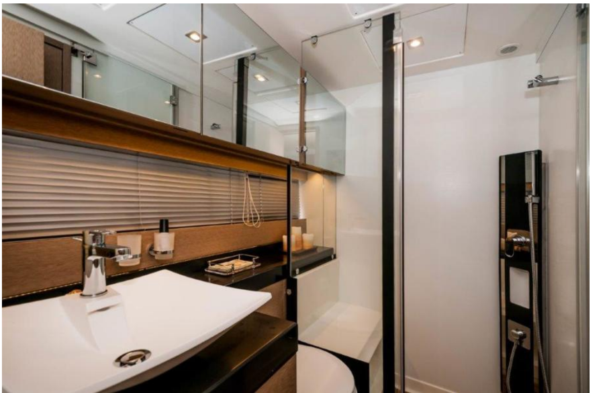
2017 Prestige 56 Flybridge VIP Head