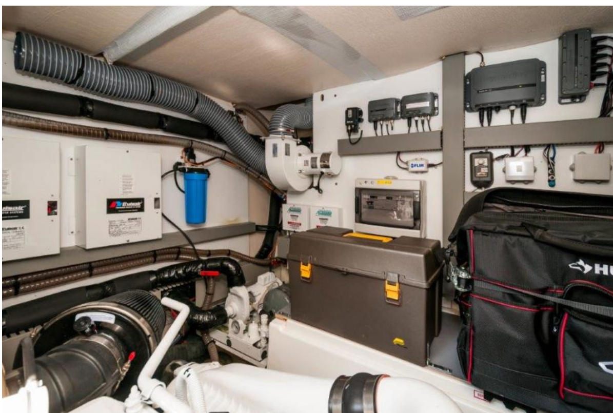
2017 Prestige 56 Flybridge Engine Room