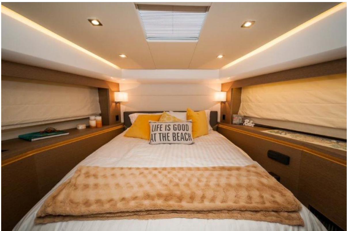
2017 Prestige 56 Flybridge VIP Stateroom