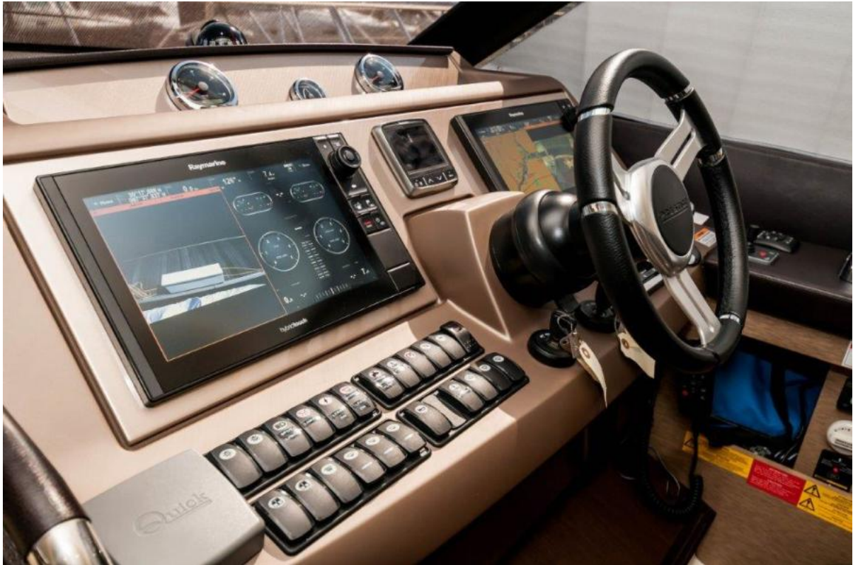
2017 Prestige 56 Flybridge Helm