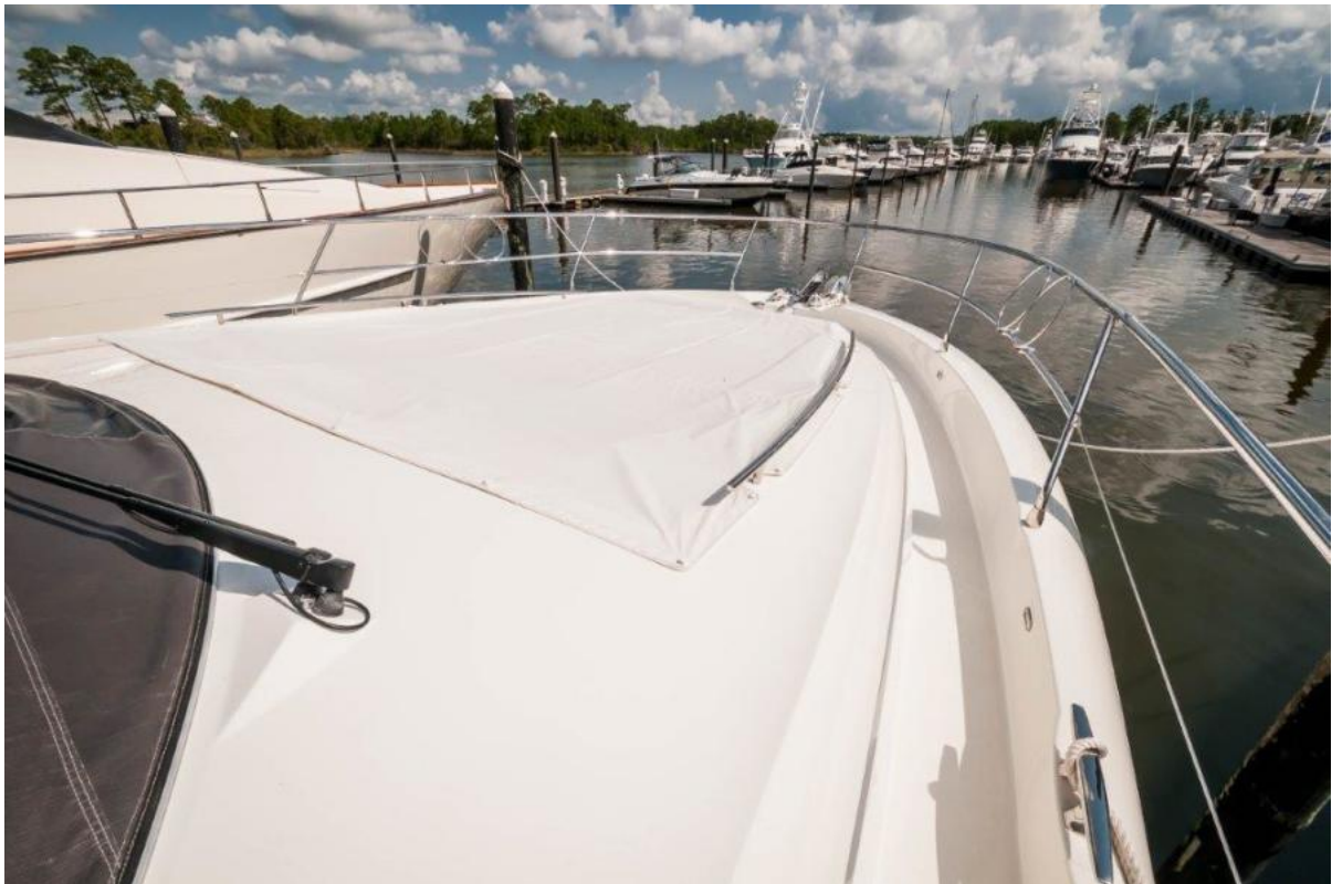
2017 Prestige 56 Flybridge Bow