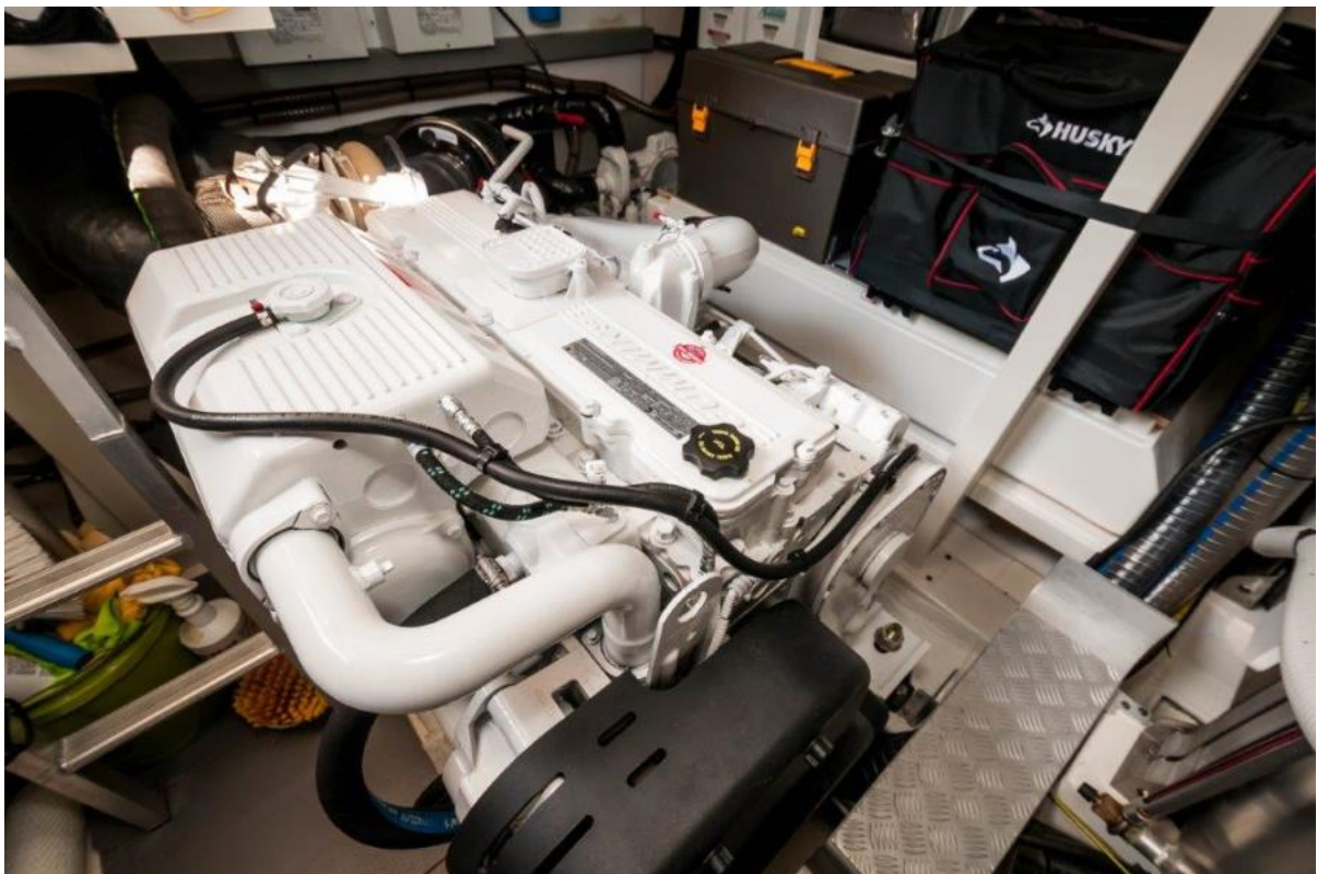
2017 Prestige 56 Flybridge Engine Room