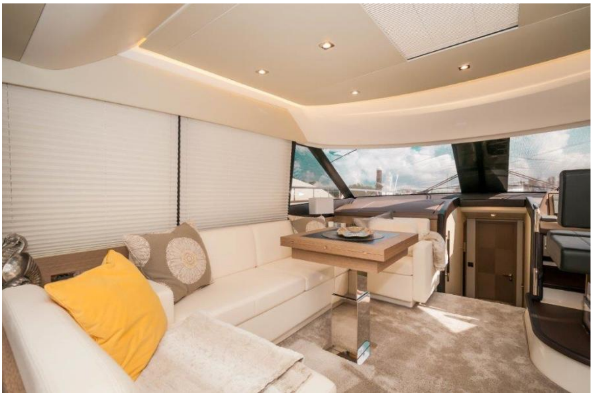
2017 Prestige 56 Flybridge Salon