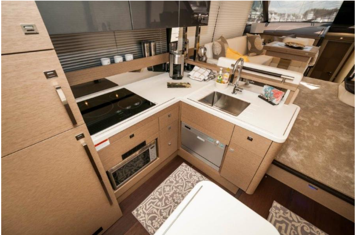
2017 Prestige 56 Flybridge Galley