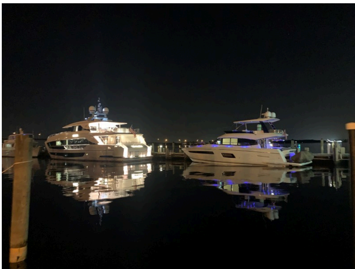
2017 Prestige 56 Flybridge