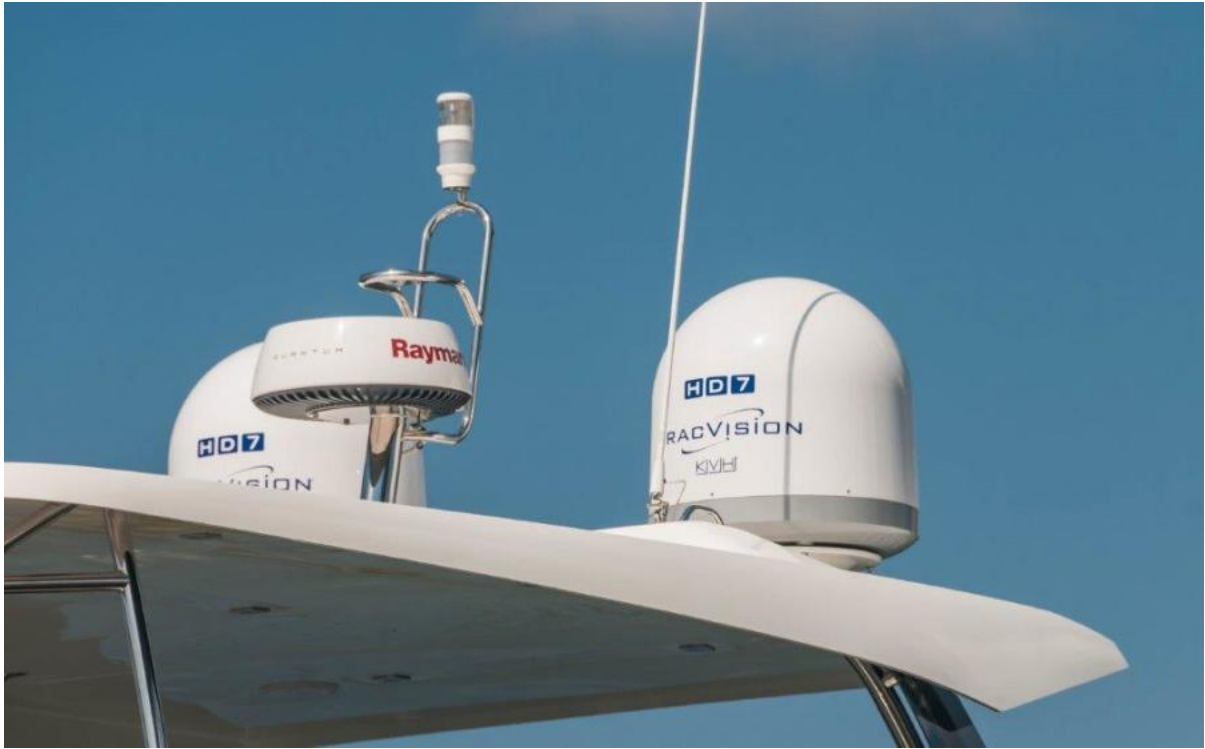
2017 Prestige 56 Flybridge Ants