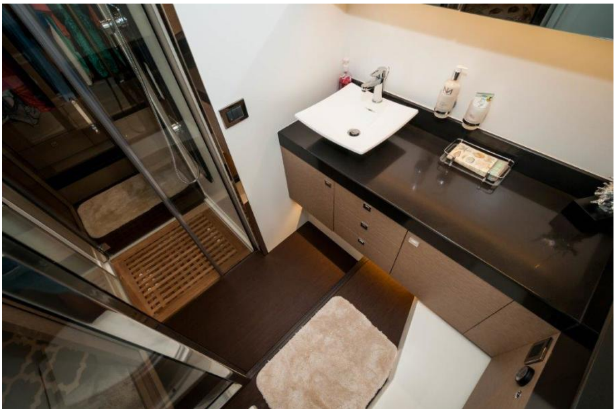
2017 Prestige 56 Flybridge Master Head