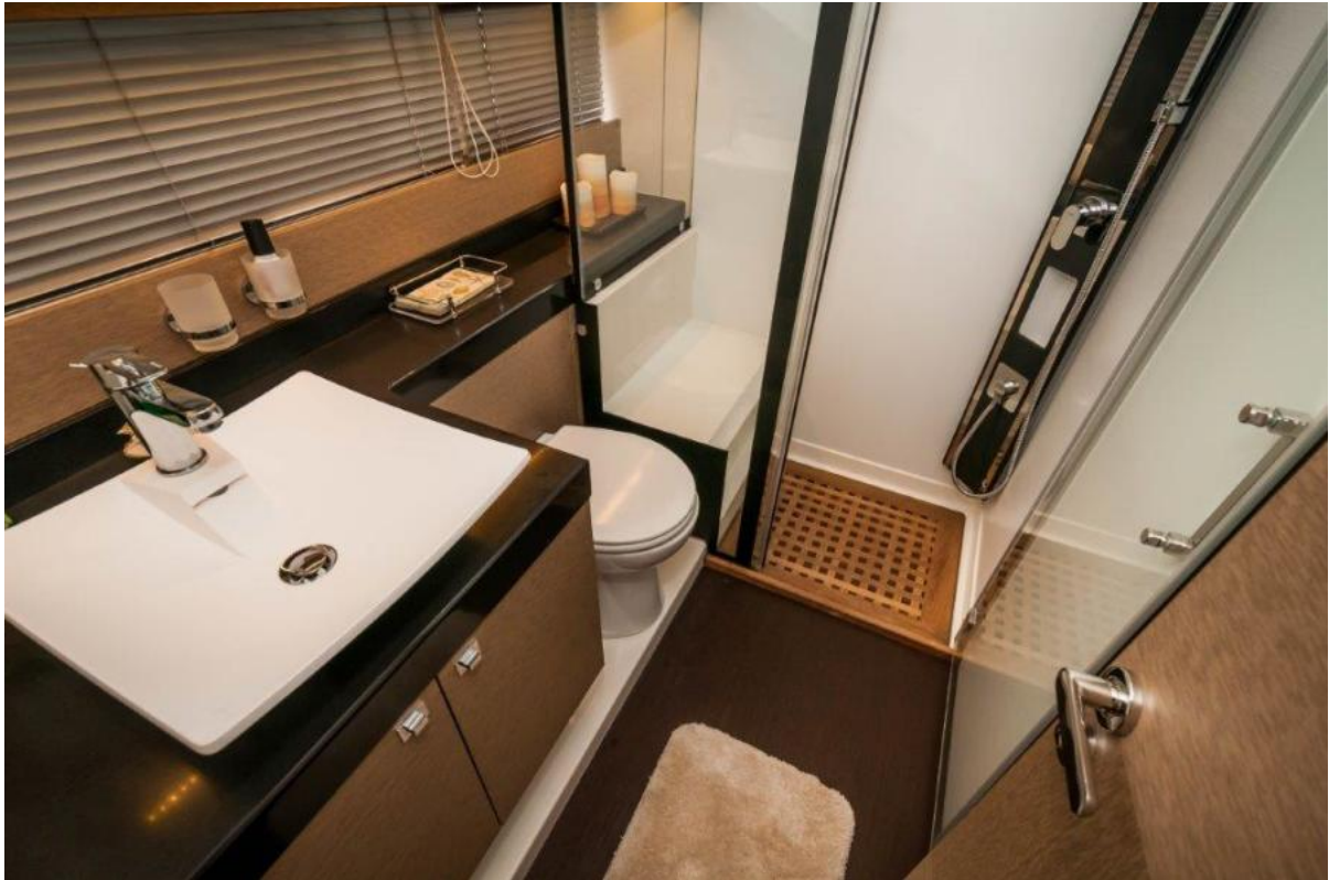
2017 Prestige 56 Flybridge VIP Head