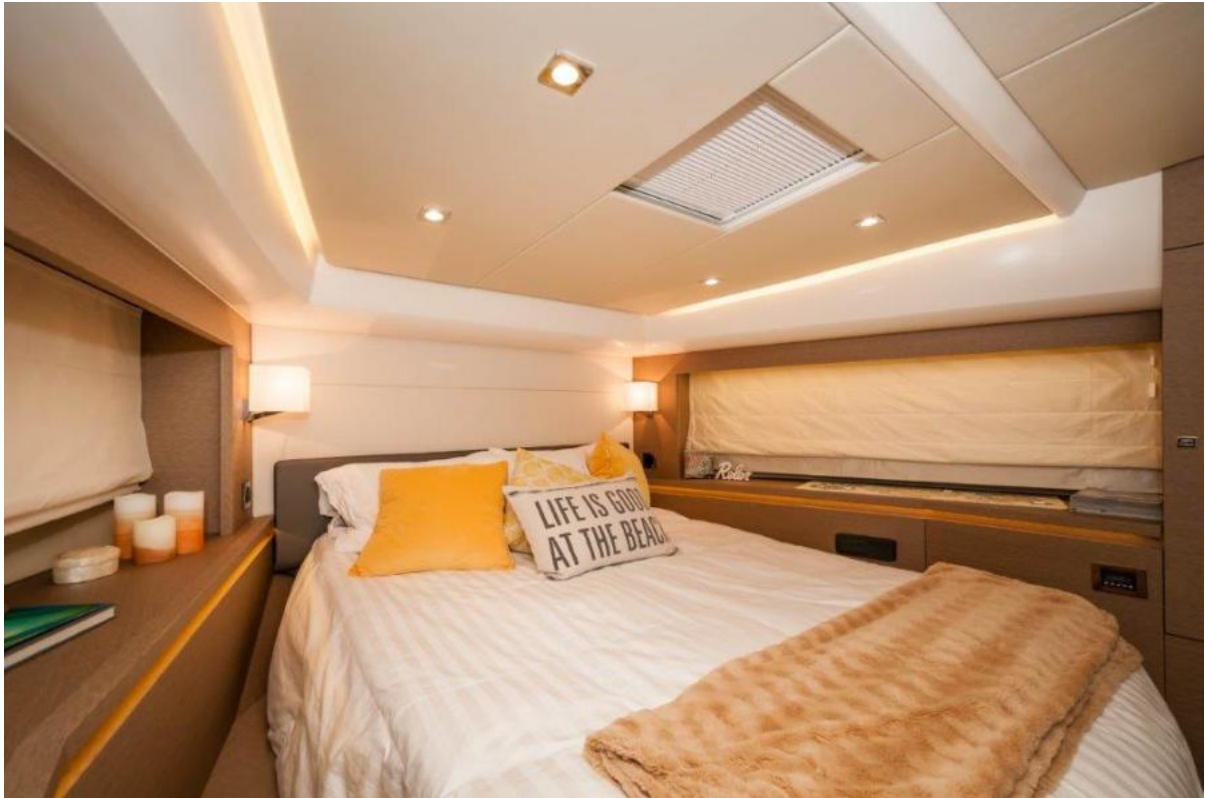
2017 Prestige 56 Flybridge VIP Stateroom