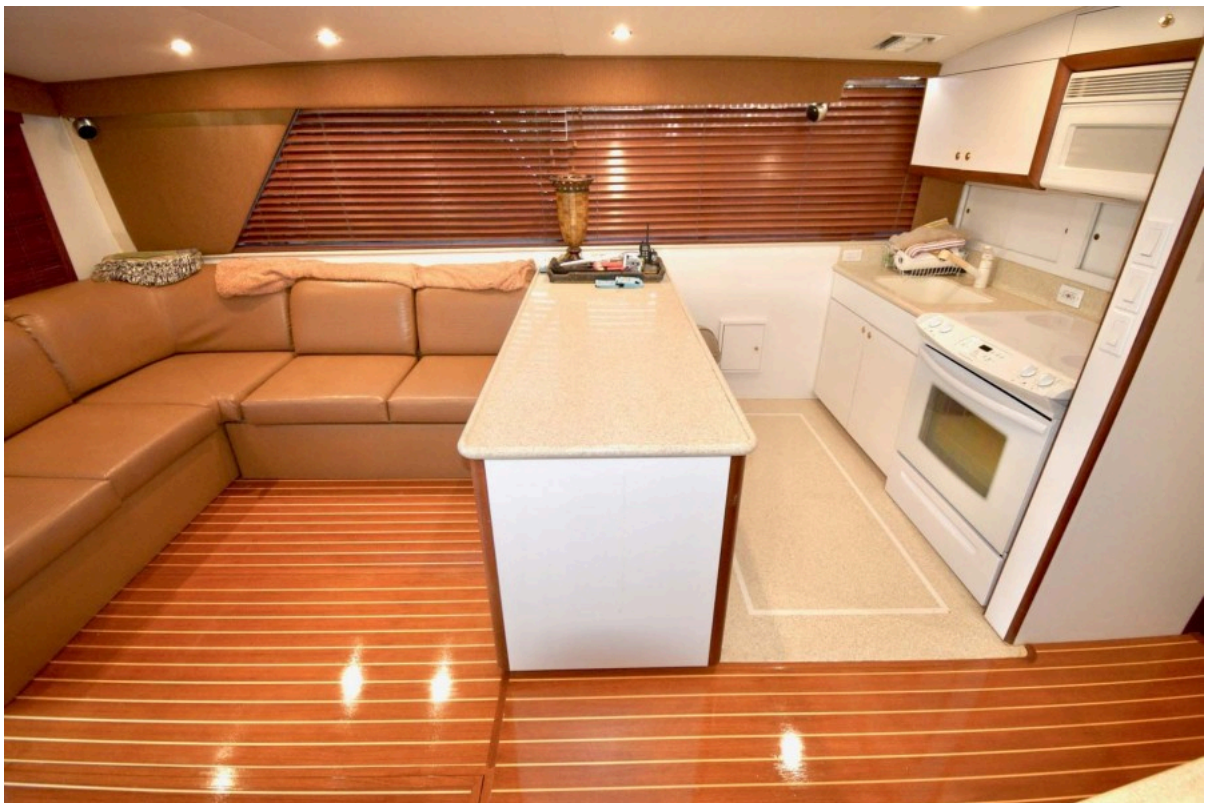
Salon Seating and Galley