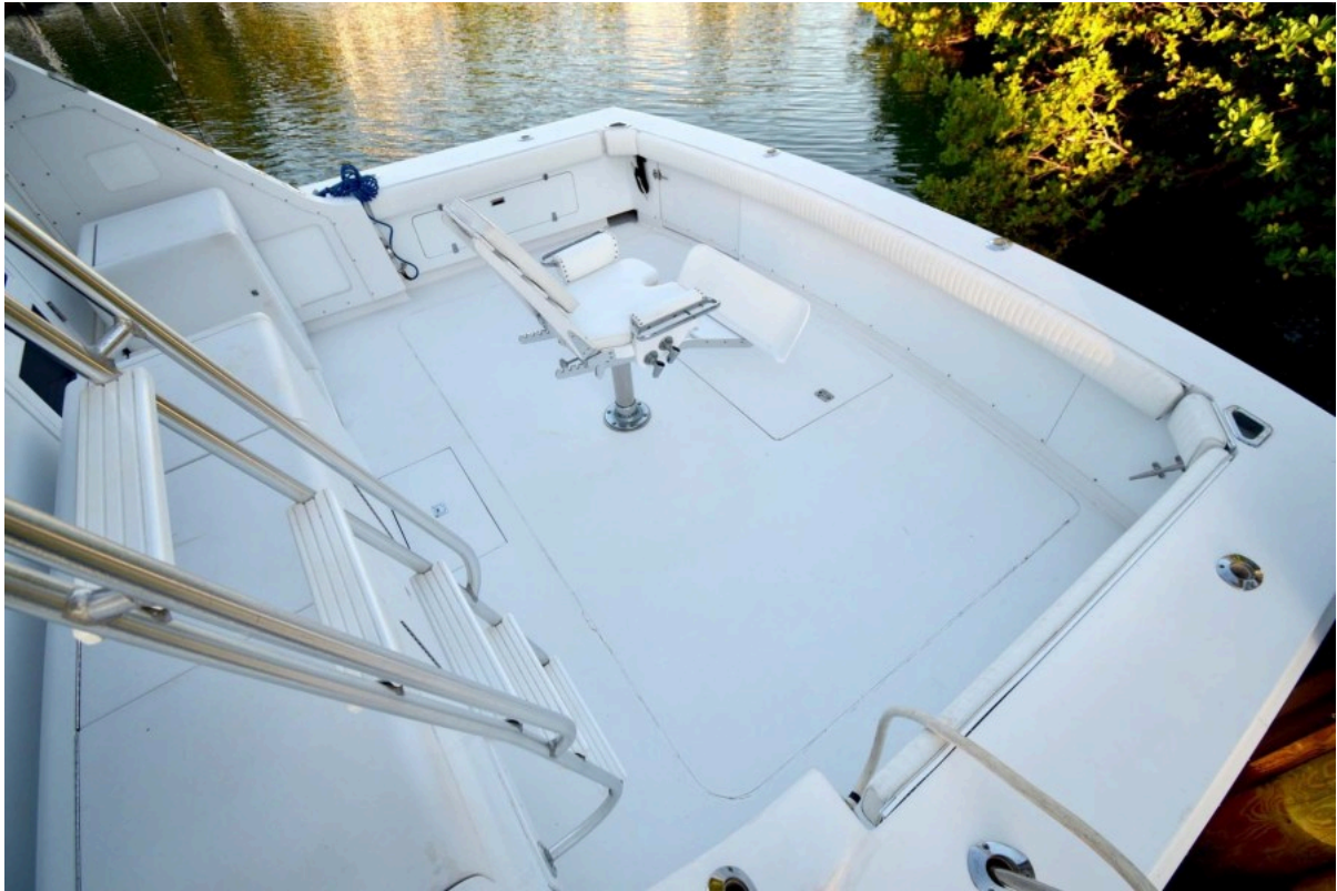
Cockpit with Fighting Chair