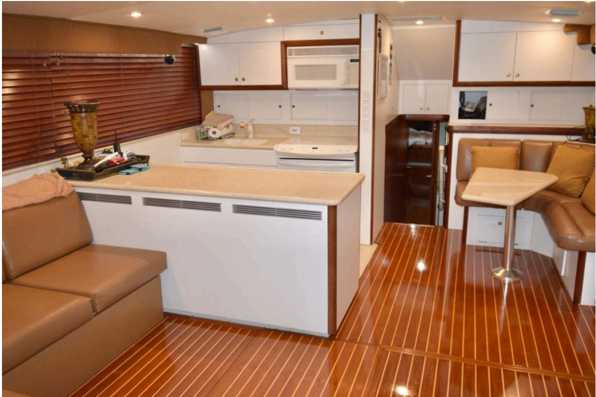
Galley and Dinette