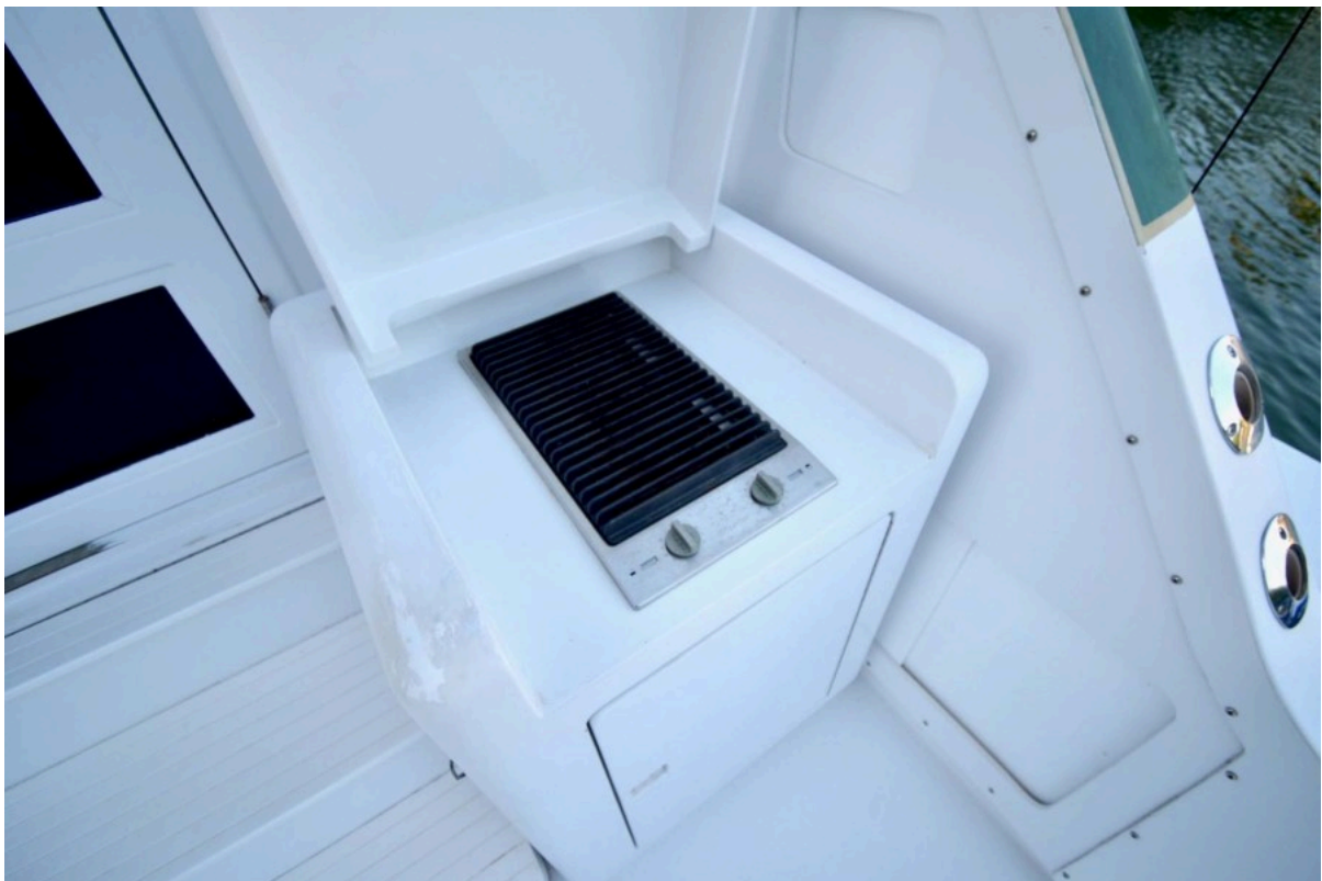
BBQ Built Into Cabinet