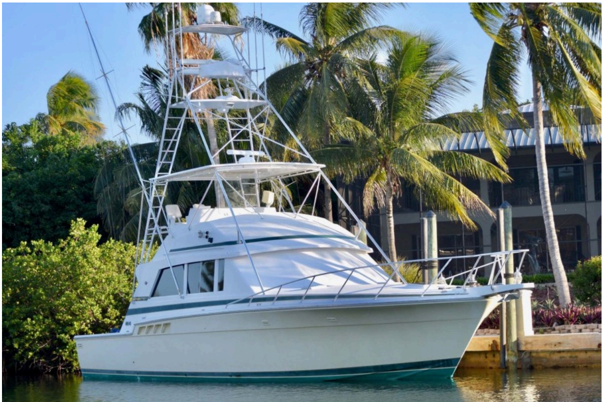
Starboard Bow View