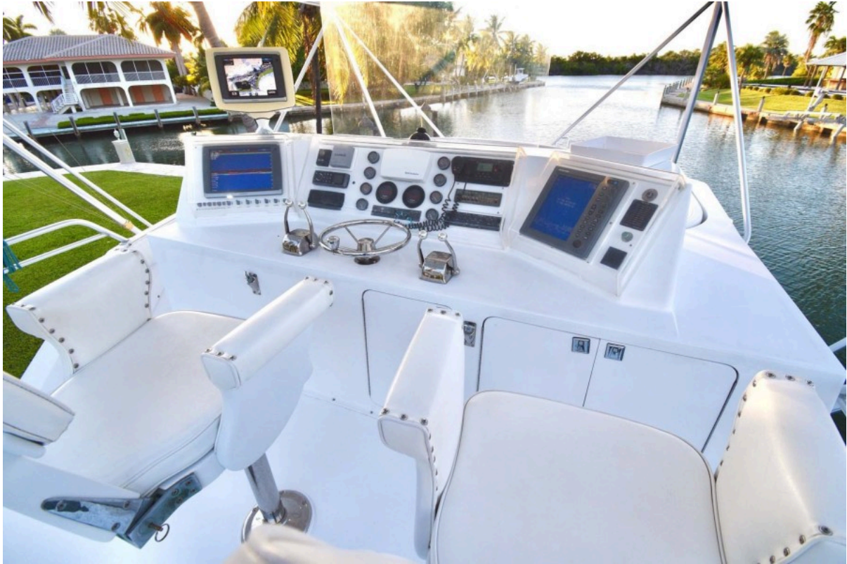
Helm Dash and Chairs