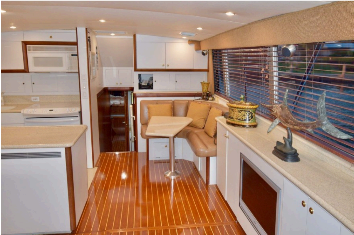
Salon and Galley