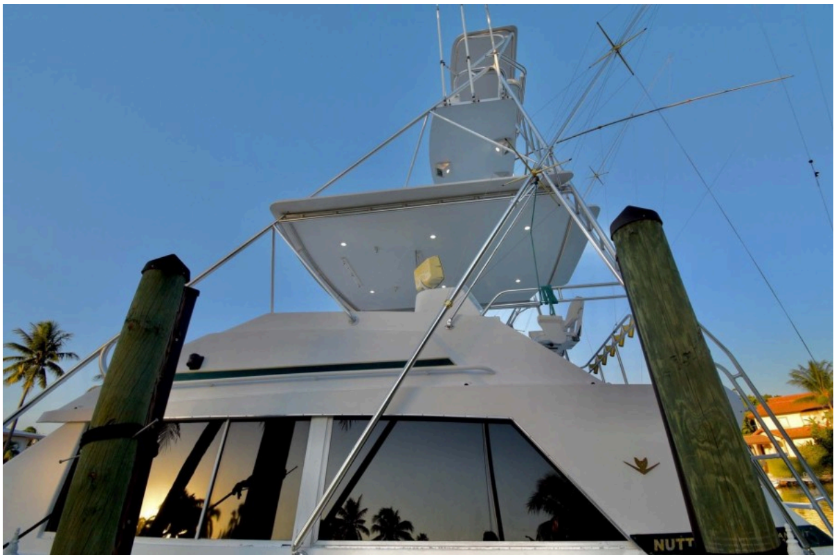
Portside View of Tower