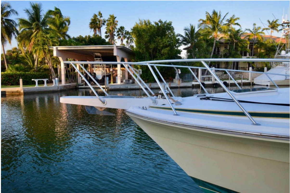
Bow Pulpit and Windlass