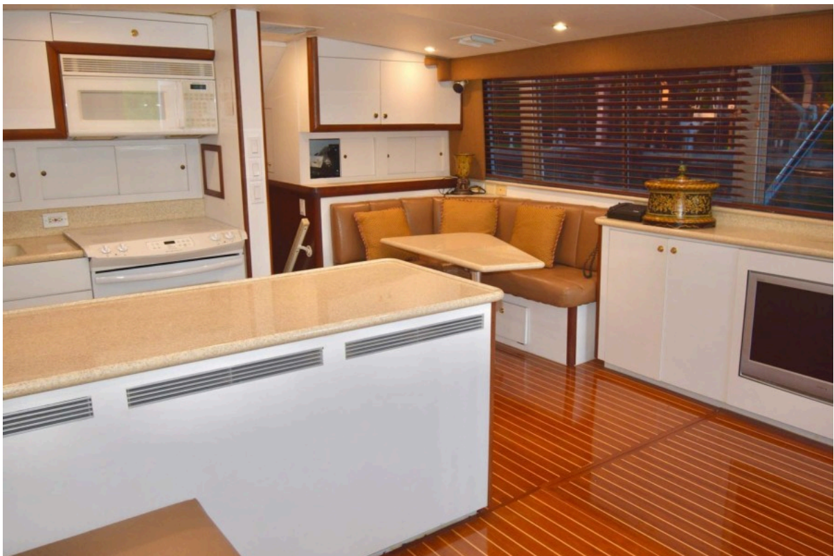
Galley and Dinette