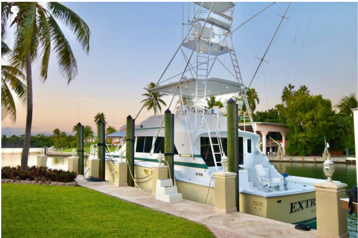
Port Aft Quarter