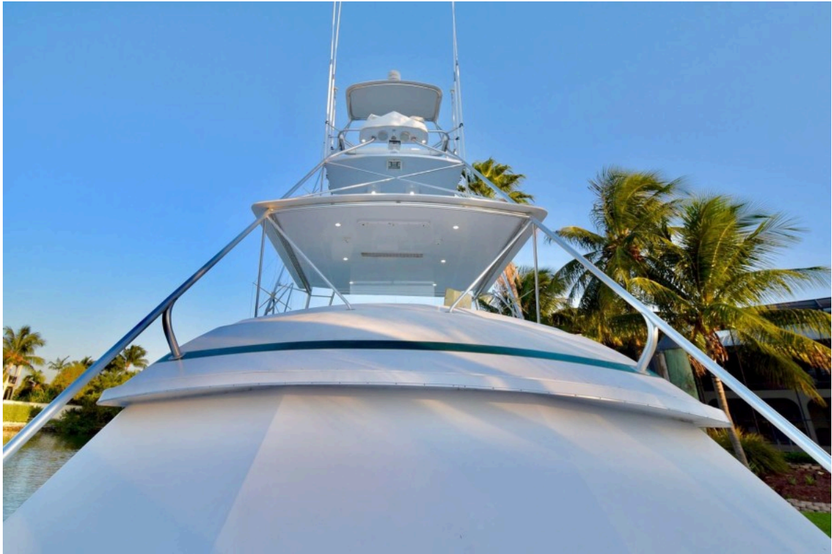
View of Tower