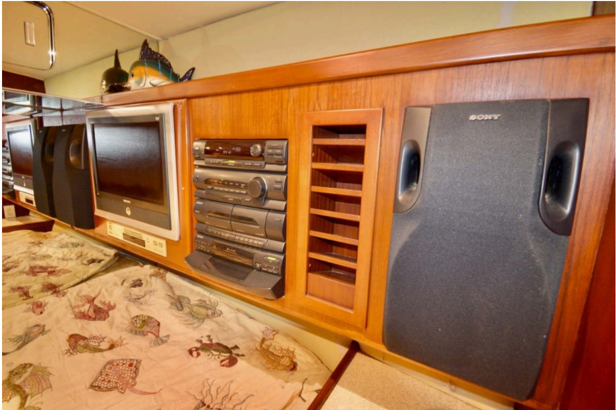
Master Stateroom Built-In Entertainment Center