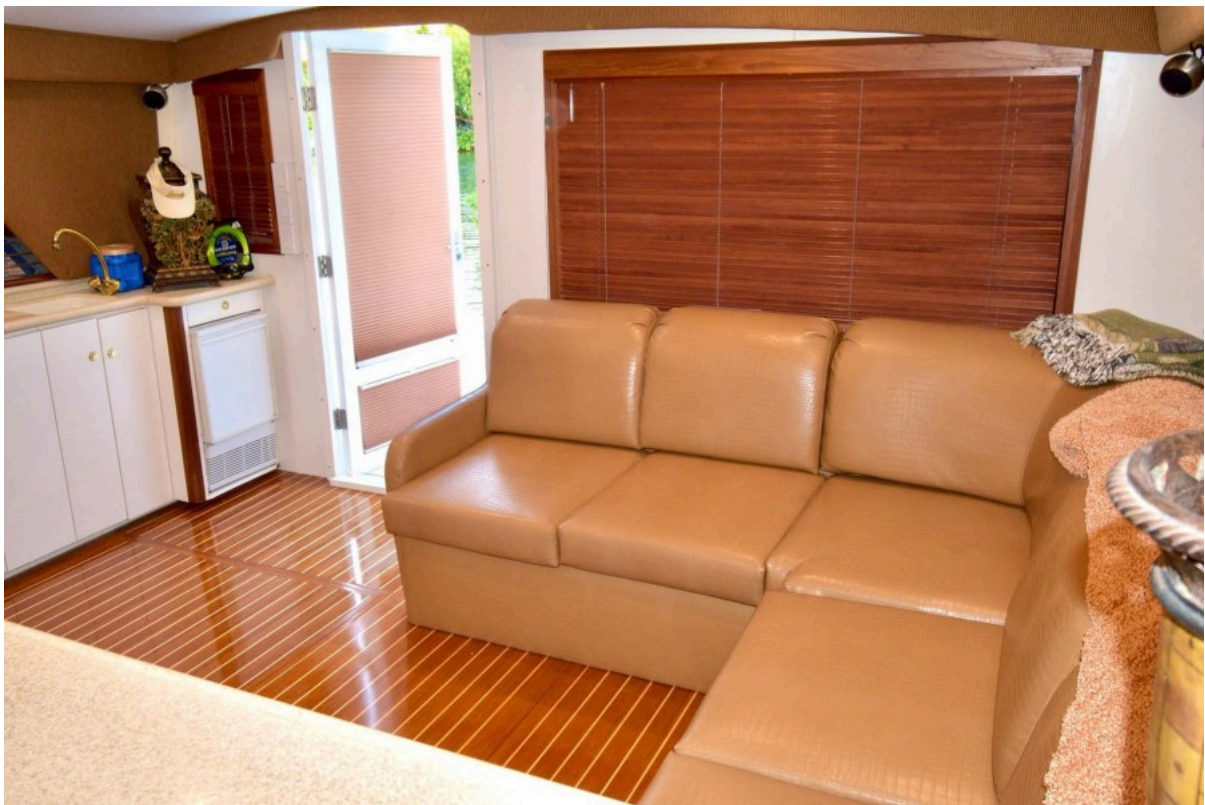
Salon L-Shaped Sofa