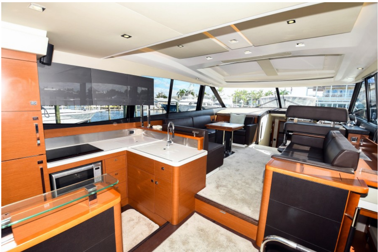
55 Prestige Salon