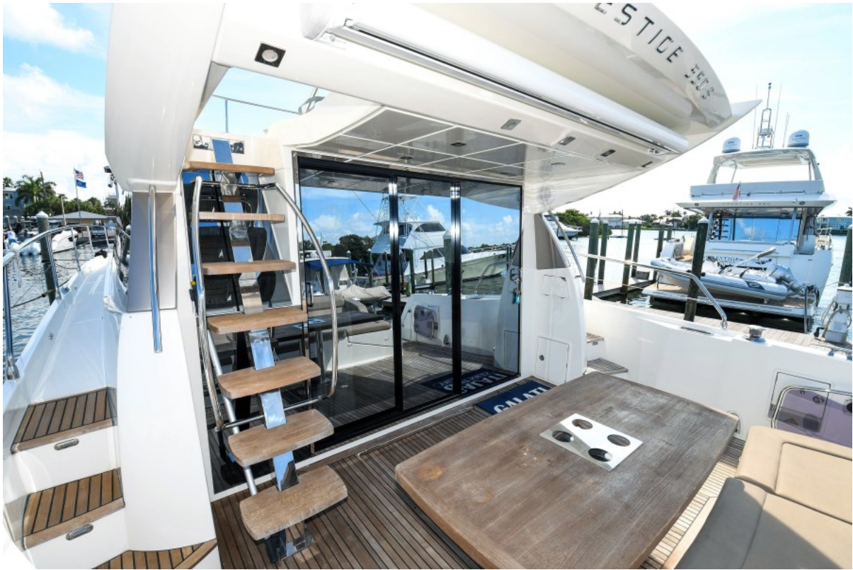
55 Prestige Cockpit