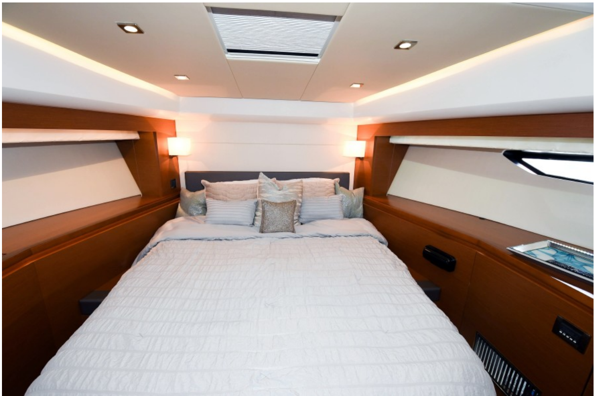
55 Prestige Stateroom