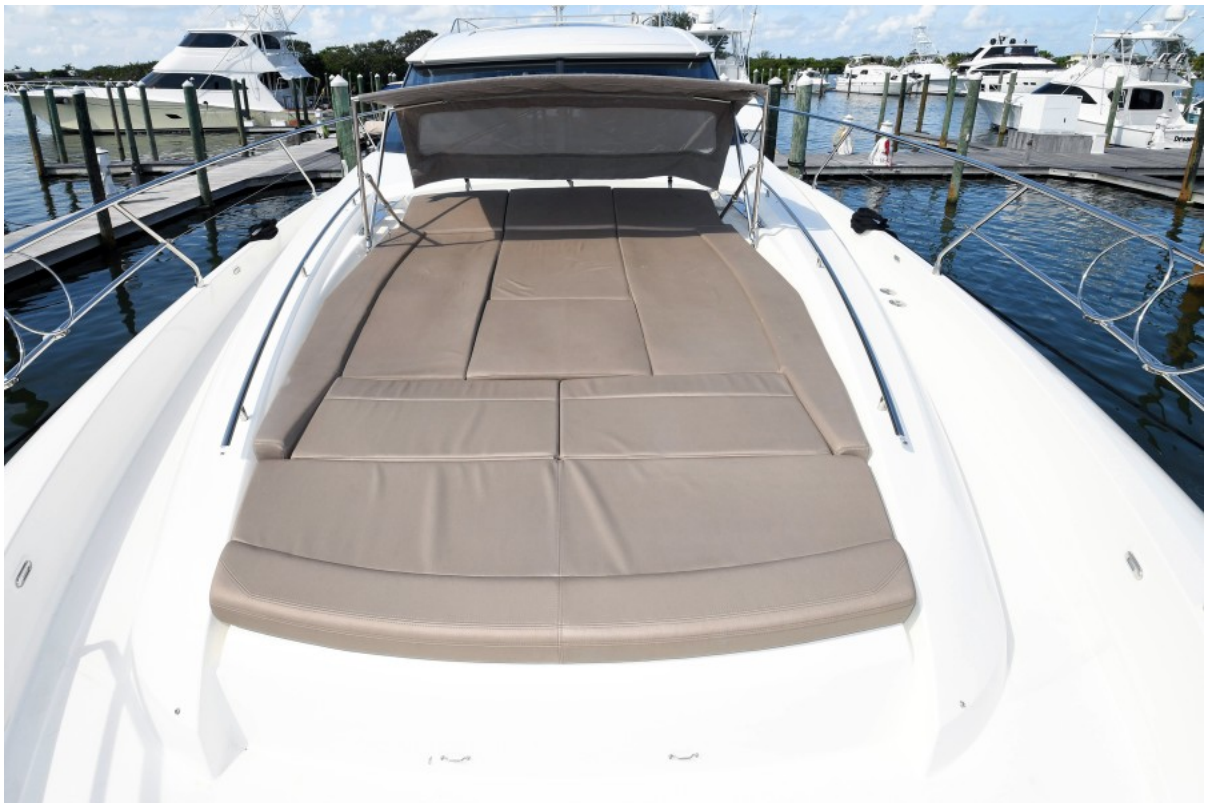
55 Prestige Bow Sunlounge