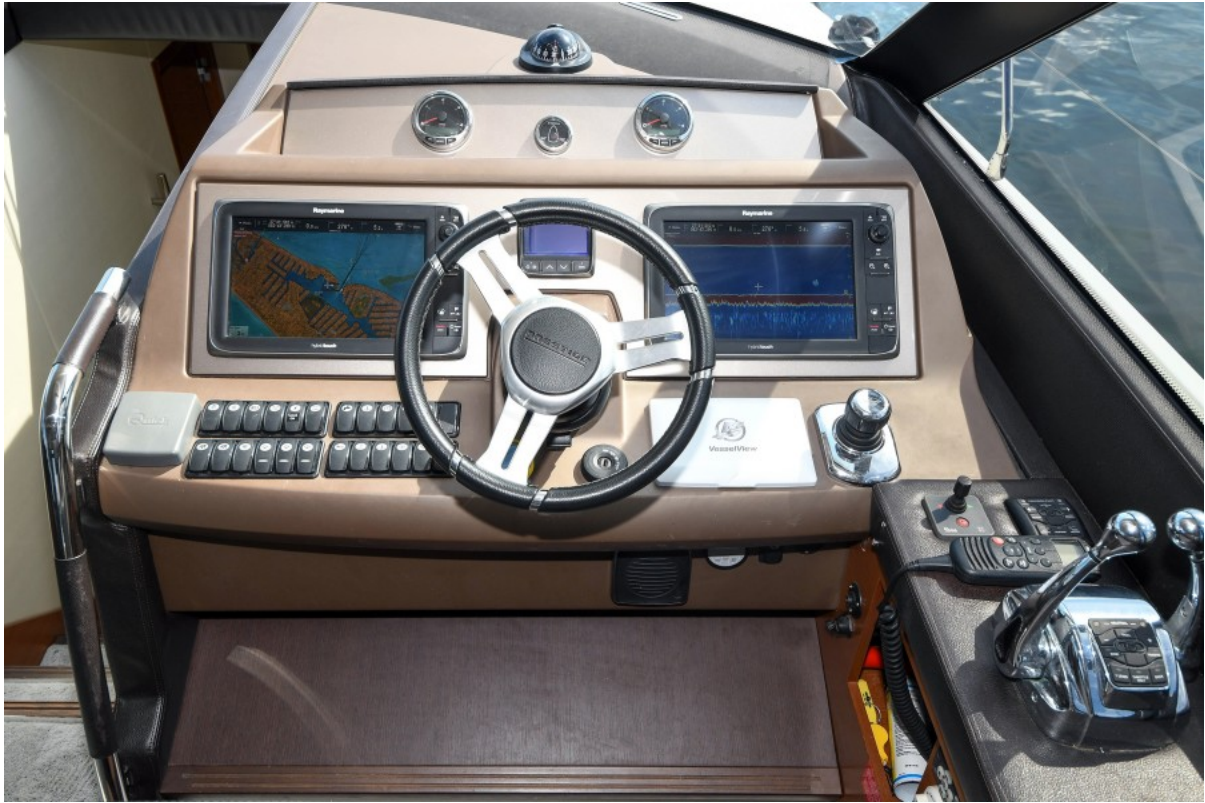
55 Prestige Helm