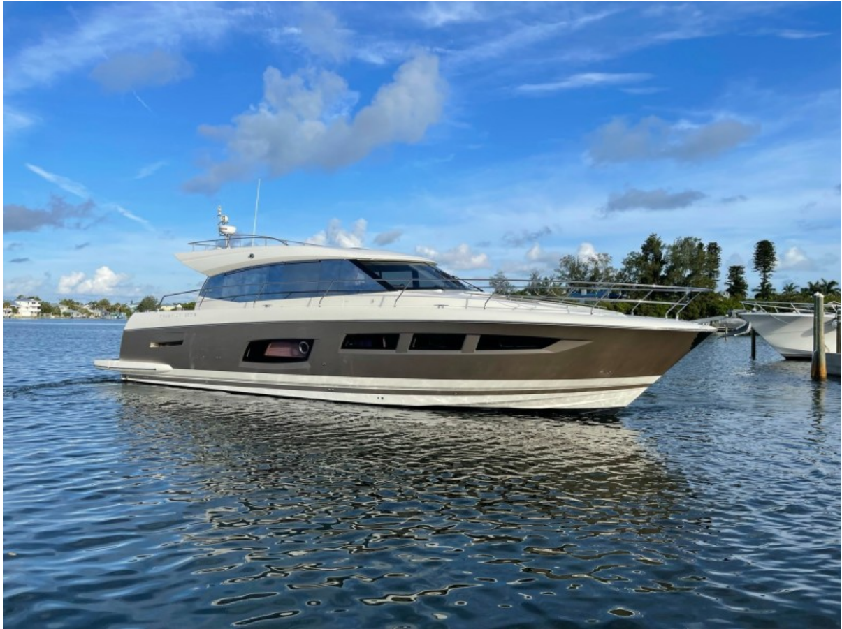
2015 Prestige 550 S