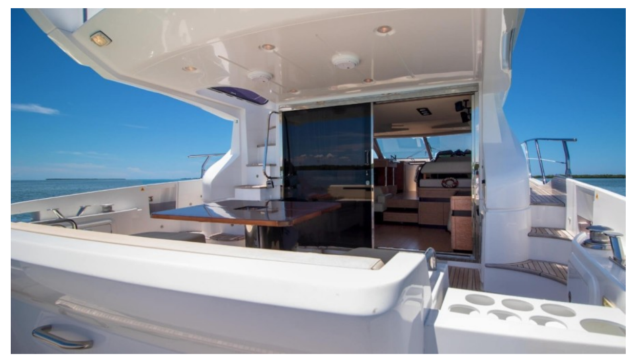
2014 54 Azimut Flybridge - Eddie's Money - Cockpit