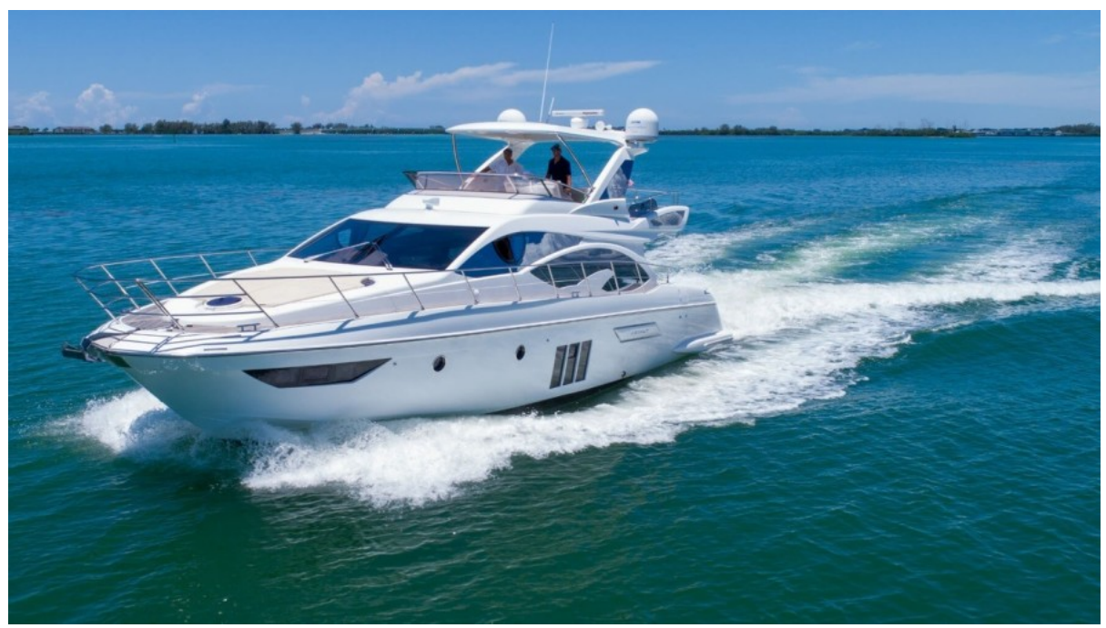
2014 54 Azimut Flybridge - Eddie's Money - Running Profile