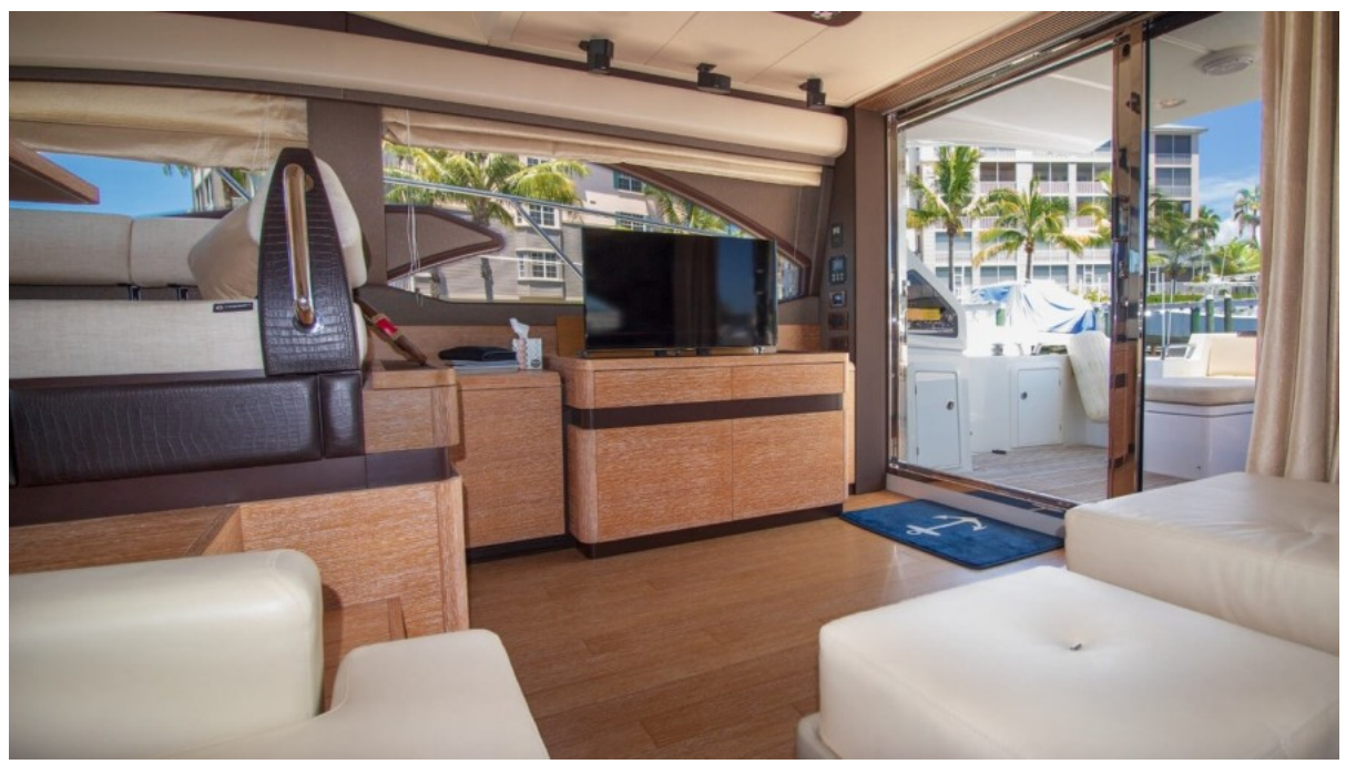
2014 54 Azimut Flybridge - Eddie's Money - Salon