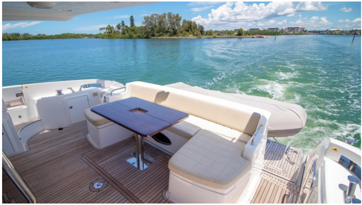
2014 54 Azimut Flybridge - Eddie's Money - Cockpit Seating