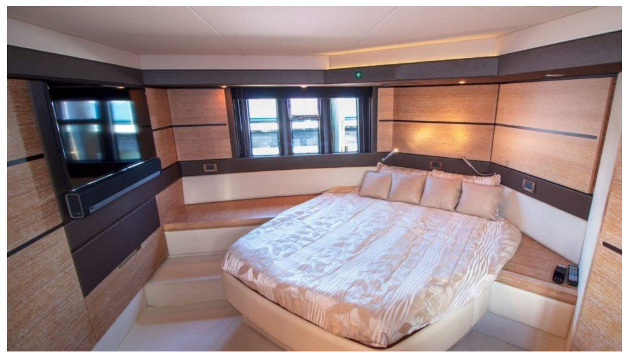
2014 54 Azimut Flybridge - Eddie's Money - Master Stateroom