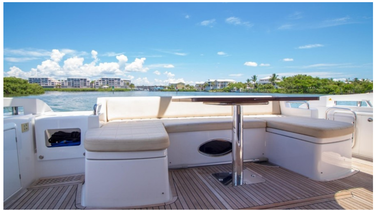
2014 54 Azimut Flybridge - Eddie's Money - Cockpit Dinette