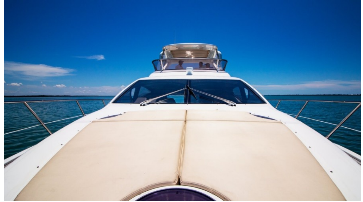
2014 54 Azimut Flybridge - Eddie's Money - Foredeck