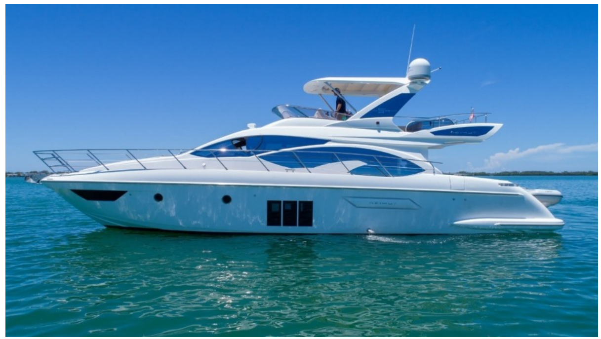
2014 54 Azimut Flybridge - Eddie's Money - Profile