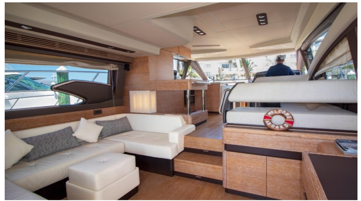
2014 54 Azimut Flybridge - Eddie's Money - Salon