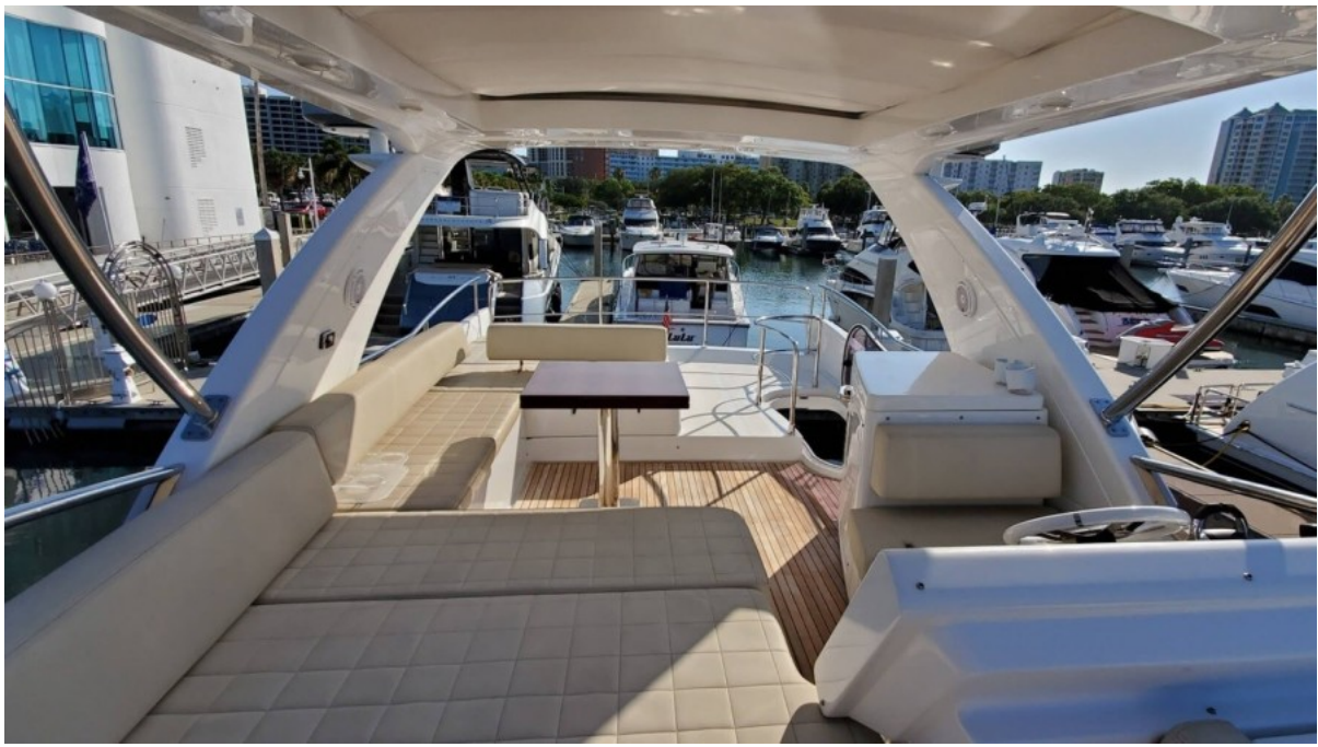
2014 54 Azimut Flybridge - Eddie's Money - Flybridge