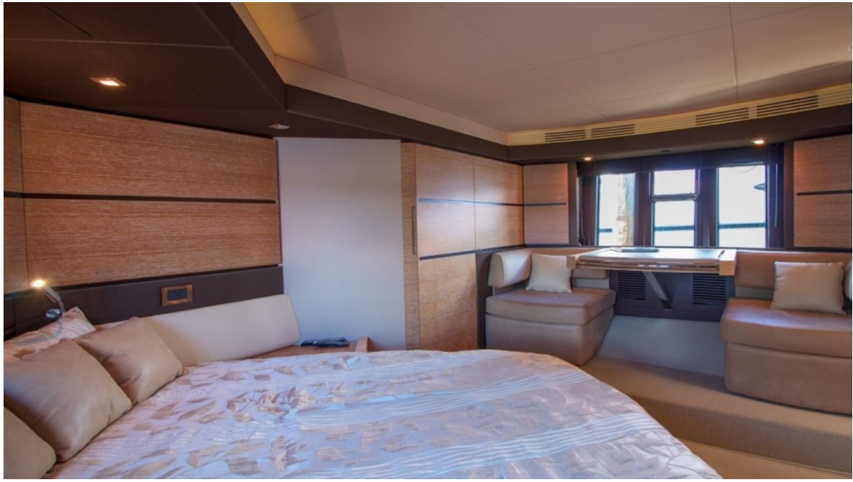
2014 54 Azimut Flybridge - Eddie's Money - Master Stateroom