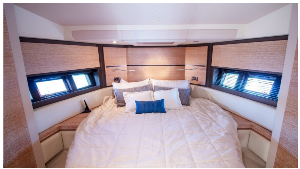
2014 54 Azimut Flybridge - Eddie's Money - VIP Stateroom