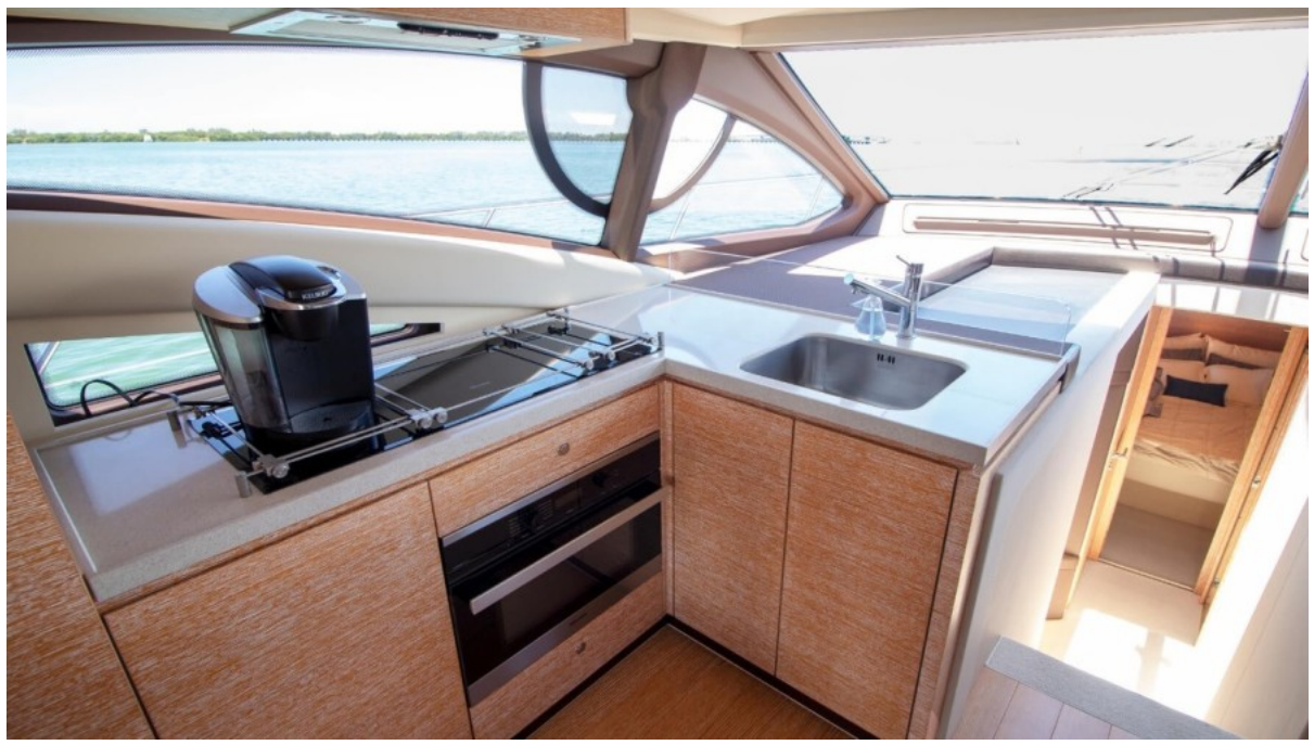
2014 54 Azimut Flybridge - Eddie's Money - Galley