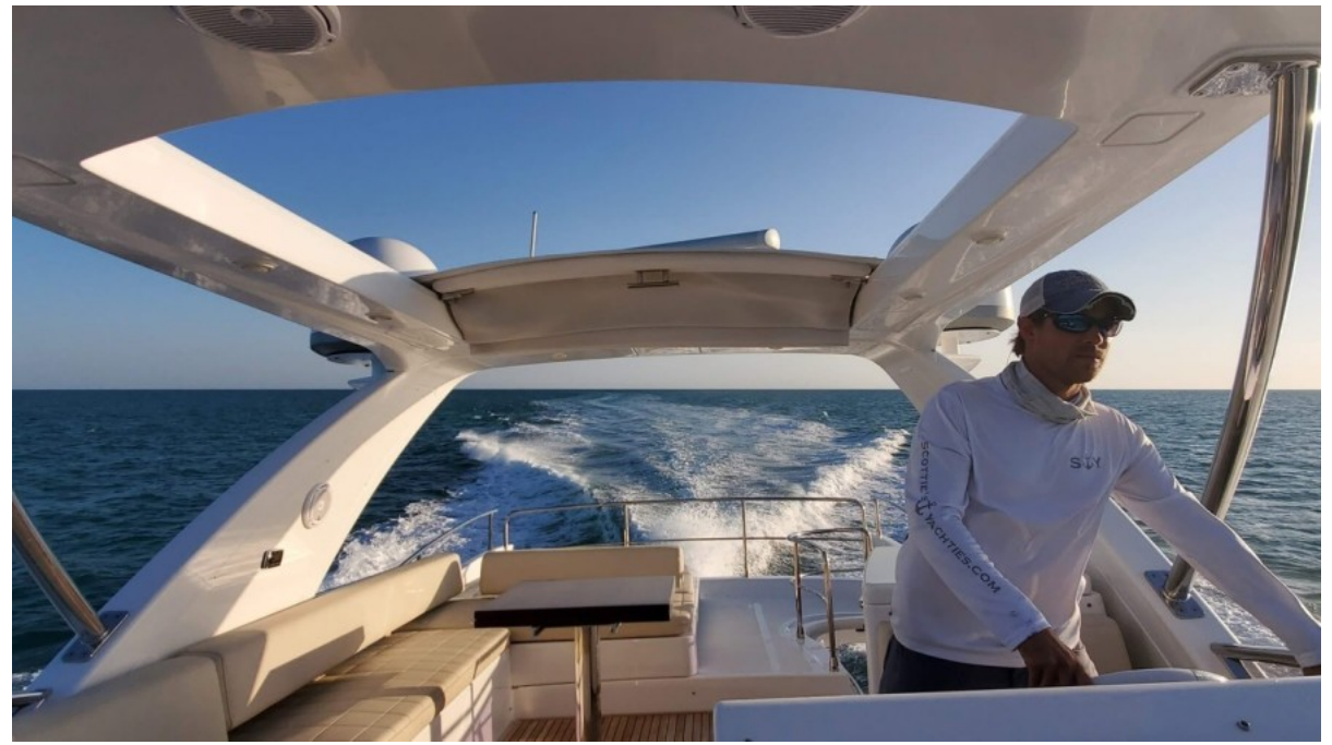
2014 54 Azimut Flybridge - Eddie's Money - Flybridge