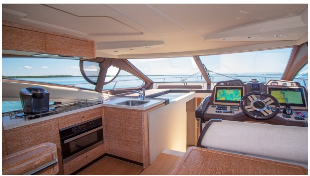
2014 54 Azimut Flybridge - Eddie's Money - Galley / Helm