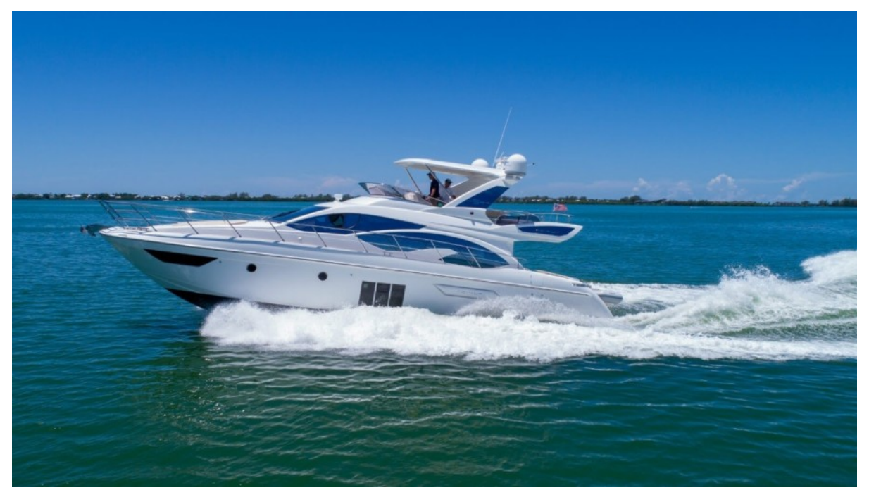
2014 54 Azimut Flybridge - Eddie's Money - Running Profile