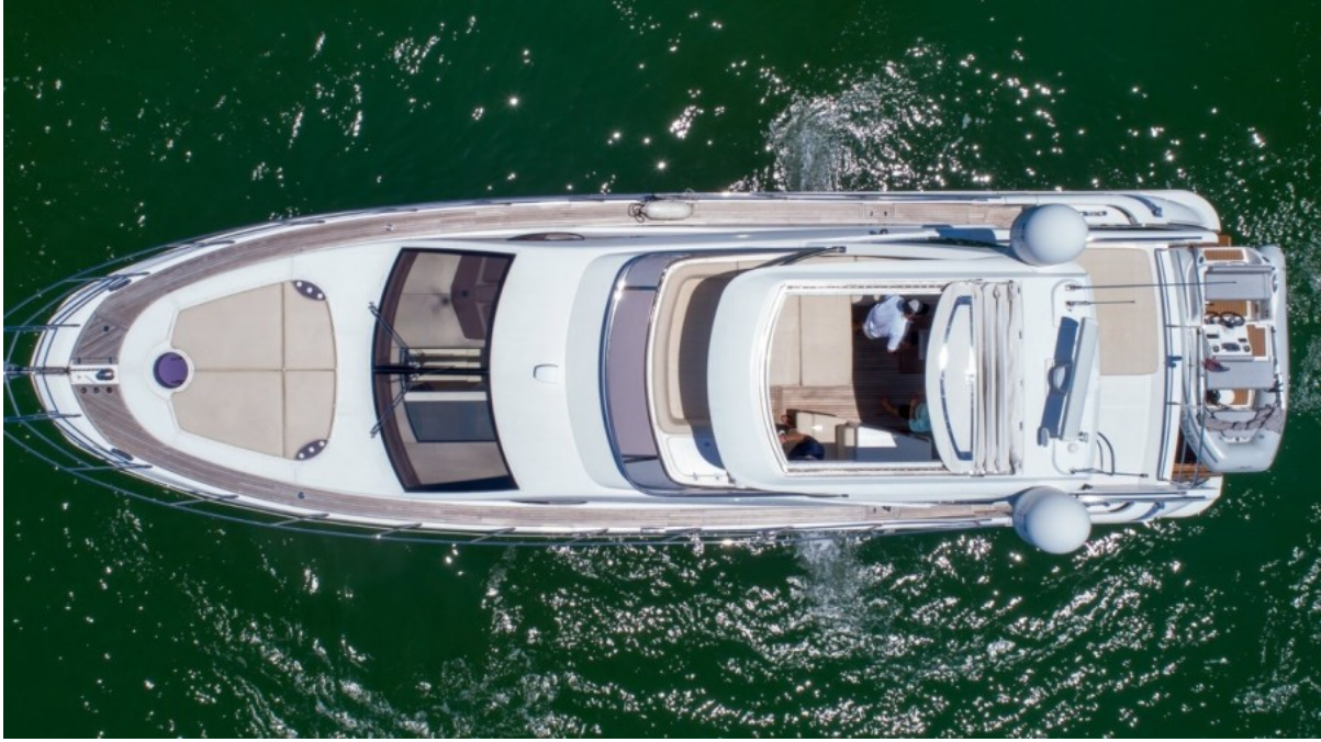
2014 54 Azimut Flybridge - Eddie's Money - Aerial Profile