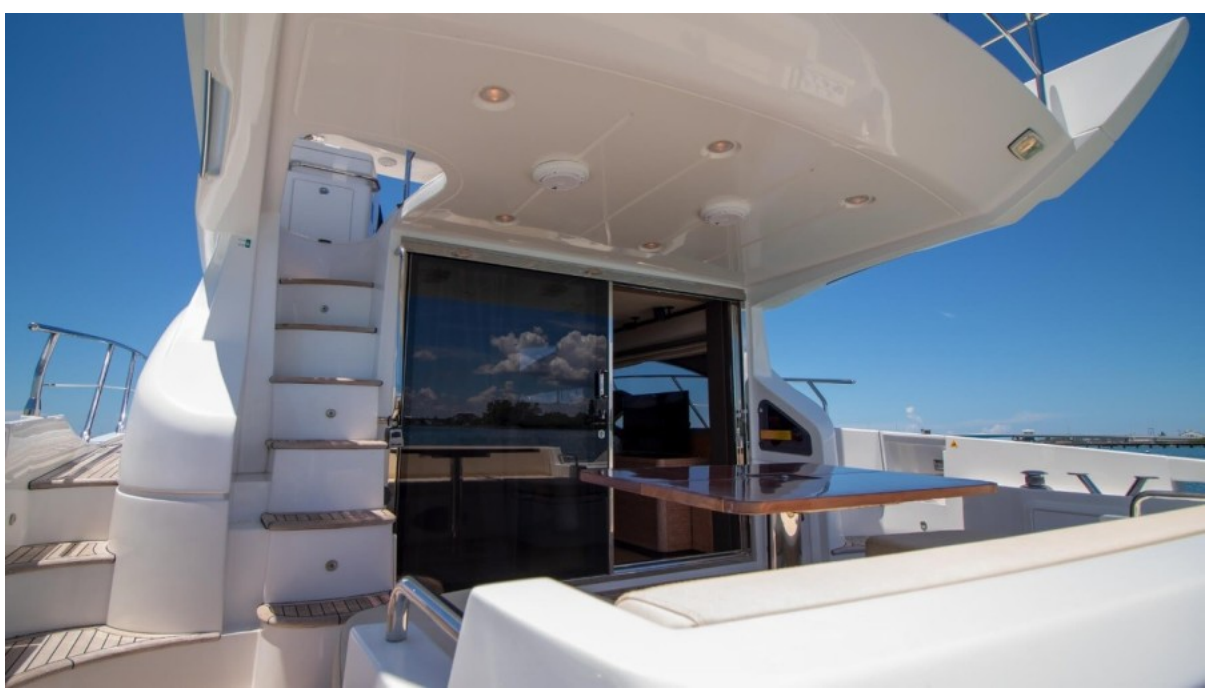
2014 54 Azimut Flybridge - Eddie's Money - Cockpit