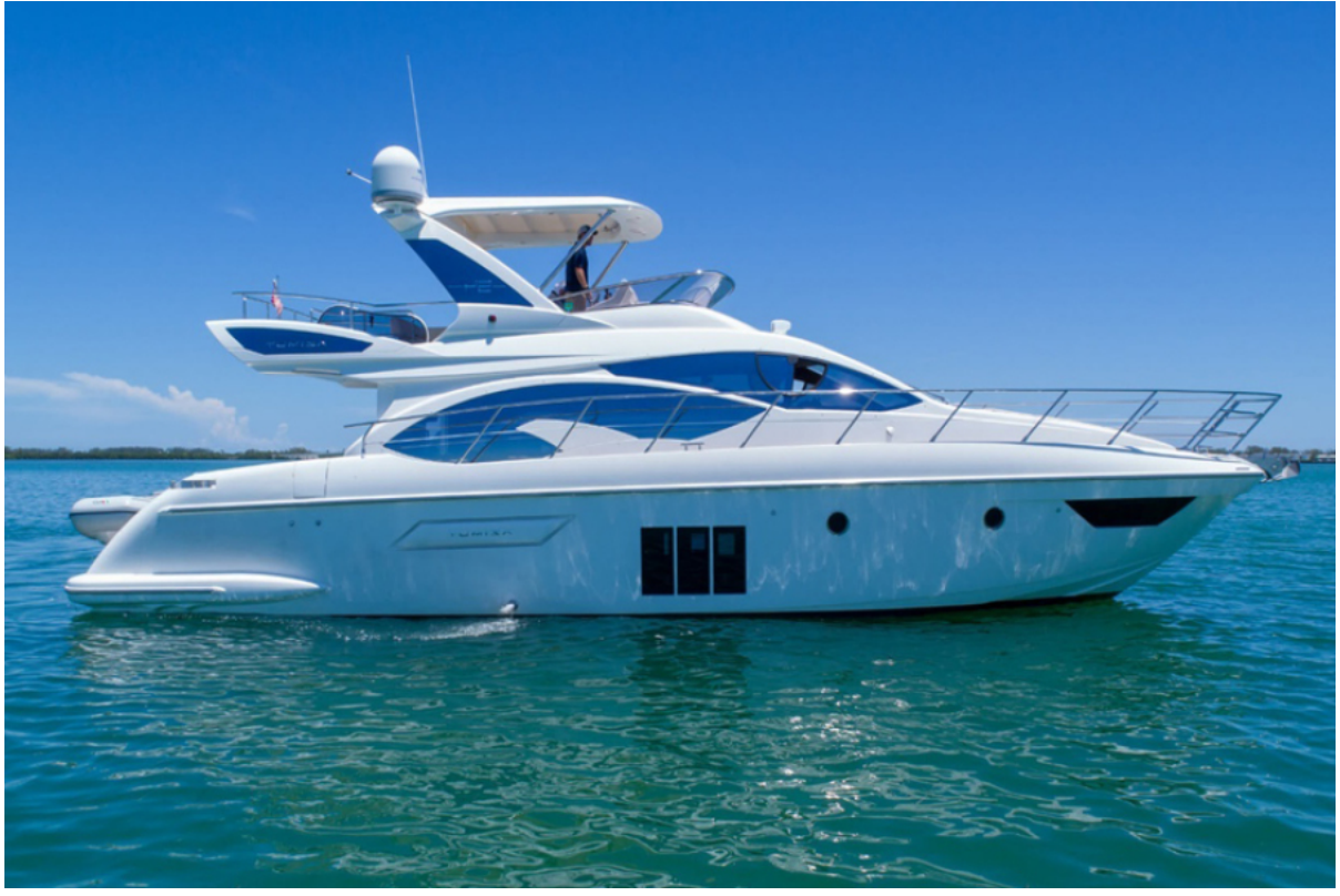
2014 54 Azimut Flybridge - Eddie's Money - Profile