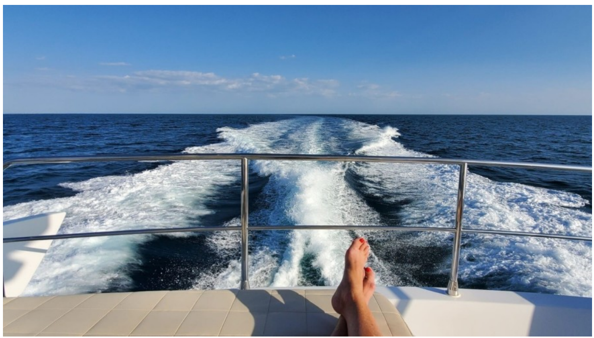
2014 54 Azimut Flybridge - Eddie's Money - Flybridge