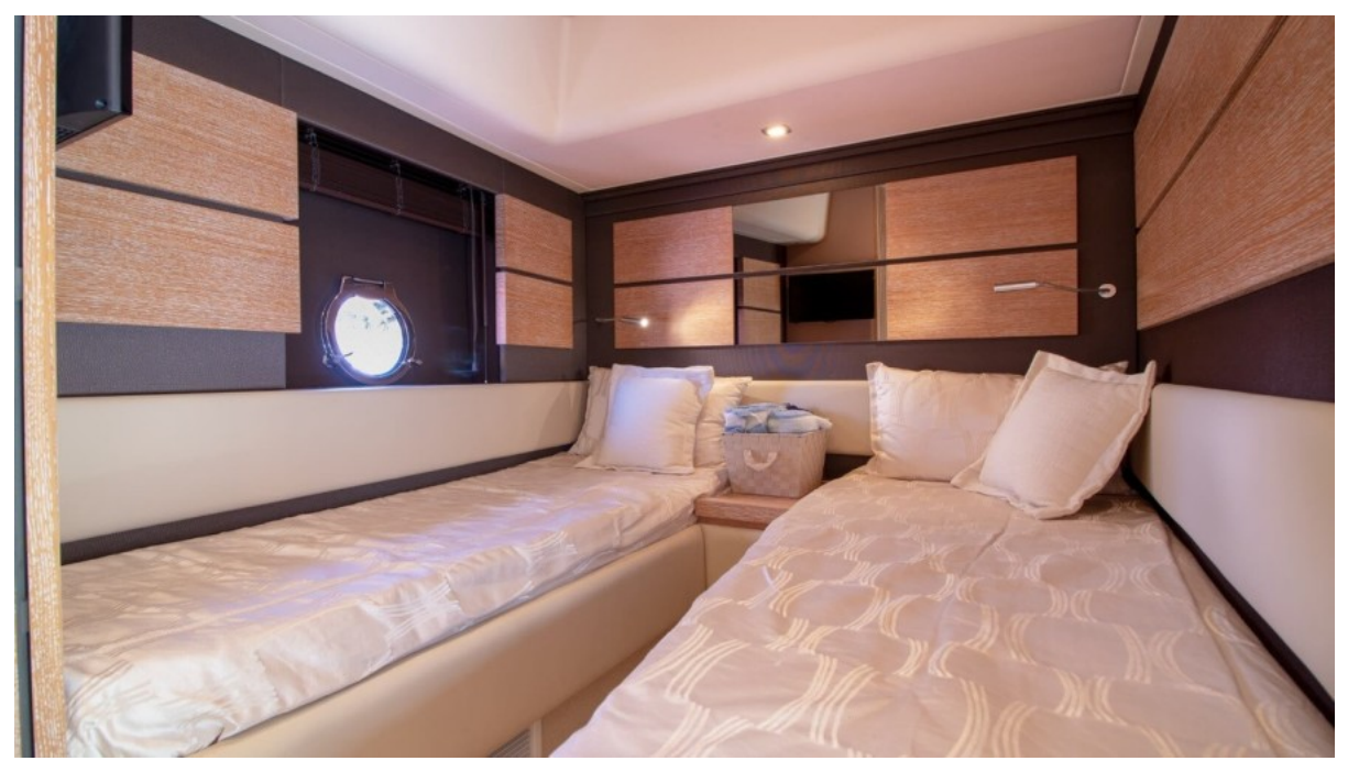
2014 54 Azimut Flybridge - Eddie's Money - Guest Stateroom