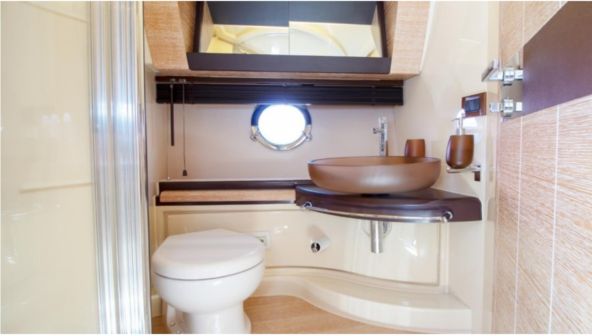
2014 54 Azimut Flybridge - Eddie's Money - VIP / Guest Head