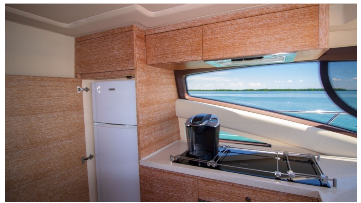
2014 54 Azimut Flybridge - Eddie's Money - Galley