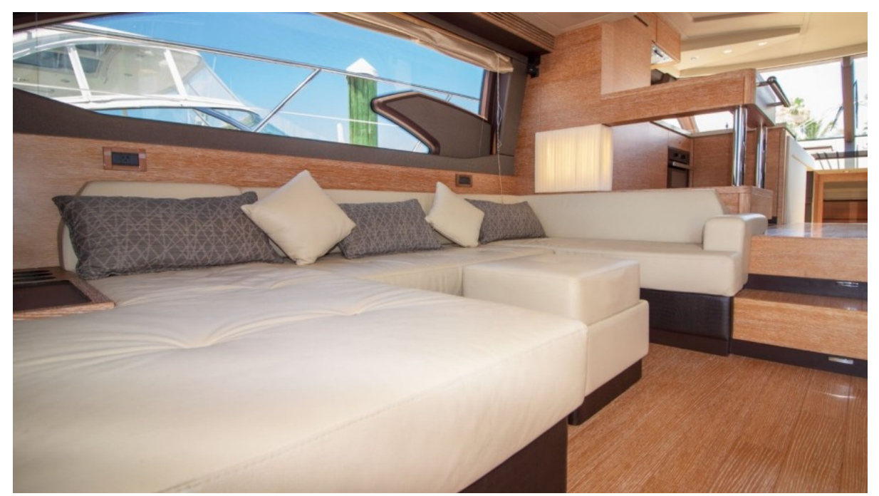
2014 54 Azimut Flybridge - Eddie's Money - Salon / Sleeper Sofa