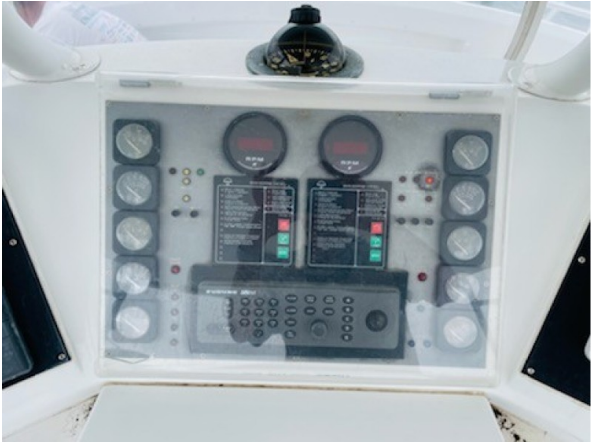
1990 Bertram 50 Convertible Helm