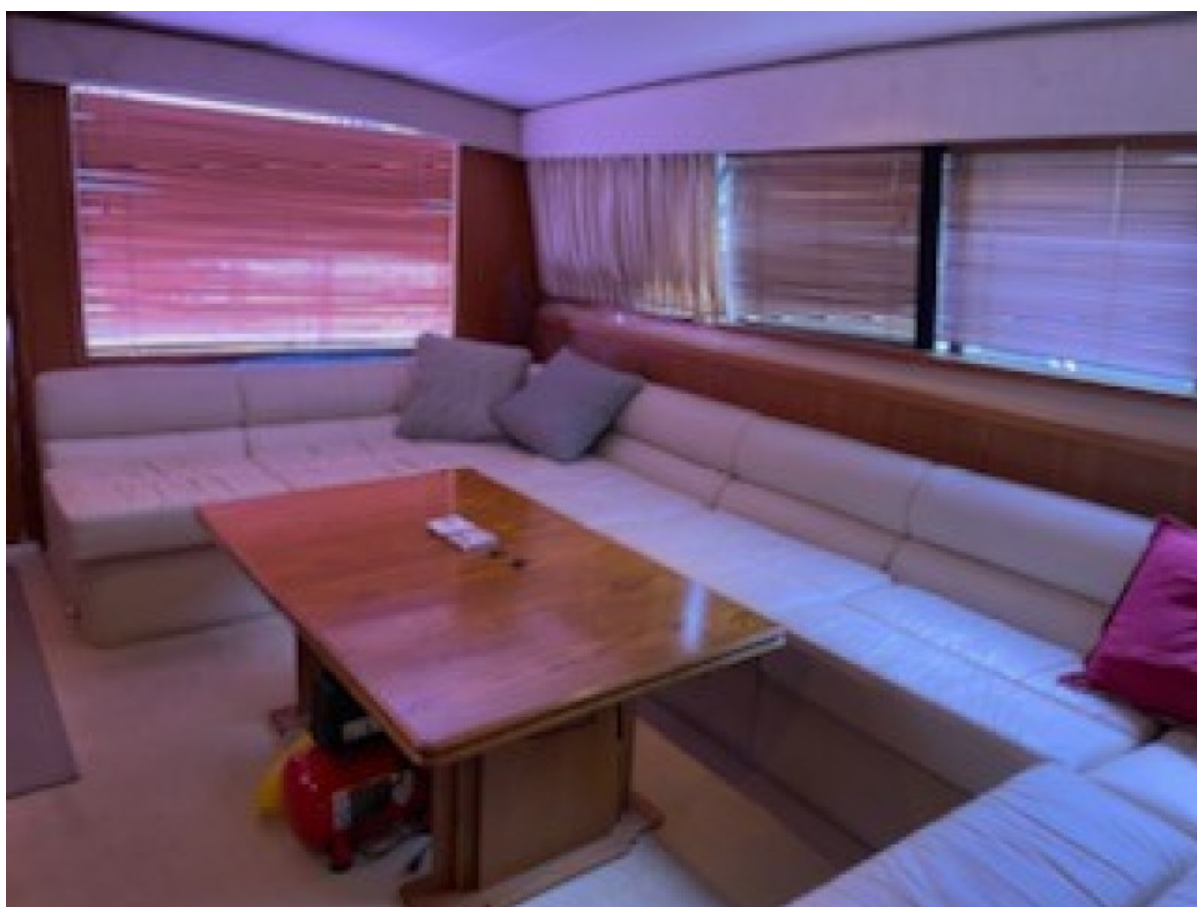
1990 Bertram 50 Convertible Dining