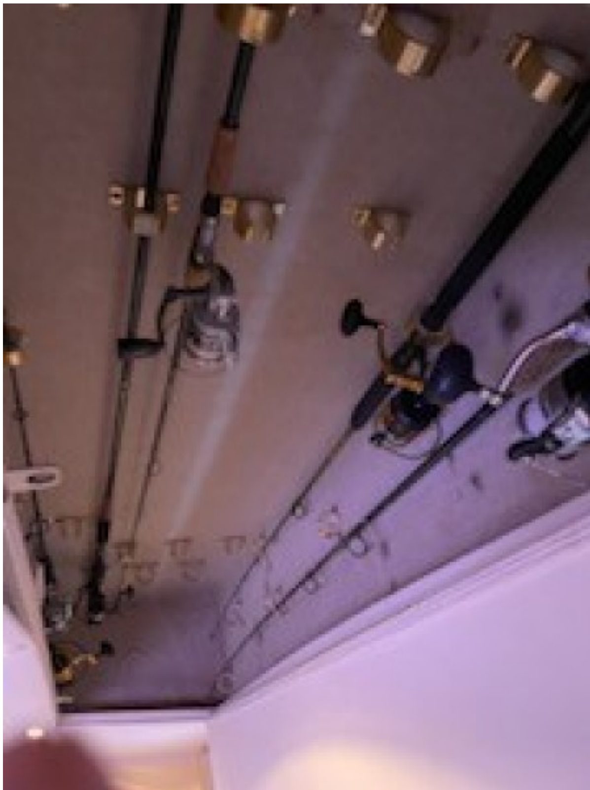
1990 Bertram 50 Convertible (19)