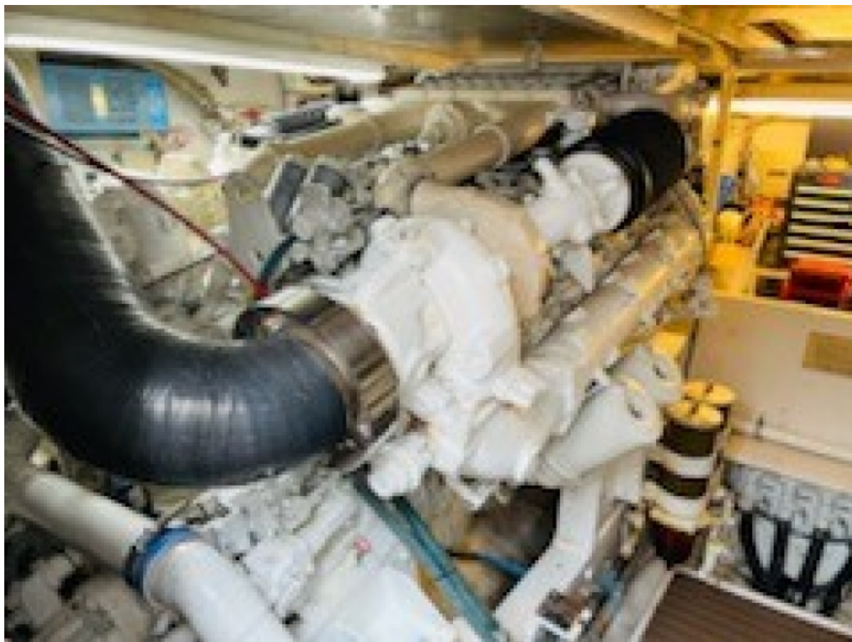
1990 Bertram 50 Convertible Engine Room