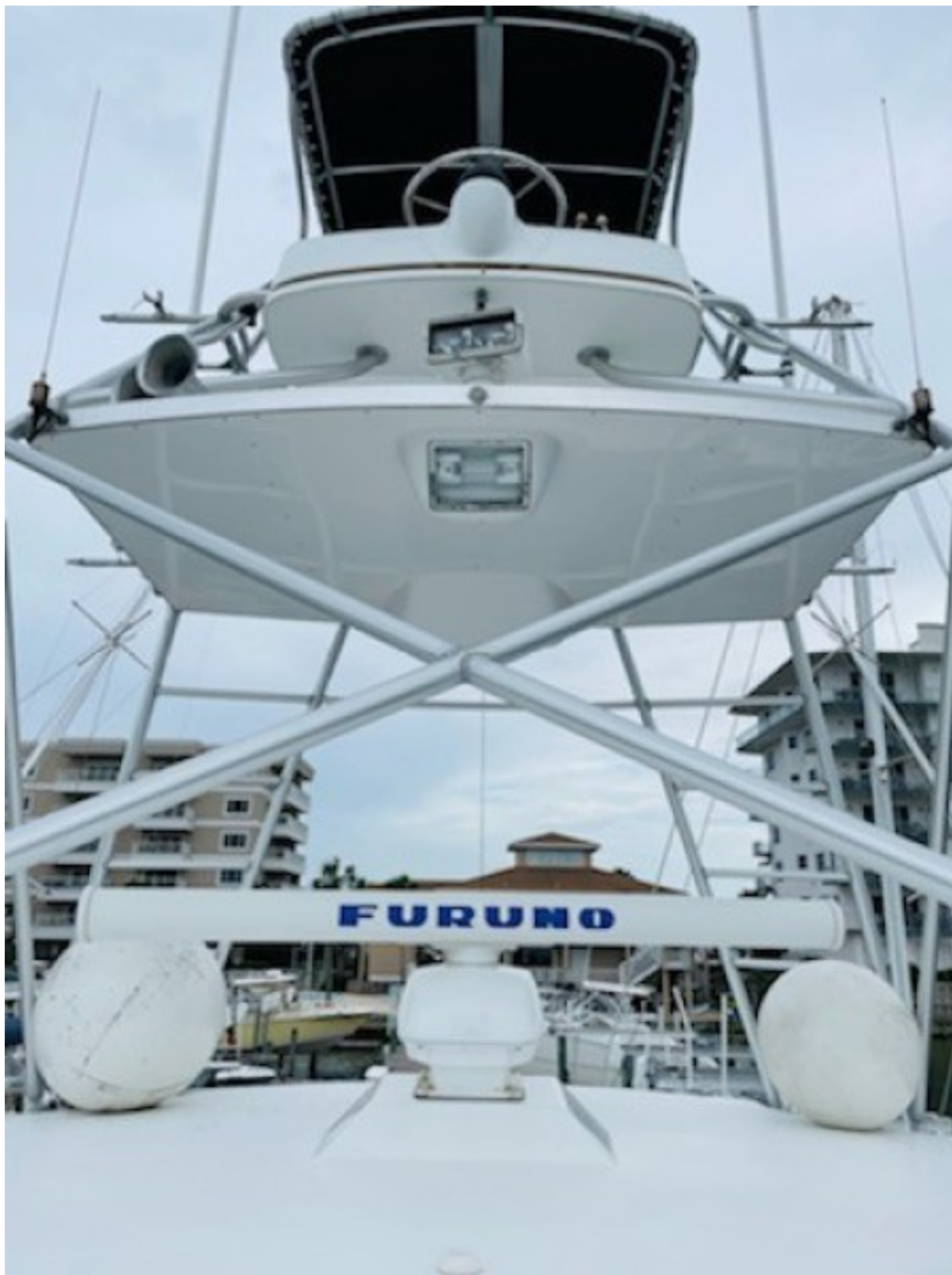
1990 Bertram 50 Convertible (23)