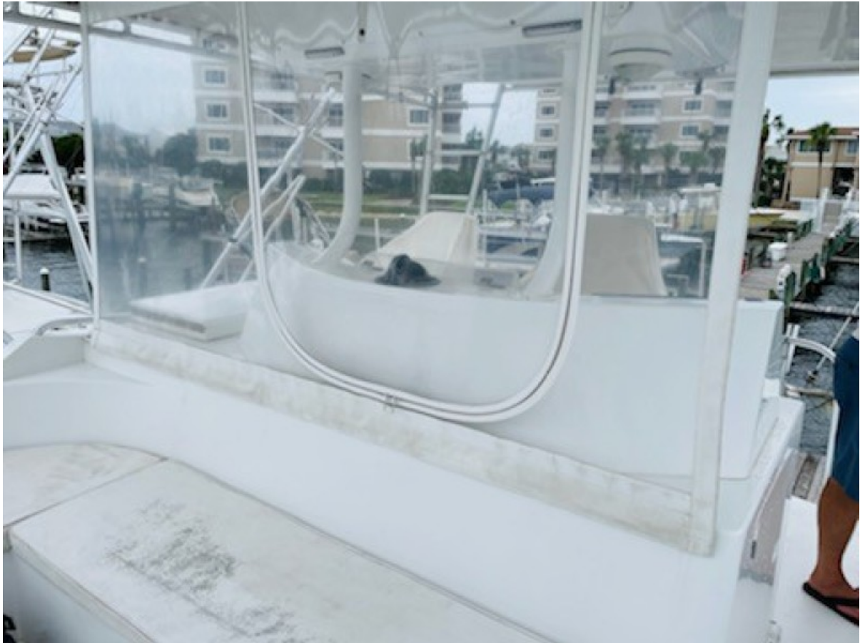
1990 Bertram 50 Convertible (24)