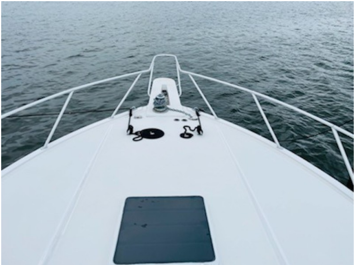
1990 Bertram 50 Convertible Bow