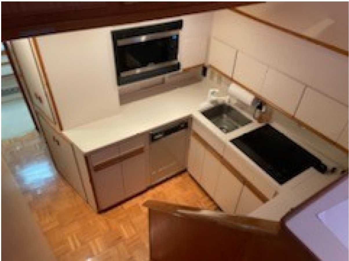
1990 Bertram 50 Convertible Galley (3)