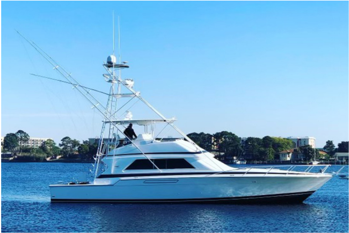
1990 Bertram 50 Convertible- IYBA Profile