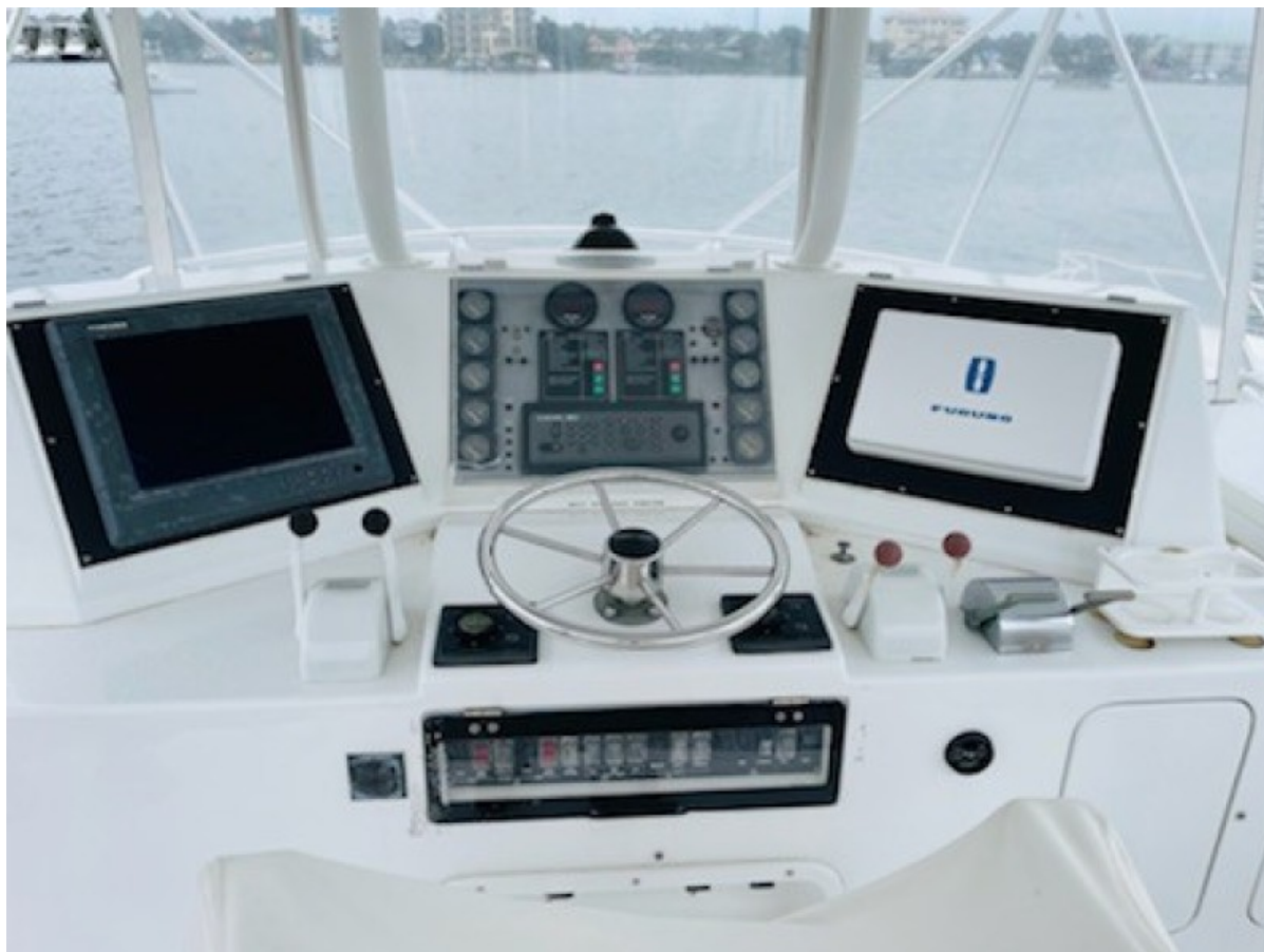
1990 Bertram 50 Convertible Helm (3)