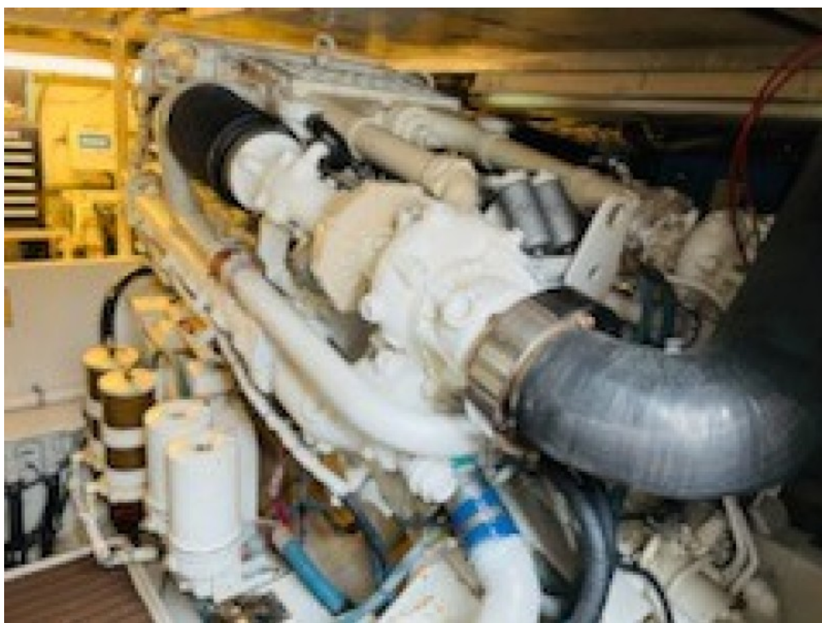
1990 Bertram 50 Convertible Engine Room (3)