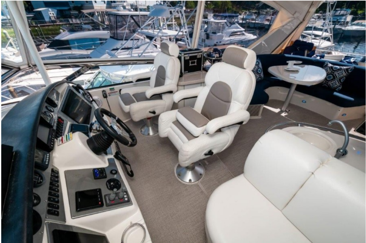
2009 Marquis 600 Flybridge Helm 3