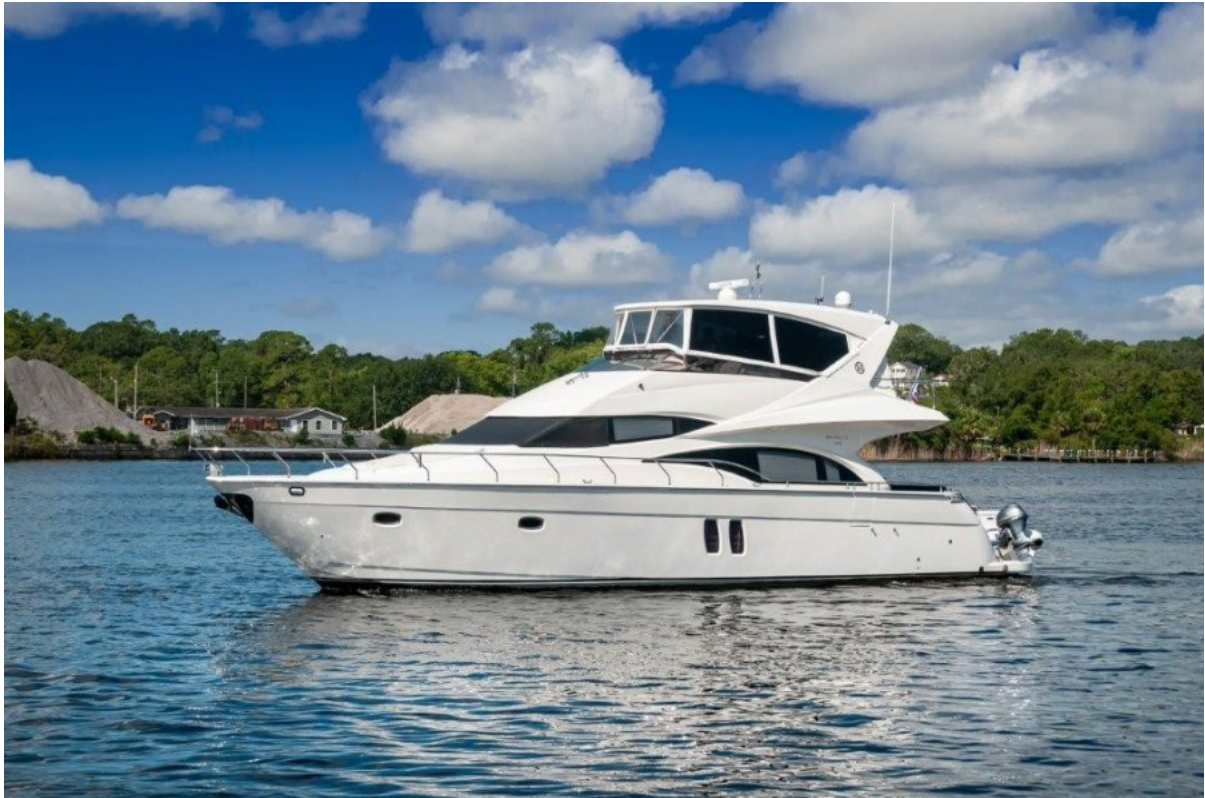
2009 Marquis 600 Flybridge Port Profile