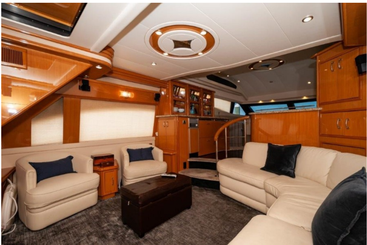
2009 Marquis 600 Flybridge Salon 3