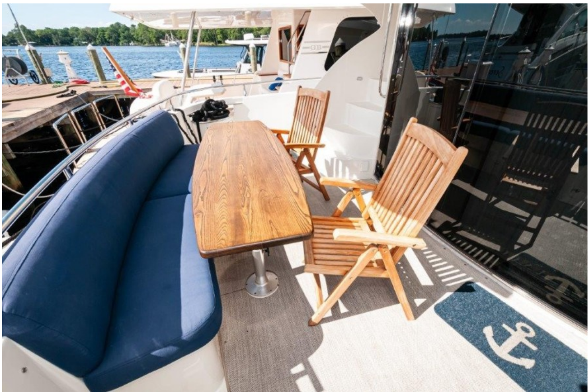
2009 Marquis 600 Flybridge Cockpit 2