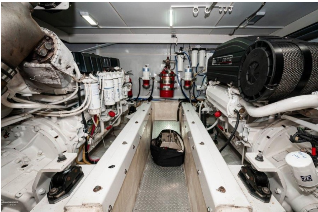
2009 Marquis 600 Flybridge Engine Room