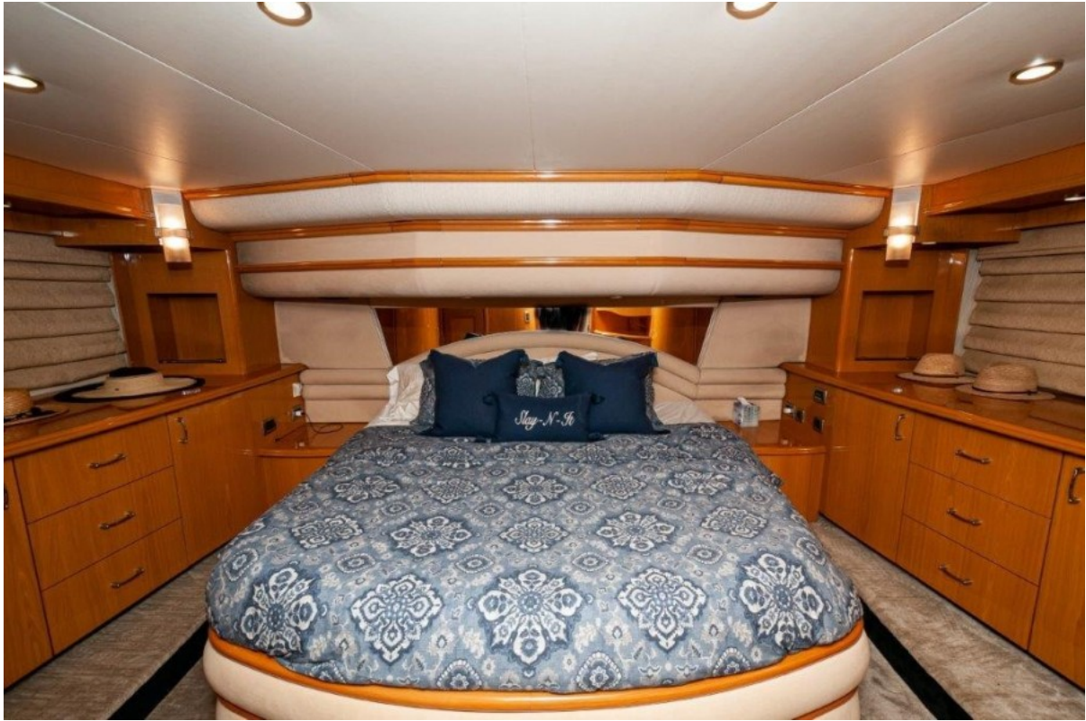
2009 Marquis 600 Flybridge Master SR