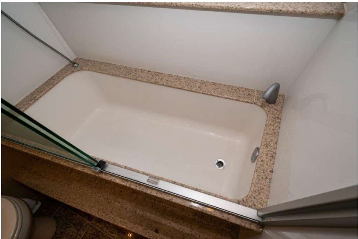
2009 Marquis 600 Flybridge Master Bath