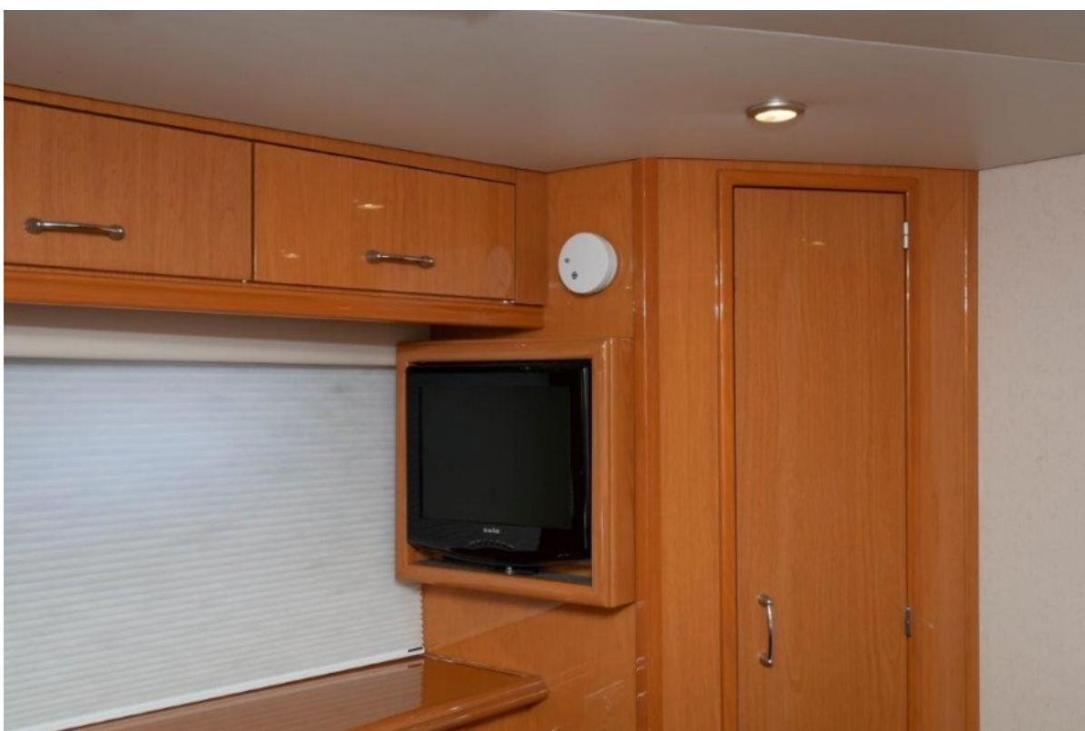
2009 Marquis 600 Flybridge VIP SR 2