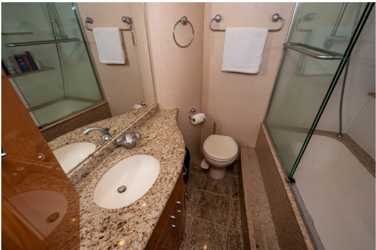
2009 Marquis 600 Flybridge Master Head 2