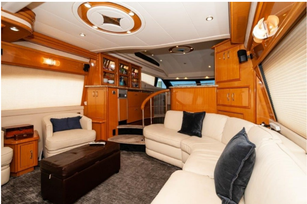
2009 Marquis 600 Flybridge Salon