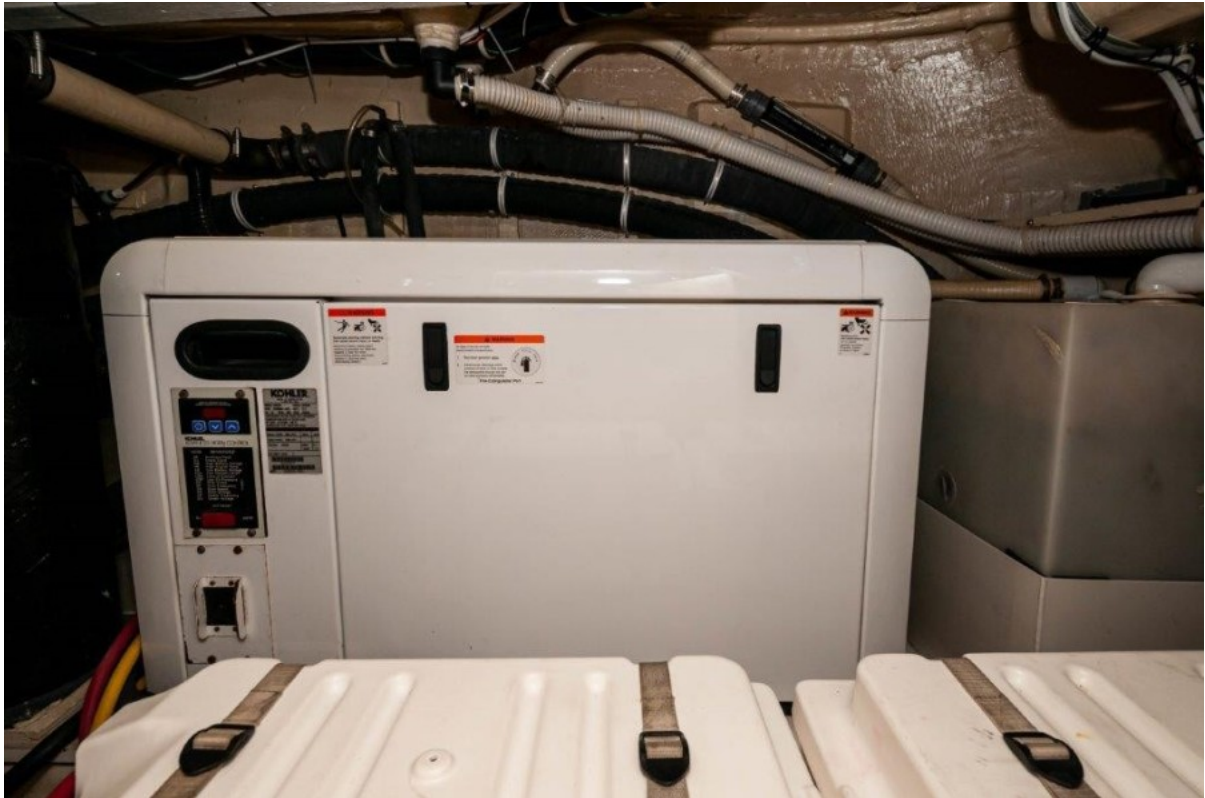
2009 Marquis 600 Flybridge Generator