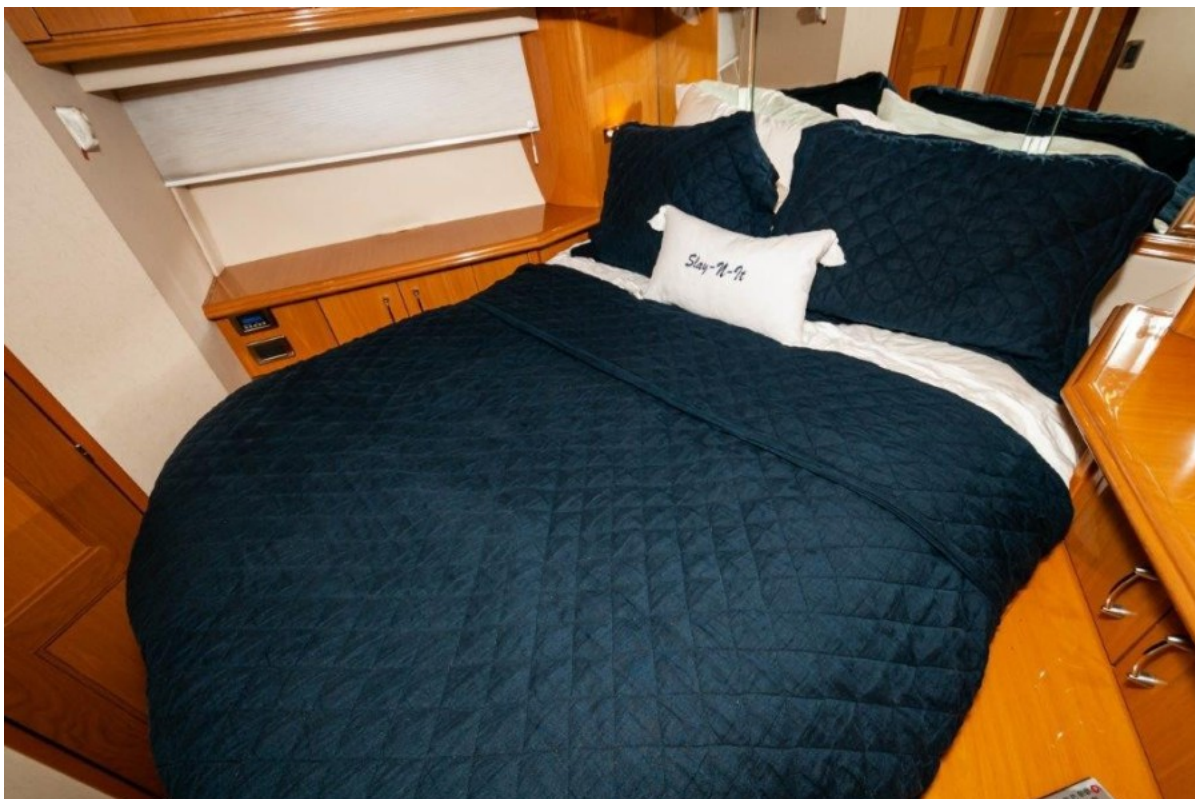
2009 Marquis 600 Flybridge VIP SR