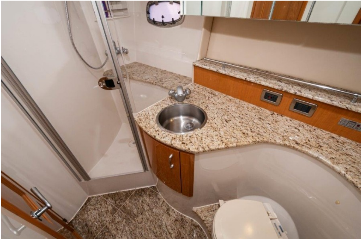
2009 Marquis 600 Flybridge VIP Head