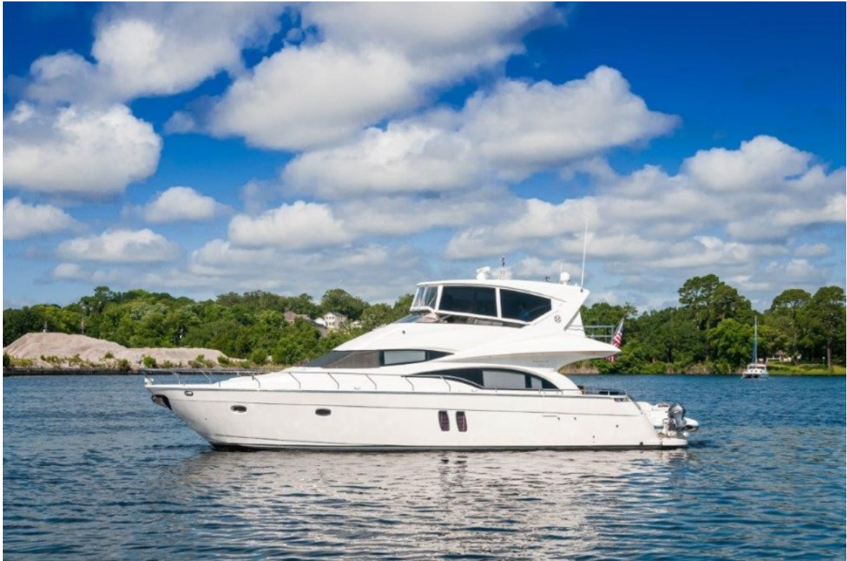
2009 Marquis 600 Flybridge Port Profile 3