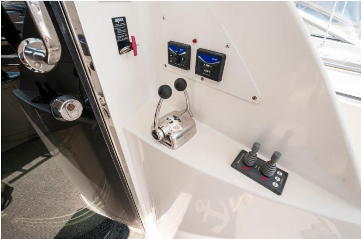
2009 Marquis 600 Flybridge Cockpit Controls