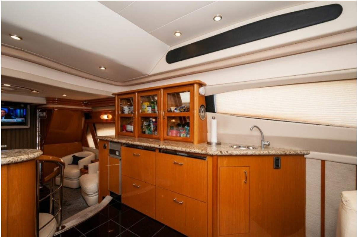
2009 Marquis 600 Flybridge Galley 3