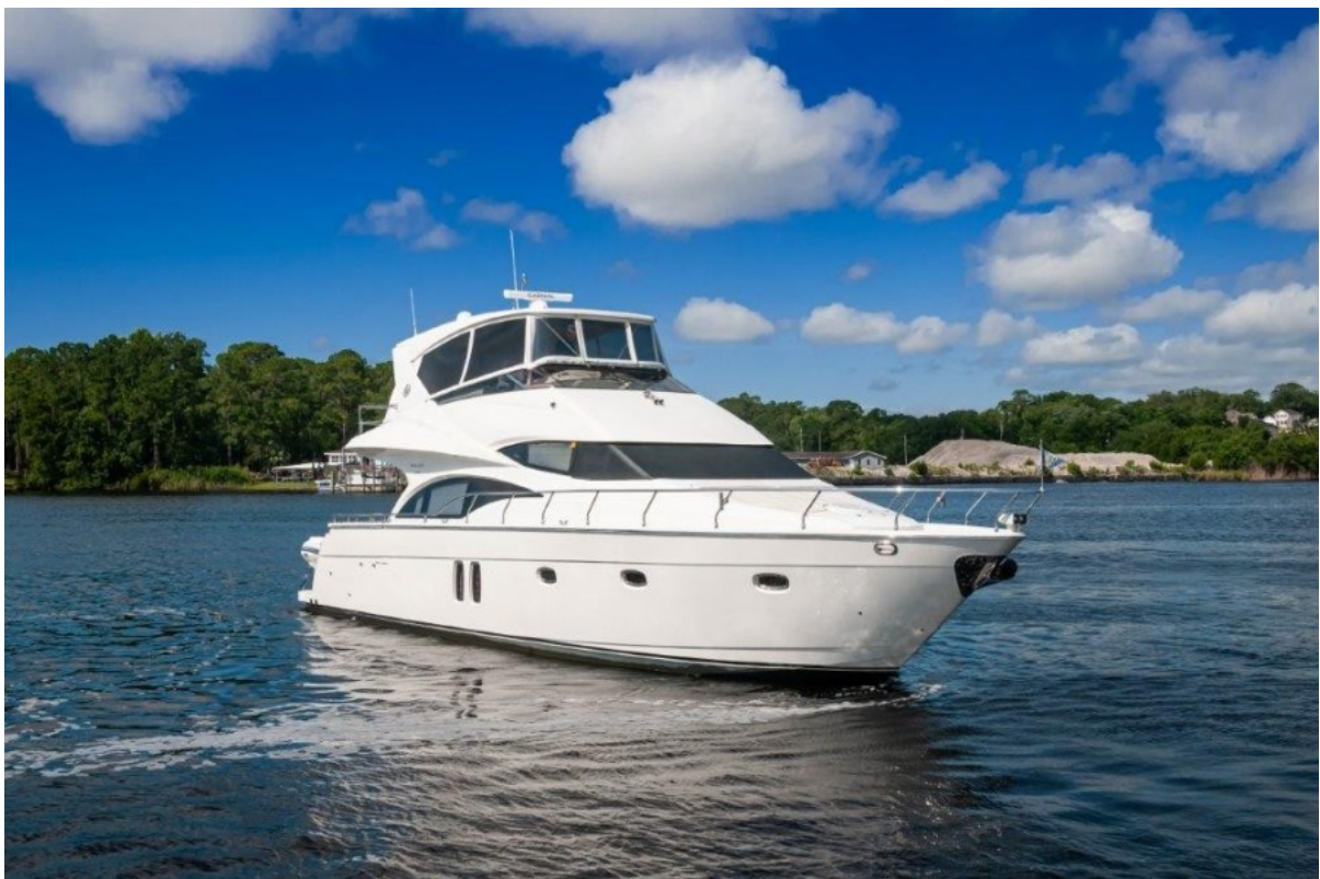
2009 Marquis 600 Flybridge Stbd Bow