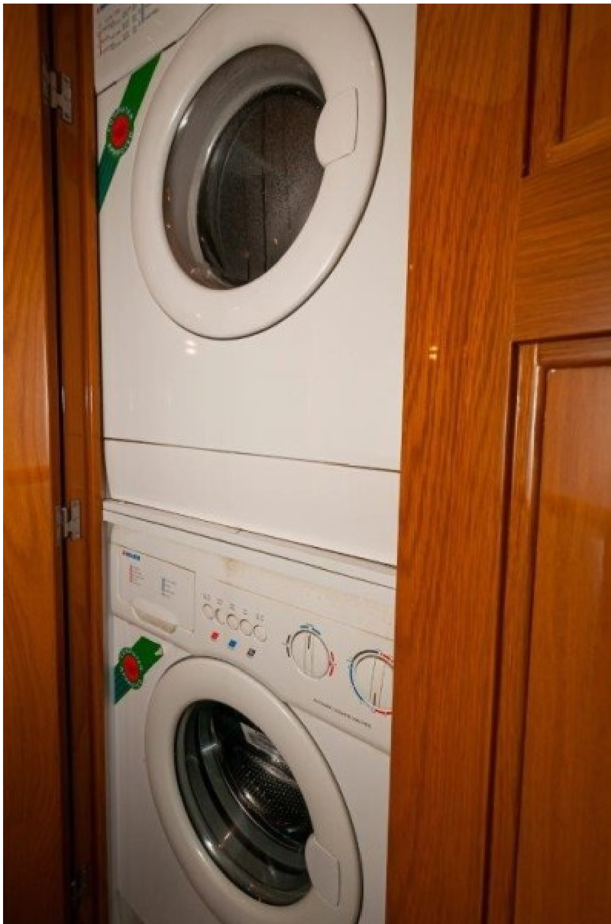
2009 Marquis 600 Flybridge Laundry