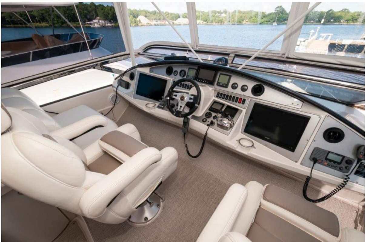
2009 Marquis 600 Flybridge Helm