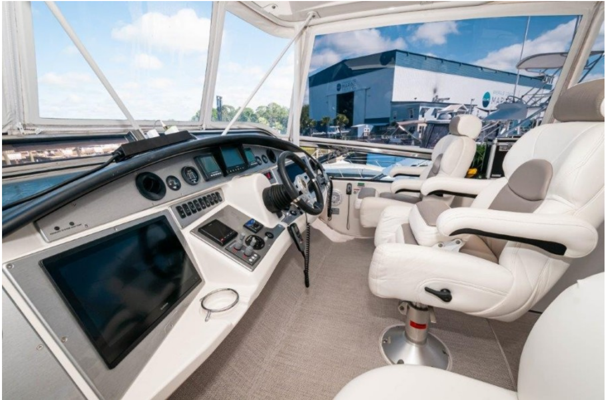
2009 Marquis 600 Flybridge Helm 2