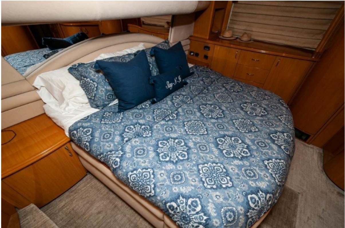
2009 Marquis 600 Flybridge Master SR 4