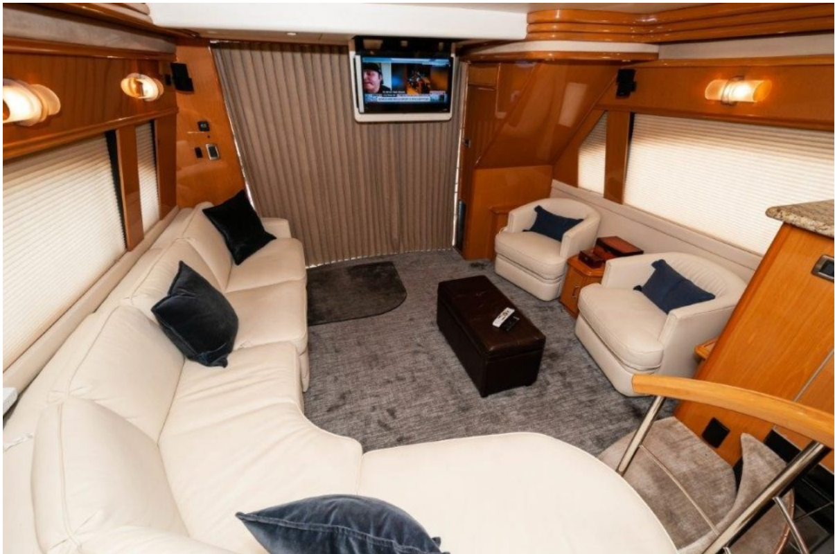
2009 Marquis 600 Flybridge Salon 2