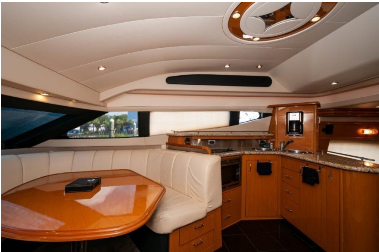
2009 Marquis 600 Flybridge Galley 2