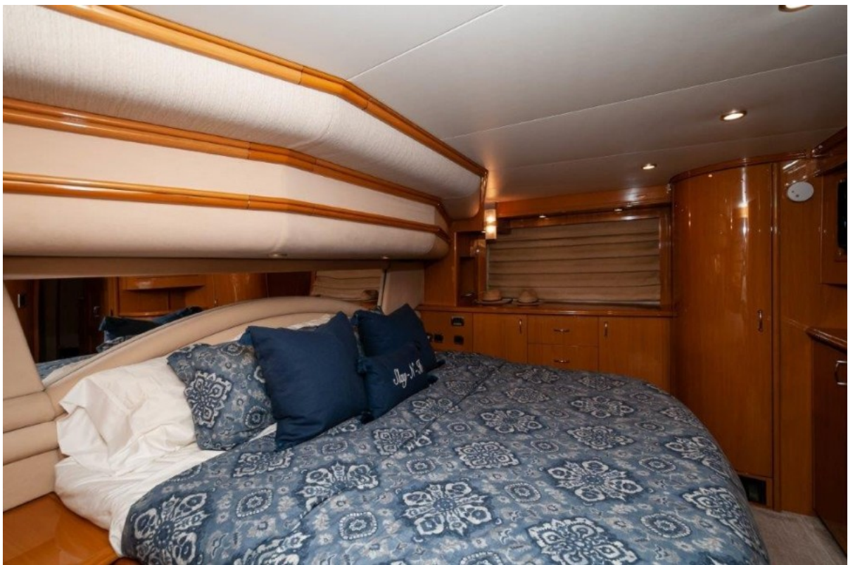
2009 Marquis 600 Flybridge Master SR 3