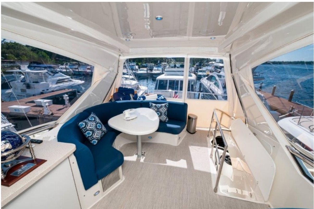
2009 Marquis 600 Flybridge Flybridge 3