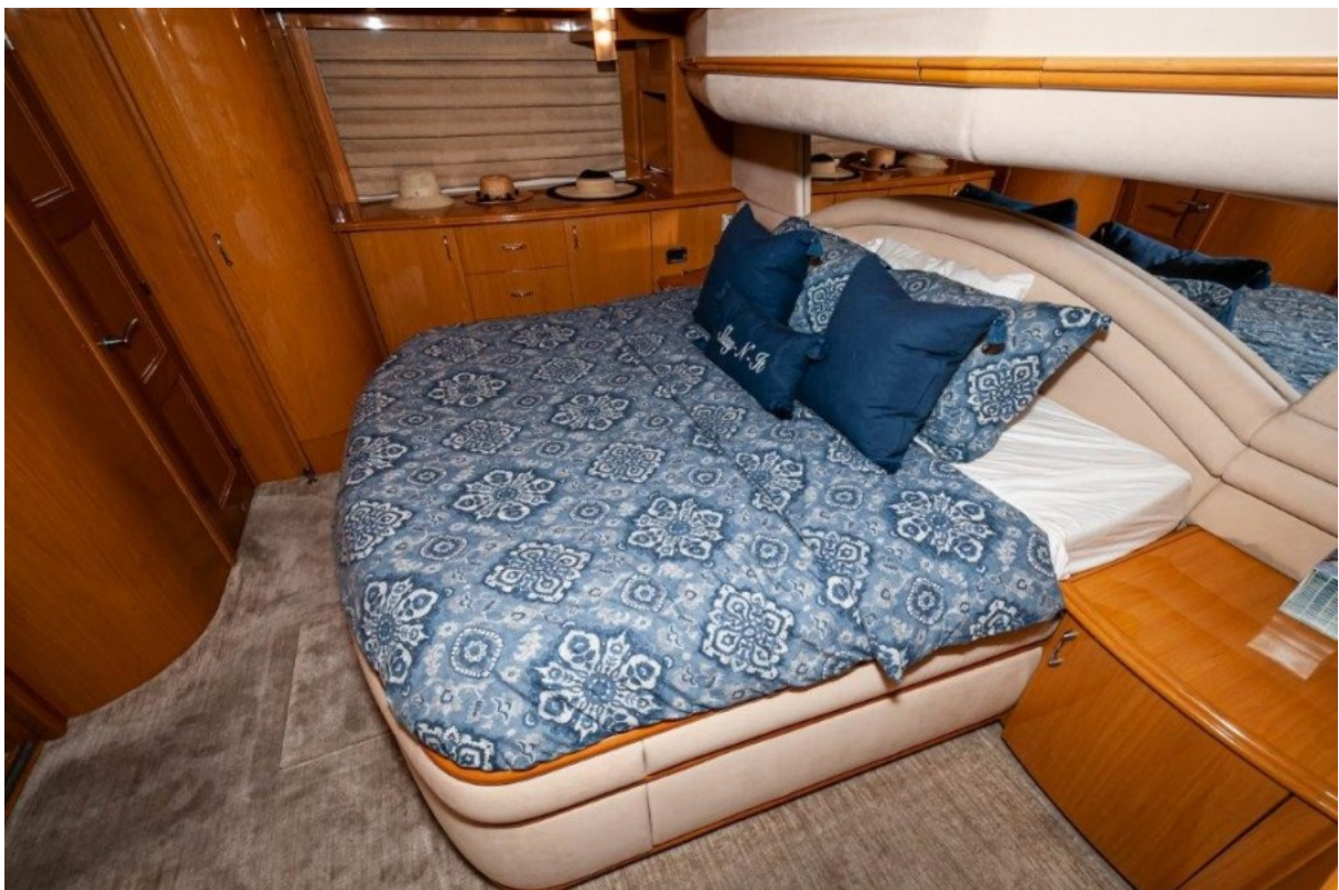
2009 Marquis 600 Flybridge Master SR 5