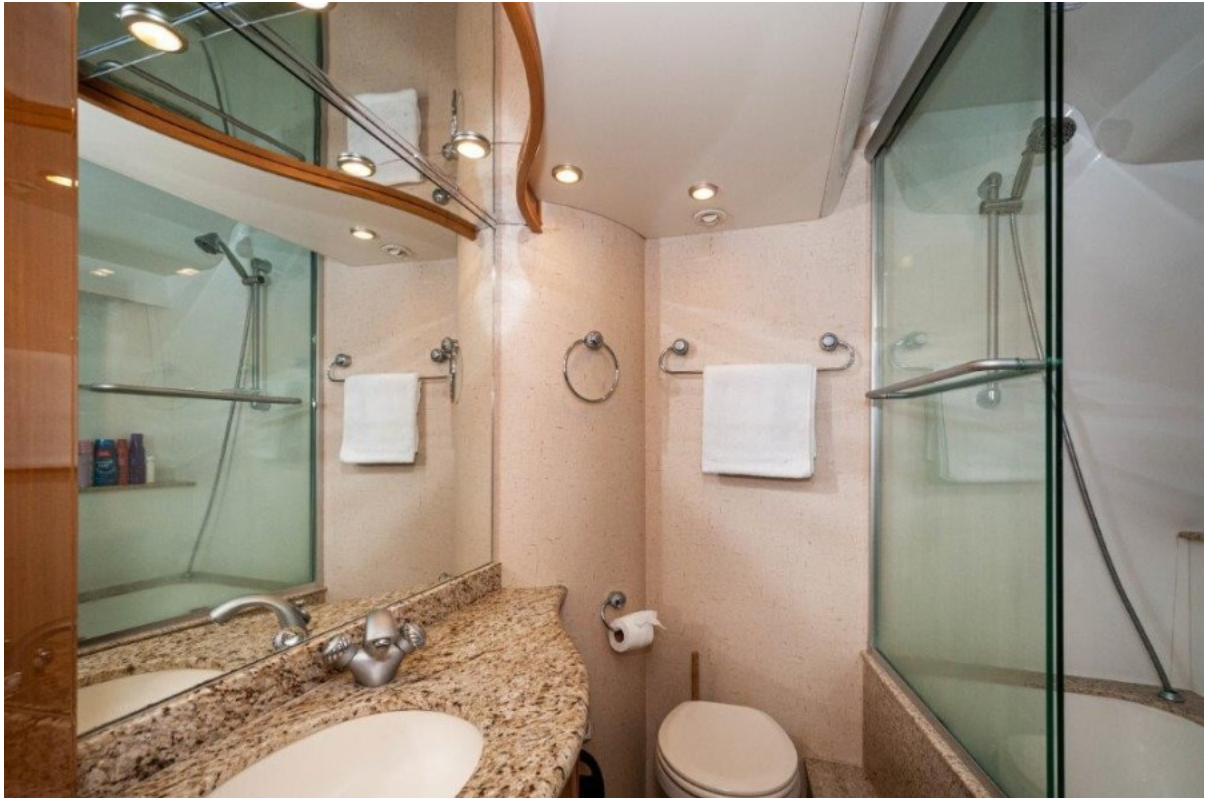
2009 Marquis 600 Flybridge Master Head