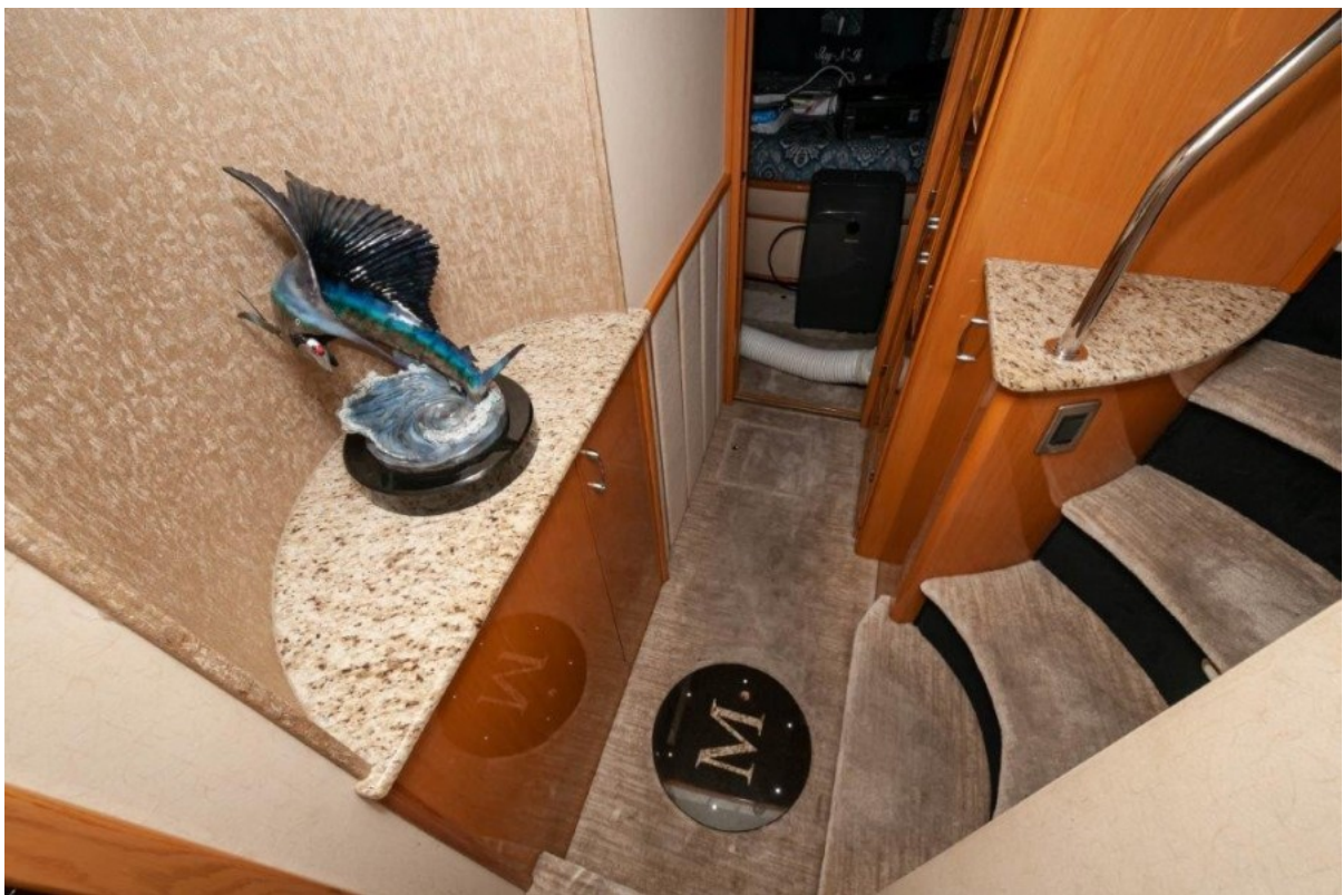
2009 Marquis 600 Flybridge Foyer