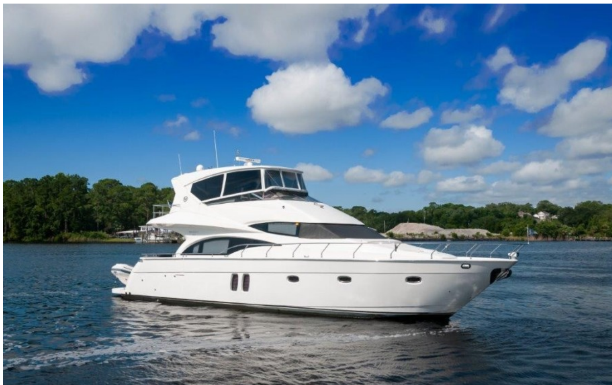
2009 Marquis 600 Flybridge Stbd Profile