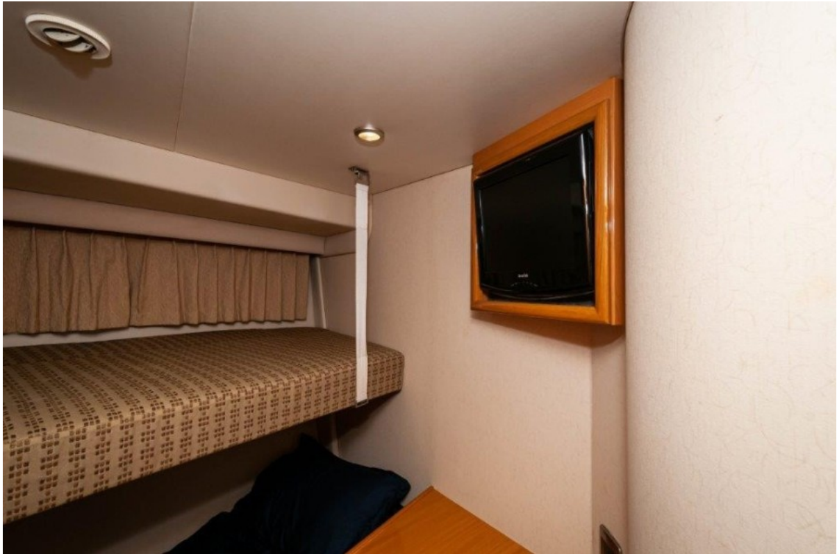
2009 Marquis 600 Flybridge Guest SR 2