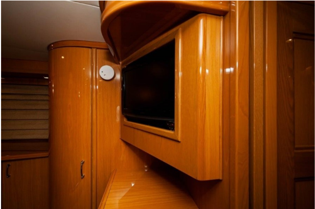
2009 Marquis 600 Flybridge Master SR 2