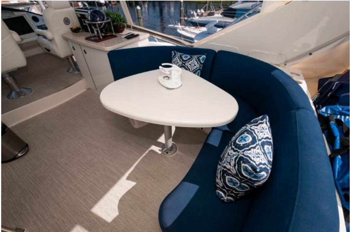
2009 Marquis 600 Flybridge Flybridge 2