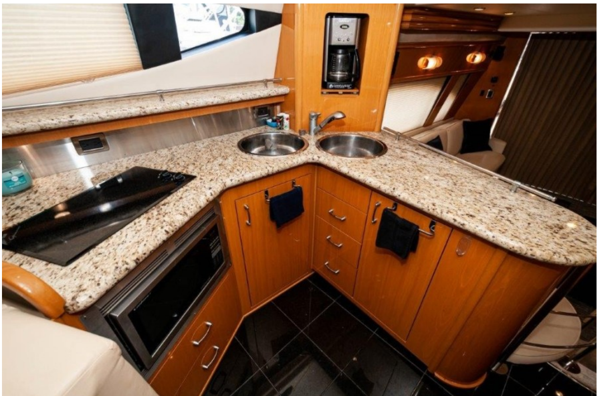
2009 Marquis 600 Flybridge Galley