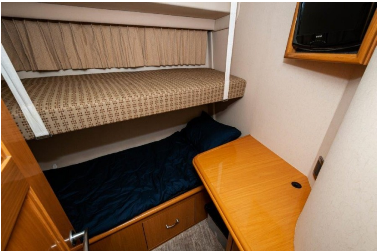
2009 Marquis 600 Flybridge Guest SR