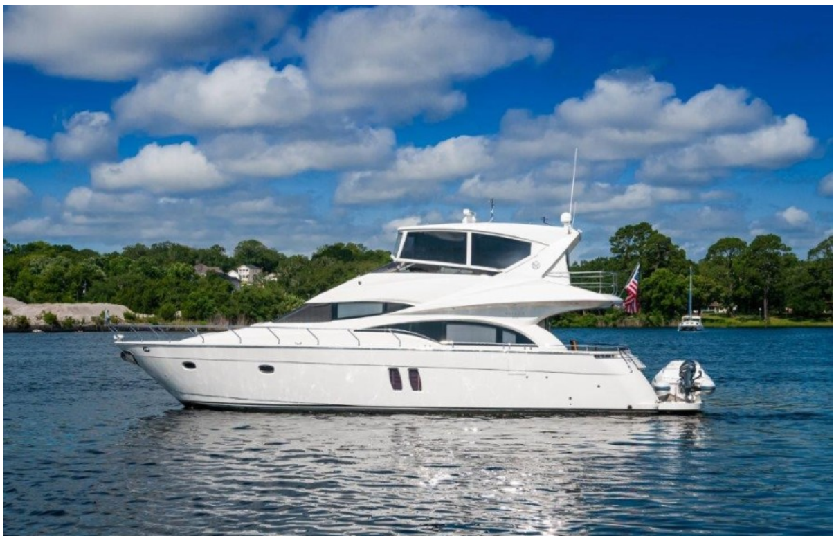
2009 Marquis 600 Flybridge Port Profile 2