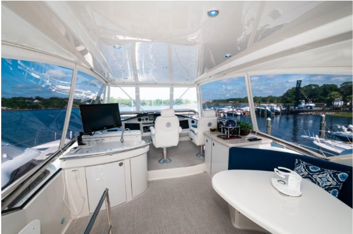
2009 Marquis 600 Flybridge Flybridge