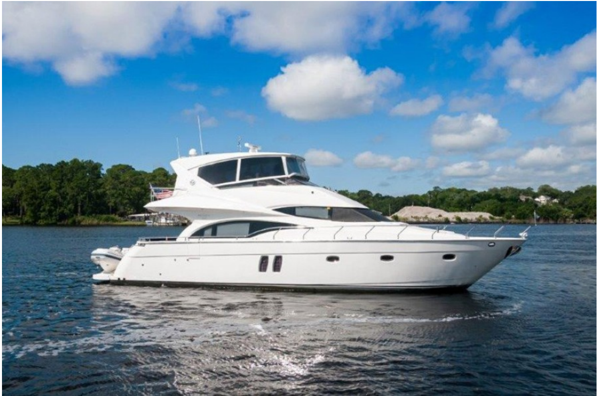
2009 Marquis 600 Flybridge IYBA PROFILE