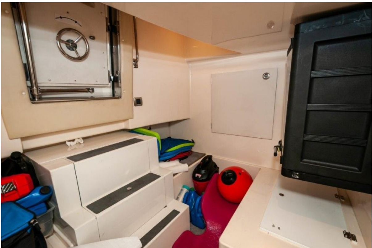
2009 Marquis 600 Flybridge Crew Qtrs