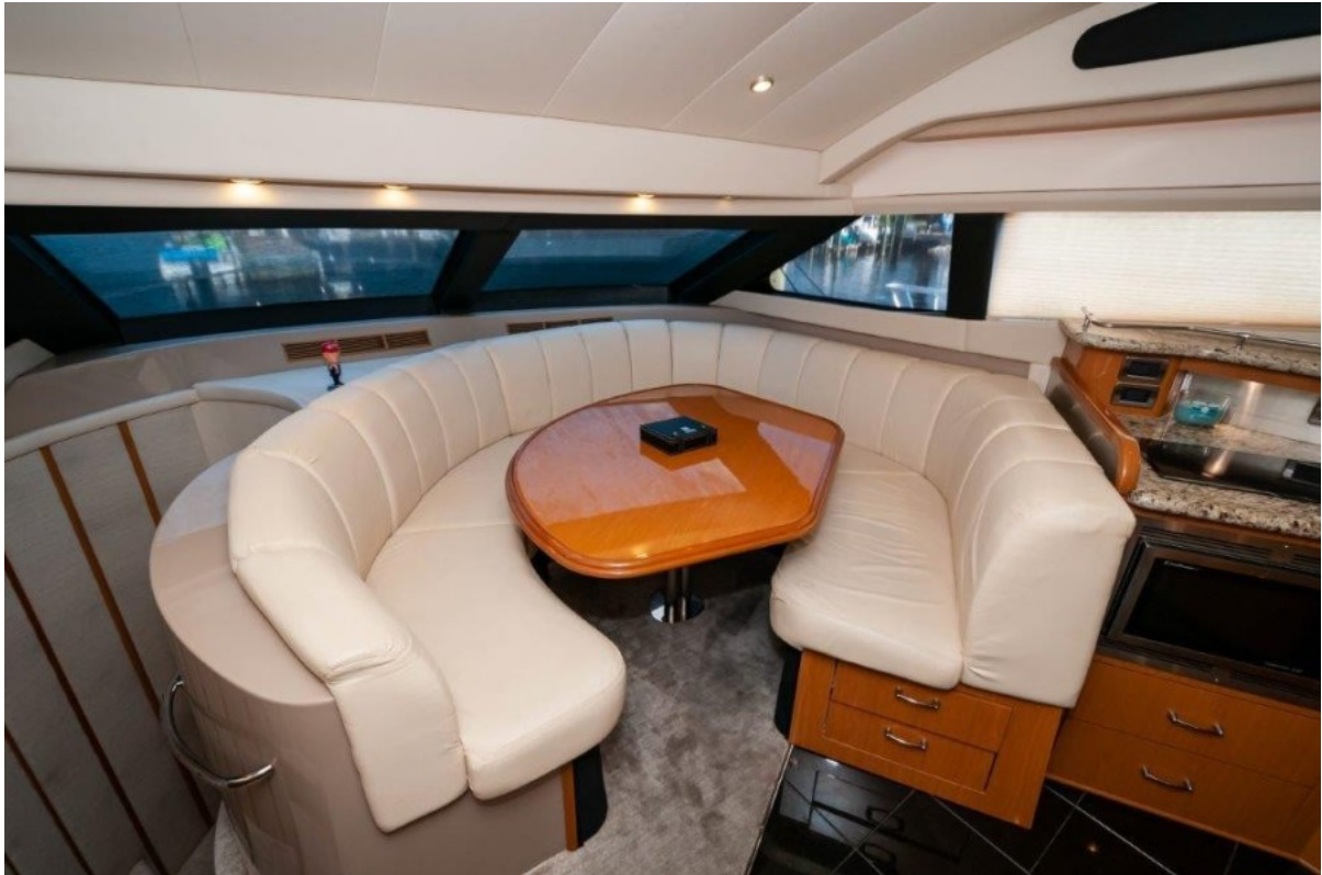
2009 Marquis 600 Flybridge Skylounge