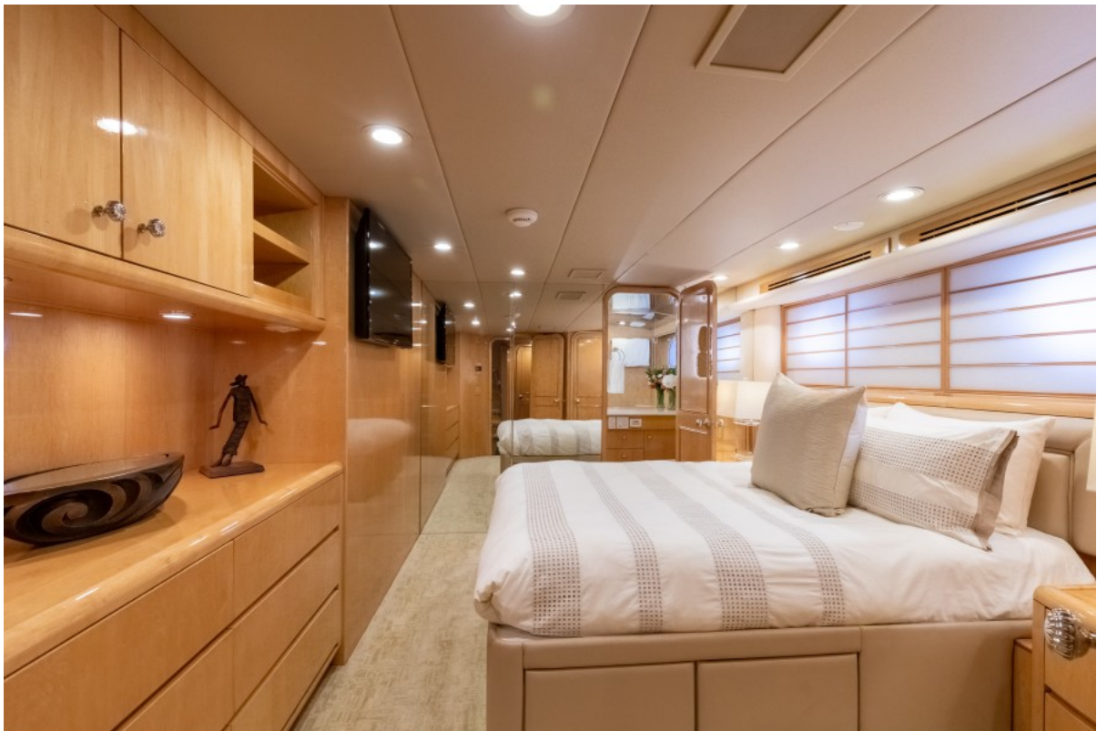
GUEST STATEROOM #3