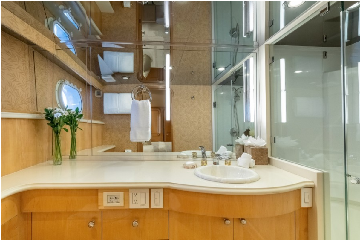
GUEST STATEROOM #2 HEAD