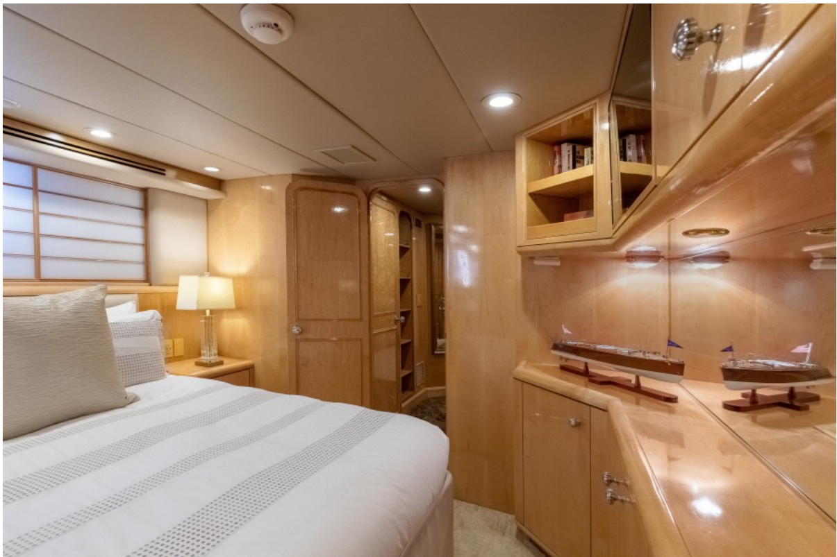
GUEST STATEROOM #1