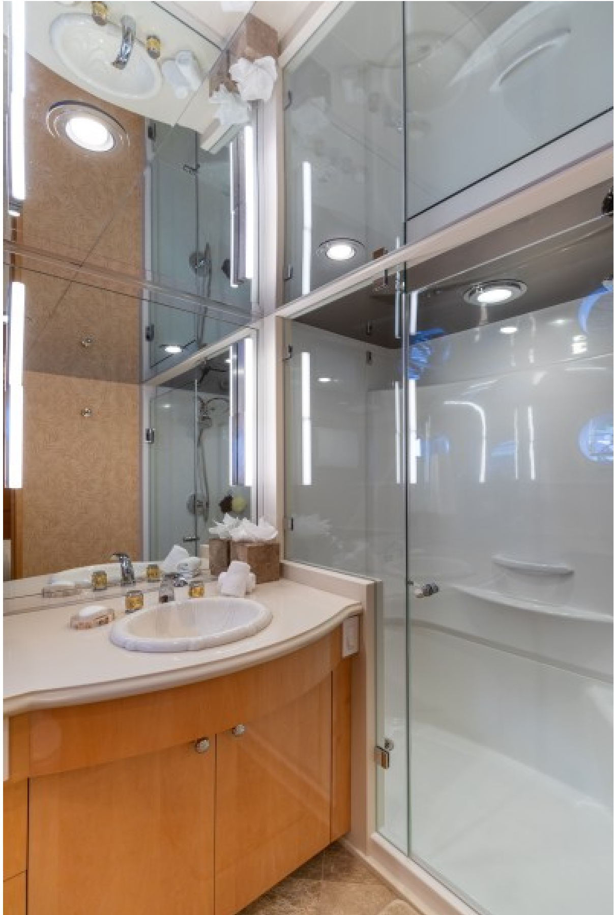
GUEST STATEROOM #1 HEAD