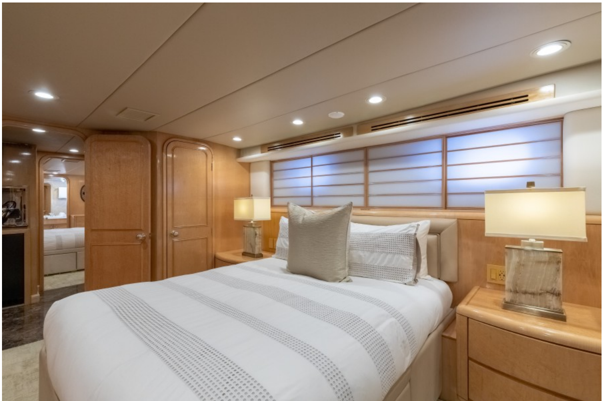
GUEST STATEROOM #2