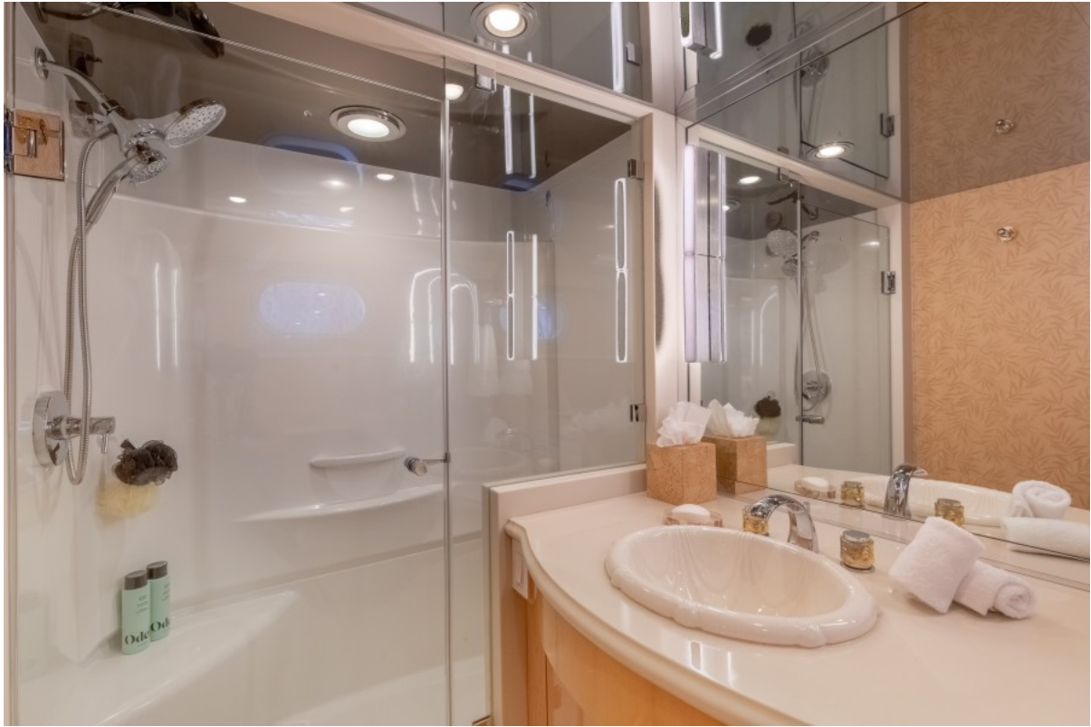
GUEST STATEROOM #3 HEAD