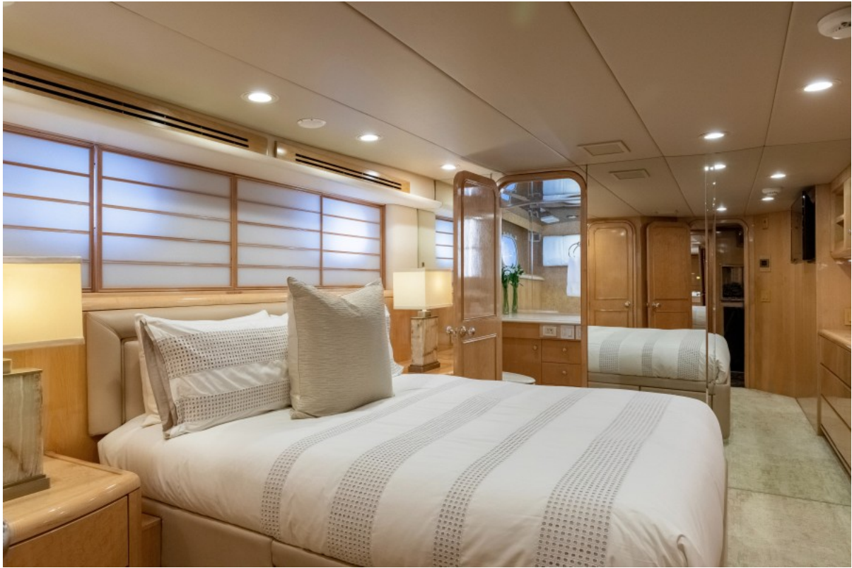
GUEST STATEROOM #2