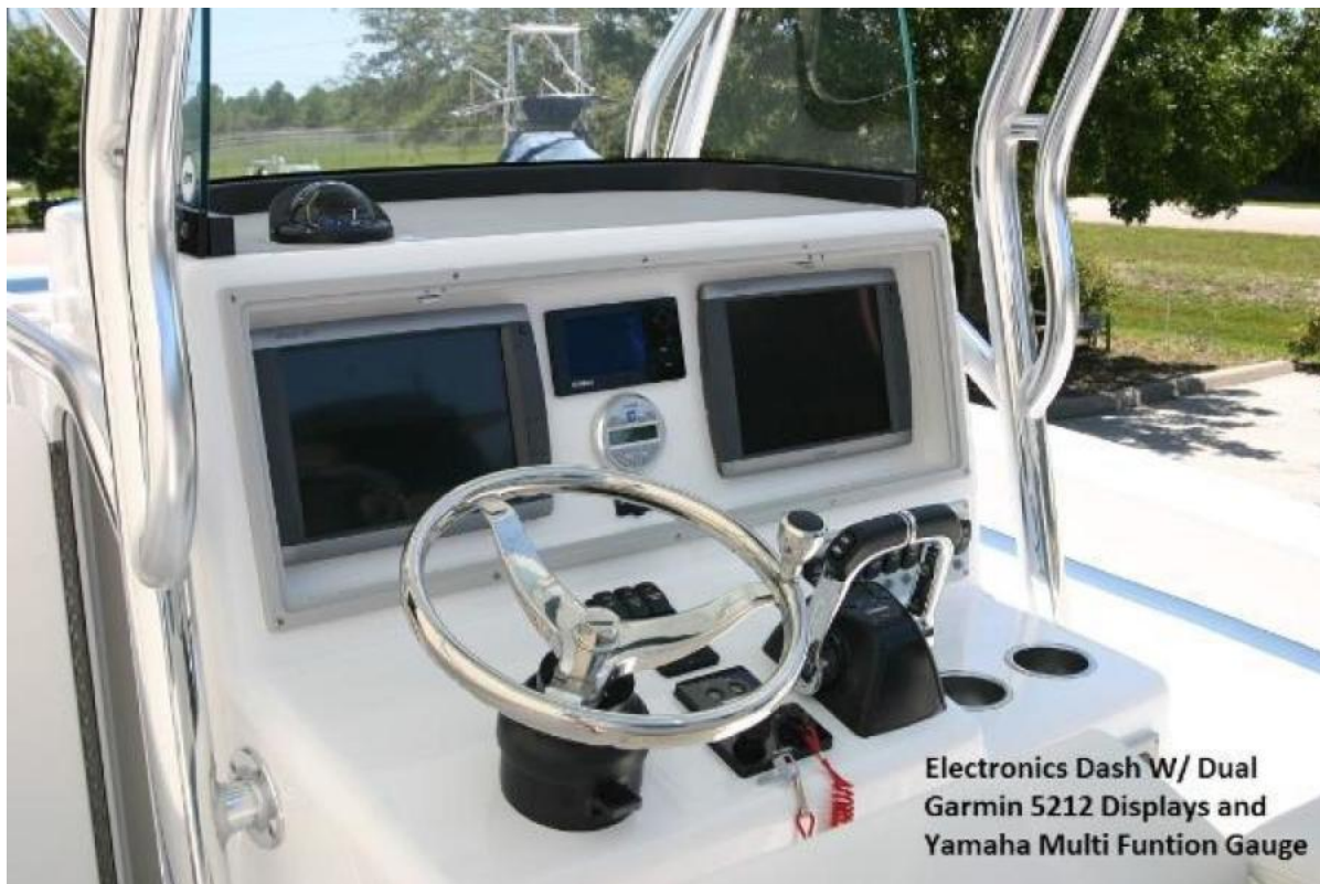
Electronics Dash W/ Dual Garmin 5212 Displays and Yamaha Multi Funtion Gauge