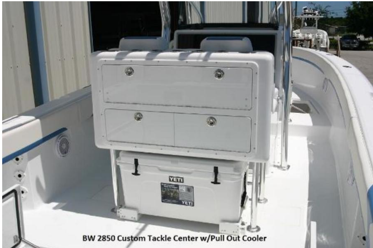
BW 2850 Custom Tackle Center w/Pull Out Cooler