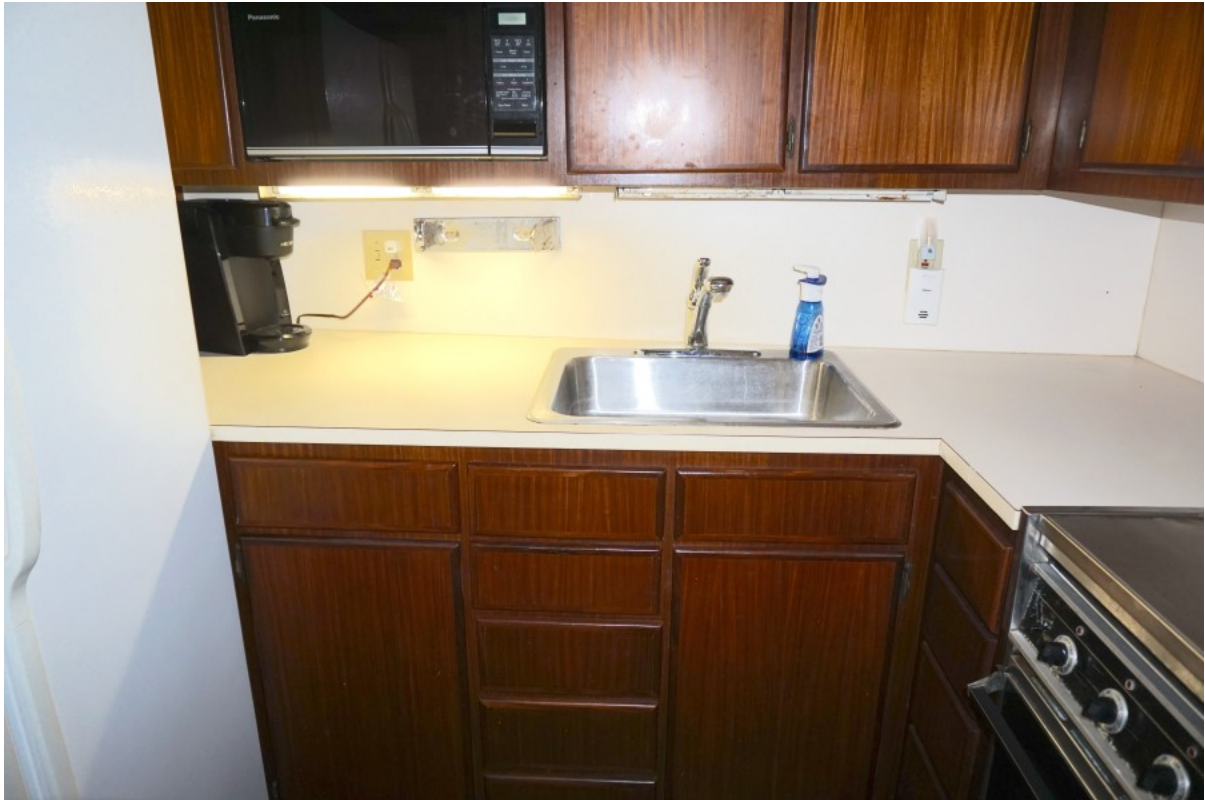
1990 52 Hatteras Convertible My Way Galley