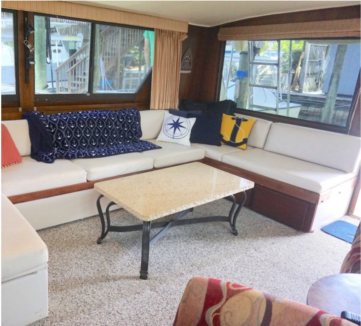
1990 52 Hatteras Convertible My Way Salon (4)