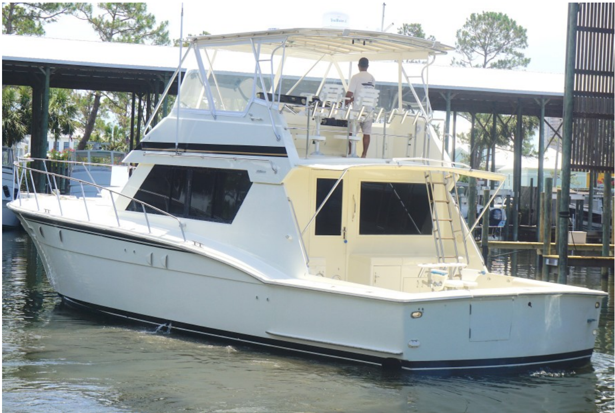
1990 52 Hatteras Convertible My Way Stern (2)