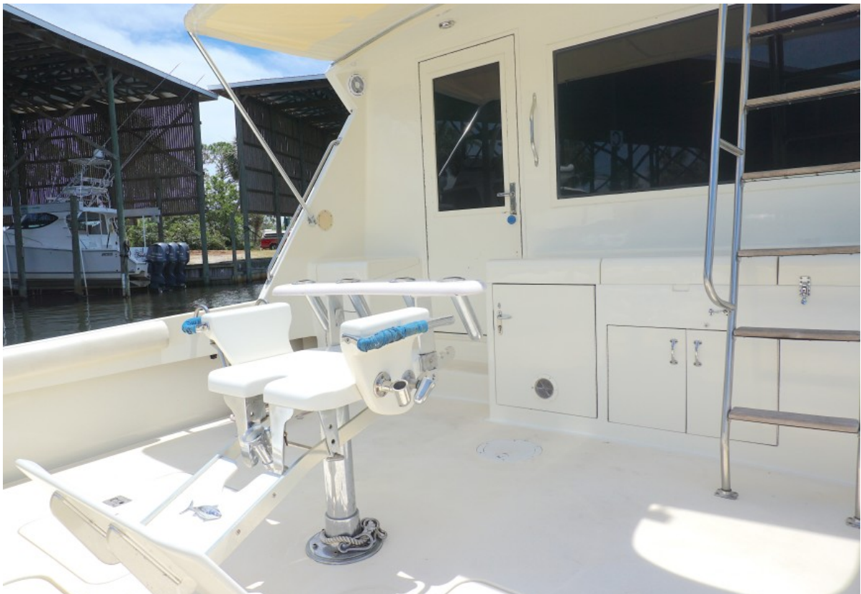
1990 52 Hatteras Convertible My Way Cockpit (2)