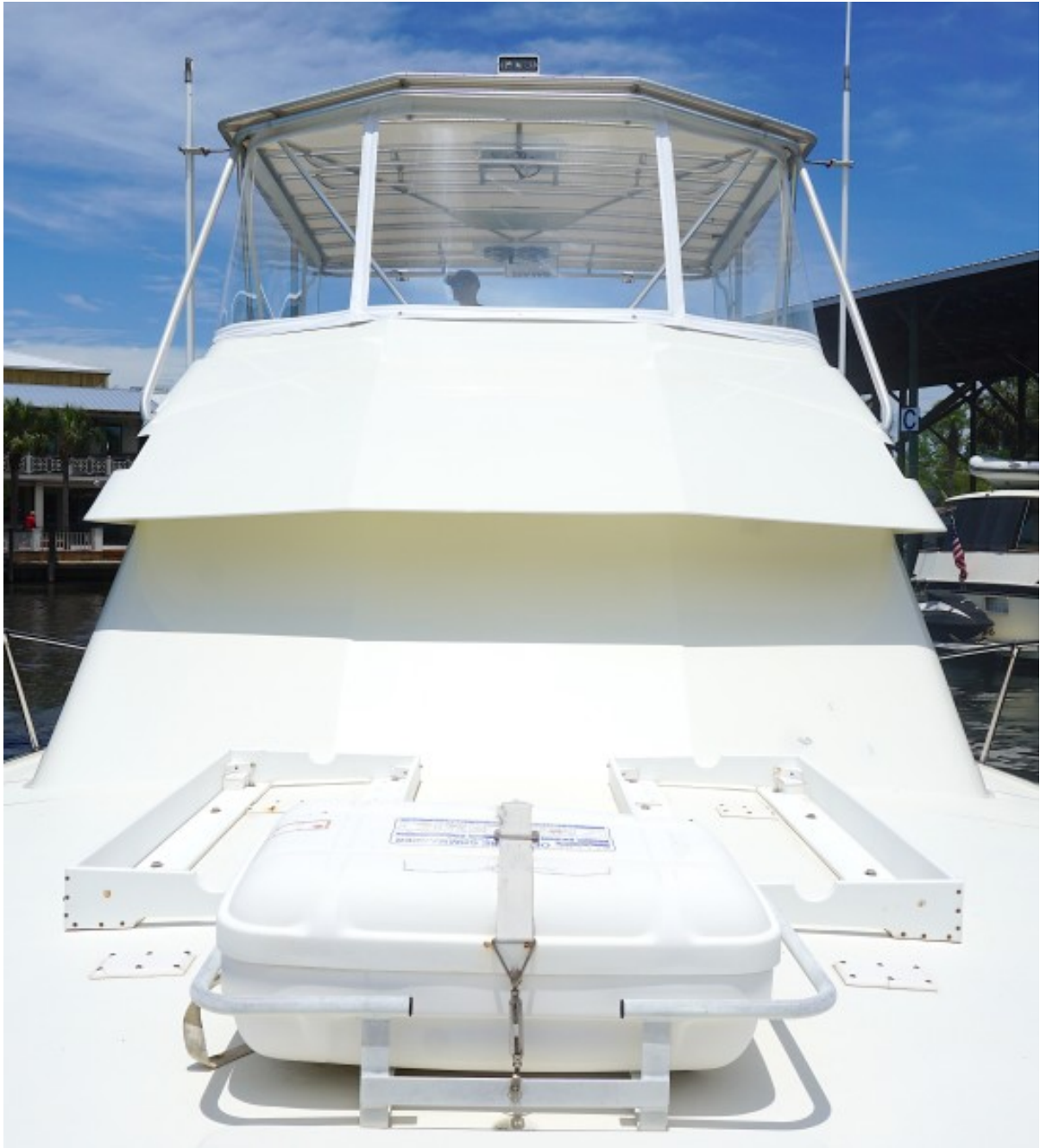
1990 52 Hatteras Convertible My Way Bow (2)