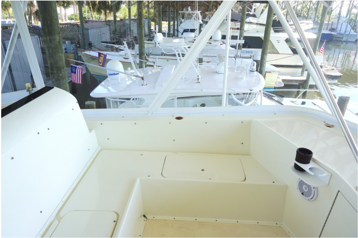
1990 52 Hatteras Convertible My Way Bridge (1)