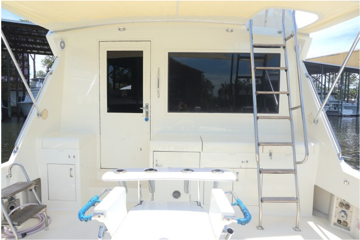
1990 52 Hatteras Convertible My Way Looking Forward