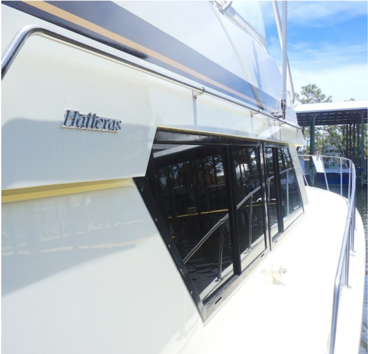
1990 52 Hatteras Convertible My Way Windows