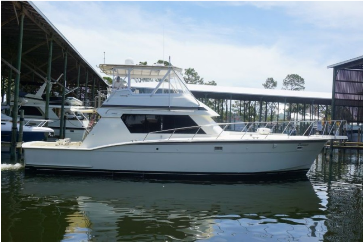
1990 52 Hatteras Convertible My Way Profile