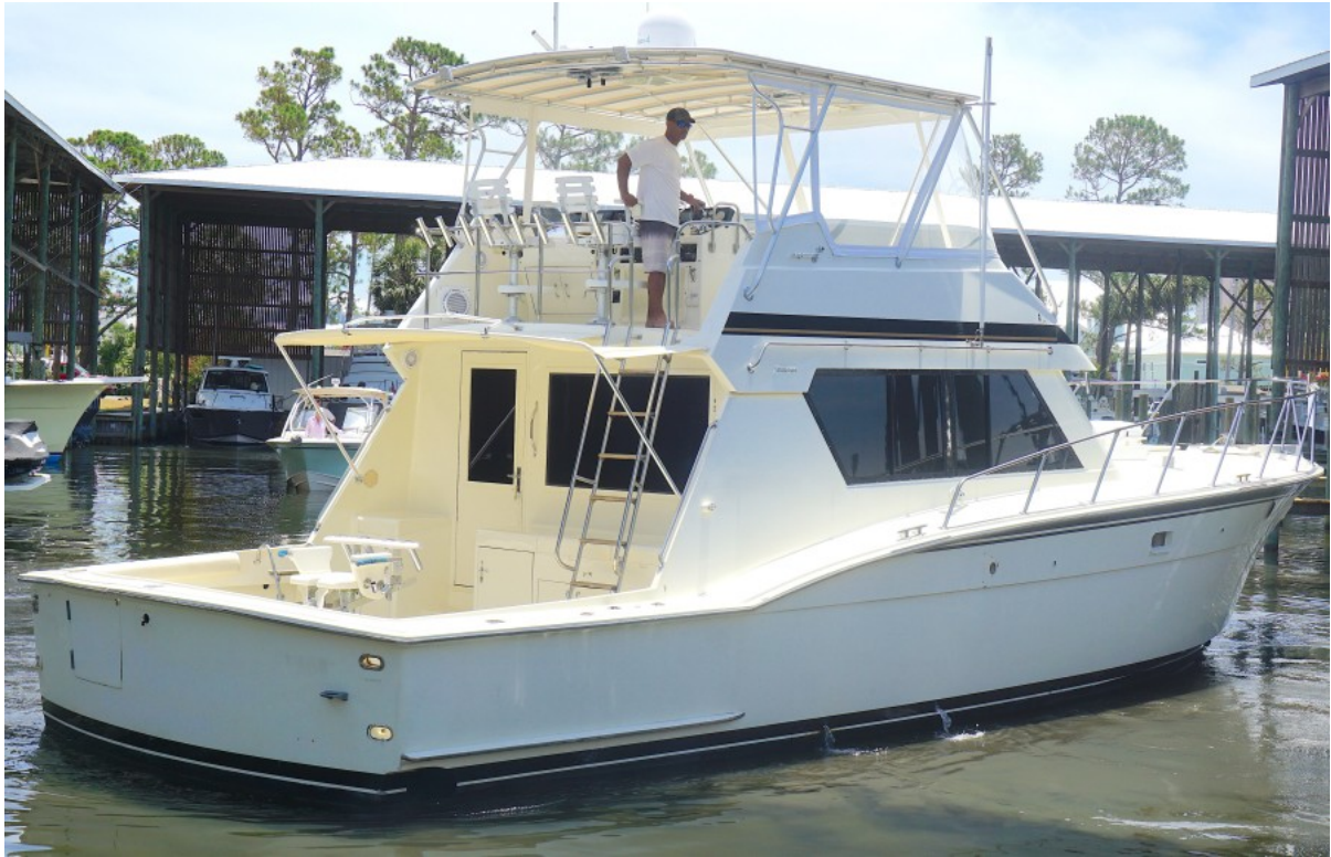
1990 52 Hatteras Convertible My Way Stern (1)