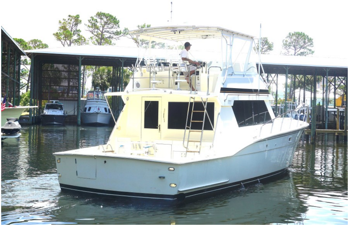
1990 52 Hatteras Convertible My Way Stern (3)