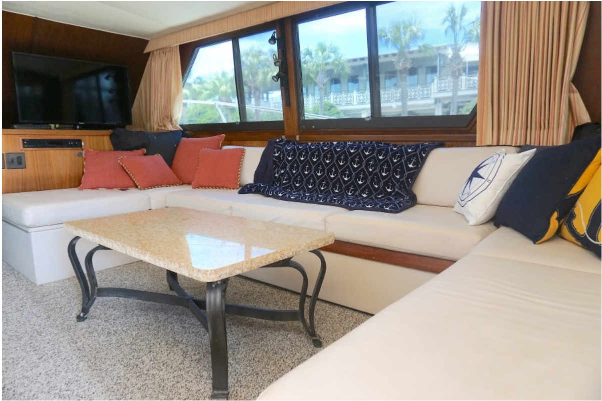
1990 52 Hatteras Convertible My Way Salon (2)