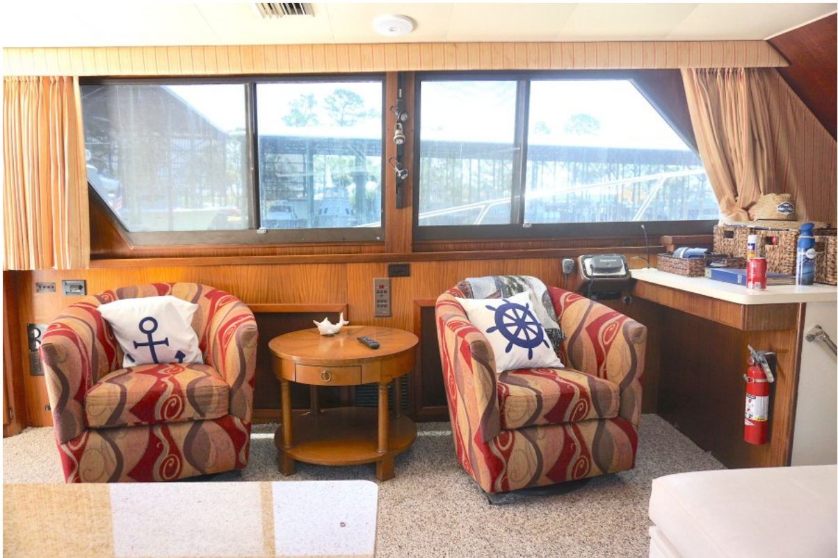
1990 52 Hatteras Convertible My Way Salon (5)