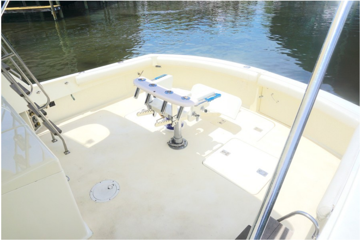
1990 52 Hatteras Convertible My Way Cockpit (1)