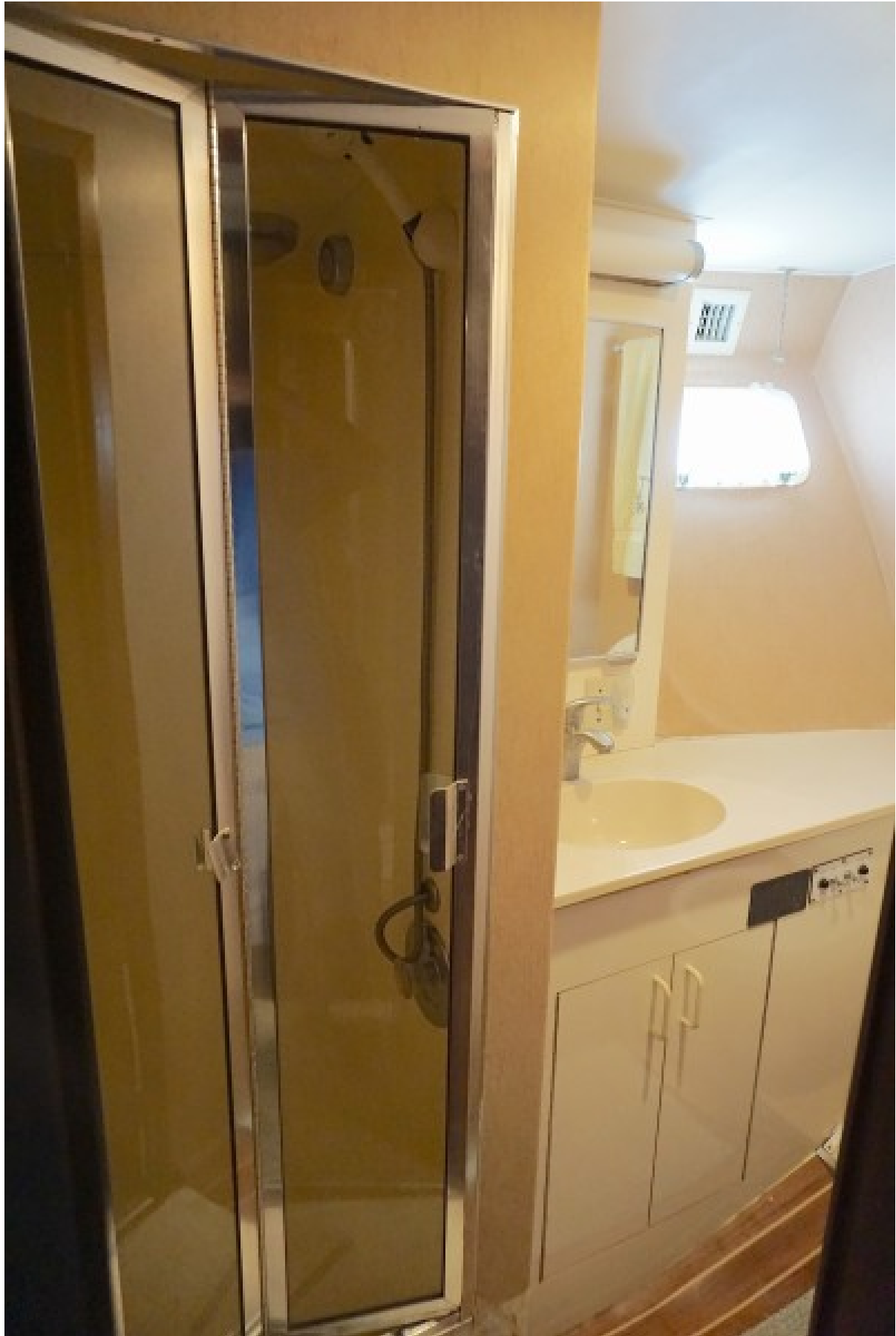
1990 52 Hatteras Convertible My Way Guest Head