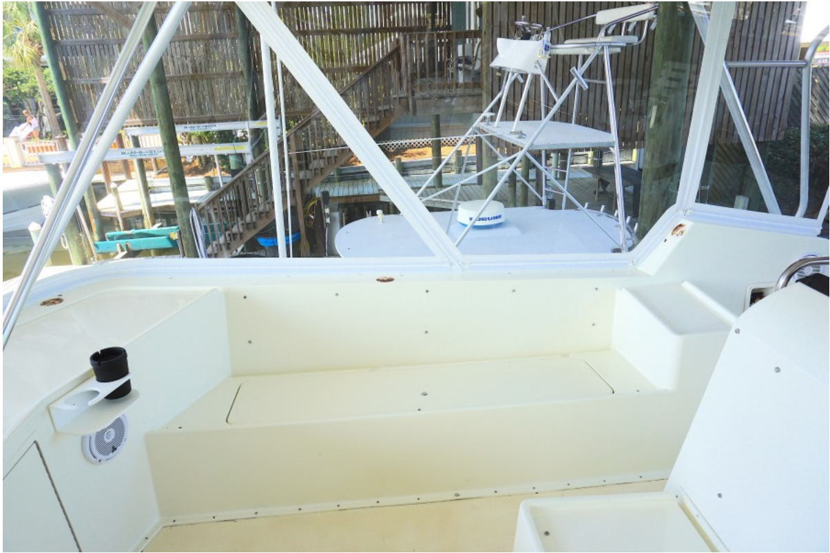
1990 52 Hatteras Convertible My Way Bridge (6)