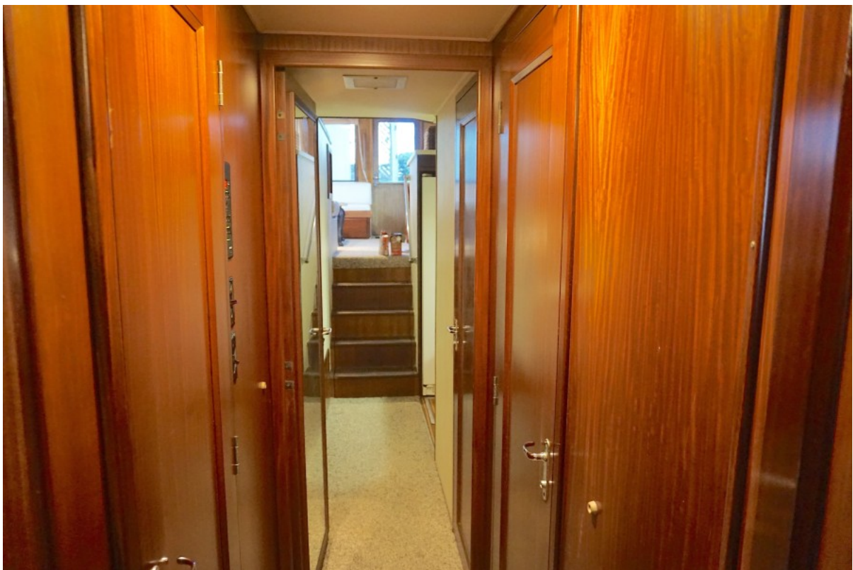
1990 52 Hatteras Convertible My Way Companionway