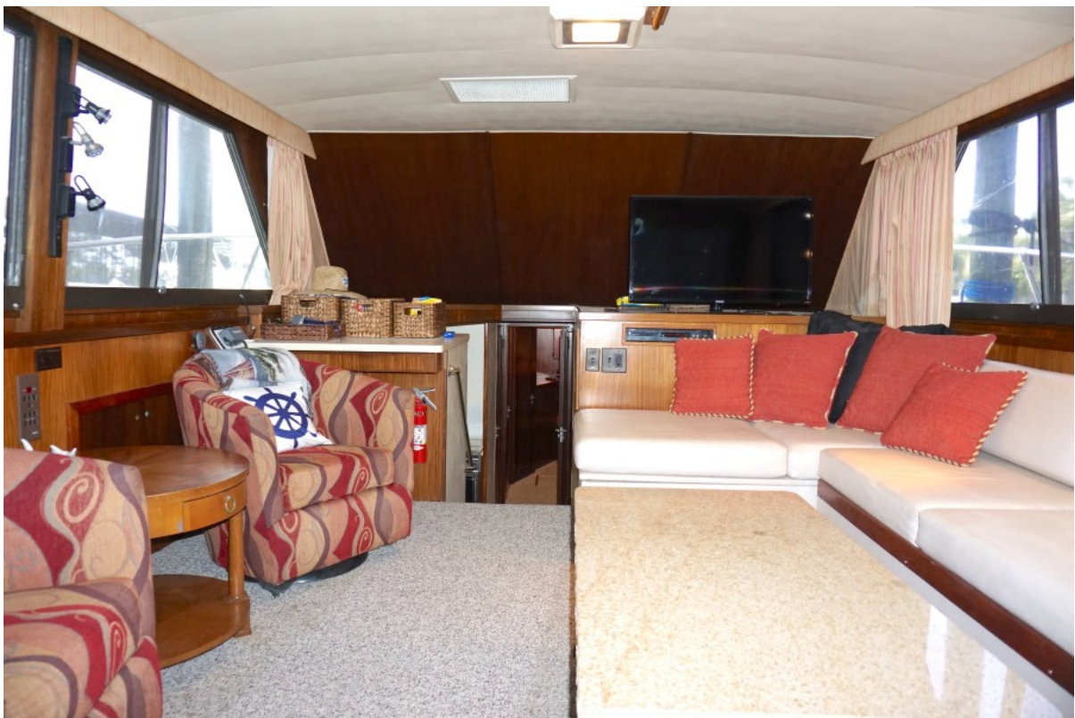
1990 52 Hatteras Convertible My Way Salon (1)