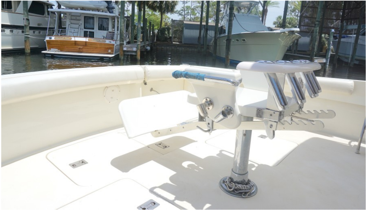
1990 52 Hatteras Convertible My Way Fighting Chair