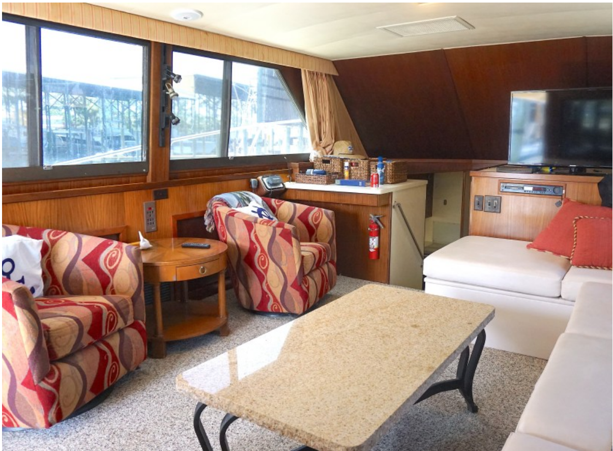
1990 52 Hatteras Convertible My Way Salon (3)