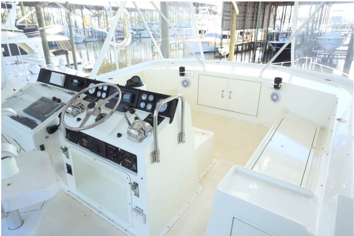
1990 52 Hatteras Convertible My Way Bridge (2)