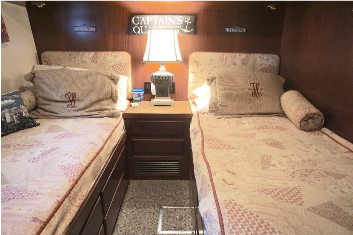
1990 52 Hatteras Convertible My Way Guest Room