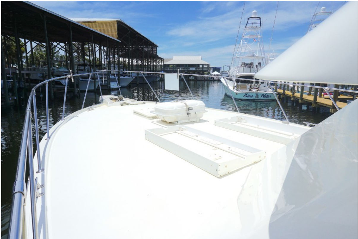
1990 52 Hatteras Convertible My Way Bow (1)