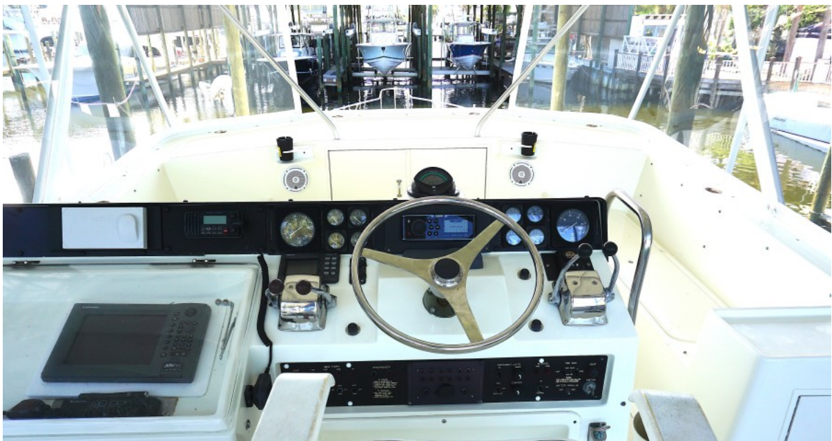
1990 52 Hatteras Convertible My Way Bridge (5)