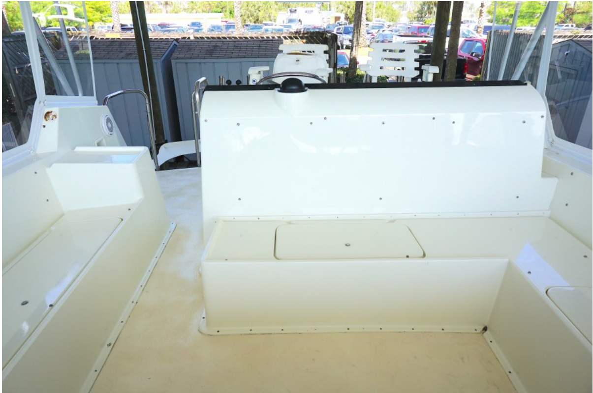
1990 52 Hatteras Convertible My Way Bridge (4)