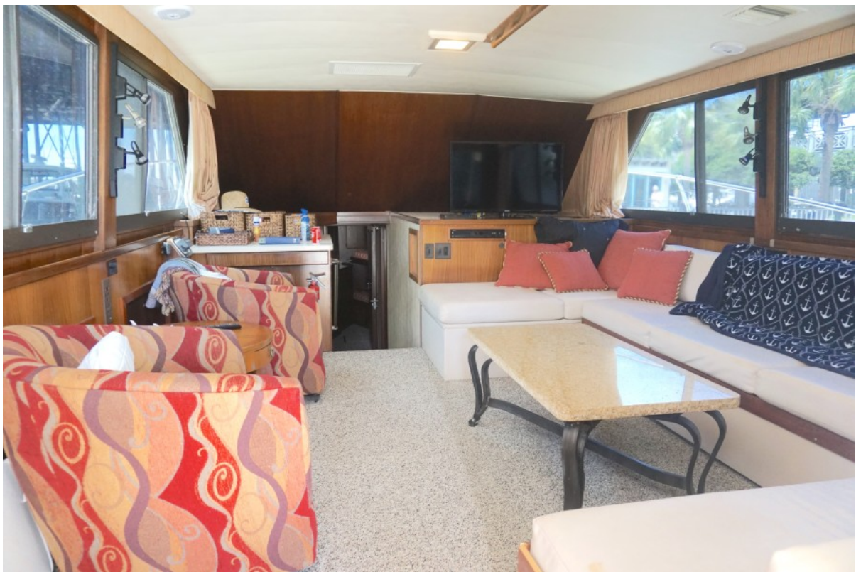
1990 52 Hatteras Convertible My Way Salon (6)