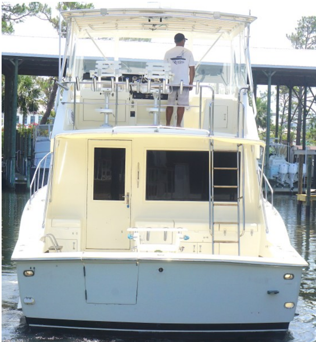
1990 52 Hatteras Convertible My Way Stern (4)