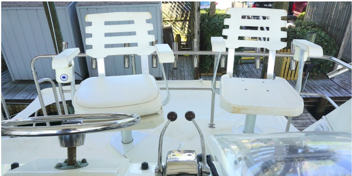
1990 52 Hatteras Convertible My Way Bridge Helm Chairs