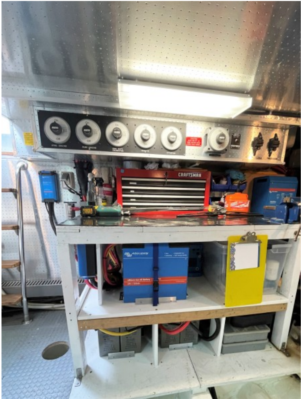
Eng room workbench