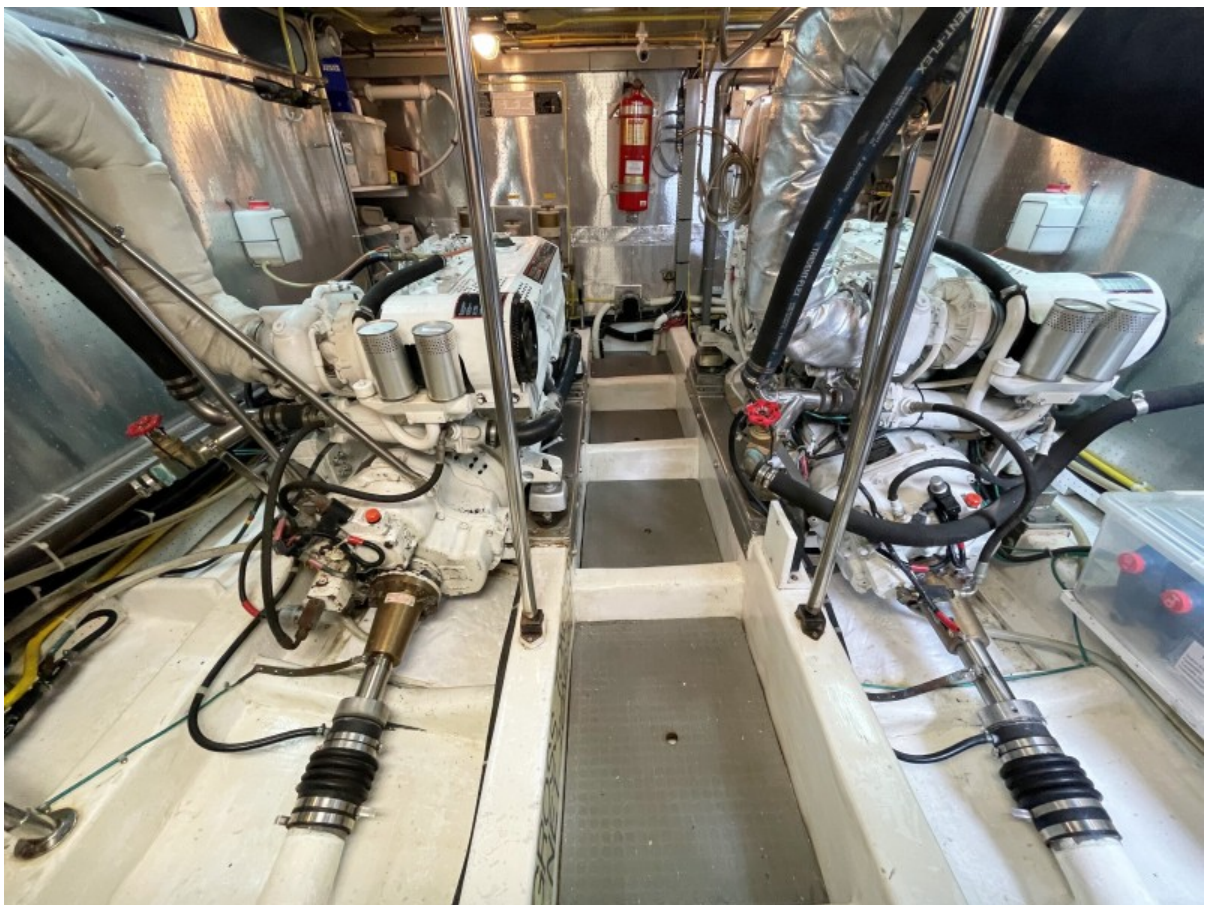
Eng room 1