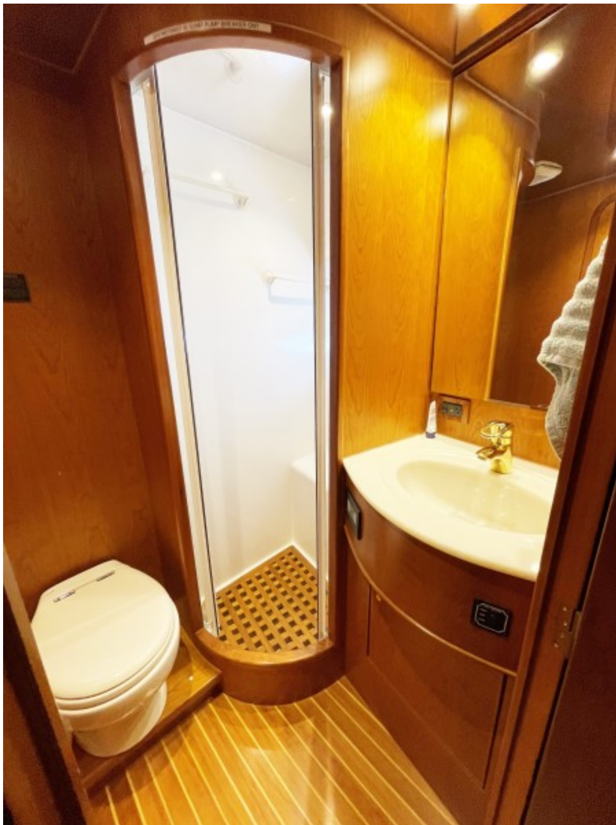
Guest head 1