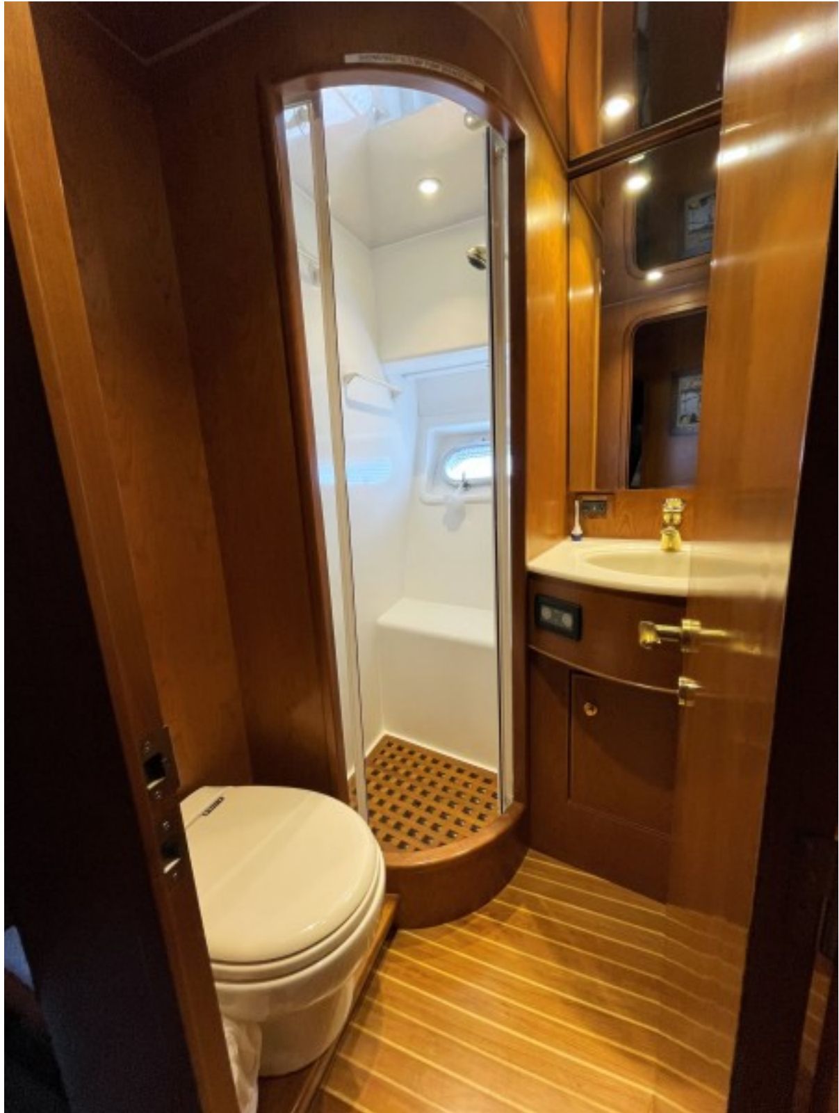
Guest head 2