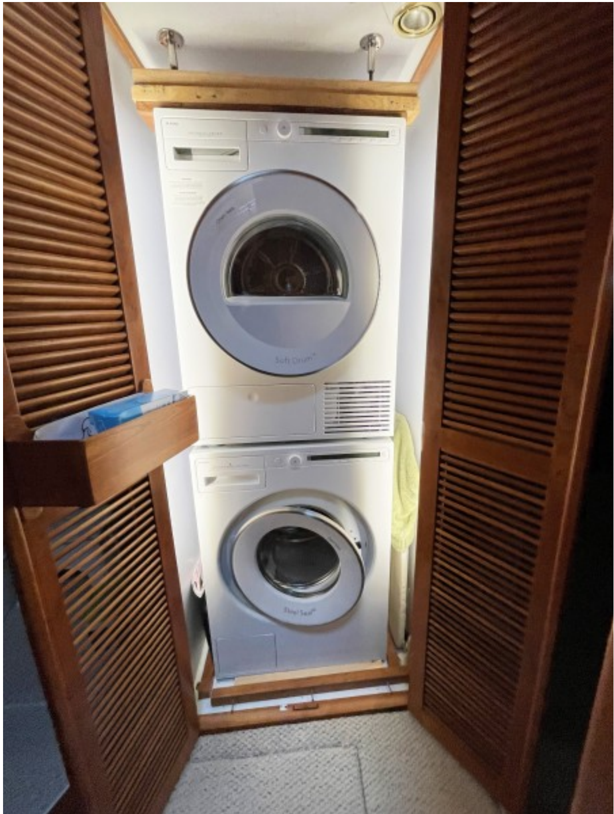
New Washer & dryer