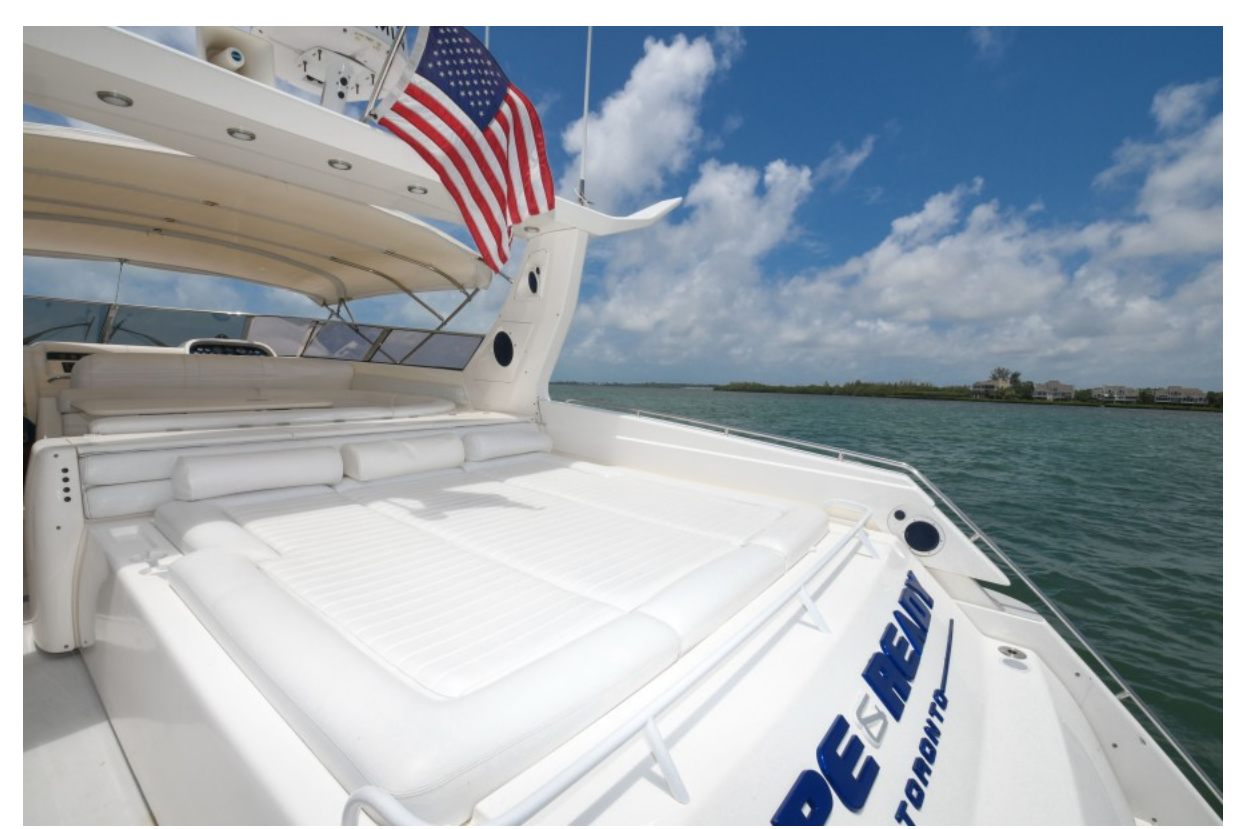
1993 Sunseeker 60 Renegade - Ripe and Ready - Aft lounge