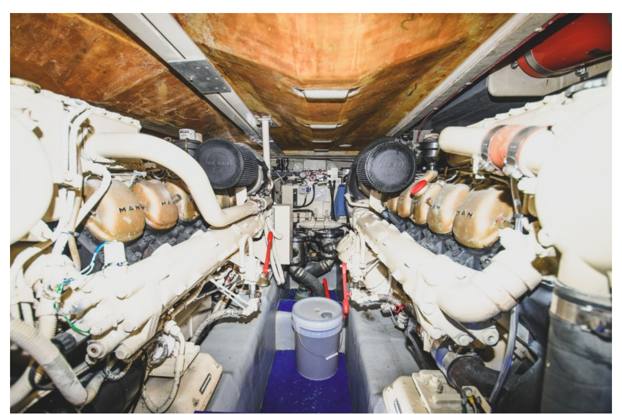
1993 Sunseeker 60 Renegade - Ripe and Ready - Engine Room