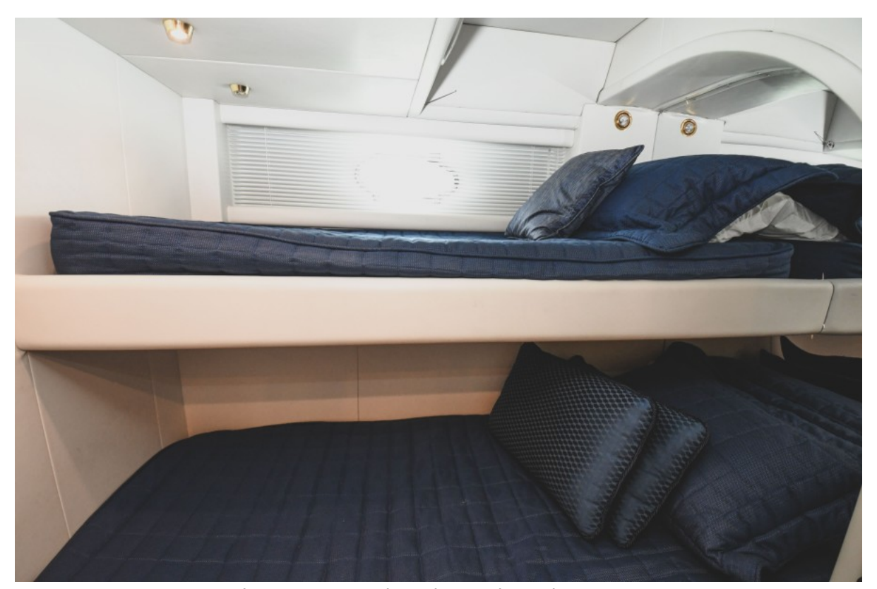
1993 Sunseeker 60 Renegade - Ripe and Ready - Guest Stateroom