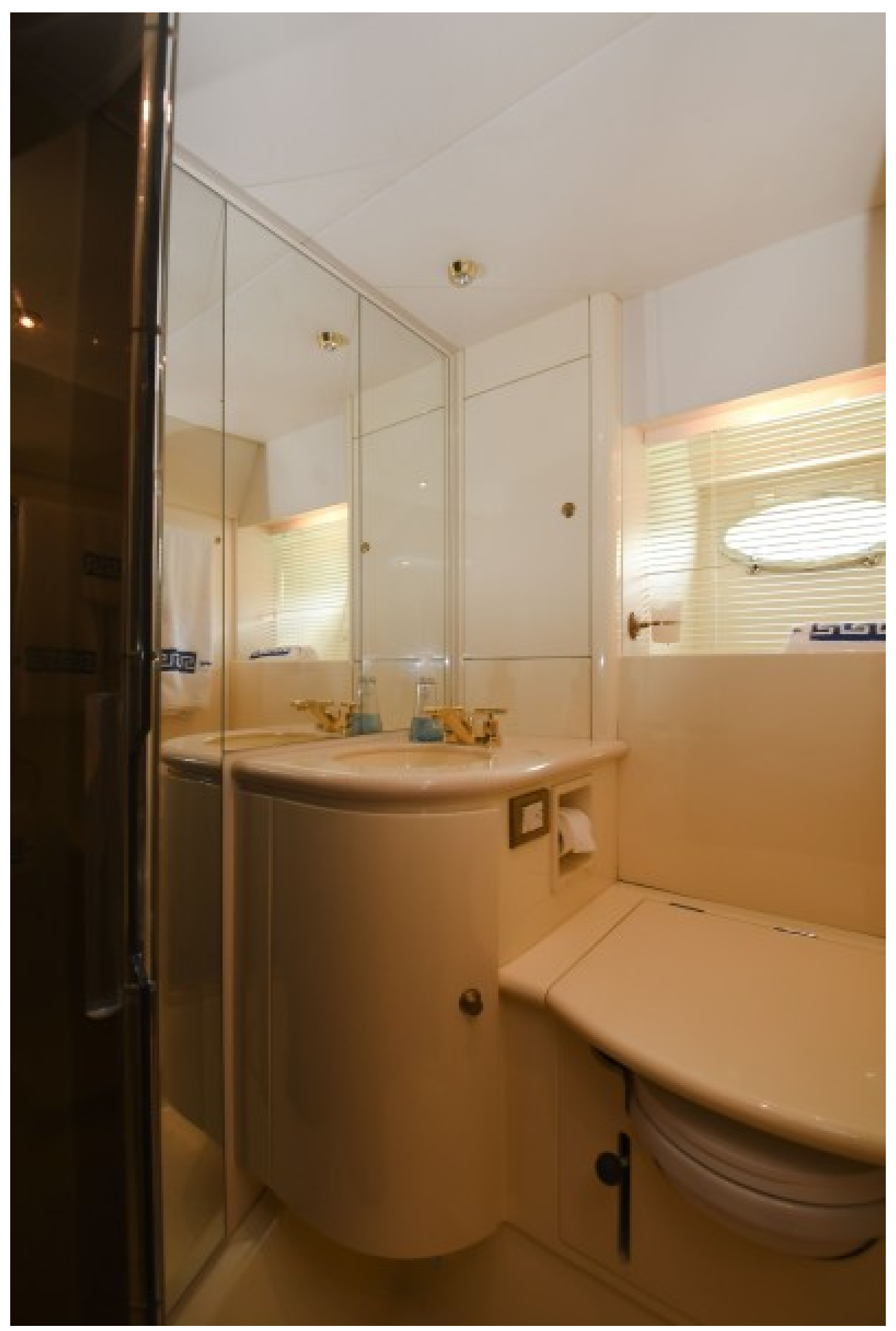
1993 Sunseeker 60 Renegade - Ripe and Ready - Guest Head