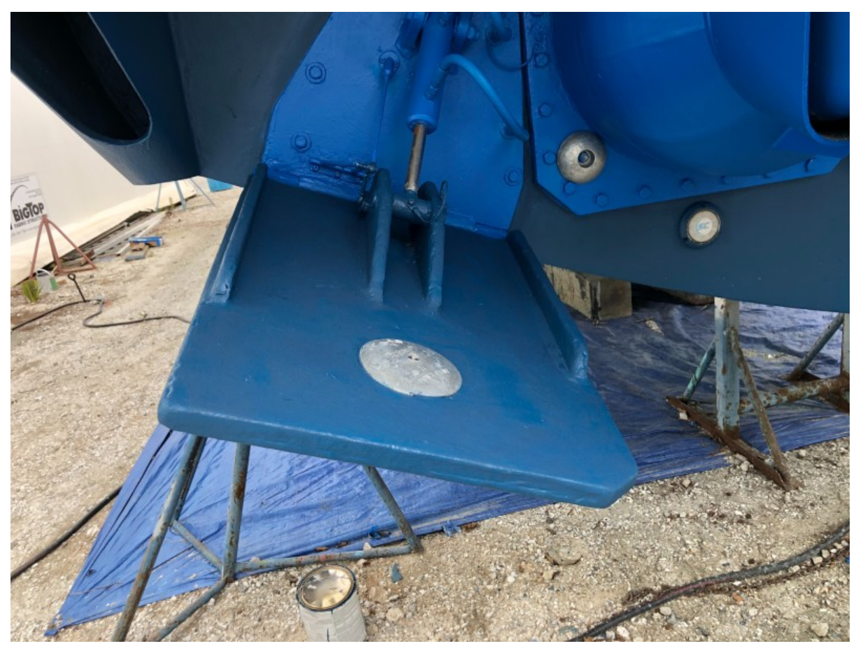
1993 Sunseeker 60 Renegade - Ripe and Ready - Bottom