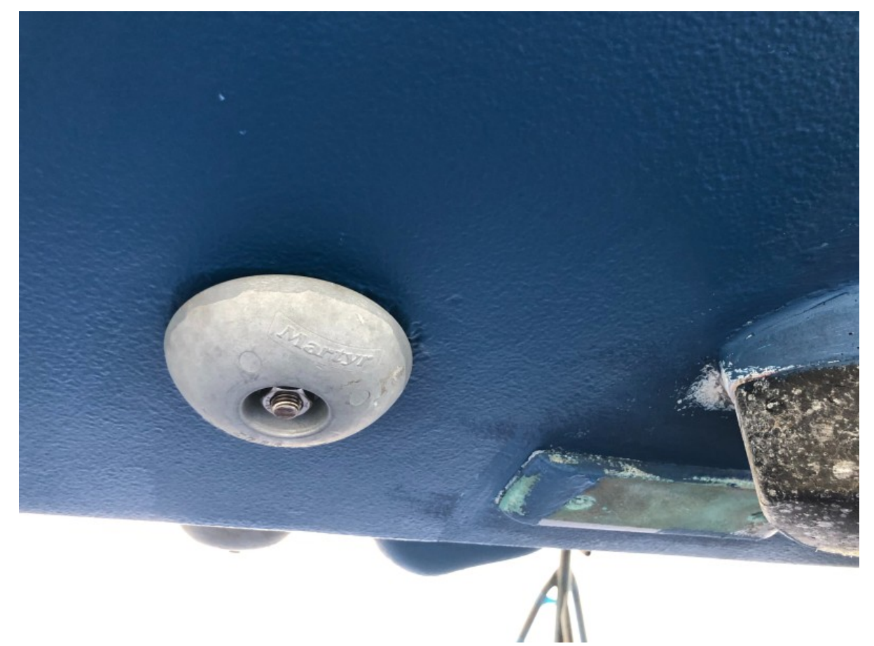
1993 Sunseeker 60 Renegade - Ripe and Ready - Bottom