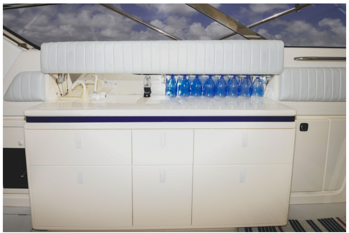
1993 Sunseeker 60 Renegade - Ripe and Ready - Cockpit Bar