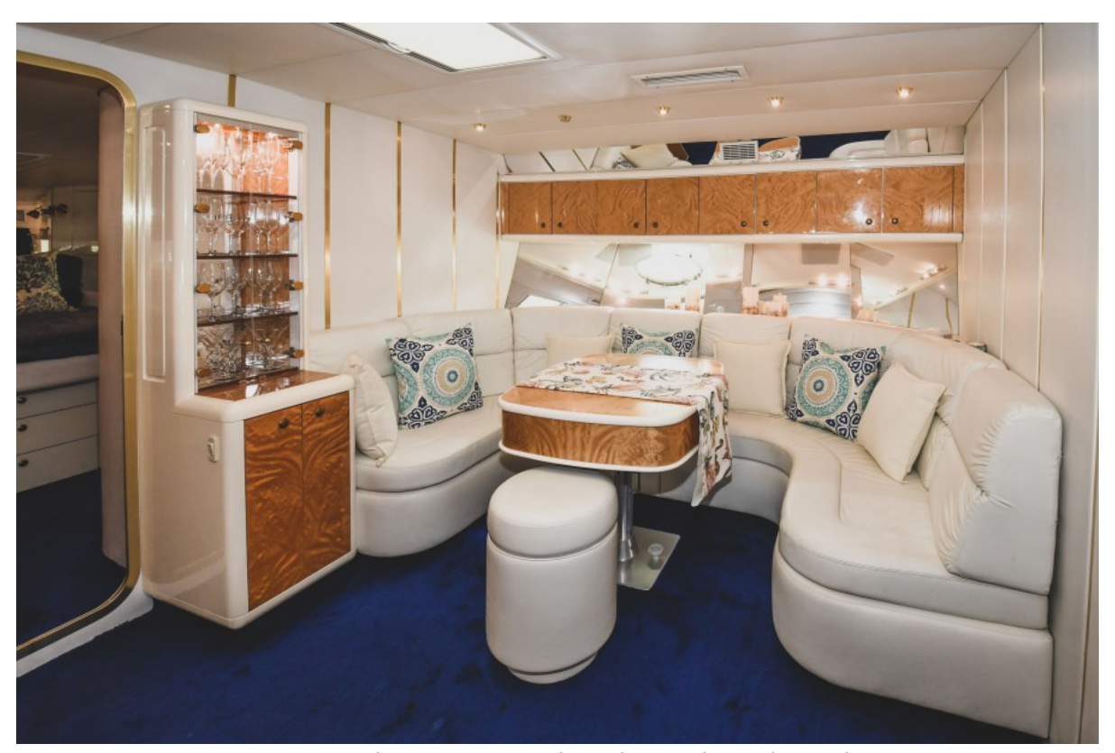
1993 Sunseeker 60 Renegade - Ripe and Ready - Salon