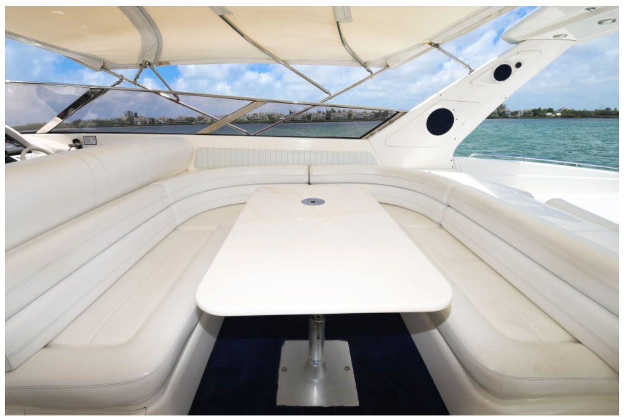
1993 Sunseeker 60 Renegade - Ripe and Ready - Dinette