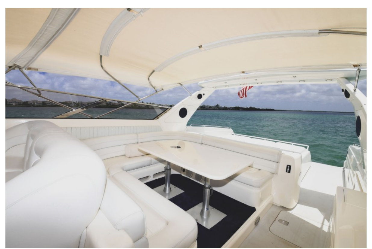
1993 Sunseeker 60 Renegade - Ripe and Ready - Cockpit