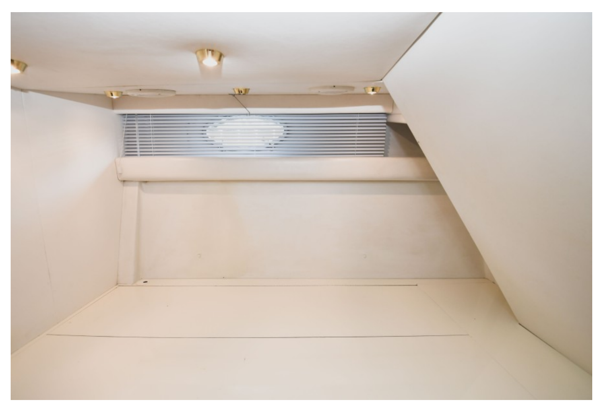
1993 Sunseeker 60 Renegade - Ripe and Ready - Berth / Storage