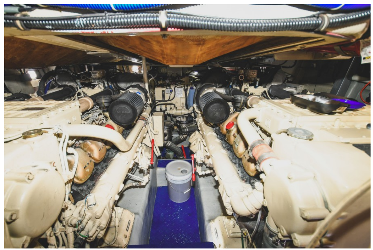
1993 Sunseeker 60 Renegade - Ripe and Ready - Engine Room