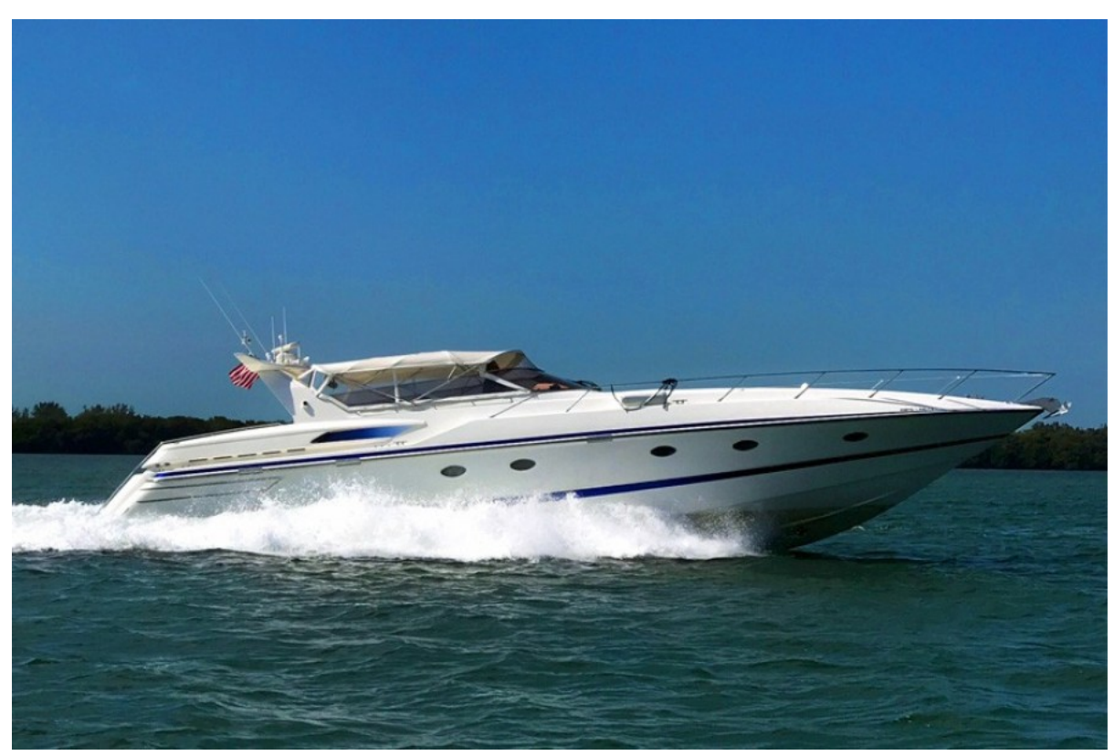
1993 Sunseeker 60 Renegade - Ripe and Ready