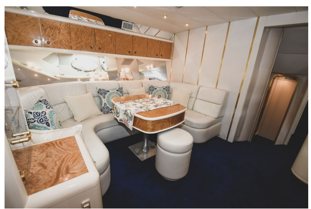
1993 Sunseeker 60 Renegade - Ripe and Ready - Salon