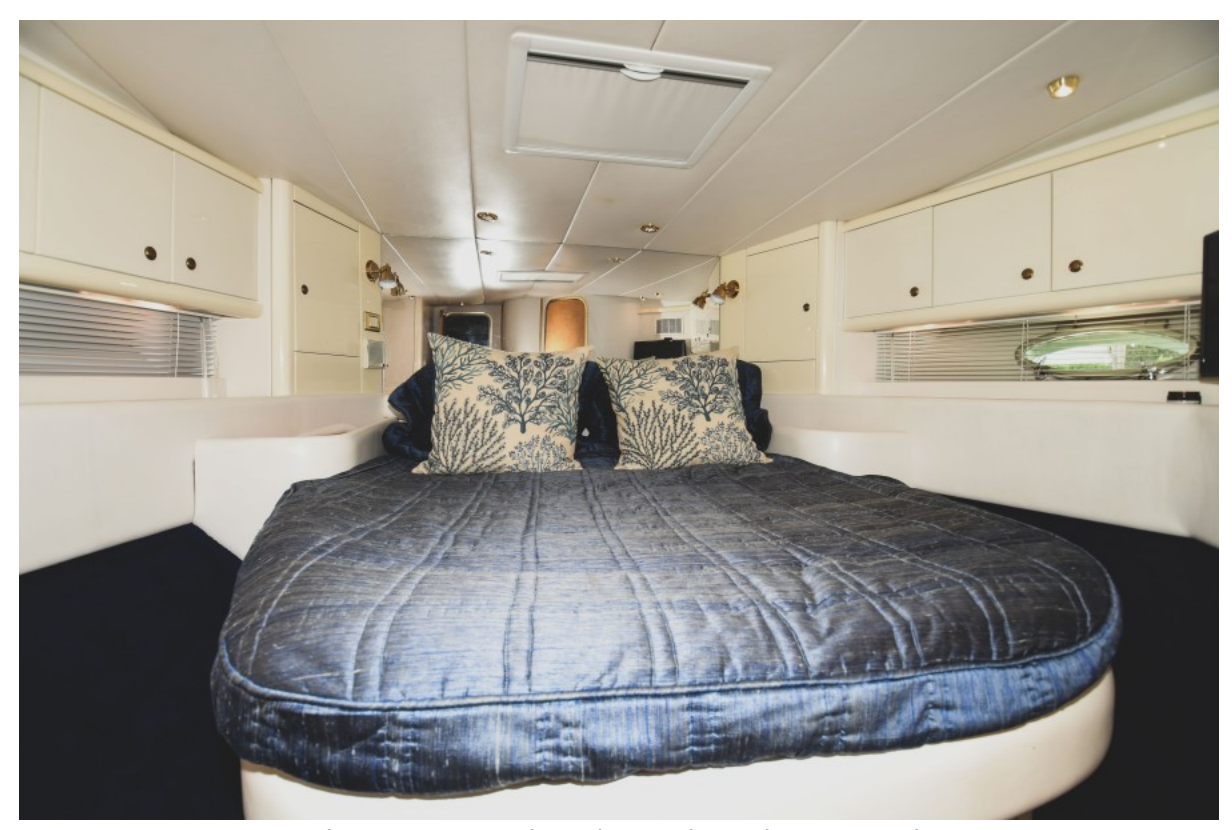
1993 Sunseeker 60 Renegade - Ripe and Ready - Forward Stateroom