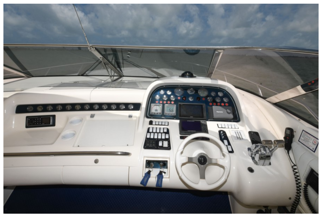
1993 Sunseeker 60 Renegade - Ripe and Ready - Helm