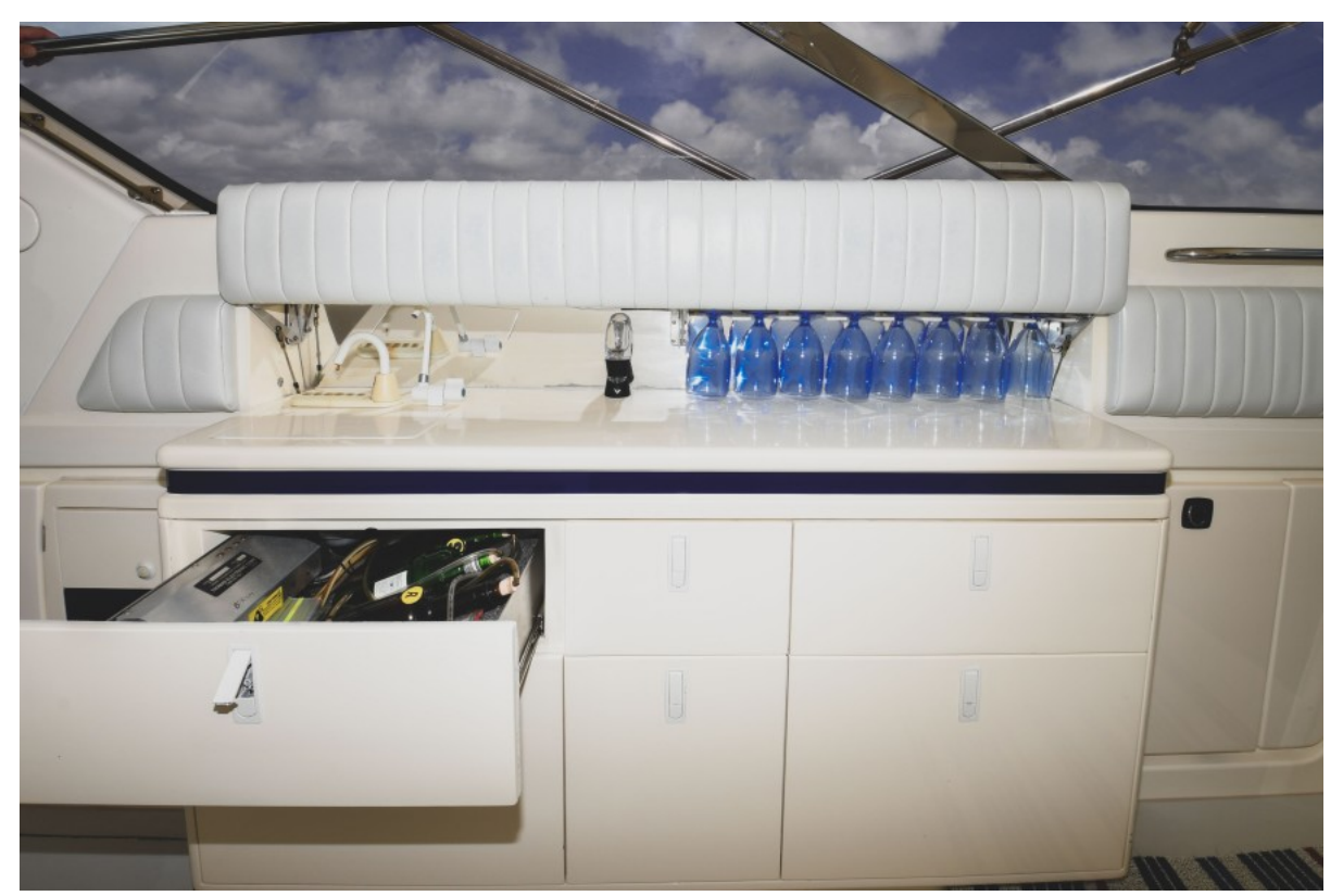
1993 Sunseeker 60 Renegade - Ripe and Ready - Cockpit Bar