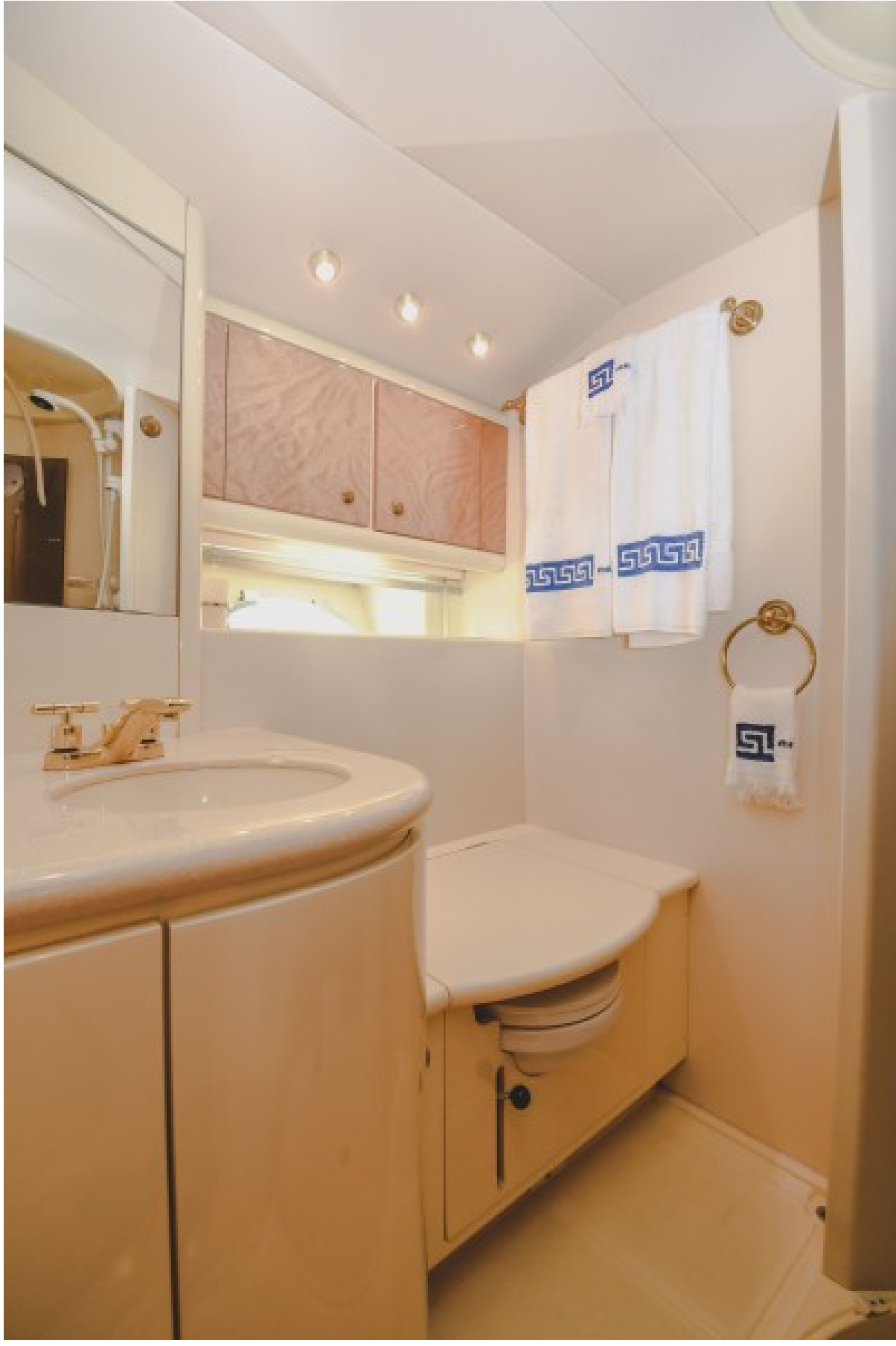
1993 Sunseeker 60 Renegade - Ripe and Ready - Forward Stateroom Head