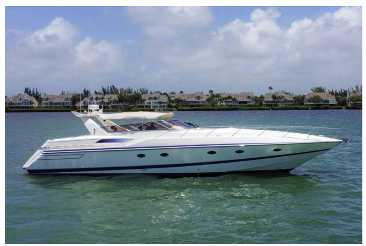
1993 Sunseeker 60 Renegade - Ripe and Ready