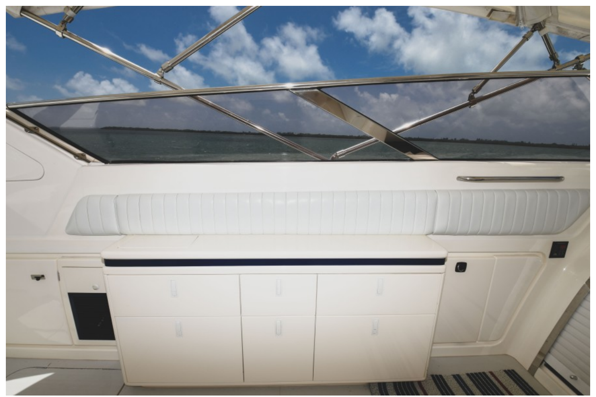
1993 Sunseeker 60 Renegade - Ripe and Ready - Cockpit