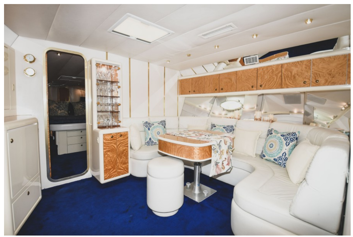
1993 Sunseeker 60 Renegade - Ripe and Ready - Salon