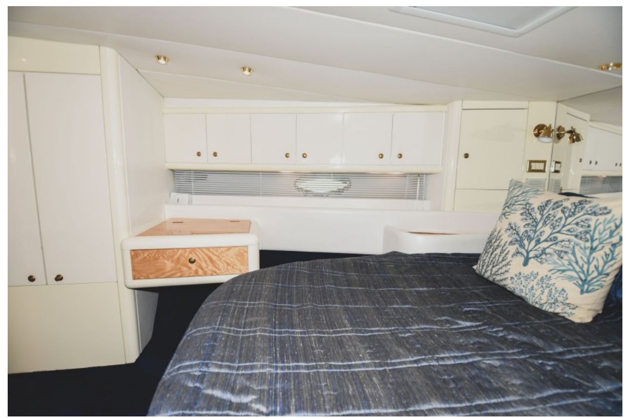
1993 Sunseeker 60 Renegade - Ripe and Ready - Forward Stateroom