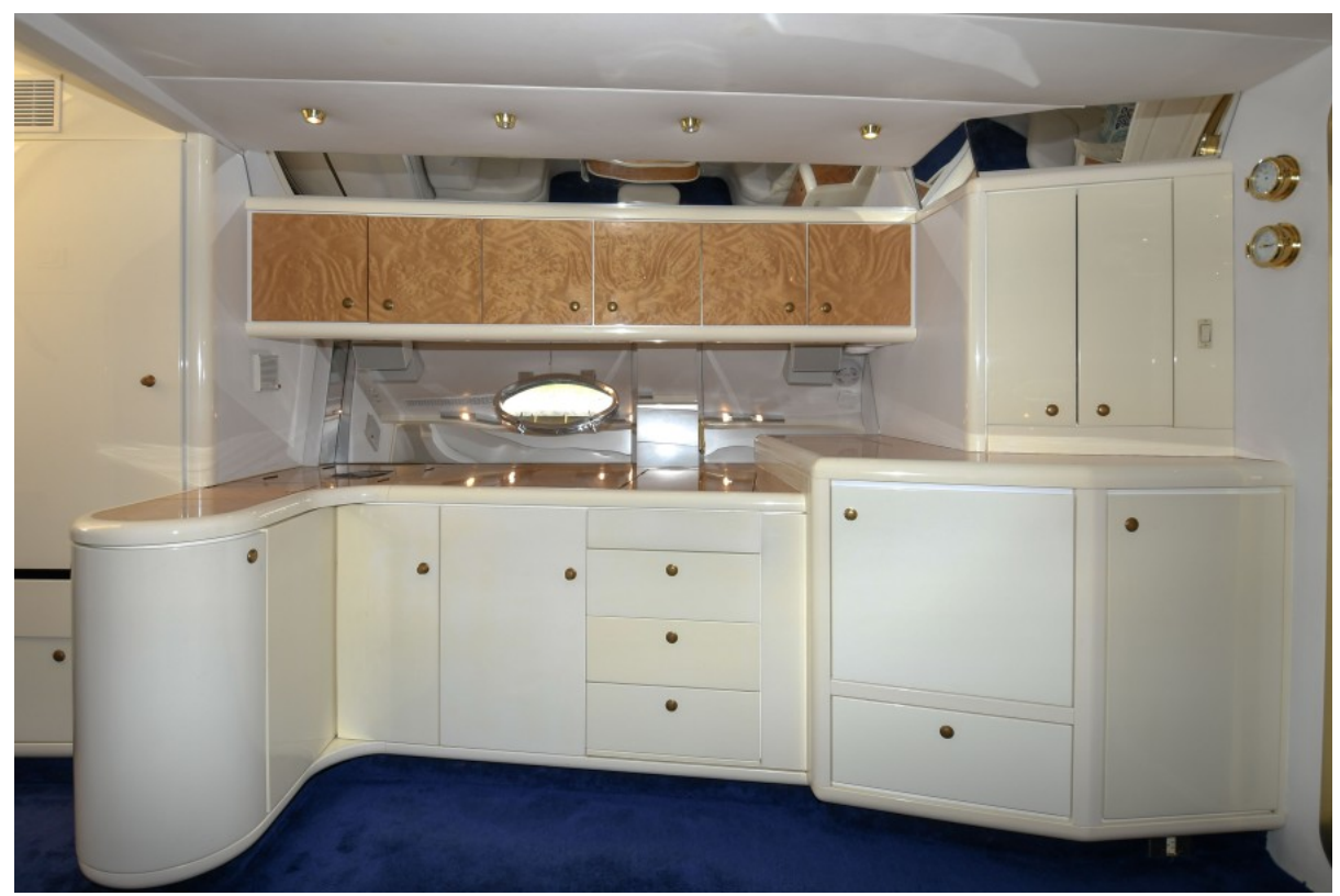
1993 Sunseeker 60 Renegade - Ripe and Ready - Galley