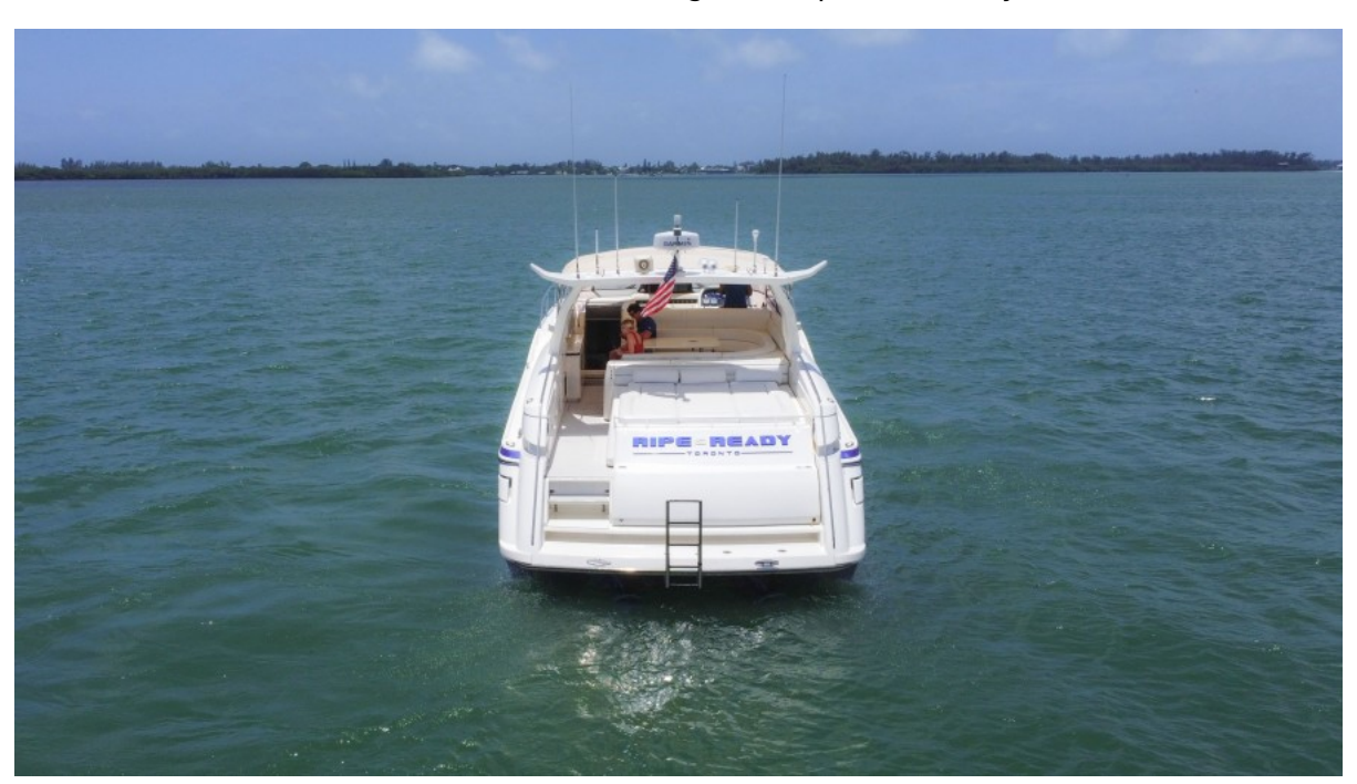
1993 Sunseeker 60 Renegade - Ripe and Ready