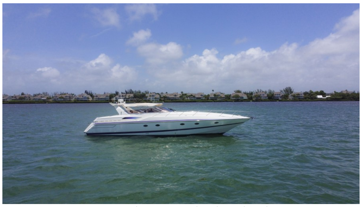
1993 Sunseeker 60 Renegade - Ripe and Ready