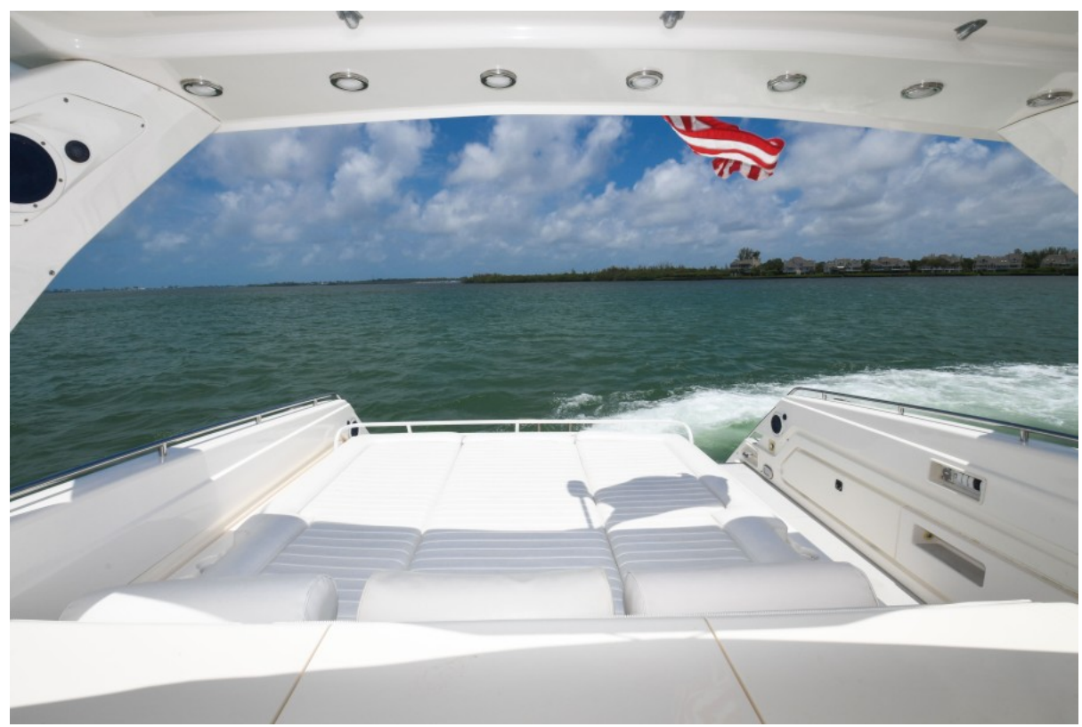
1993 Sunseeker 60 Renegade - Ripe and Ready - Aft lounge