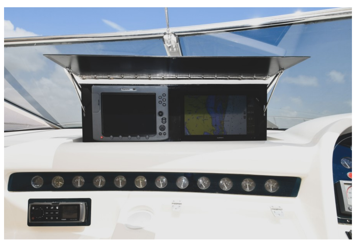
1993 Sunseeker 60 Renegade - Ripe and Ready - Helm