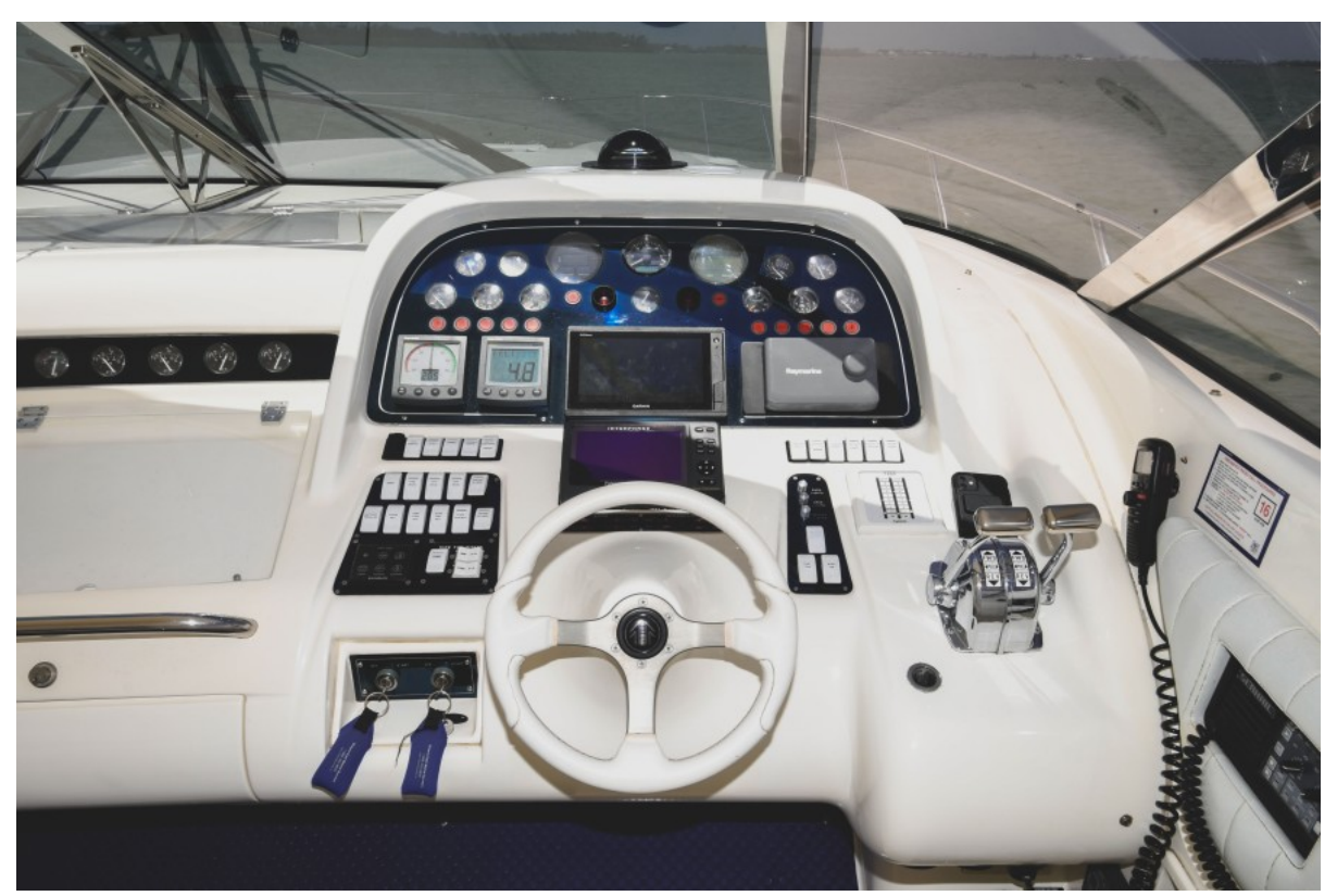
1993 Sunseeker 60 Renegade - Ripe and Ready - Helm