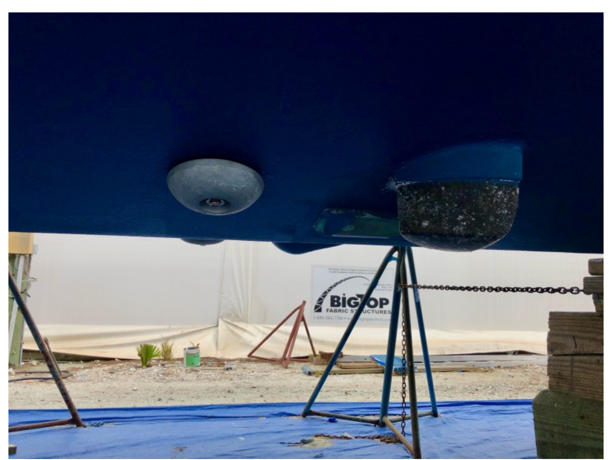
1993 Sunseeker 60 Renegade - Ripe and Ready - Bottom