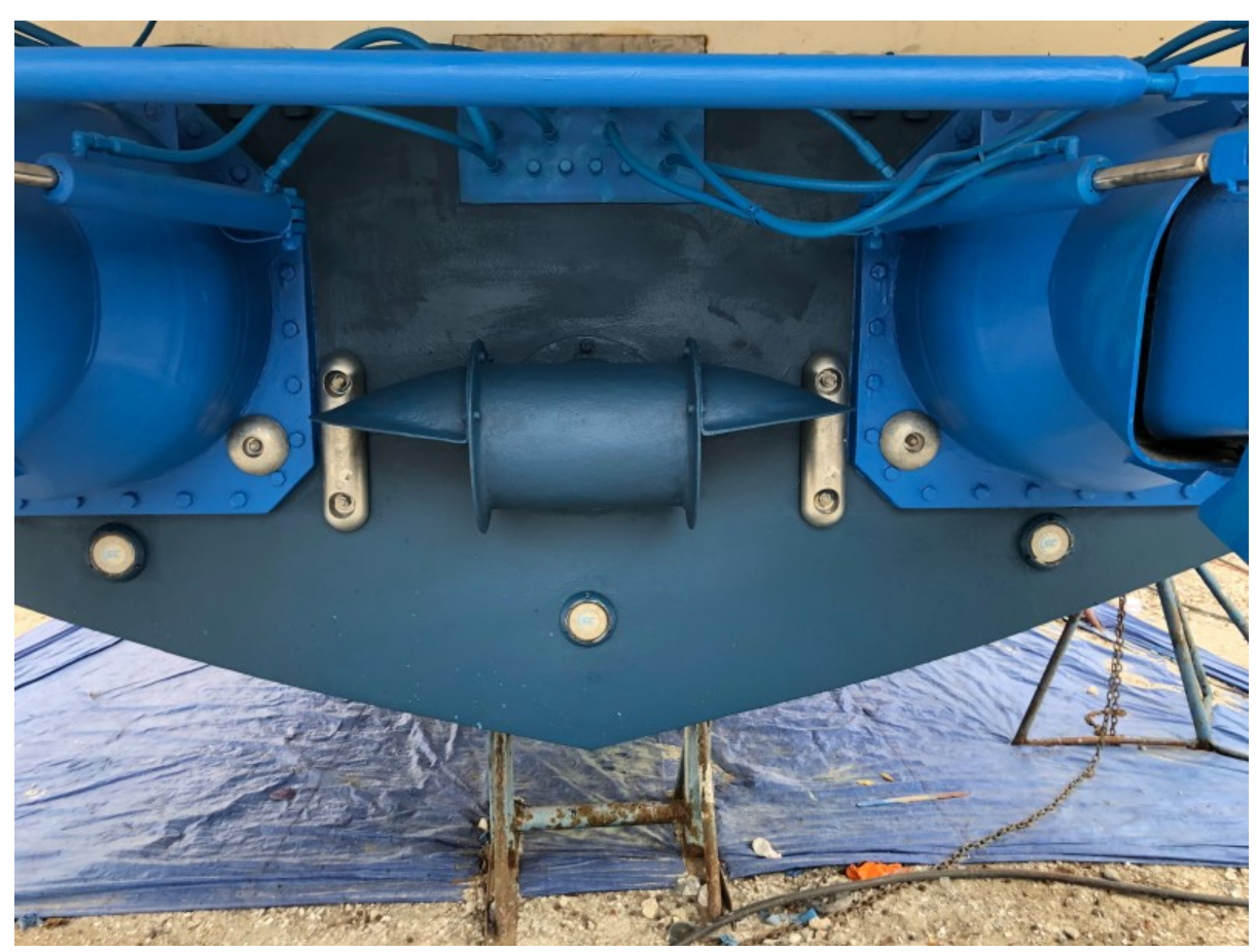
1993 Sunseeker 60 Renegade - Ripe and Ready - Bottom