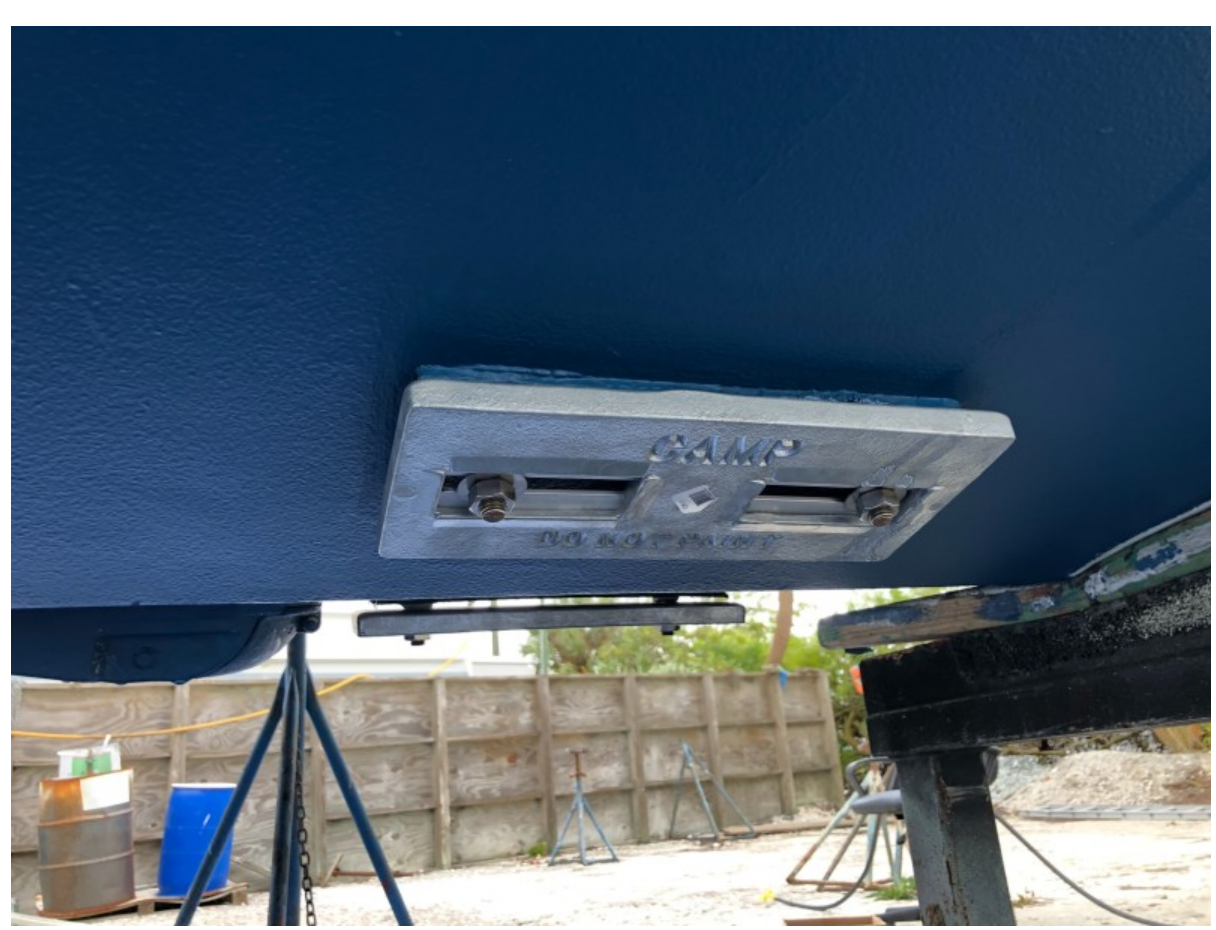
1993 Sunseeker 60 Renegade - Ripe and Ready - Bottom