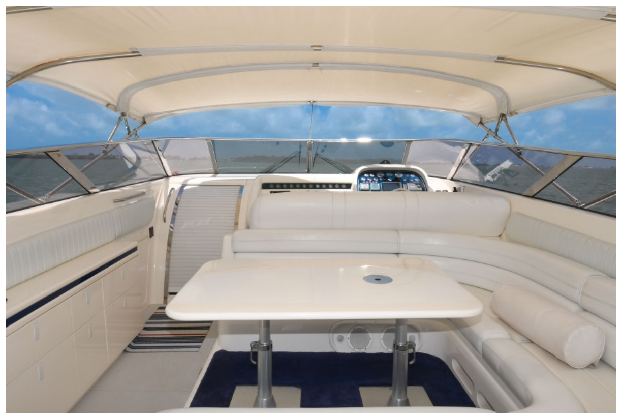
1993 Sunseeker 60 Renegade - Ripe and Ready - Cockpit