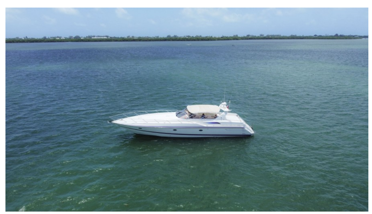
1993 Sunseeker 60 Renegade - Ripe and Ready