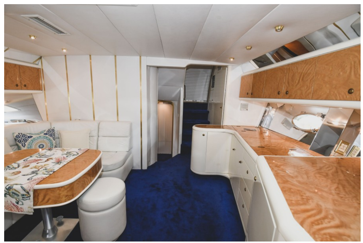
1993 Sunseeker 60 Renegade - Ripe and Ready - Salon / Galley