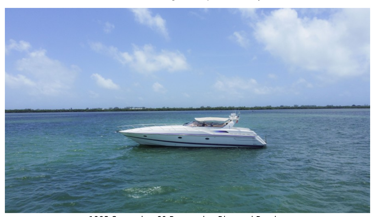
1993 Sunseeker 60 Renegade - Ripe and Ready