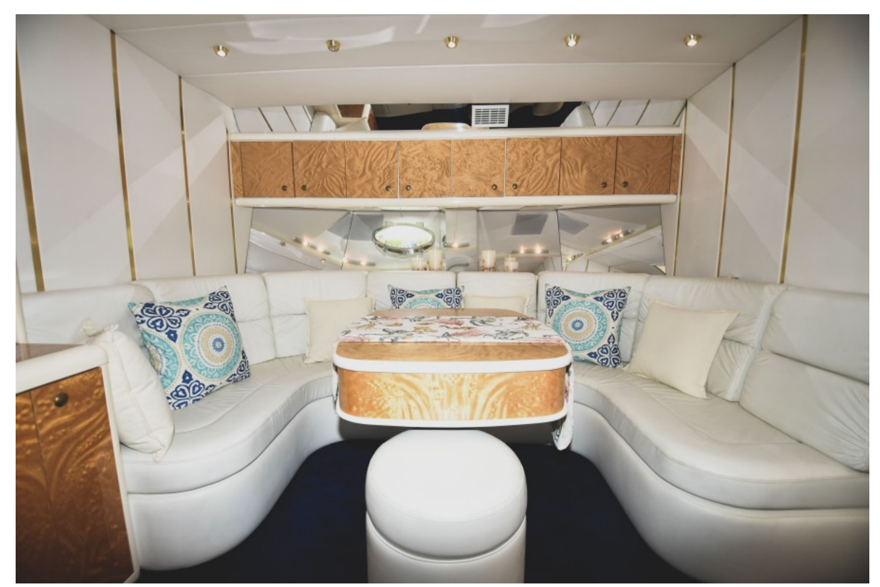
1993 Sunseeker 60 Renegade - Ripe and Ready - Salon