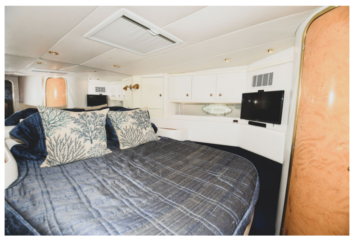
1993 Sunseeker 60 Renegade - Ripe and Ready - Forward Stateroom