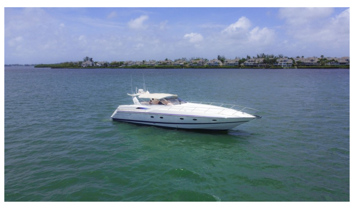
1993 Sunseeker 60 Renegade - Ripe and Ready