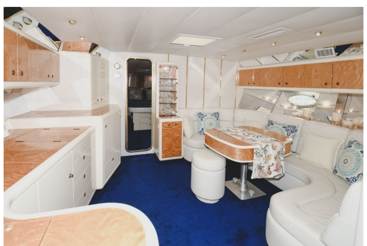
1993 Sunseeker 60 Renegade - Ripe and Ready - Salon