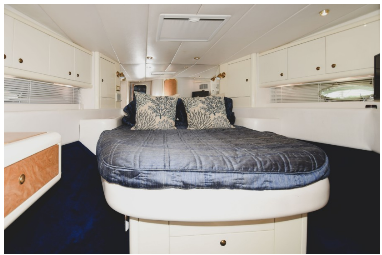
1993 Sunseeker 60 Renegade - Ripe and Ready - Forward Stateroom