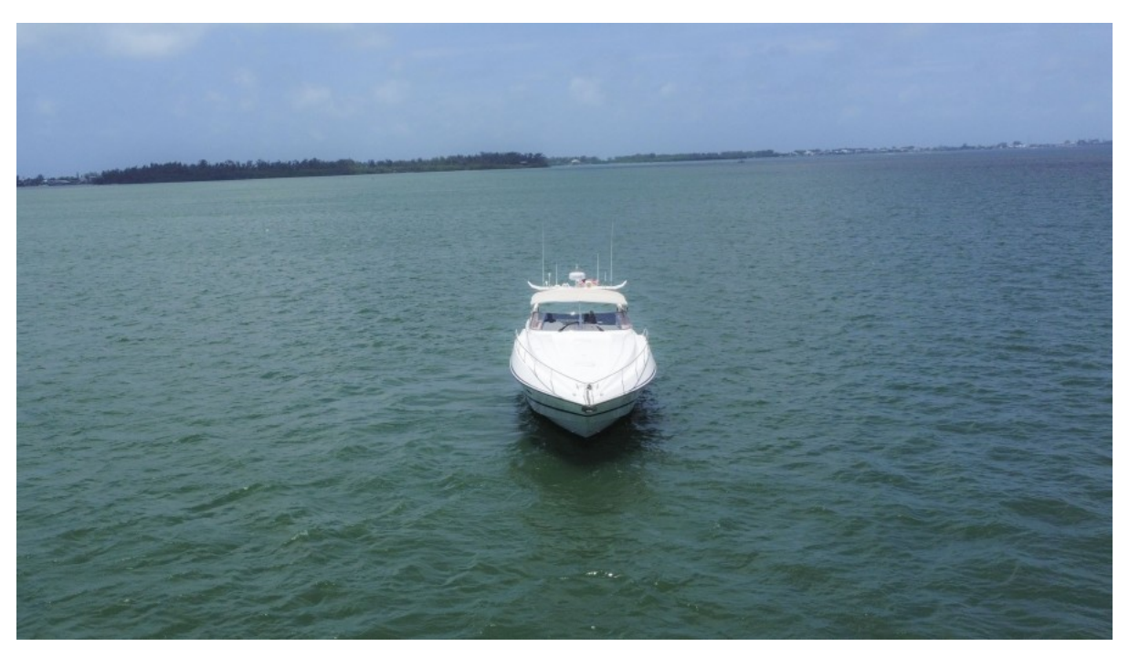
1993 Sunseeker 60 Renegade - Ripe and Ready