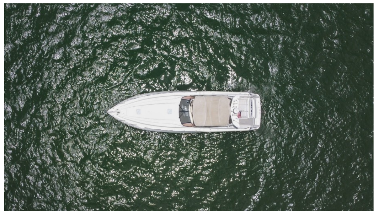
1993 Sunseeker 60 Renegade - Ripe and Ready