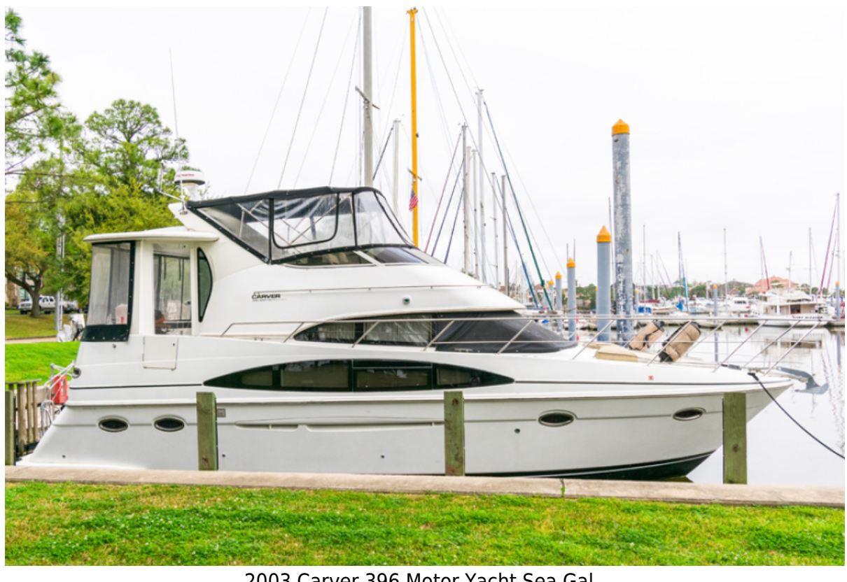
2003 Carver 396 Motor Yacht Sea Gal