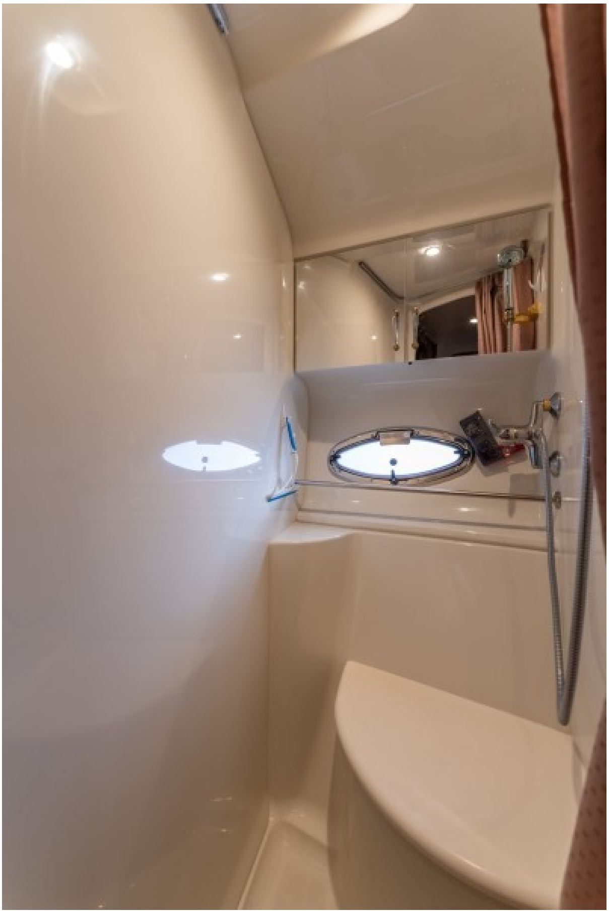
2003 Carver 396 Motor Yacht Sea Gal