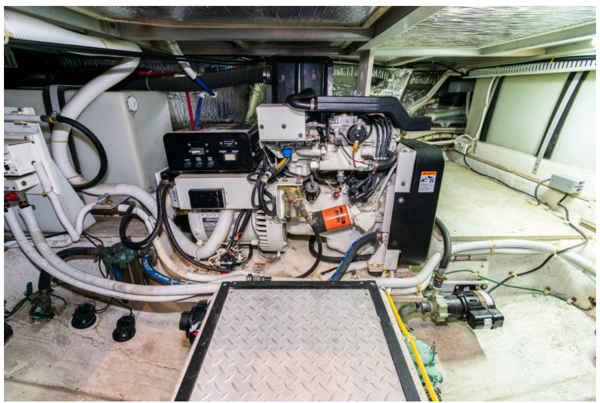
2003 Carver 396 Motor Yacht Sea Gal