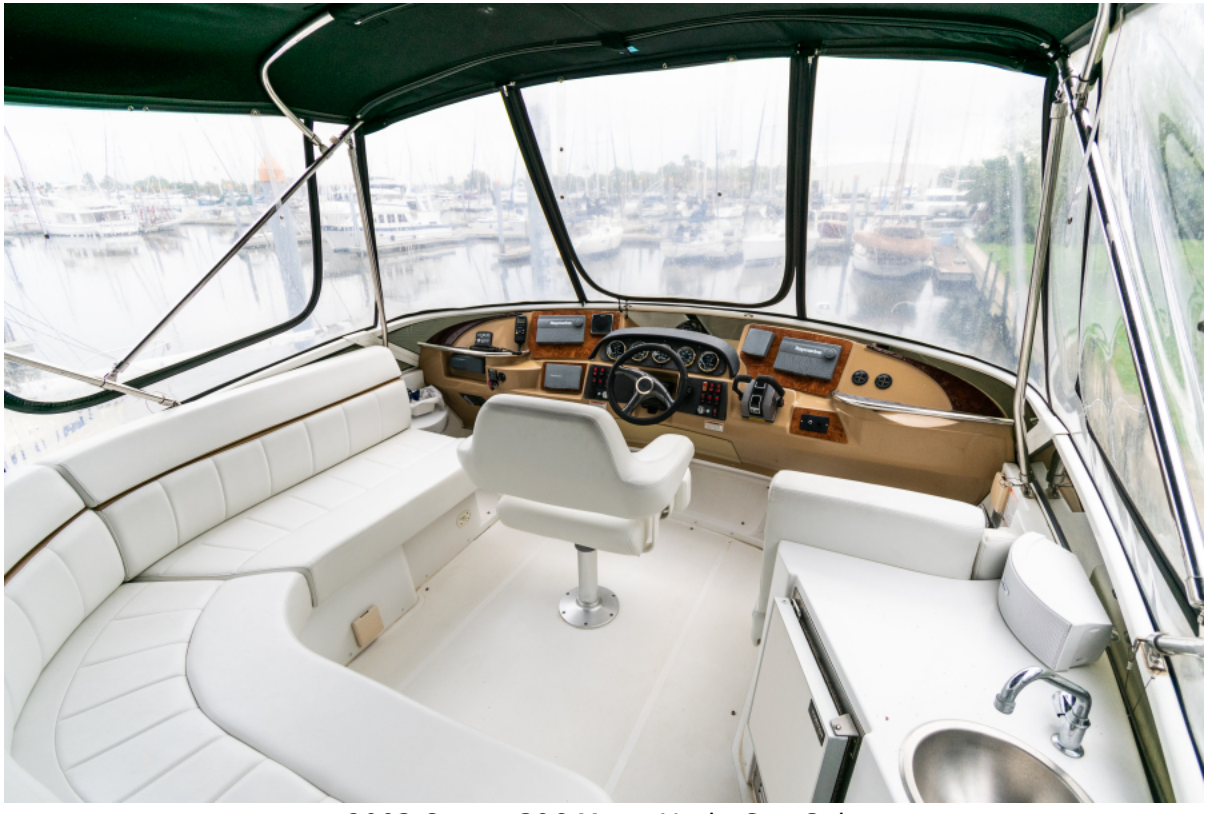
2003 Carver 396 Motor Yacht Sea Gal