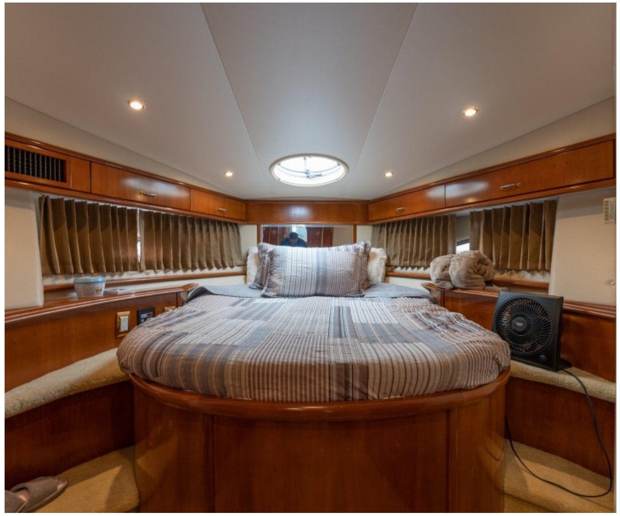
2003 Carver 396 Motor Yacht Sea Gal