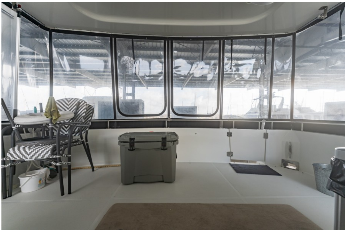
2003 Carver 396 Motor Yacht Sea Gal