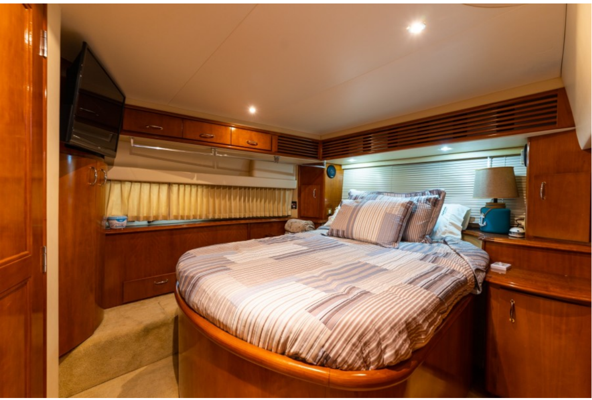
2003 Carver 396 Motor Yacht Sea Gal