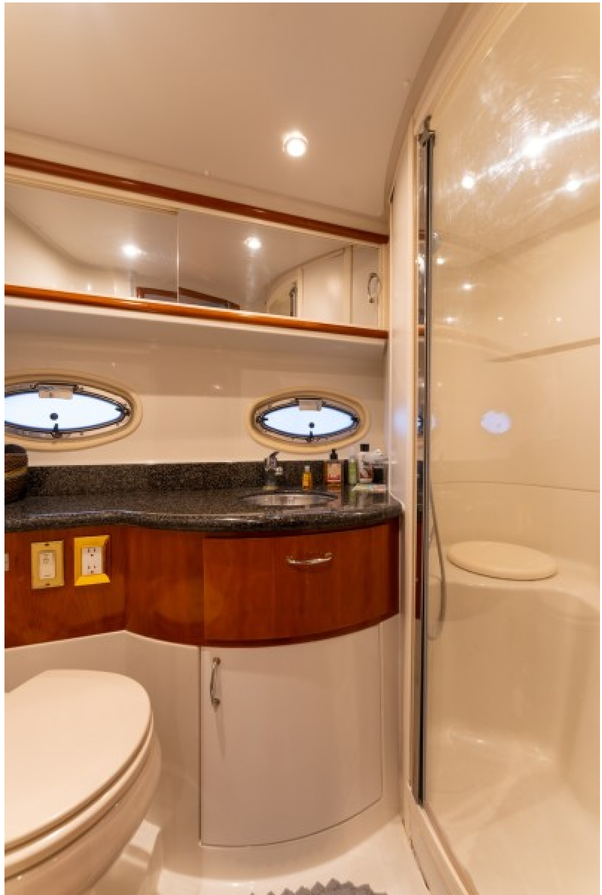
2003 Carver 396 Motor Yacht Sea Gal