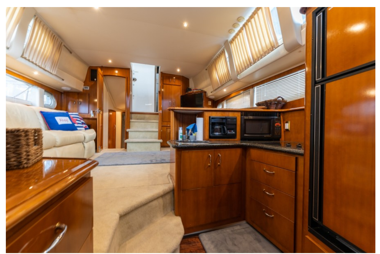
2003 Carver 396 Motor Yacht Sea Gal