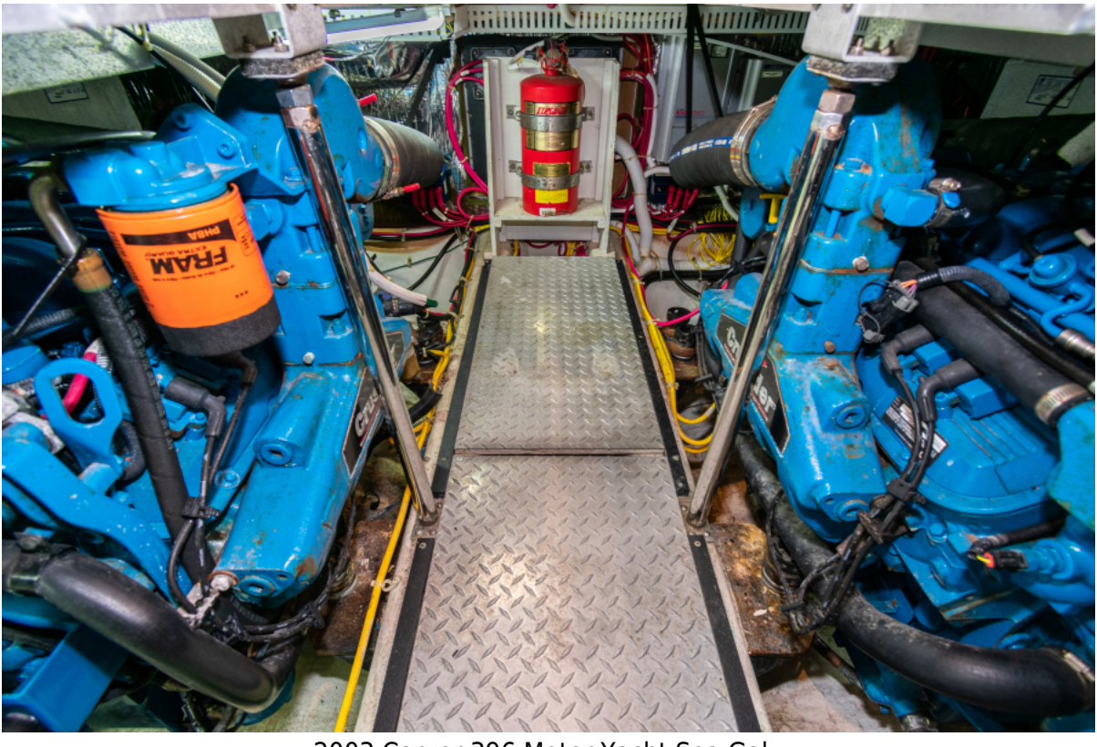
2003 Carver 396 Motor Yacht Sea Gal