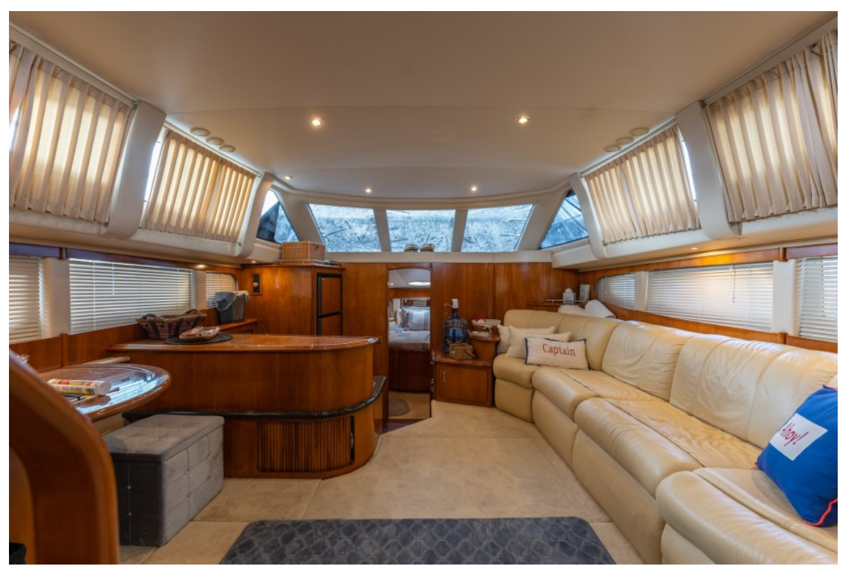
2003 Carver 396 Motor Yacht Sea Gal