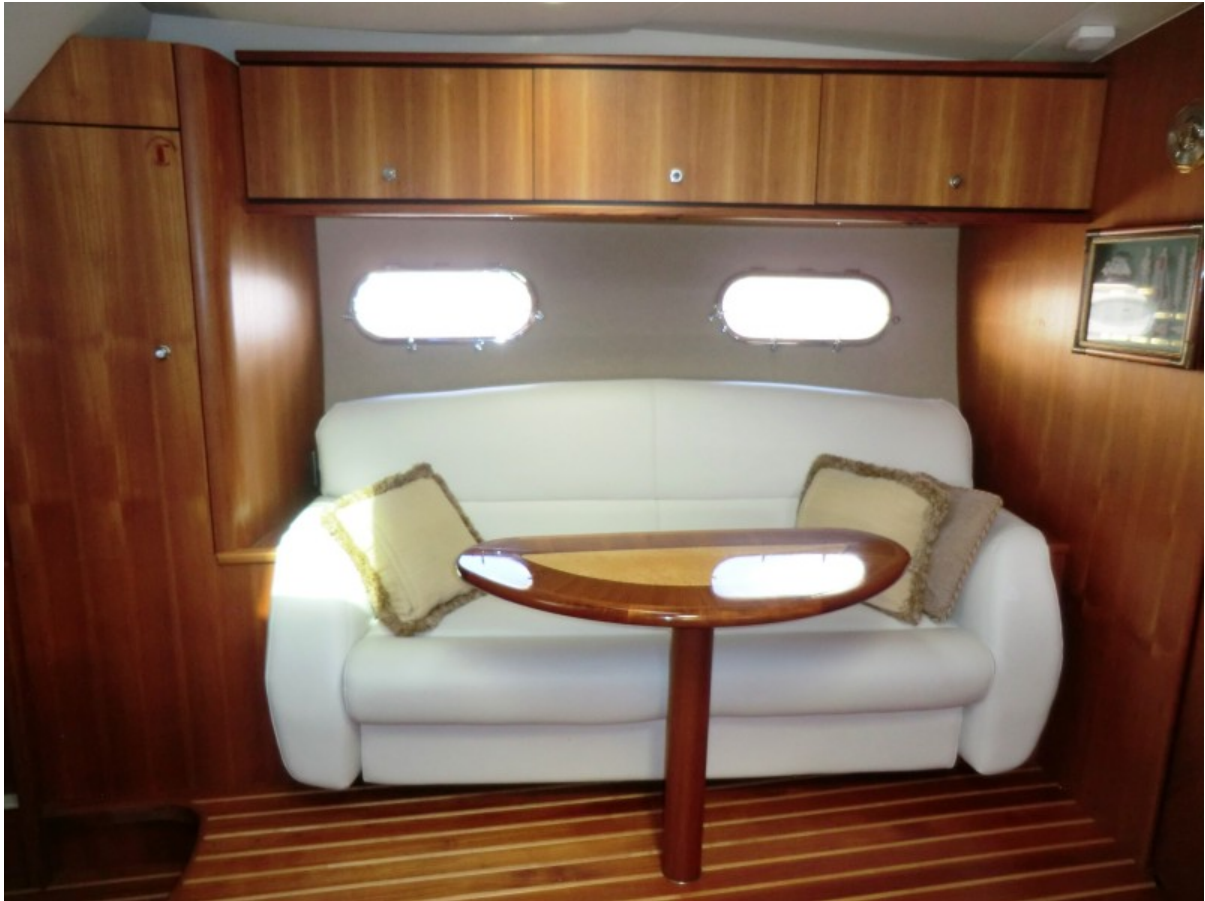
2008 3900 Tiara Sovran Salon Dinette