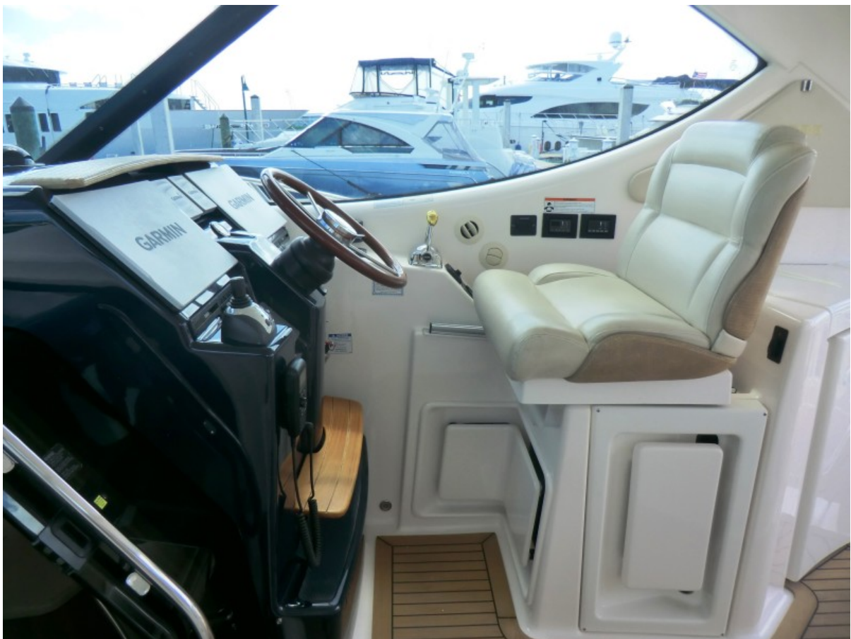
2008 3900 Tiara Sovran Helm And Seating