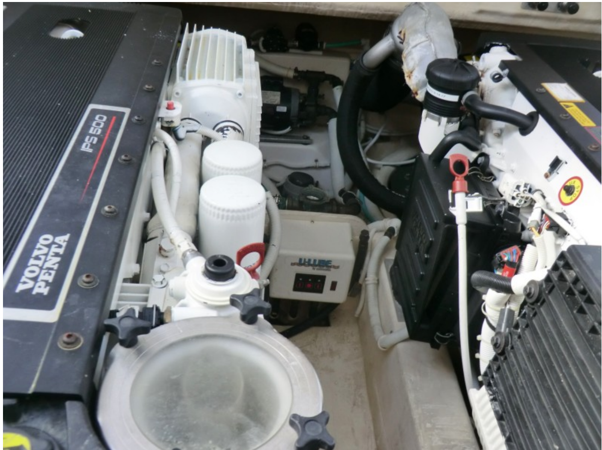
2008 3900 Tiara Sovran Engine Oil Transfer