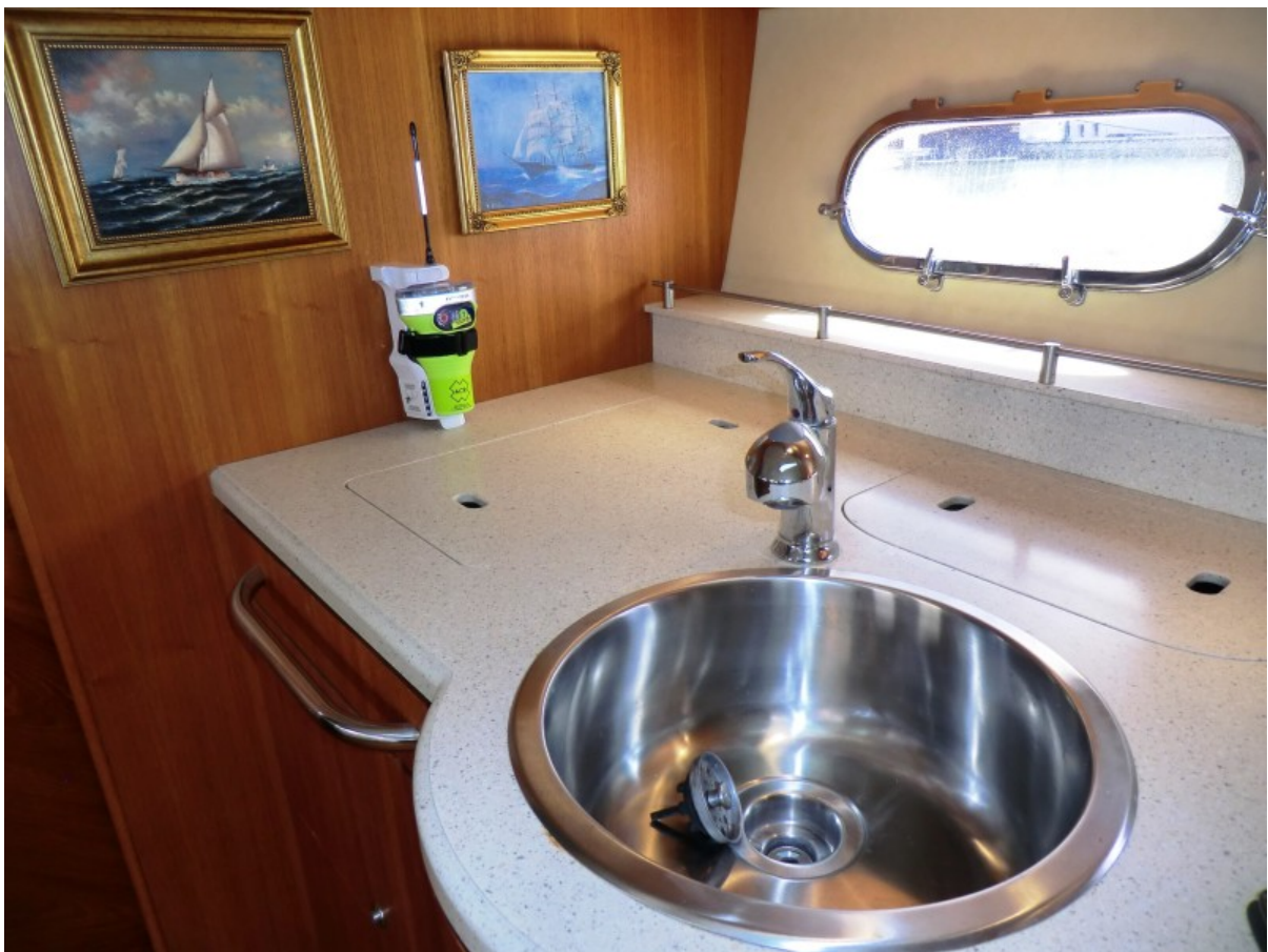
2008 3900 Tiara Sovran Galley