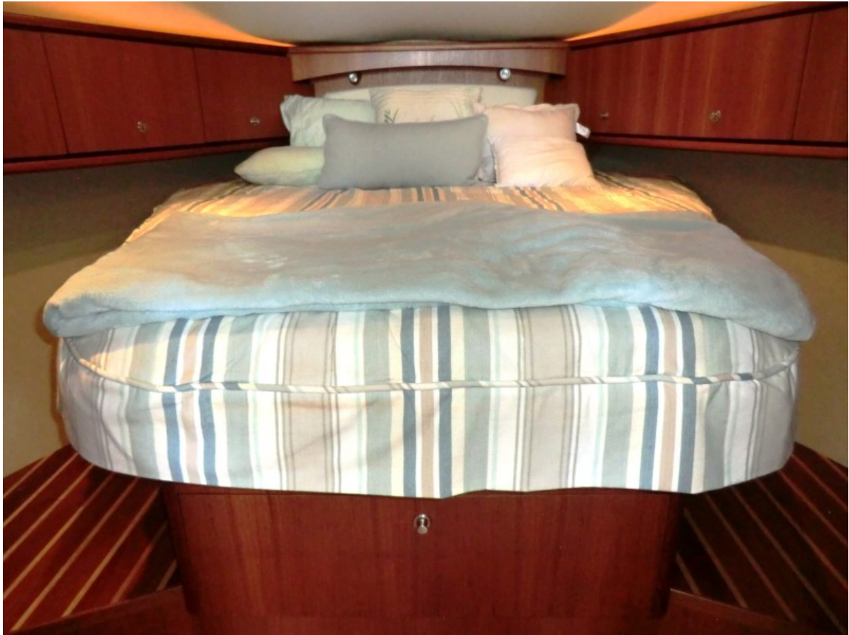
2008 3900 Tiara Sovran Master Berth