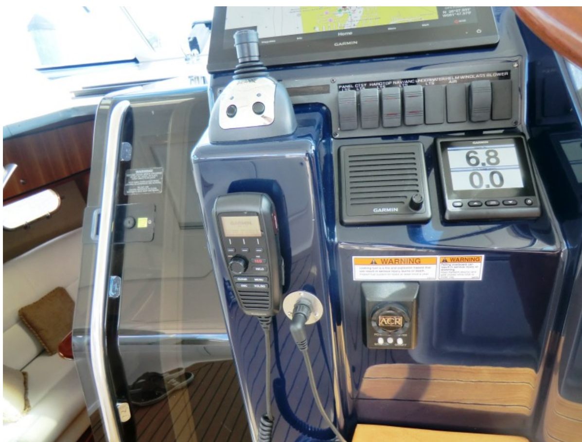
2008 3900 Tiara Sovran Helm