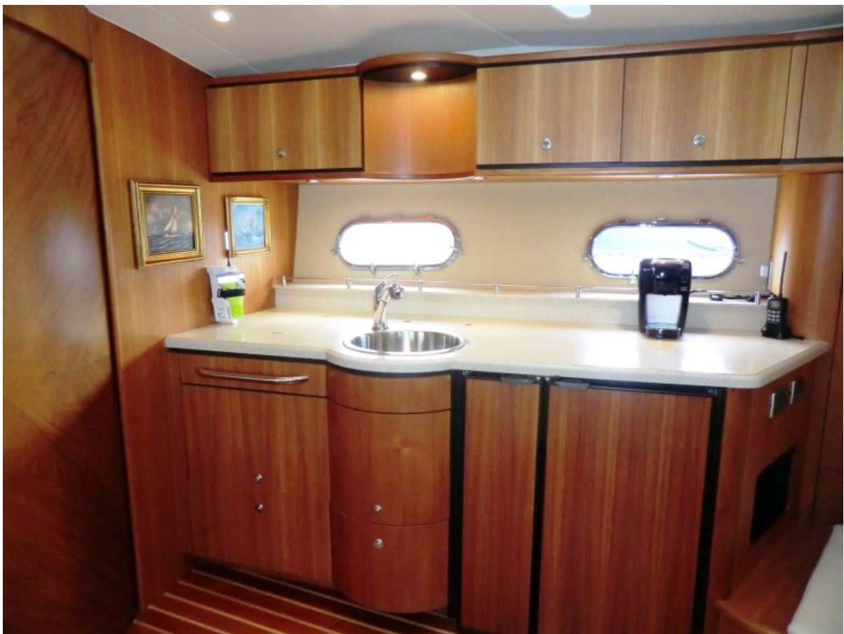
2008 3900 Tiara Sovran Galley