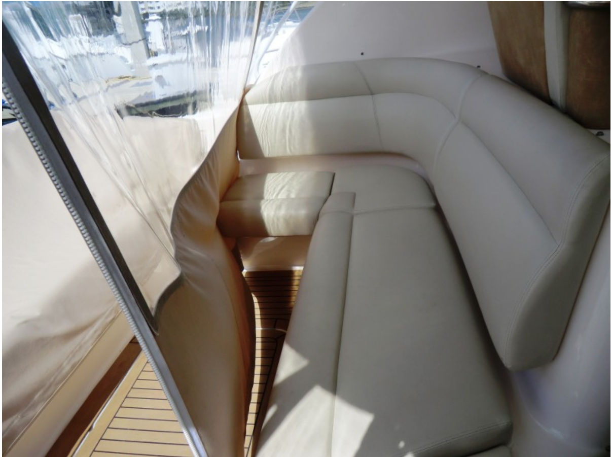
2008 3900 Tiara Sovran Lower Cockpit Aft Facing Seat