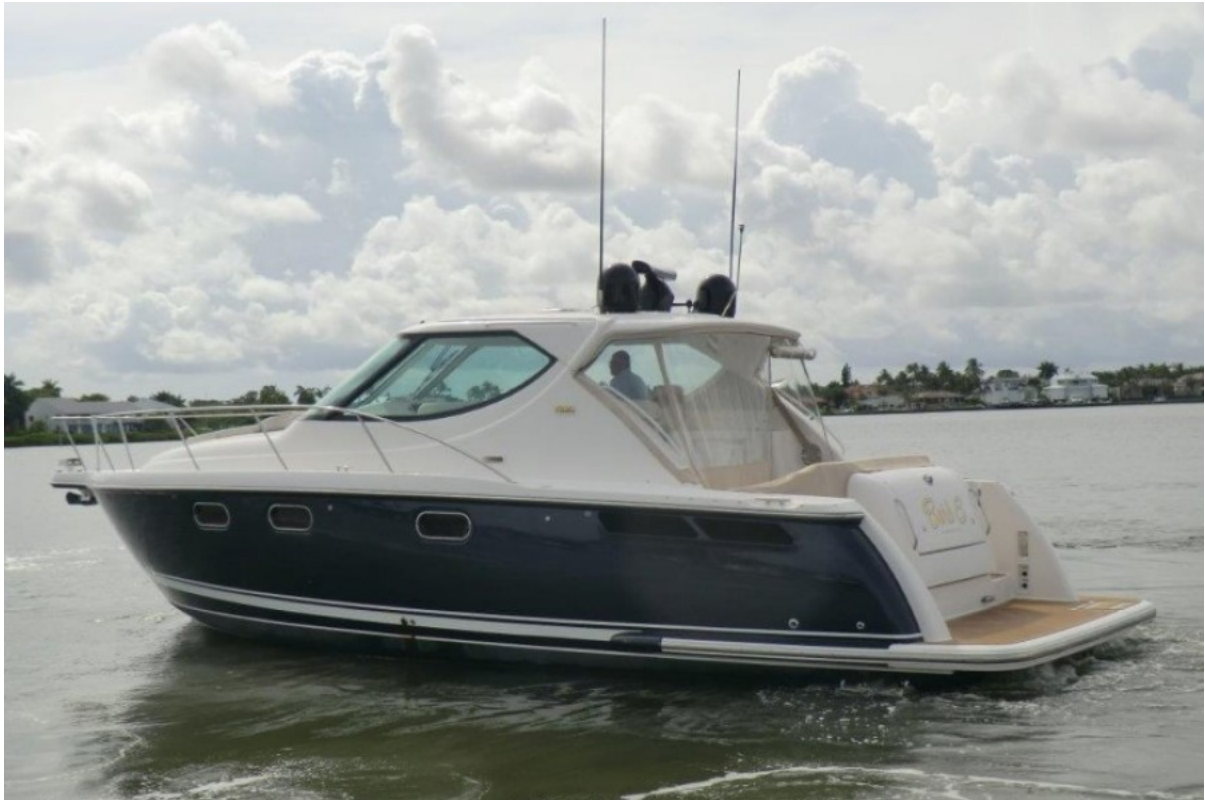
2008 3900 Tiara Sovran Profile