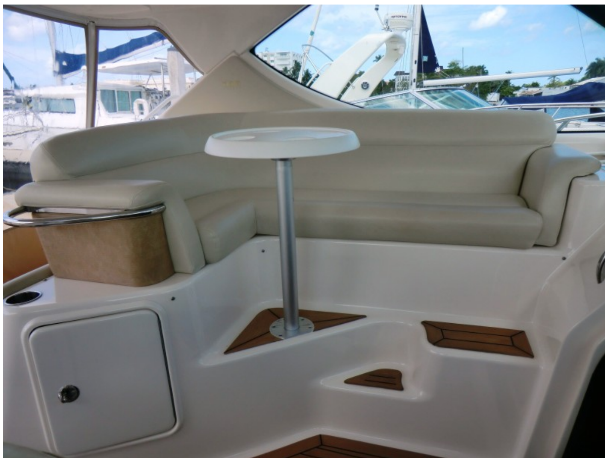
2008 3900 Tiara Sovran Upper Deck Companion Seating