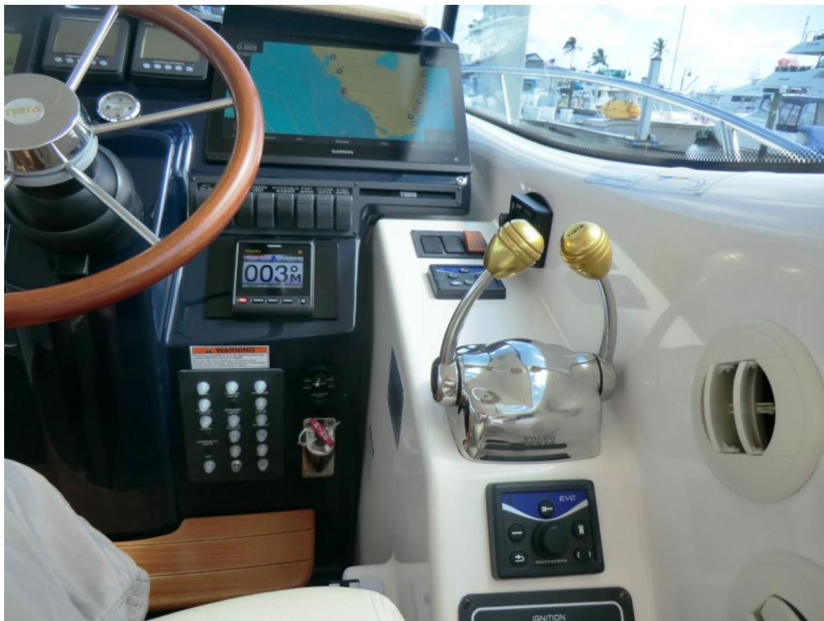
2008 3900 Tiara Sovran Helm