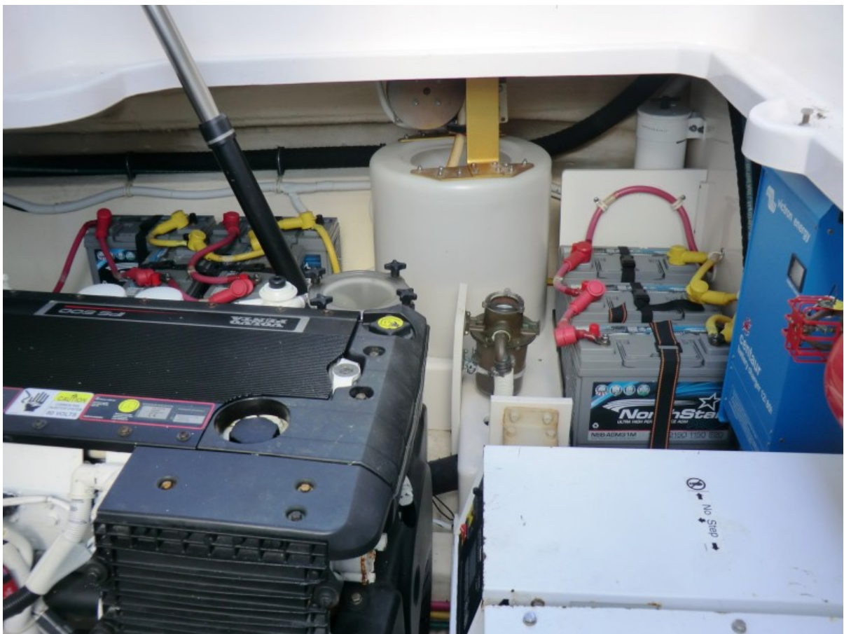
2008 3900 Tiara Sovran Batteries