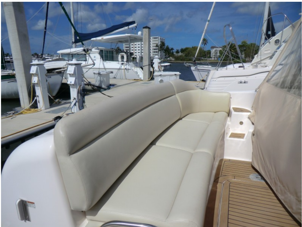
2008 3900 Tiara Sovran Lower Cockpit Forward Facing Seat