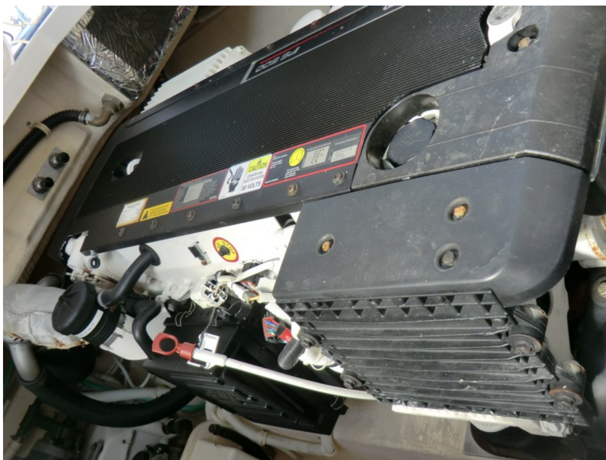
2008 3900 Tiara Sovran Port Engine