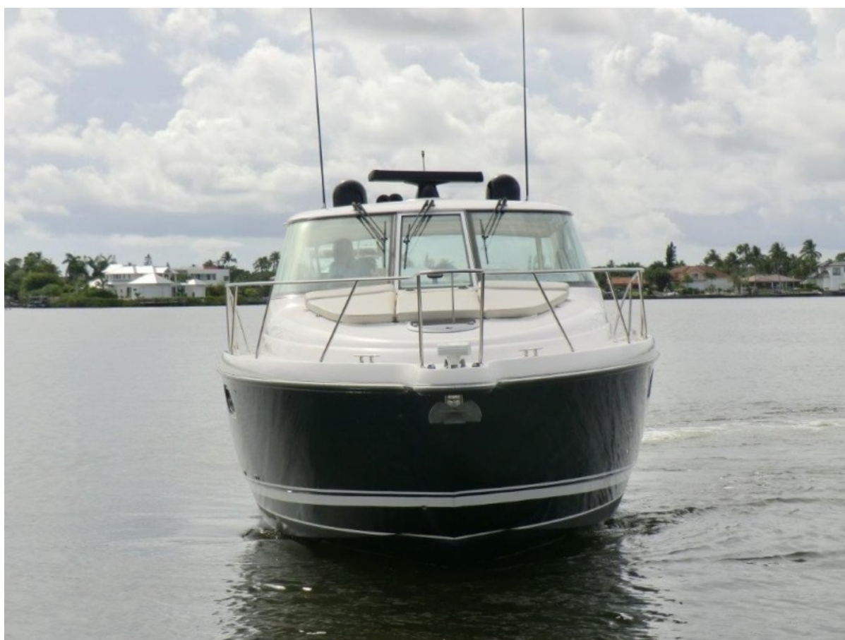
2008 3900 Tiara Sovran Bow