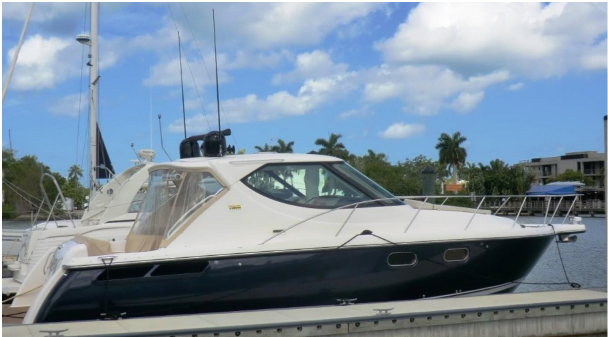
2008 3900 Tiara Sovran