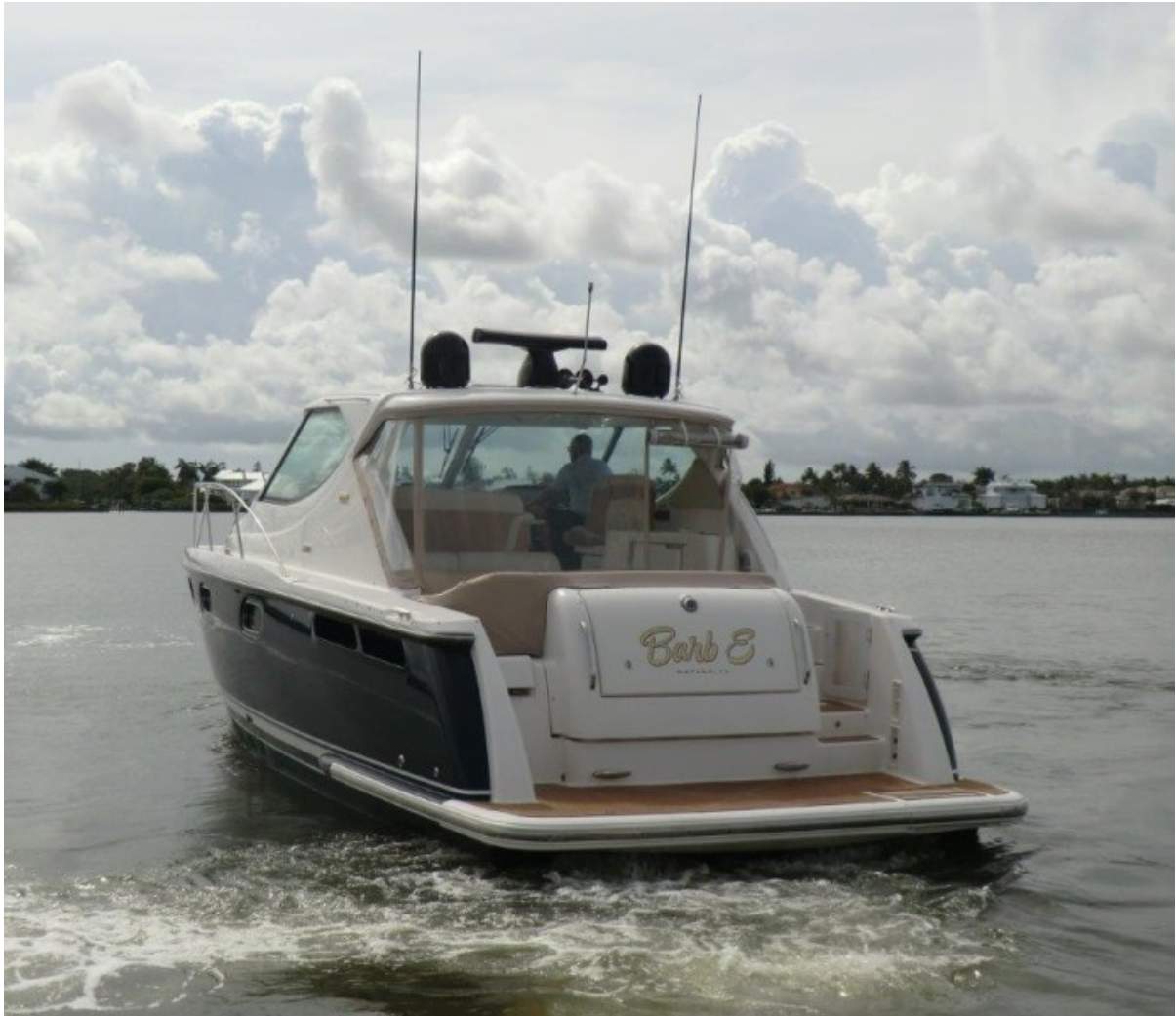
2008 3900 Tiara Sovran Stern