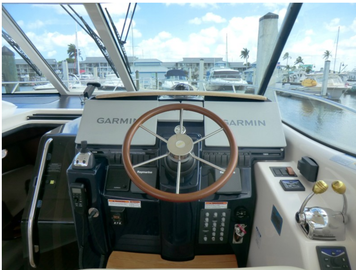
2008 3900 Tiara Sovran Helm