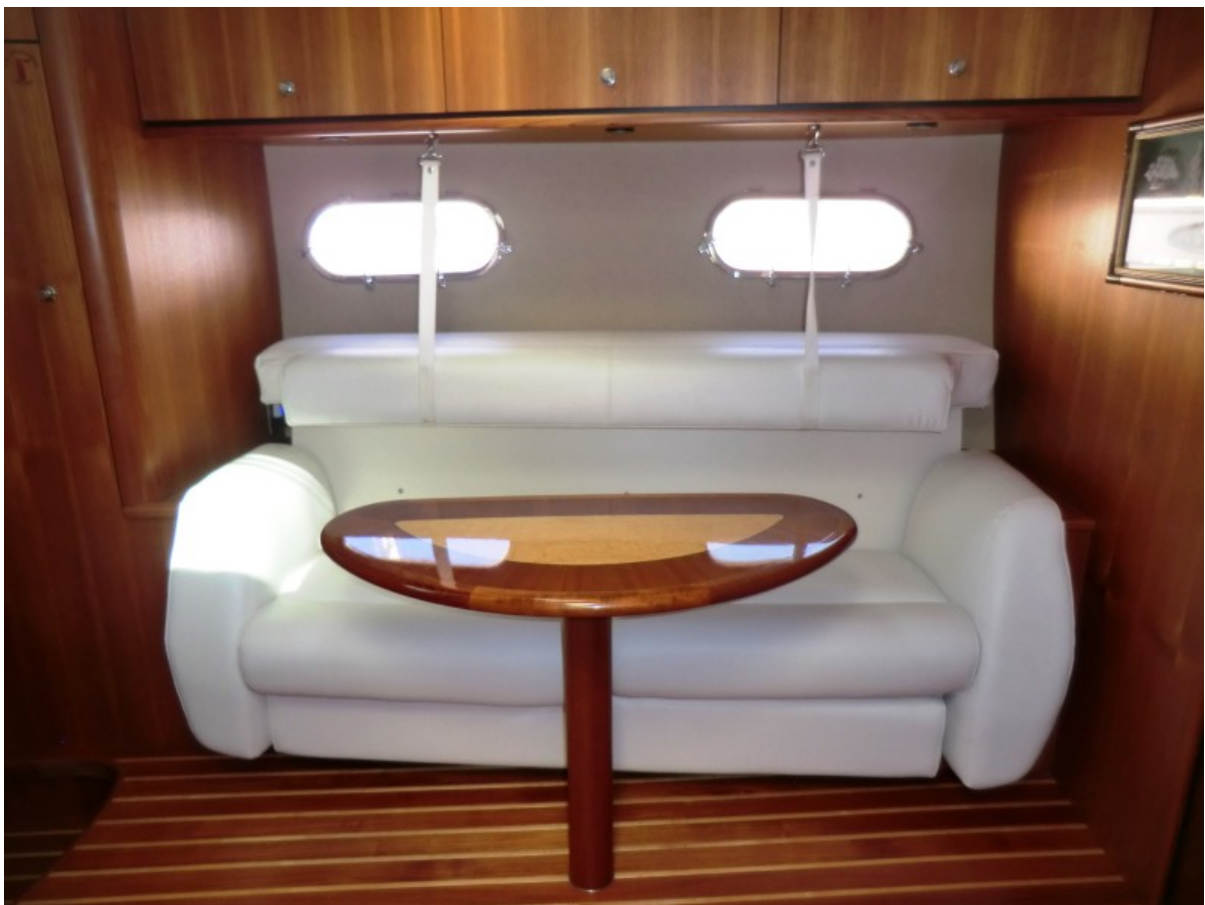
2008 3900 Tiara Sovran Sofa Converts To Over Under Berth