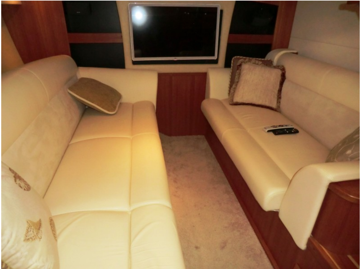
2008 3900 Tiara Sovran Mid Cabin