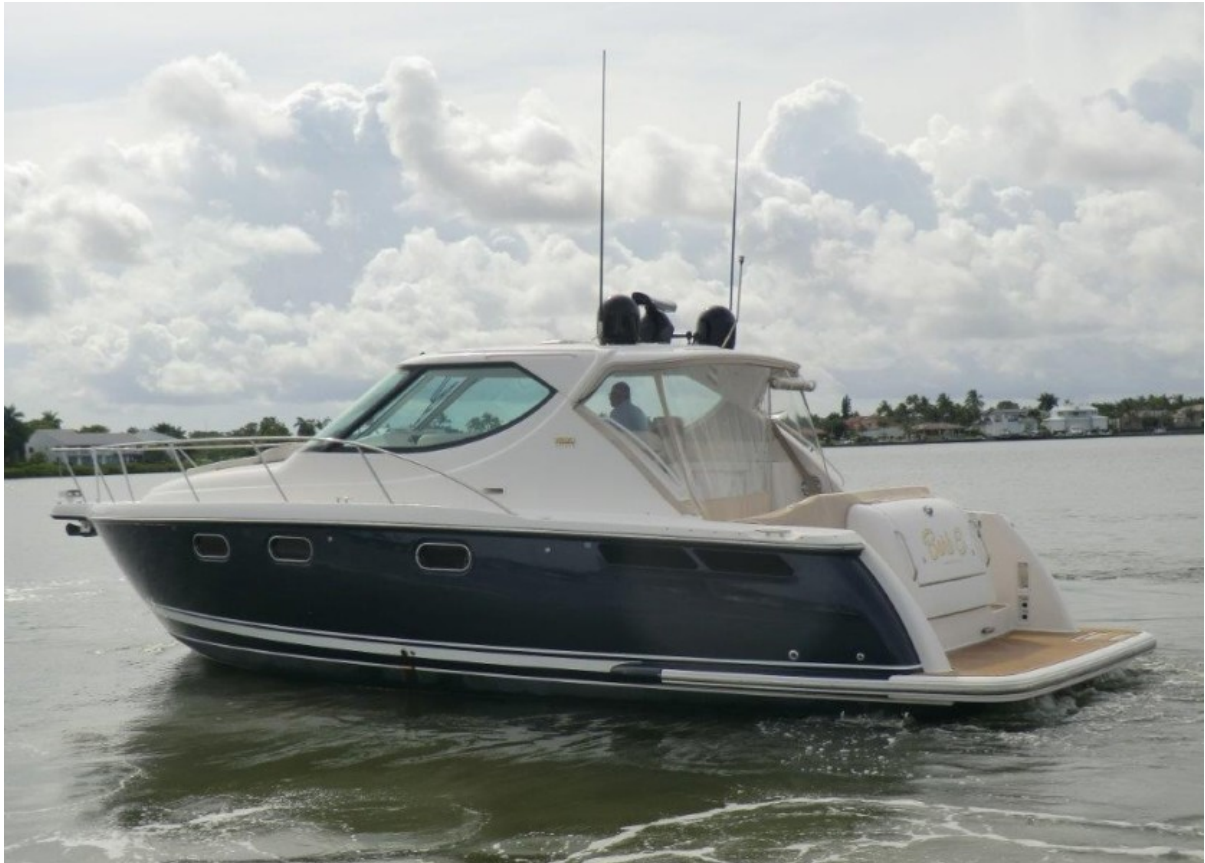
2008 3900 Tiara Sovran