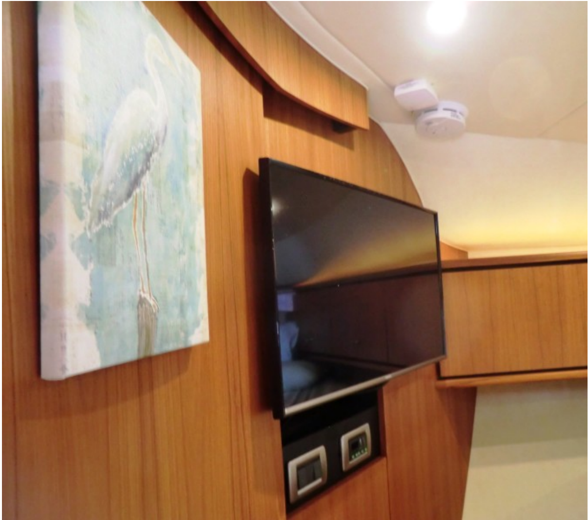
2008 3900 Tiara Sovran Master TV