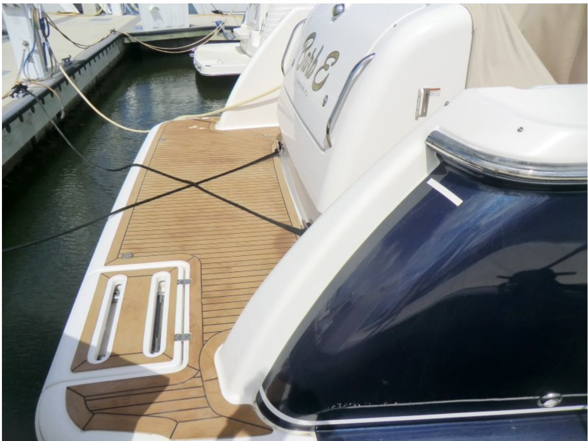
2008 3900 Tiara Sovran Swim Platform