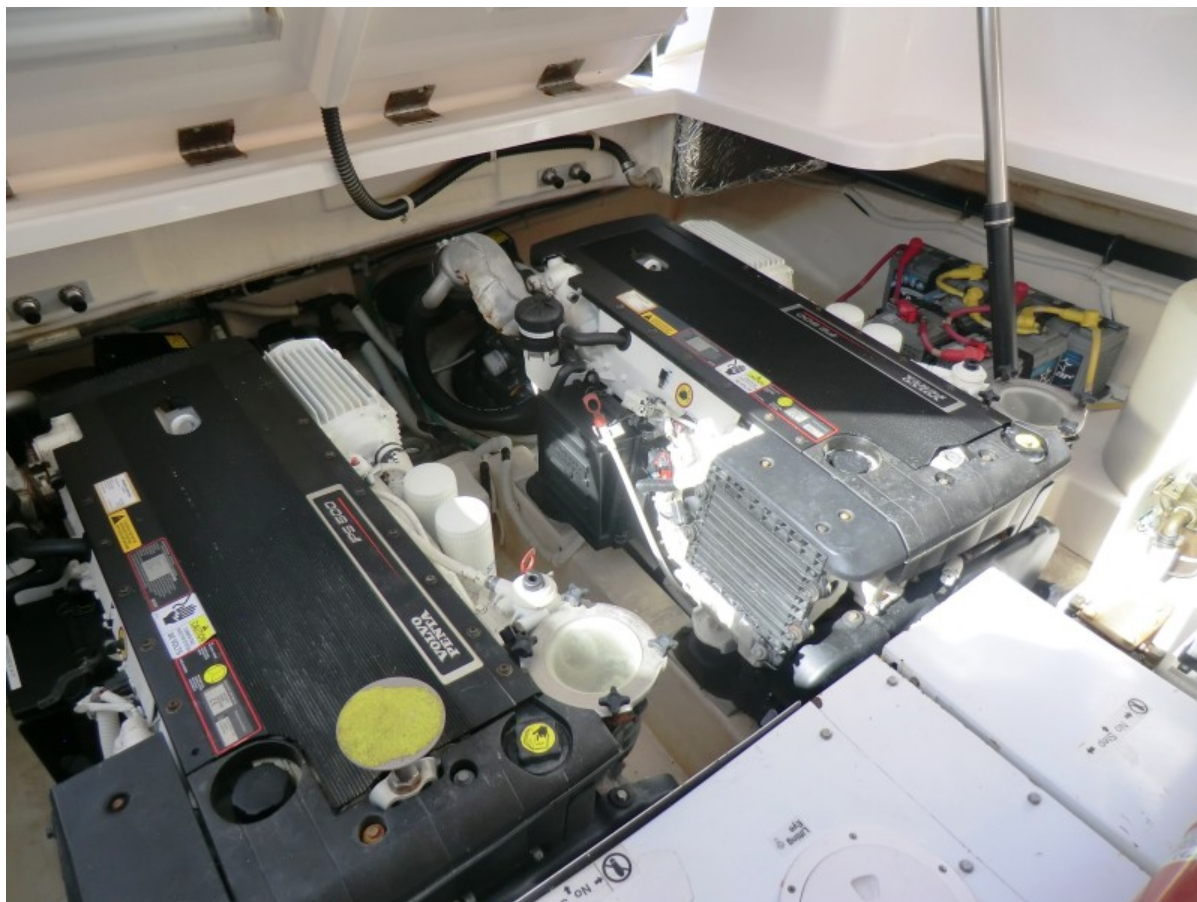
2008 3900 Tiara Sovran Engine Room