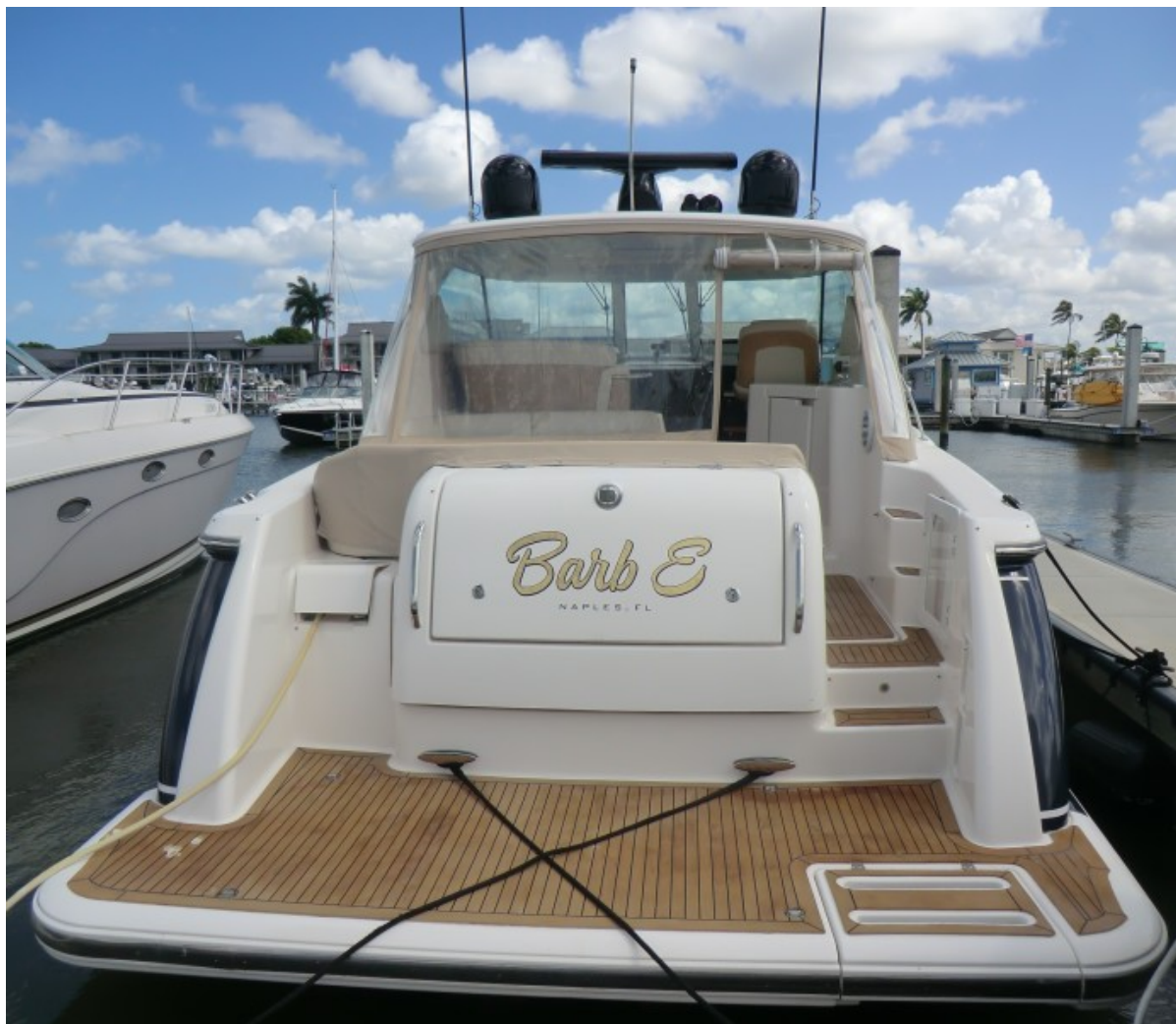
2008 3900 Tiara Sovran Stern