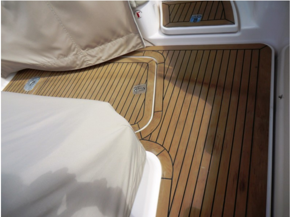
2008 3900 Tiara Sovran Cockpit Teak Decking