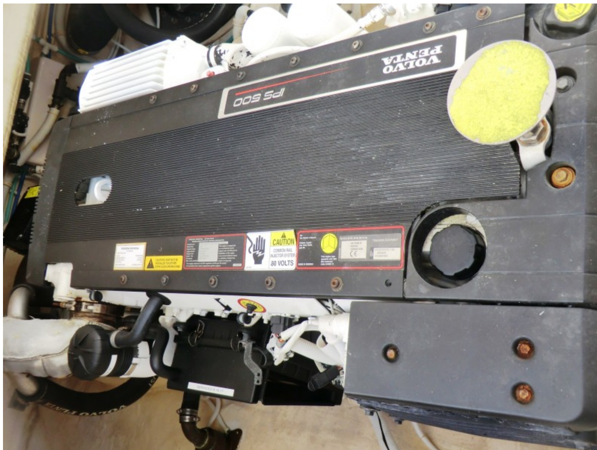
2008 3900 Tiara Sovran STB Engine