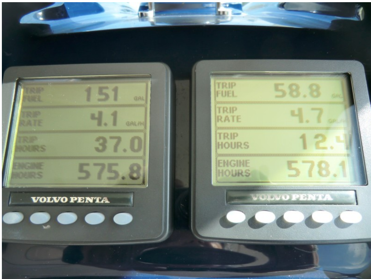
2008 3900 Tiara Sovran Engine Hours