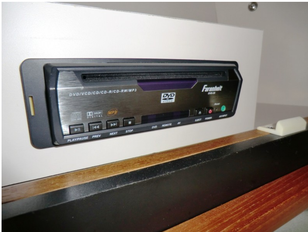
2008 3900 Tiara Sovran Entertainment