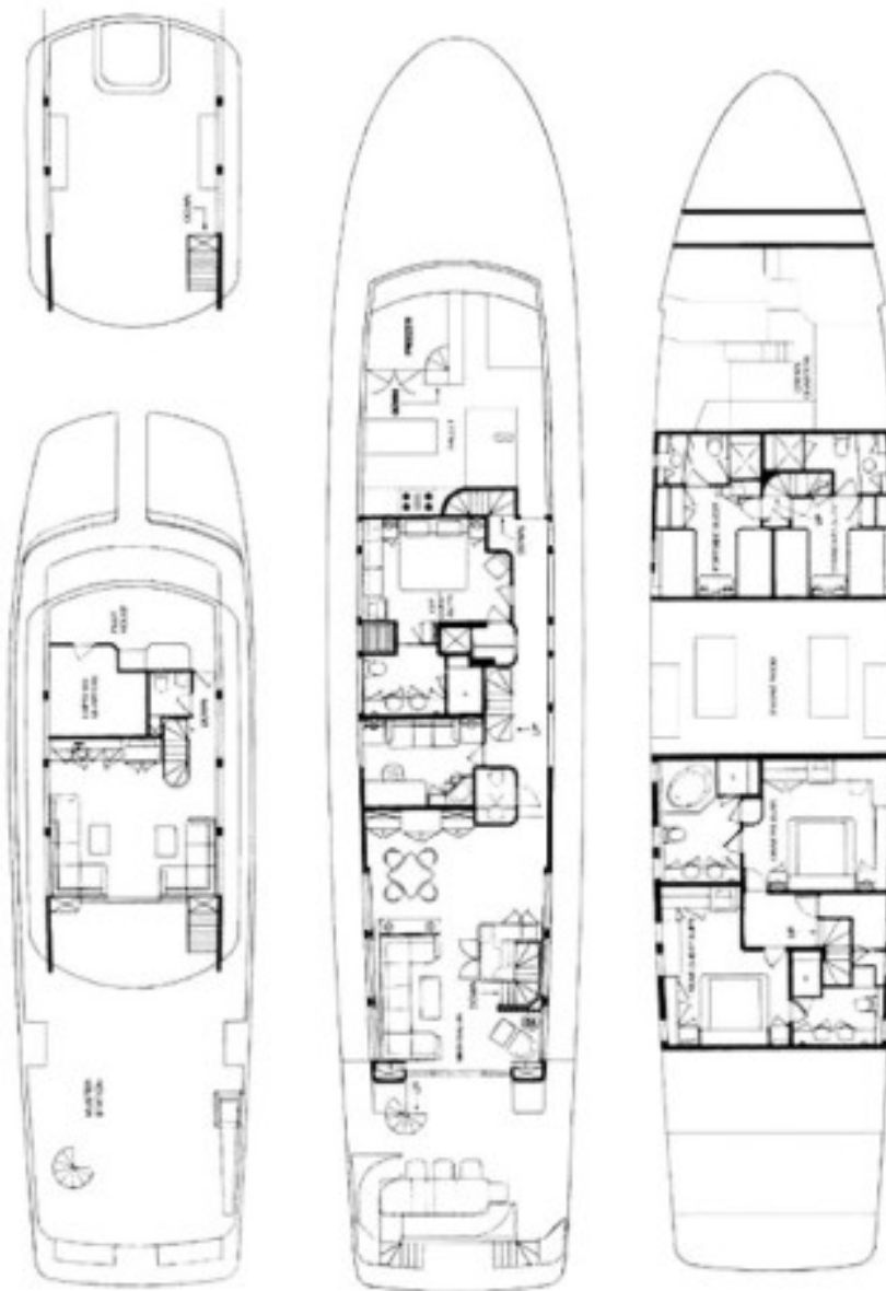
SUNSHINE, 124' (37.80m) Lloyd's Ships Motoryacht, 1986 /2014