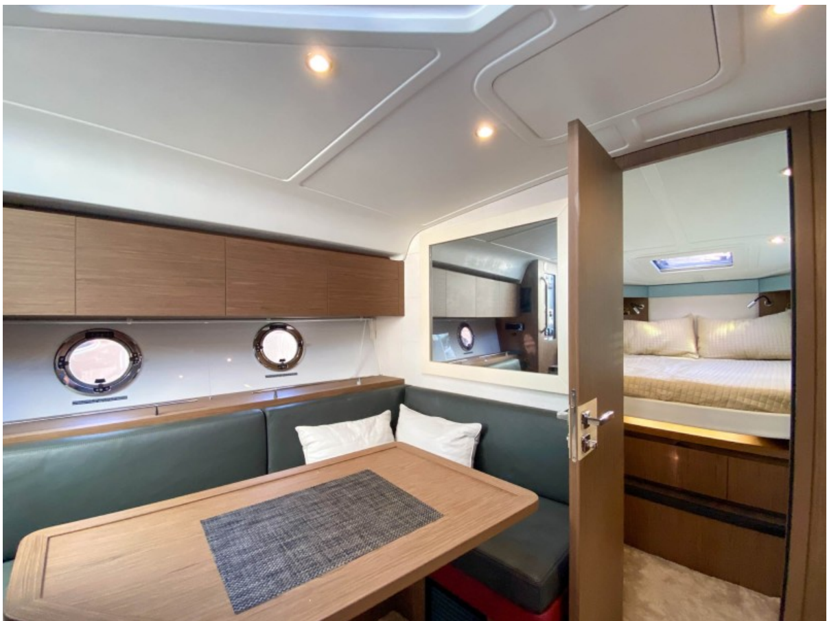
Salon Settee and Table and Entrance to Stateroom