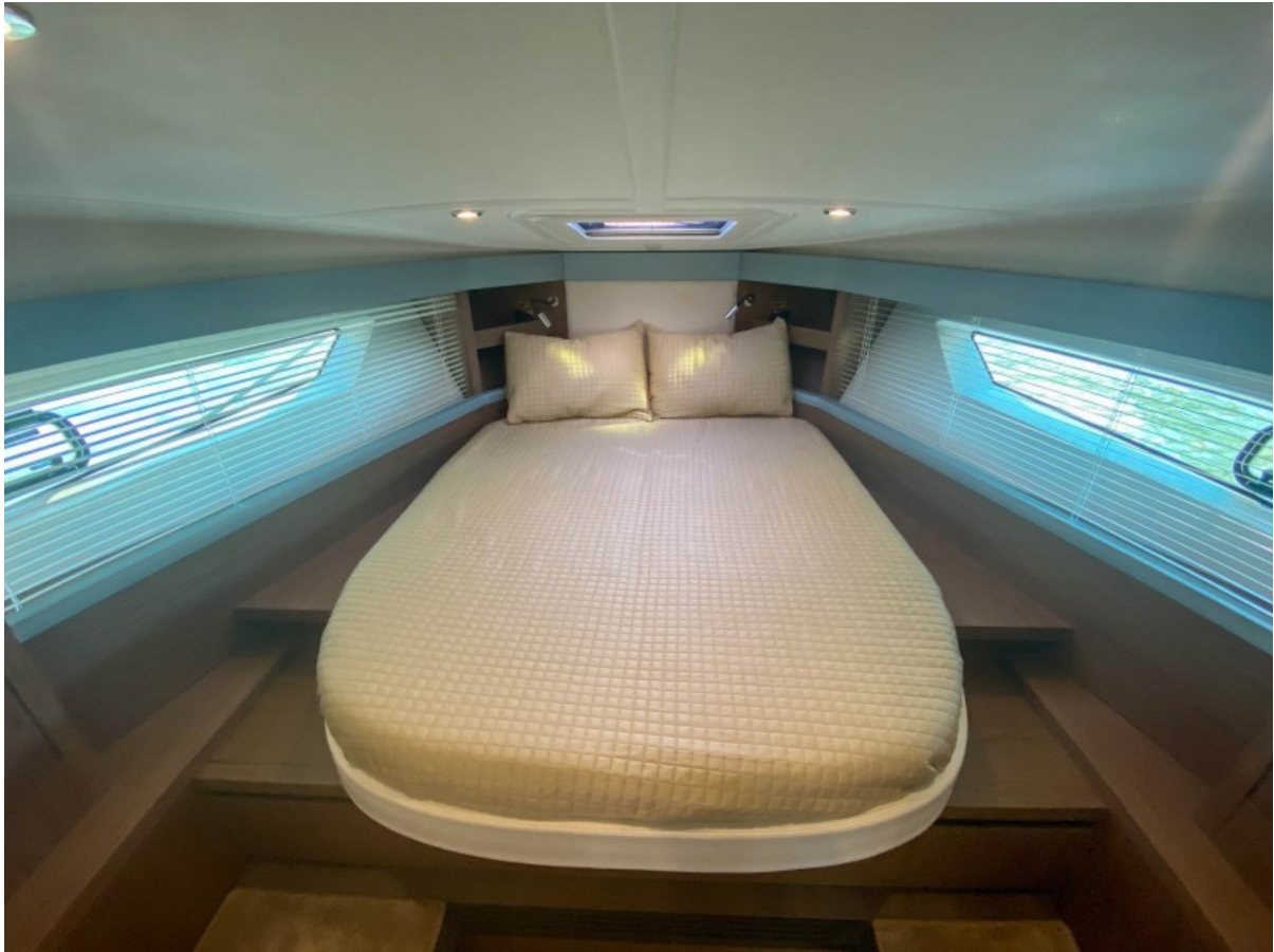
Forward Walkaround Island Berth