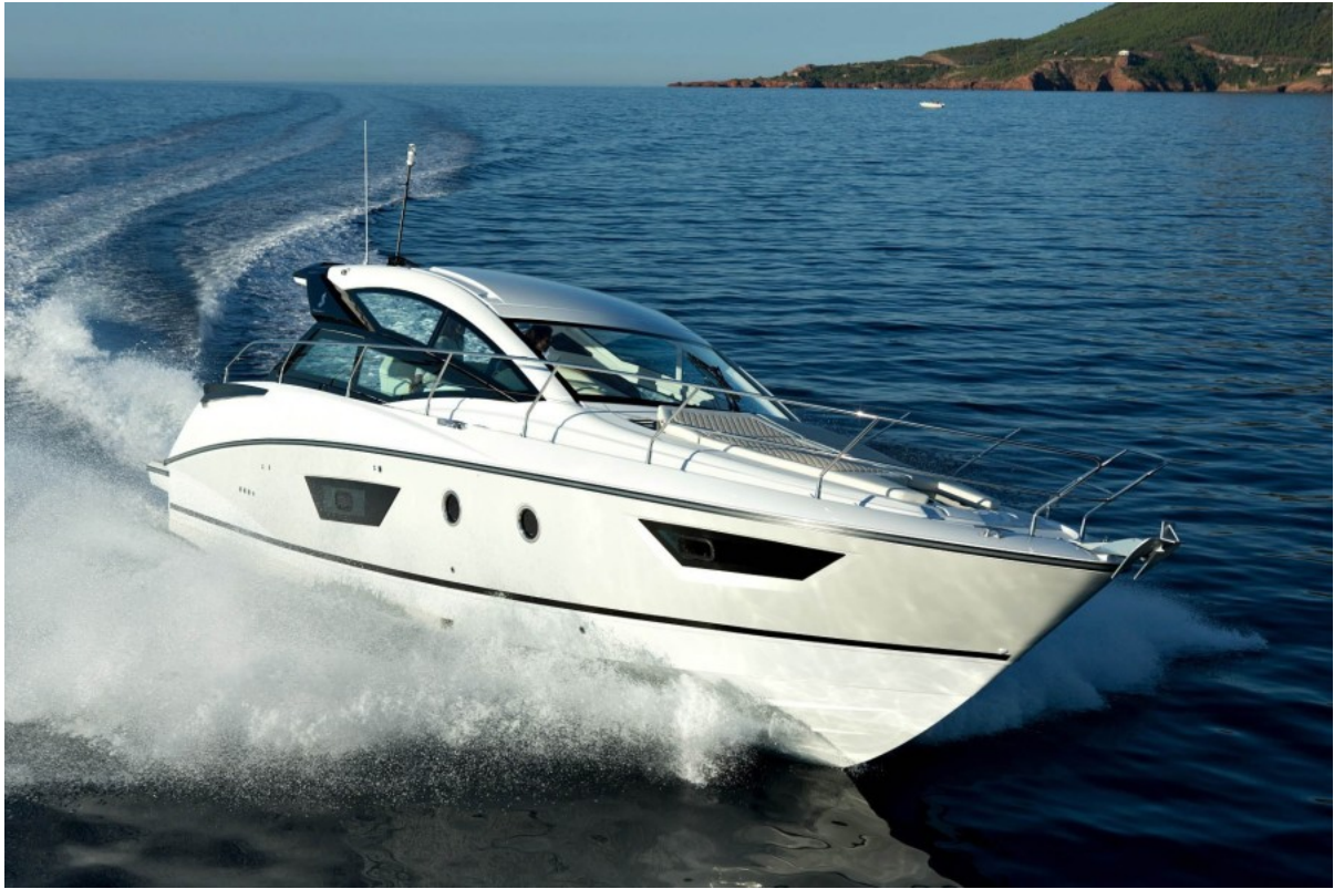
Beneteau Gran Turismo Running