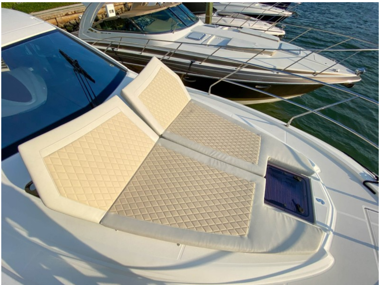
Bow Sunpad with Backrest