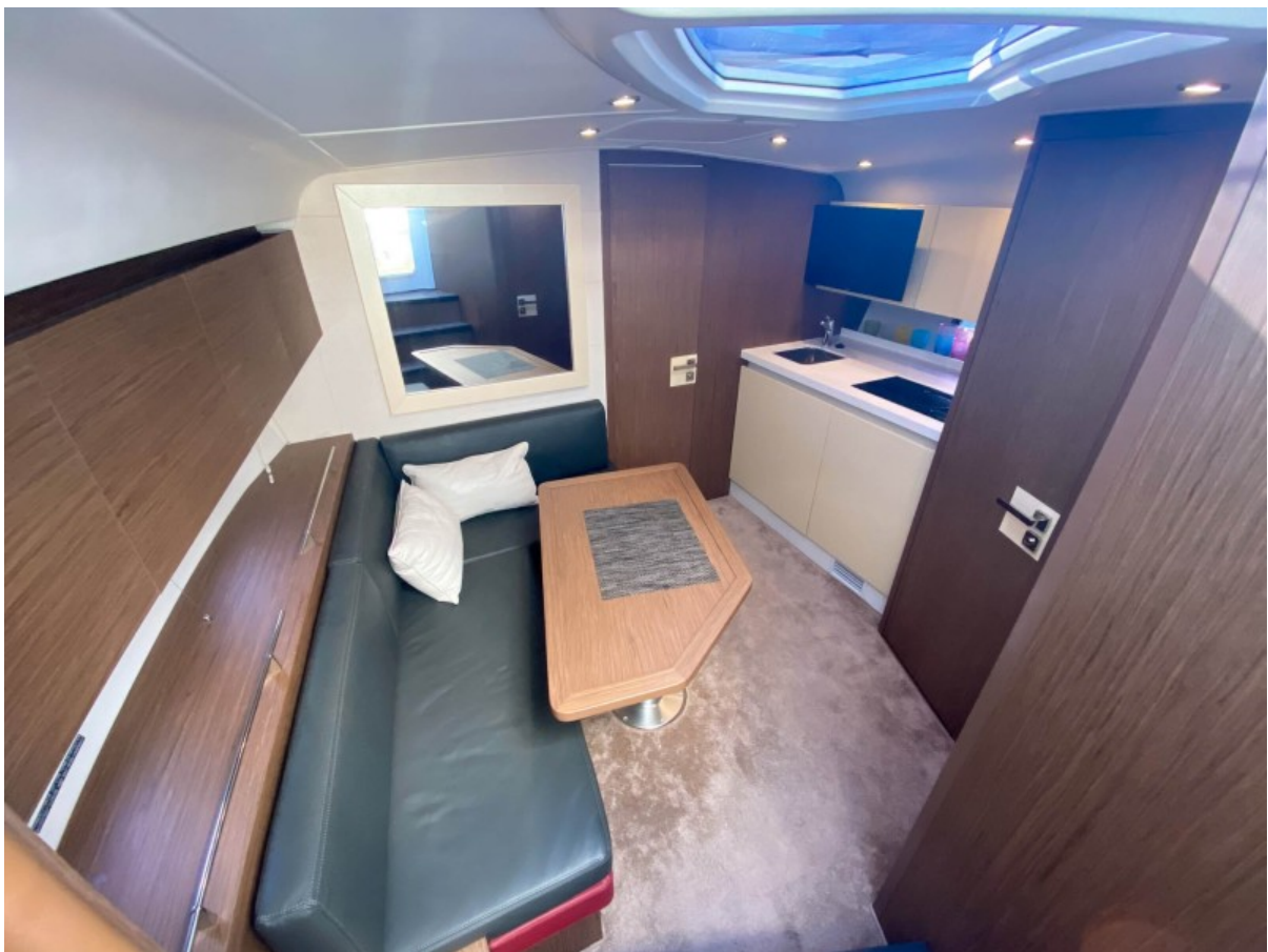
Main Salon and Galley