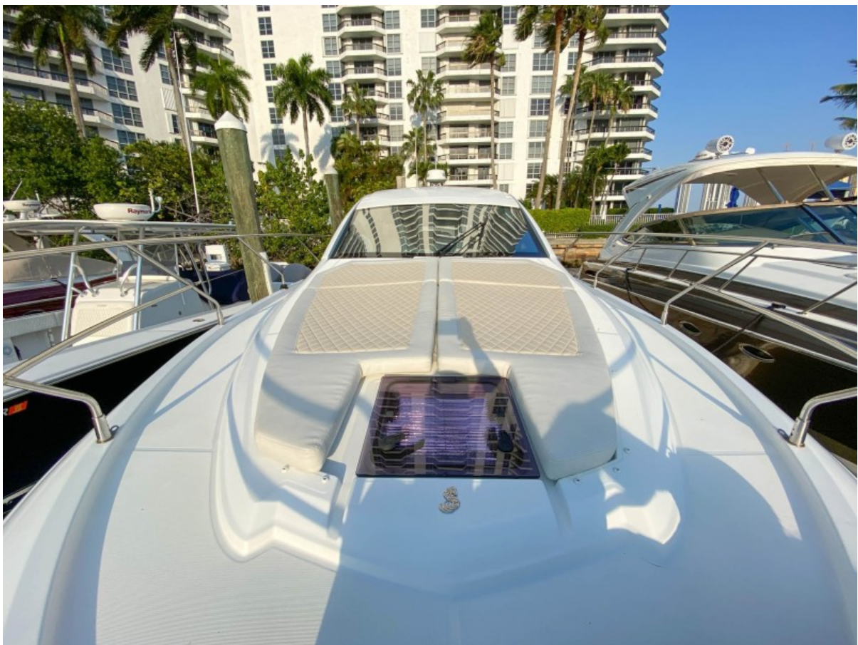
Foredeck Looking Aft