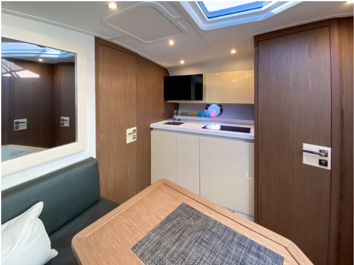
Salon Looking to Galley