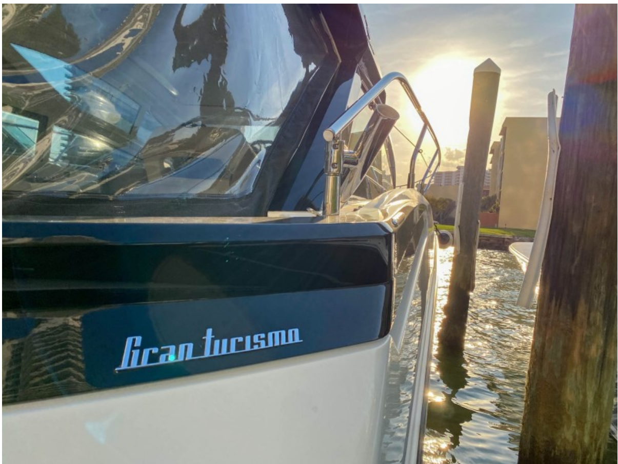
Gran Turismo Logo