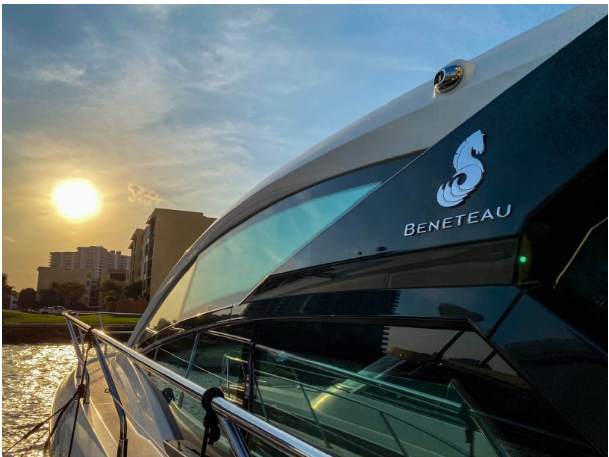
Port Side Deck