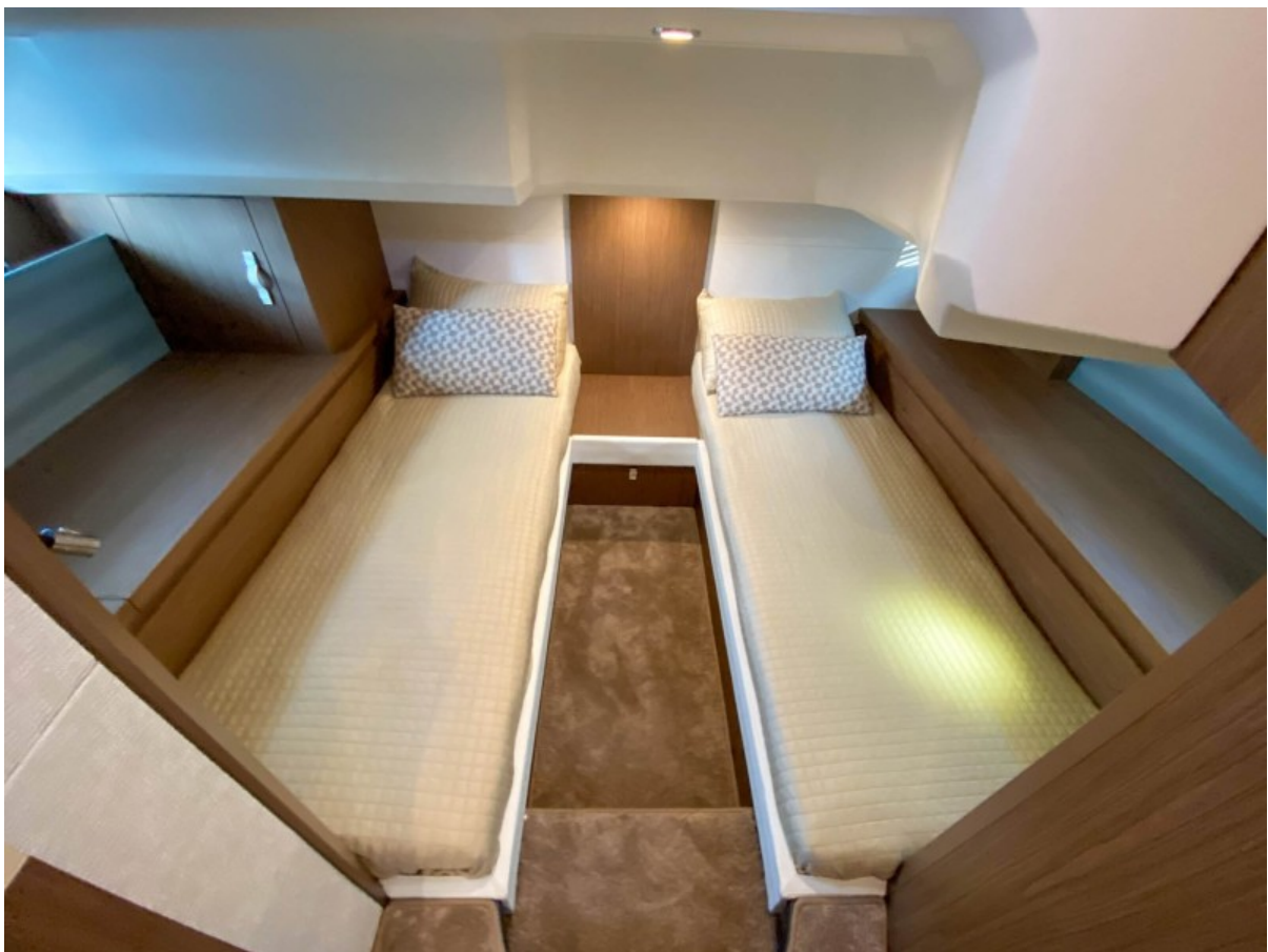
Aft Cabin Twin Berths