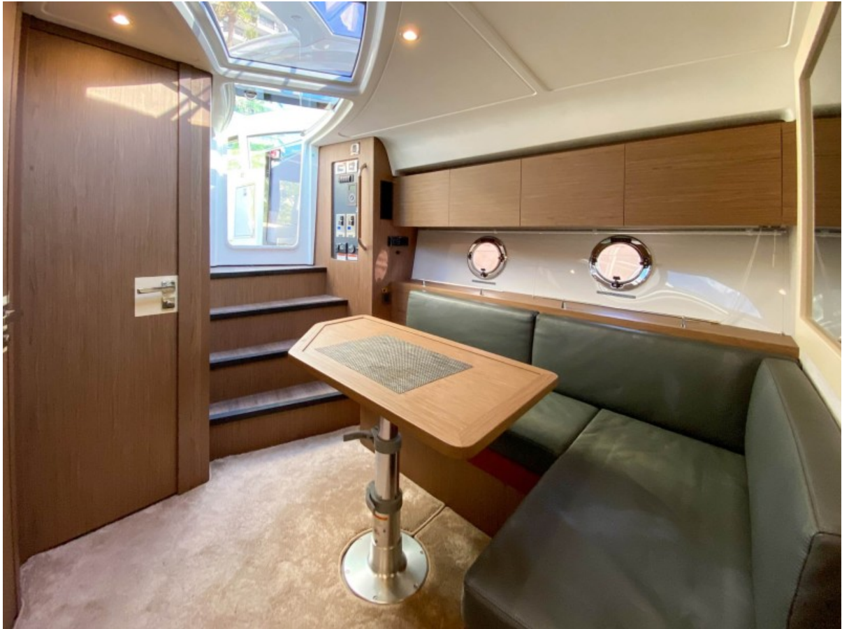
Cabin Entry and Salon to Port