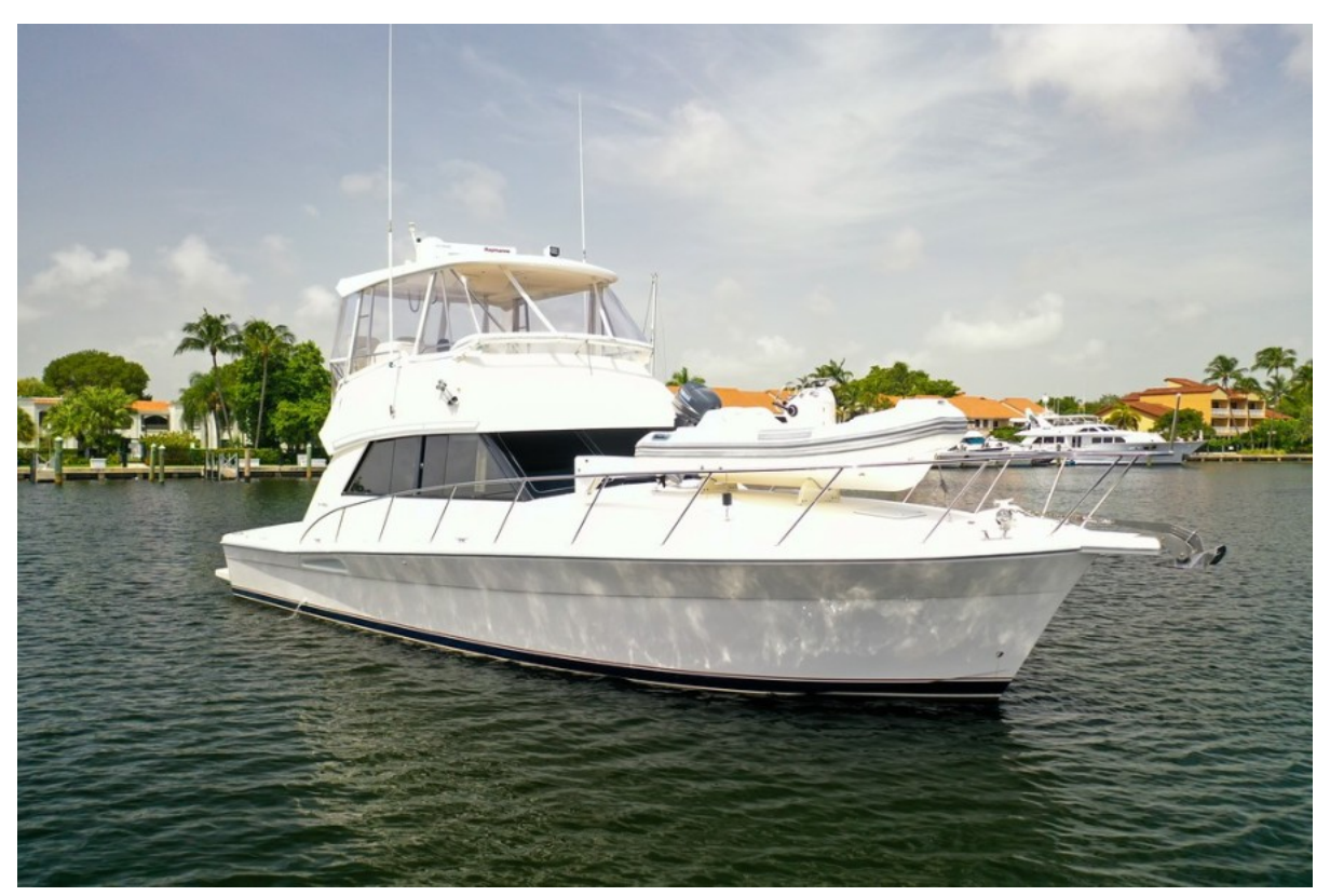
2001 Riviera 43 CNV - Starboard