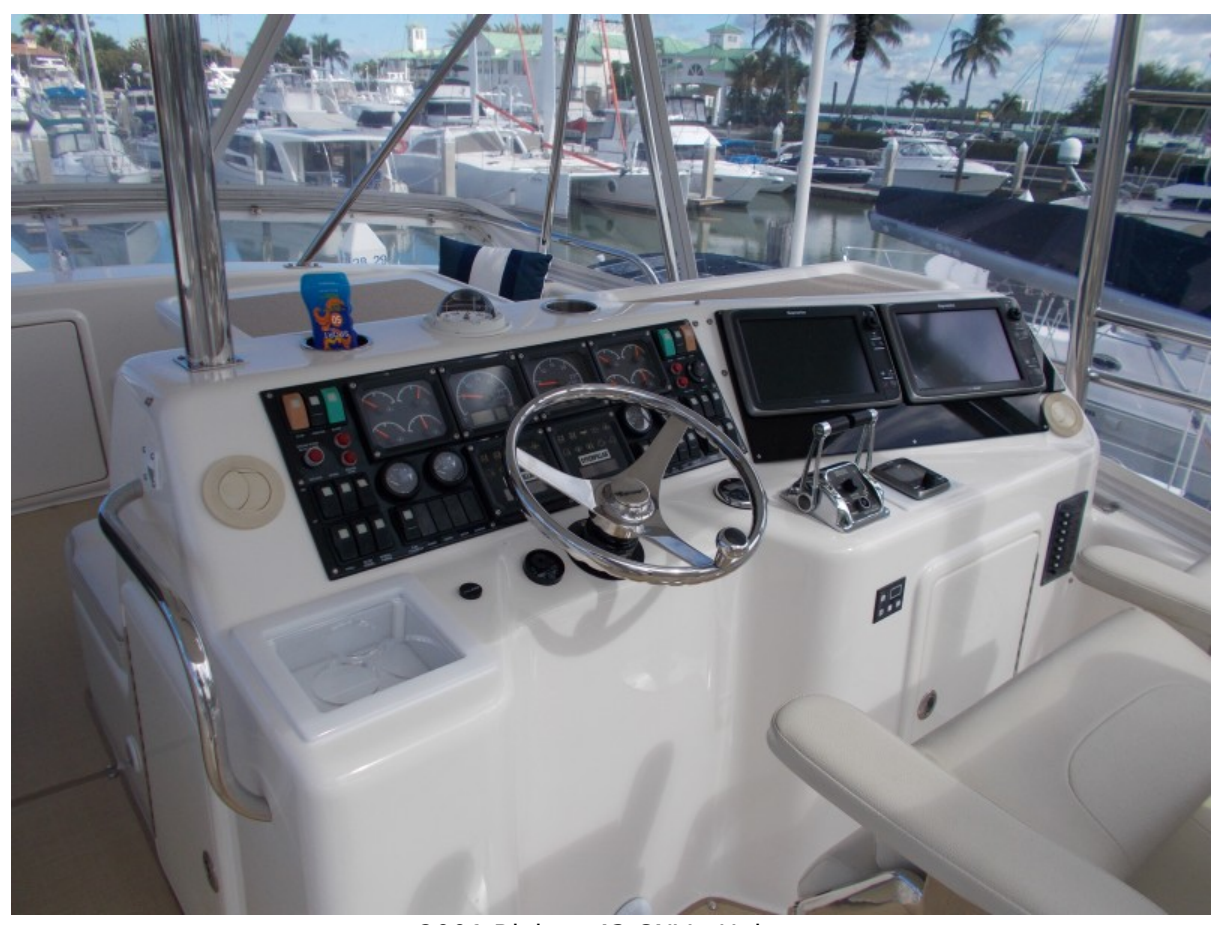
2001 Riviera 43 CNV - Helm