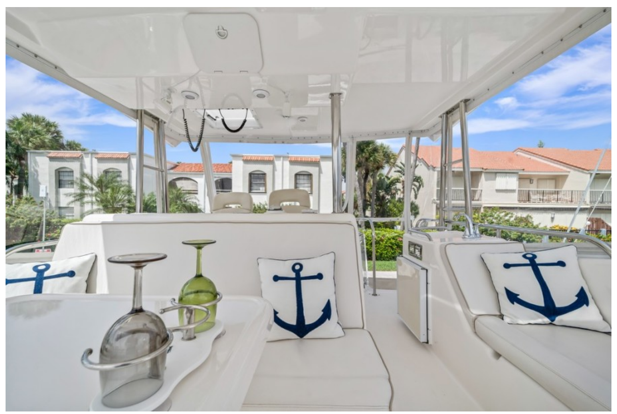
2001 Riviera 43 CNV - Flybridge Seating