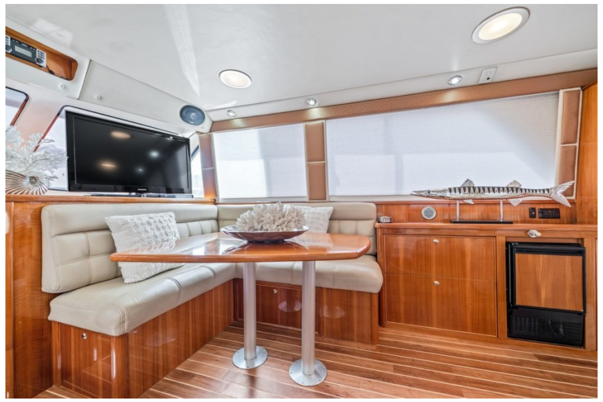
2001 Riviera 43 CNV - Dining Table