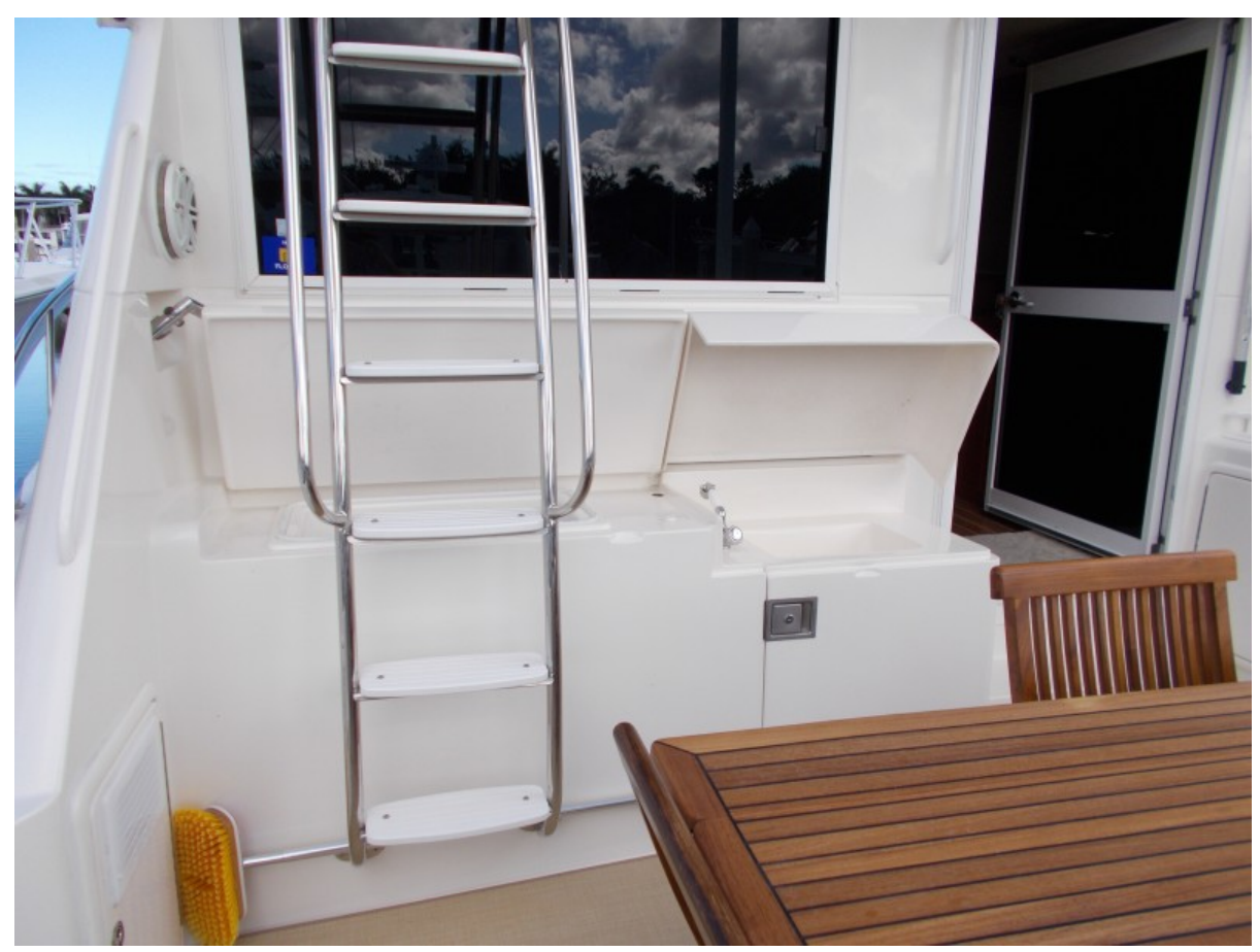
2001 Riviera 43 CNV - Flybridge Ladder