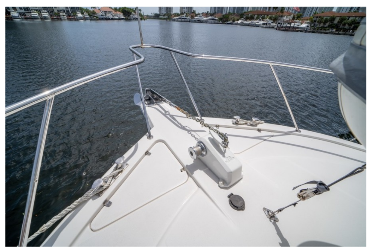
2001 Riviera 43 CNV - Bow