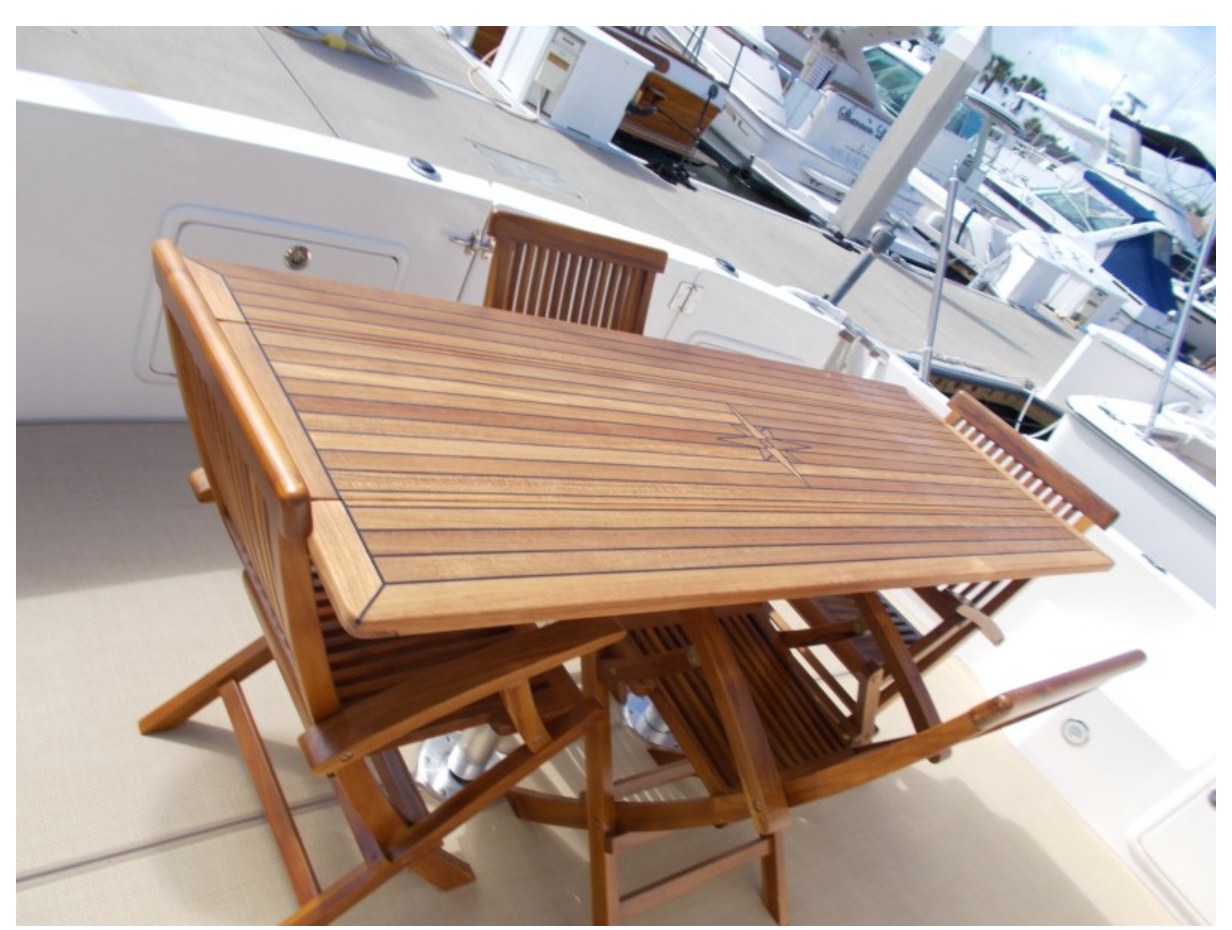
2001 Riviera 43 CNV - Cockpit Table