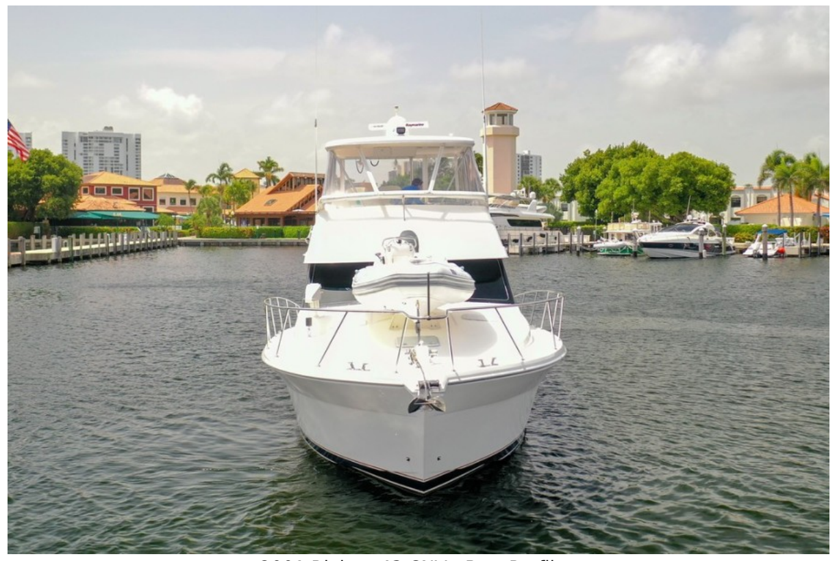
2001 Riviera 43 CNV - Bow Profile