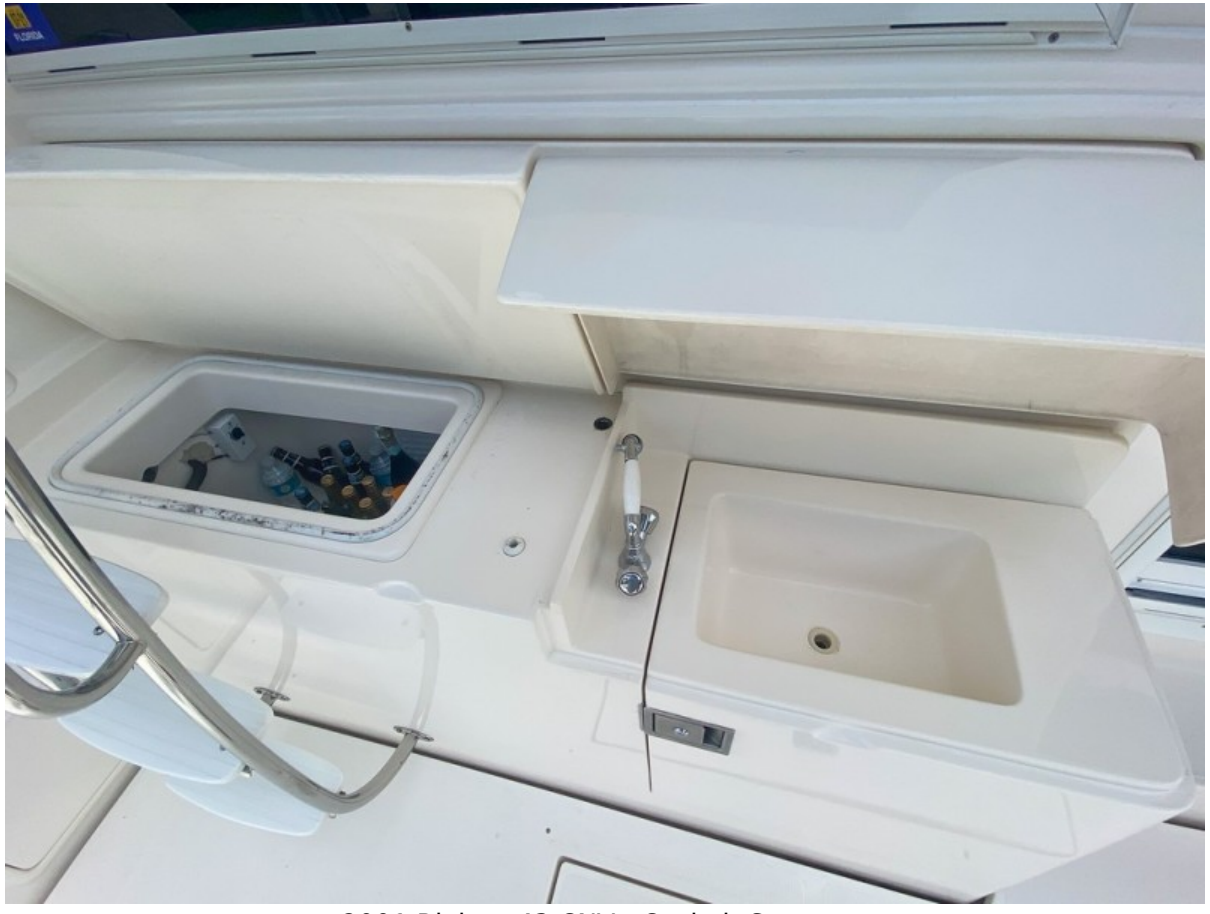
2001 Riviera 43 CNV - Cockpit Storage