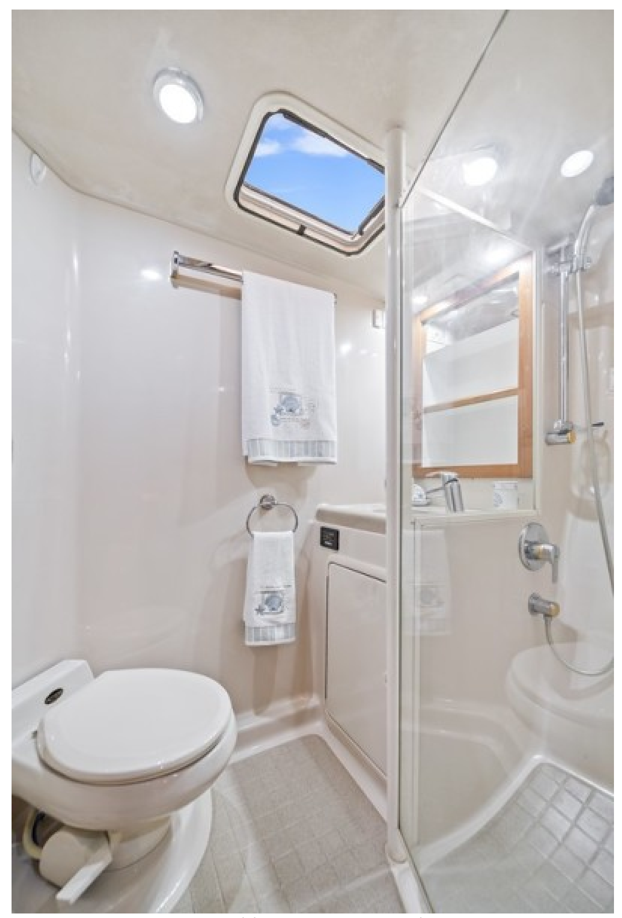
2001 Riviera 43 CNV - Guest Head