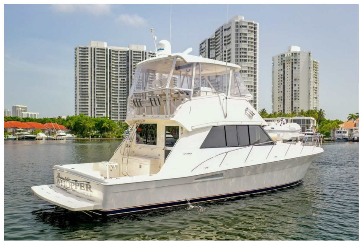
2001 Riviera 43 CNV - Starboard Profile