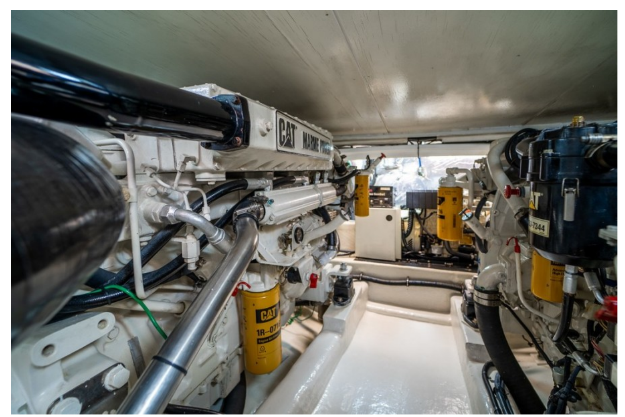
2001 Riviera 43 CNV - Engine Compartment