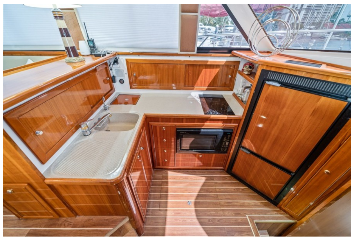
2001 Riviera 43 CNV - Galley