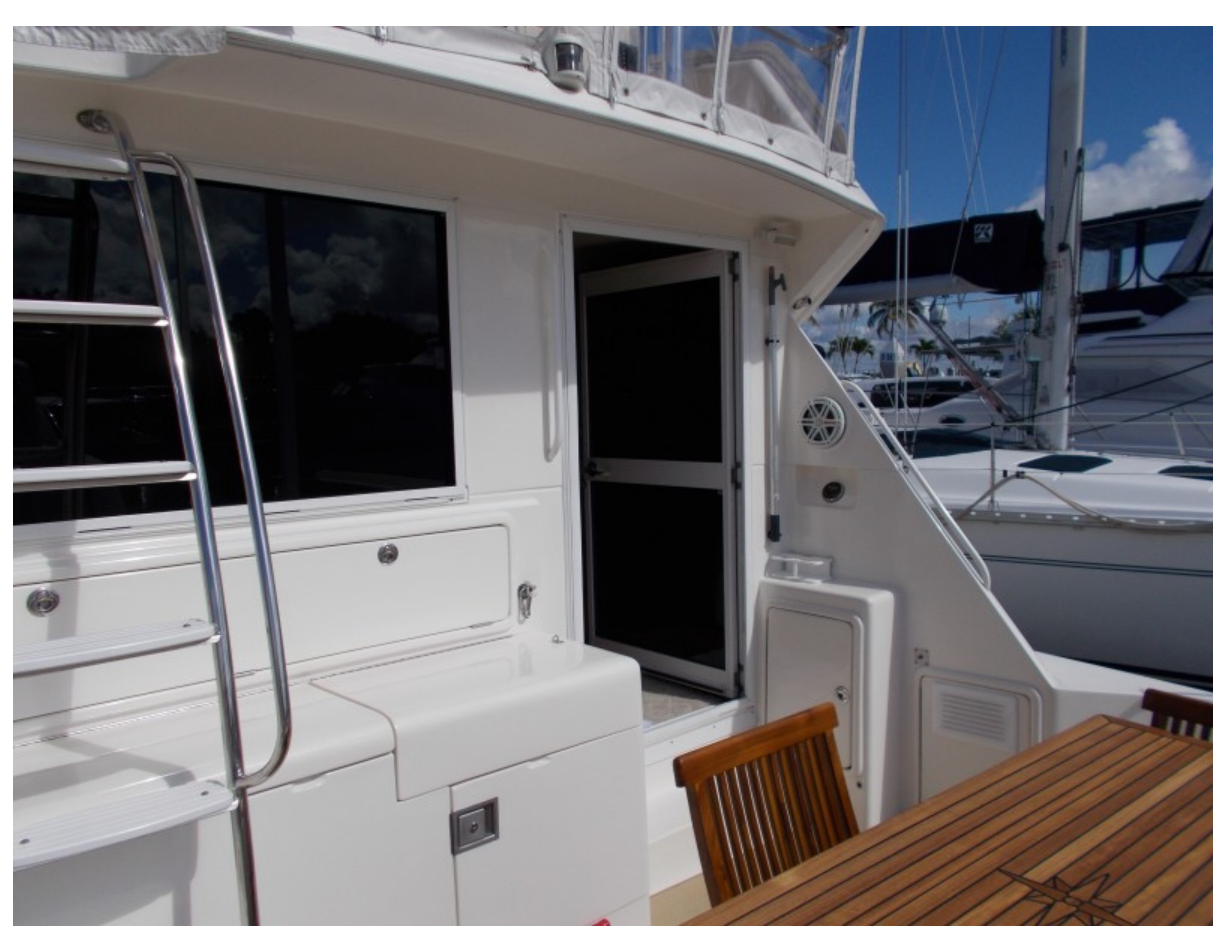
2001 Riviera 43 CNV - Cockpit