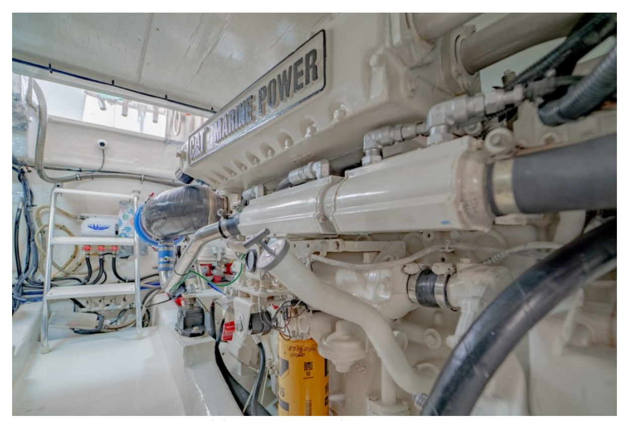
2001 Riviera 43 CNV - Engine Compartment