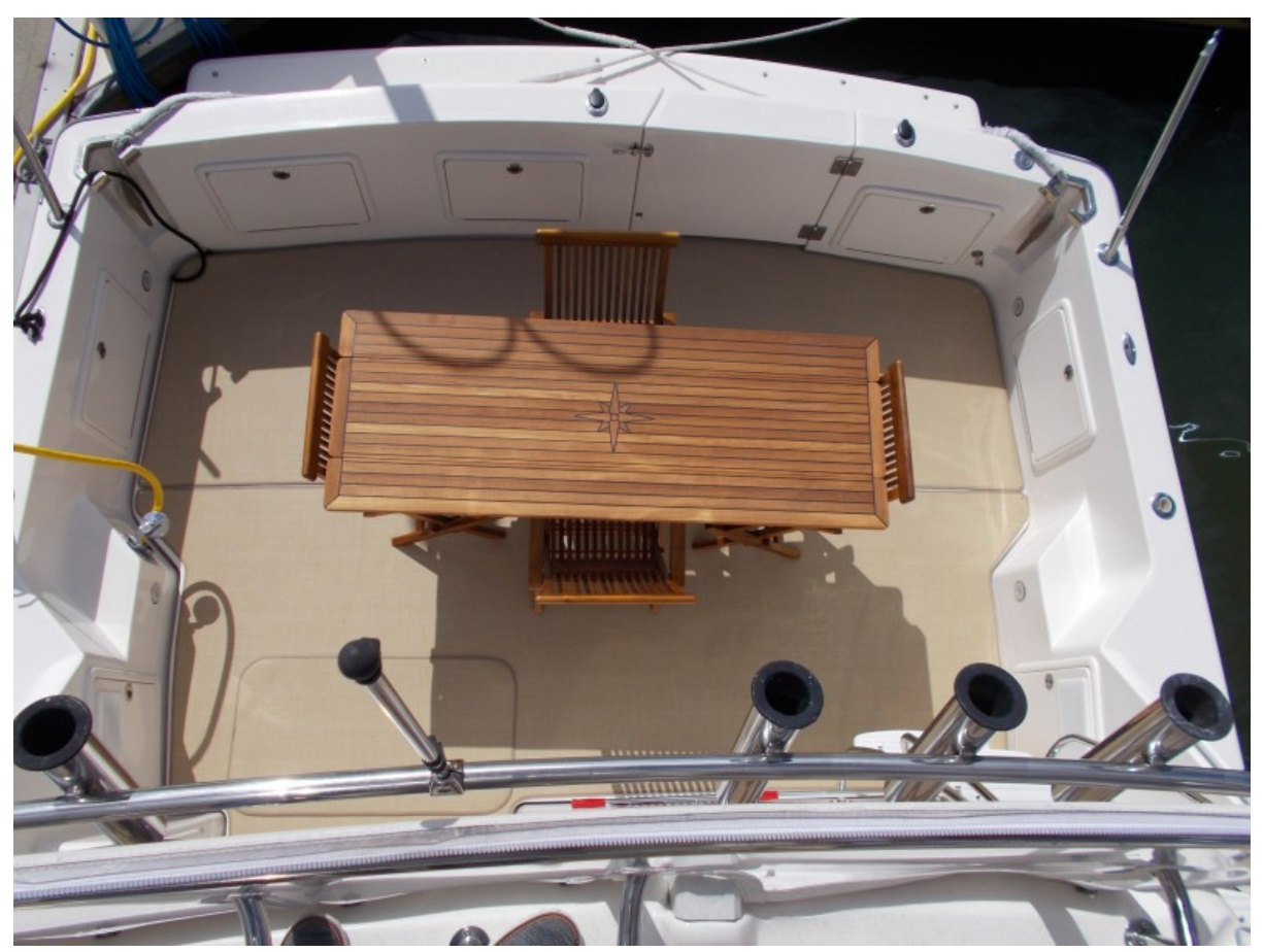
2001 Riviera 43 CNV - Cockpit overview from Flybridge