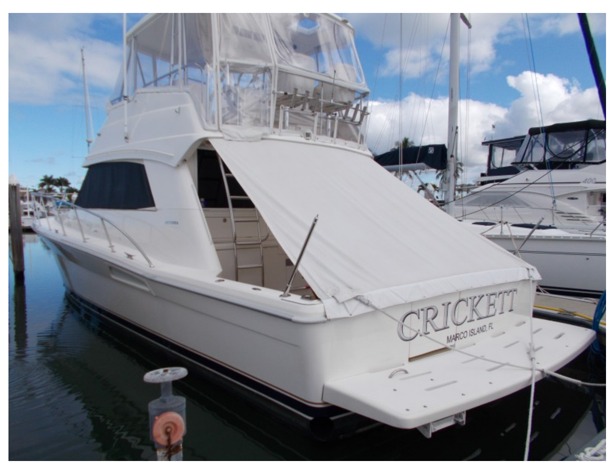
2001 Riviera 43 CNV - Canvas