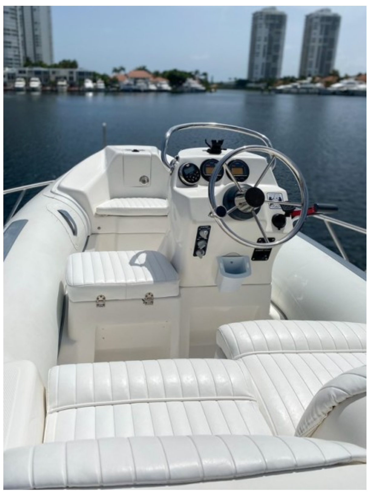
2001 Riviera 43 CNV - Tender