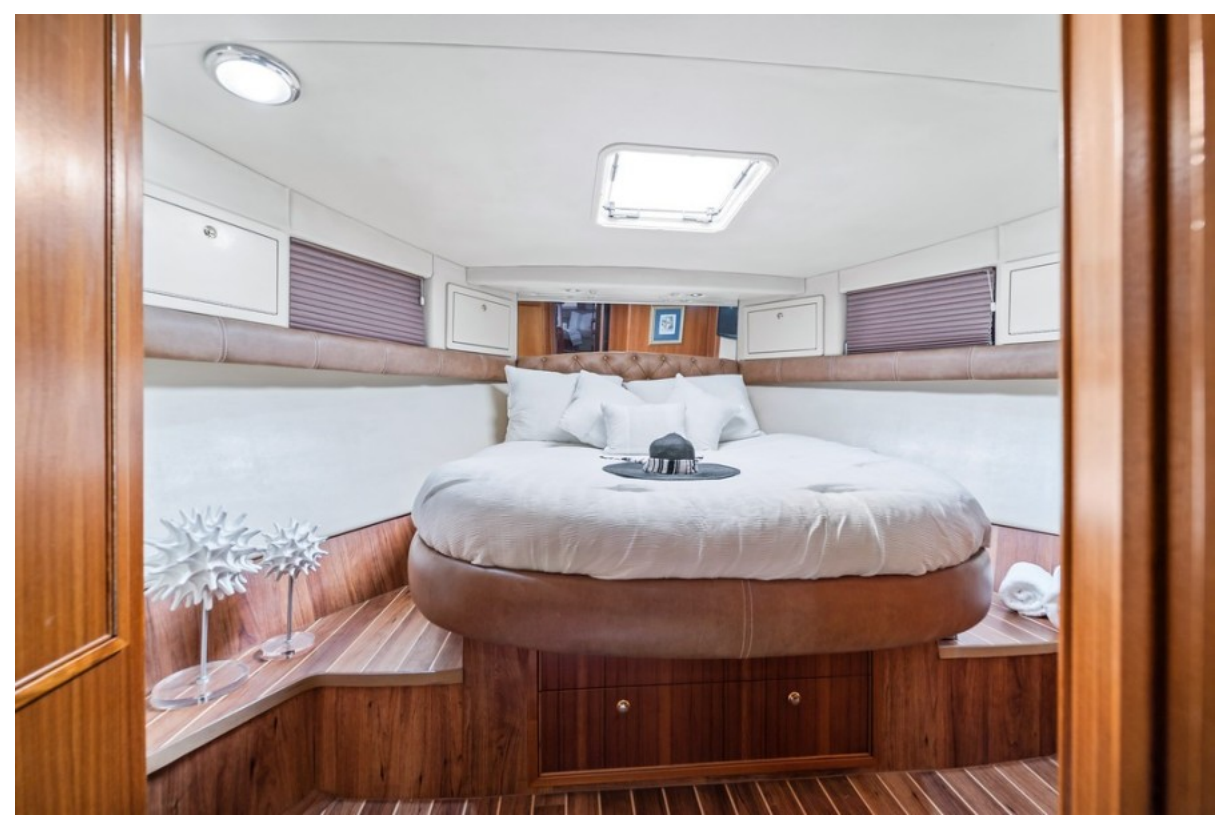
2001 Riviera 43 CNV - Master Stateroom