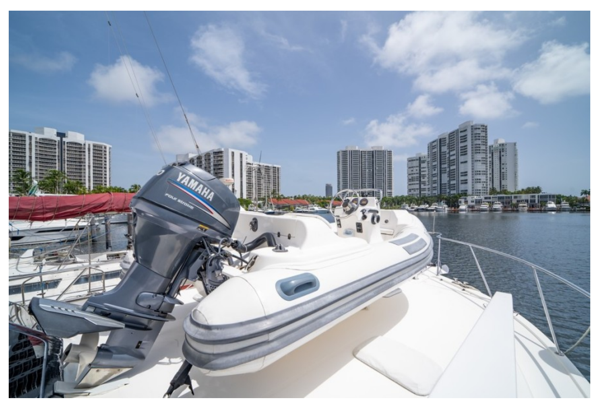
2001 Riviera 43 CNV - Tender