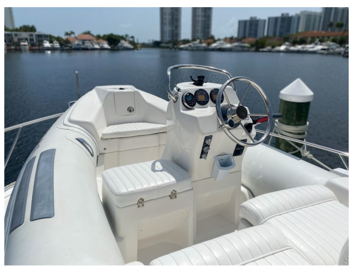
2001 Riviera 43 CNV - Tender