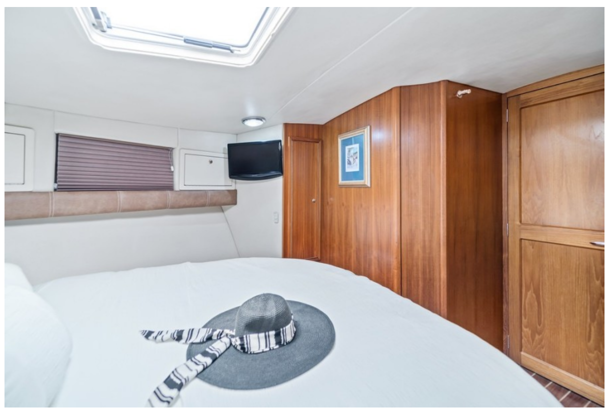
2001 Riviera 43 CNV - Master Stateroom