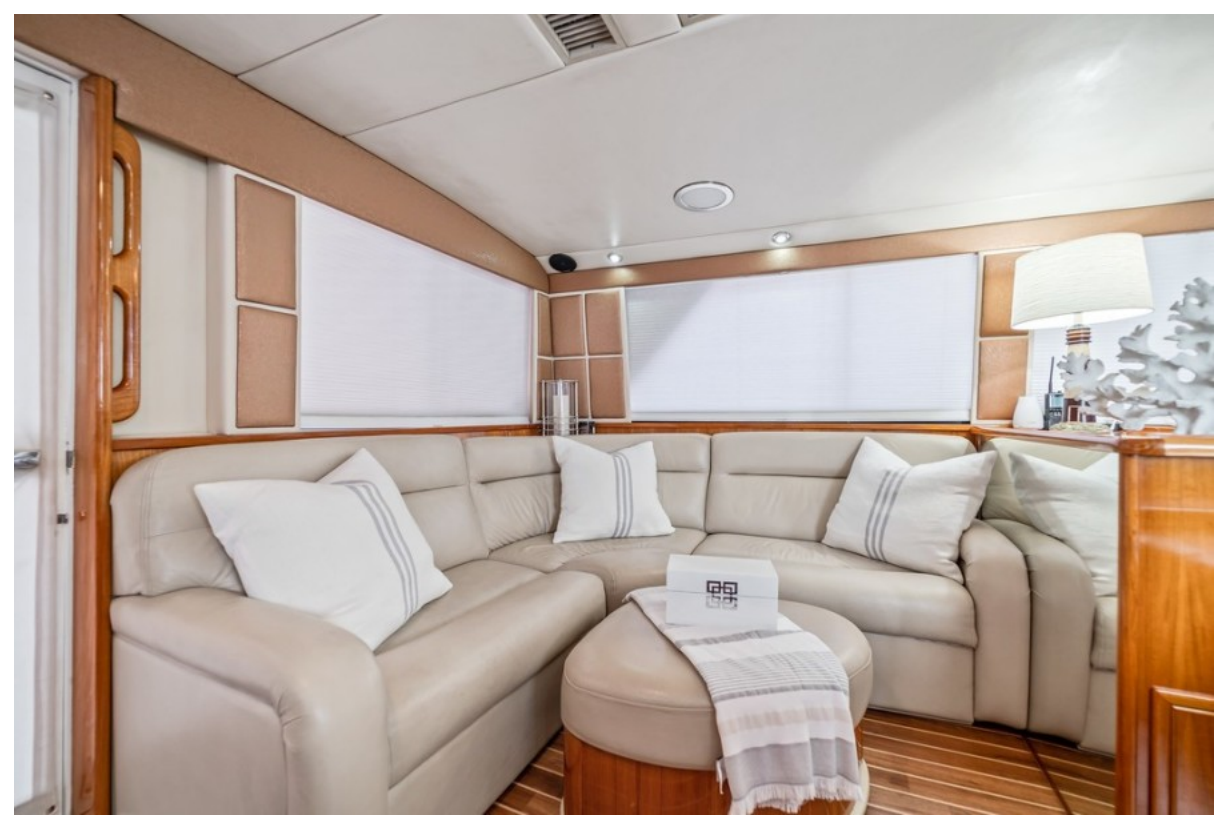
2001 Riviera 43 CNV - Salon Seating