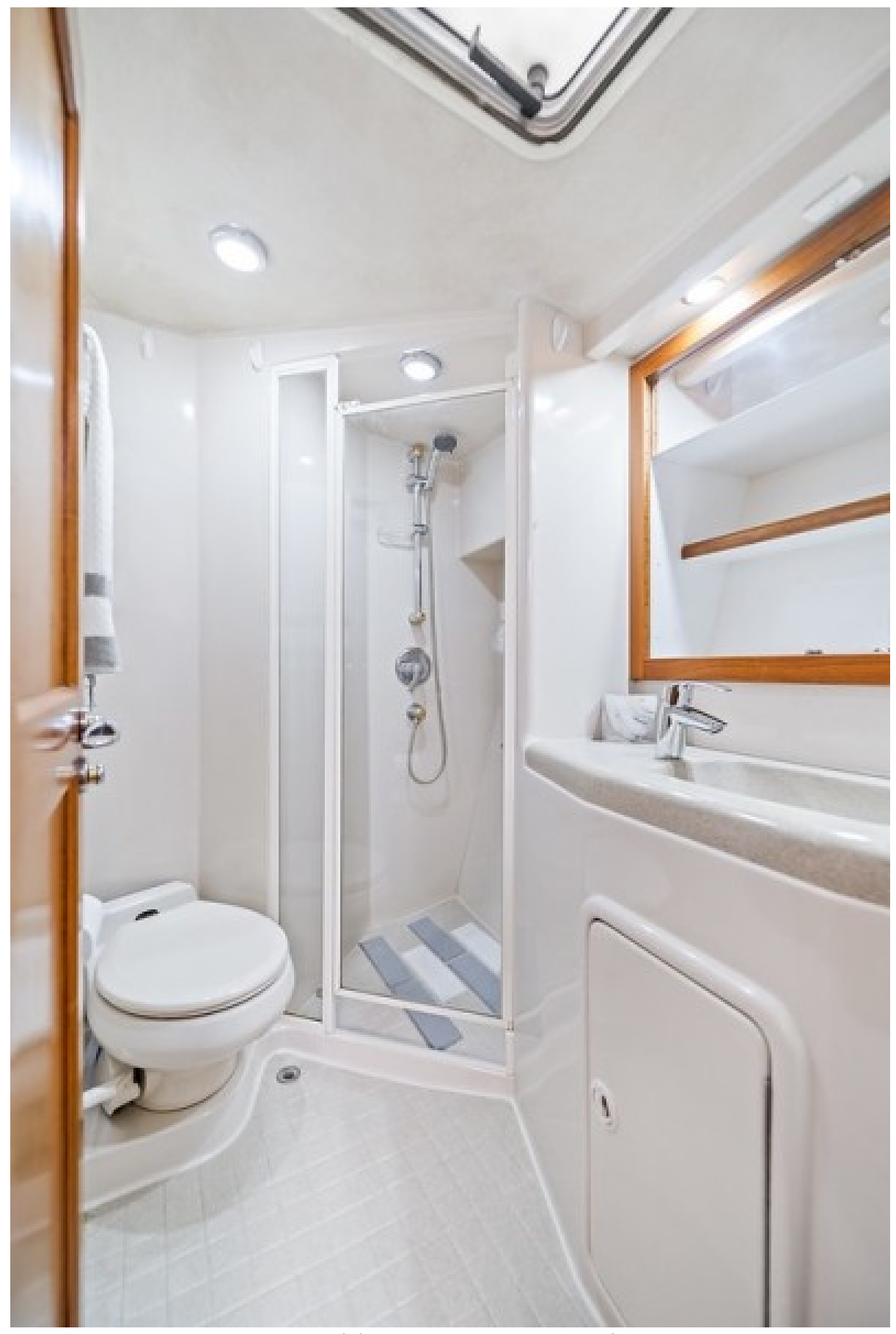
2001 Riviera 43 CNV - Master HEad