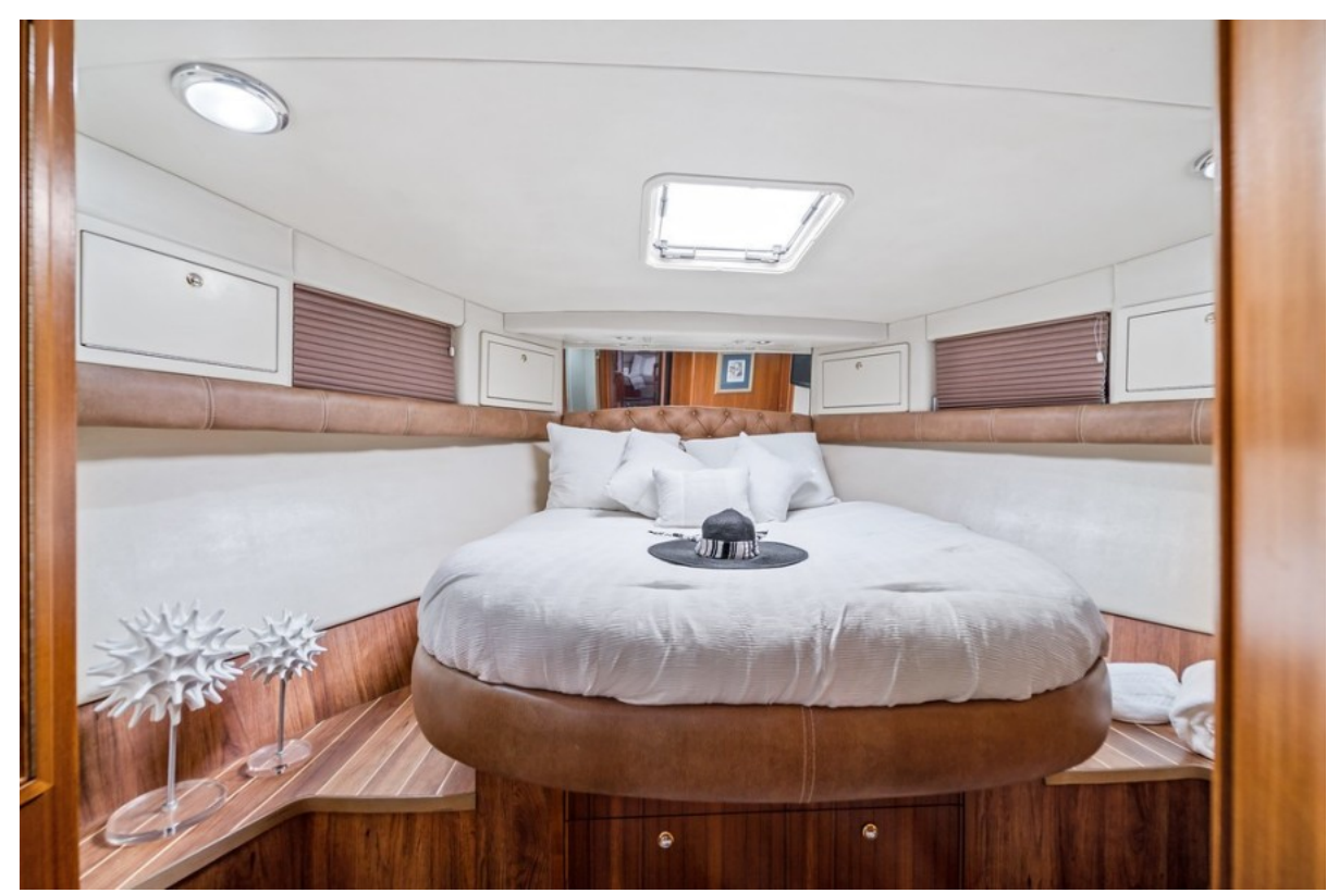
2001 Riviera 43 CNV - Master Stateroom