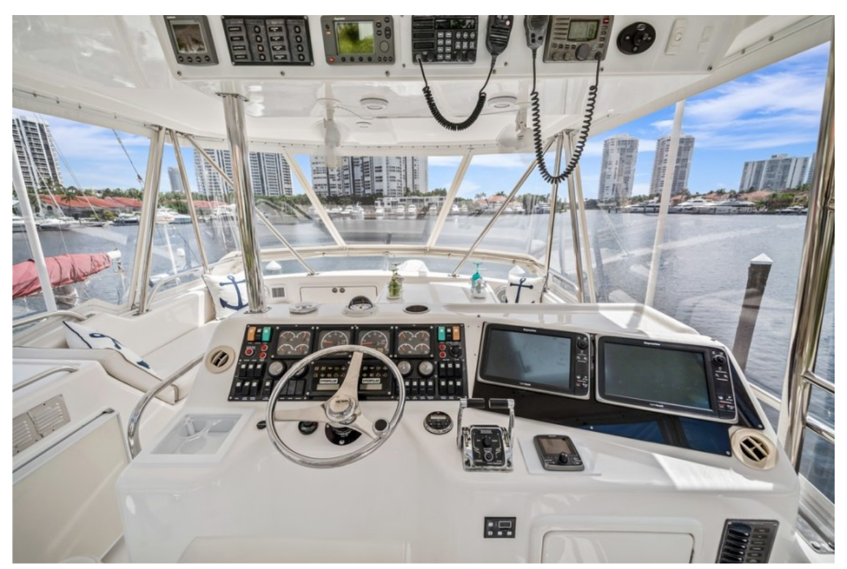
2001 Riviera 43 CNV - Helm Electronics