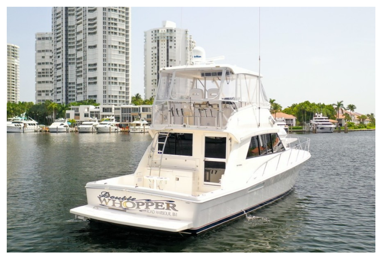
2001 Riviera 43 CNV - Starboard Side