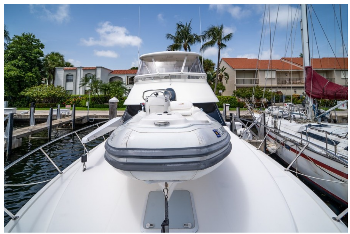
2001 Riviera 43 CNV - Tender