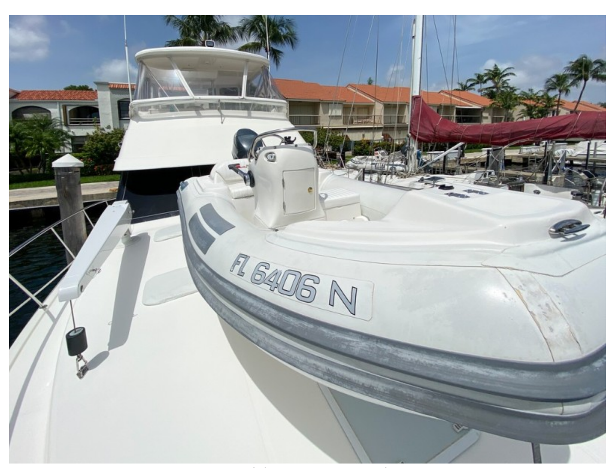
2001 Riviera 43 CNV - Tender