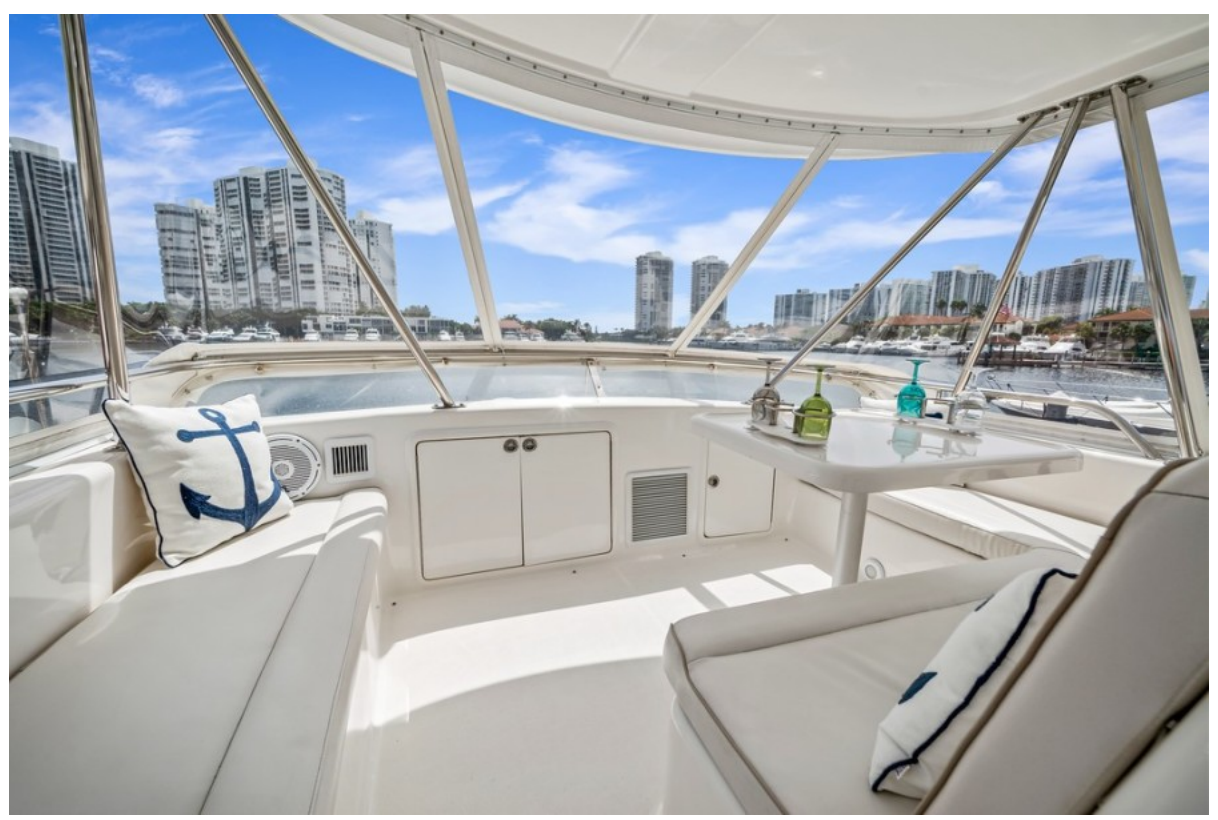
2001 Riviera 43 CNV - Flybridge Seating