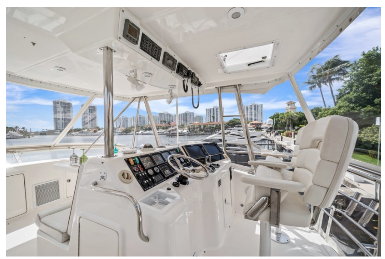
2001 Riviera 43 CNV - Helm