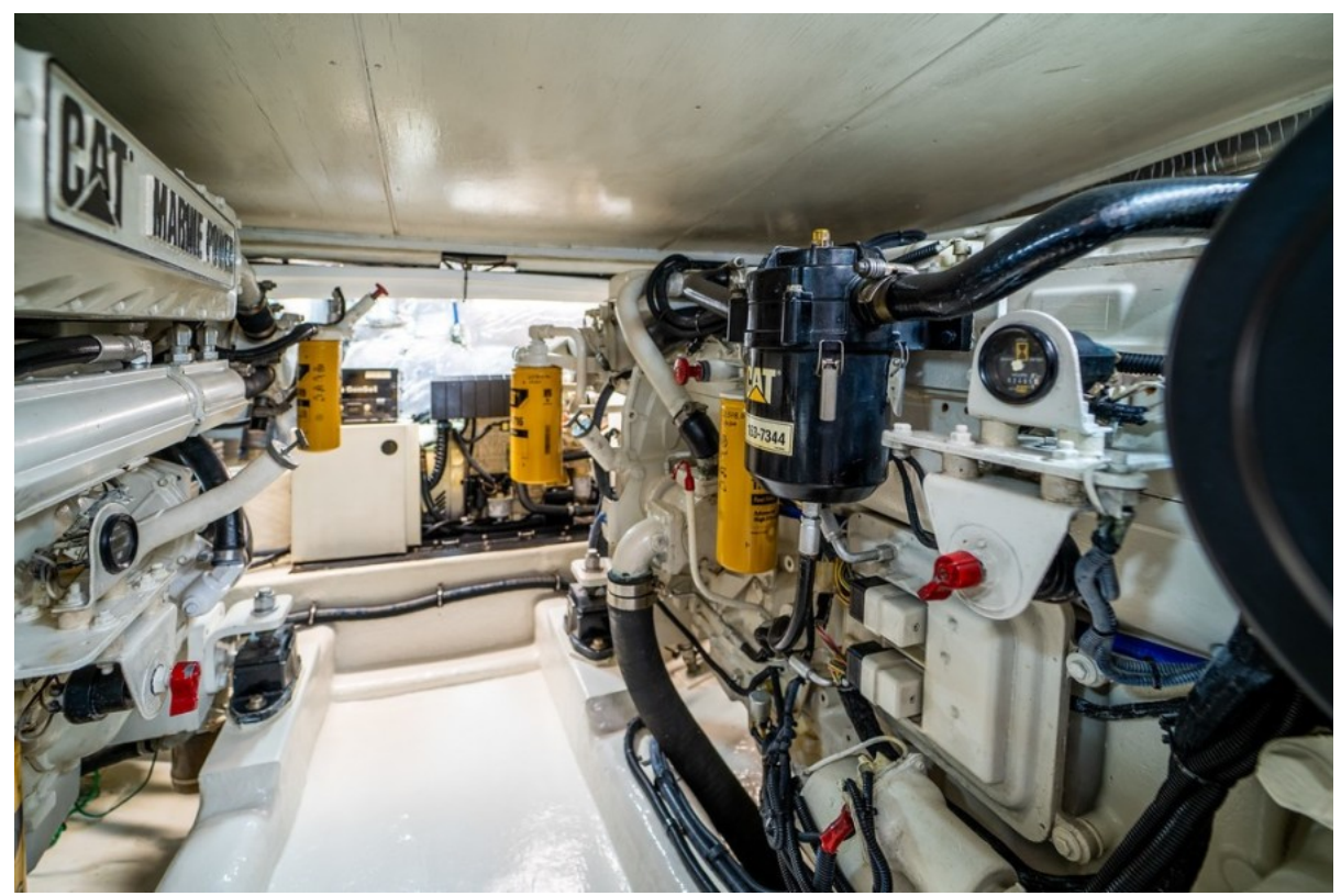
2001 Riviera 43 CNV - Engine Compartment