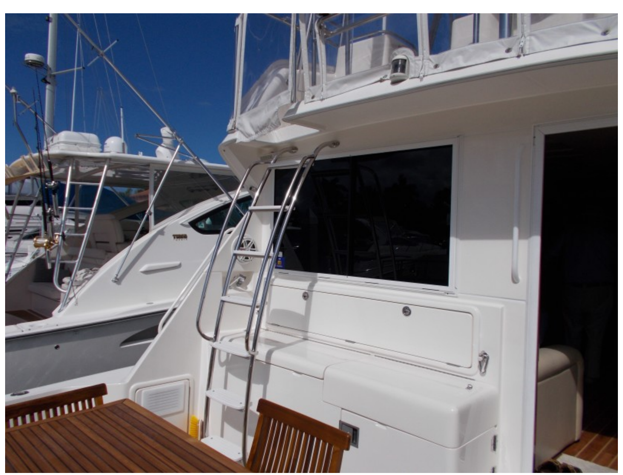
2001 Riviera 43 CNV - Cockpit