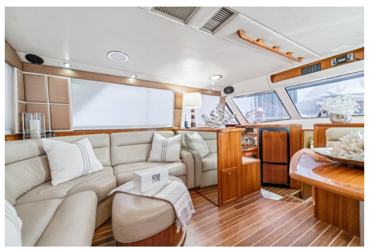
2001 Riviera 43 CNV - Salon