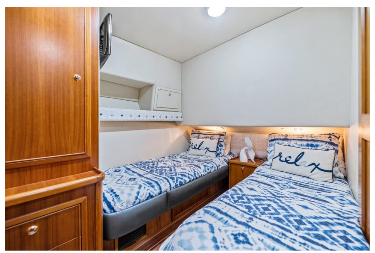
2001 Riviera 43 CNV - Guest Stateroom