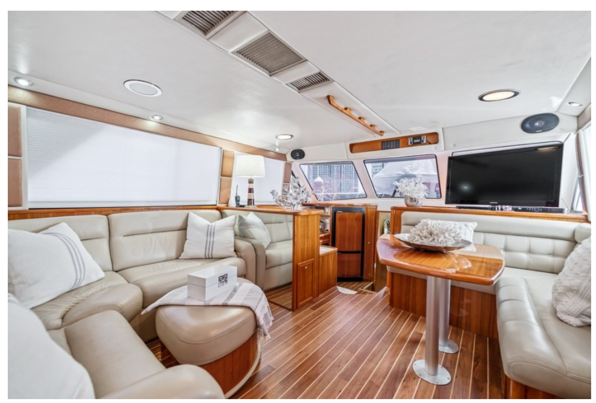
2001 Riviera 43 CNV - Salon