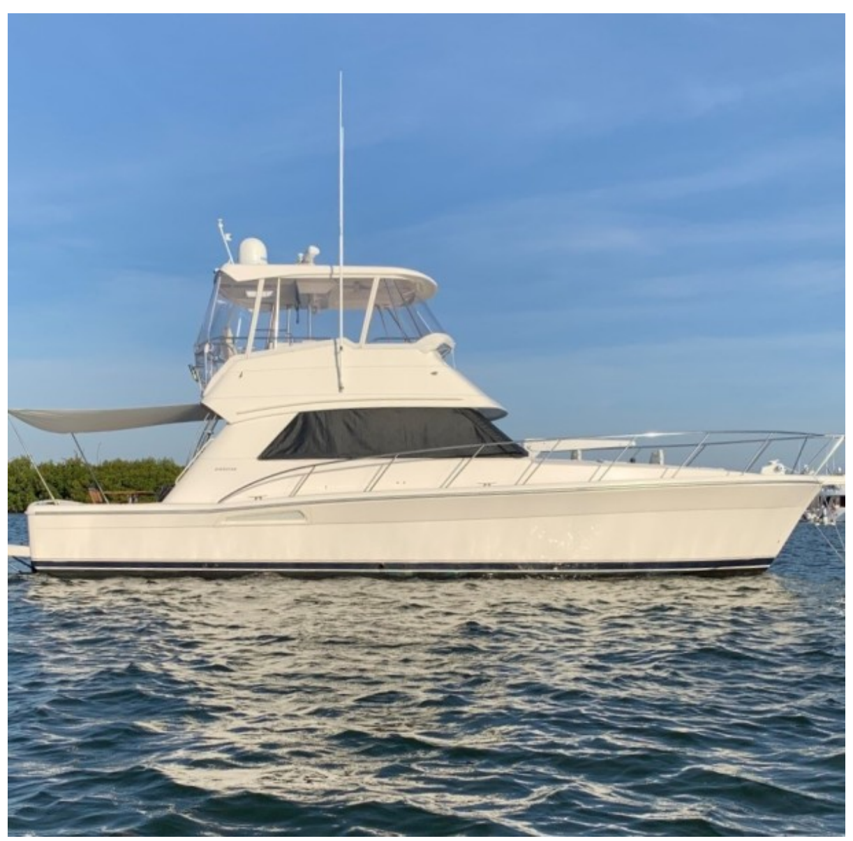
2001 Riviera 43 CNV - Main Profile