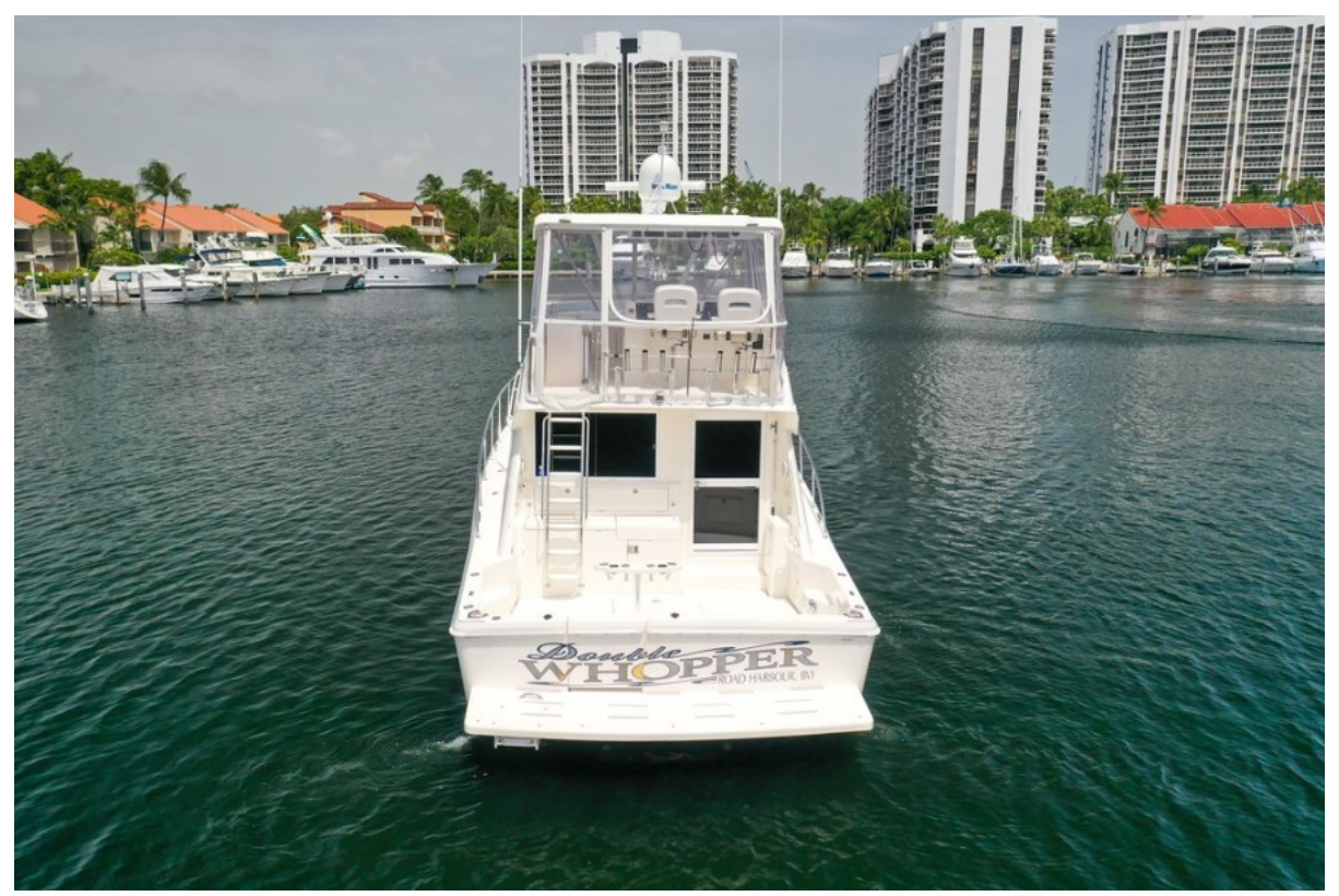
2001 Riviera 43 CNV - Stern