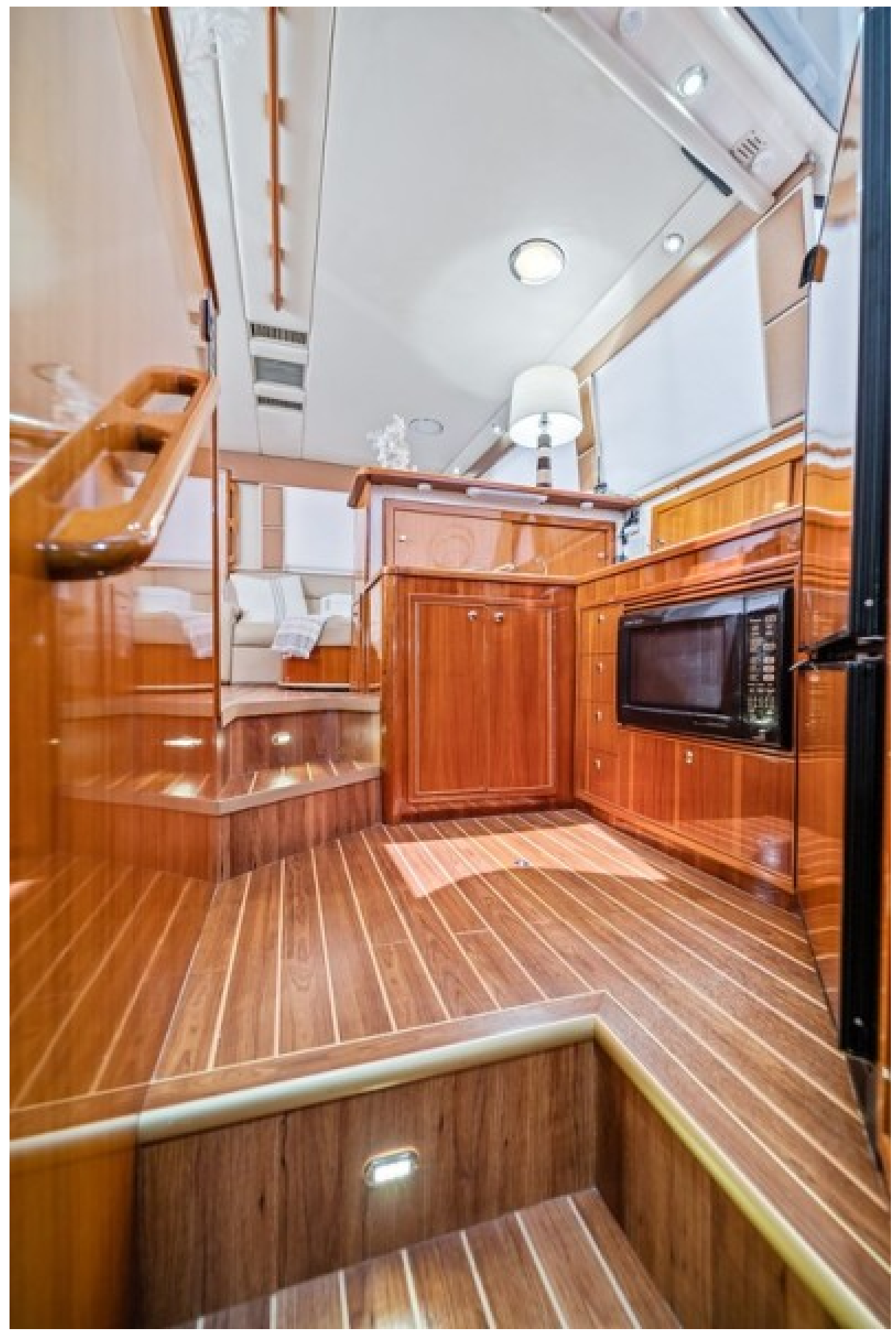
2001 Riviera 43 CNV - Galley