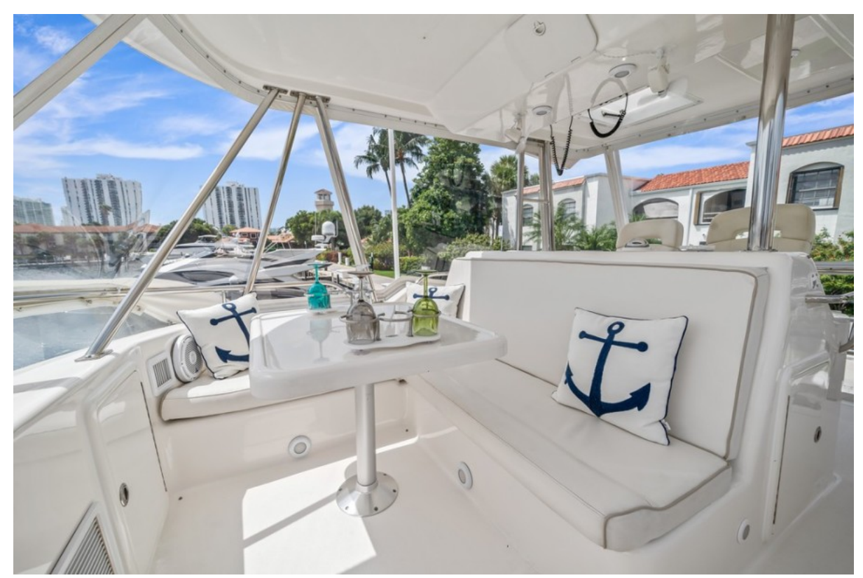
2001 Riviera 43 CNV - Flybridge Seating