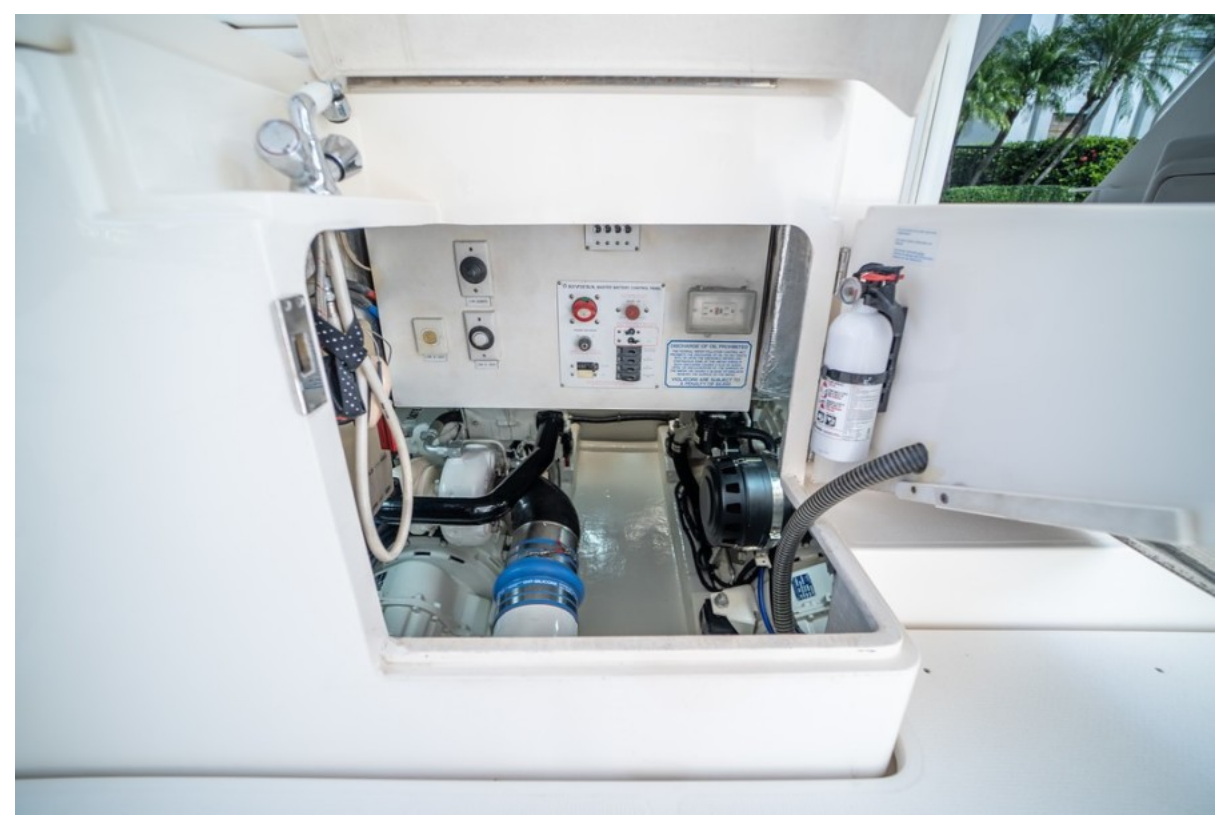
2001 Riviera 43 CNV - Engine Compartment