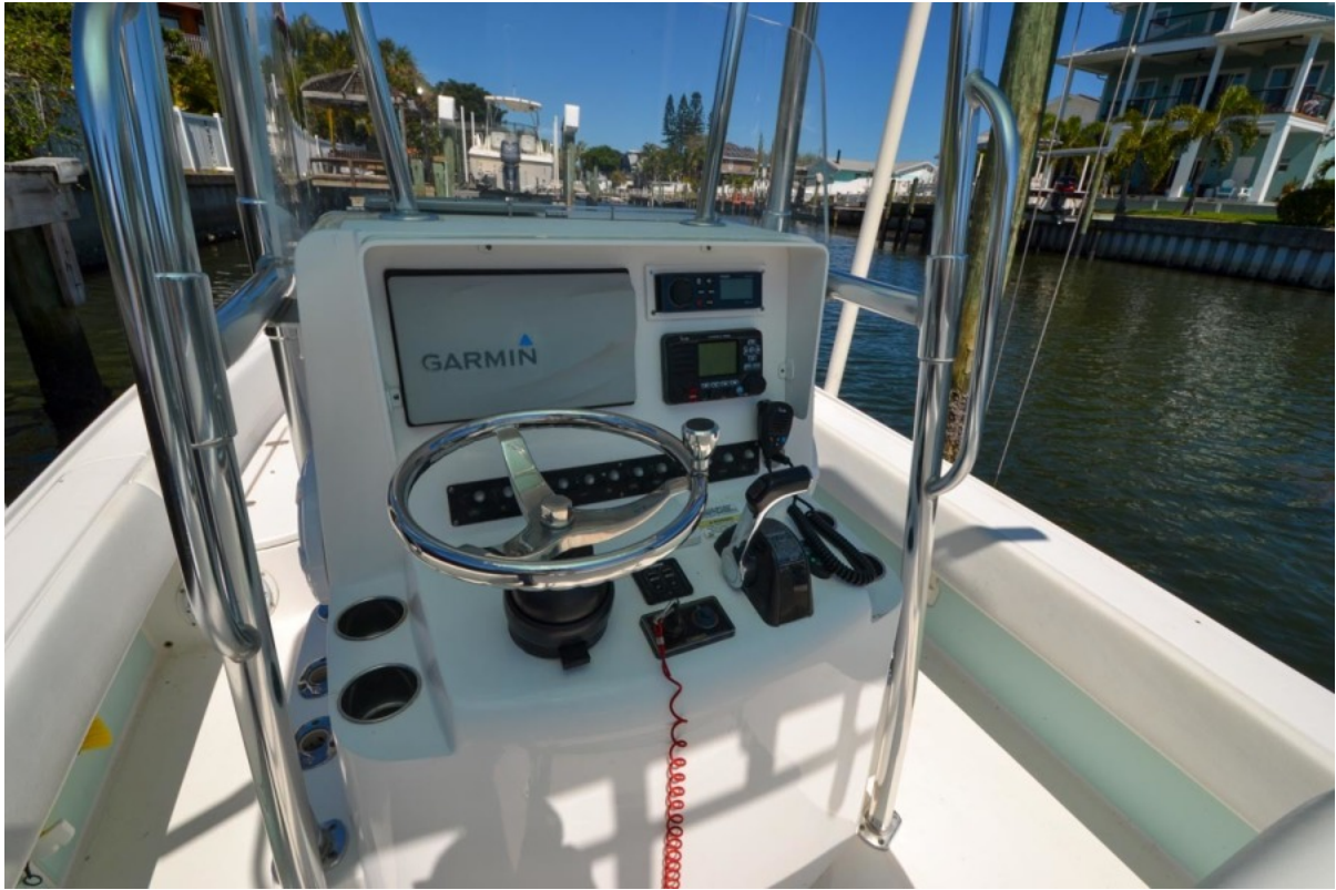
Garmin New Stereo, Amp and Speakers