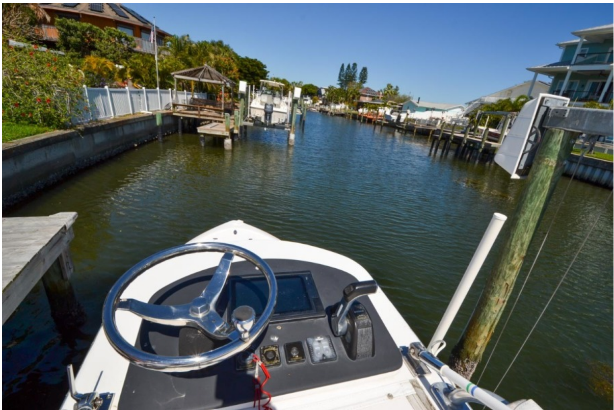
Upper Helm Garmin