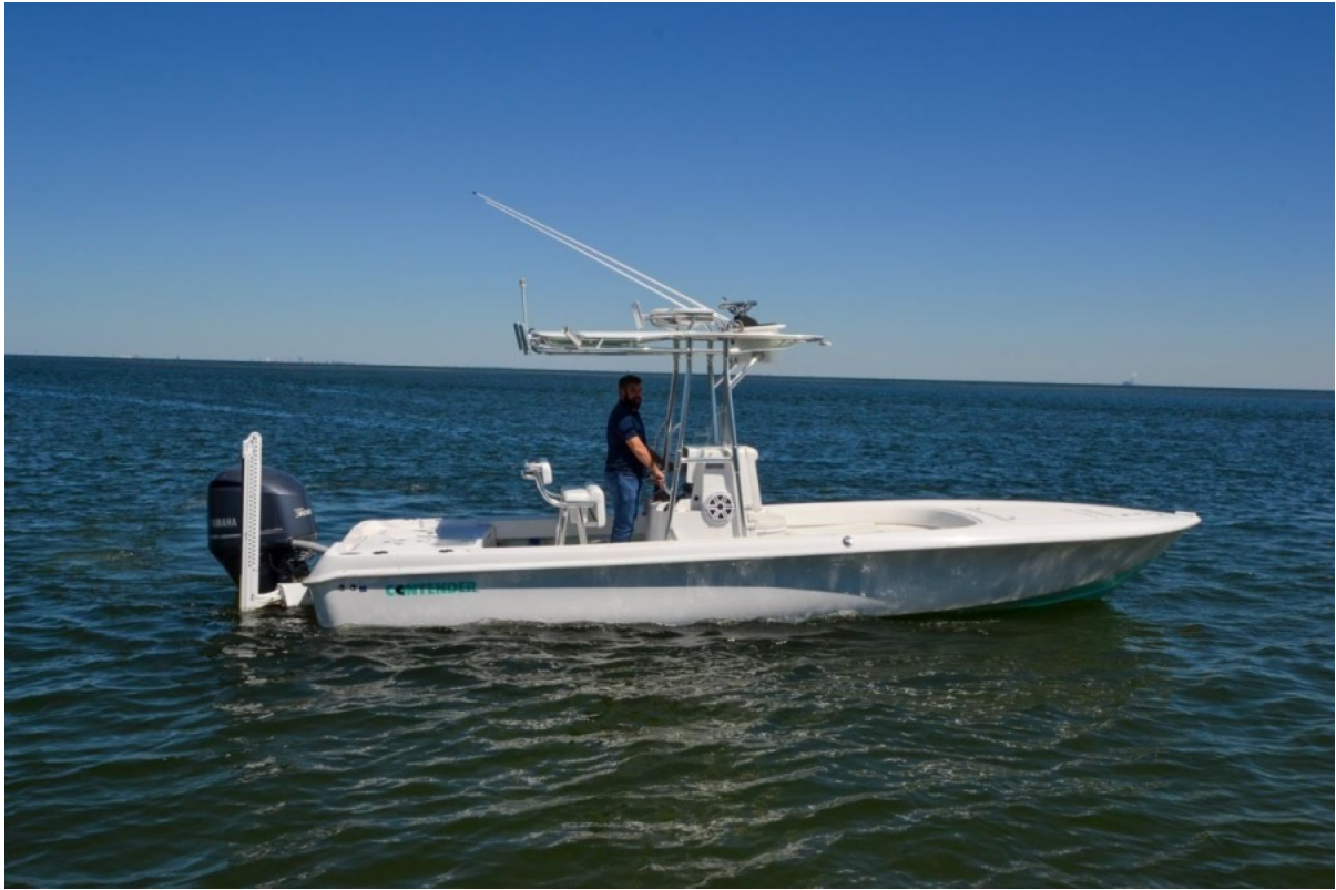
Contender 25 Bay 2nd Station