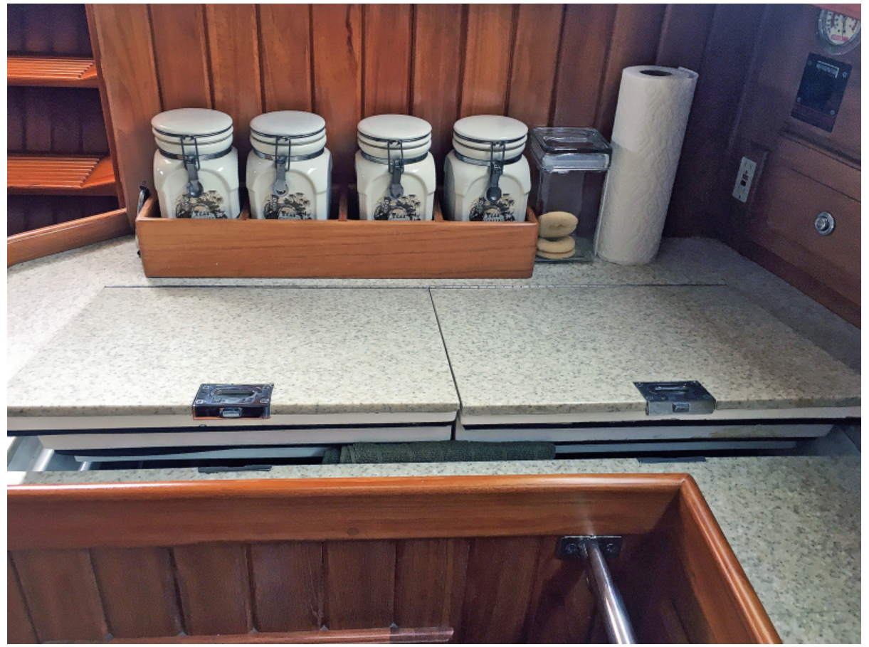
Counter Access to Fridge, Freezer