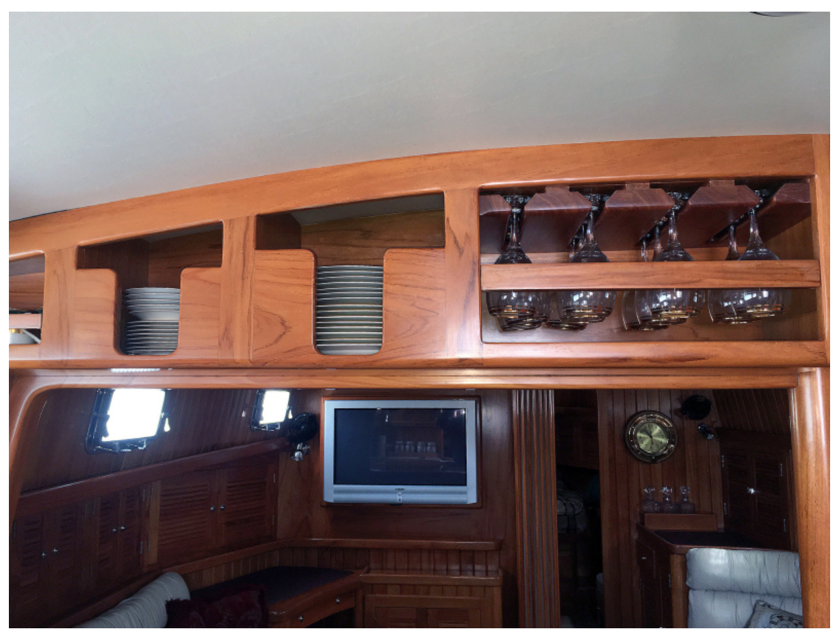
Dish and Glass Storage