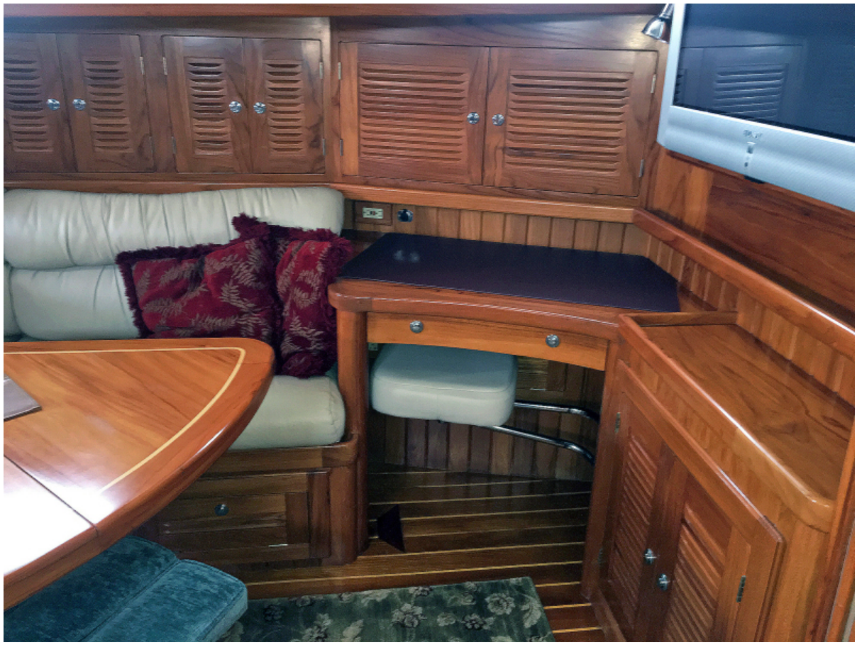
Salon Work desk