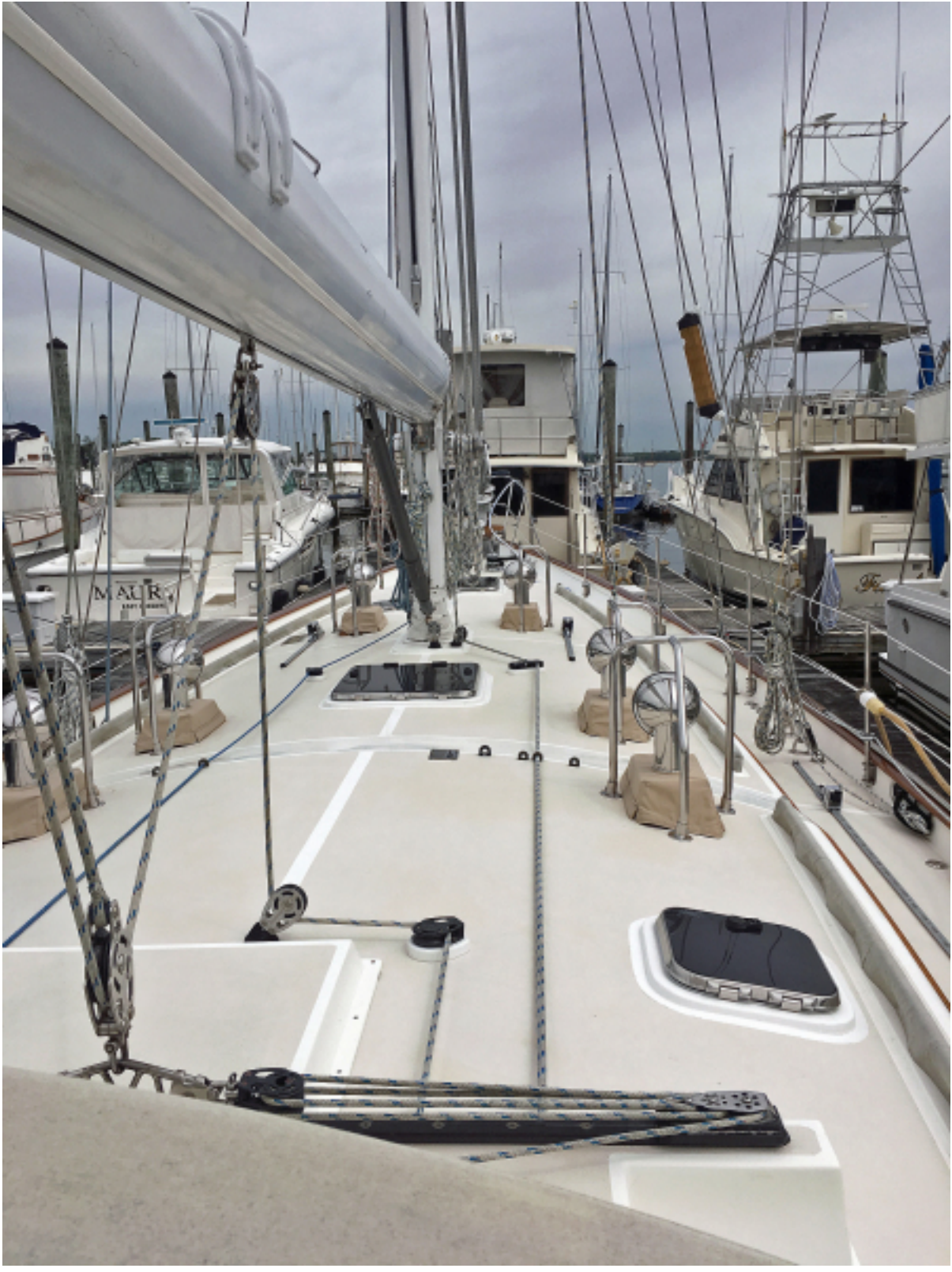
Foredeck Looking Aft