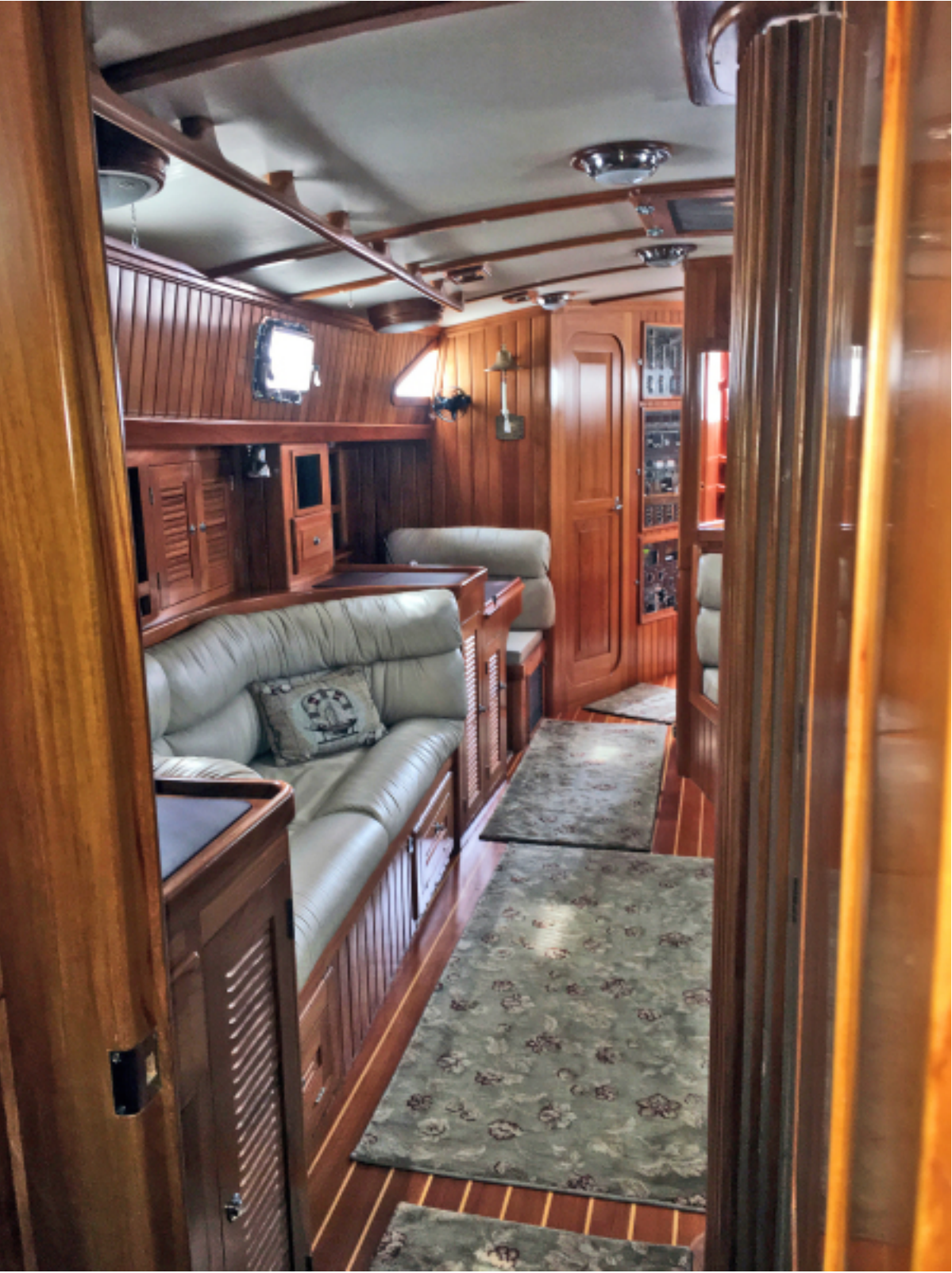
Stbd Salon Looking Aft