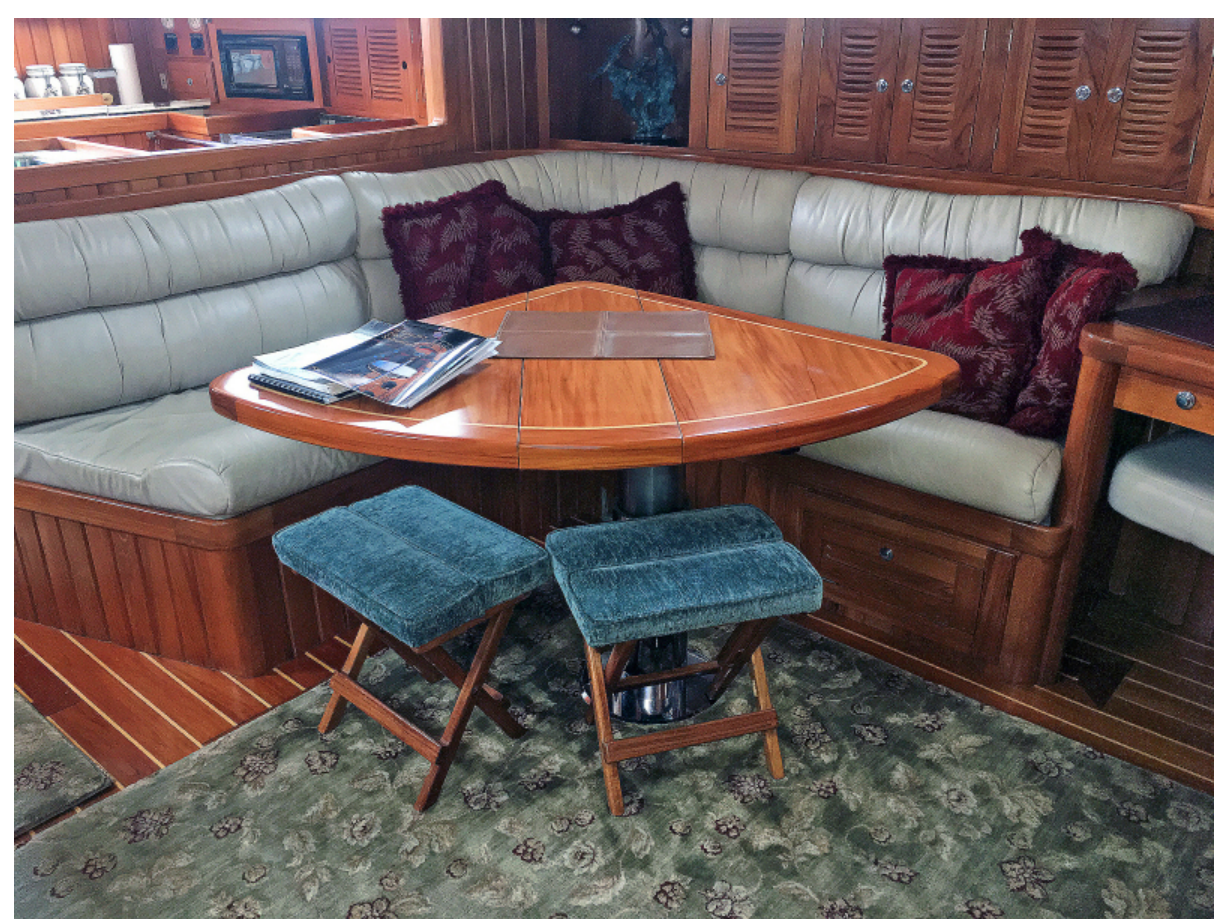
Salon Table, Port