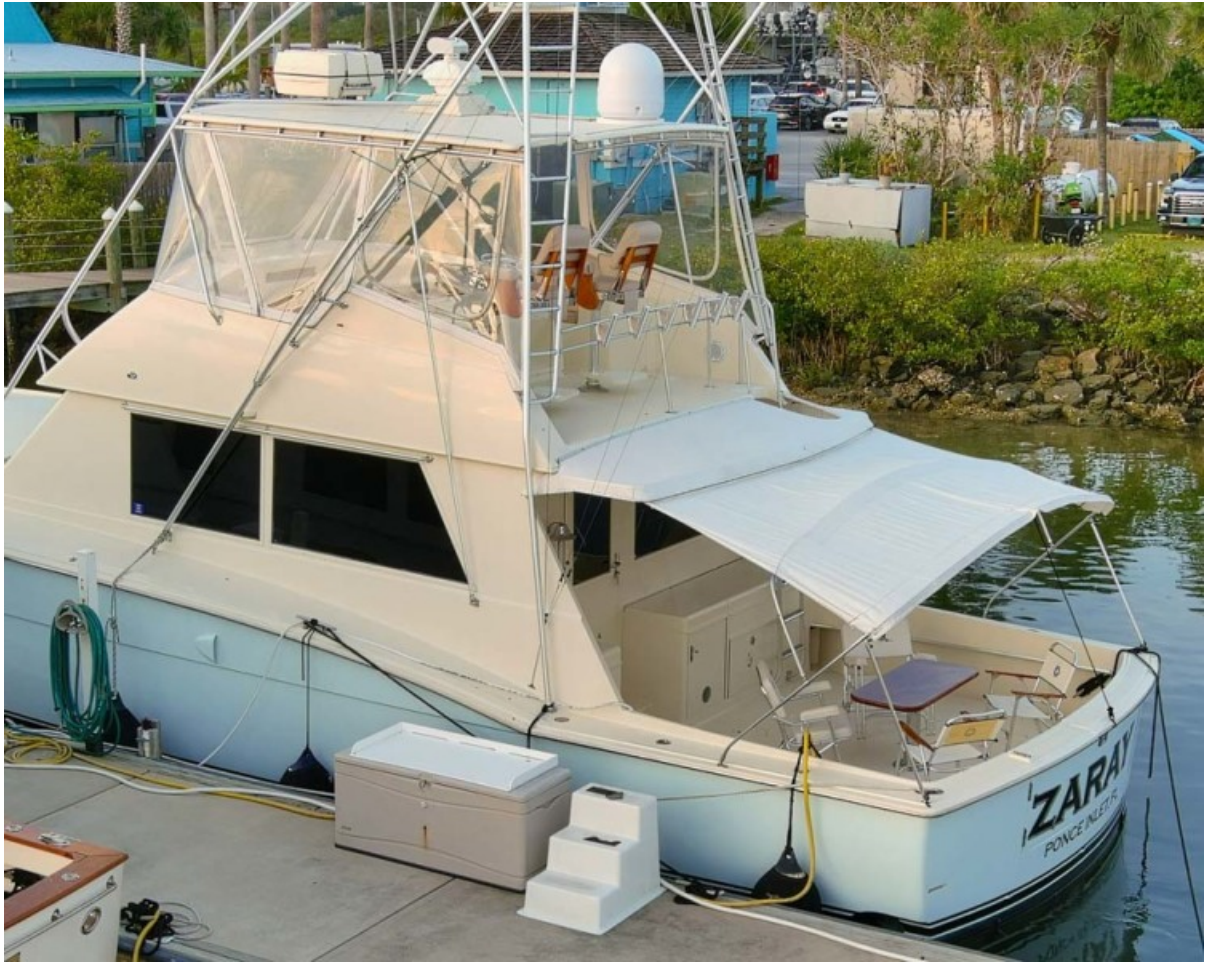
Port Aft Profile