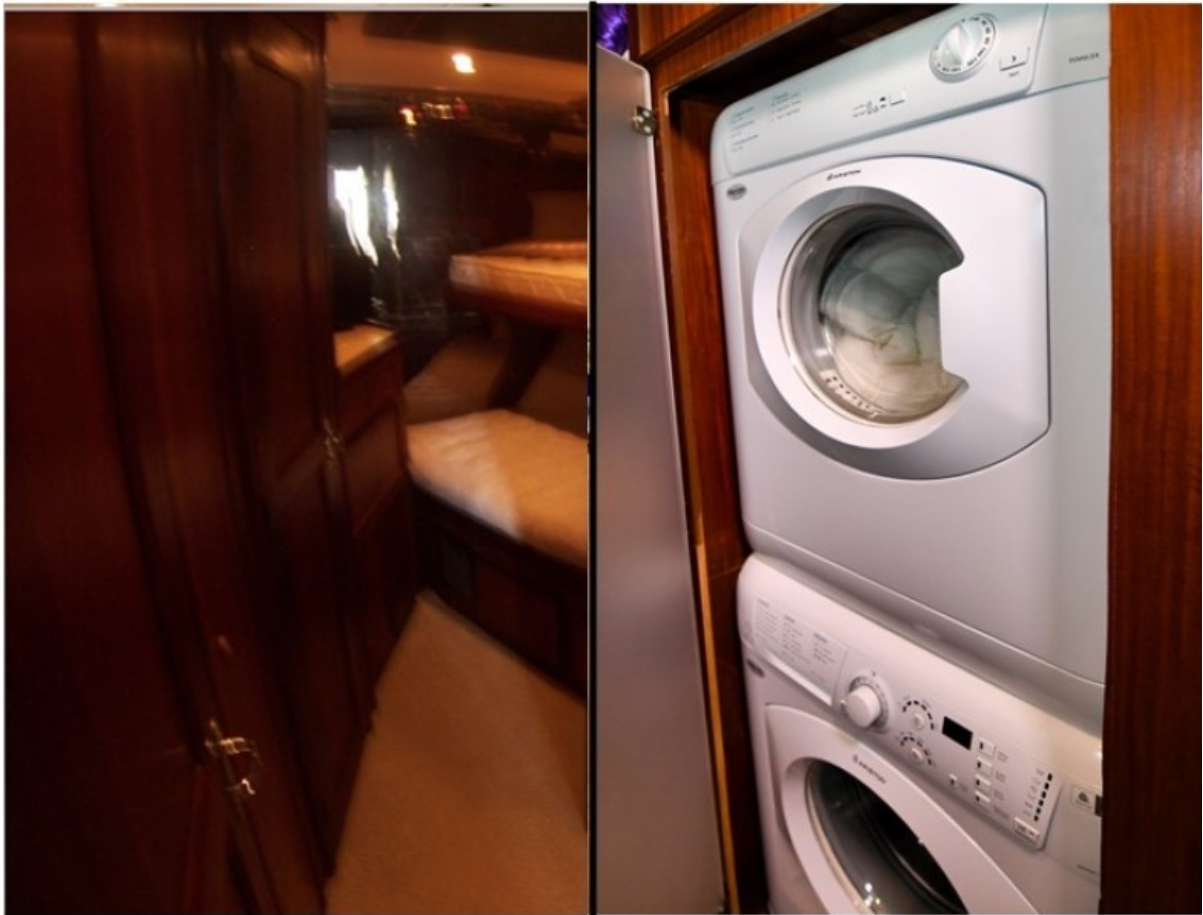
Forward Stateroom & Washer Dryer