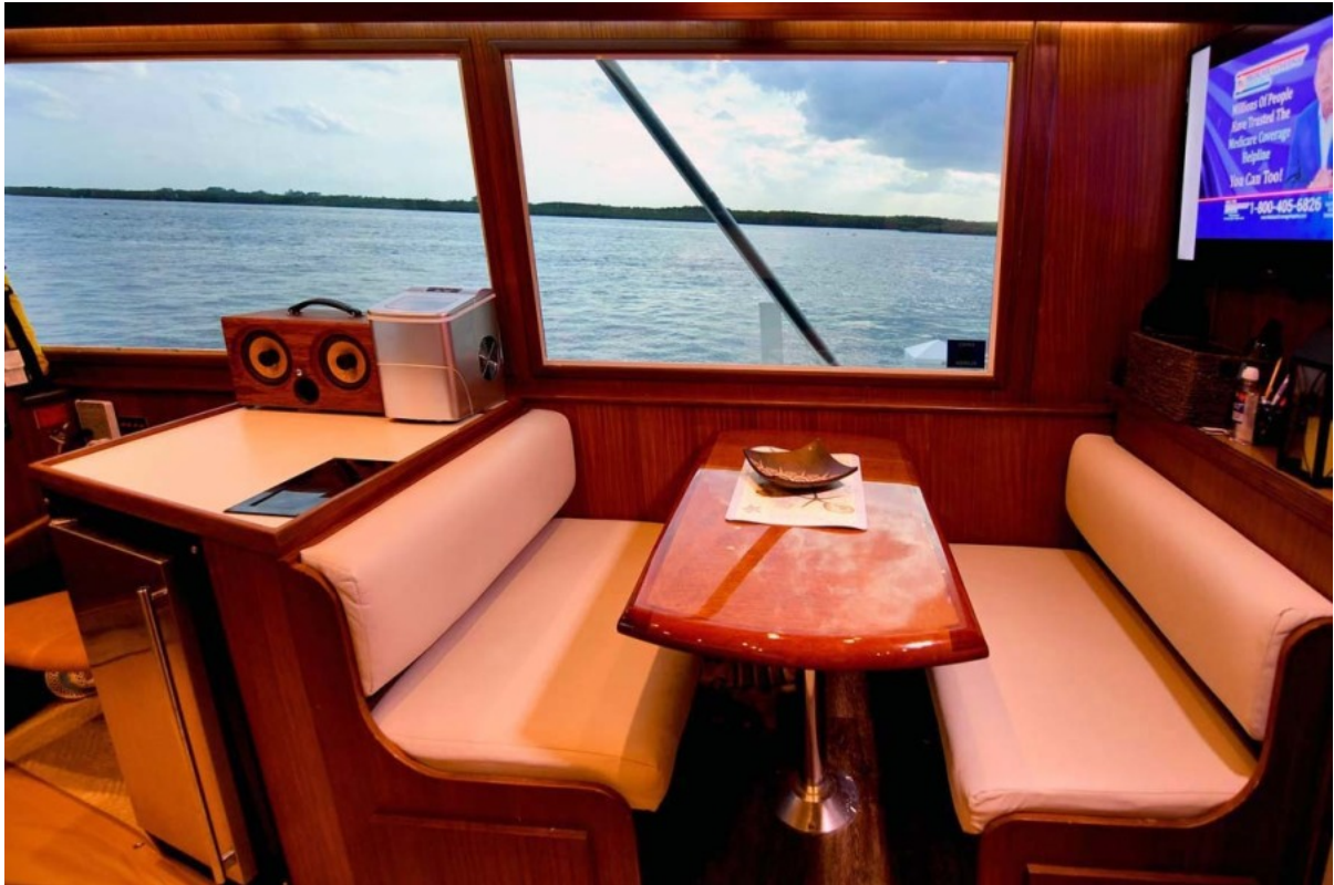
Dinette To Port