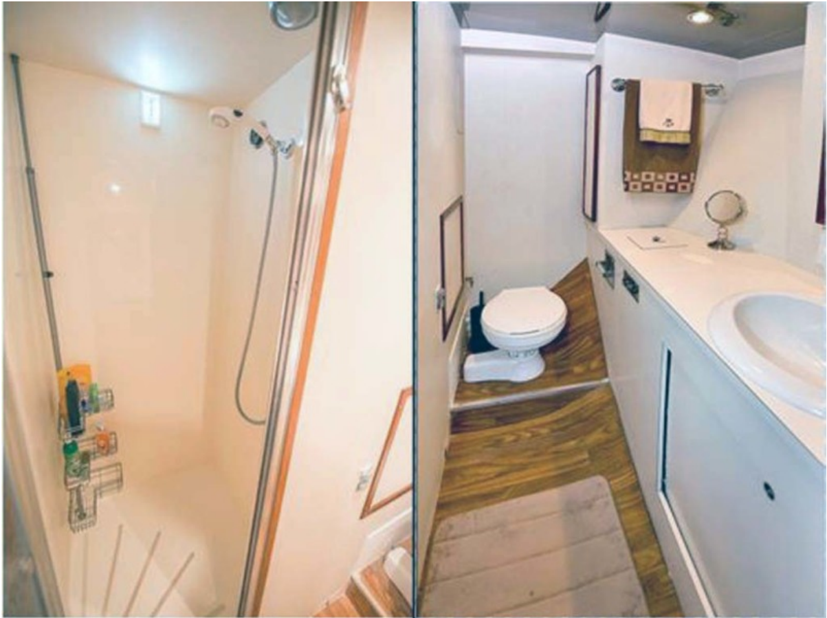
MSR En-Suite Head And Shower