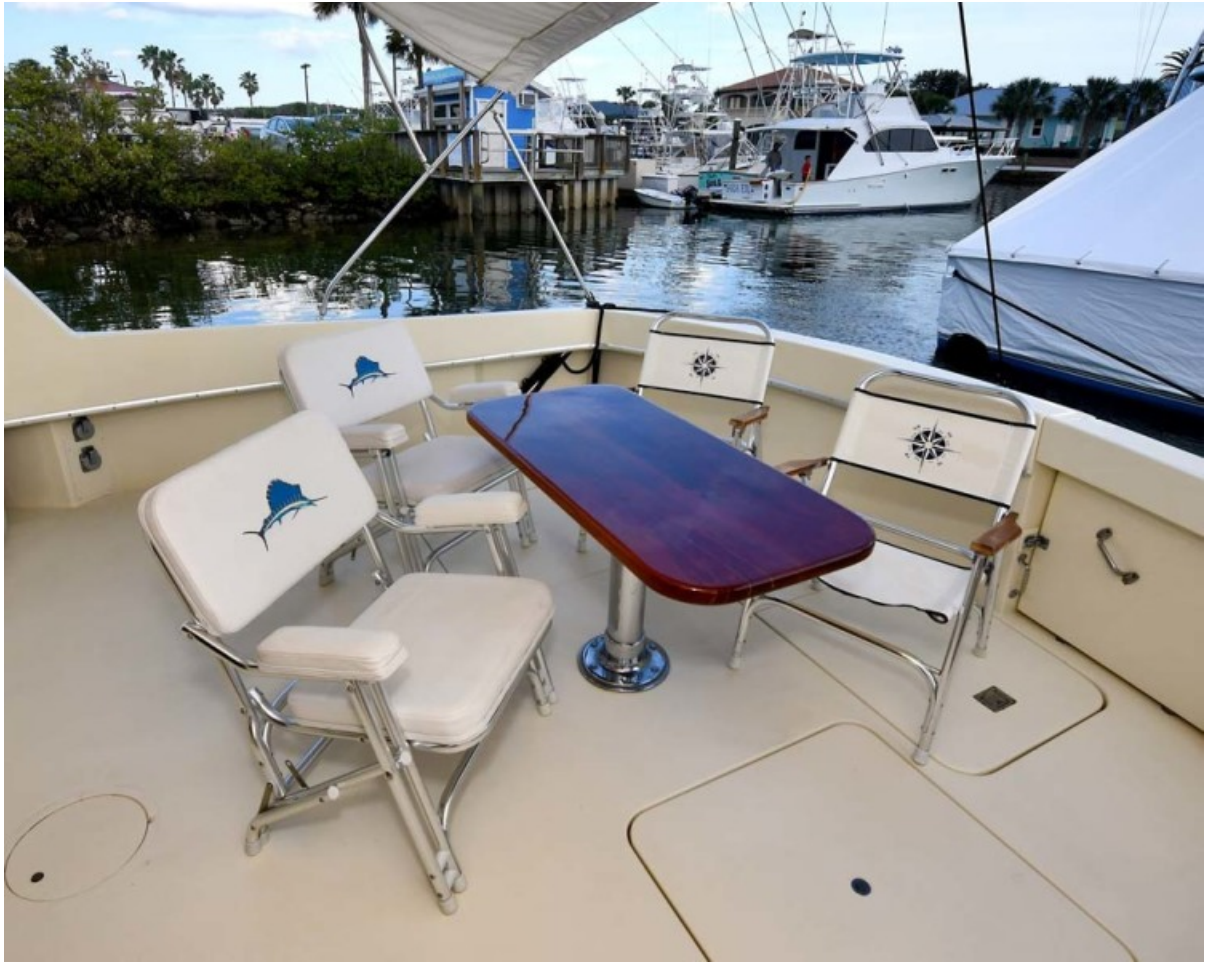
Cockpit To Starboard