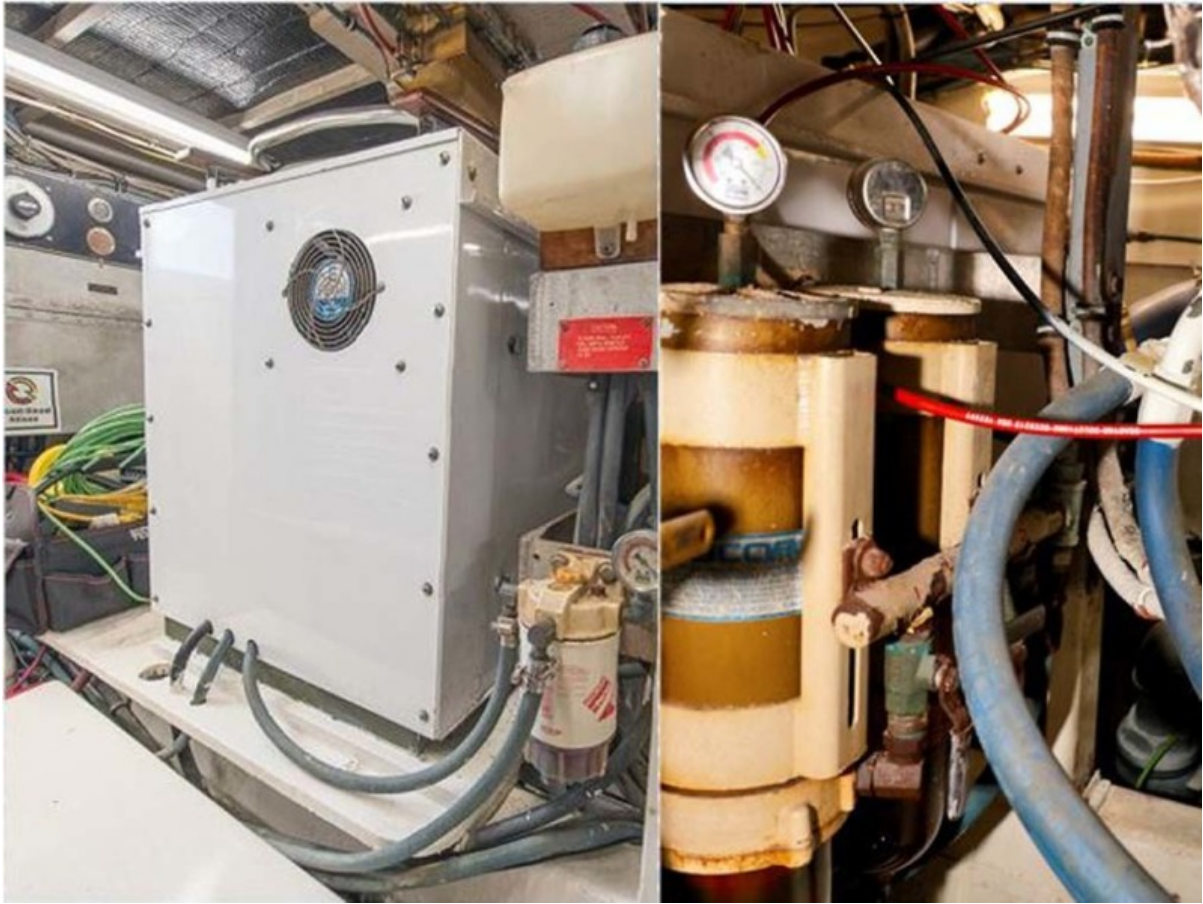
Genset and Racors