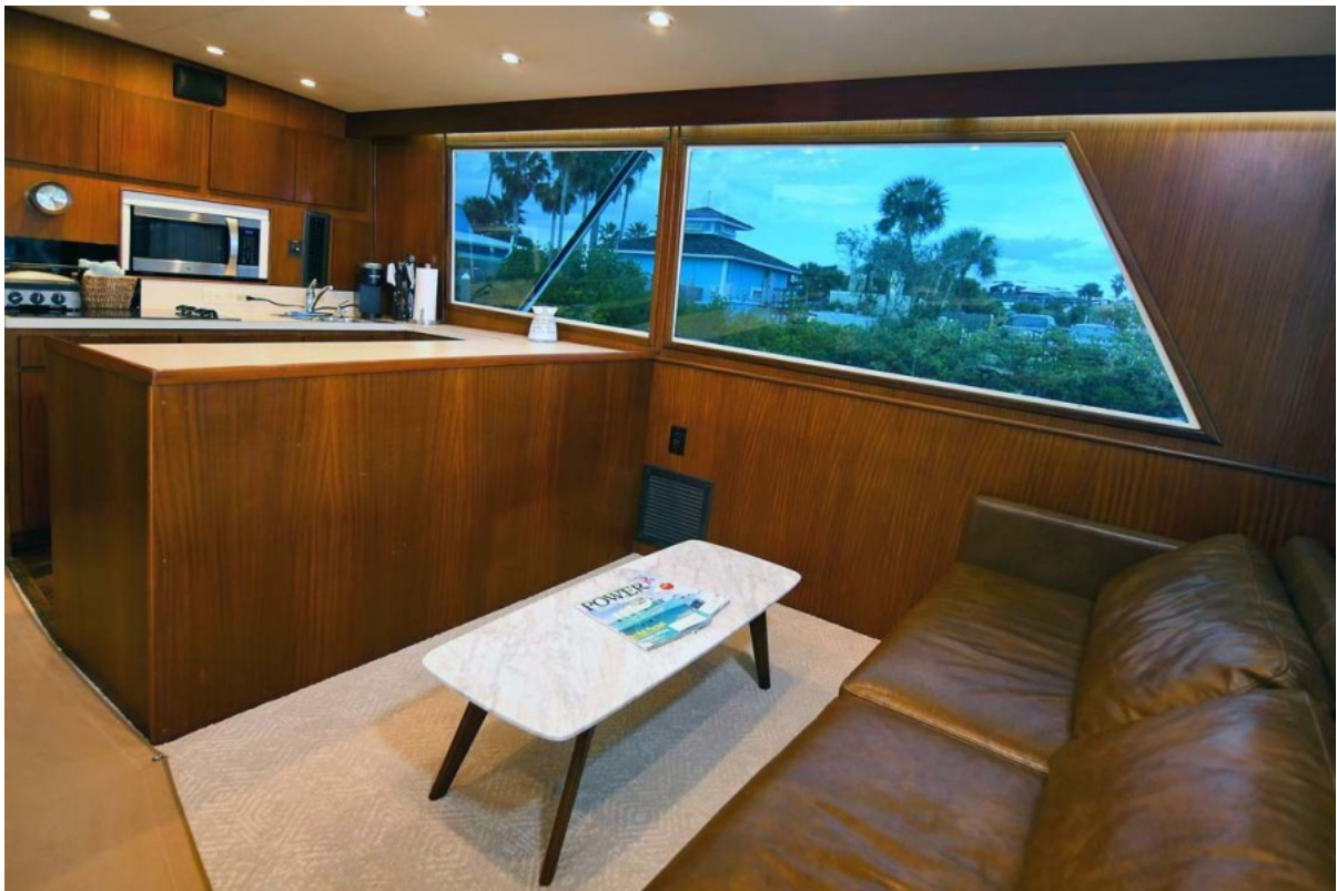
Salon and Galley To Starboard