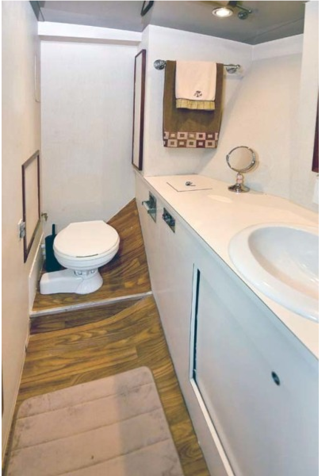
MSR En-Suite Head