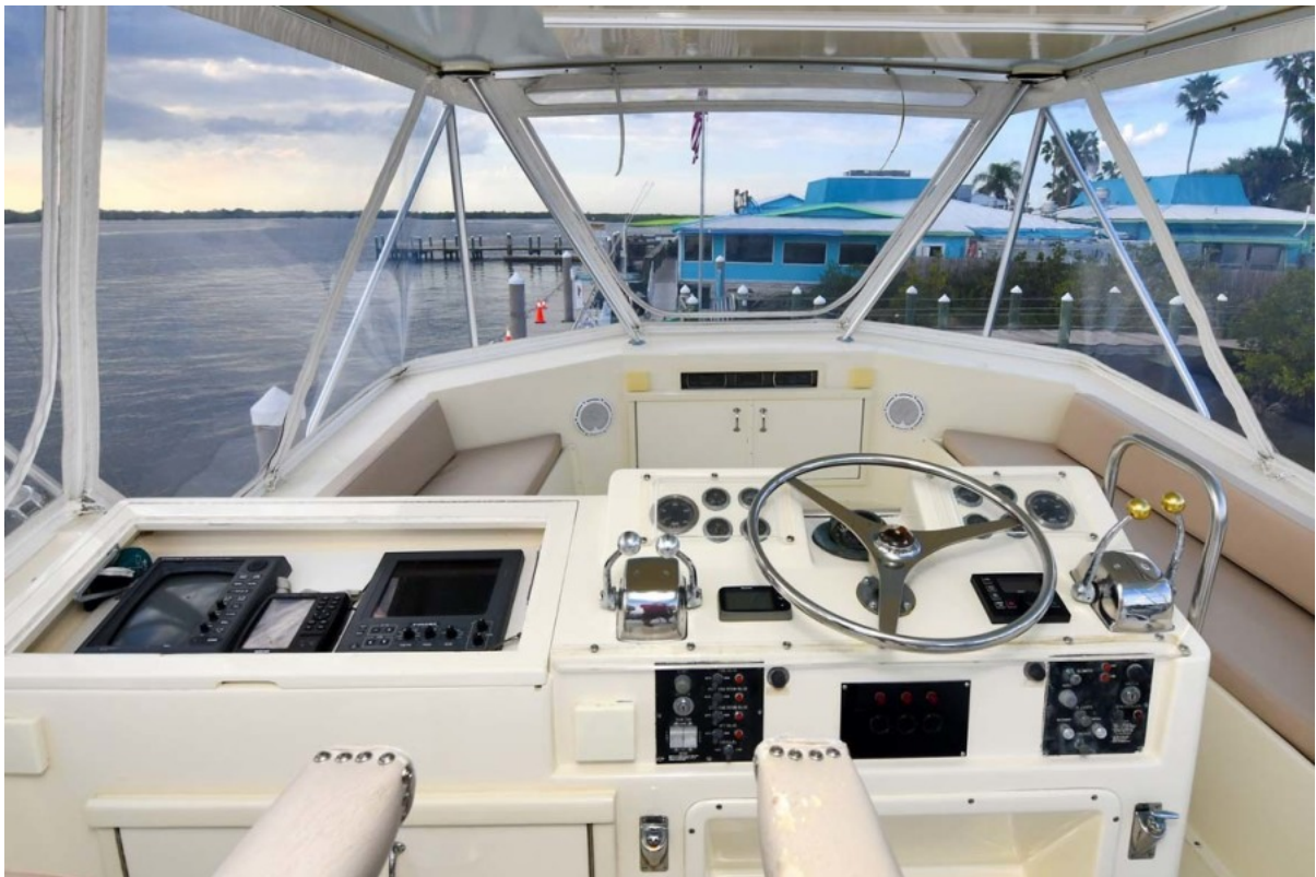
Flybridge Instrument Panel