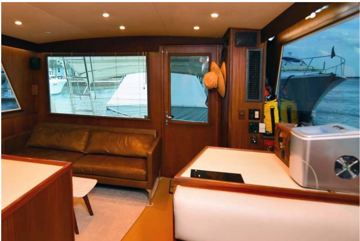
Salon To Aft