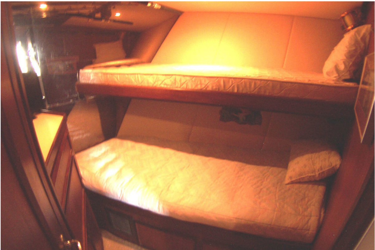
Forward Stateroom To Starboard