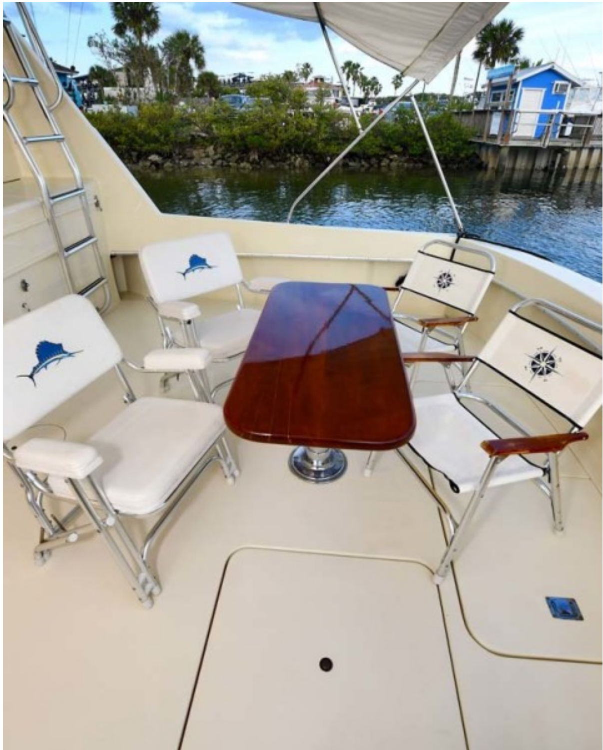
Cockpit With Table Setup