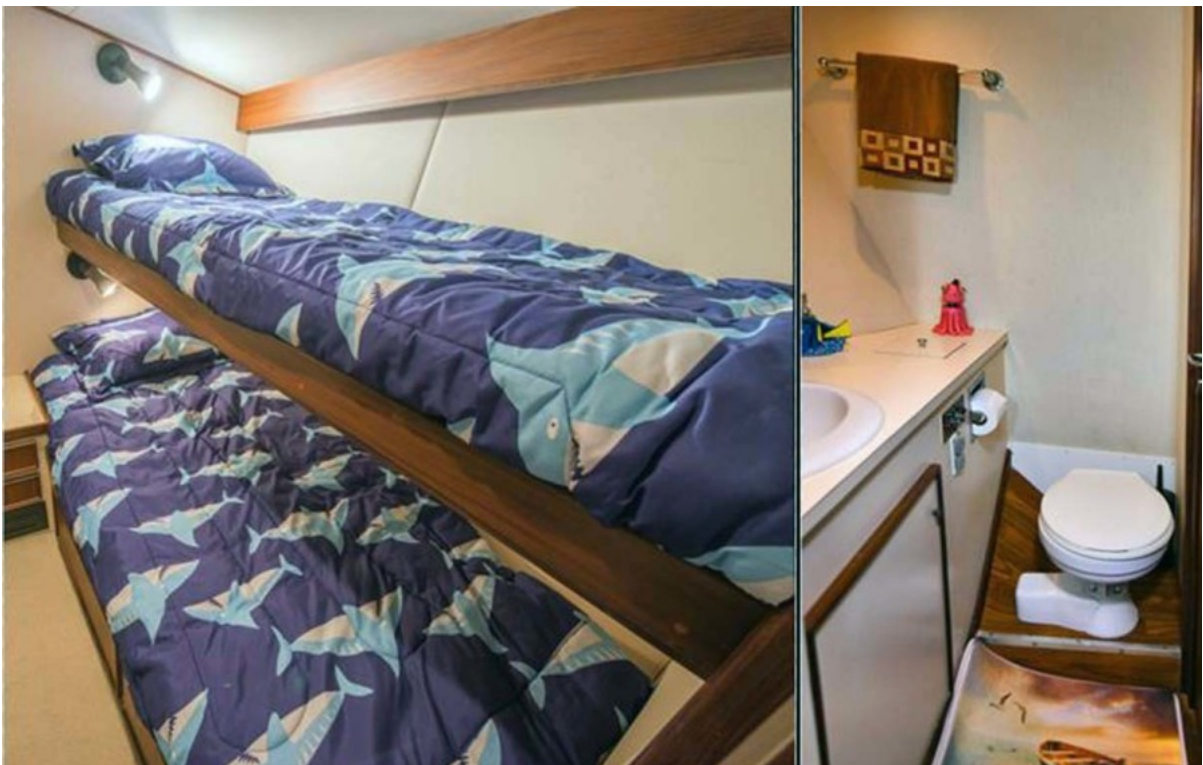
Portside Bunk Stateroom And En Suite Head