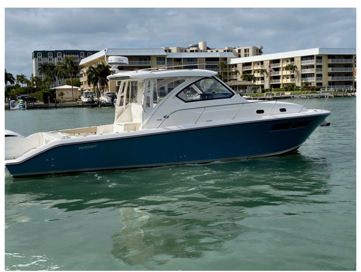
35 Pursuit Profile Stbd 2018 Pursuit 35 O.S. Profile Starboard