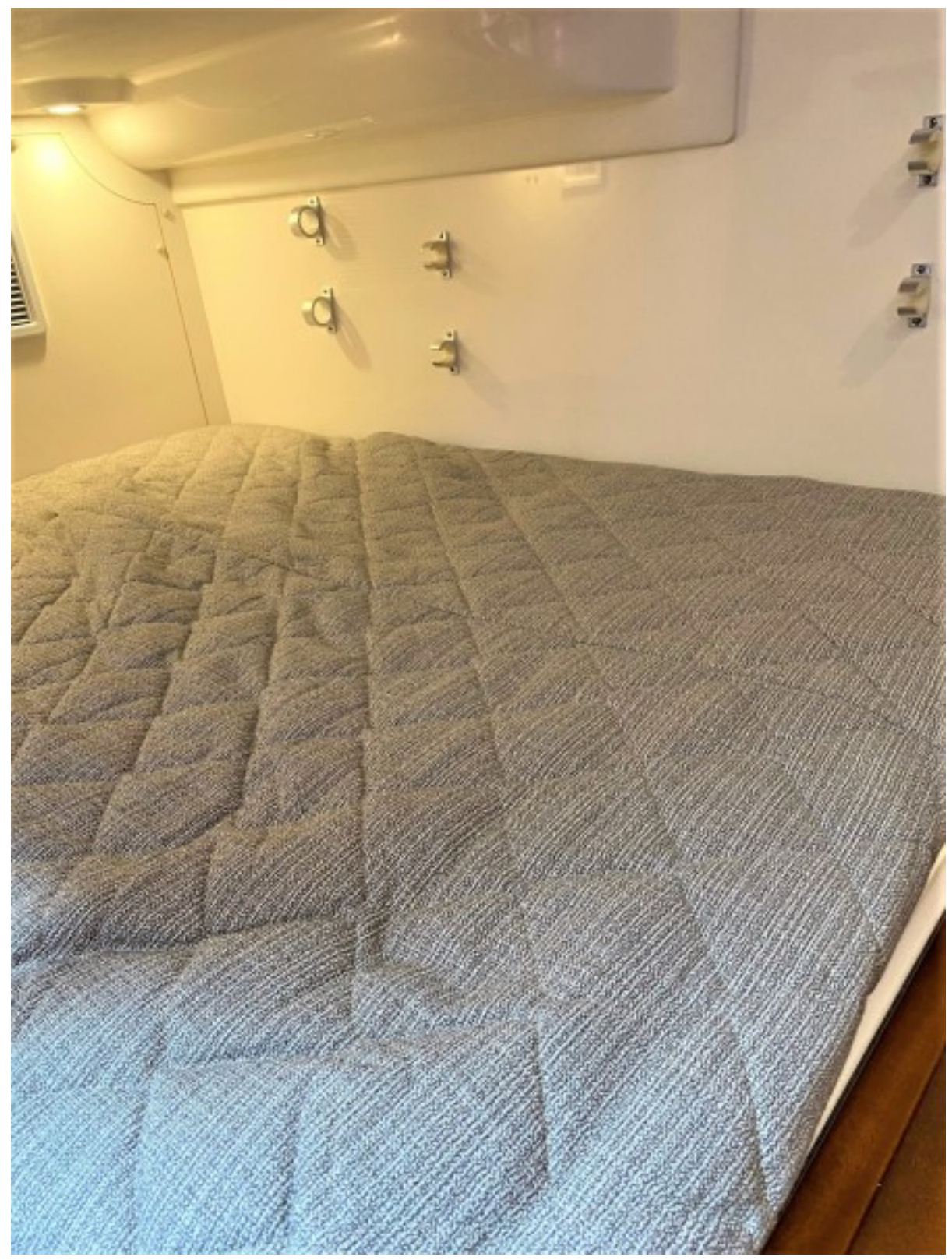
35 Pursuit Aft Cabin Berth 2018 Pursuit 35 O.S. Aft Cabin