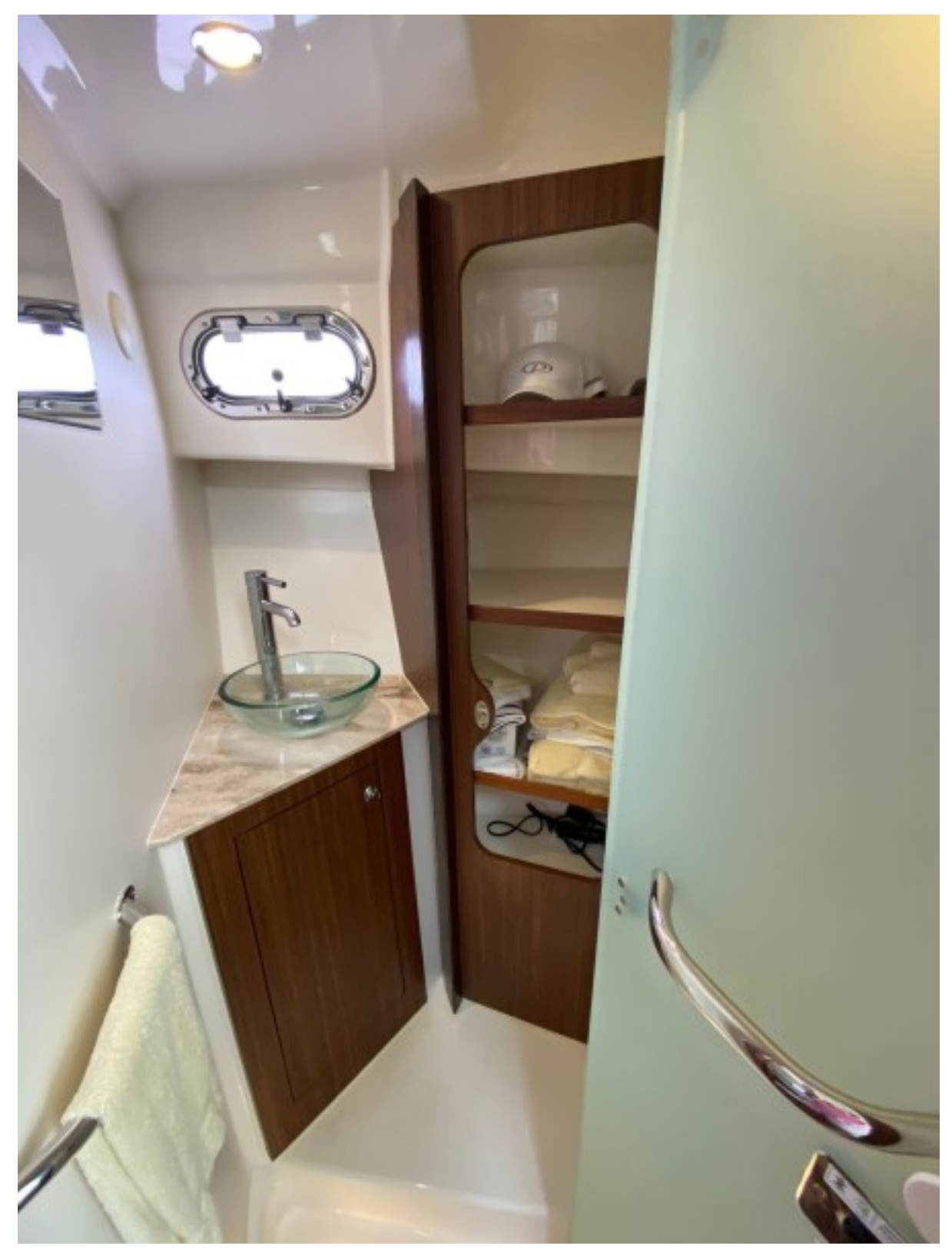
35 Pursuit Head Wash Basin 2018 Pursuit 35 O.S. Bathroom