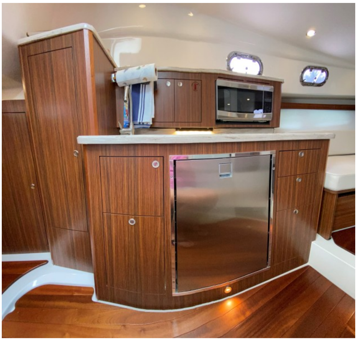
35 Pursuit Galley 2018 Pursuit 35 O.S. Galley