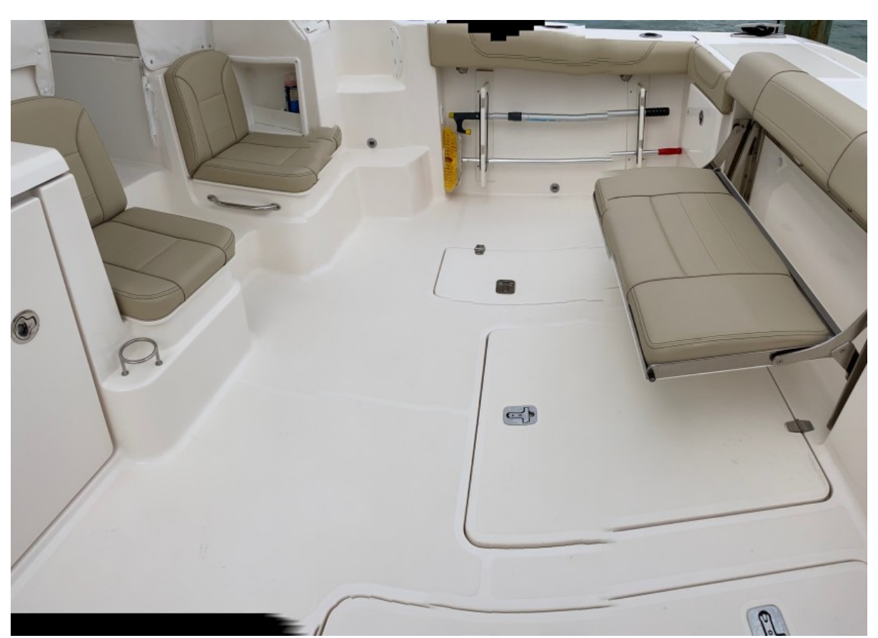
35 Pursuit Cockpit 2018 Pursuit 35 O.S. Cockpit