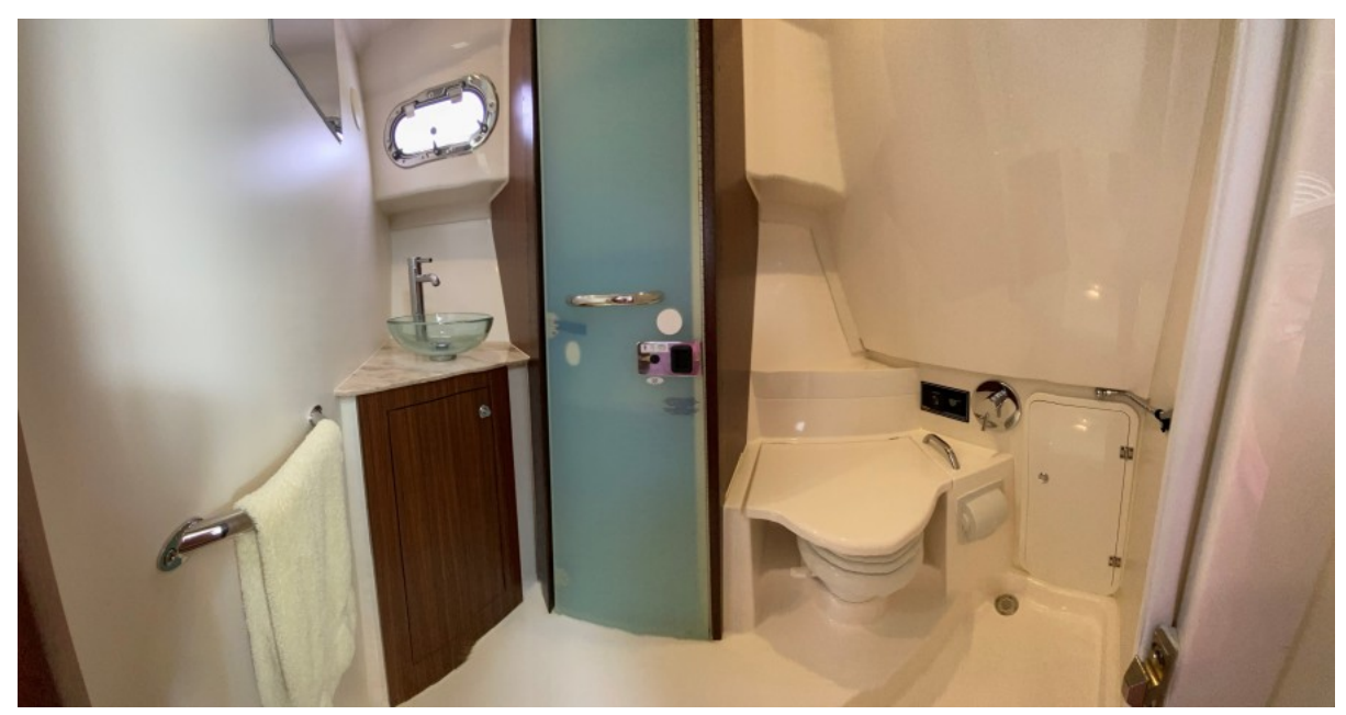
35 Pursuit Bathroom 2018 Pursuit 35 O.S. Bathroom