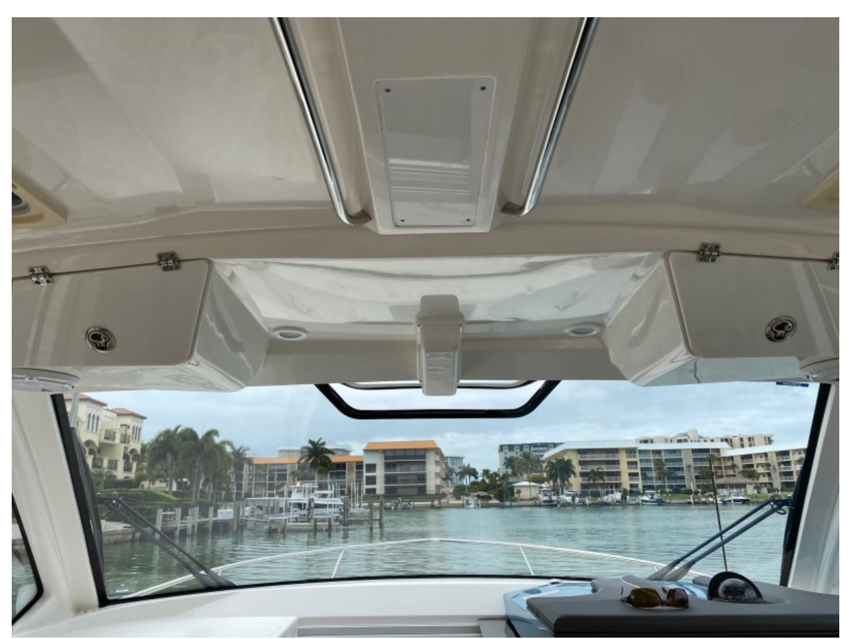
35 Pursuit Helm View 2018 Pursuit 35 O.S. Helm View