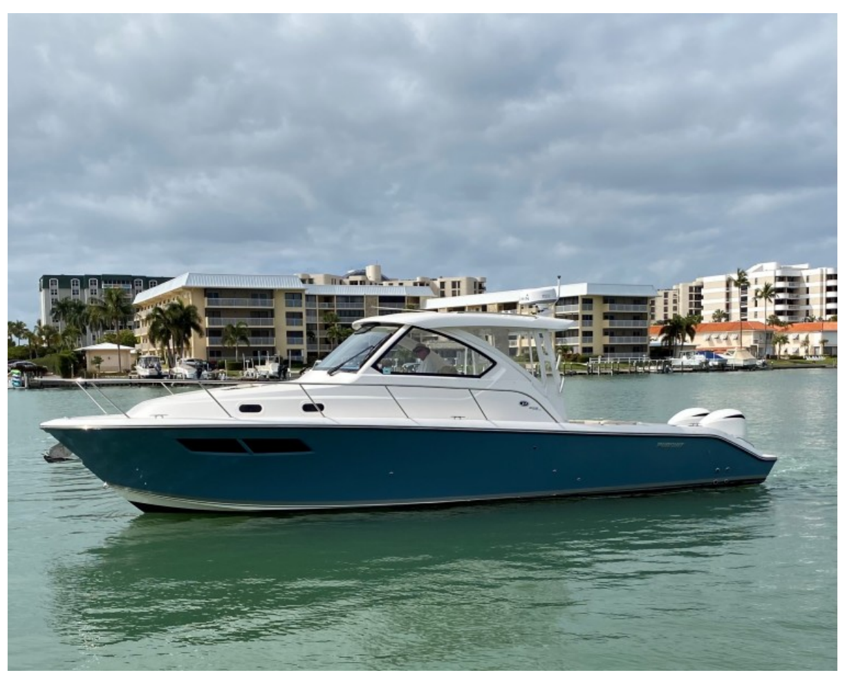
35 Pursuit Profile Port 2018 Pursuit 35 O.S. Profile Port