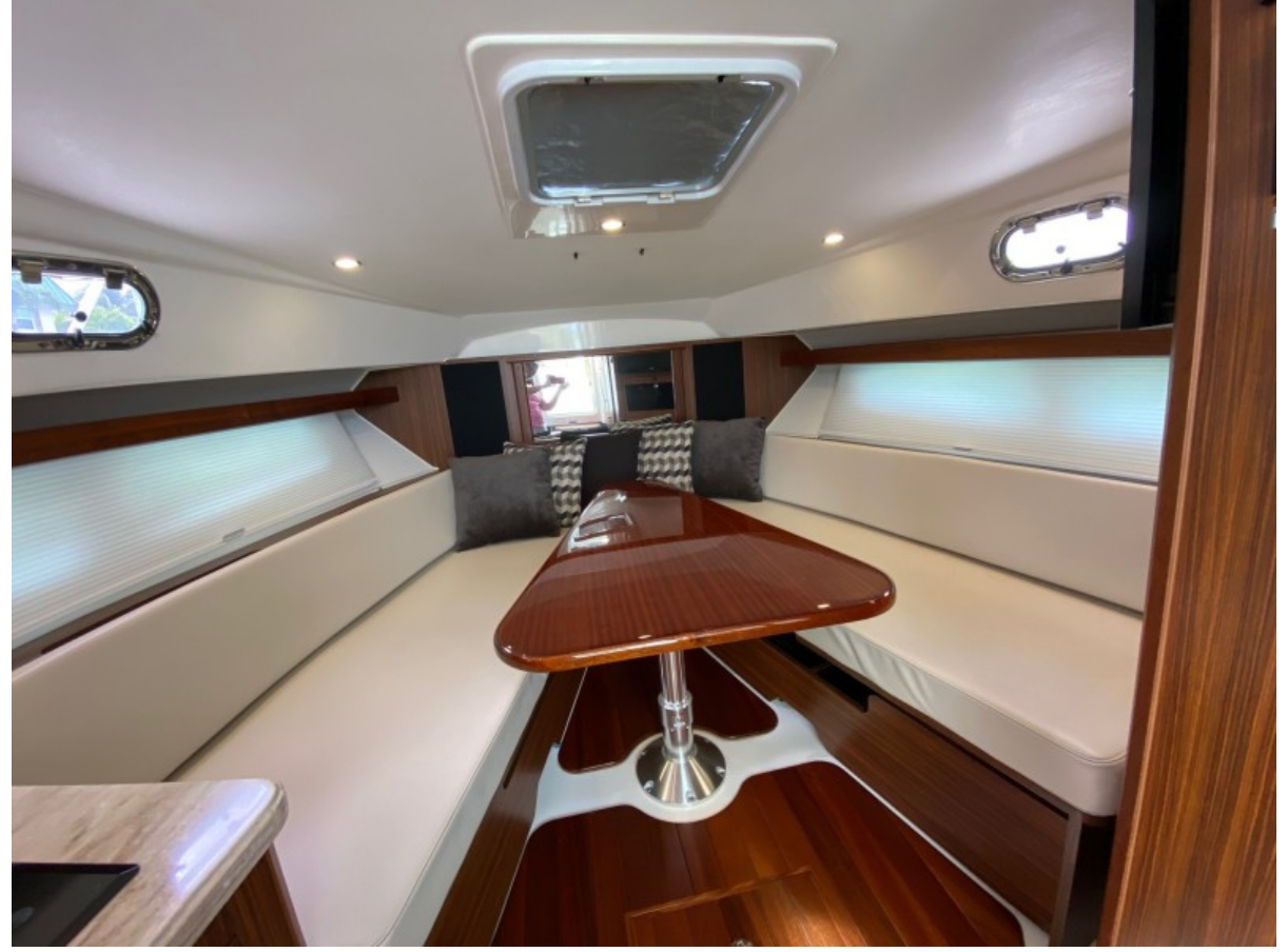
35 Pursuit Dinette Lounge 2018 Pursuit 35 O.S. Dinette Lounge