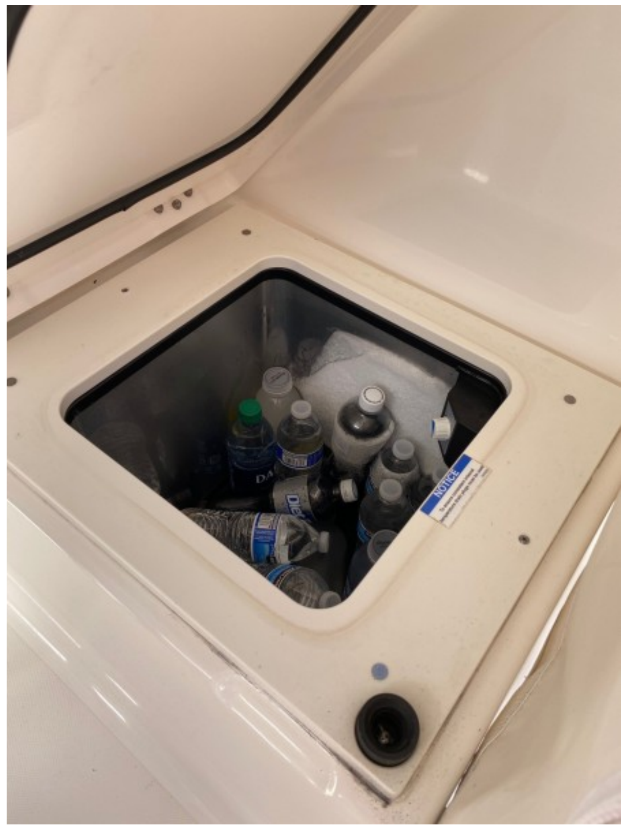
35 Pursuit Helm Cooler 2018 Pursuit 35 O.S. Helm Cooler