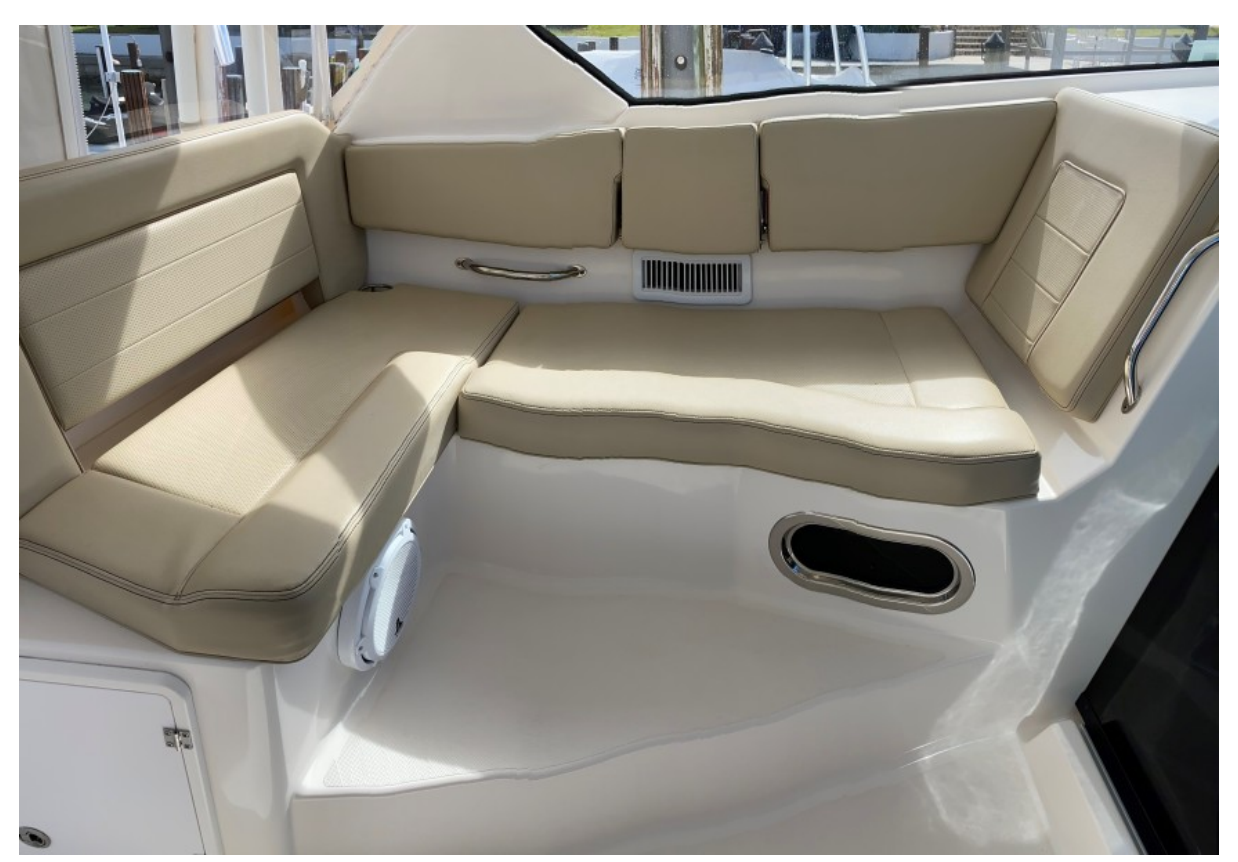
35 Pursuit Helm Lounge 2018 Pursuit 35 O.S. Helm Lounge