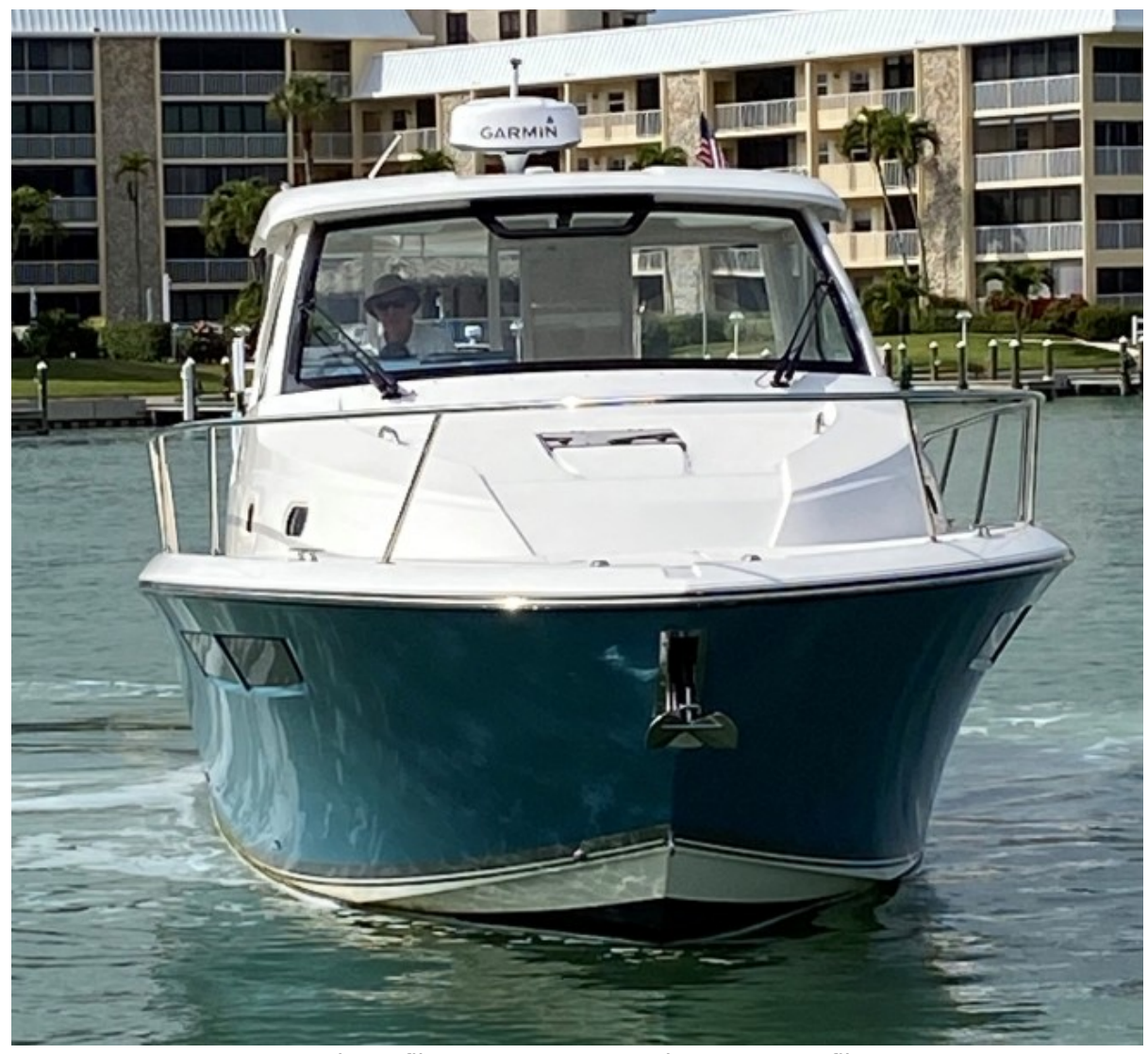
35 Pursuit Profile Bow 2018 Pursuit 35 O.S. Profile Bow