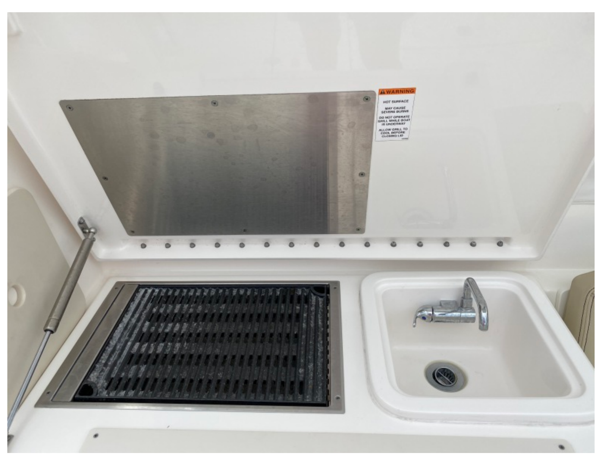
35 Pursuit Cockpit Grill 2018 Pursuit 35 O.S. Grill and Sink