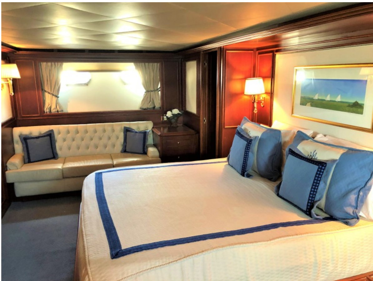
90 Ferretti Master Stateroom Stbd2 2000 Ferretti Navetta 27 Master Stateroom