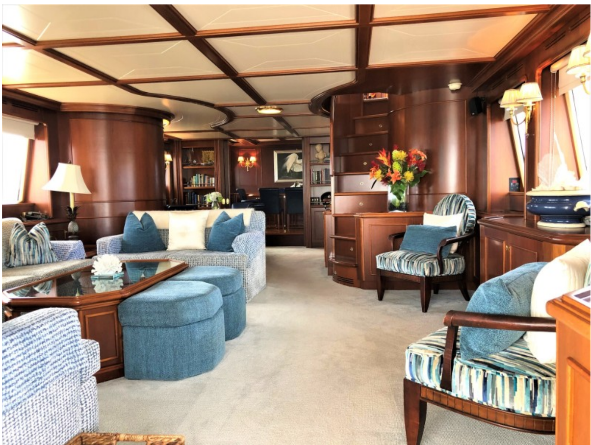
90 Ferretti Salon Fwd 2000 Ferretti Navetta 27 Salon Forward