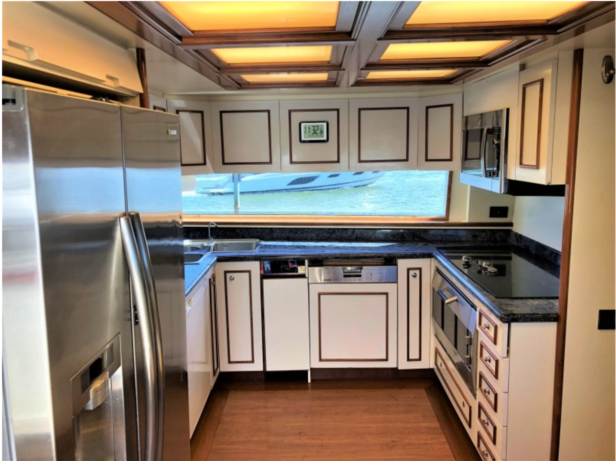
90 Ferretti Galley Port 2000 Ferretti Navetta 27 Galley