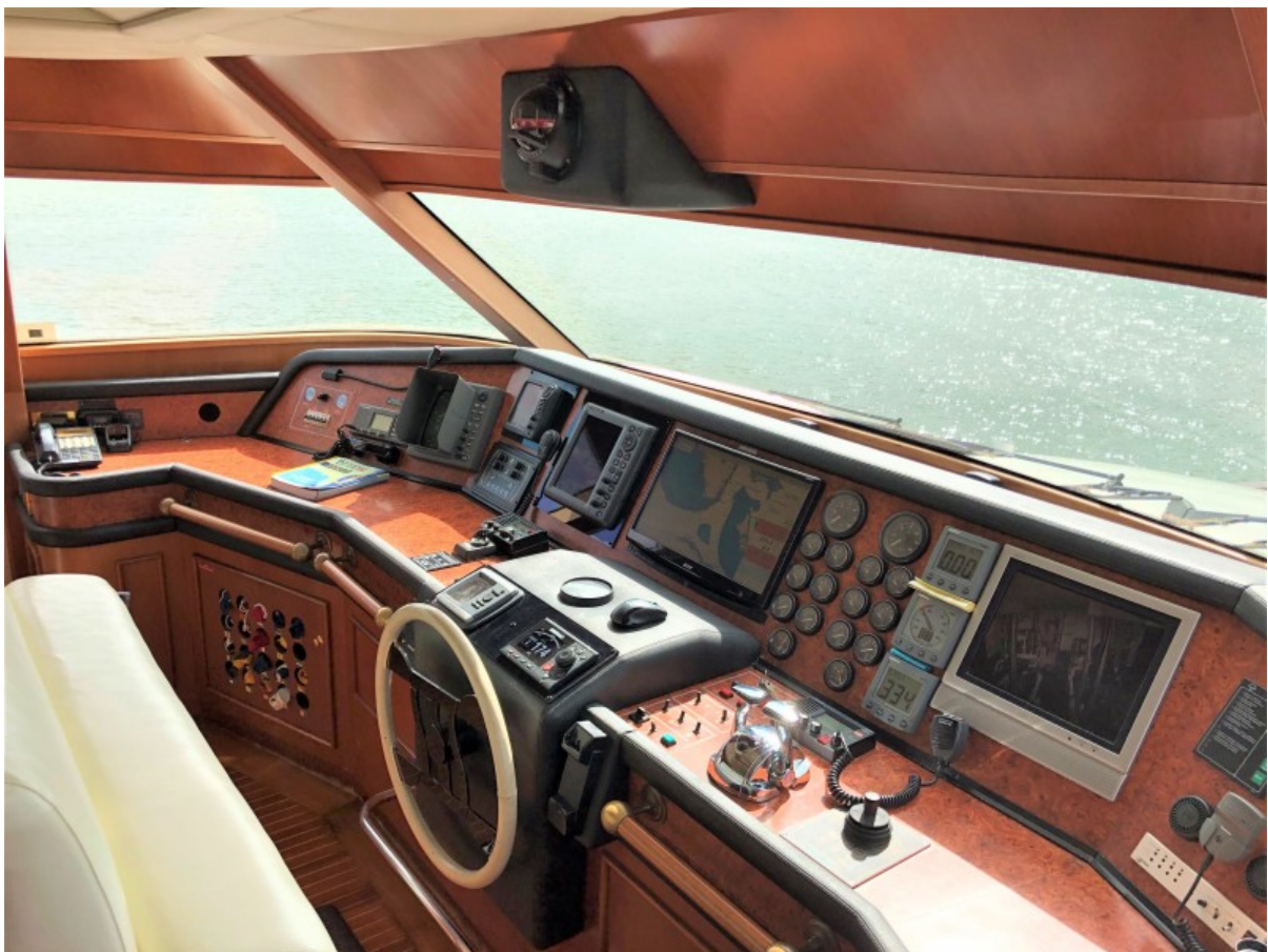
90 Ferretti PH Helm Dash 2000 Ferretti Navetta 27 Helm Dash