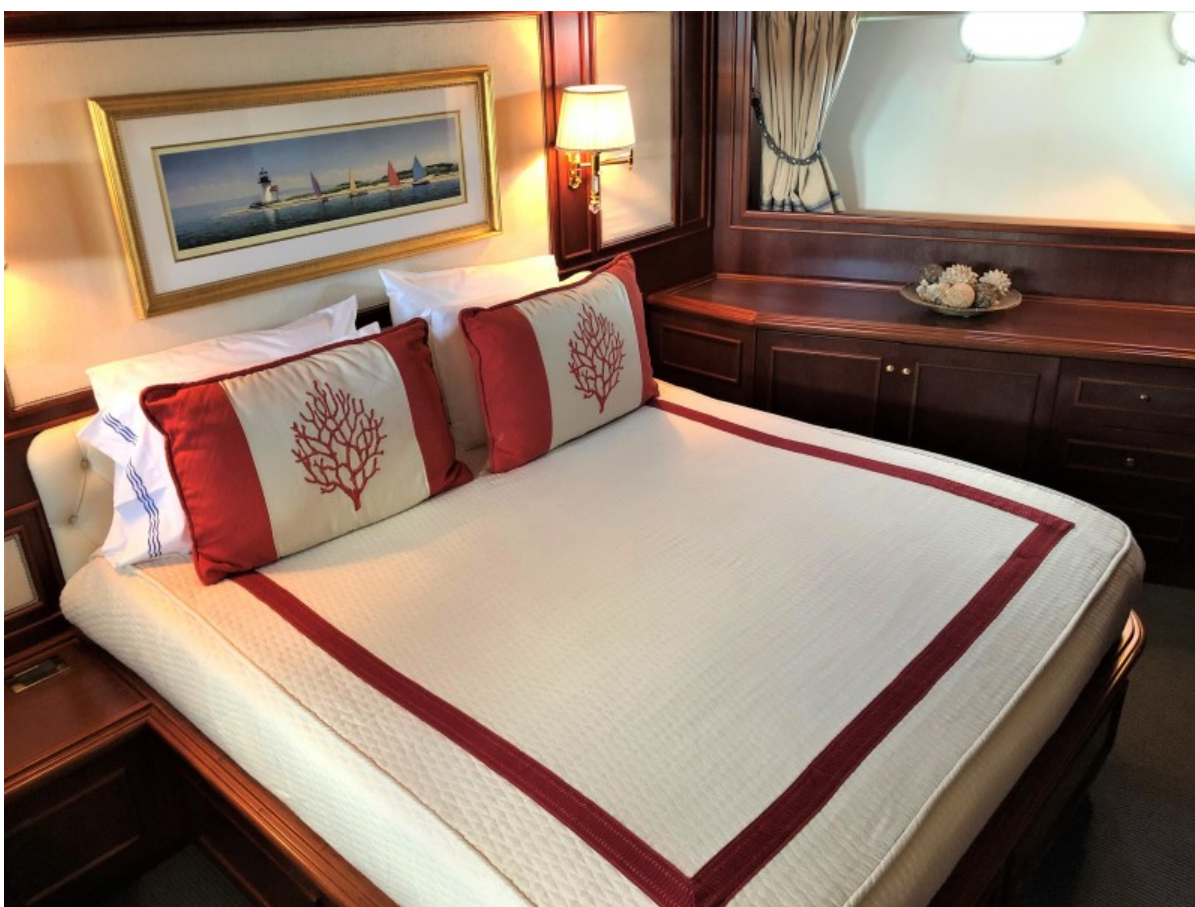
90 Ferretti VIP Stbd 2000 Ferretti Navetta 27 V.I.P. Stateroom