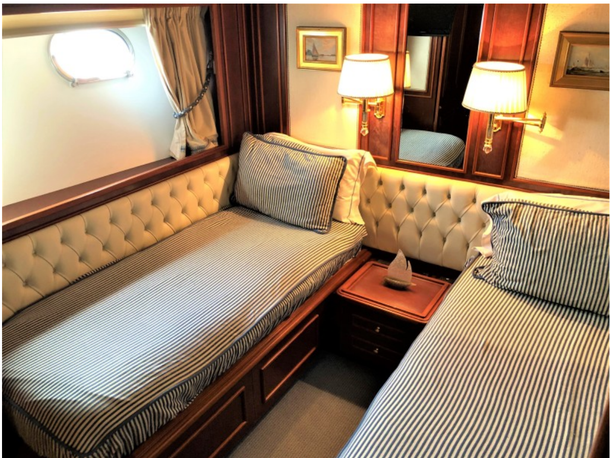
90 Ferretti Guest SR Starboard 2000 Ferretti Navetta 27 Guest Stateroom