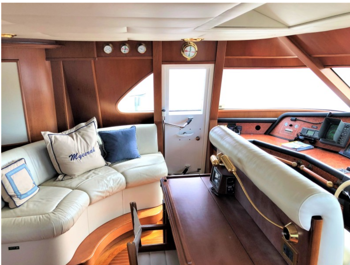
90 Ferretti Pilothouse Port Lounge 2000 Ferretti Navetta 27 Pilothouse Lounge