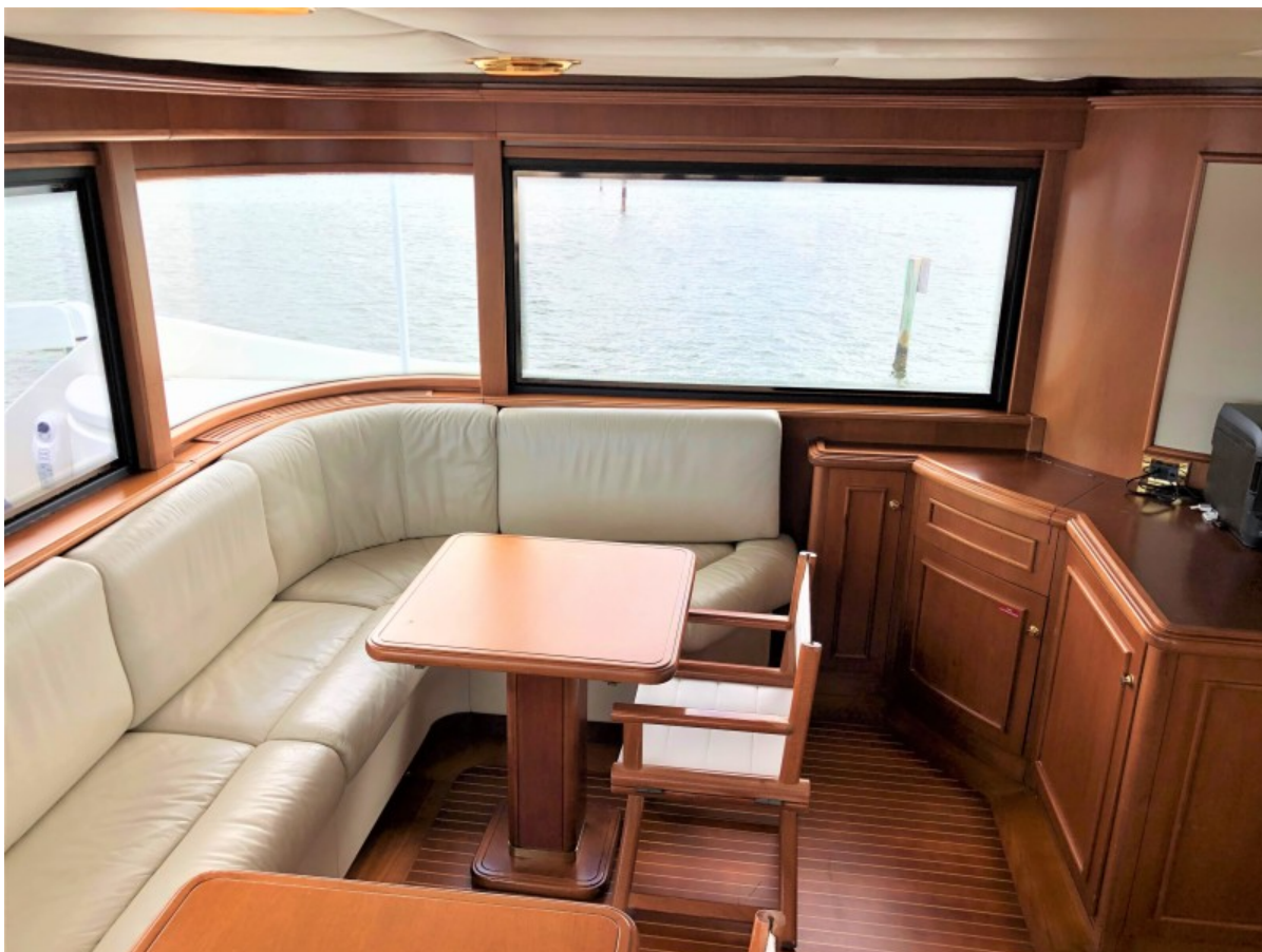
90 Ferretti Panoramic Lounge Port2 2000 Ferretti Navetta 27 Panoramic Lounge Port