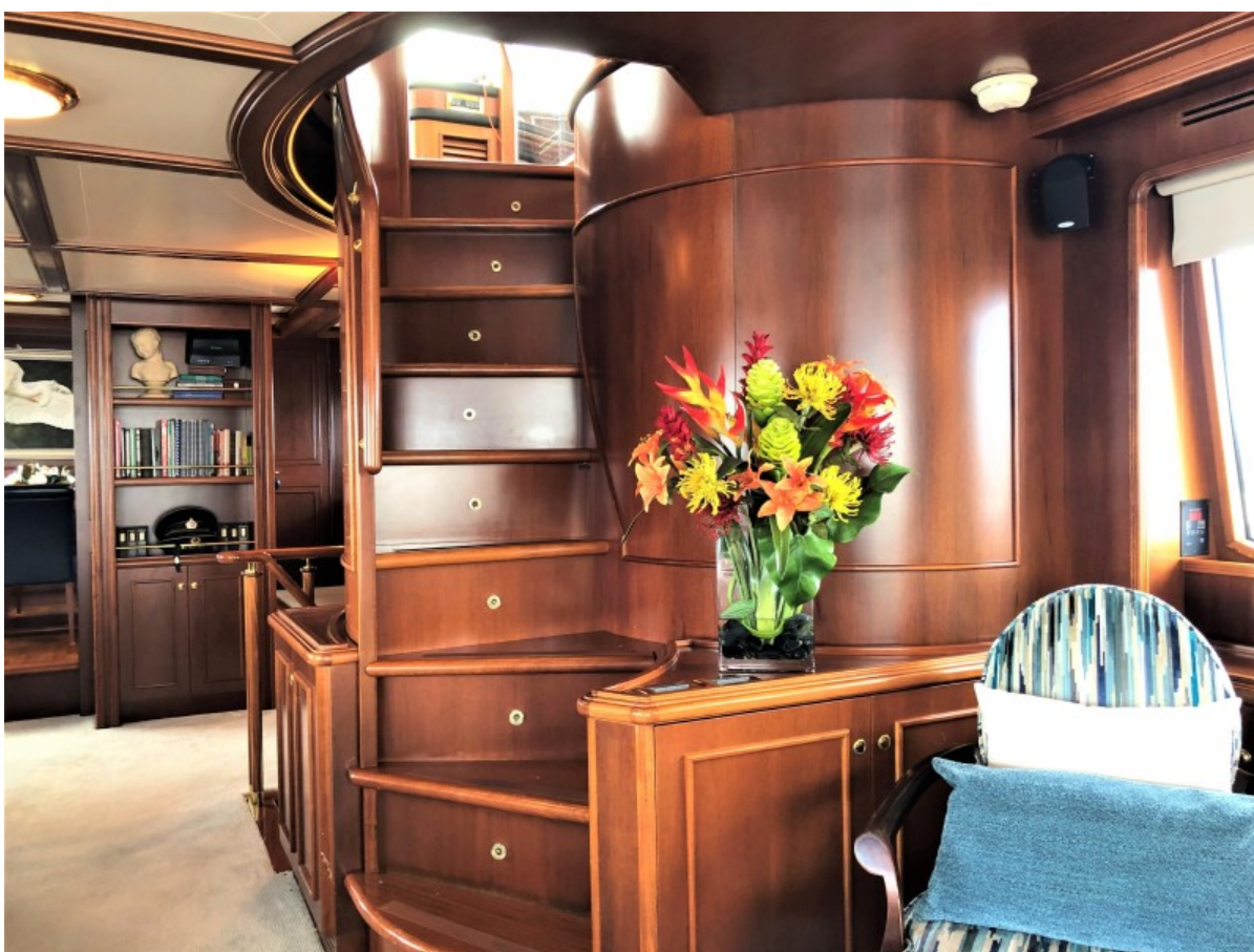
90 Ferretti Pilothouse Stairs 2000 Ferretti Navetta 27 Stairs to Pilothouse