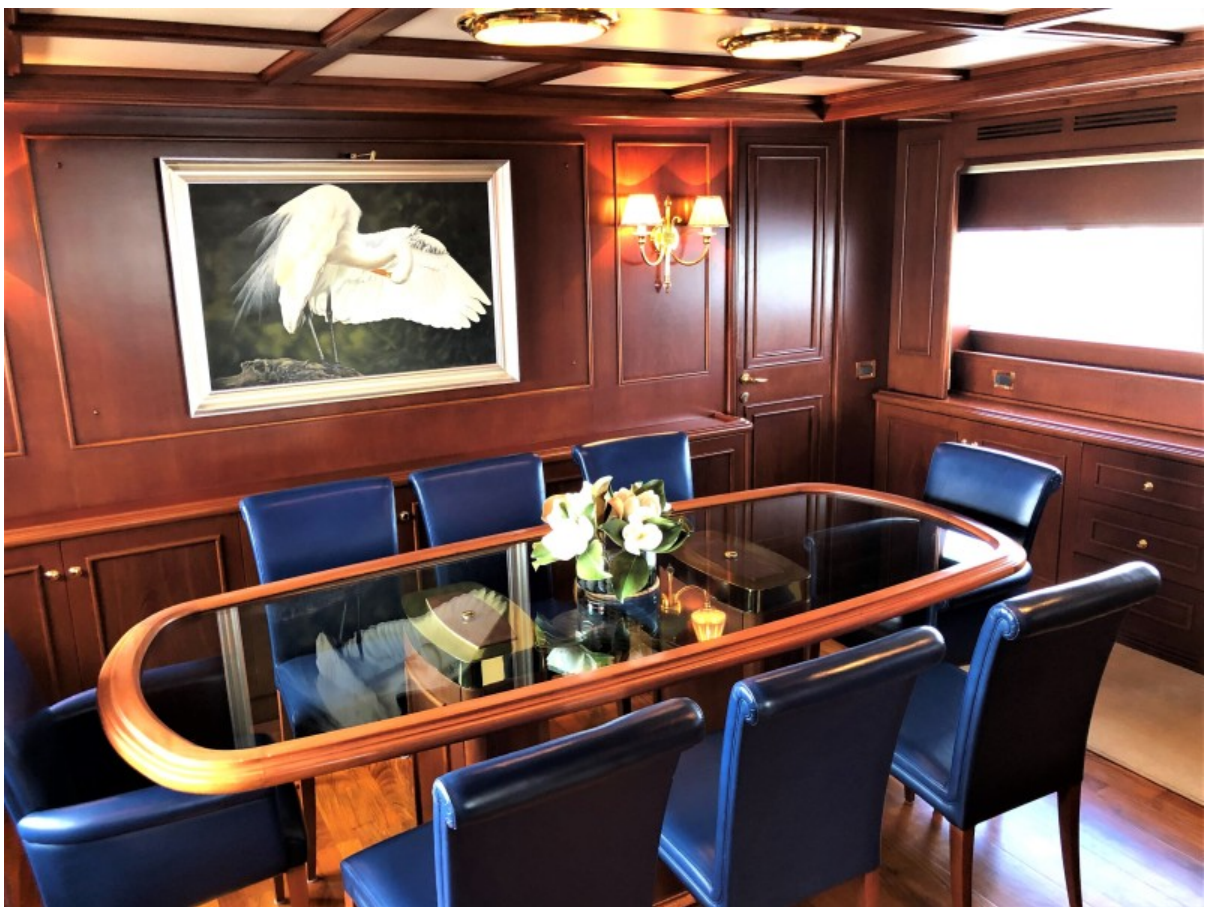
90 Ferretti Dining Fwd Stbd 2000 Ferretti Navetta 27 Dining