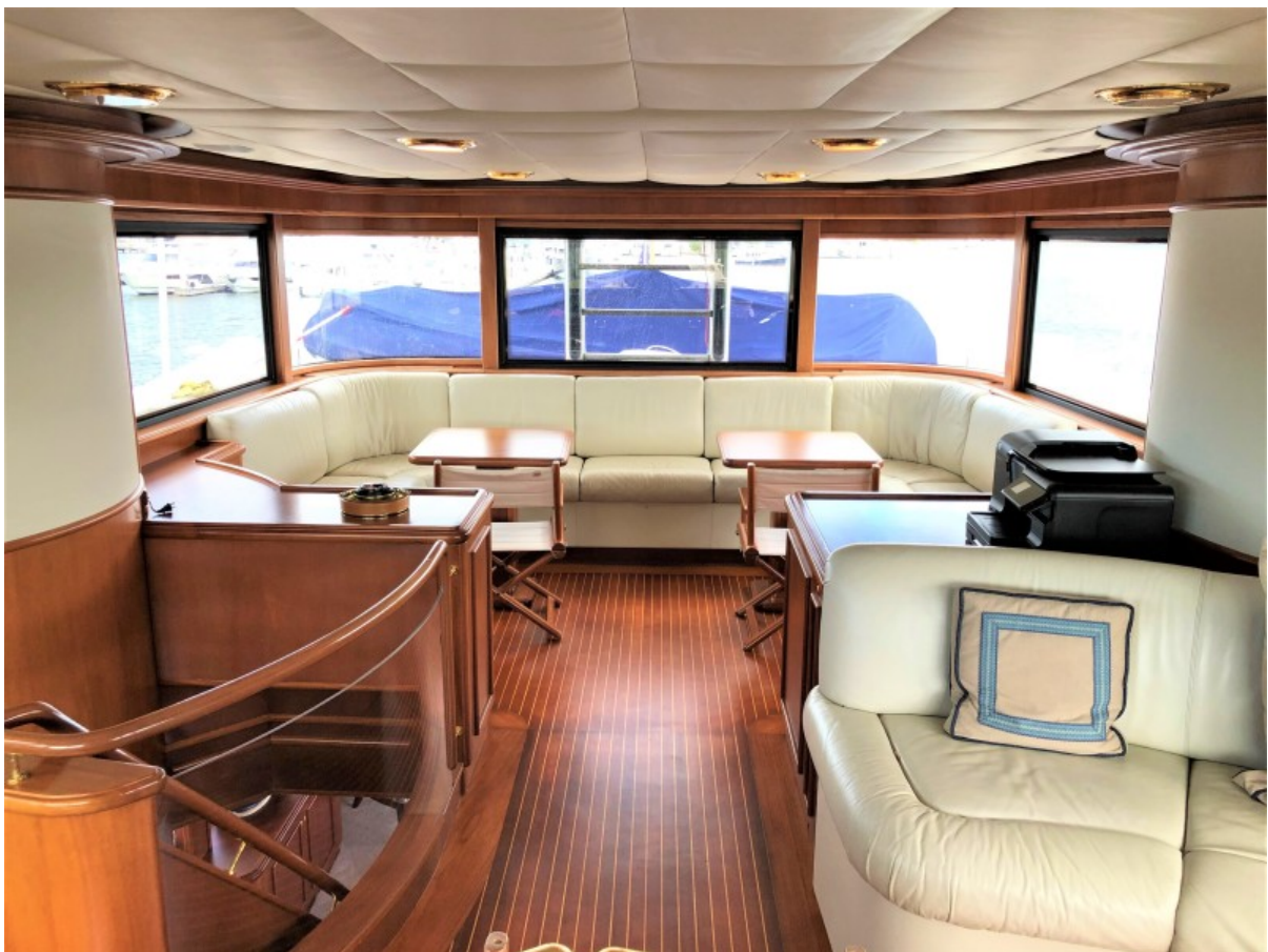
90 Ferretti Panoramic Lounge 2000 Ferretti Navetta 27 Panoramic Lounge