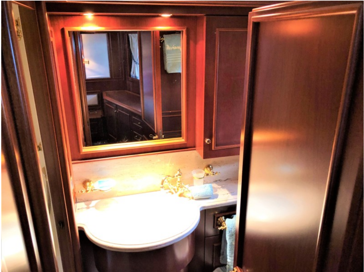
90 Ferretti VIP Bath 2000 Ferretti Navetta 27 V.I.P. Bathroom