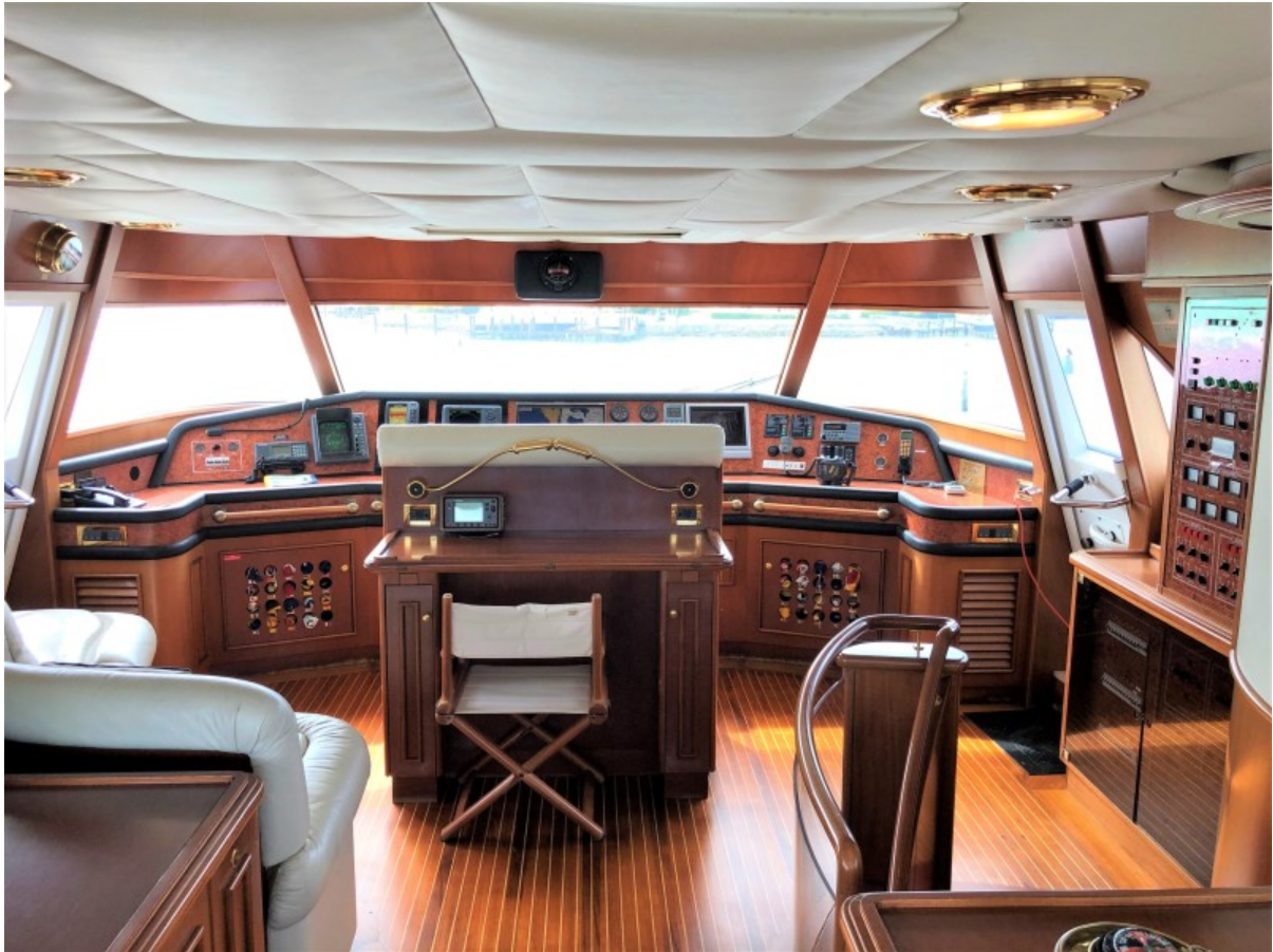
90 Ferretti PH Helm Deck 2000 Ferretti Navetta 27 Helm Deck