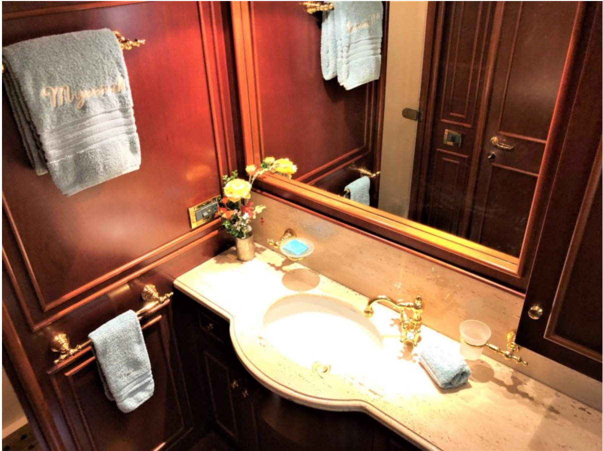
90 Ferretti Guest SR Stbd Bath Sink 2000 Ferretti Navetta 27 Guest Stateroom Bath