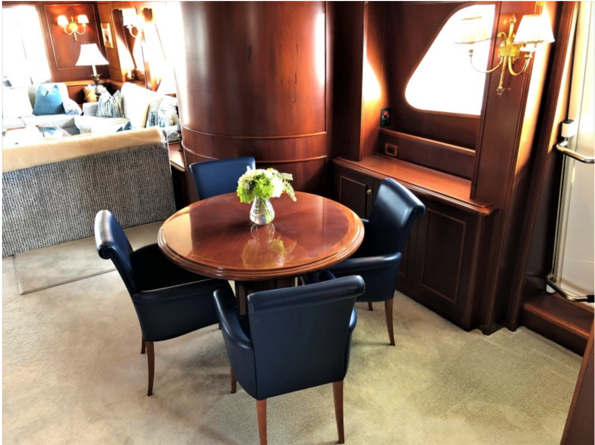
90 Ferretti Salon Lobby 2000 Ferretti Navetta 27 Salon Lobby