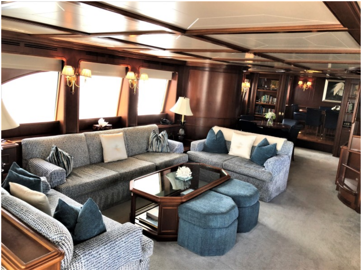
90 Ferretti Salon Fwd Port 2000 Ferretti Navetta 27 Salon Forward Port