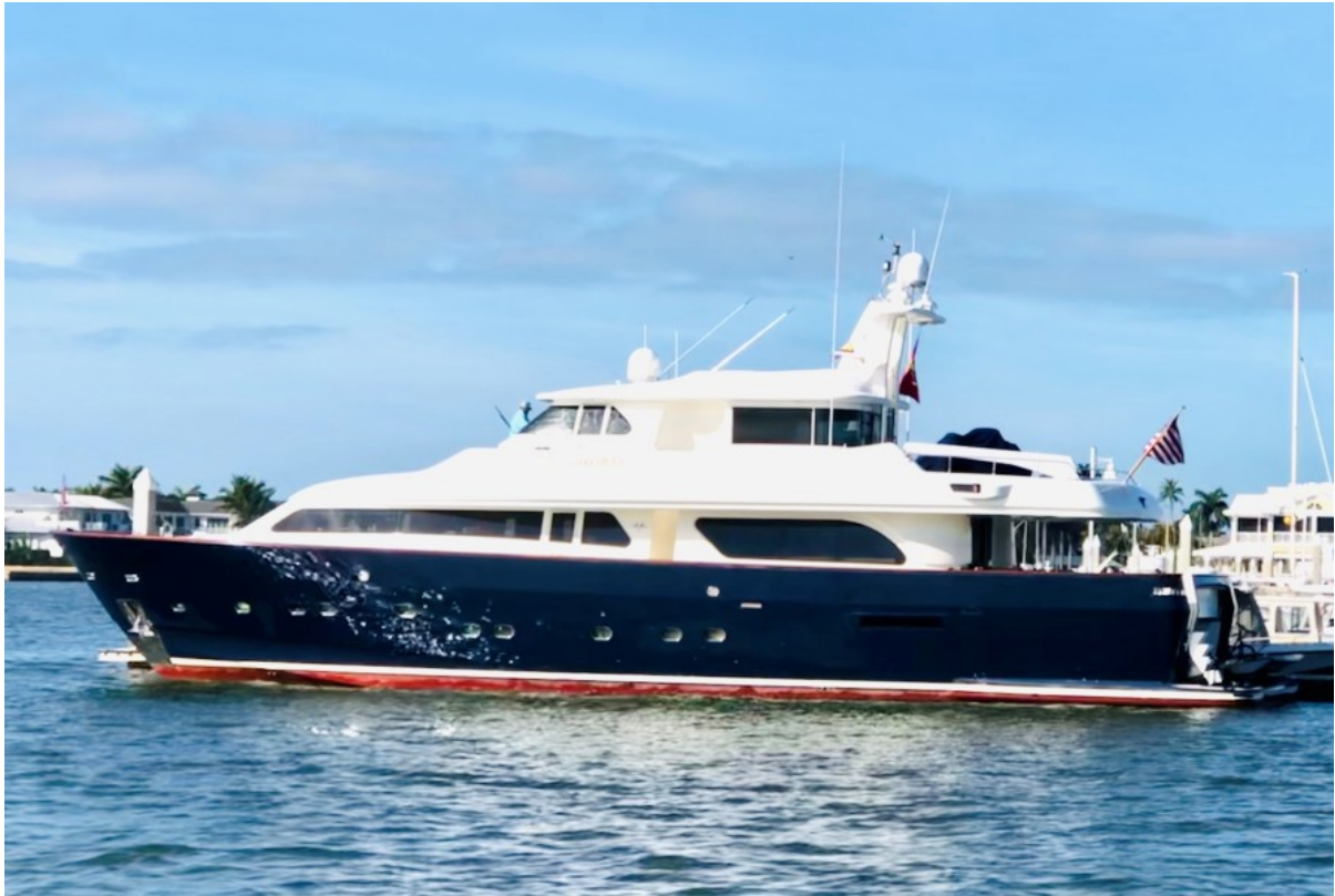
2000 Ferretti 90' Custom Line 2000 Ferretti Navetta 27 Profile