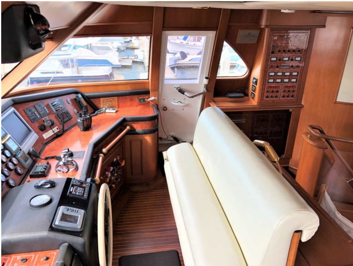
90 Ferretti Pilothouse Stbd Wing Door 2000 Ferretti Navetta 27 Pilothouse Starboard Wing Door