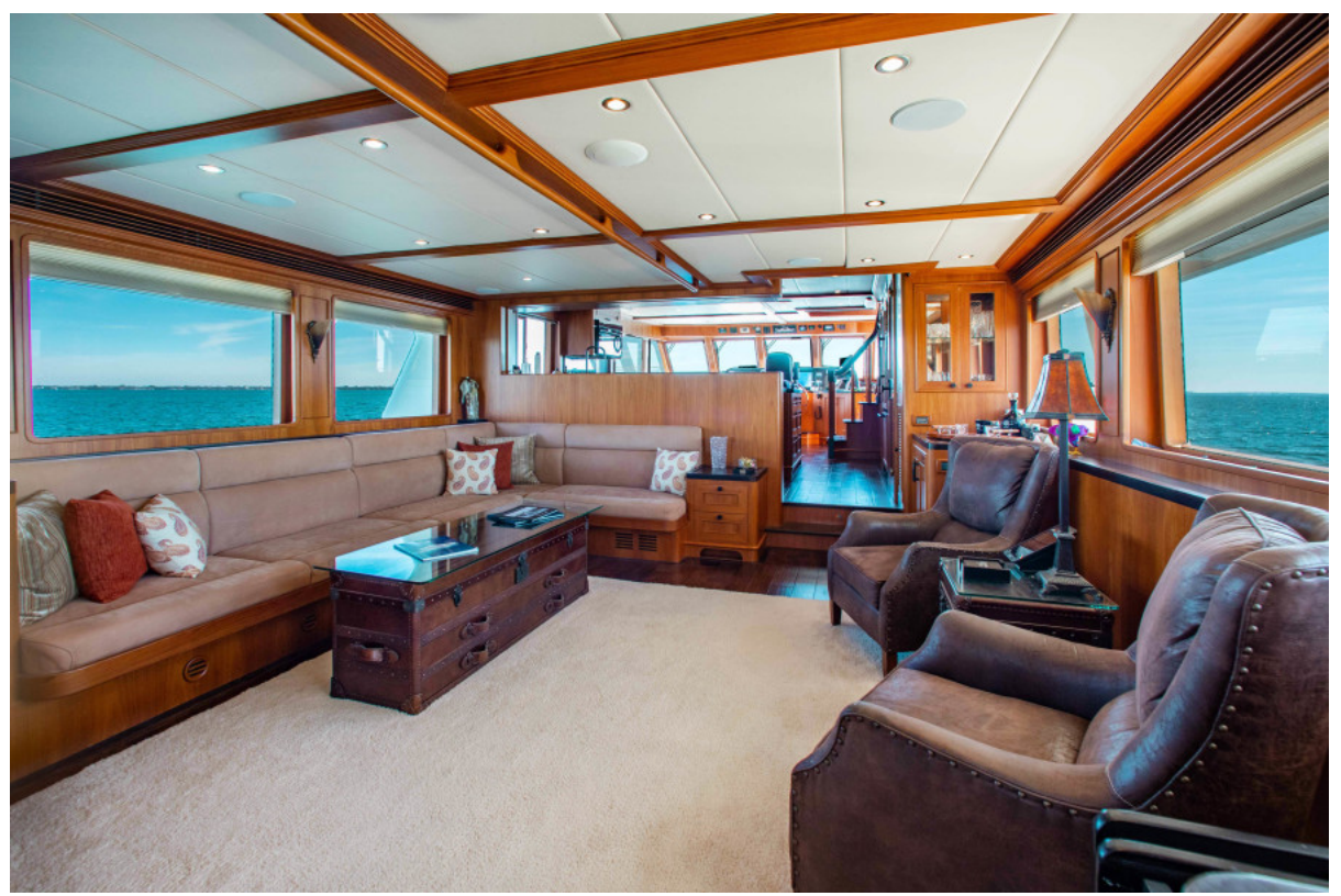
2015 Outer Reef Yachts 82 CPMY - Barbara Sue II - Salon