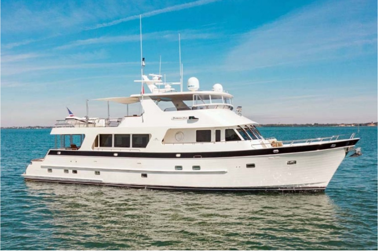
2015 Outer Reef Yachts 82 CPMY - Barbara Sue II