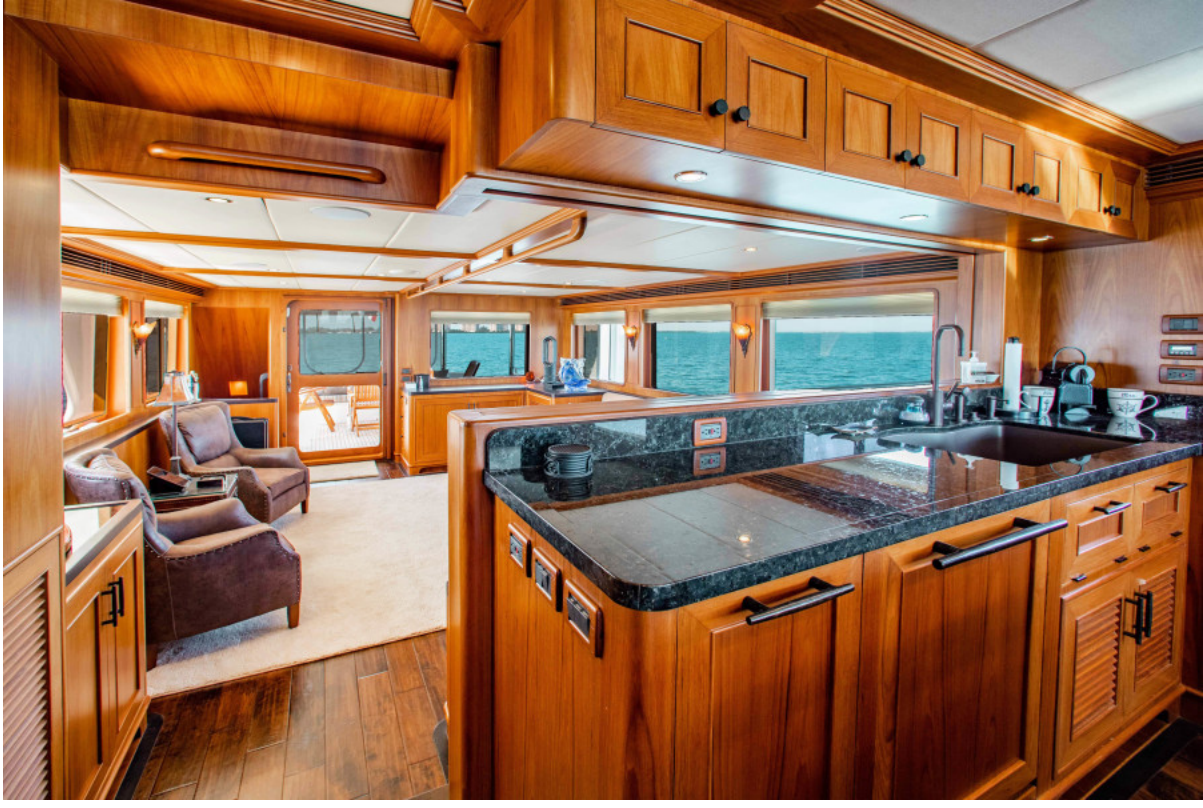
2015 Outer Reef Yachts 82 CPMY - Barbara Sue II - Salon / Galley