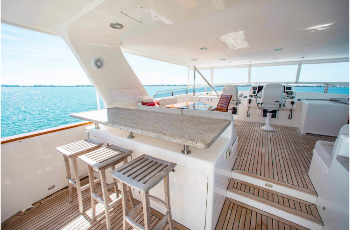
2015 Outer Reef Yachts 82 CPMY - Barbara Sue II - Flybridge