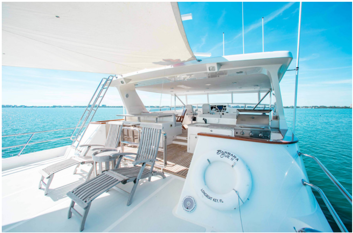
2015 Outer Reef Yachts 82 CPMY - Barbara Sue II - Flybridge