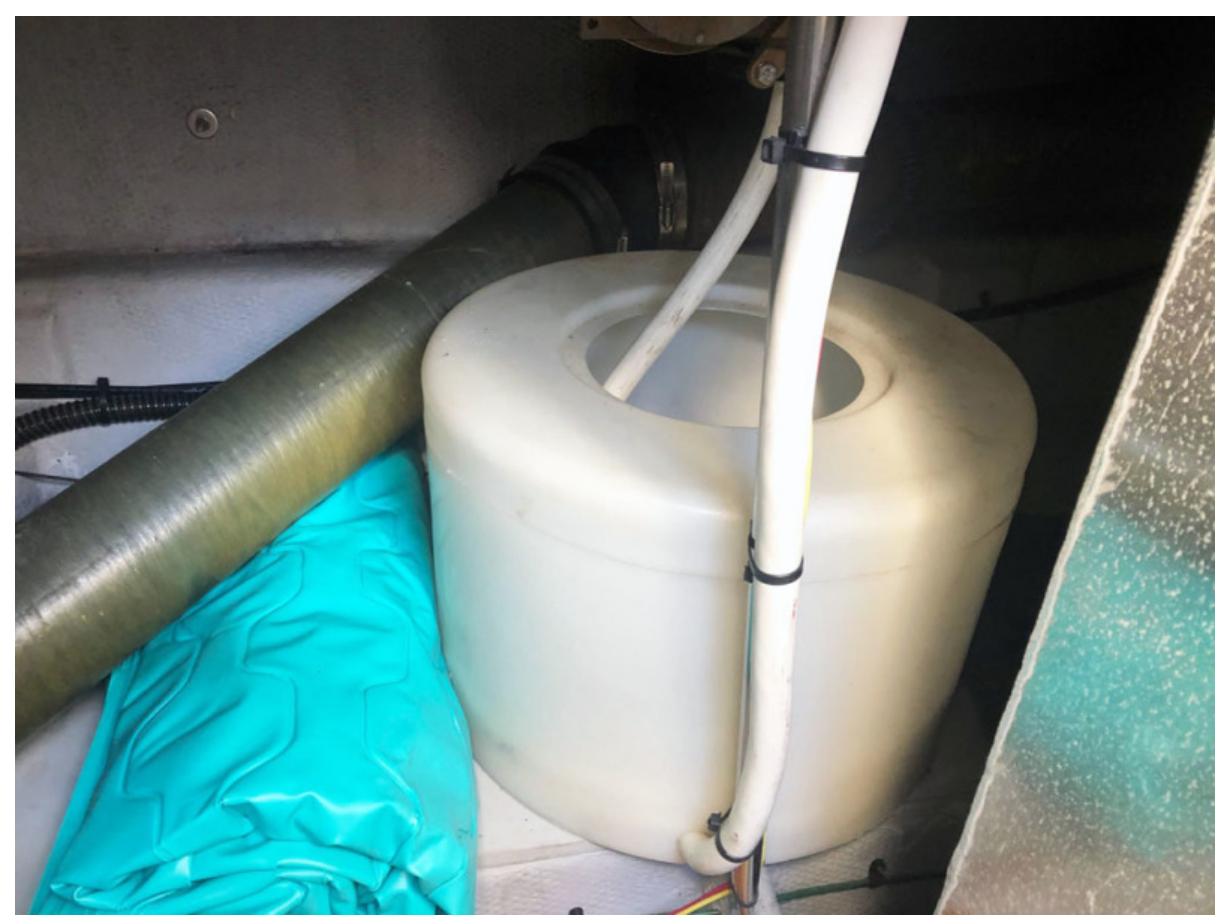
Glendenning Shore Cord Retriever