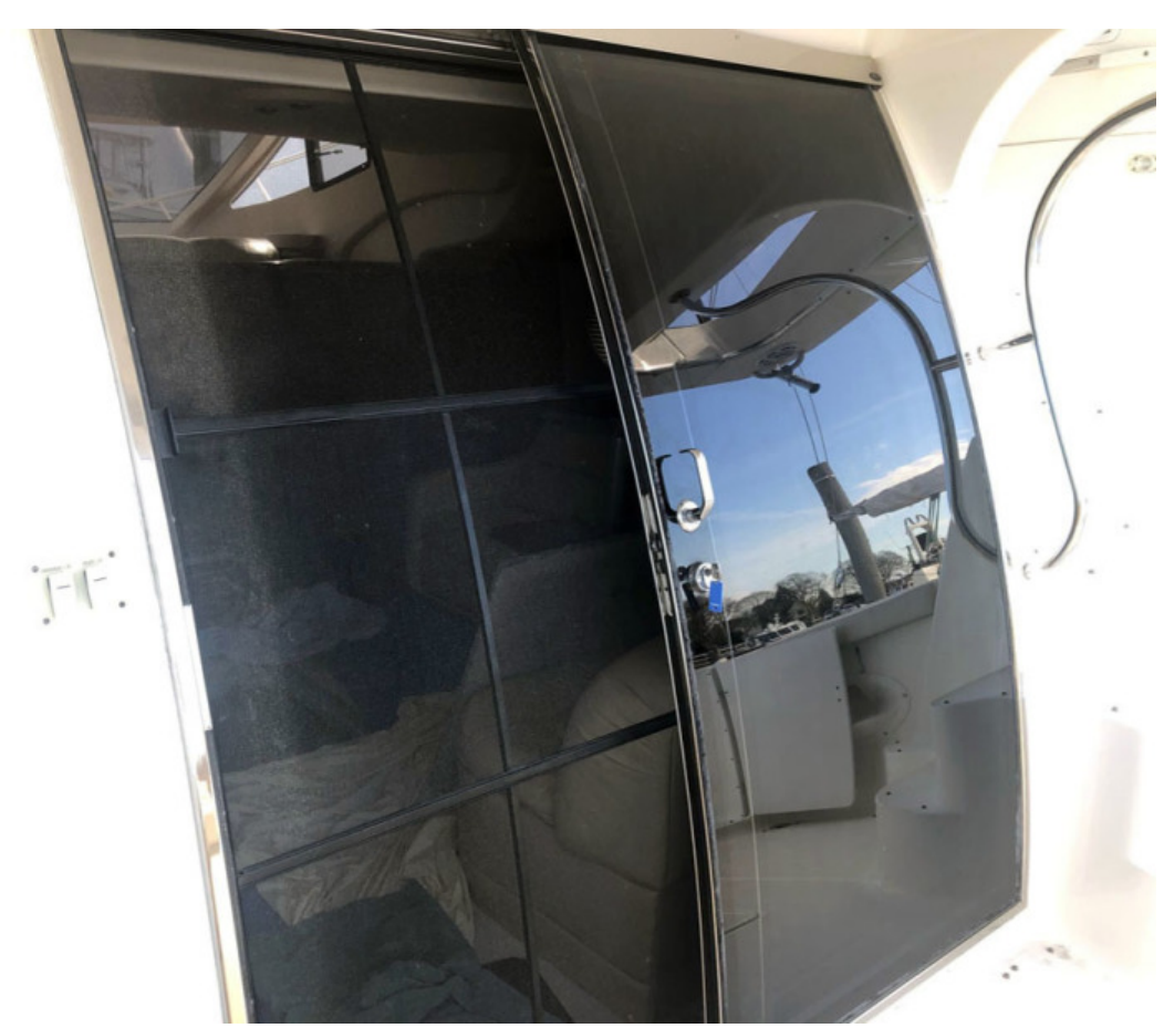
Slider To Cabin