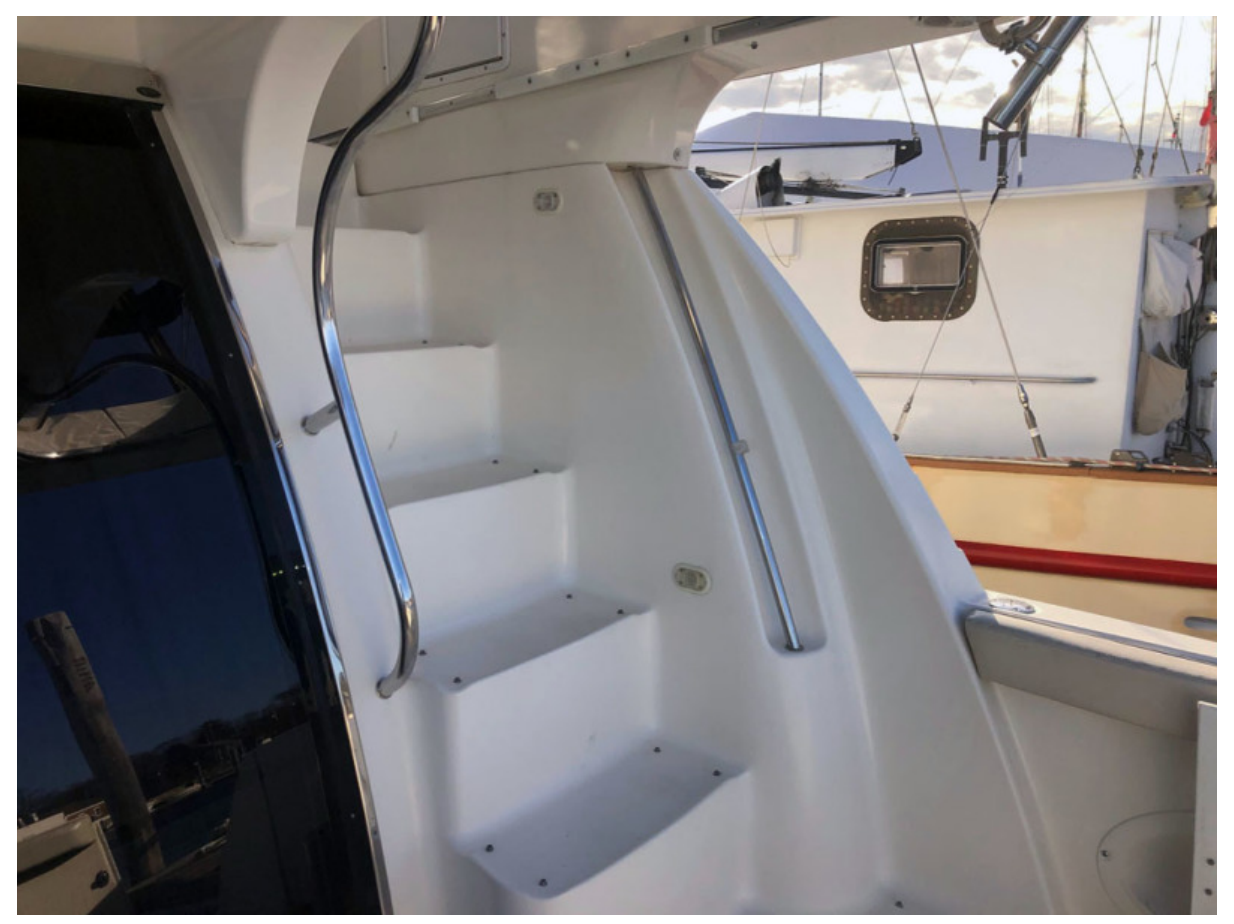
Stairs To Bridge