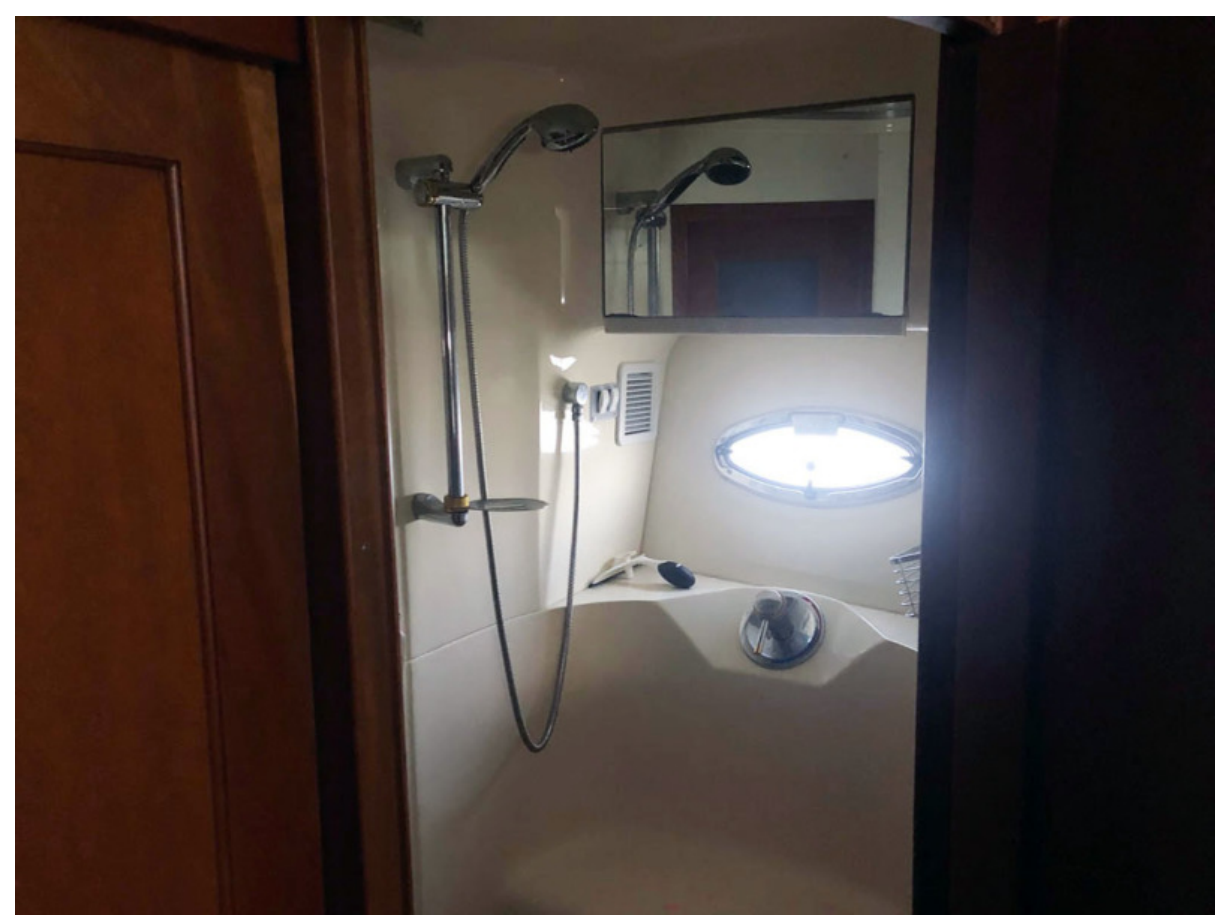
Portside Head Area