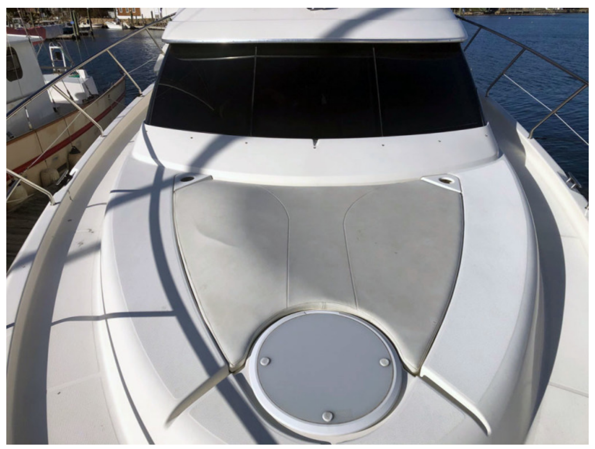
Sun Pad - Foredeck