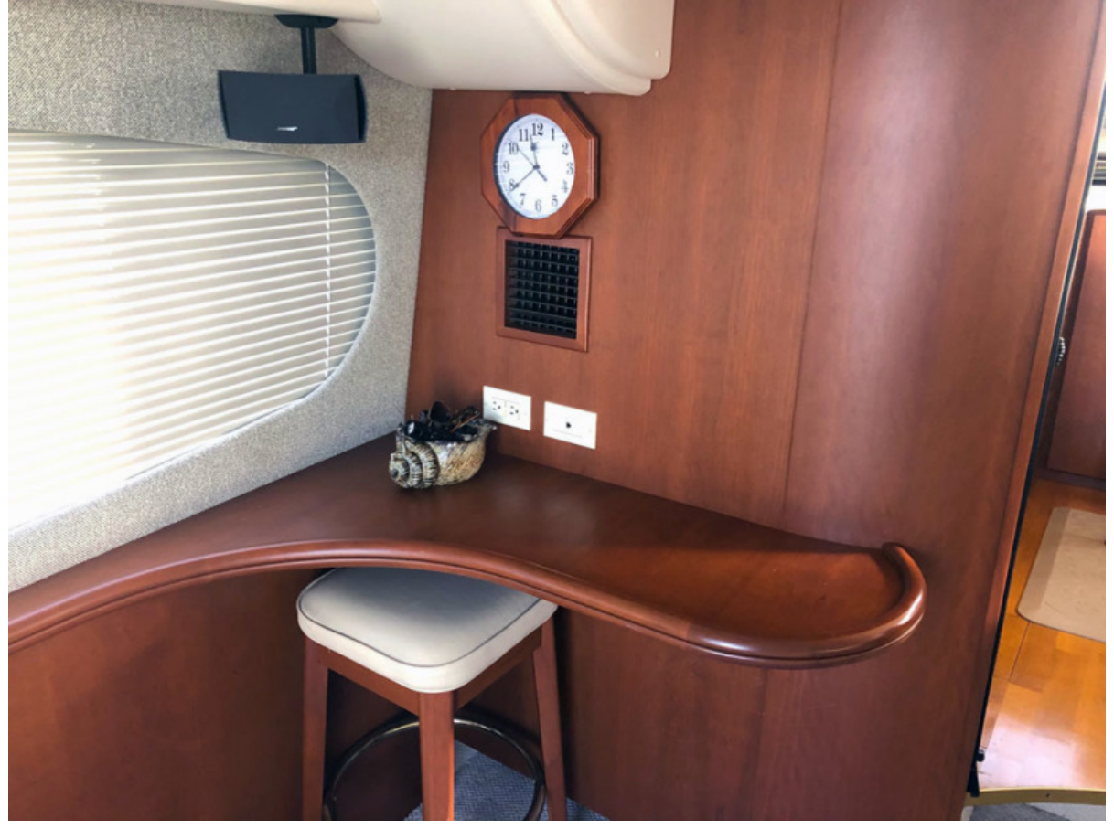
Salon Desk Area