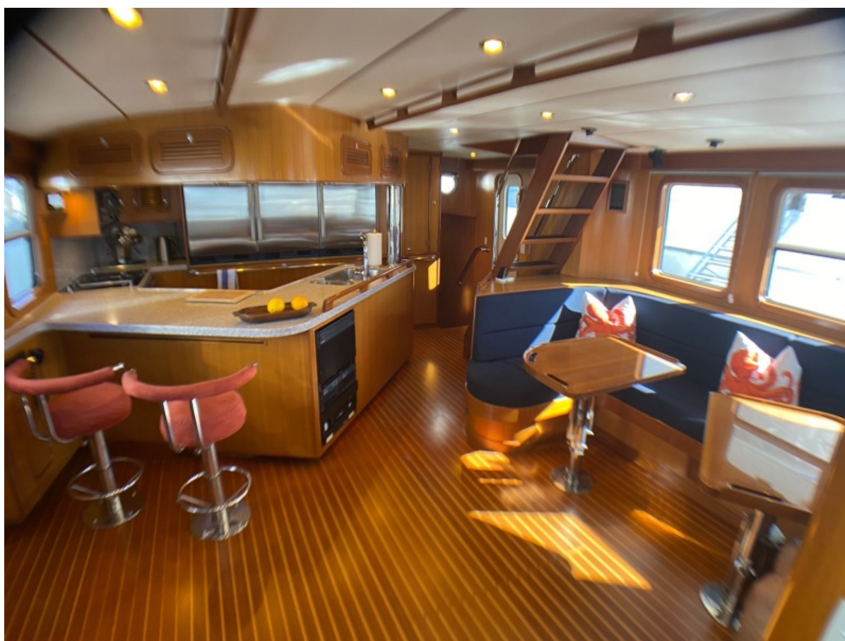
Salon and Galley