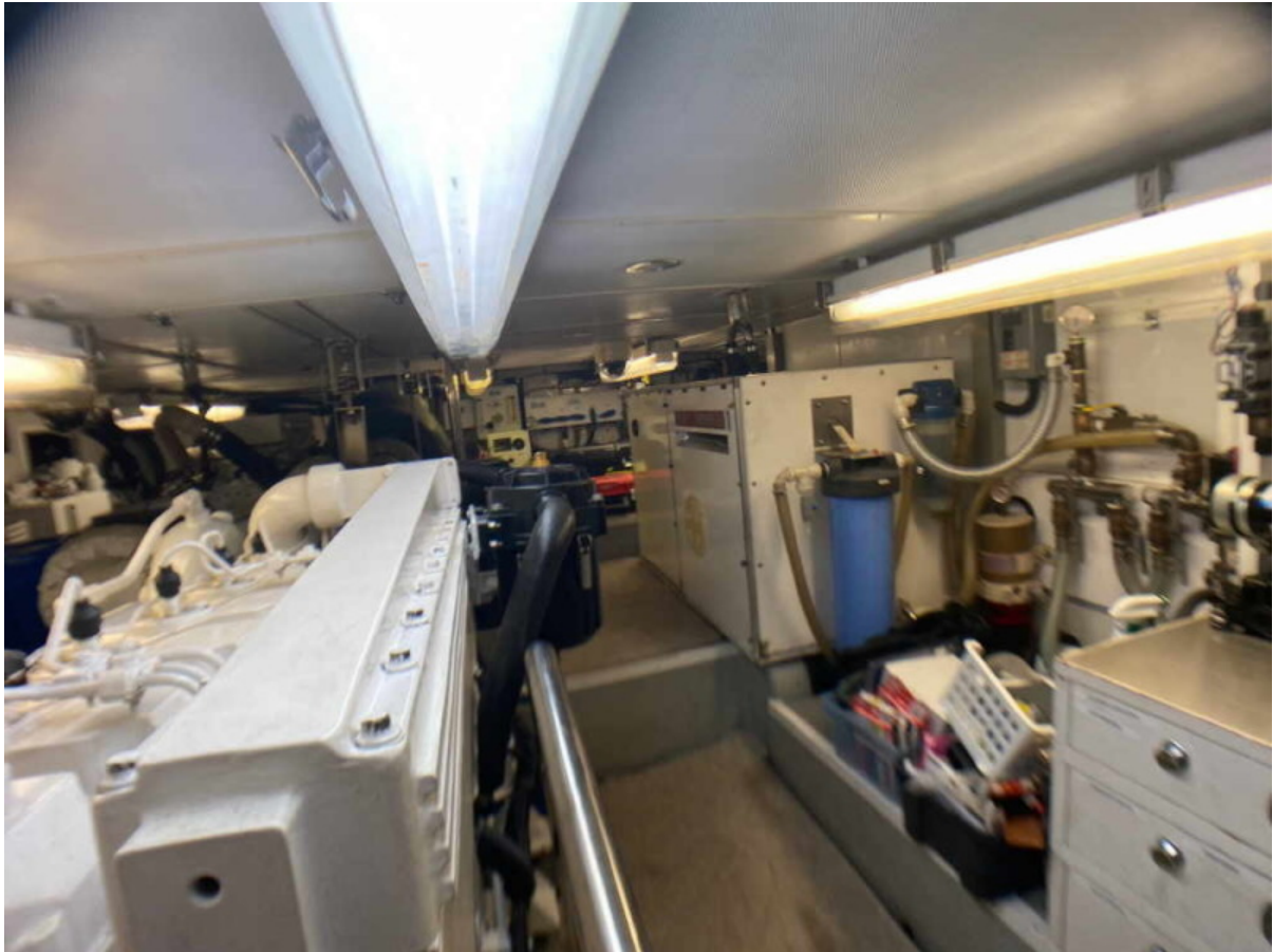
Engine Room 2