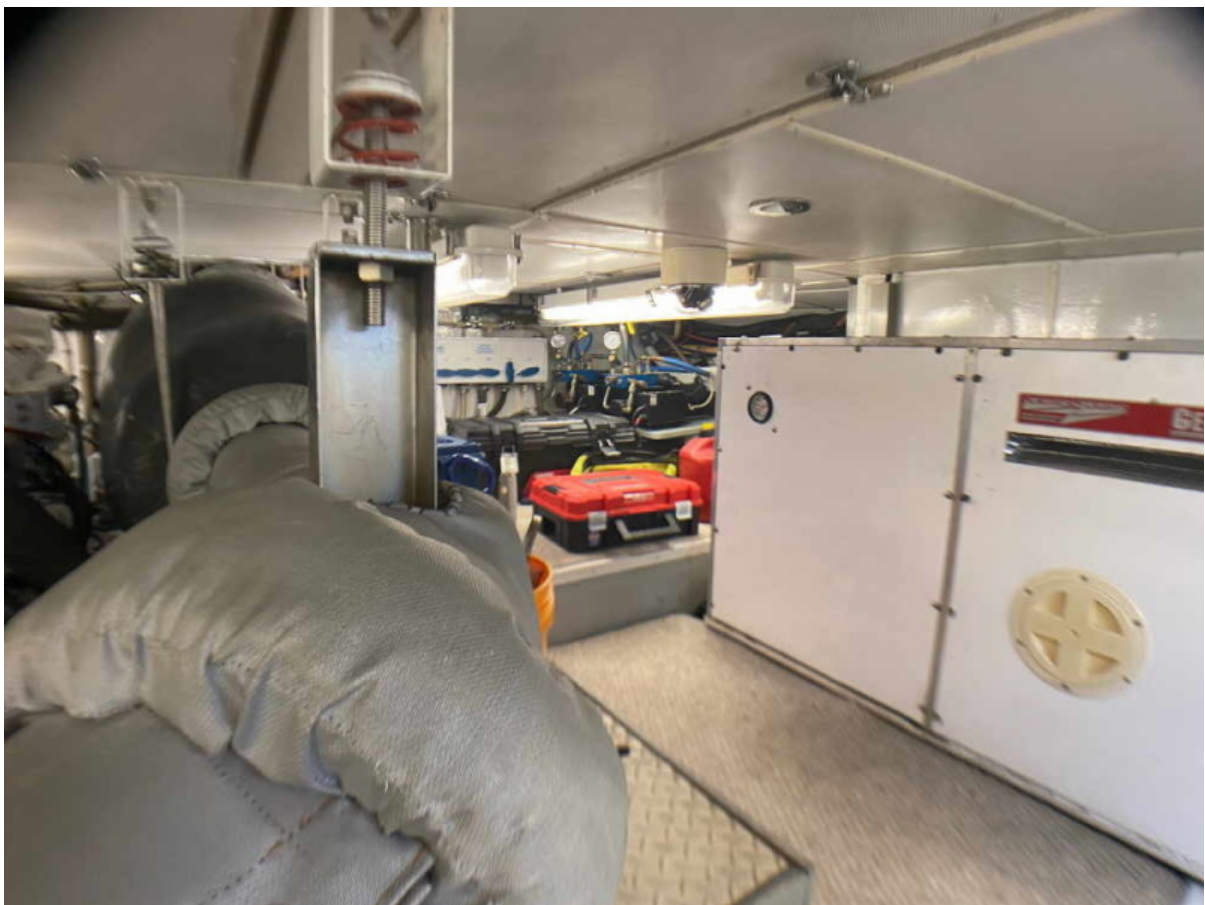
Engine Room 3