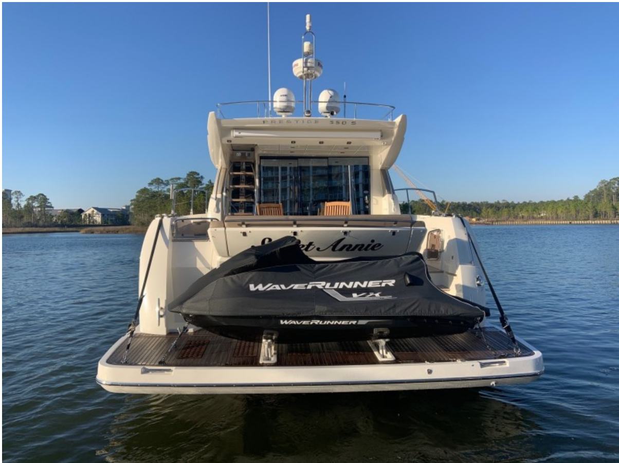
2014 58 Prestige 550 Sweet Annie Stern (2)