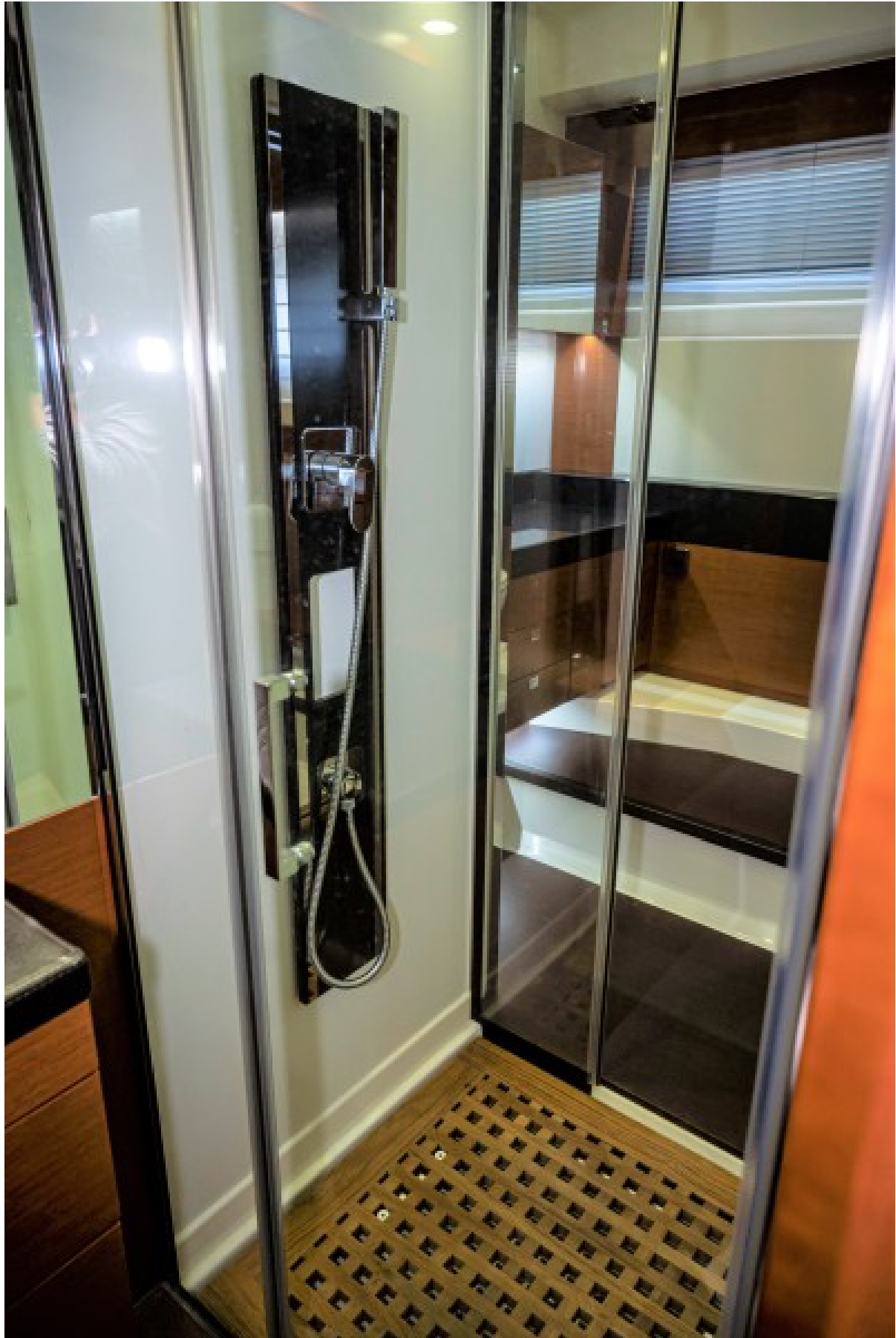
2014 58 Prestige 550 Sweet Annie Master Head Shower (1)