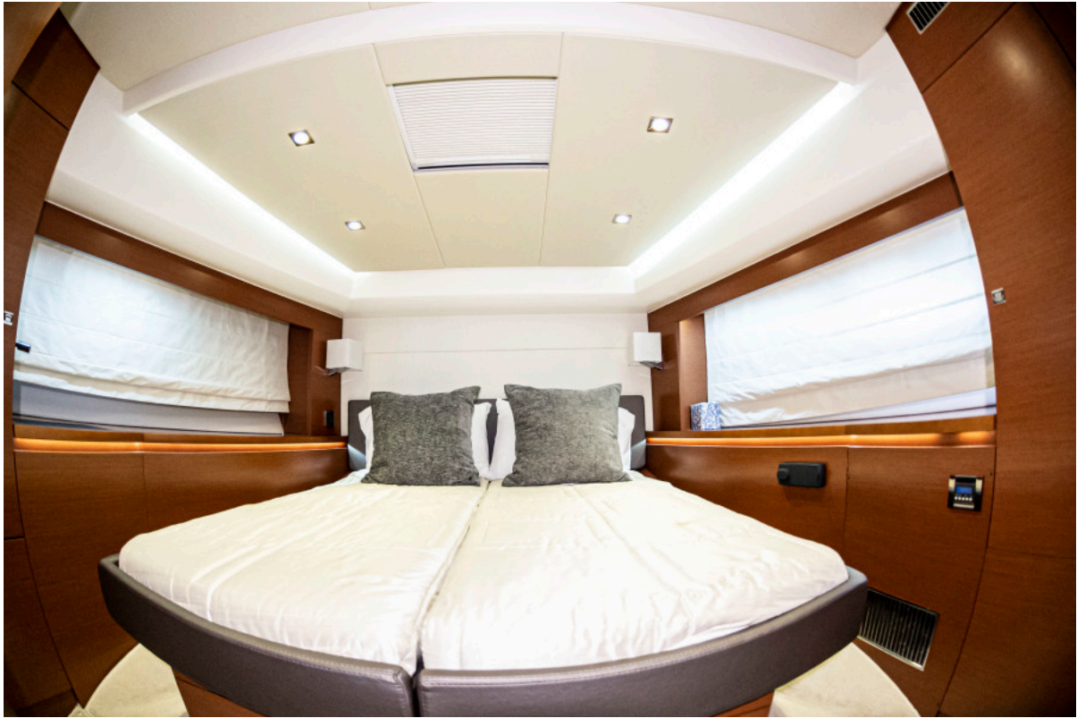
2014 58 Prestige 550 Sweet Annie VIP Guest Stateroom (2)