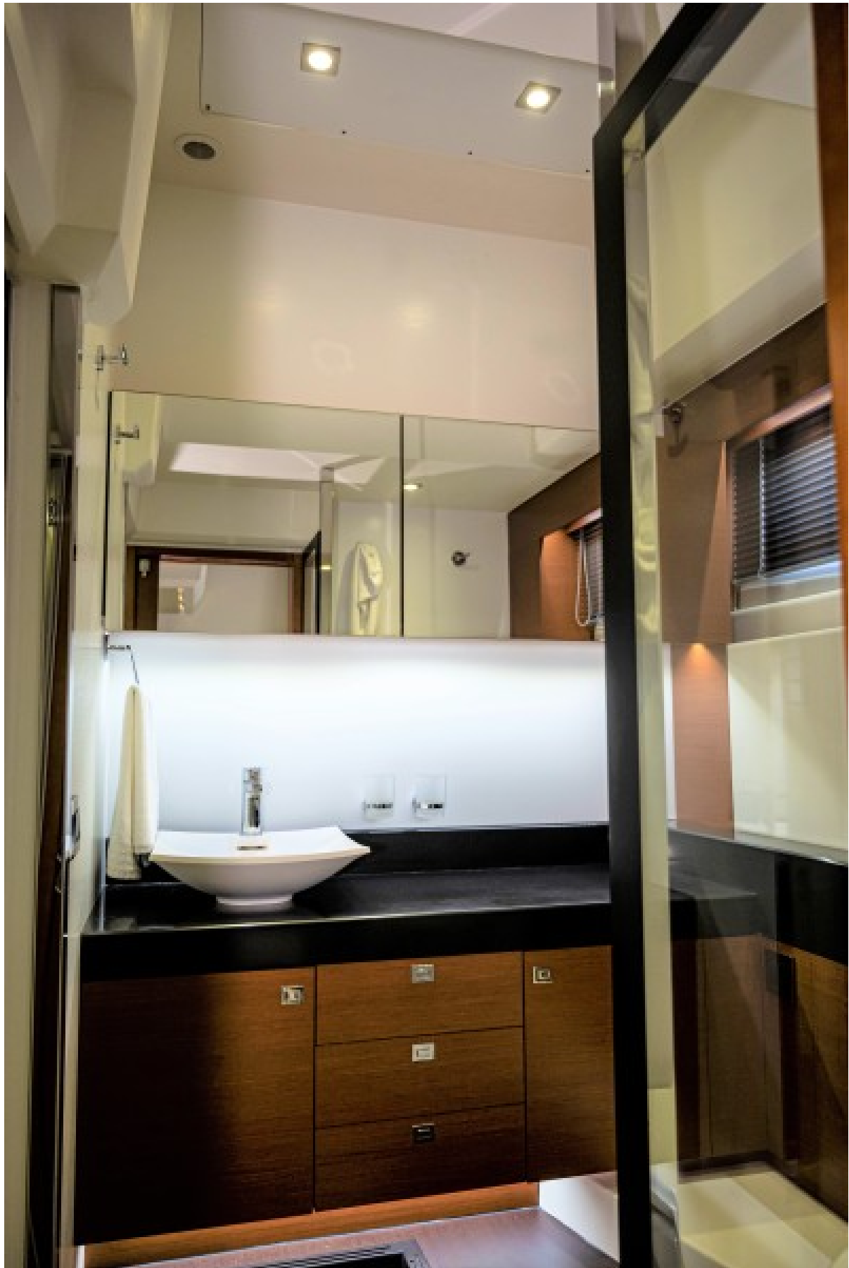
2014 58 Prestige 550 Sweet Annie Master Head (3)