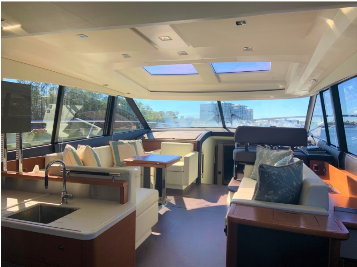
2014 58 Prestige 550 Sweet Annie Salon (1)