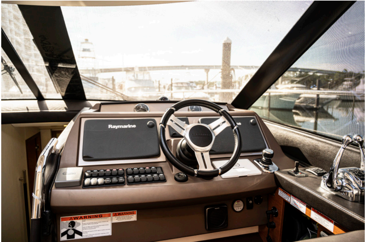
2014 58 Prestige 550 Sweet Annie Helm Station