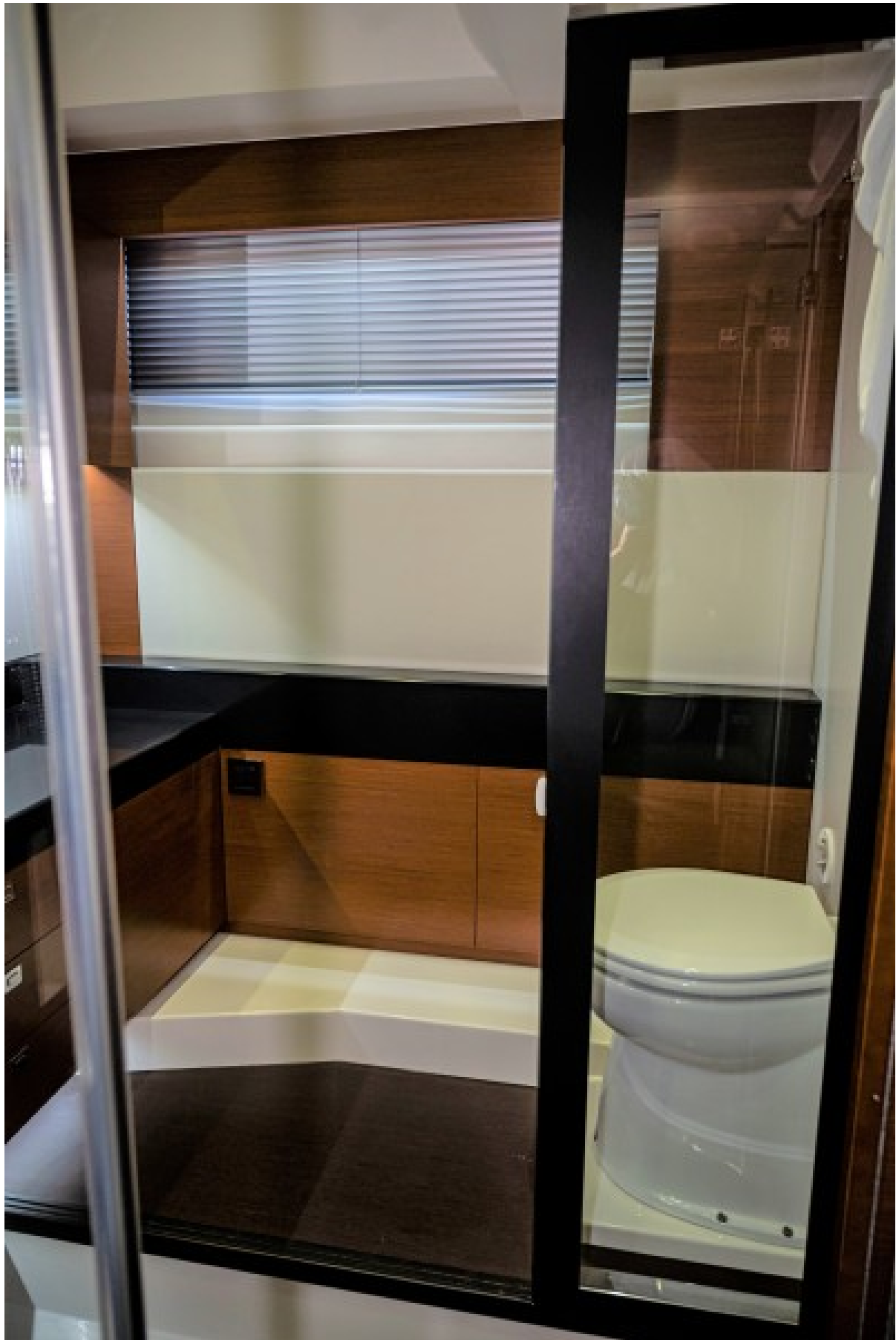
2014 58 Prestige 550 Sweet Annie Master Head (4)