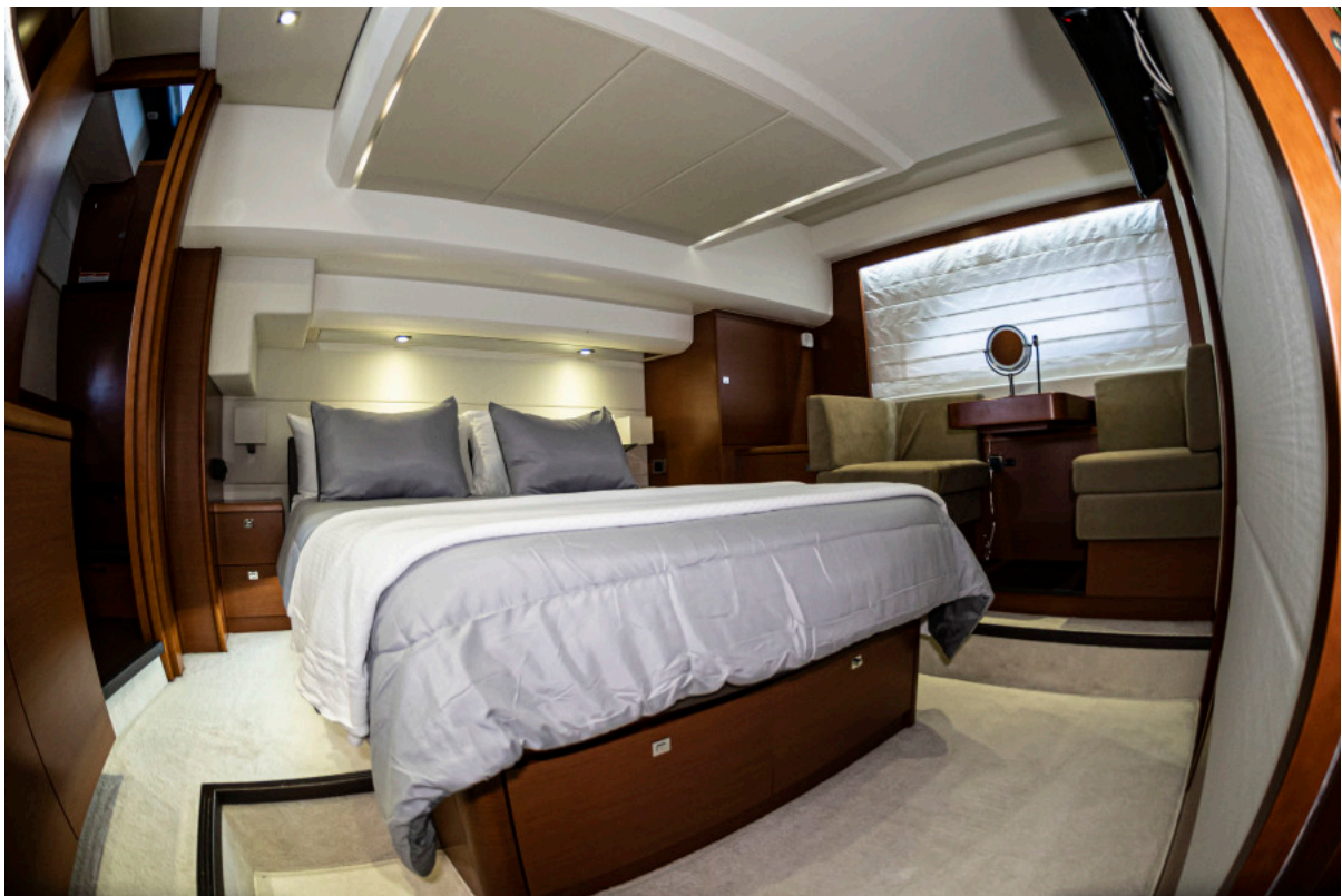
2014 58 Prestige 550 Sweet Annie Master Stateroom (4)