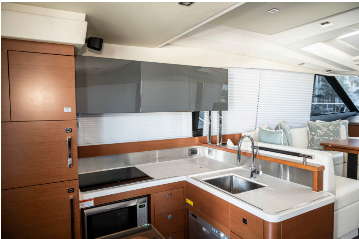
2014 58 Prestige 550 Sweet Annie Galley