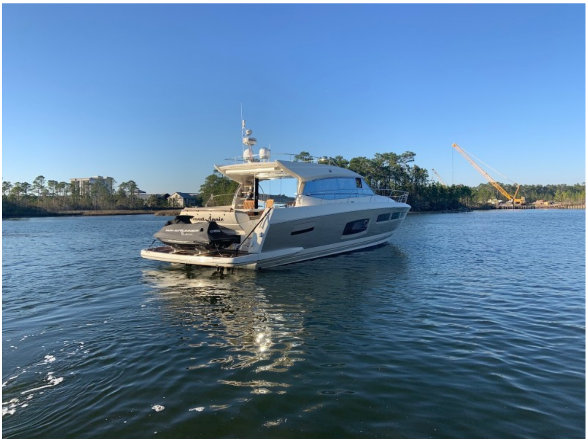
2014 58 Prestige 550 Sweet Annie Stern (1)