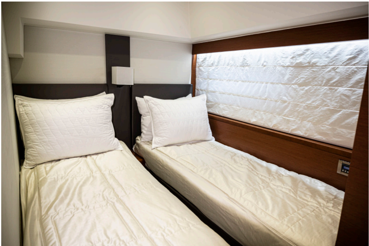
2014 58 Prestige 550 Sweet Annie Guest State Room