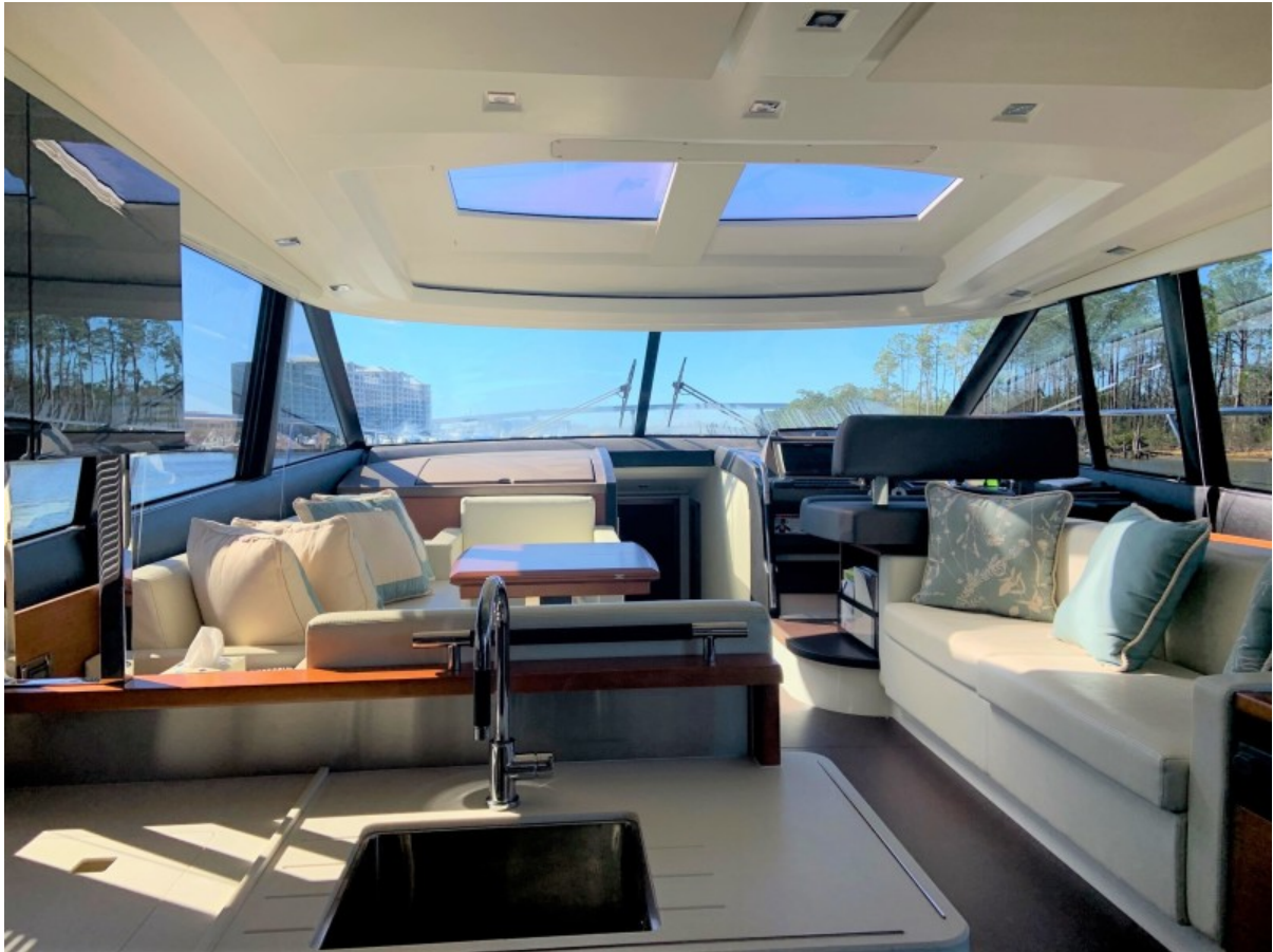
2014 58 Prestige 550 Sweet Annie Salon (2)