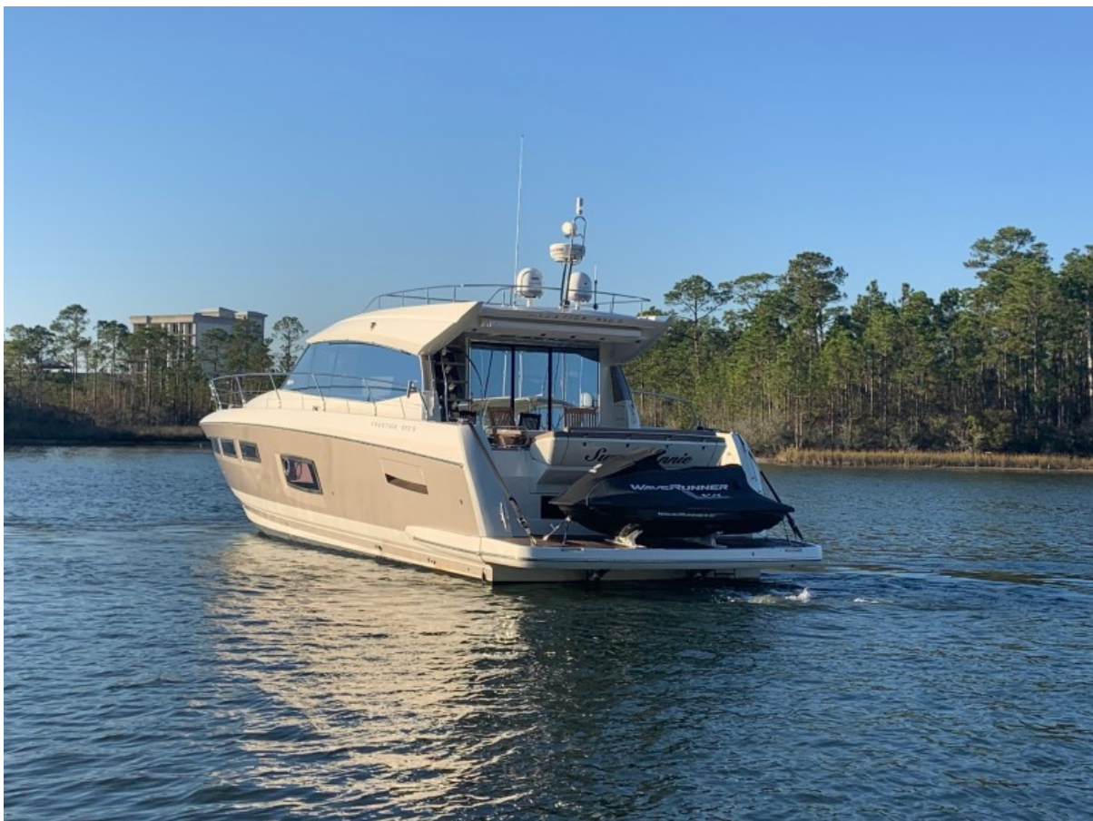
2014 58 Prestige 550 Sweet Annie Stern (3)