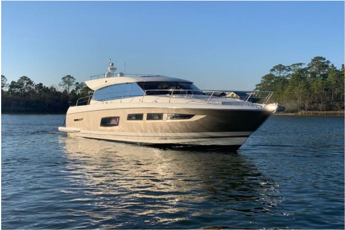
2014 55 Prestige 550 Sweet Annie Profile