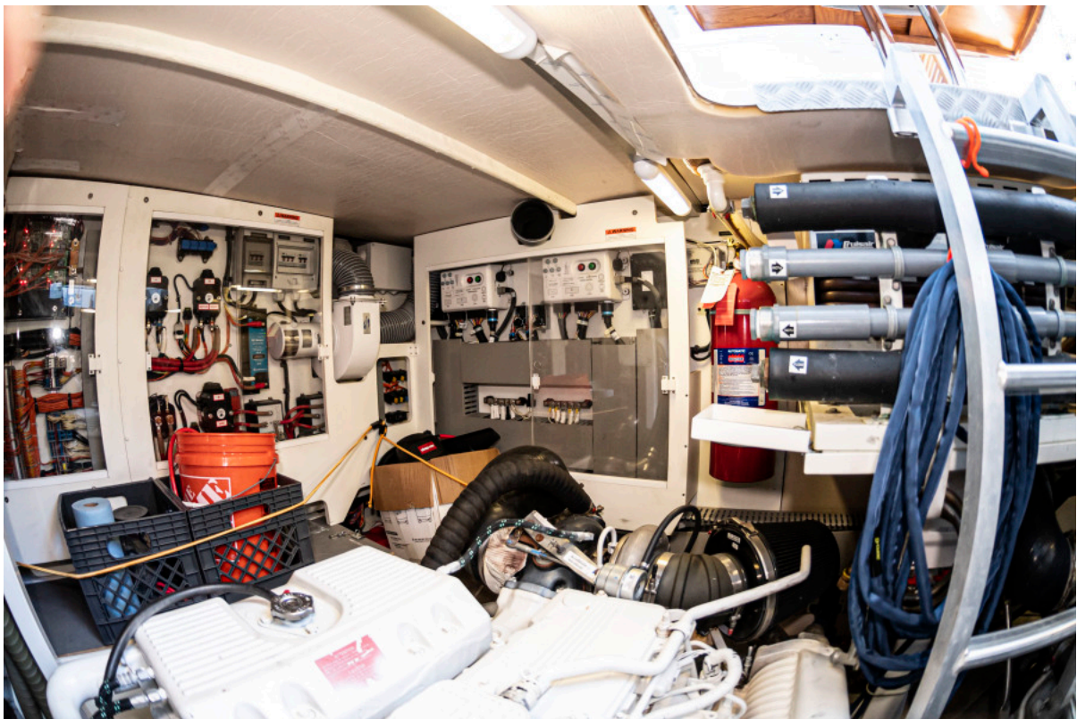
2014 58 Prestige 550 Sweet Annie Engine Room Port