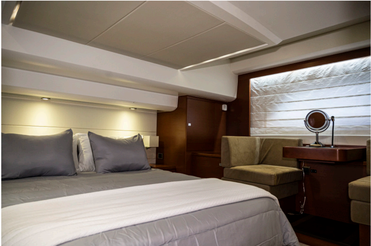
2014 58 Prestige 550 Sweet Annie Master Stateroom (2)