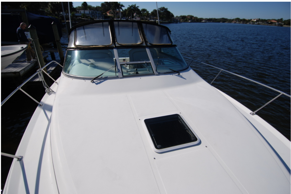
Bow for Sunning