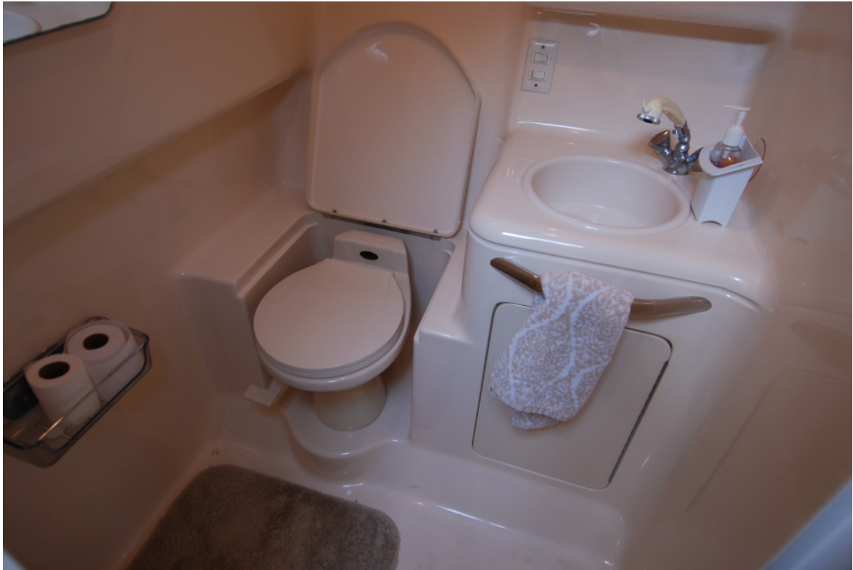
Head with Shower