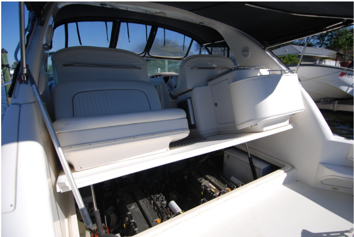
Electric Engine Hatch