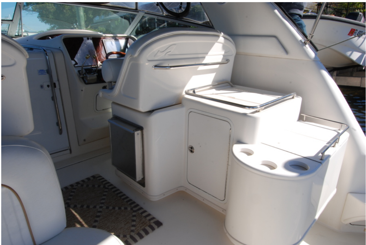
Bait and Prep Station