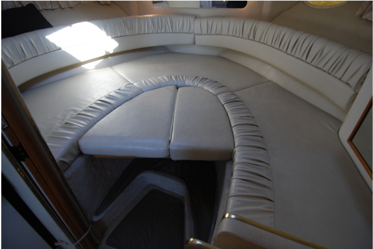
Forward Berth converts to Dinette