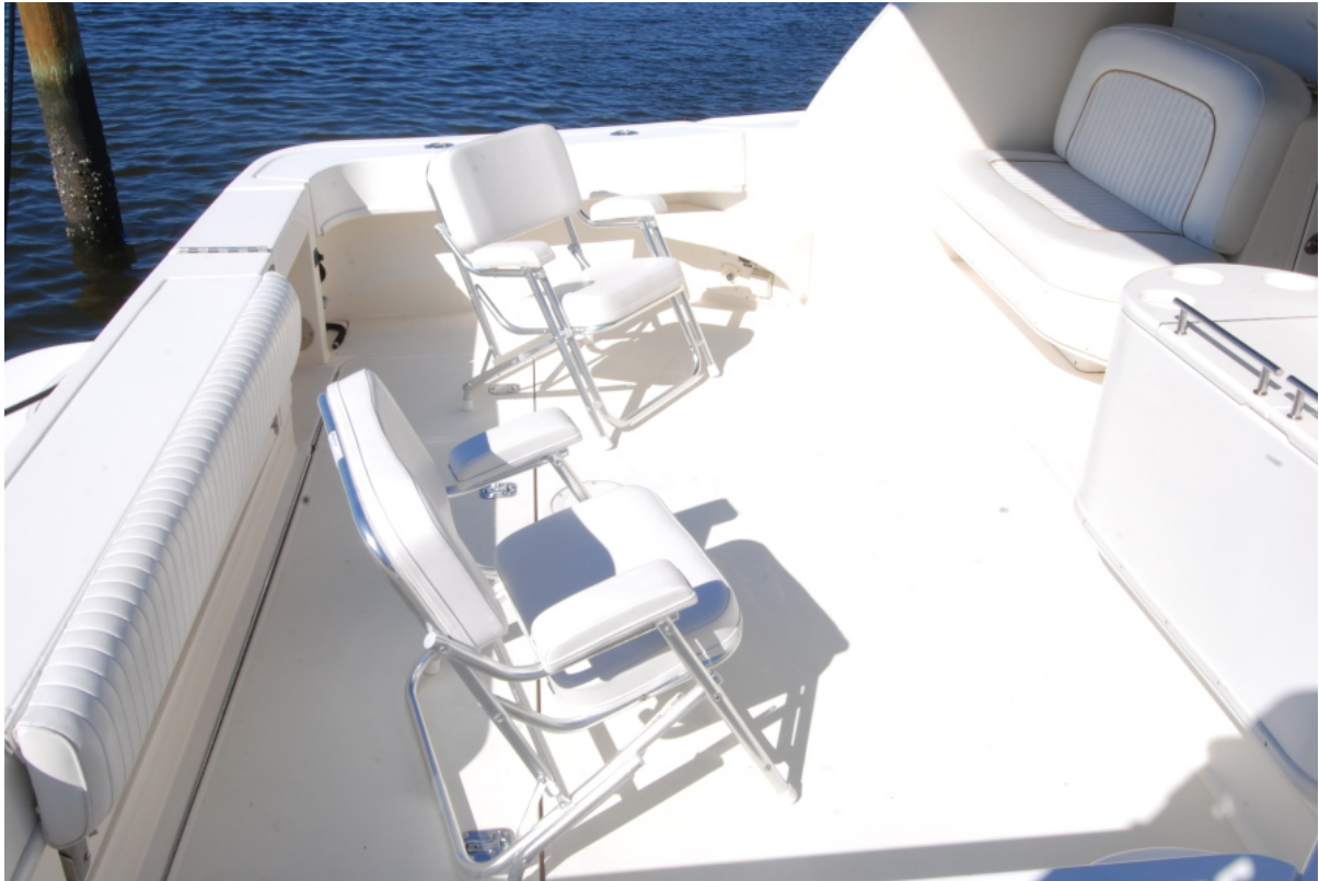
Spacious Seating or Fishing ability