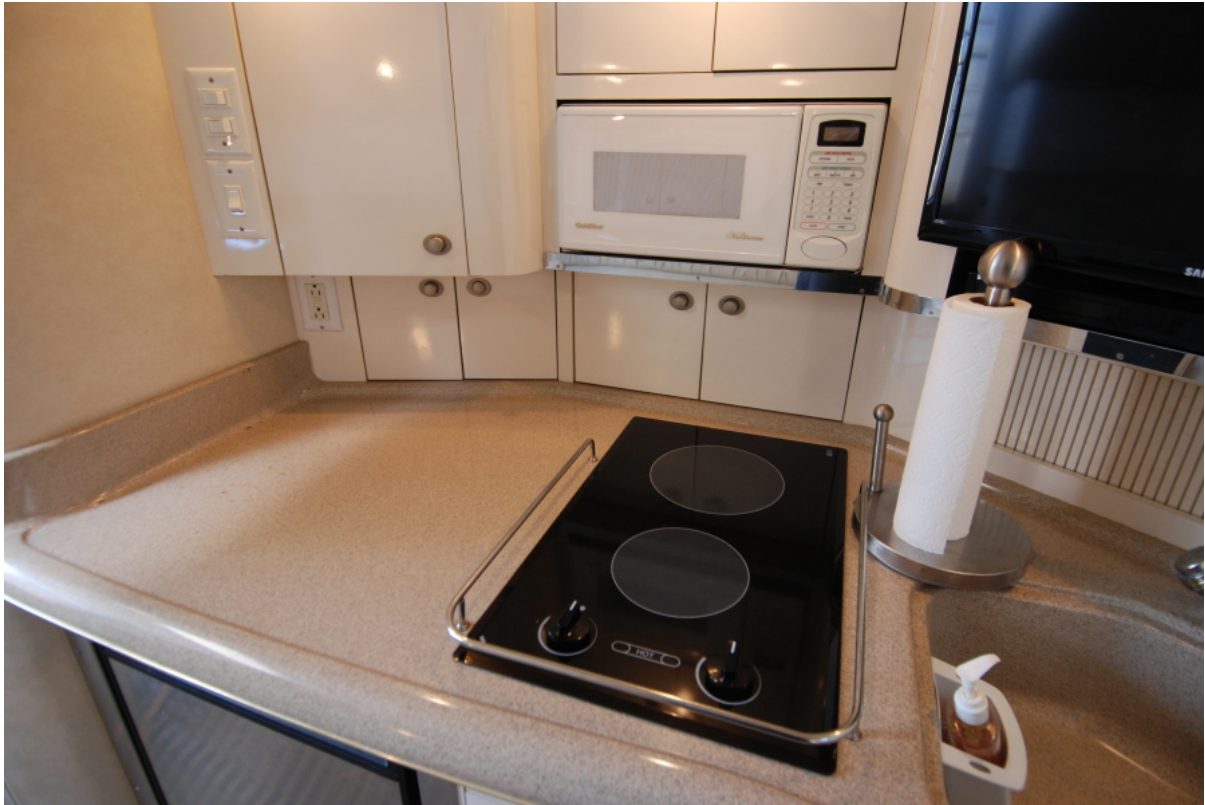
Two Burner Top