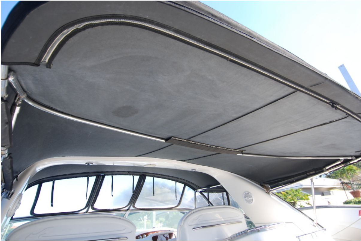
Bimini Top with Fiberglass Arch