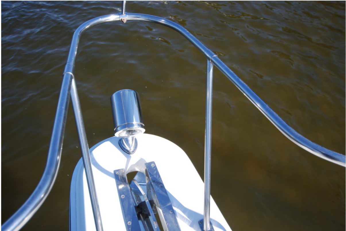
Stainless Steel Spotlight and Windlass