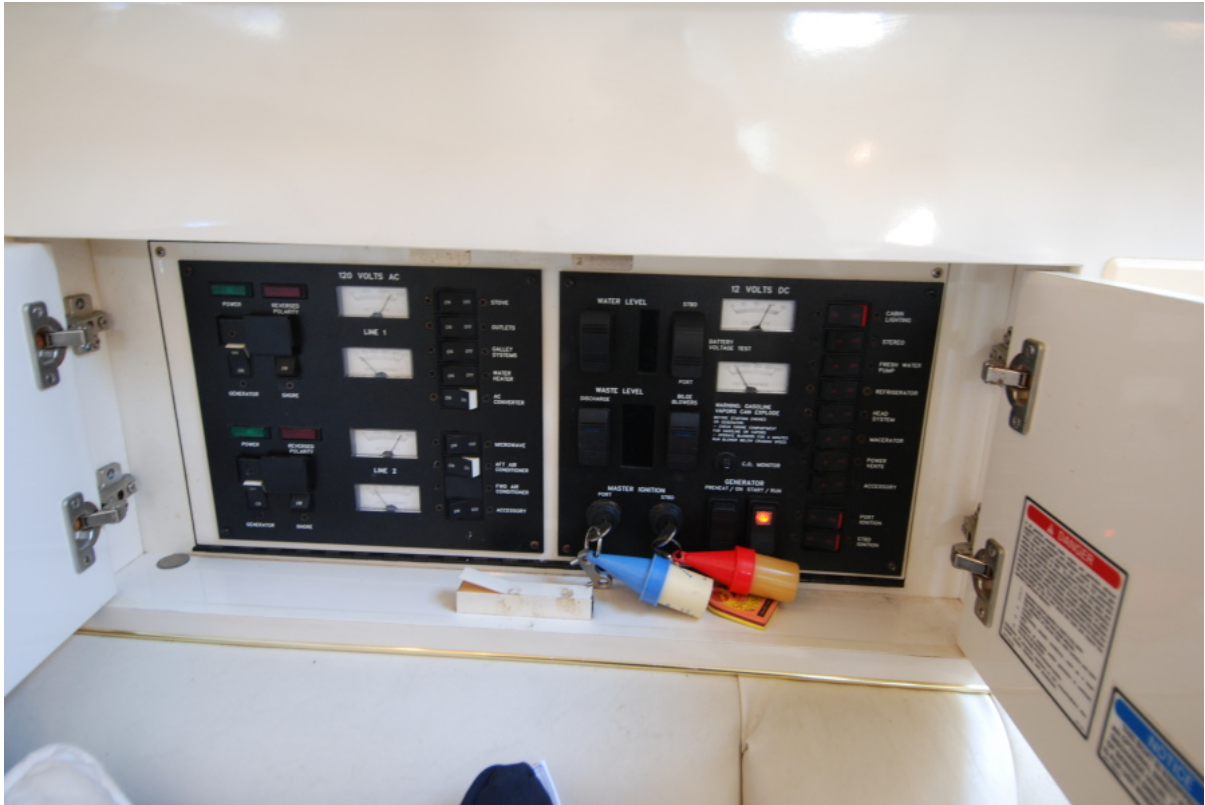
Power Panel in Salon