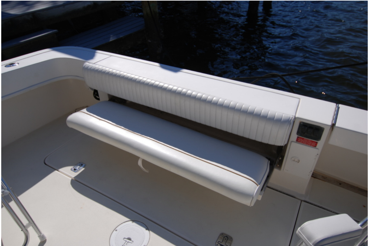
Flip Down Back Bench