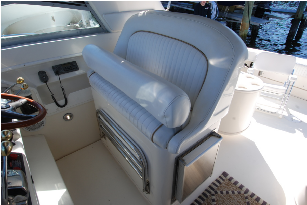
Captain Bolster Seat