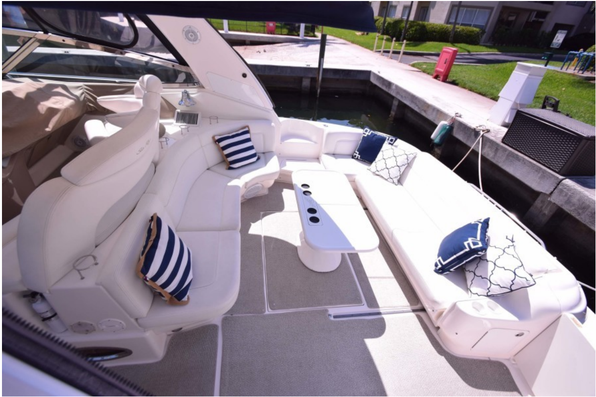
Overview No Canvas Above Cockpit