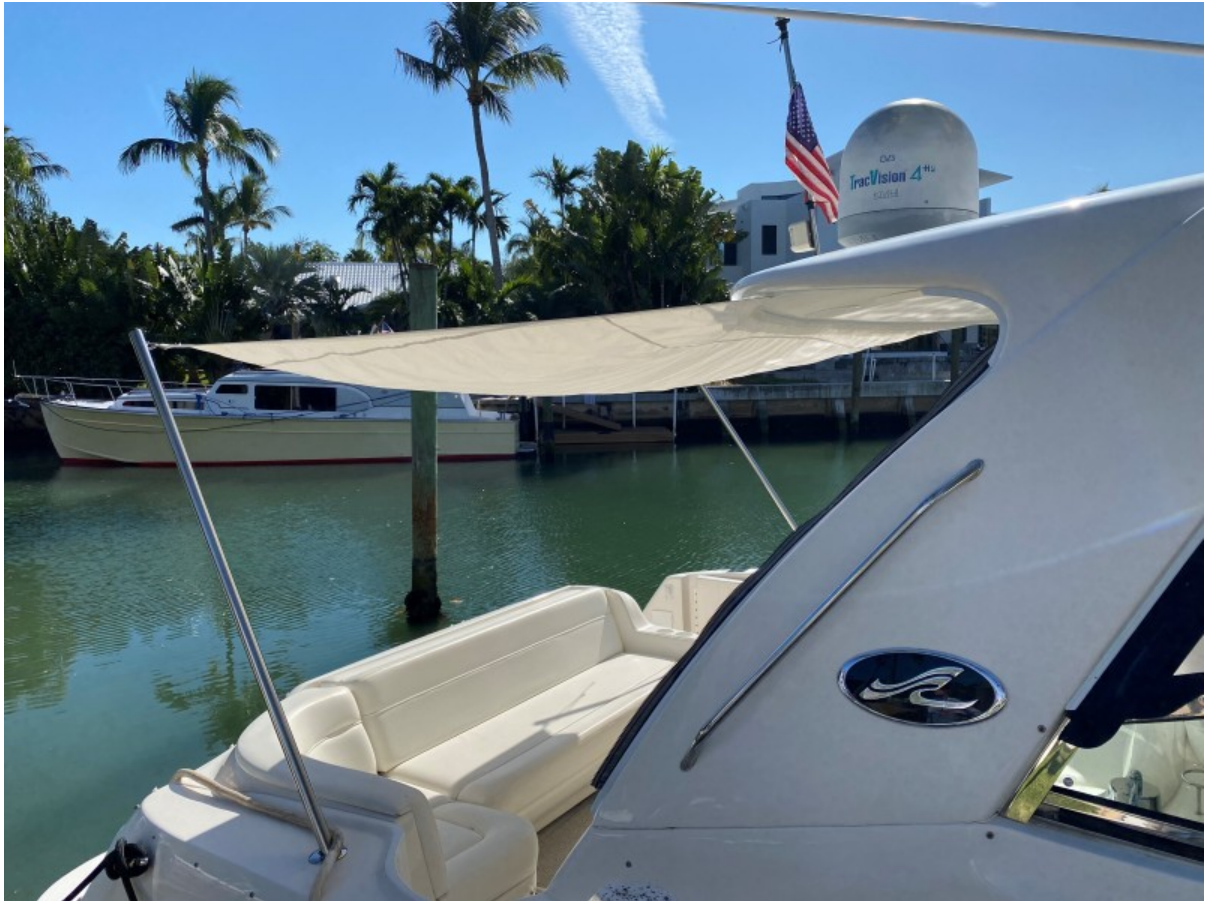
New Sunshade 1