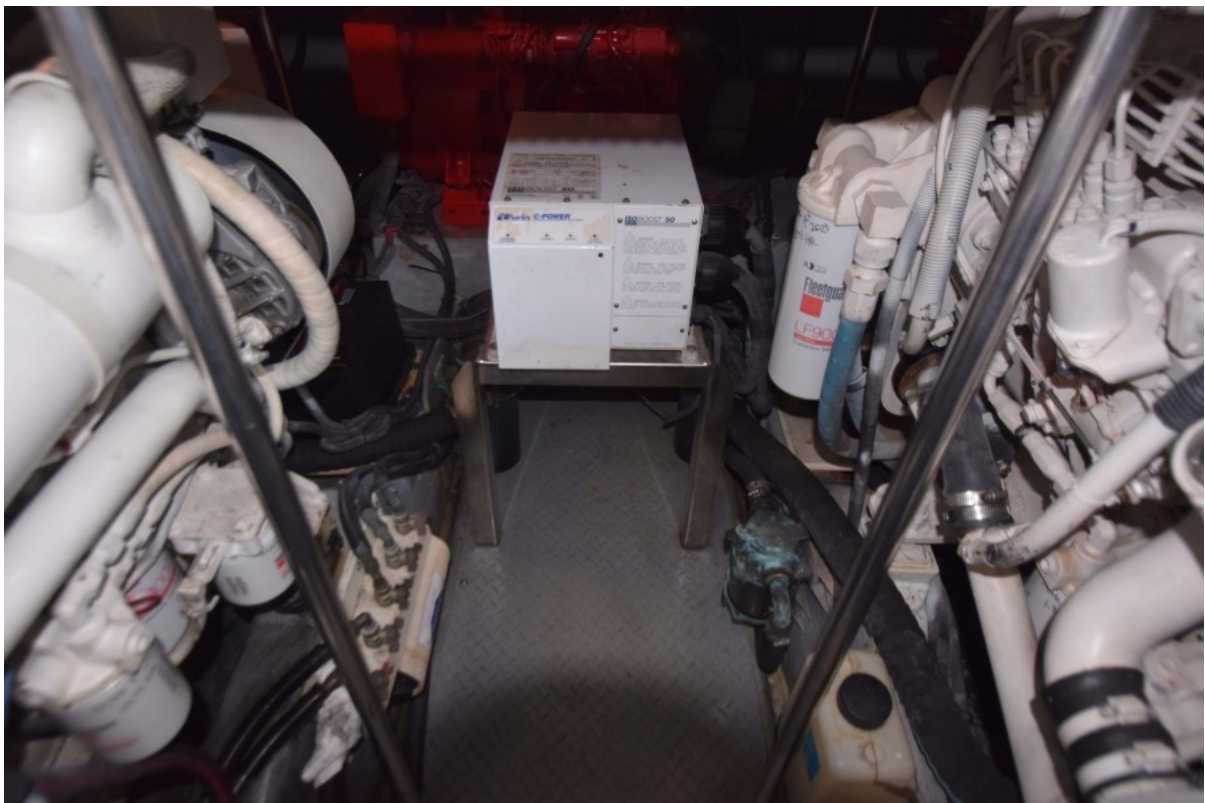
Engine Room View to Aft