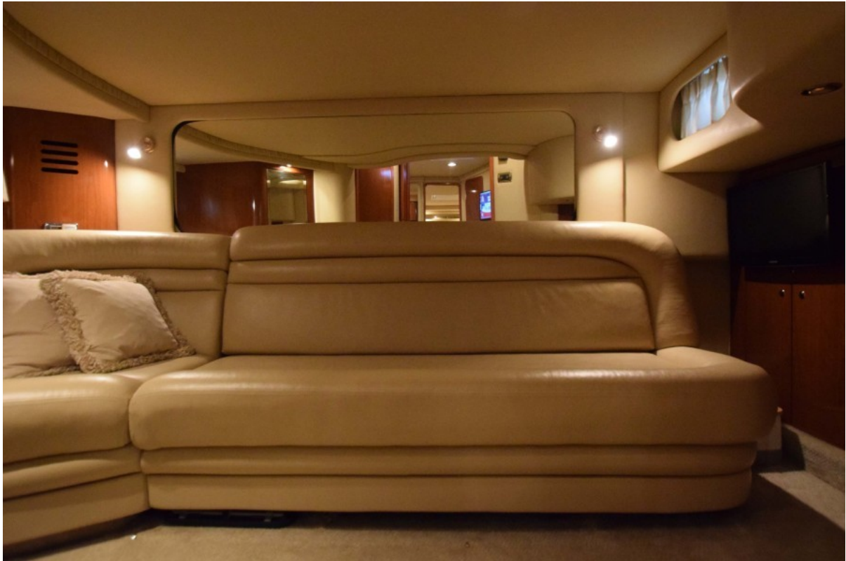
Convertible Couch in Guest Bed