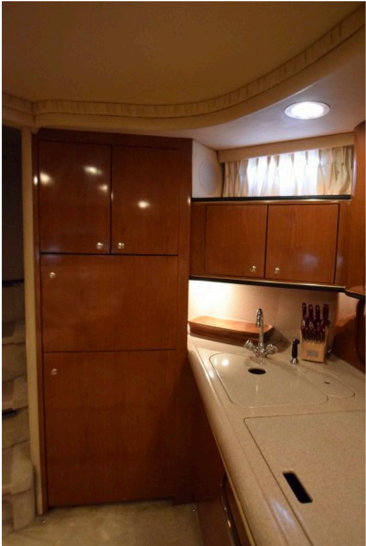
Galley with Focus on Refrigerator