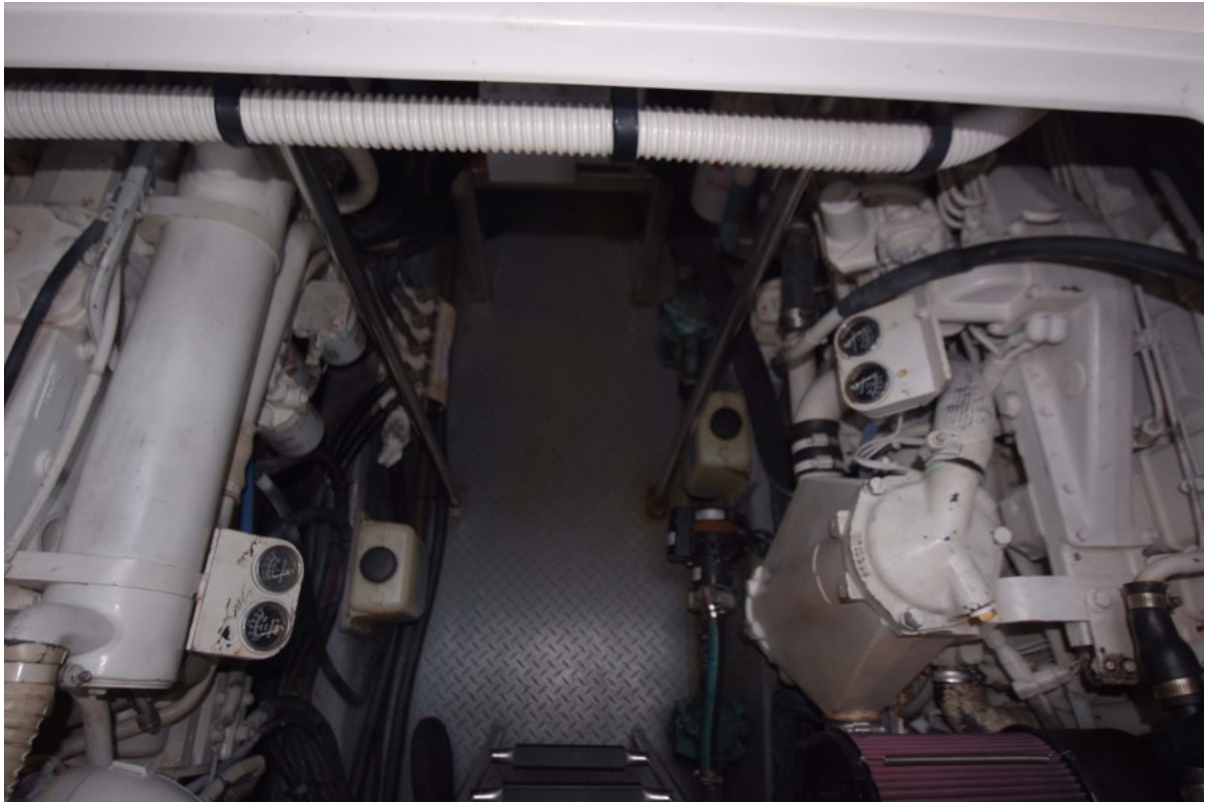
Engine Room View from Cockpit