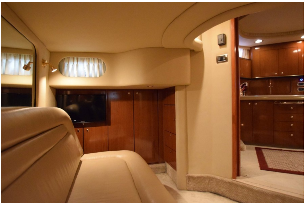
View to Galley from Guest Cabin