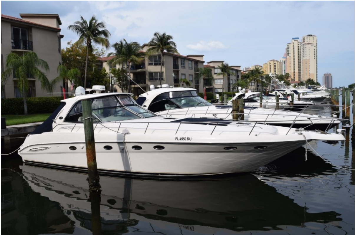
STBD Side View