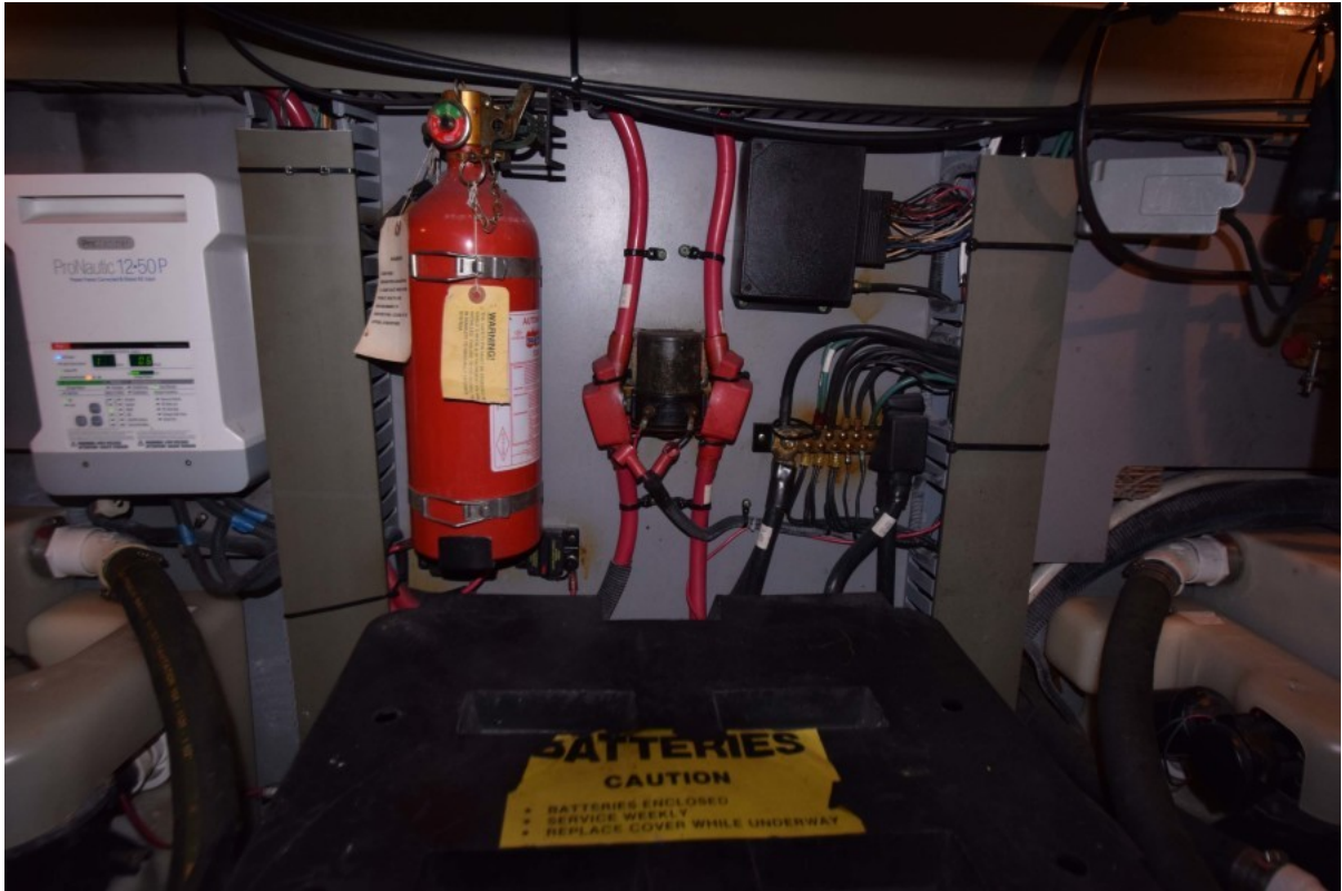
Engine Room Batteries and Charger