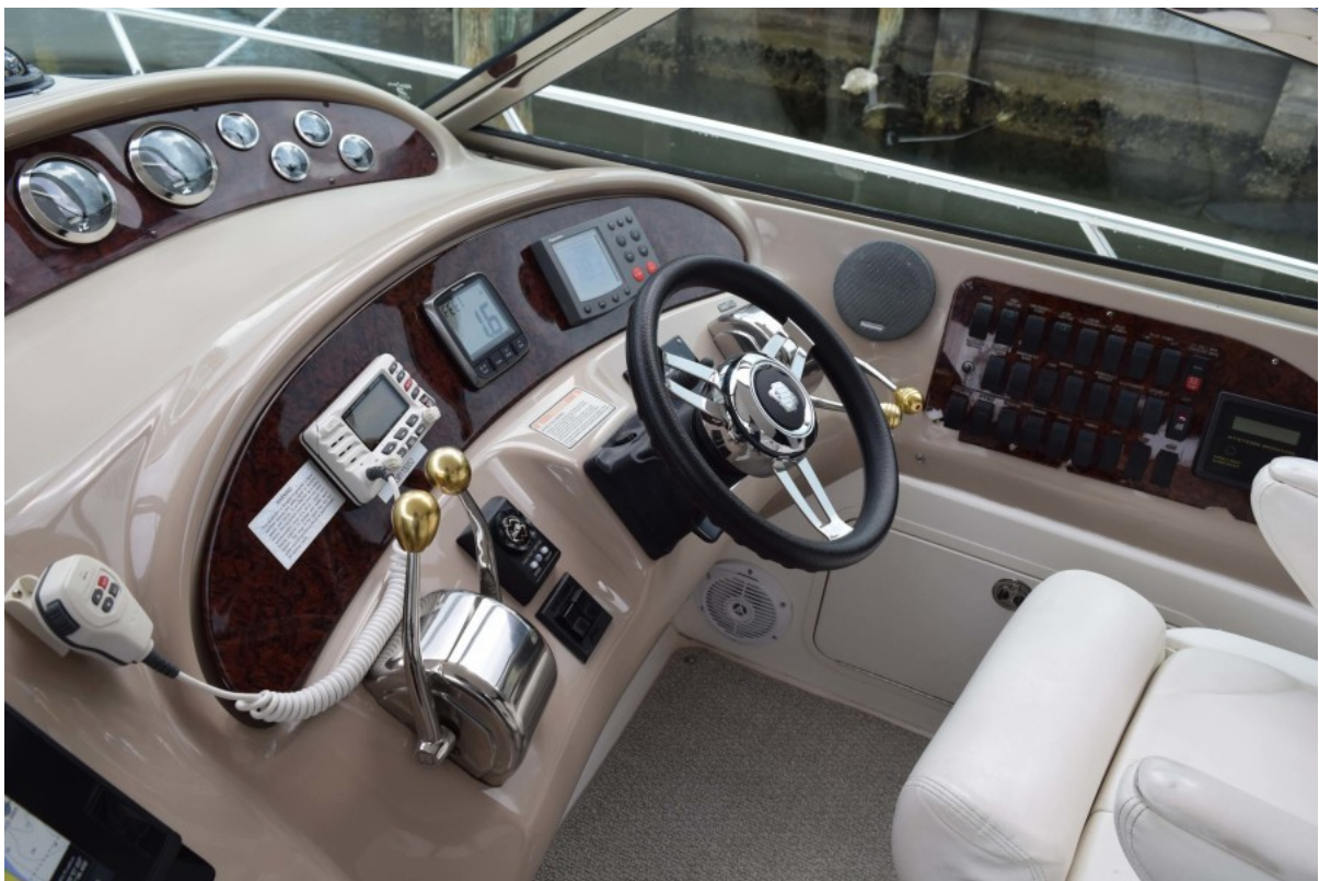
Helm Overview from Companion Seating