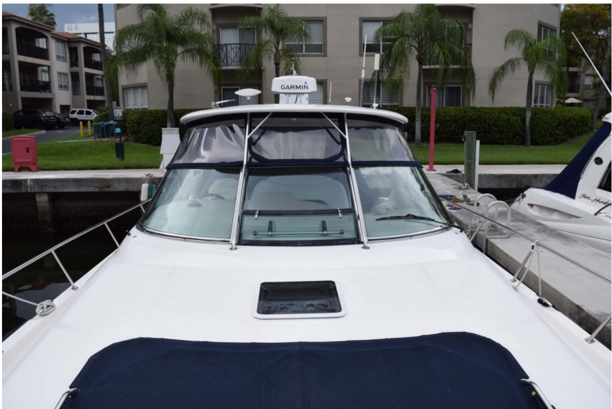
Helm View from Mid Bow