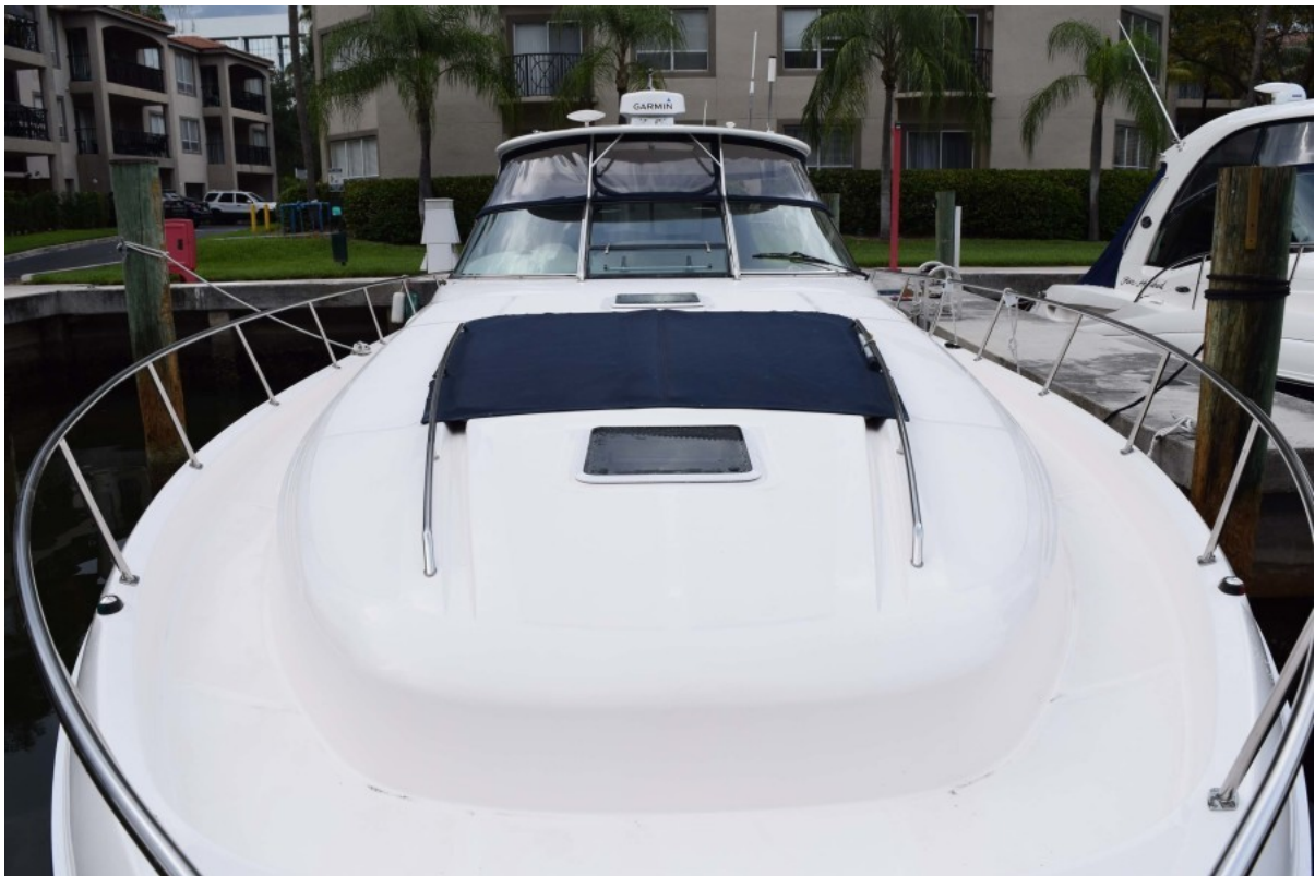
Pulpit View to Helm