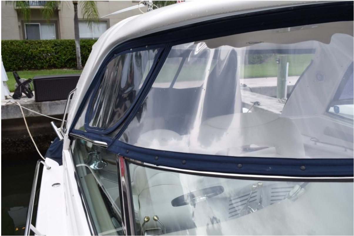
Isinglass from STBD View