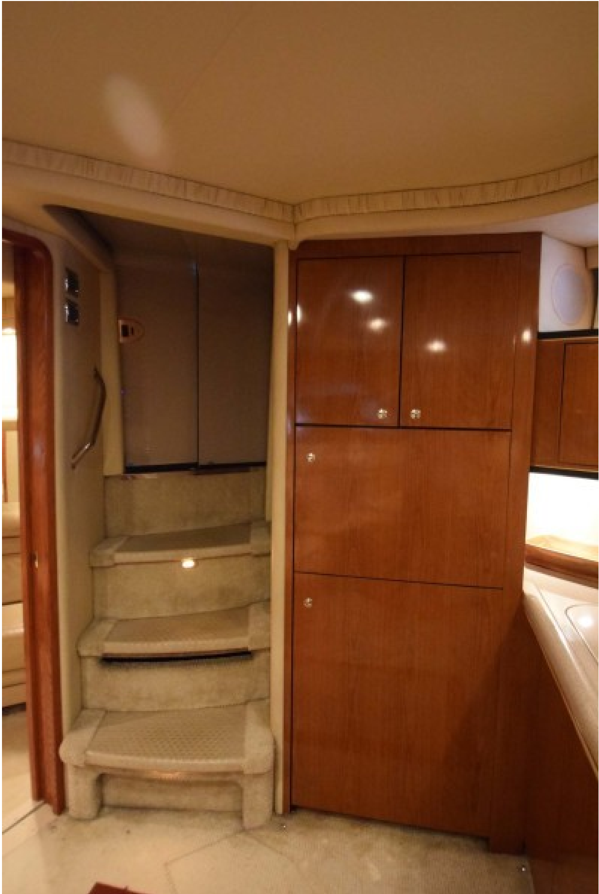
Steps to Cockpit