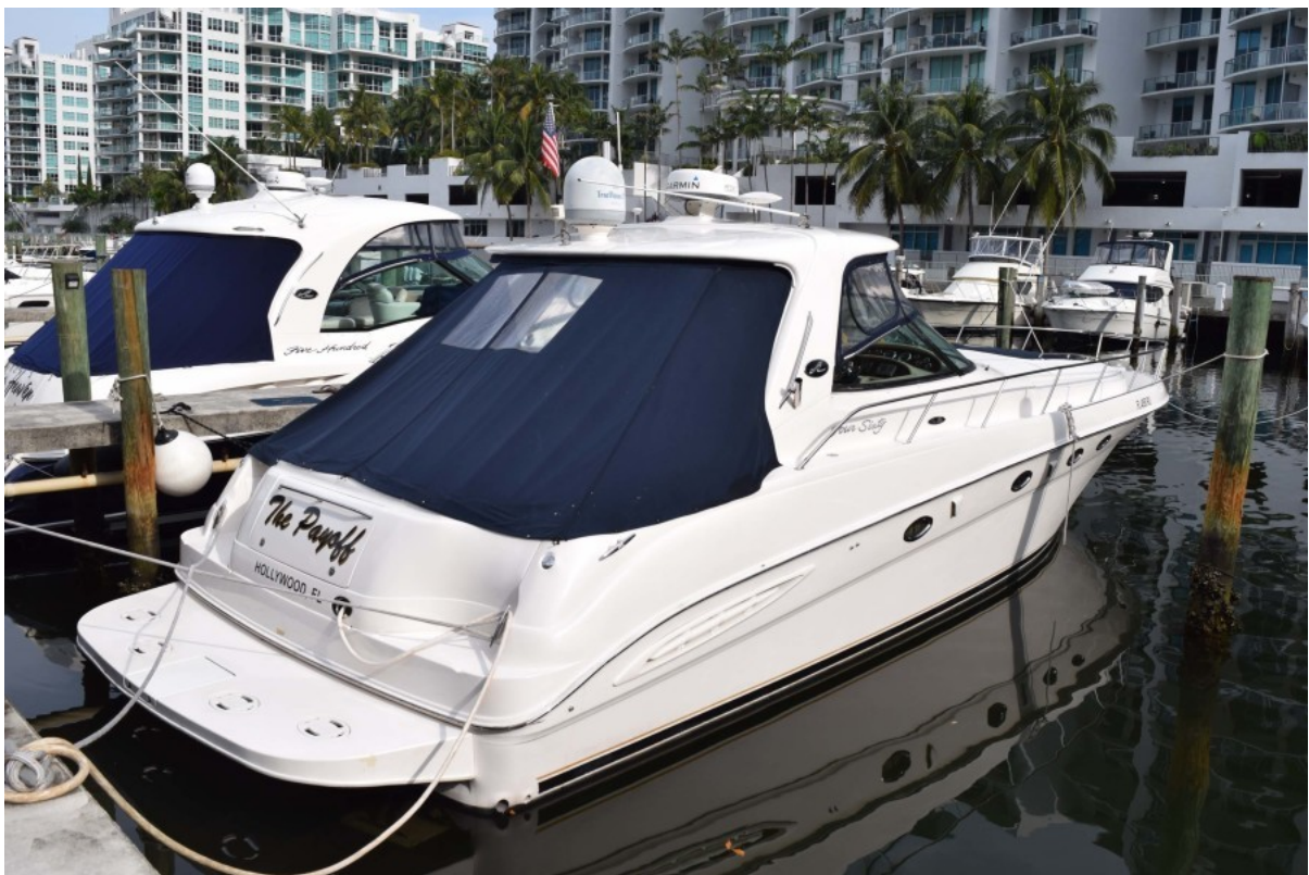
STBD Side View from Dock