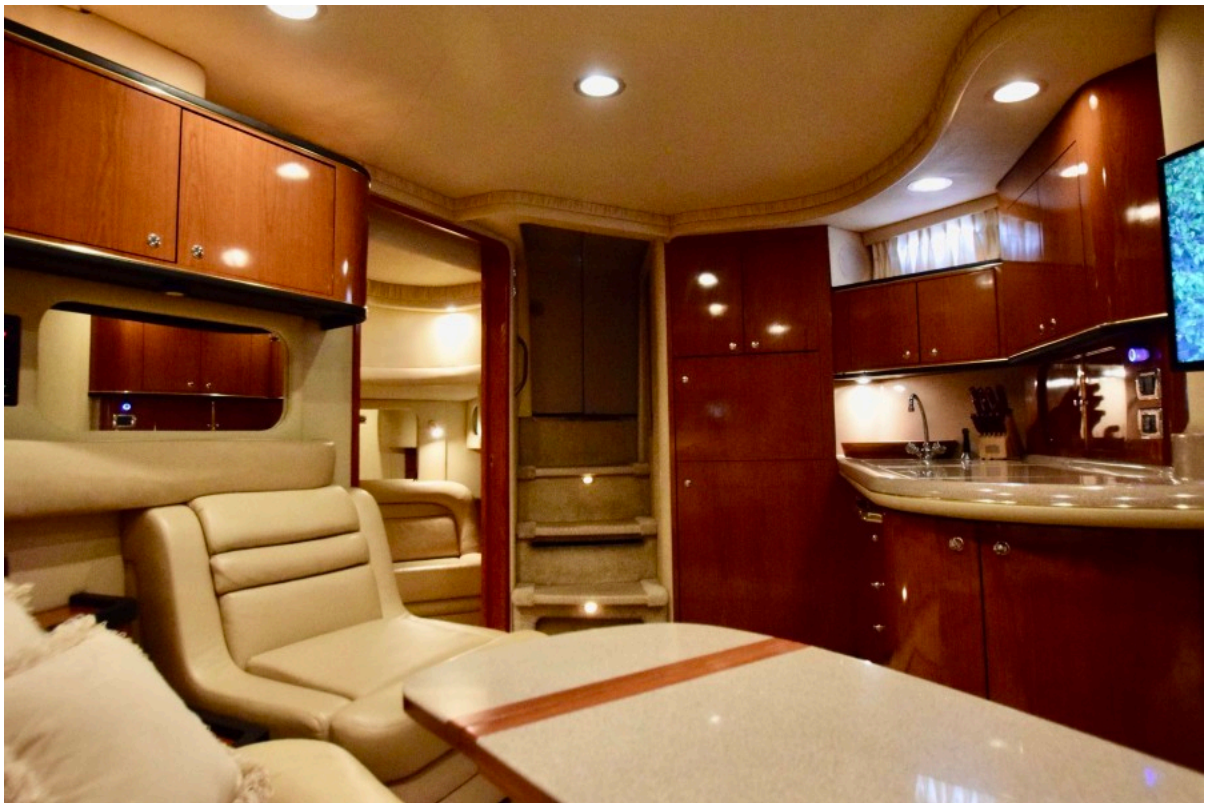
Galley View from Salon Seating