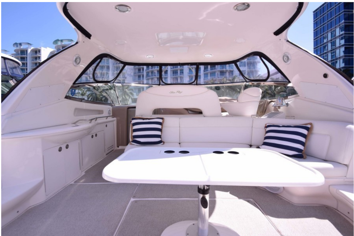
Cockpit to Helm View