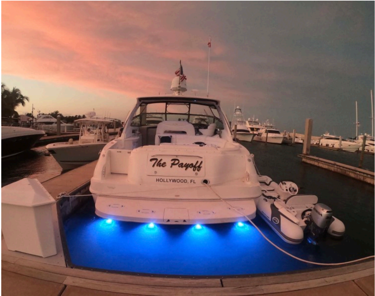
Evening Underwater Lights