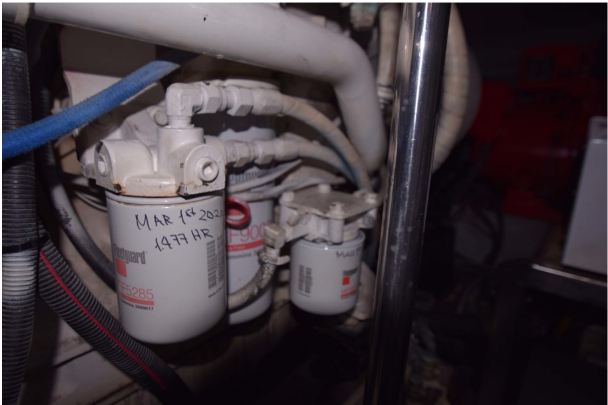
Engine Room Filters and Dates