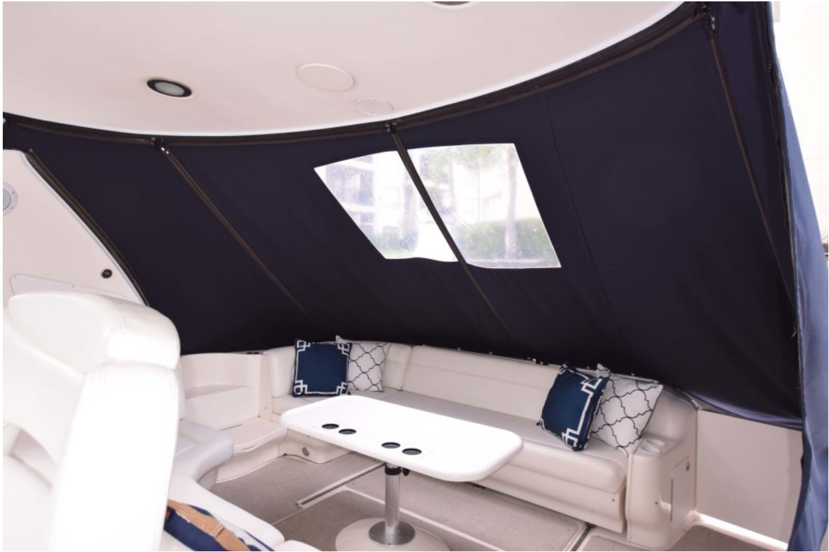
Cockpit Seating with Canvas