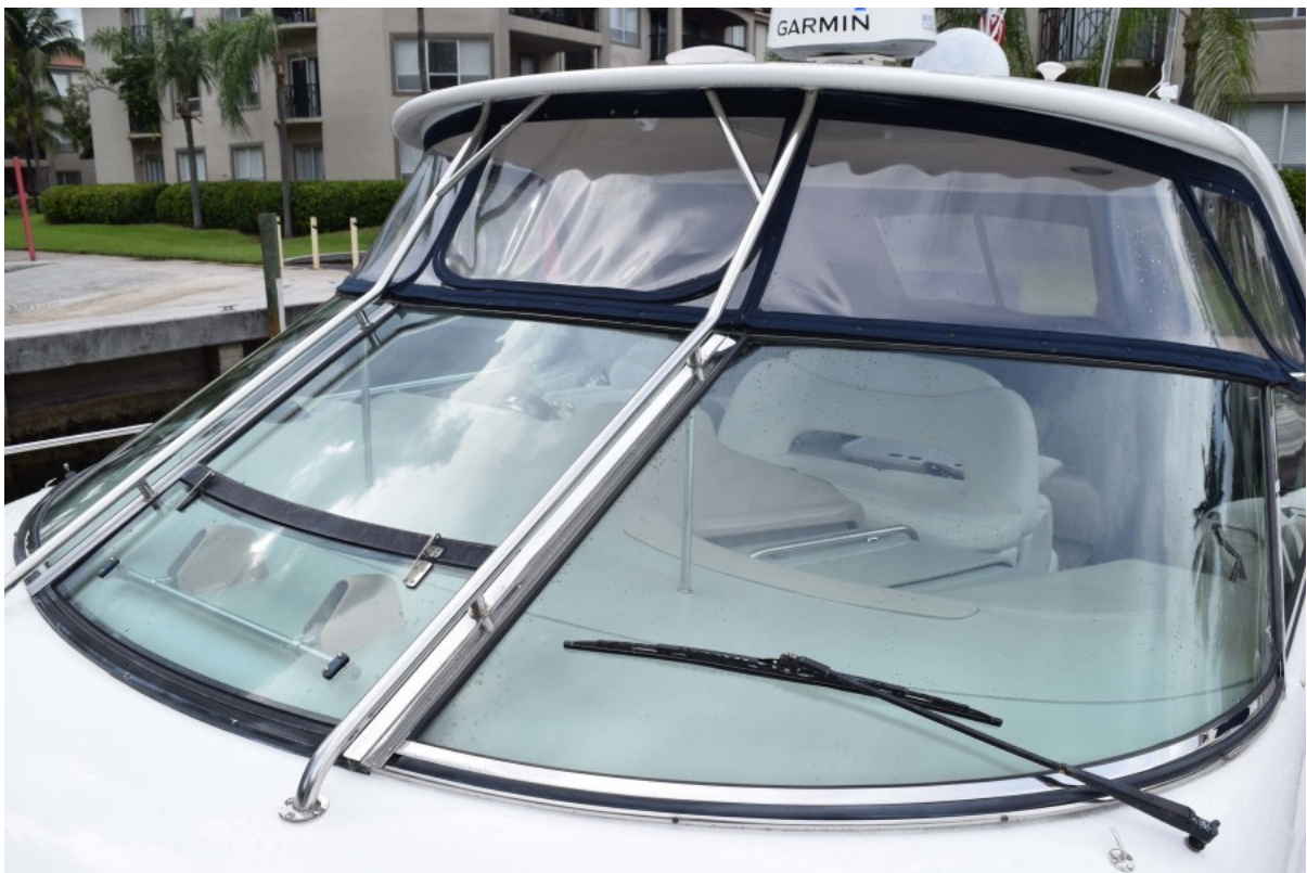
Isinglass and Windshield Detail