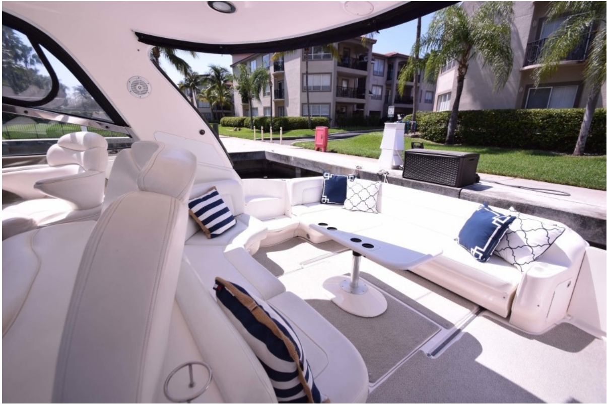
Cockpit from Helm