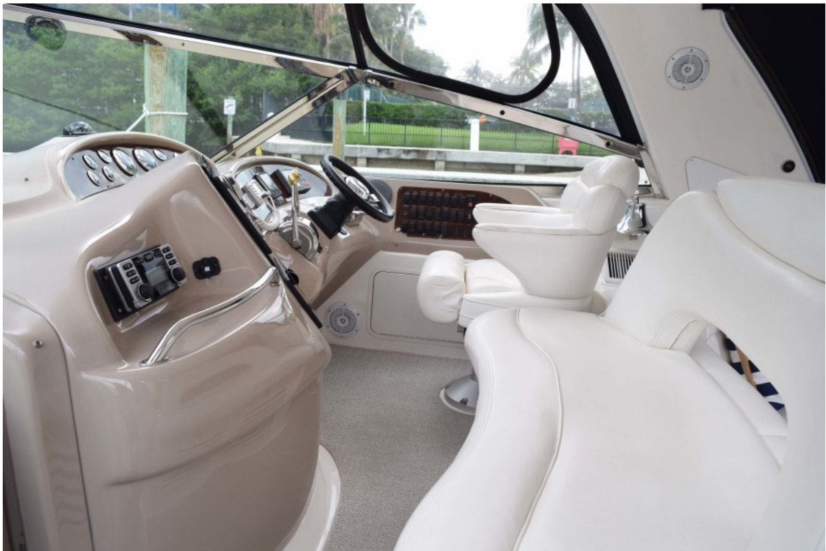
Helm and Companion Seat from PORT