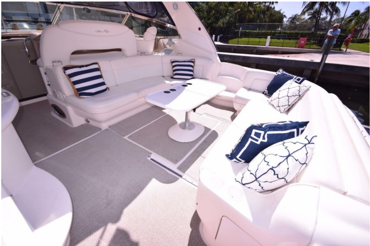
Cockpit from PORT Side Entry