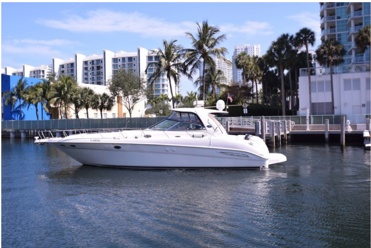
PORT Side View