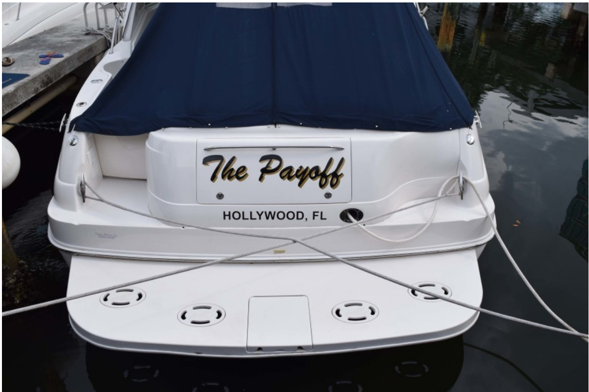
Swim Platform from Dock