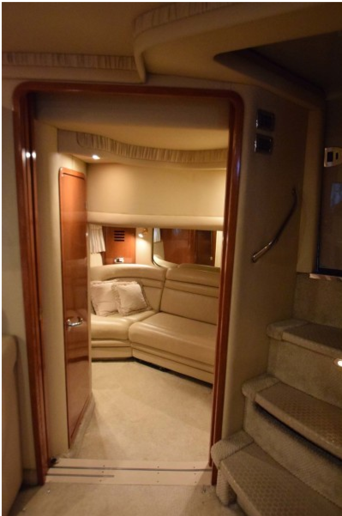
View into Guest Room with Sliding Doors