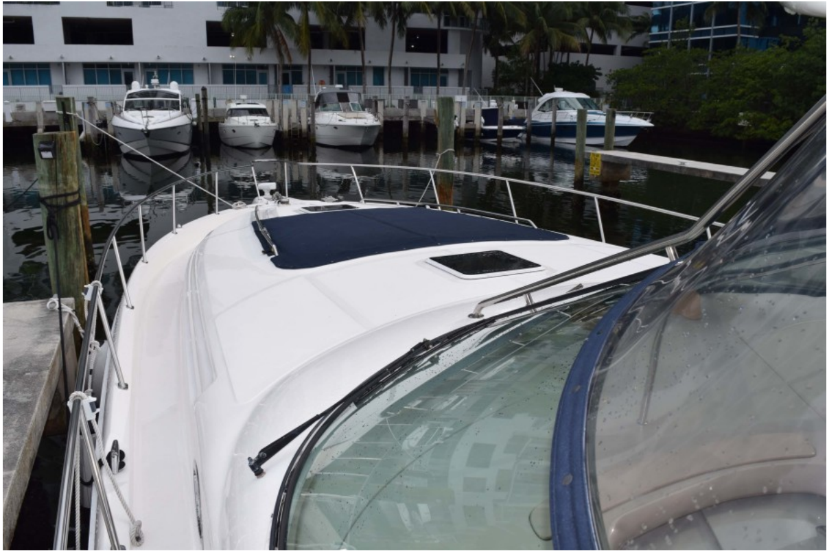
PORT Side View to Bow