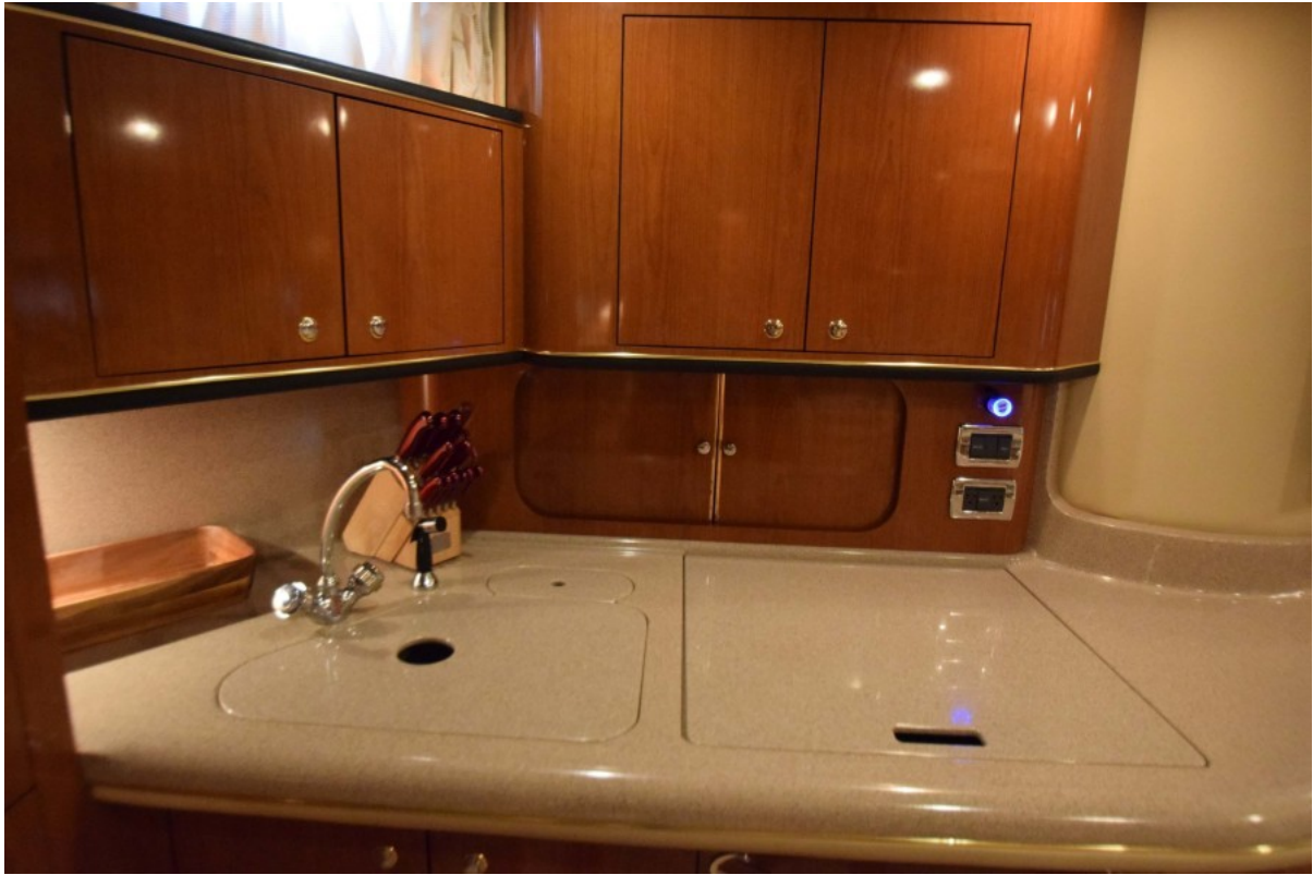
Galley with Covers