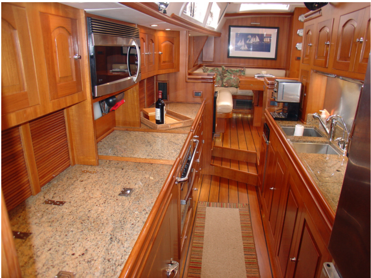
Galley Looking Fwd.