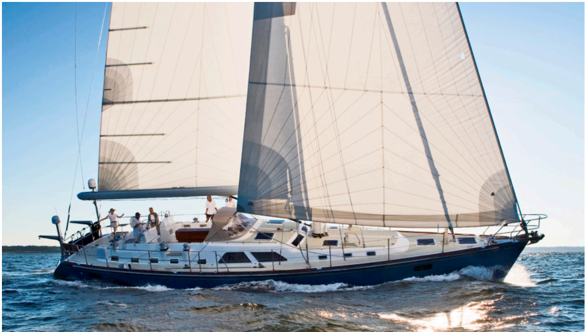
AMANTE, 2007 Hylas 70 Centerboard Cruiser