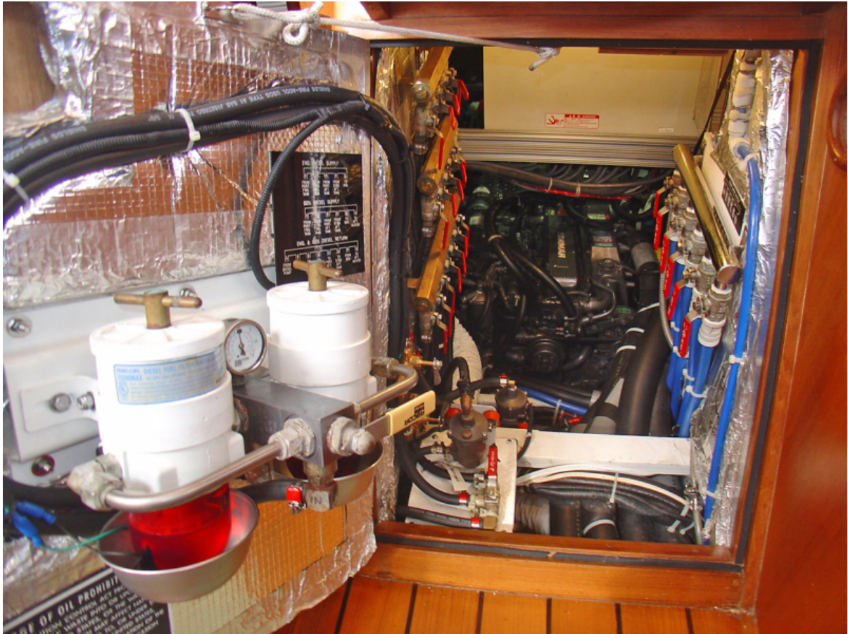
Engine Room View from Salon