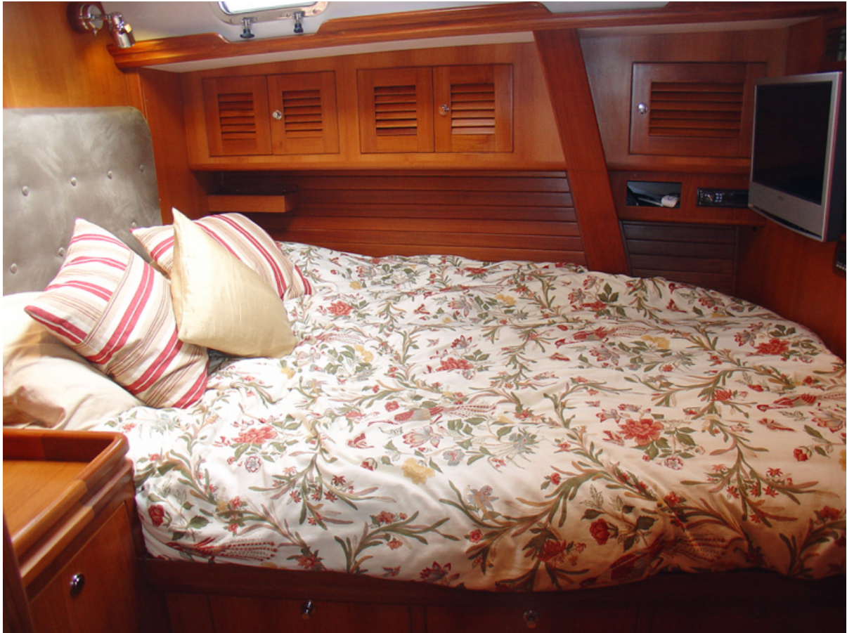
Port Guest Cabin