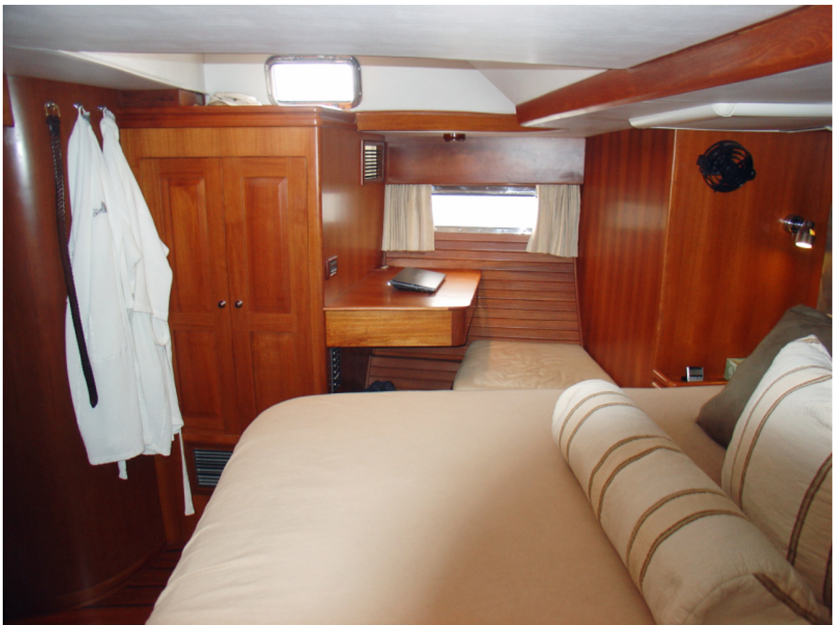
Owners SR Sbd. Side