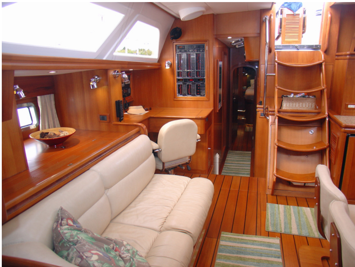
Starboard Salon, Looking Aft