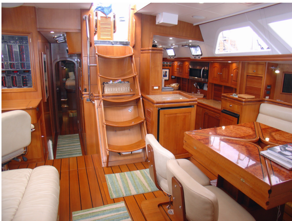
Salon, Looking Aft