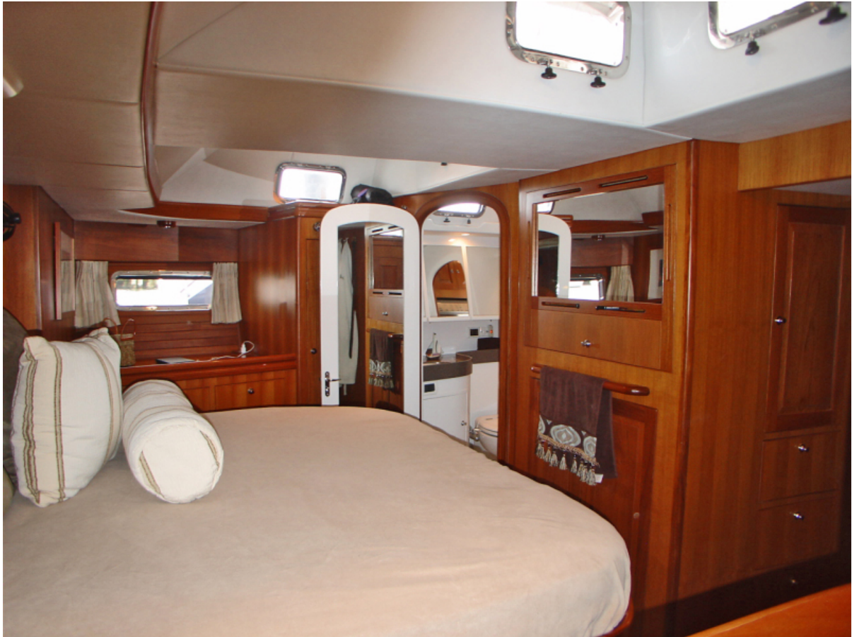
Owners SR Port Side