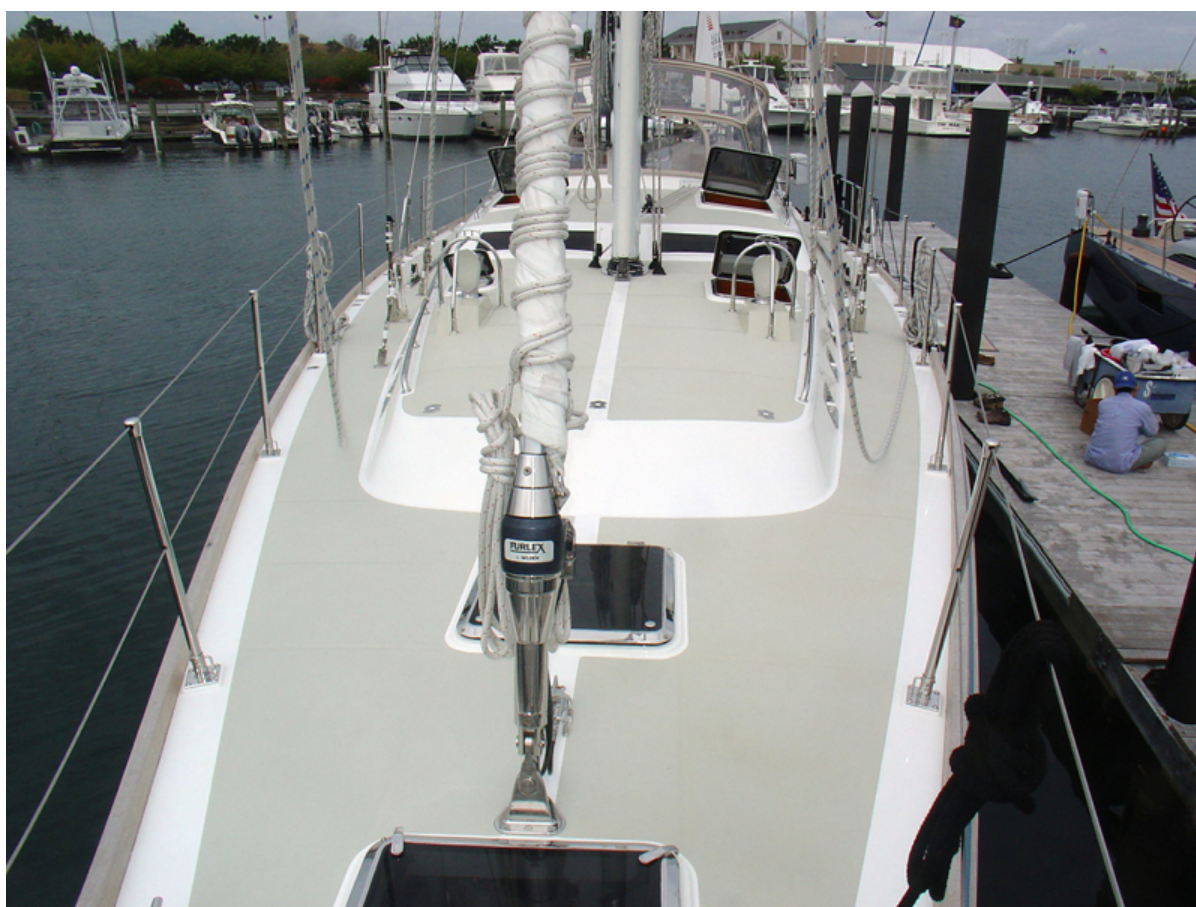
Foredeck Looking Aft