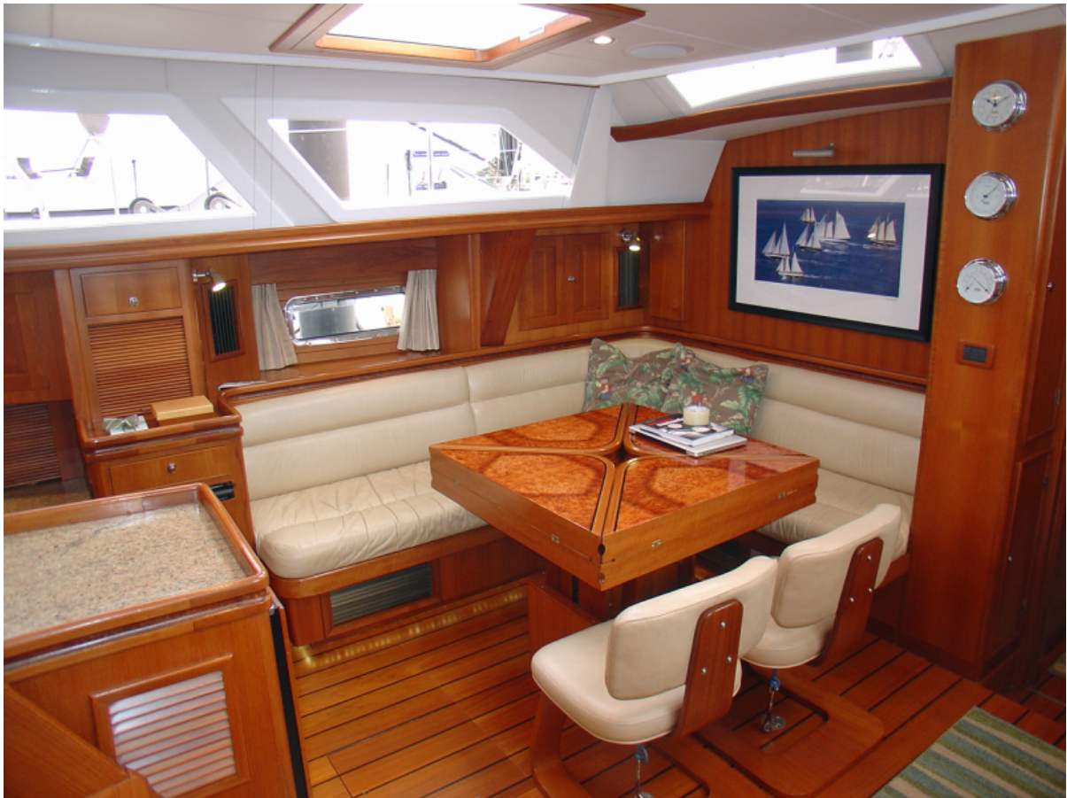
Port Salon Table, Closed