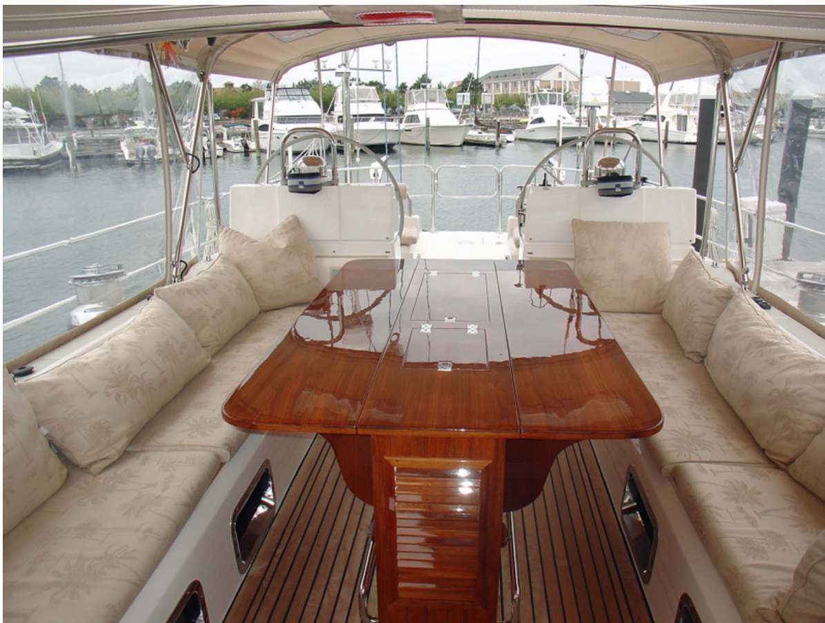
Looking Aft, Table Extended