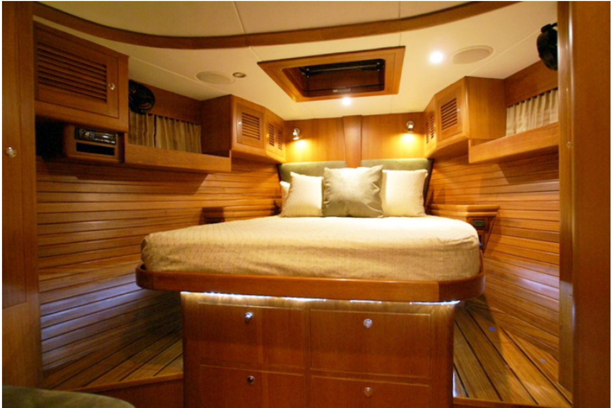
Fwd. Guest SR