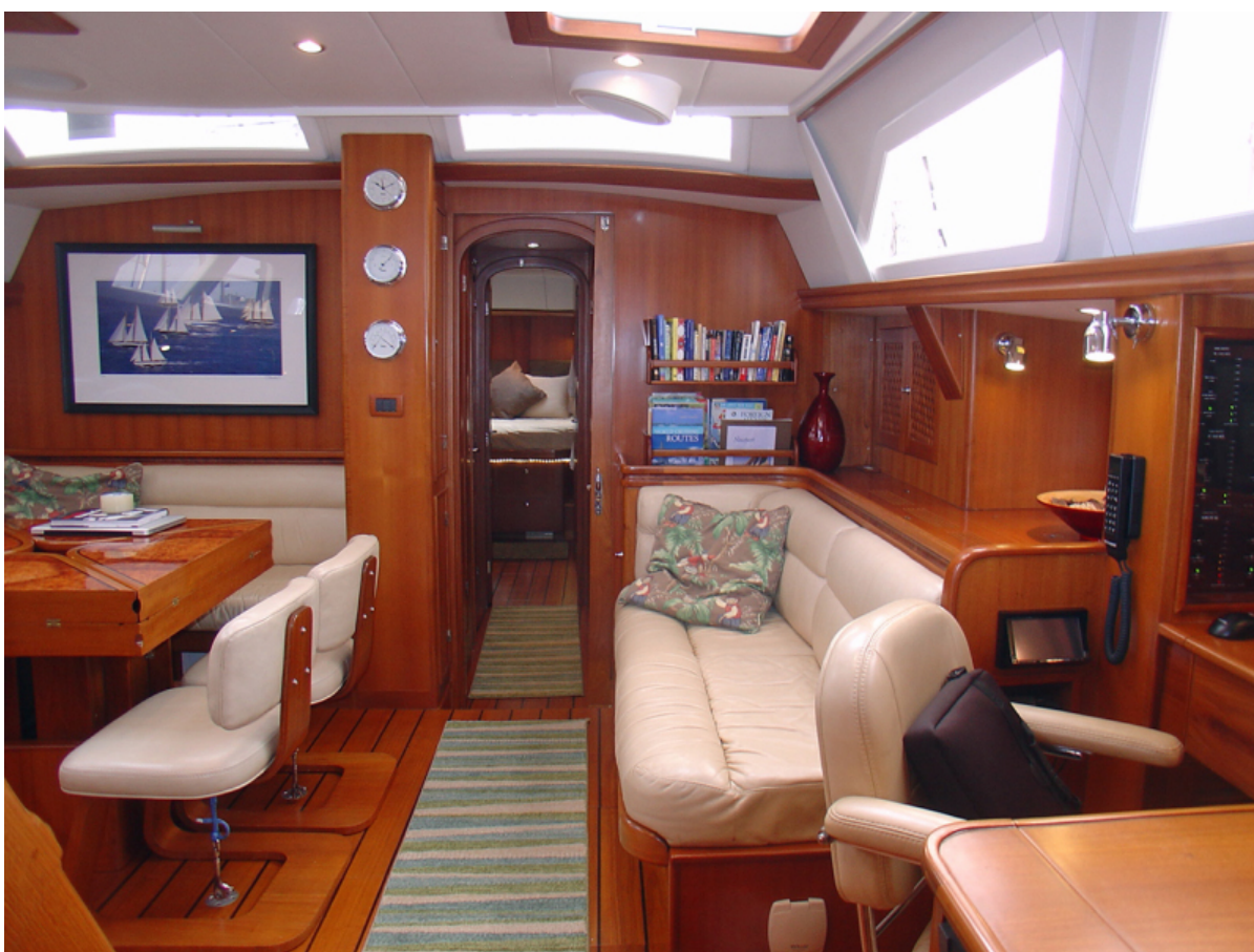
Starboard Salon, Looking Fwd.