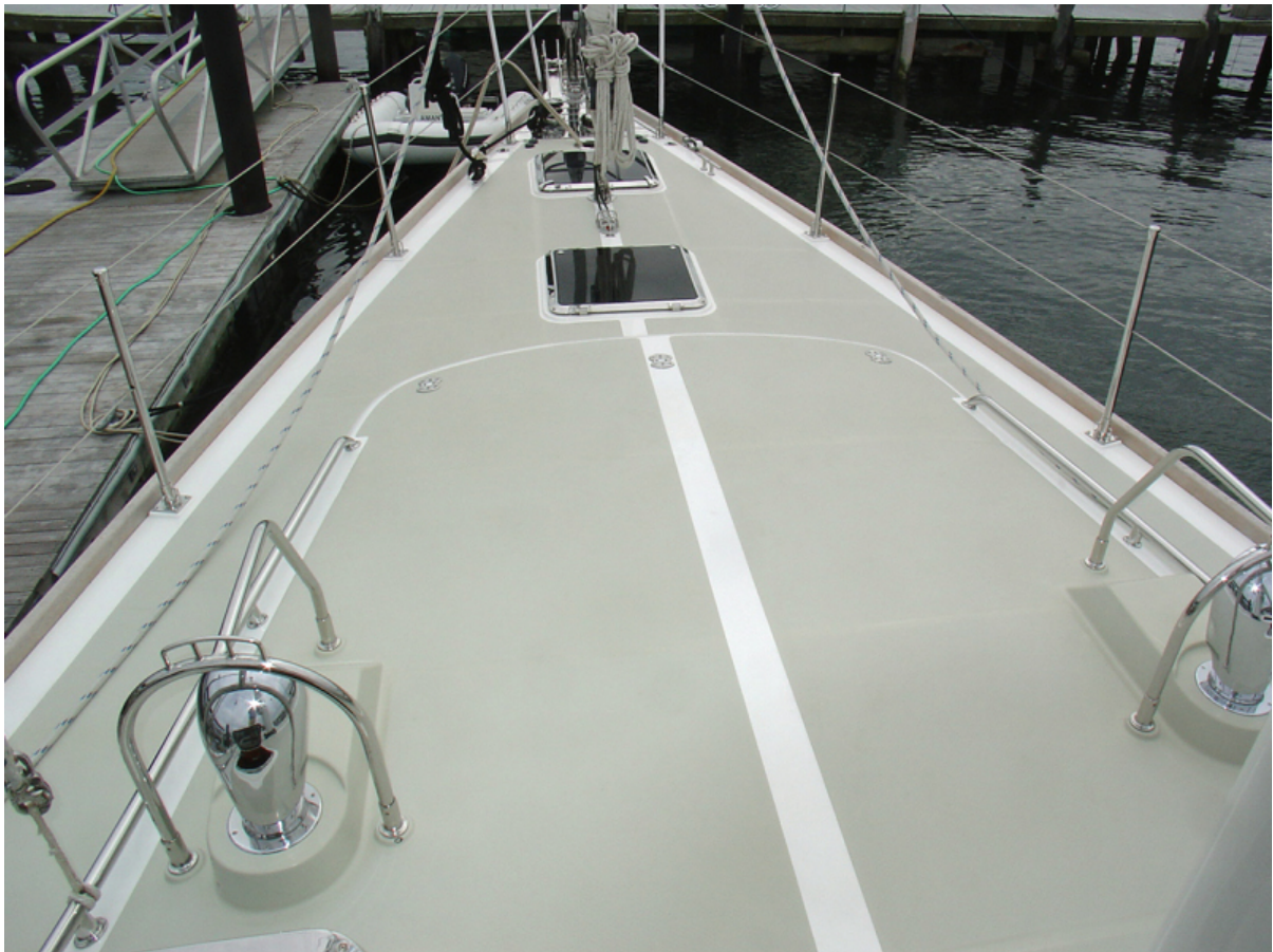
Foredeck Looking Forward