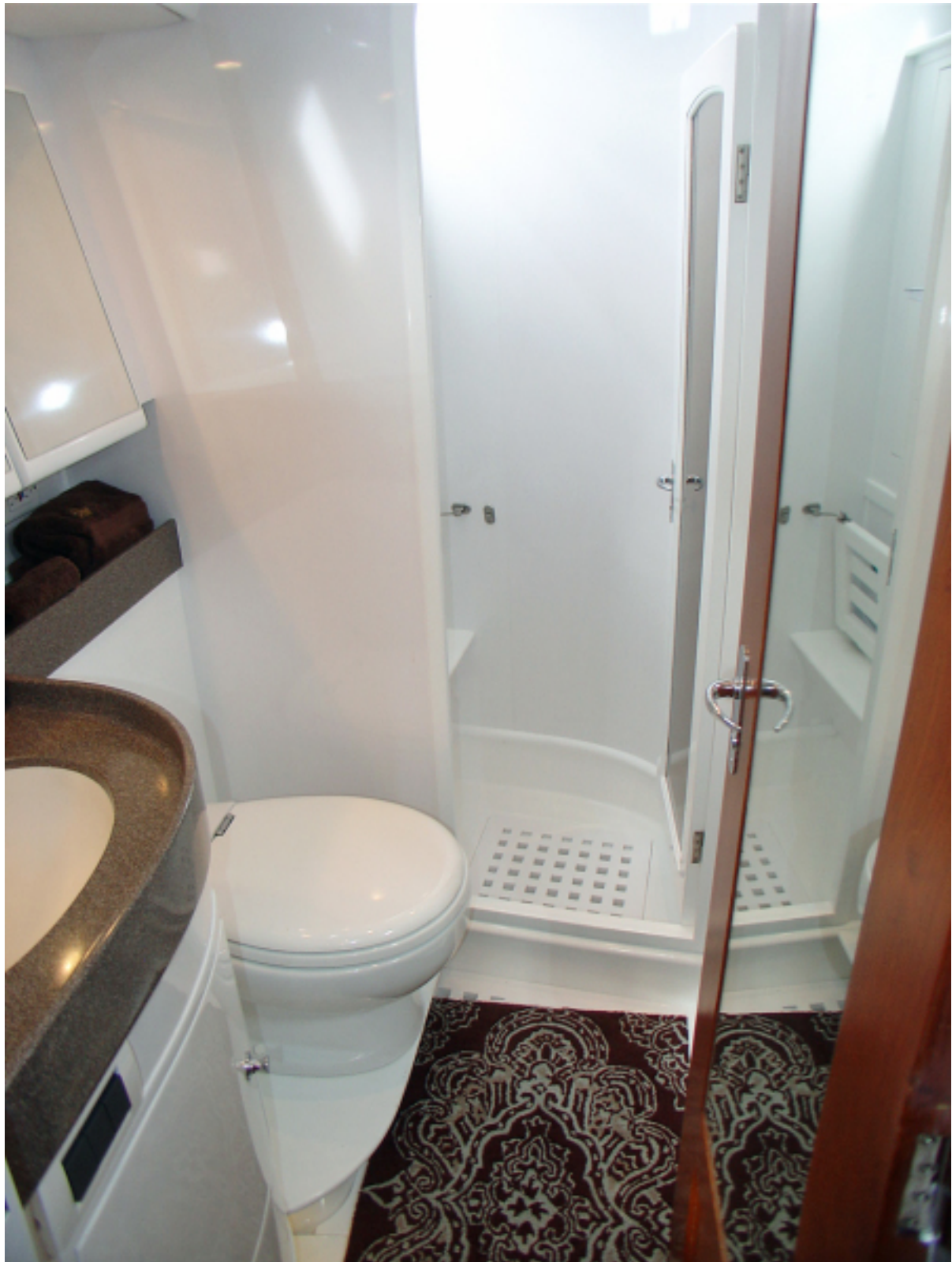
Stbd. Guest or Crew Head