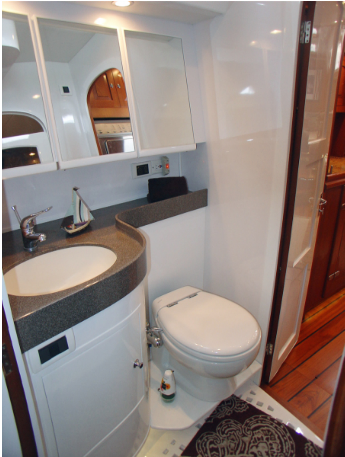
Owners En-suite Head