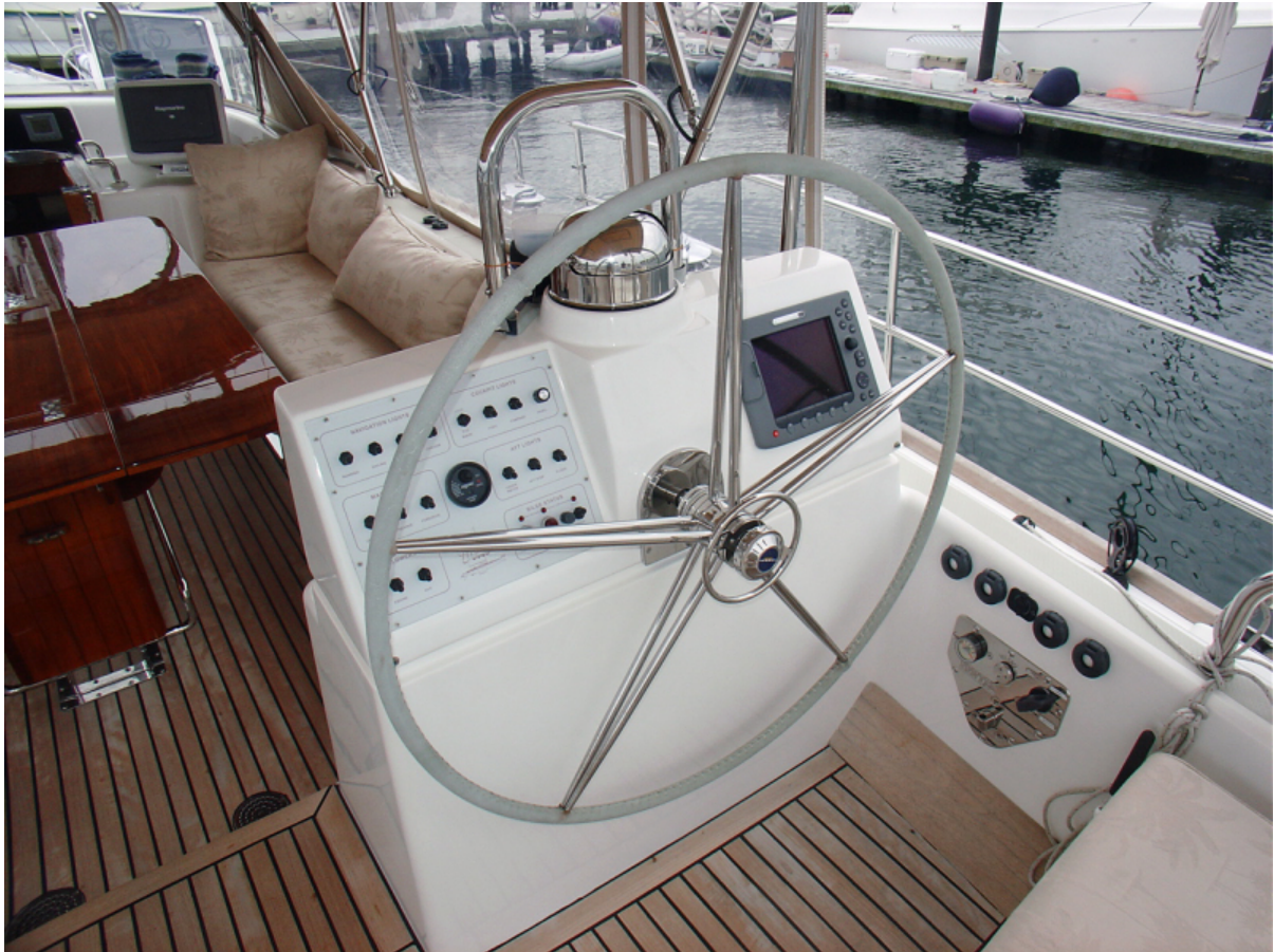
Steering Station, Stainless Wheel