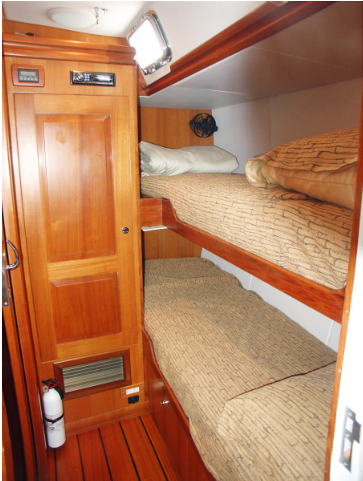
Stbd. Guest or Crew Qtrs.