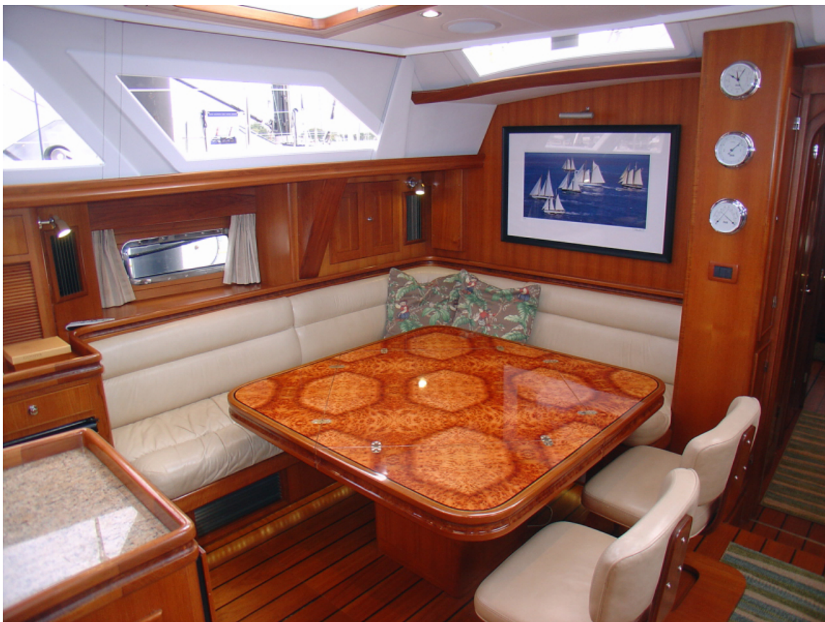
Port Salon Table, Open