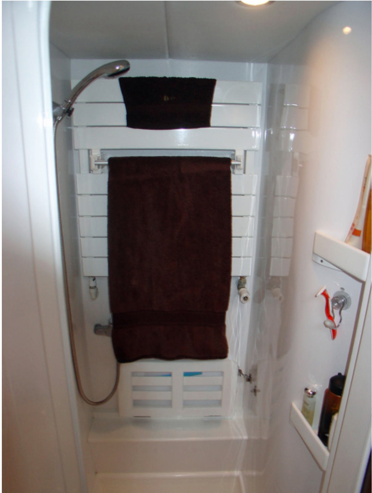
Owner En-suite Shower