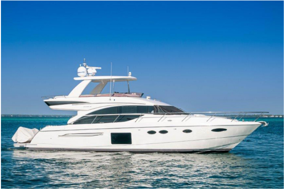
2016 60 Princess FB "The O'Sheaux"