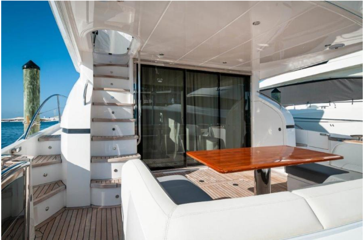
2016 60 Princess FB Cockpit (2)