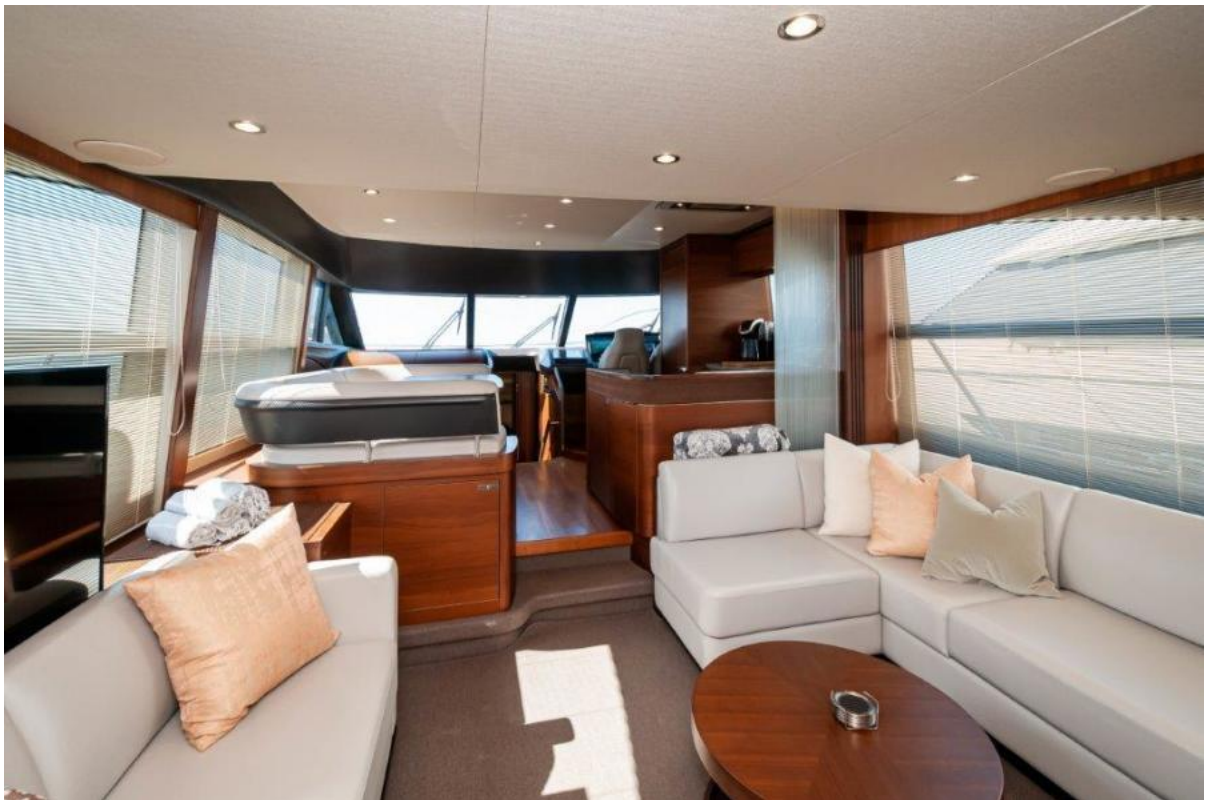
2016 60 Princess FB Salon (4)