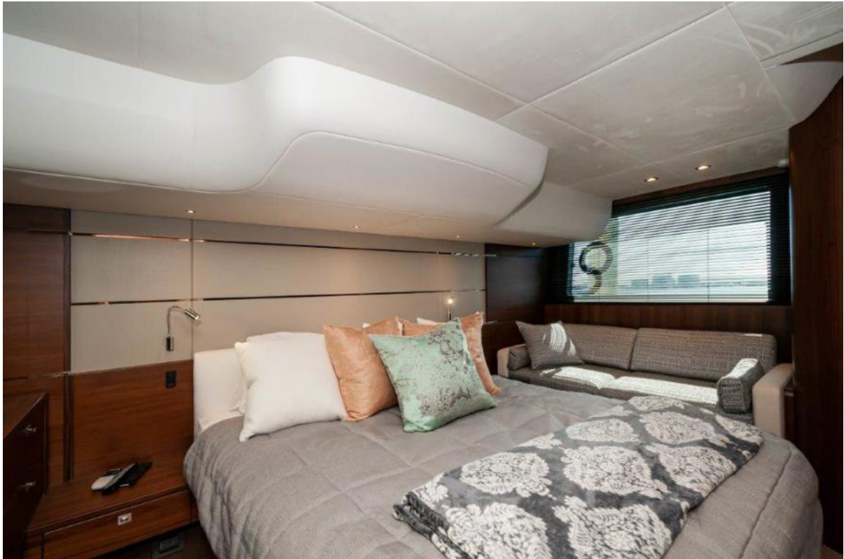
2016 60 Princess FB Master SR (3)