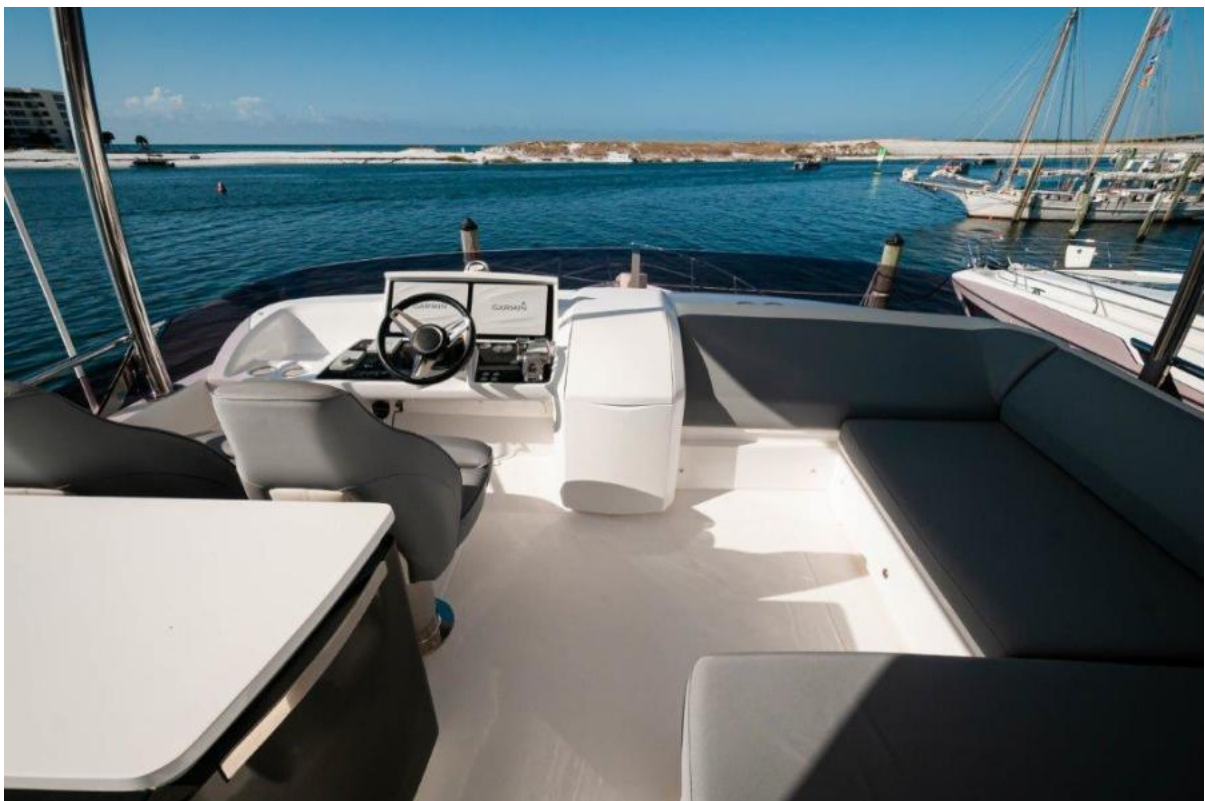
2016 60 Princess FB Flybridge (7)