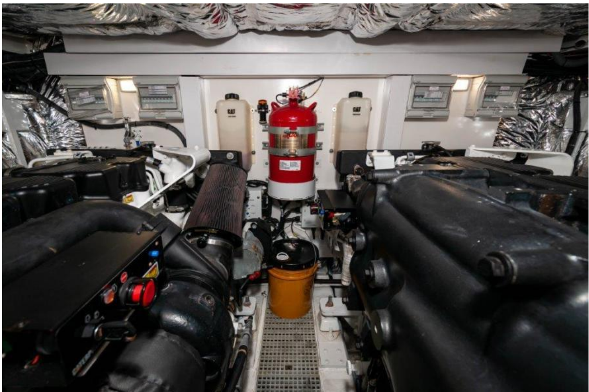
2016 60 Princess FB Engine Room (1)