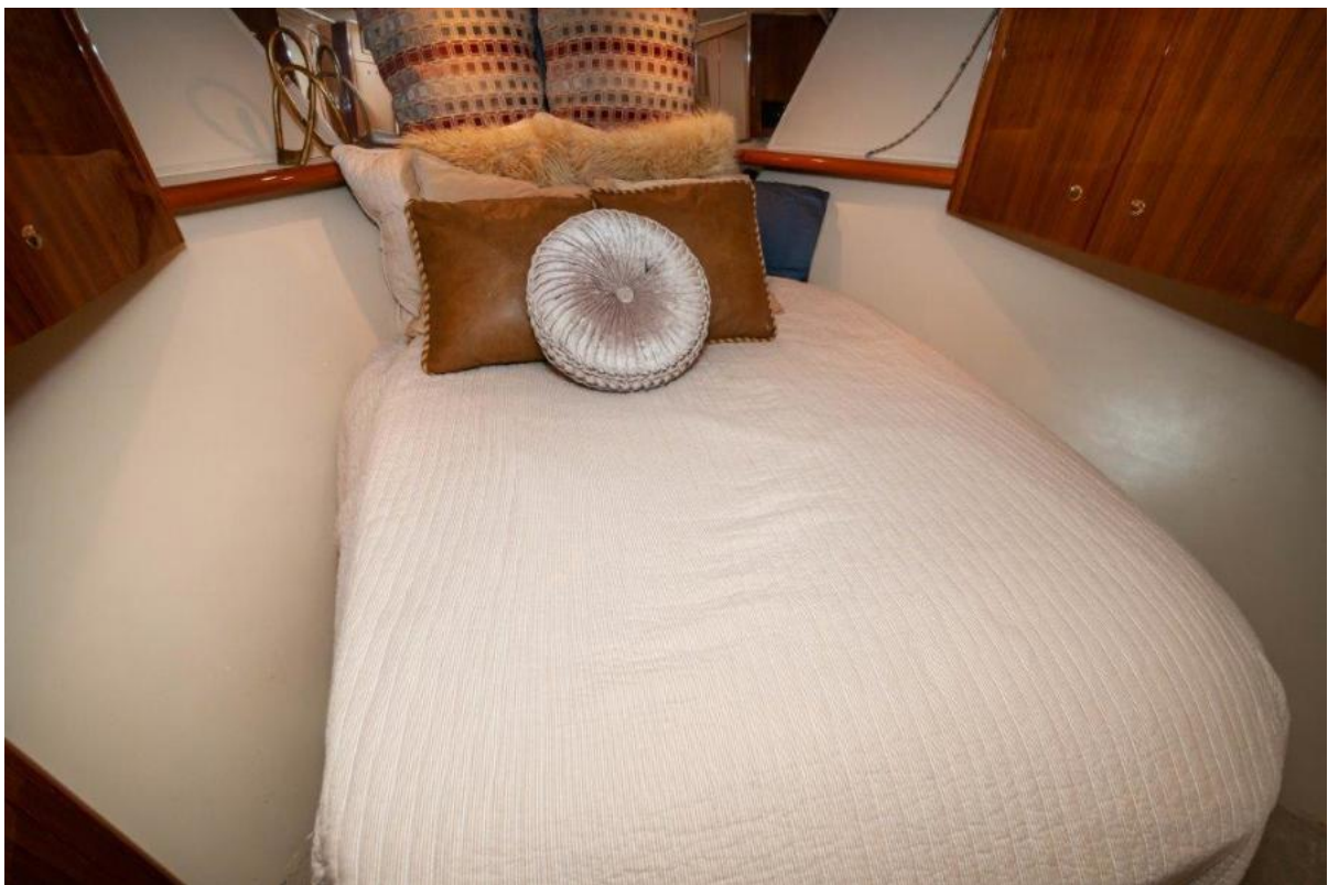
2005 56 Viking Convertible Dead Line VIP SR (1)