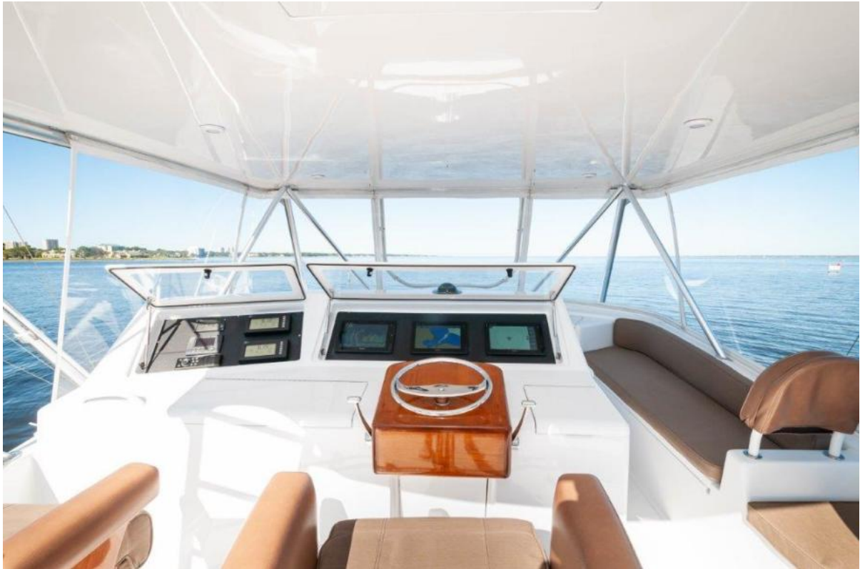
2005 56 Viking Convertible Dead Line Helm (3)