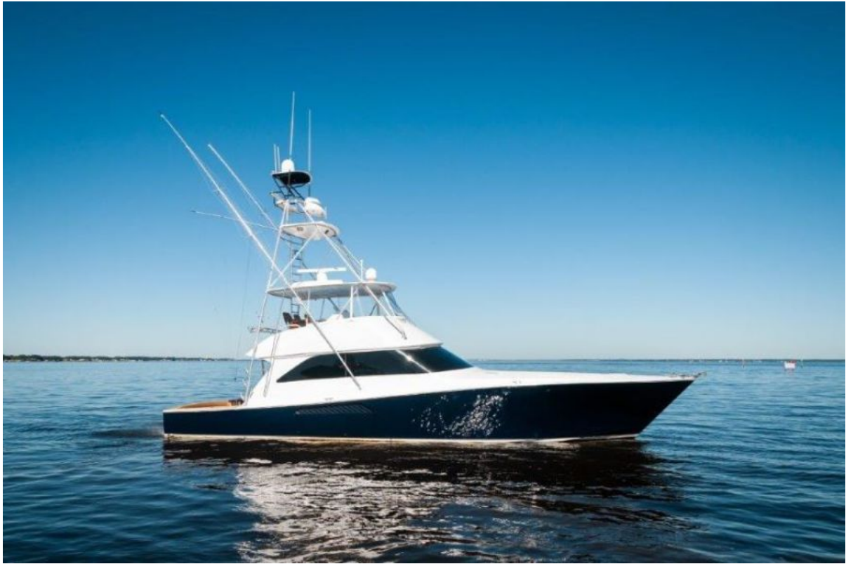
2005 56 Viking Convertible Dead Line Stbd Profile (1)