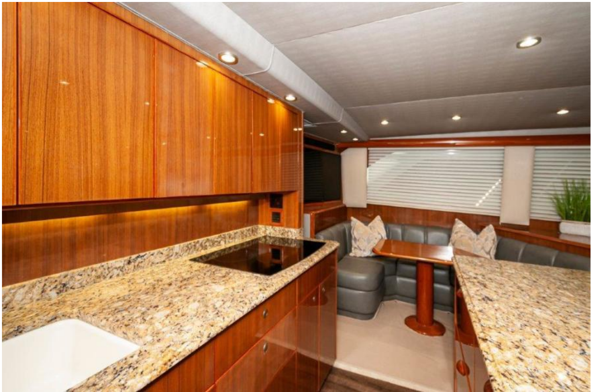
2005 56 Viking Convertible Dead Line Galley (5)