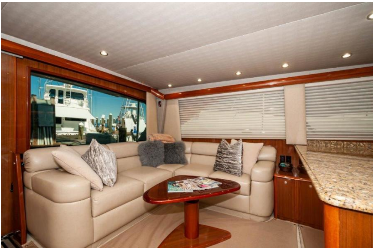
2005 56 Viking Convertible Dead Line Salon (3)